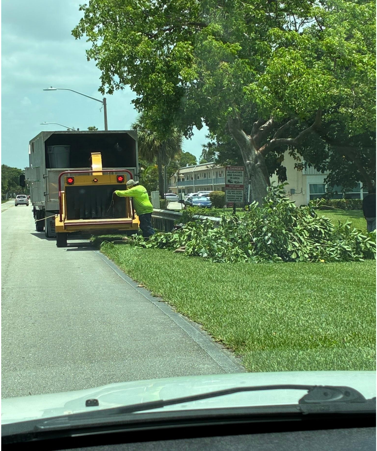
NORTH DRIVE- ANNUAL TREE AND PALM TRIMMING BY REQUELME LANDSCAPING CONTINUES.