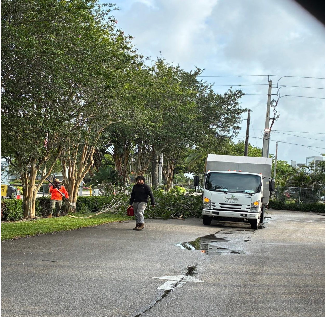
UCO OFFICE- ANNUAL TREE AND PALM TRIMMING BY REQUELME LANDSCAPING CONTINUES.