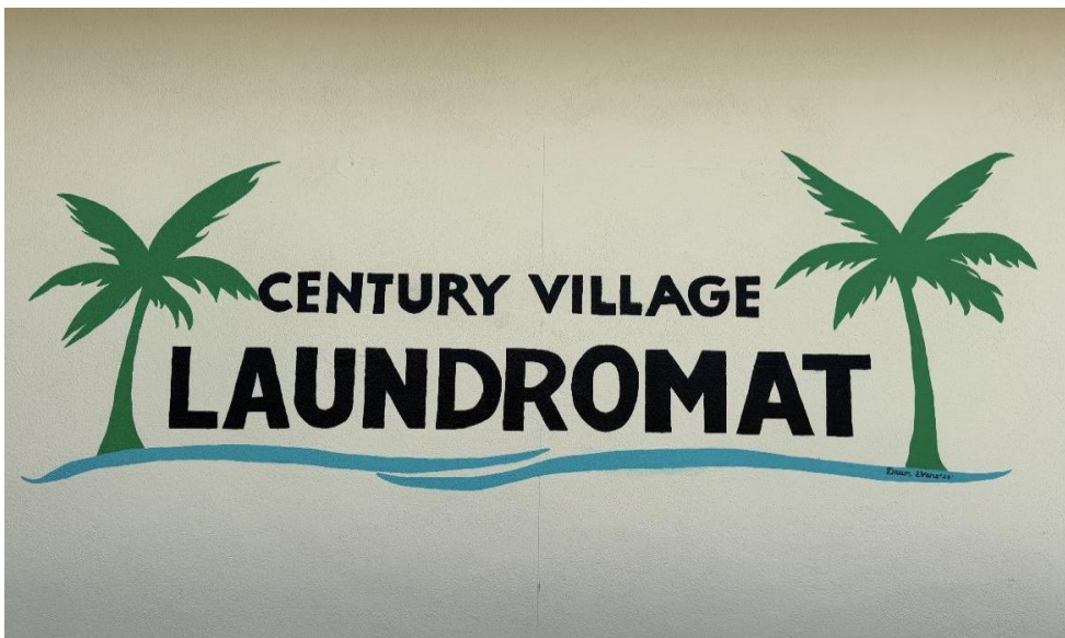
PLYMOUTH LAUNDRY- NEW SIGN PAINTED ON THE FRONT OF THE BUILDING.