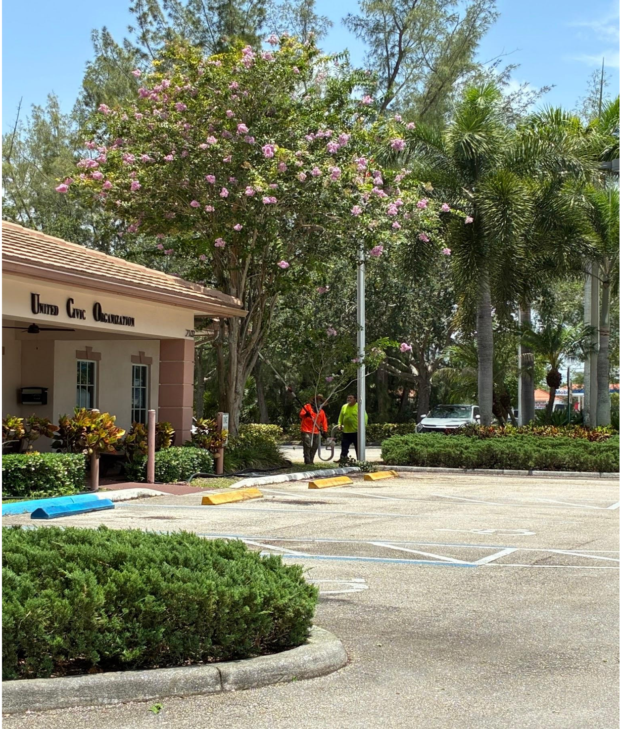
UCO OFFICE- ANNUAL TREE AND PALM TRIMMING BY REQUELME LANDSCAPING CONTINUES.