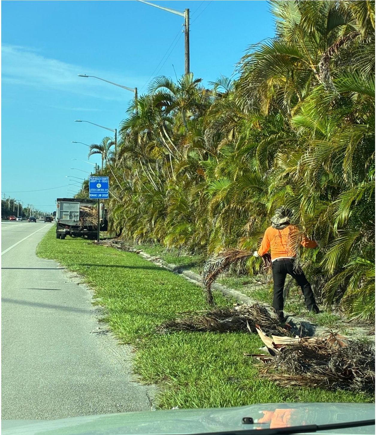
HVERHILL ROAD- QUARTERLY CLEANING OF THIS SWALE AND HEDGE WAS DONE BY SEACREST SERVICES ON 6/30.