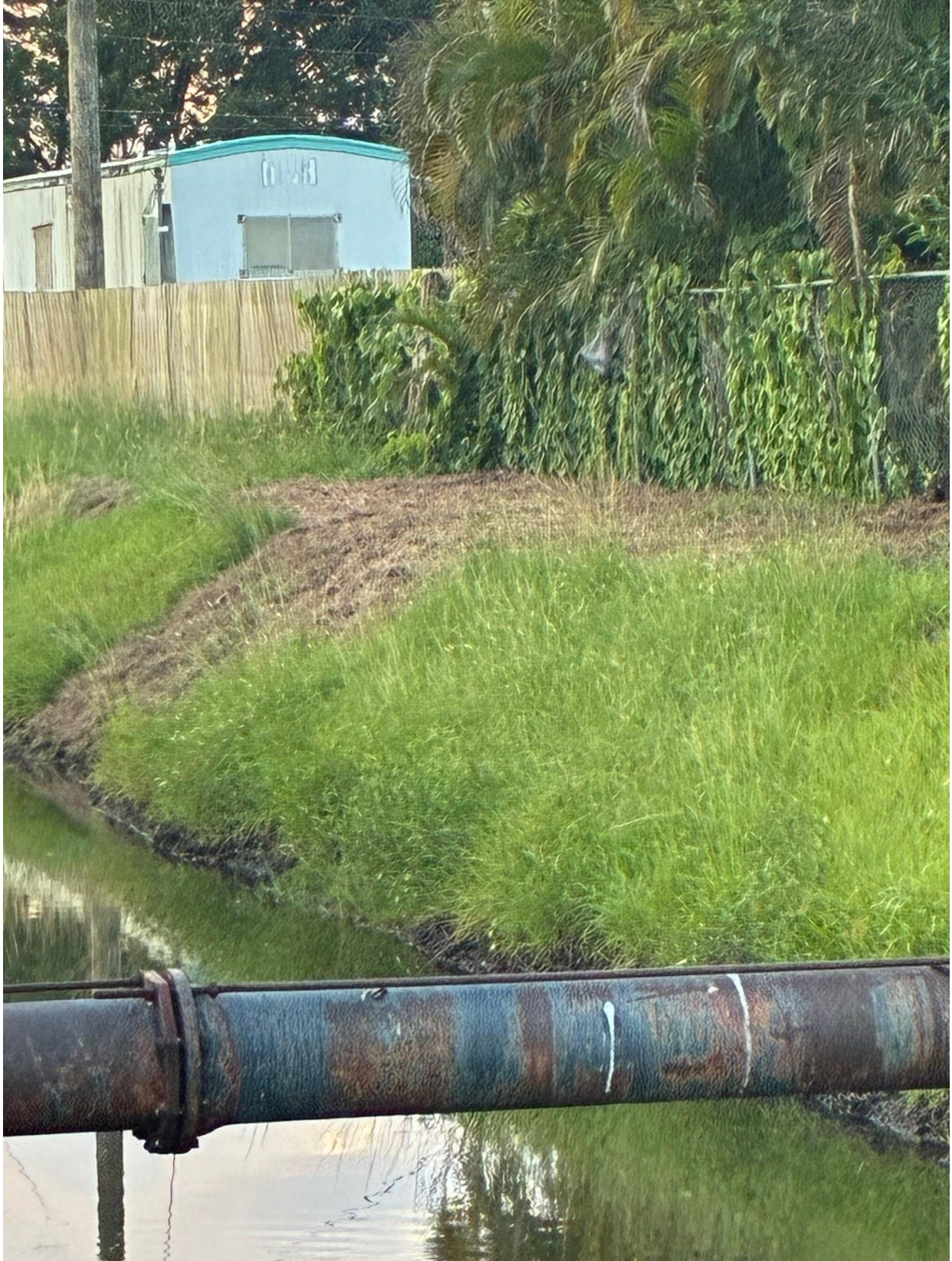
BEDFORD SECTION- NEW SOD INSTALLED BY AAA SOD.