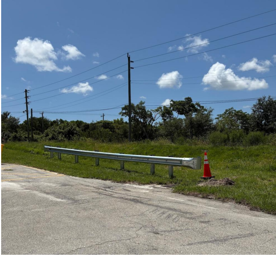
ANDOVER SECTION- FIRST SECTION OF GUARDRAIL INSTALLED BY COMPLETE HIGHWAY SOLUTIONS.