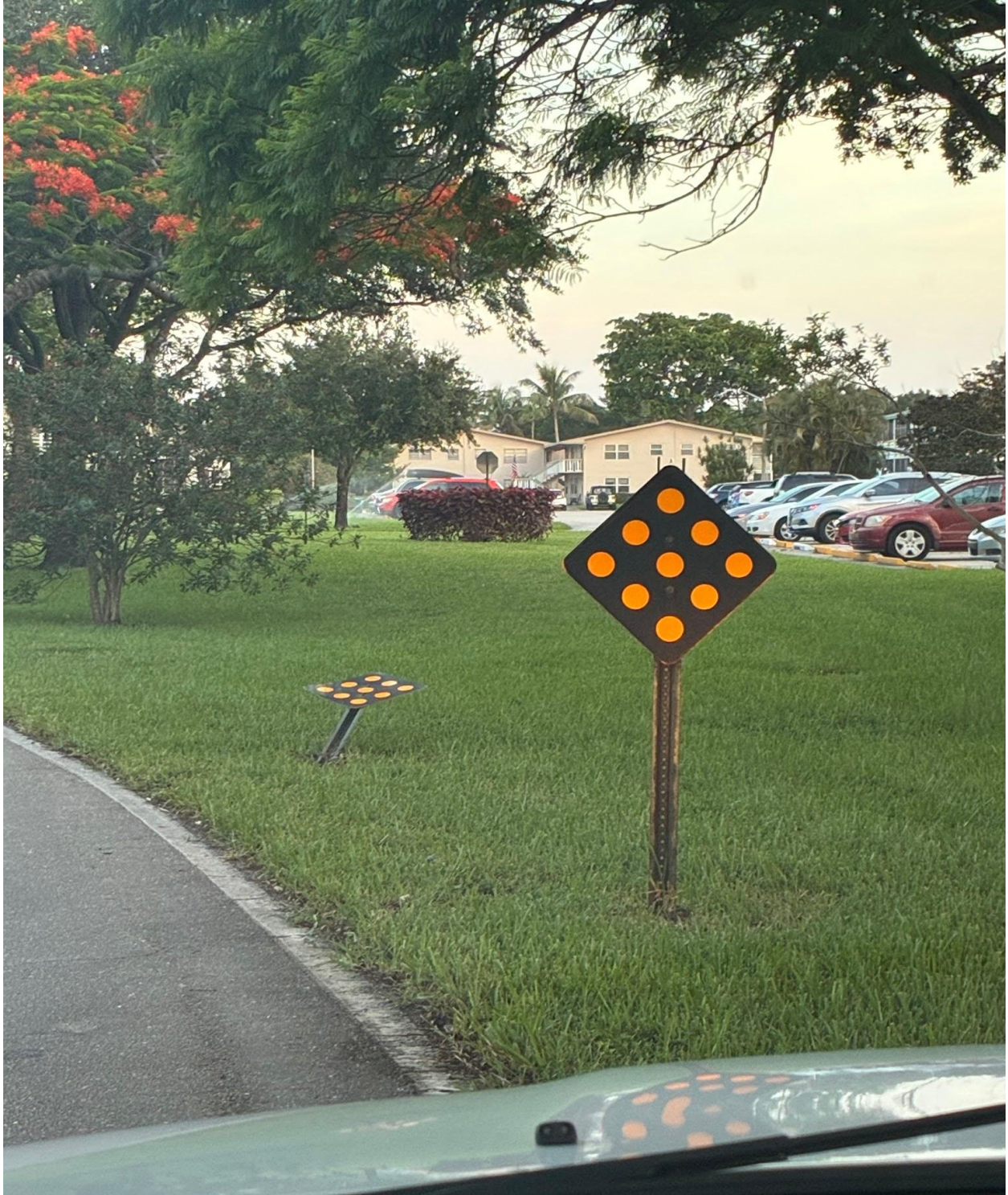
NORTH DRIVE- THIS SIGN WAS RUN OVER LAST WEEK.