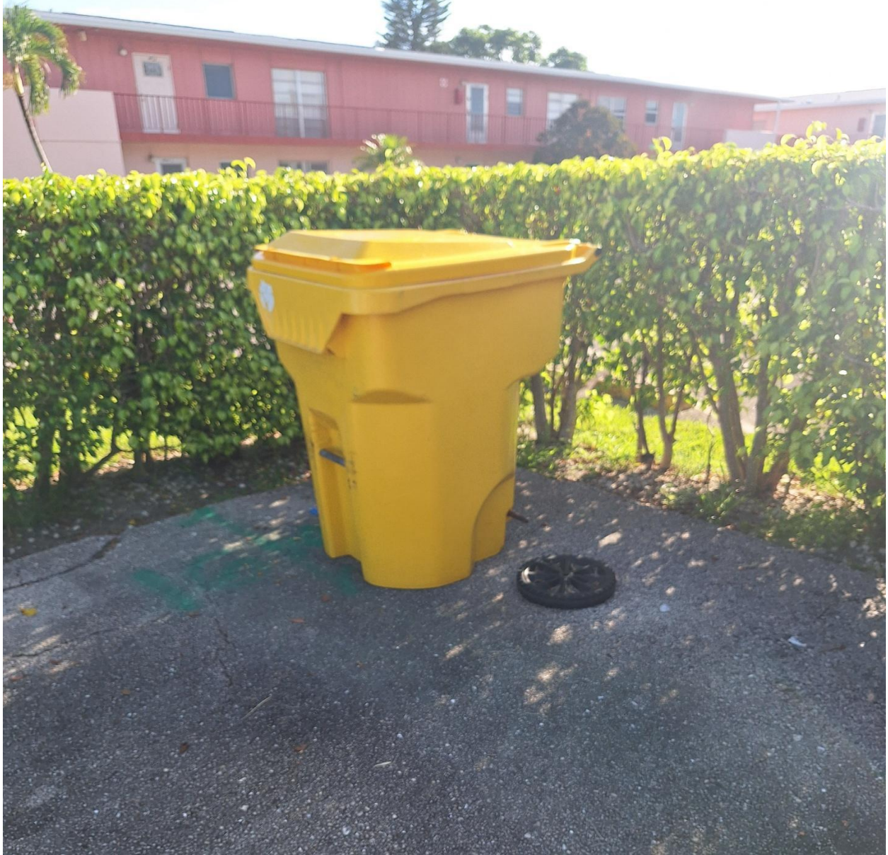
GOLFS EDGE- YELLOW TOTER WITH BUSTED WHEEL. REPORTED IN BY THE PROPERTY MANAGER. A REQUEST FOR REPAIR WAS SENT TO WASTE PRO.