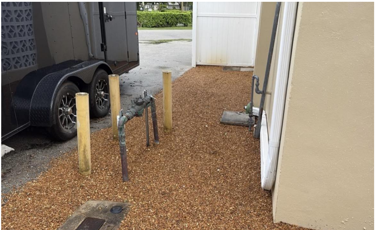
PLYMOUTH LAUNDRY- DECORATIVE ROCKS WERE INSTALLED AT THE FRONT, BACK AND SIDES OF THE BUILDING.