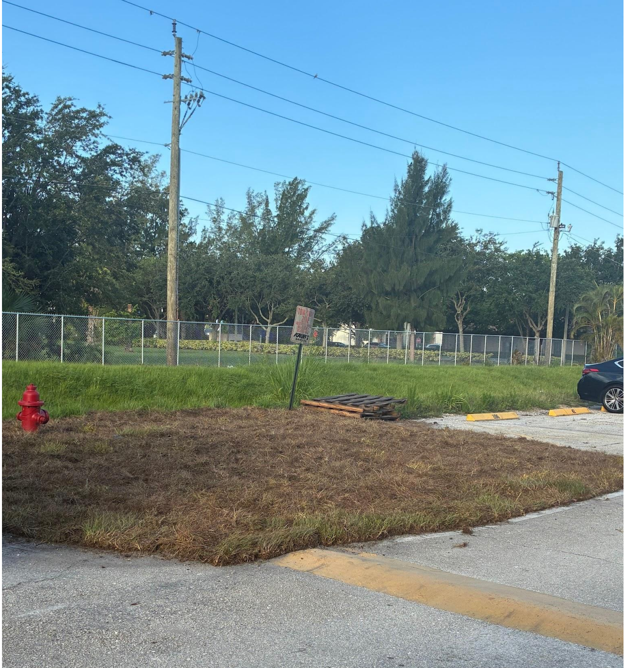
WELLINGTON SECTION- NEW SOD INSTALLED BY AAA SOD.