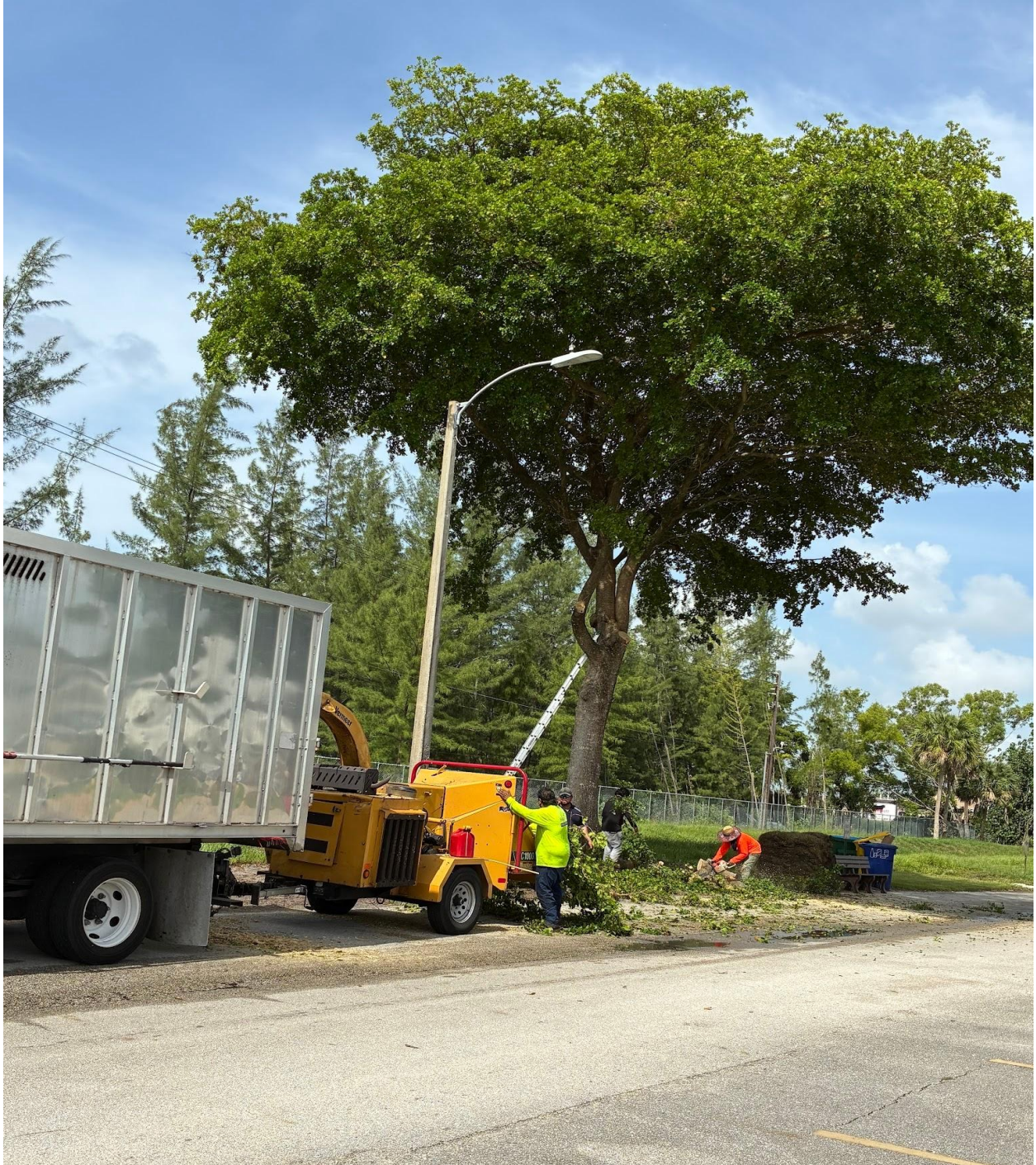
WINDSOR SECTION- ANNUAL TREE AND PALM TRIMMING BY REQUELME LANDSCAPING CONTINUES.