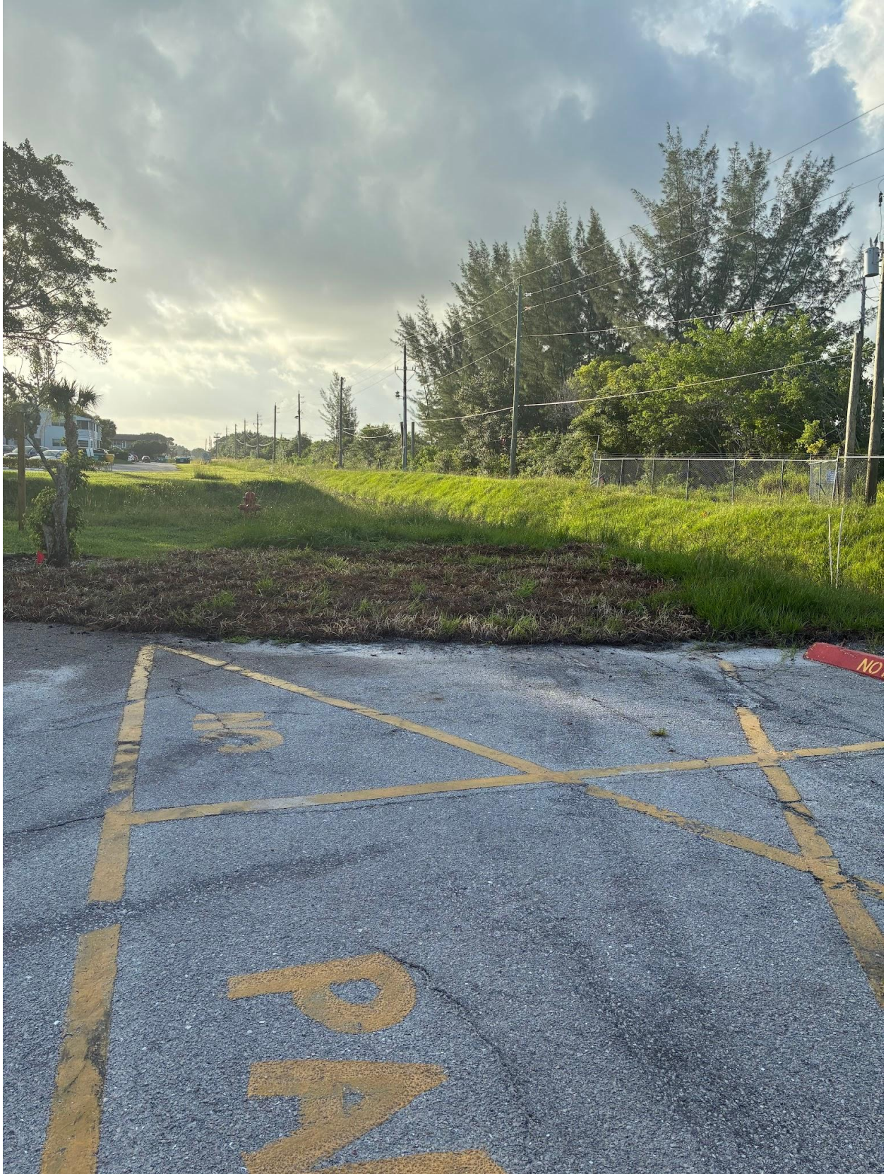
WELLINGTON SECTION- NEW SOD INSTALLED BY AAA SOD.