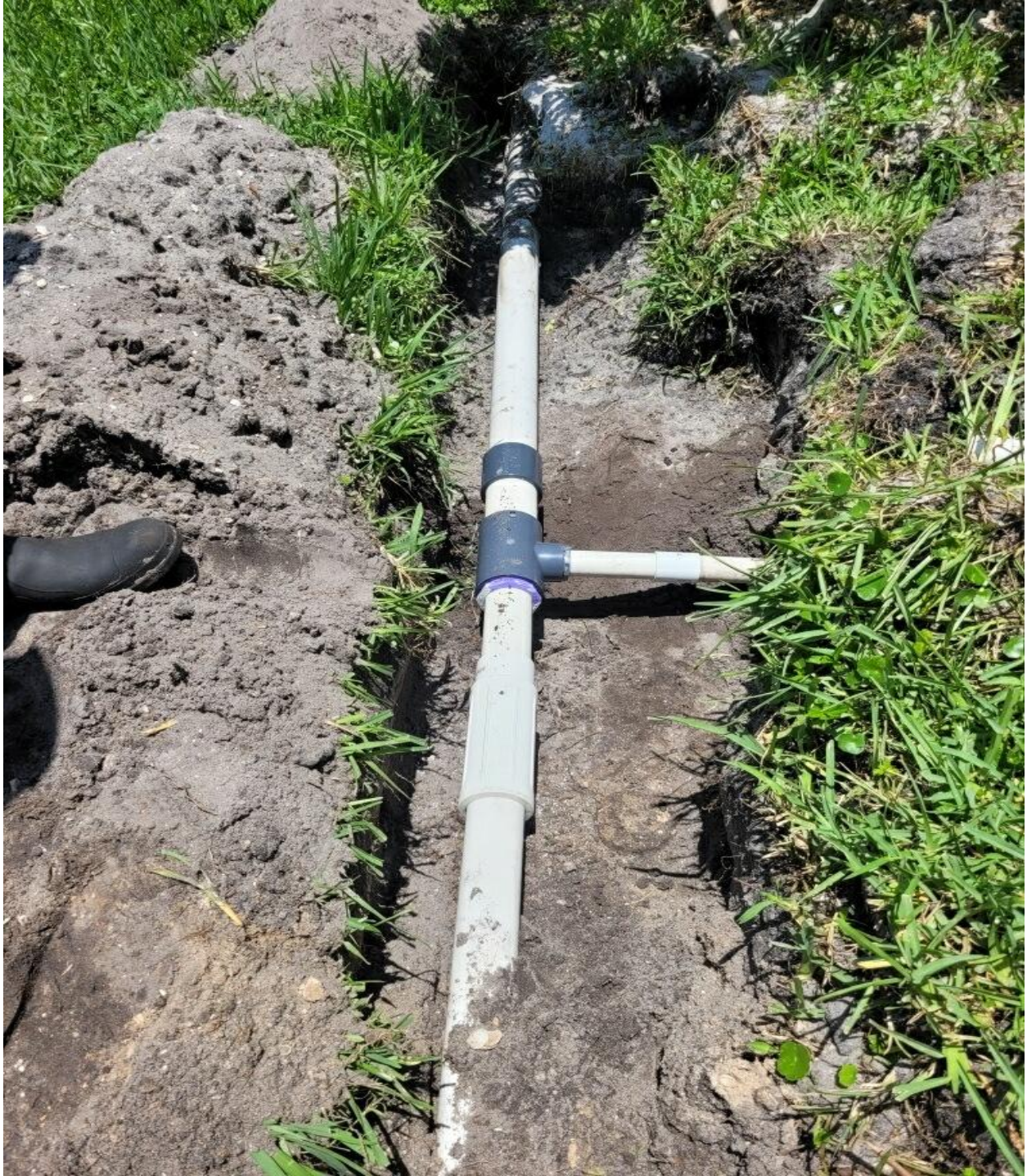
NORTHAMPTON H- MAIN LINE IRRIGATION LEAK REPAIR BY SEACREST SERVICES ON 7/2.