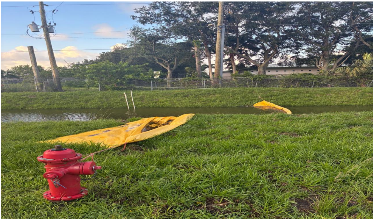
WELLINGTON SECTION- THESE YELLOW BOOMS WILL BE REMOVED BY SHENANDOAH CONSTRUCTION THIS WEEK.