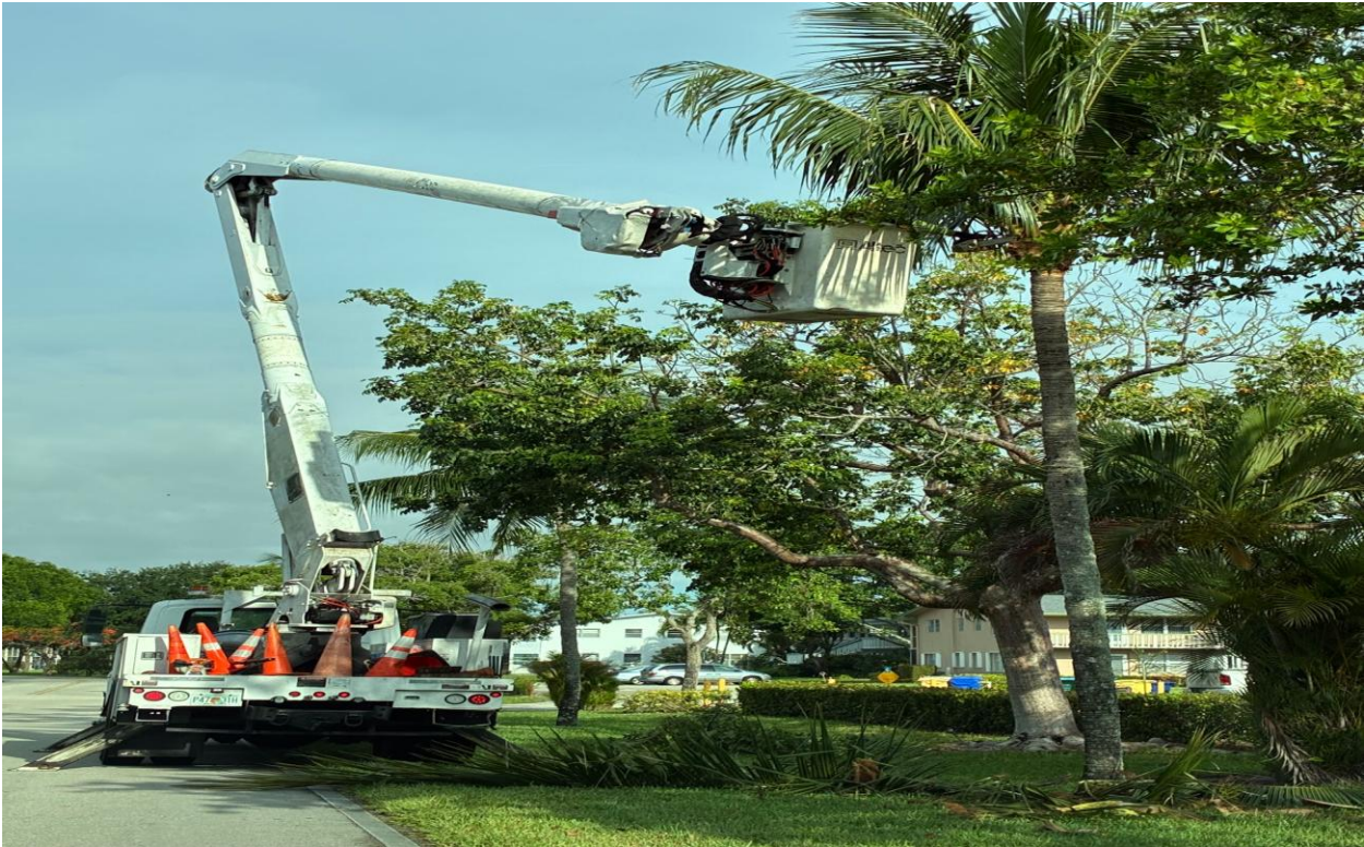
WEST DRIVE- REQUELME TREE SERVICE CONTINUED ANNUAL TREE AND PALM TRIMMING LAST WEEK.