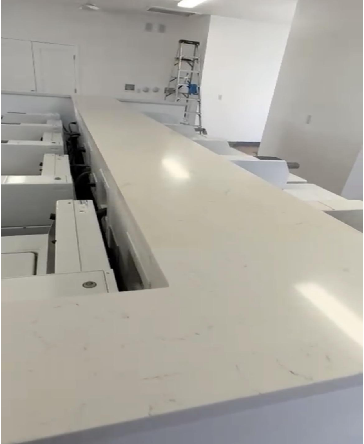
PLYMOUTH LAUNDRY- NEW QUARTZ COUNTERTOPS INSTALLED ON TOP OF THE LOW WALL THAT SURROUNDS THE WASHERS.