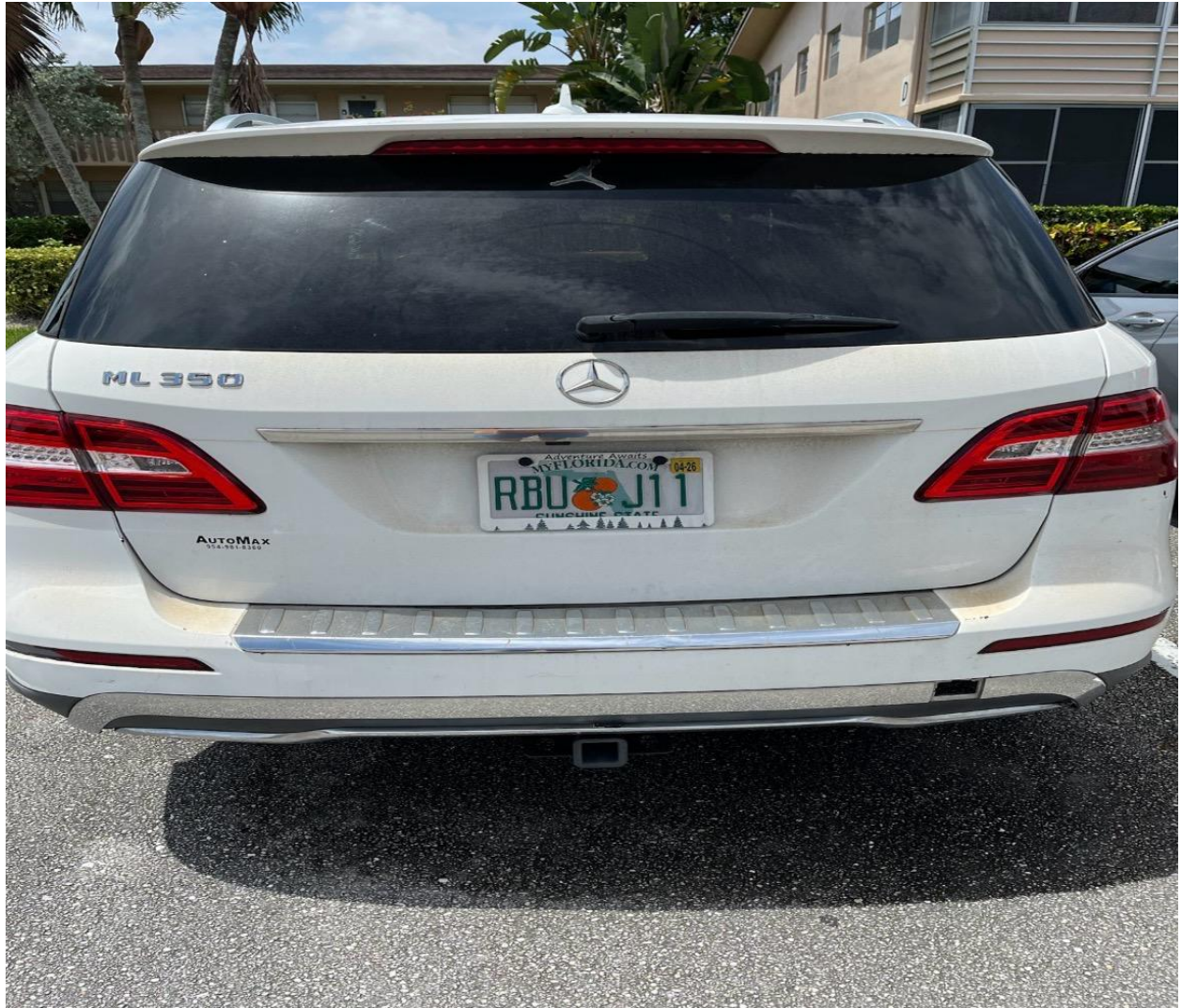
CANTERBURY D- ABANDONED CAR, STUFFED WITH JUNK. THE ASSOCIATION PRESIDENT ORDERED IT TO BE TOWED.