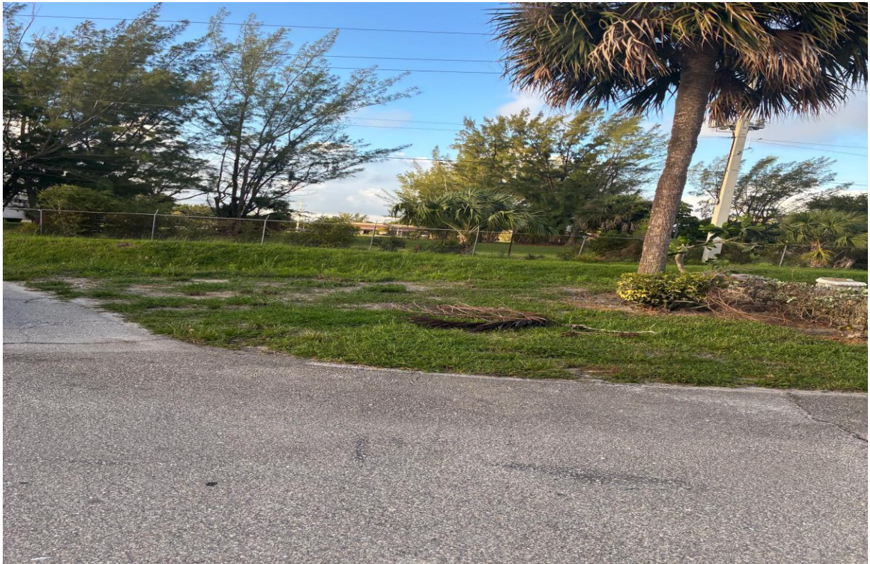
WELLINGTON SECTION- THESE SPOTS NEED NEW SOD.