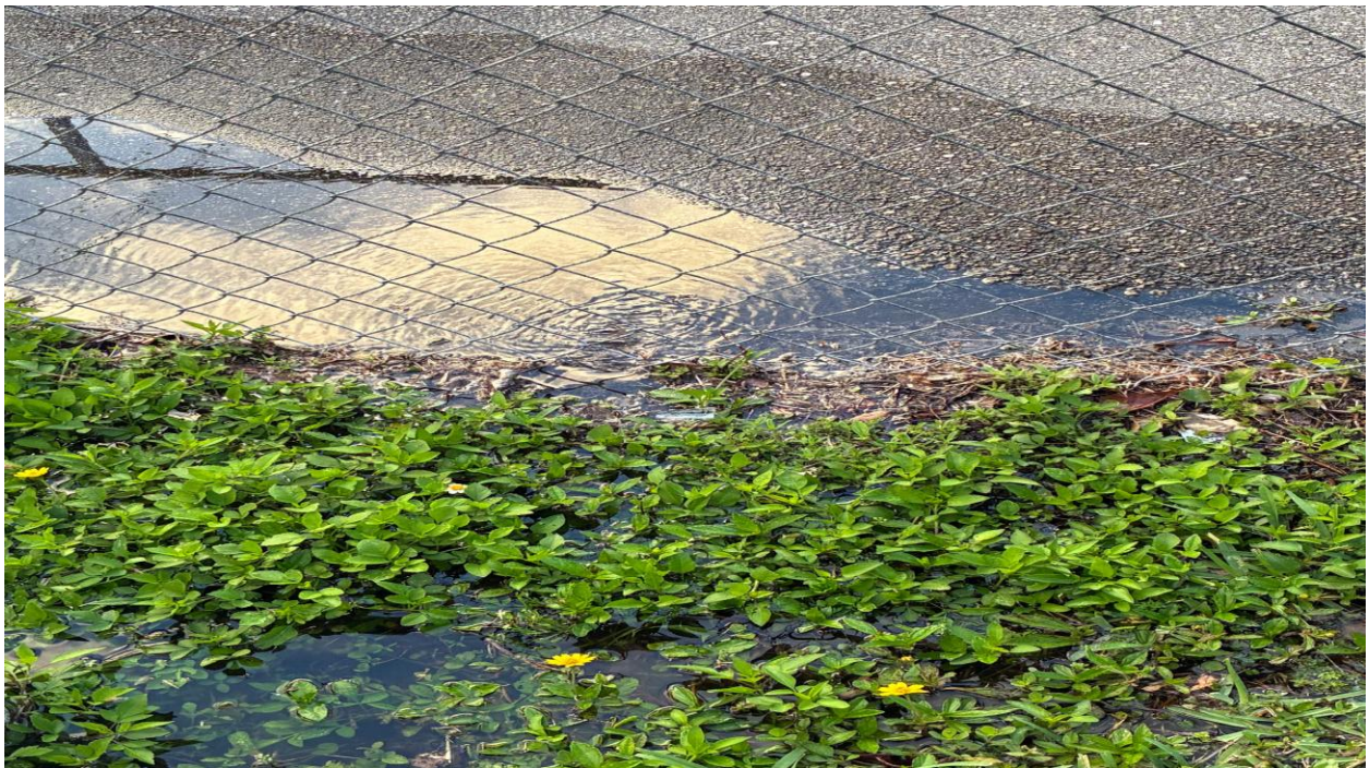
OKEECHOBEE BOULEVARD ENTRANCE- IRRIGATION LEAK. REPAIRED BY SEACREST SERVICES ON 5/26.