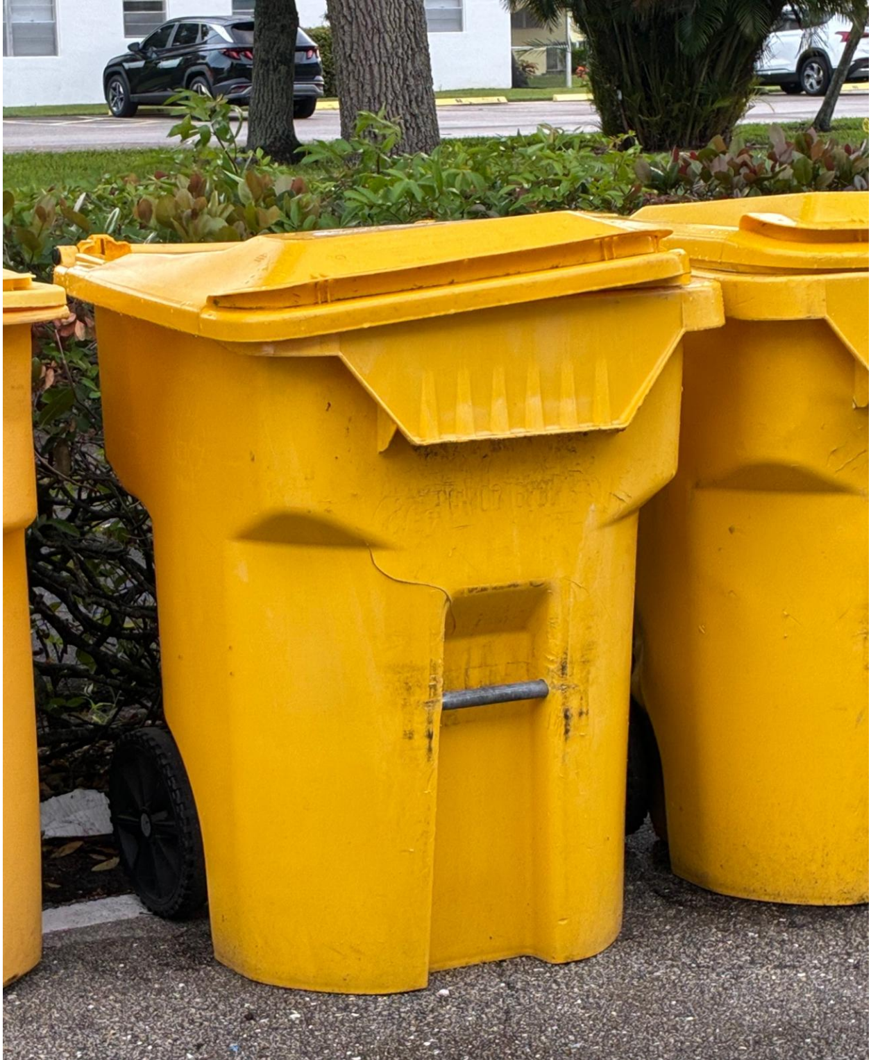
STRATFORD N- CRACKED YELLOW TOTER. REPORTED IN BY A CV UNIT OWNER. A REQUEST FOR REPLACEMENT WAS SENT TO WASTE PRO.