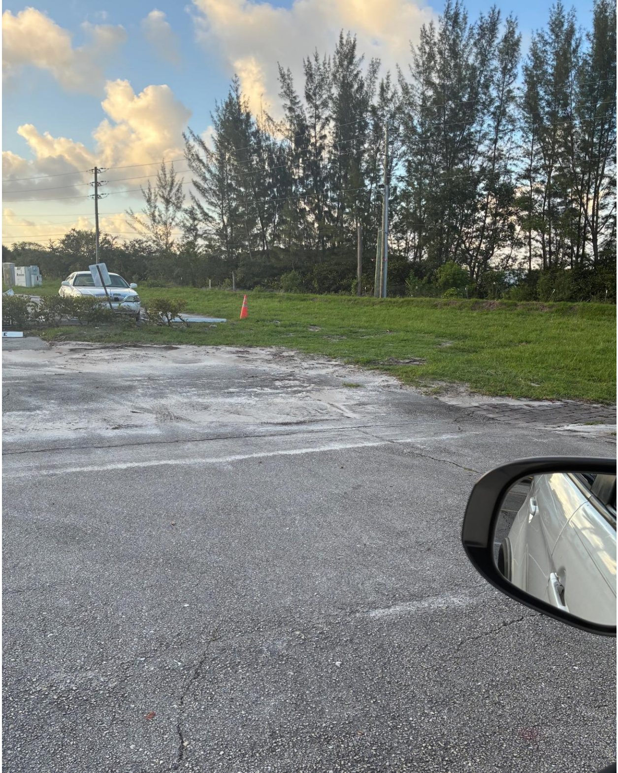
WELLINGTON E- SOME AREAS NEED TO BE SWEEPED UP.