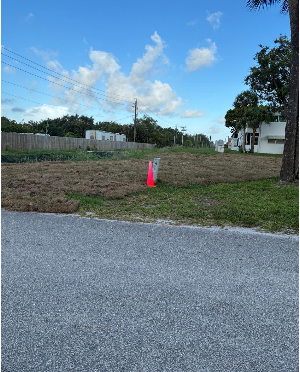
SOUTH CANAL- NEW SOD INSTALLED ON 5/23 AT BEDFORD SECTION. THIS VARIETY OF SOD DOES NOT REQUIRE IRRIGATION; IT WILL TURN GREEN WHEN IT GETS SOME RAIN.