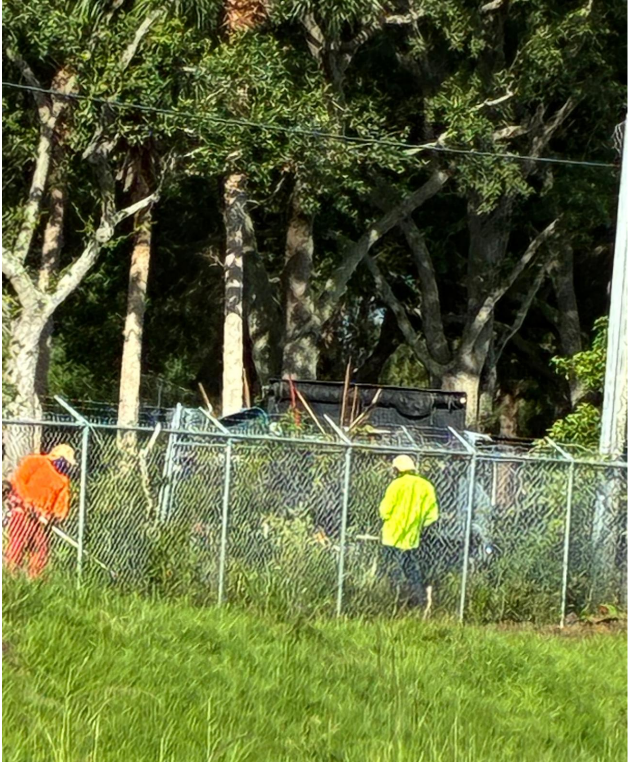
SOUTH CANAL- SEACREST IS CLEARING BRUSH ALONG THE FENCE LINE SO THAT BUDGET FENCE CAN WORK THIS WEEK.