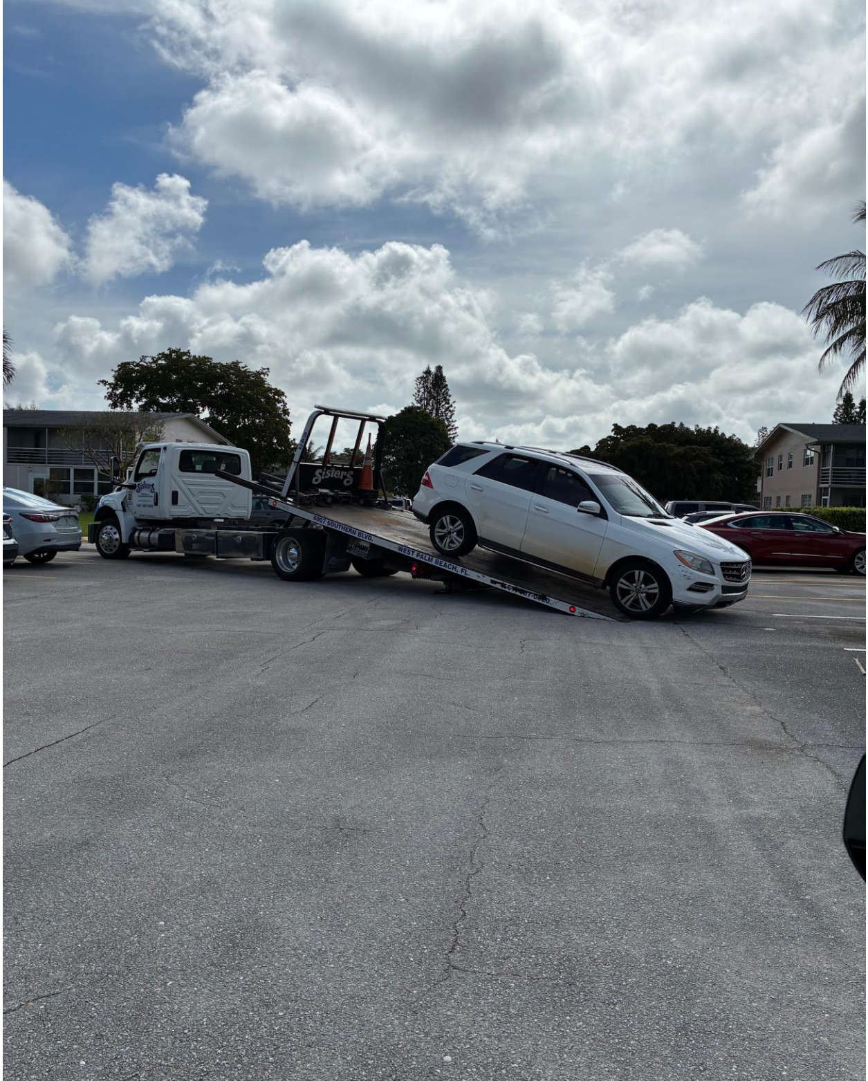
CANTERBURY D- THIS CAR WAS REMOVED BY SISTERS TOWING ON 5/29.