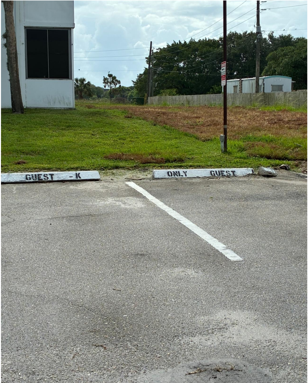
BEDFORD K- BUSTED PARKING STOPS NEAR NORTH CANAL NEED TO BE REPLACED.