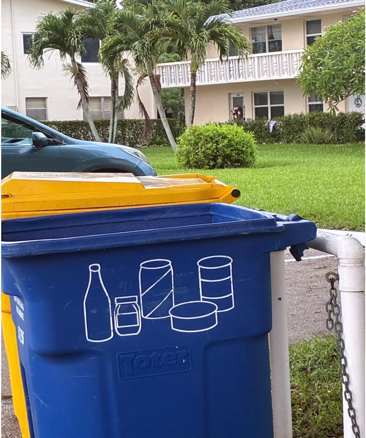
DORCHESTER G- BLUE TOTER, MISSING LID. A REQUEST FOR REPAIR WAS SENT TO WASTE PRO.