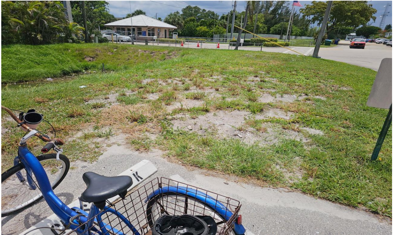
WELLINGTON SECTION- NEW SOD NEEDS TO BE INSTALLED HERE.