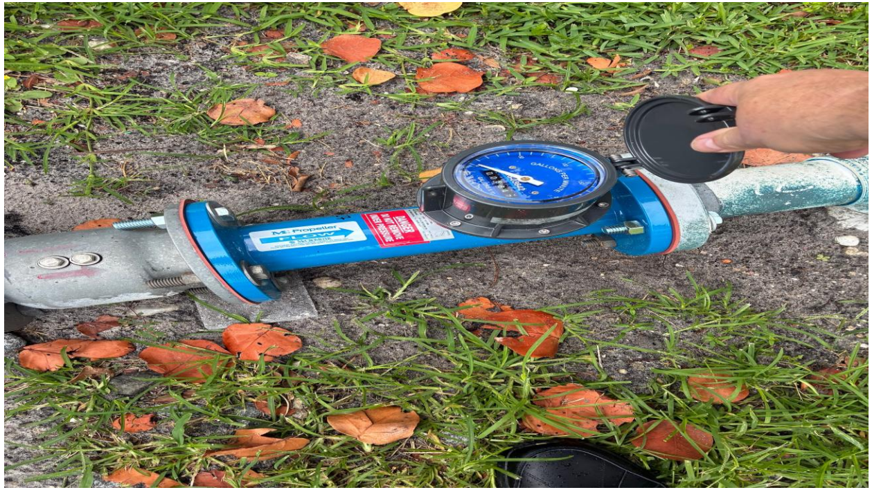
KENT, DORCHESTER IRRIGATION STATIONS- NEW FLOWMETERS WERE INSTALLED BY CHABOT IRRIGATION.