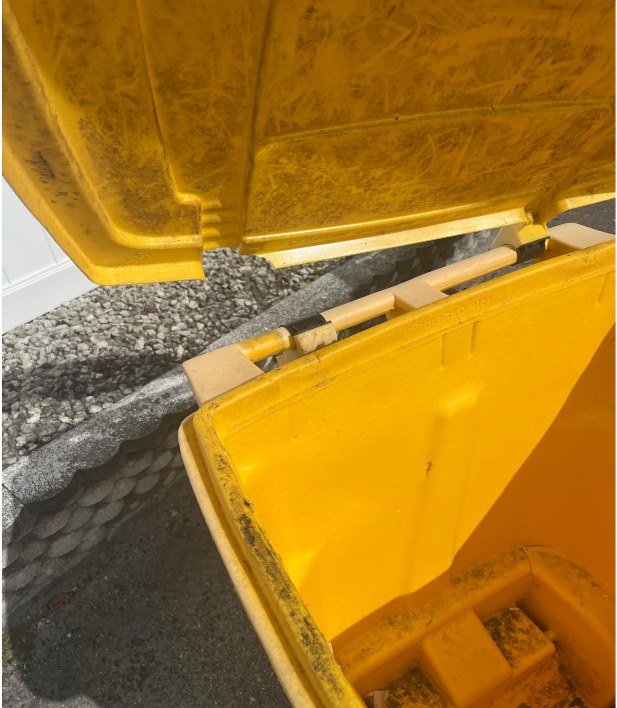
DORCHESTER B- CRACKED YELLOW Toter. REPORTED IN BY A CV UNIT OWNER. A REQUEST FOR REPLACEMENT WAS SENT TO WASTE PRO.