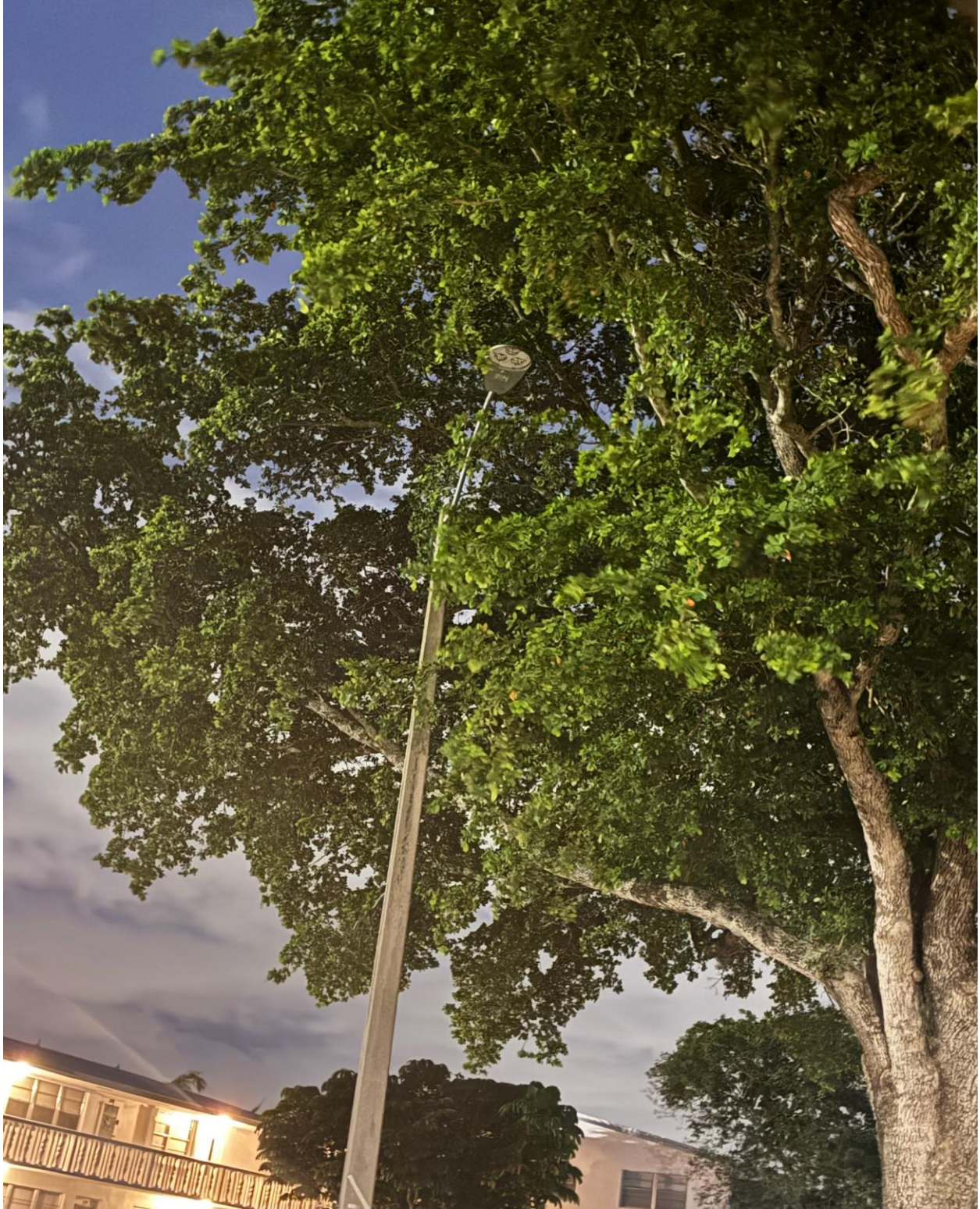
SHEFFIELD L- DARK STREETLIGHT. A REQUEST FOR REPAIR WAS SENT TO FPL, # 45493.