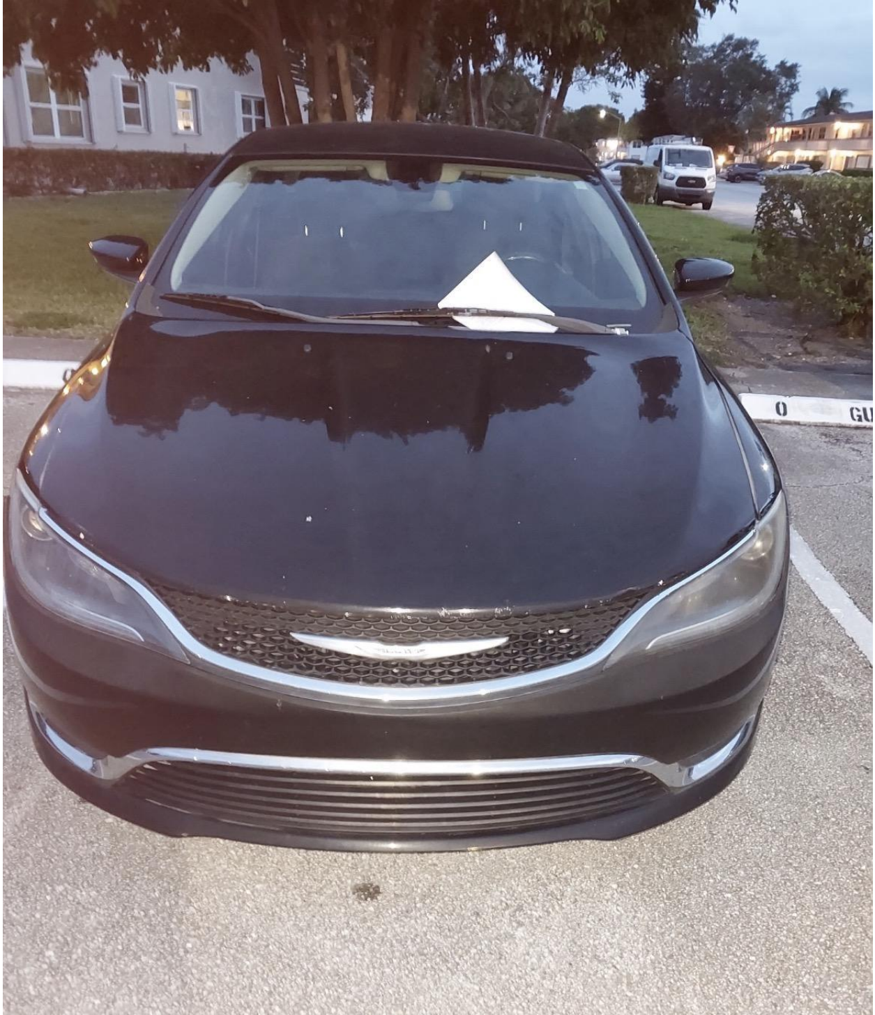
NORTHAMPTON O- A TOW NOTICE WAS PUT ON THIS CAR'S WINDSHIELD ON 6/4.