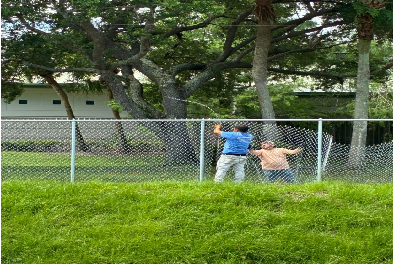
WELLINGTON SECTION- NEW FENCING IS BEING INSTALLED ALONG THE SOUTH SIDE OF SOUTH CANAL.