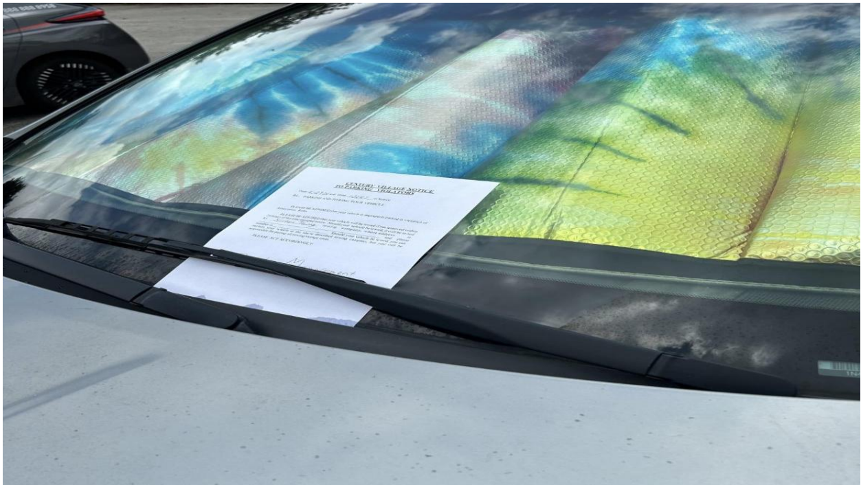
CAMBRIDGE B- SMASHED UP CAR. REPORTED IN BY A CV UNIT OWNER ON 5/29. A TOW NOTICE WAS PLACED ON THIS SMASHED UP CAR ON 5/29. THE CAR WAS REMOVED FROM CV ON 5/30.