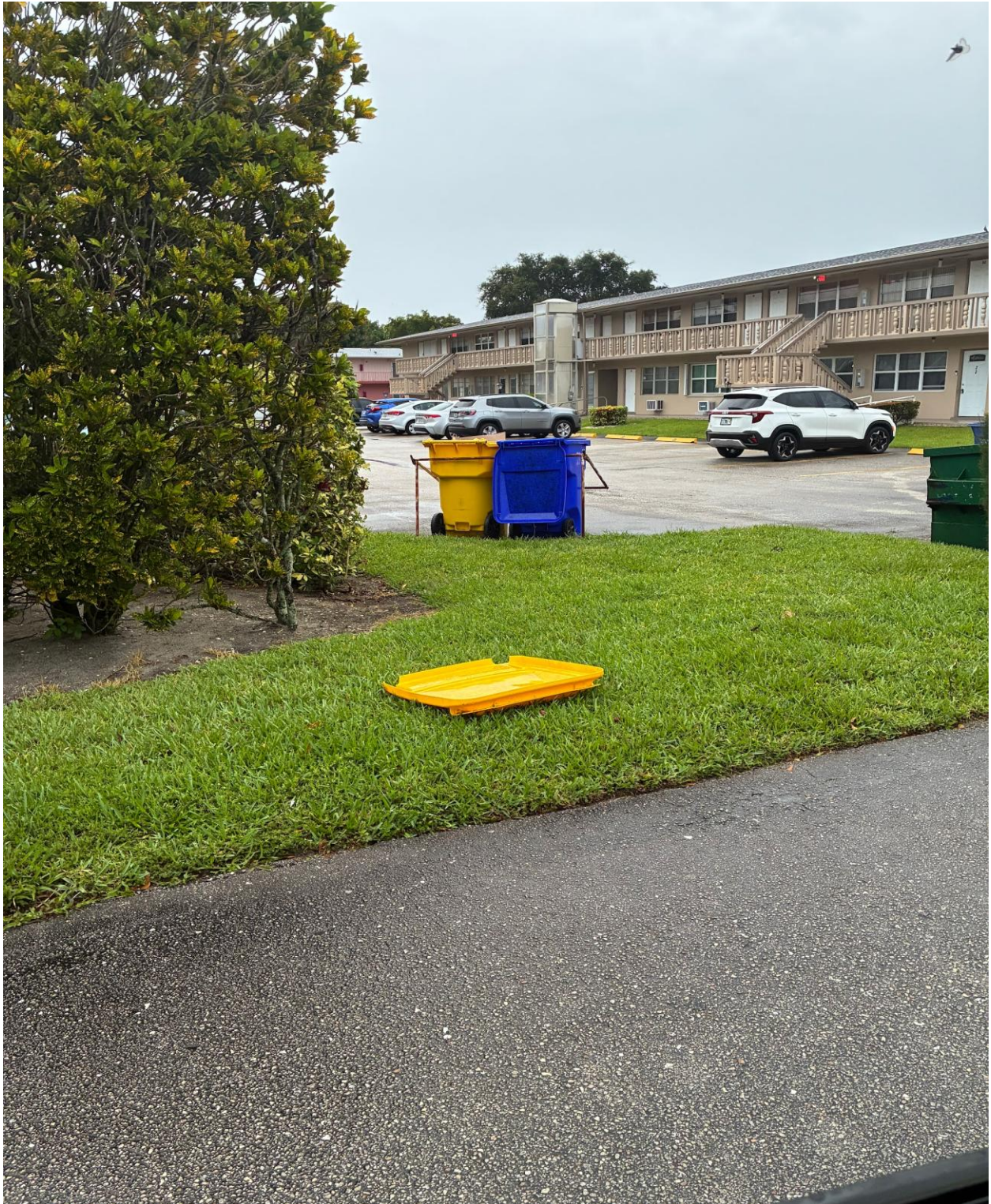
KINGSWOOD A- BUSTED YELLOW TOTER. A REQUEST FOR REPLACEMENT WAS SENT TO WASTE PRO.