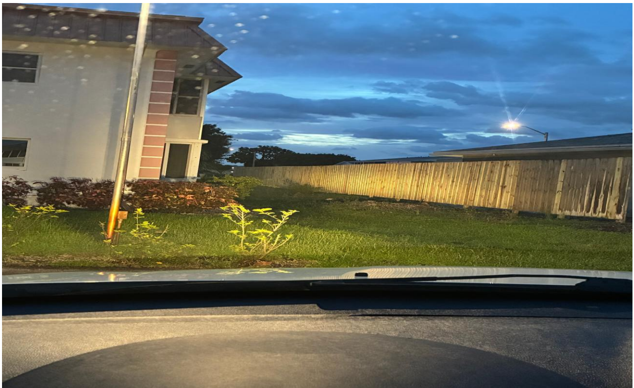
PLYMOUTH LAUNDRY- A NEW WOOD FENCE WAS INSTALLED AT THE BACK OF THE LAUNDRY.