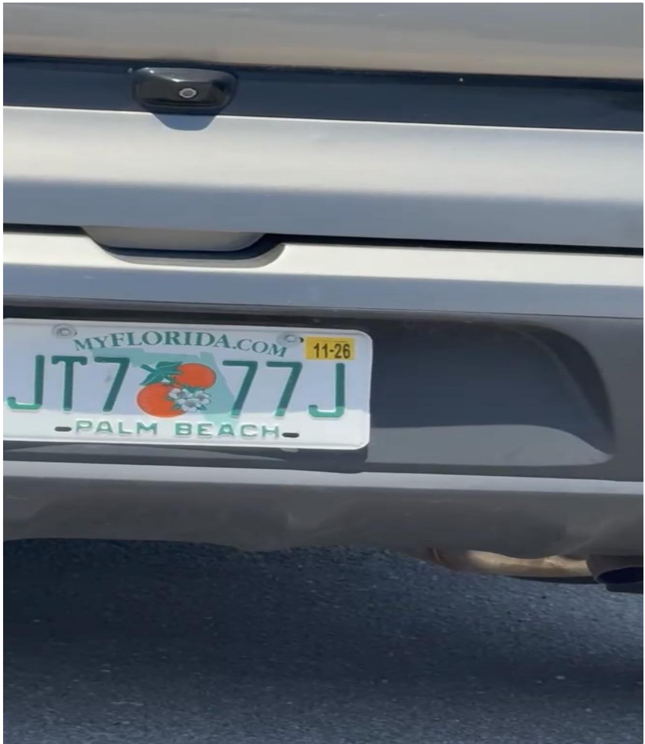
BEDFORD I- A LICENSE PLATE WAS PUT ON THIS CAR ON 6/12.