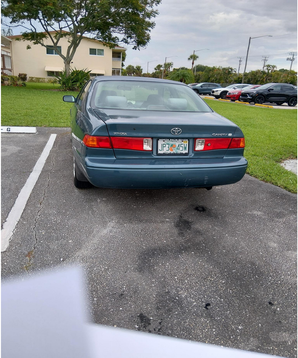
EASTHAMPTON G- THIS INOPERABLE CAR WAS REPORTED IN BY A CV RESIDENT ON 6/8. IT HAD NOT MOVED IN MONTHS AND BELONGS TO A GUEST OF A RENTAL TENANT.