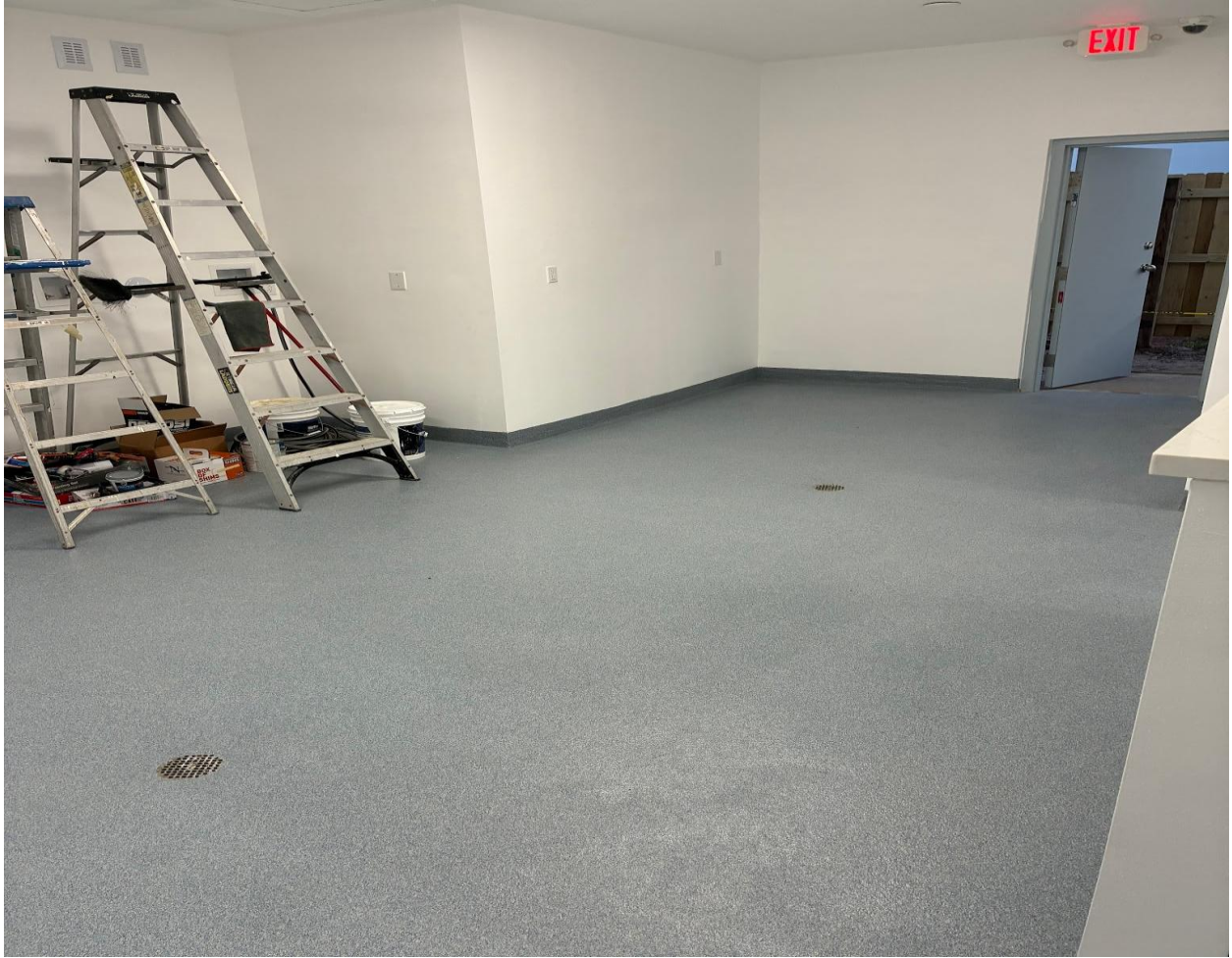
PLYMOUTH LAUNDRY- NEW EPOXY FLOORS. DURABLE, EASY TO CLEAN, SLIP RESISTANT.