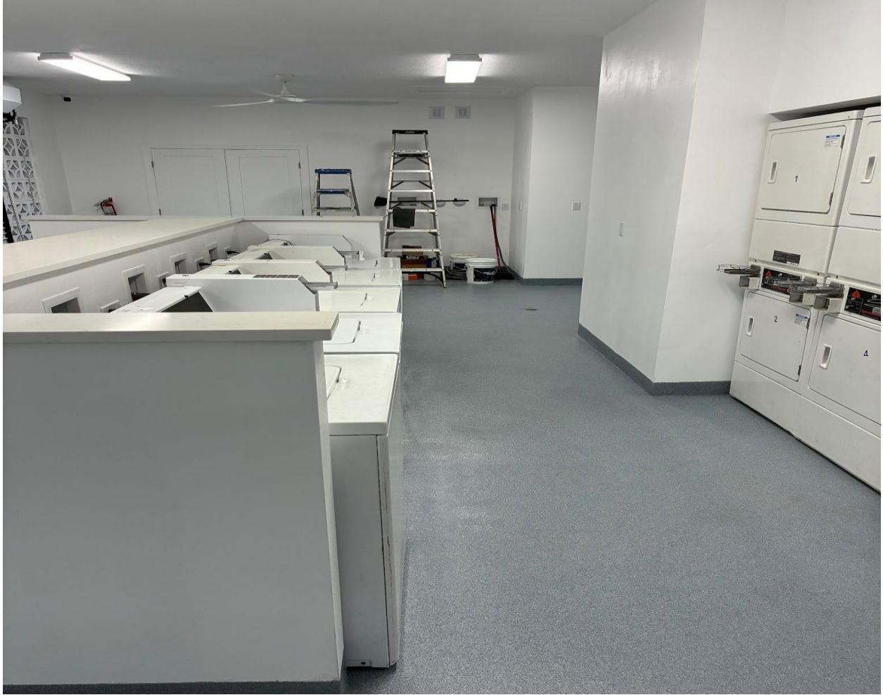
PLYMOUTH LAUNDRY- NEW EPOXY FLOORS. DURABLE, EASY TO CLEAN, SLIP RESISTANT.