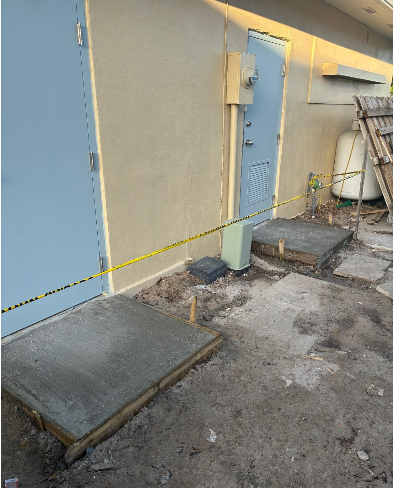
PLYMOUTH LAUNDRY- CONCRETE FOOTPADS WERE POURED ON 6/10.