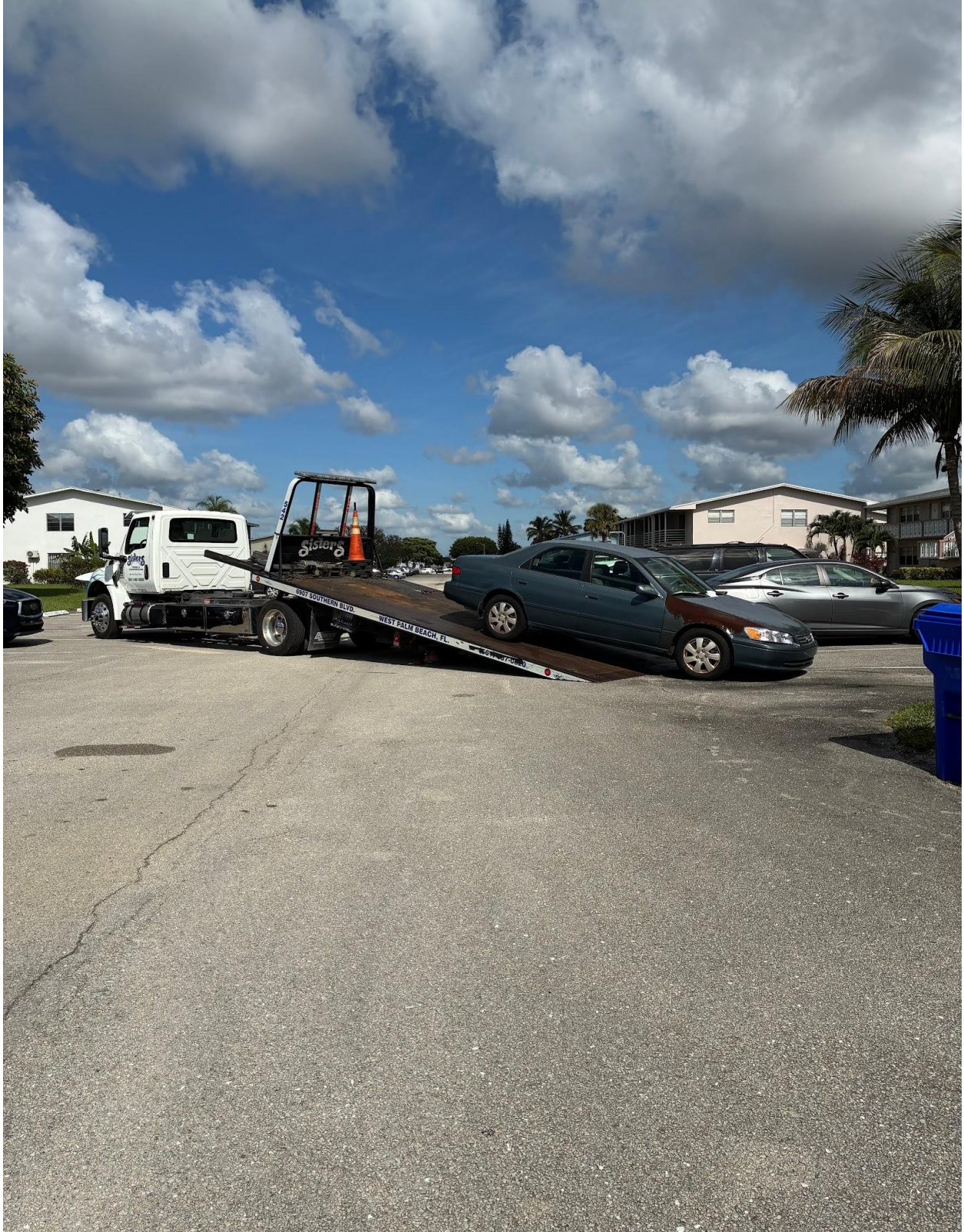
EASTHAMPTON G- THIS INOPERABLE CAR WAS REMOVED FROM CV BY SISTERS TOWING ON 6/11.