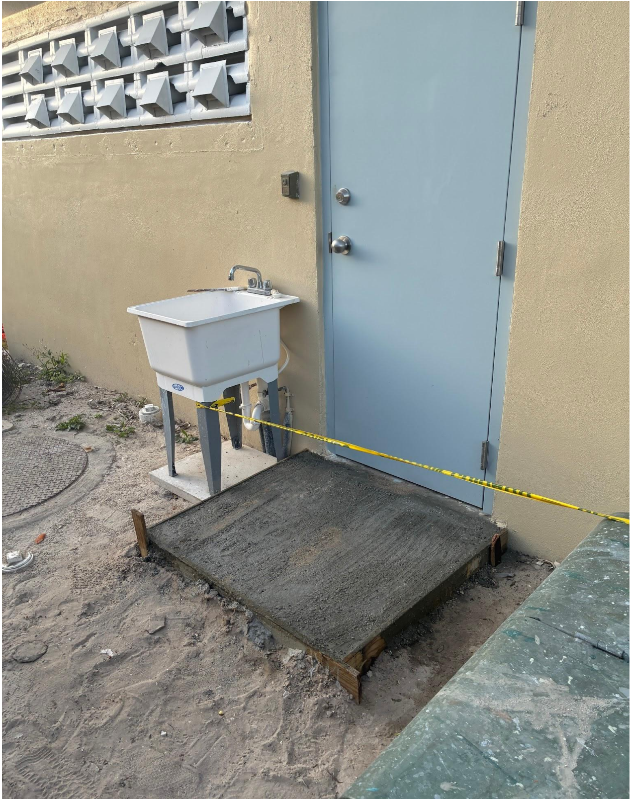
PLYMOUTH LAUNDRY- CONCRETE FOOTPADS WERE POURED ON 6/10.