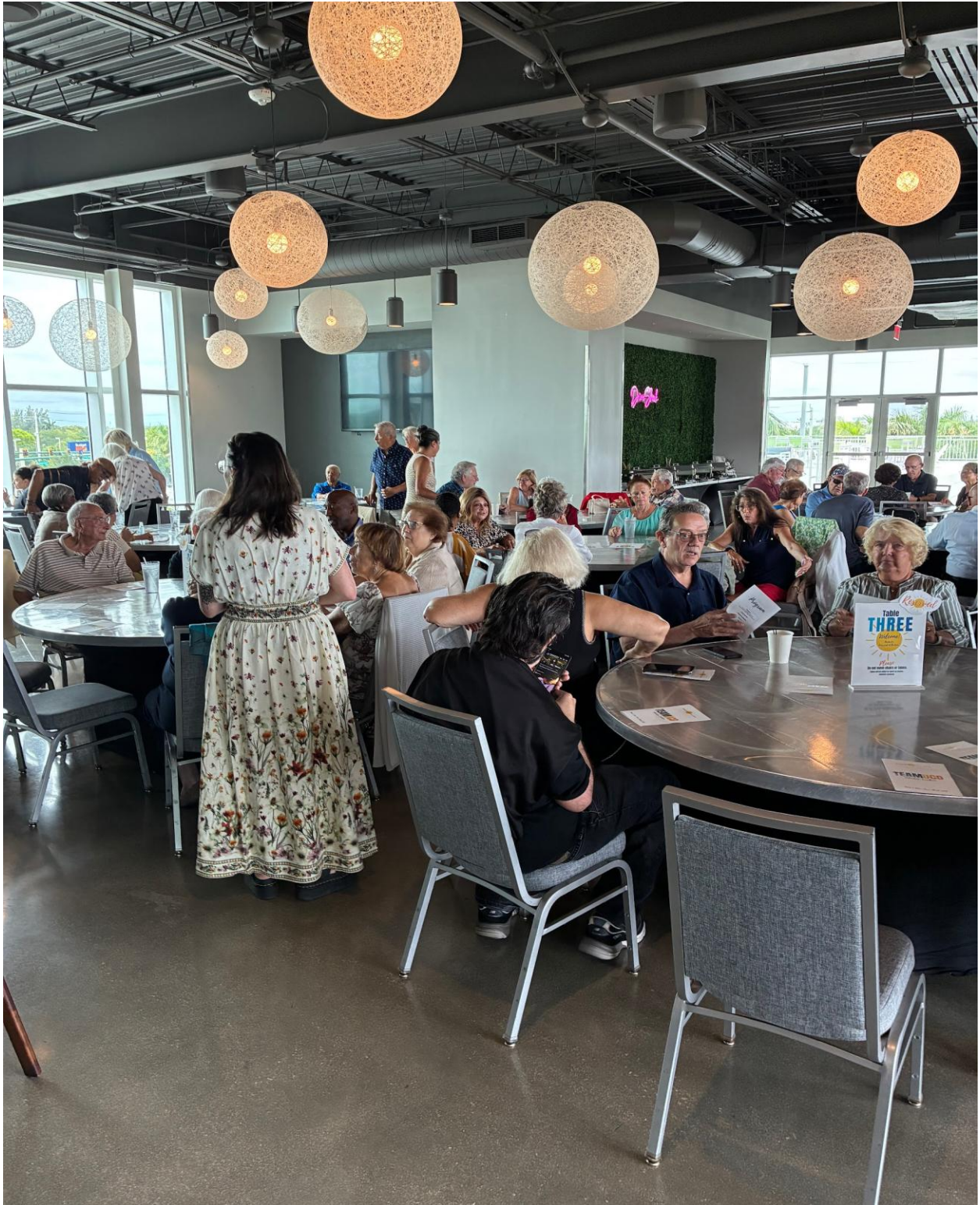
UCO VOLUNTEER APPRECIATION LUNCHEON- ABOUT ONE HUNDRED VOLUNTEERS ATTENDED THIS LUNCHEON. UCO RUNS ON VOLUNTEER POWER!