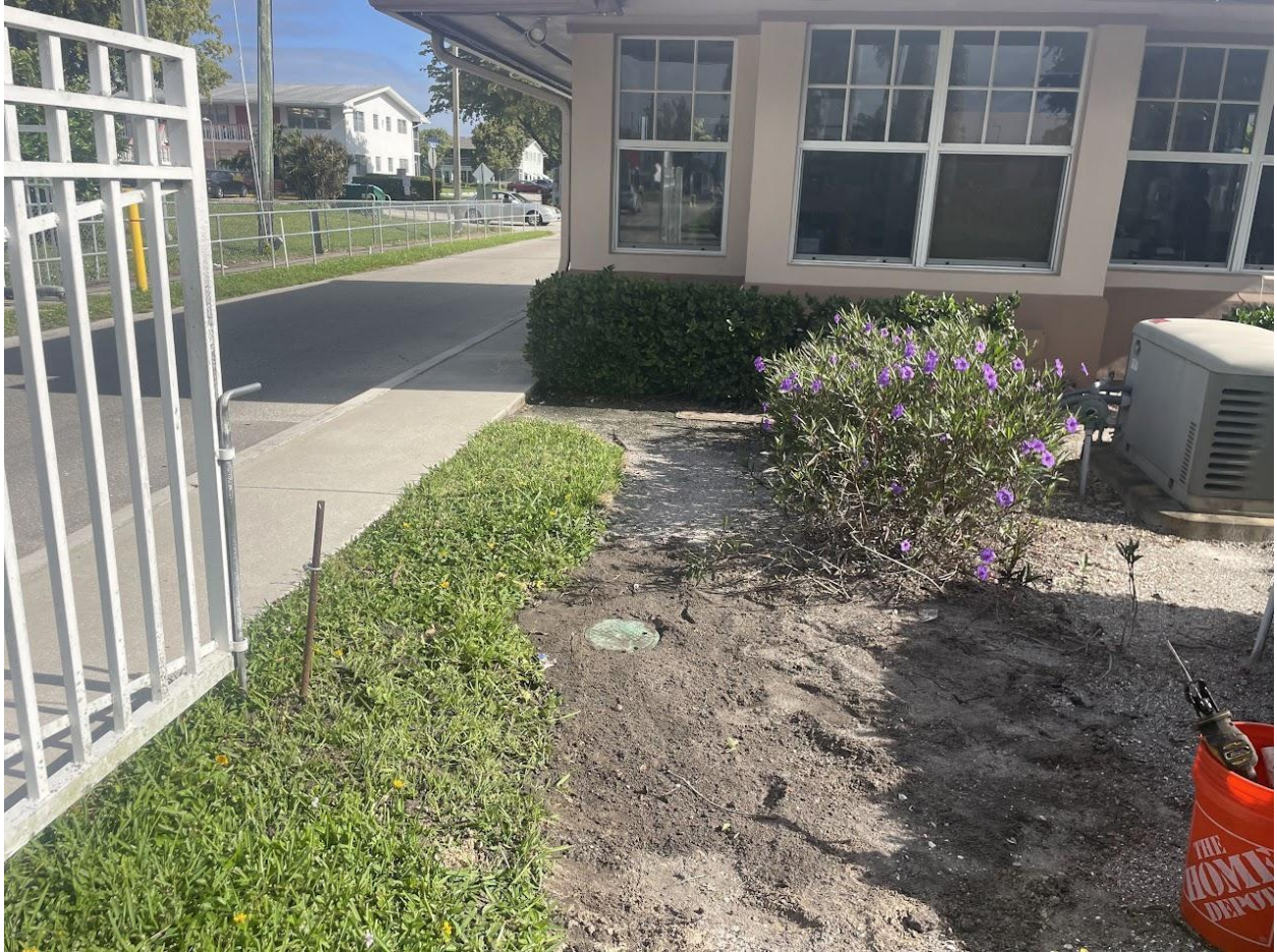
OKEECHOBEE GUARDHOUSE- IRRIGATION REPAIRS MADE BY SEACREST SERVICES LAST WEEK.