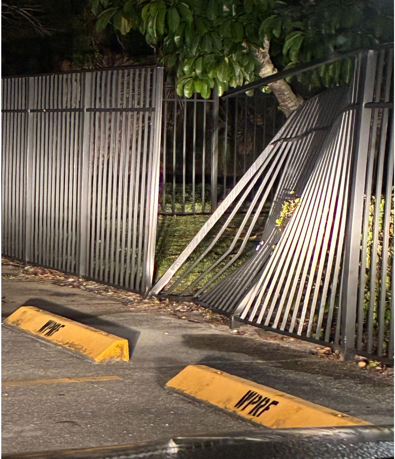
DORCHESTER POOL- A RESIDENT ACCIDENTALLY CRASHED INTO THIS FENCE ON 5/28.