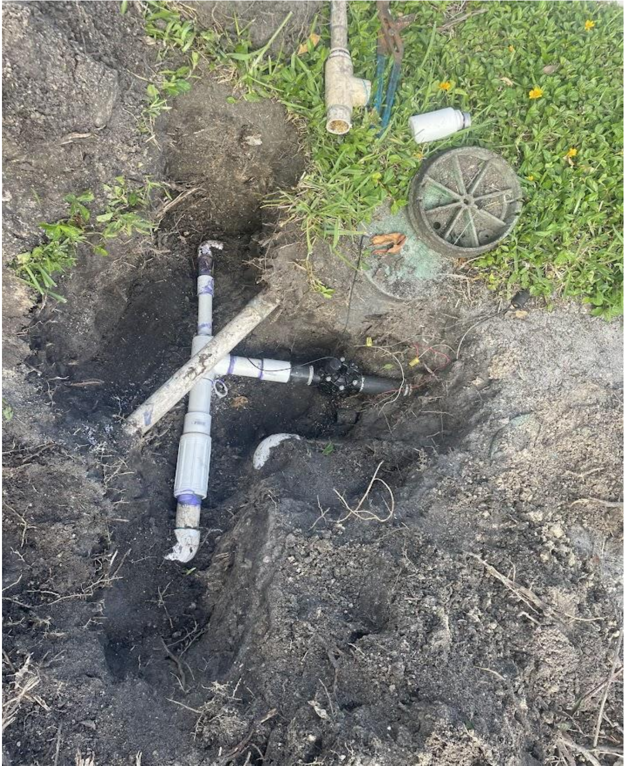
HAVERHILL GUARDHOUSE- A FAULTY IRRIGATION CONTROL VALVE WAS REPLACED BY SEACREST SERVICES LAST WEEK.