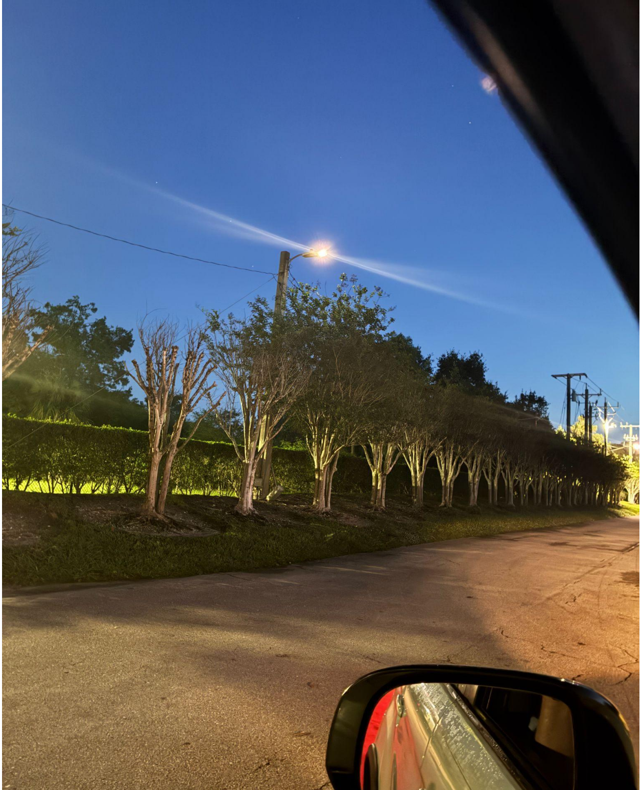
SUSSEX SECTION- THIS STREETLIGHT IS PARTIALLY LIT. ONE OF THE THREE ELEMENTS IS DARK. A REPORT WAS SENT TO FPL, TICKET #44180.