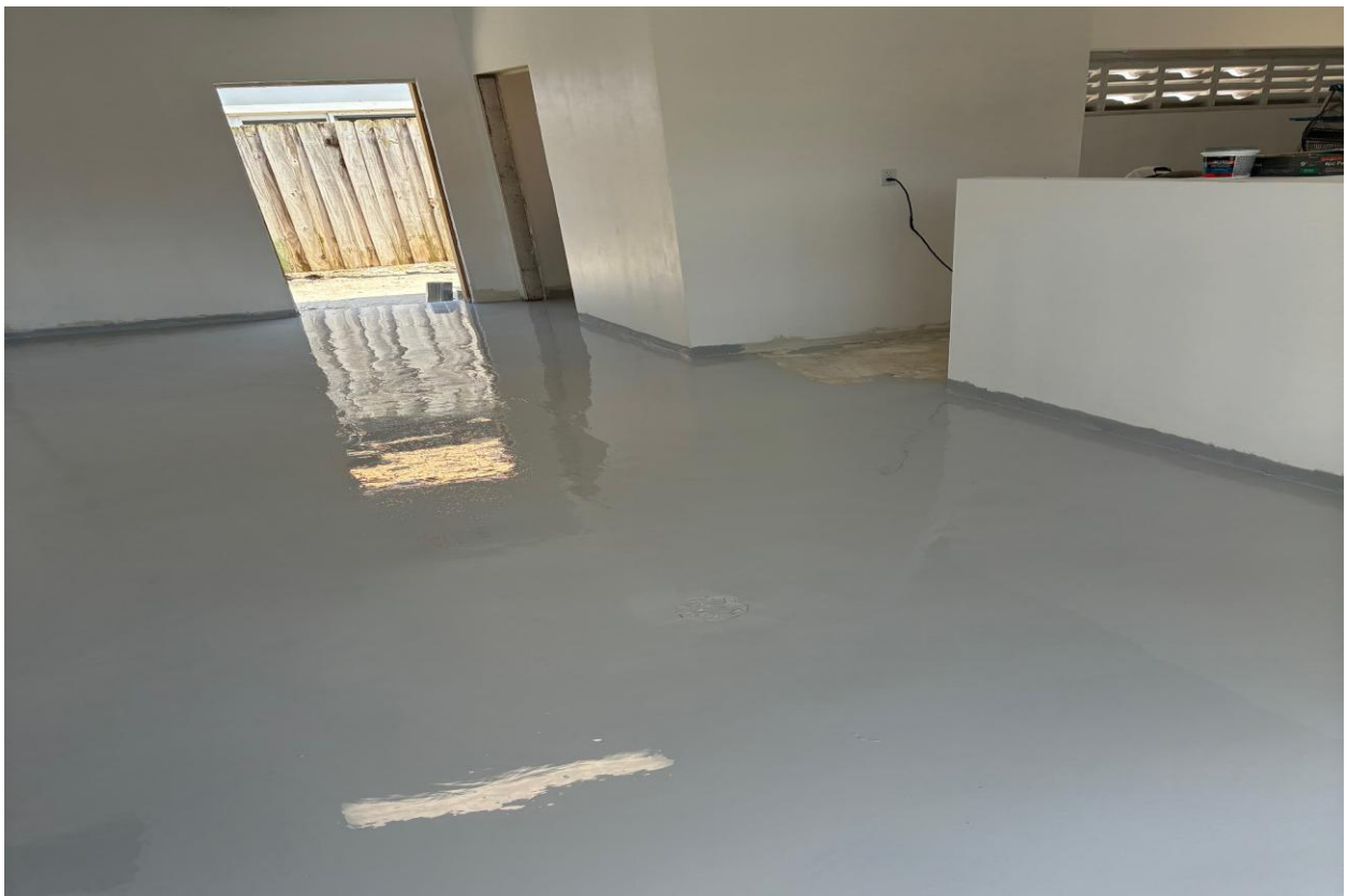
PLYMOUTH LAUNDRY- A NEW EPOXY FLOOR IS BEING INSTALLED. THIS IS THE FIRST OF FOUR COATS.