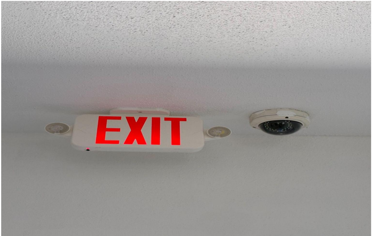
PLYMOUTH LAUNDRY- INTERIOR PAINTING IS COMPLETE. NEW LIGHTING FIXTURES AND CEILING FANS WERE INSTALLED.