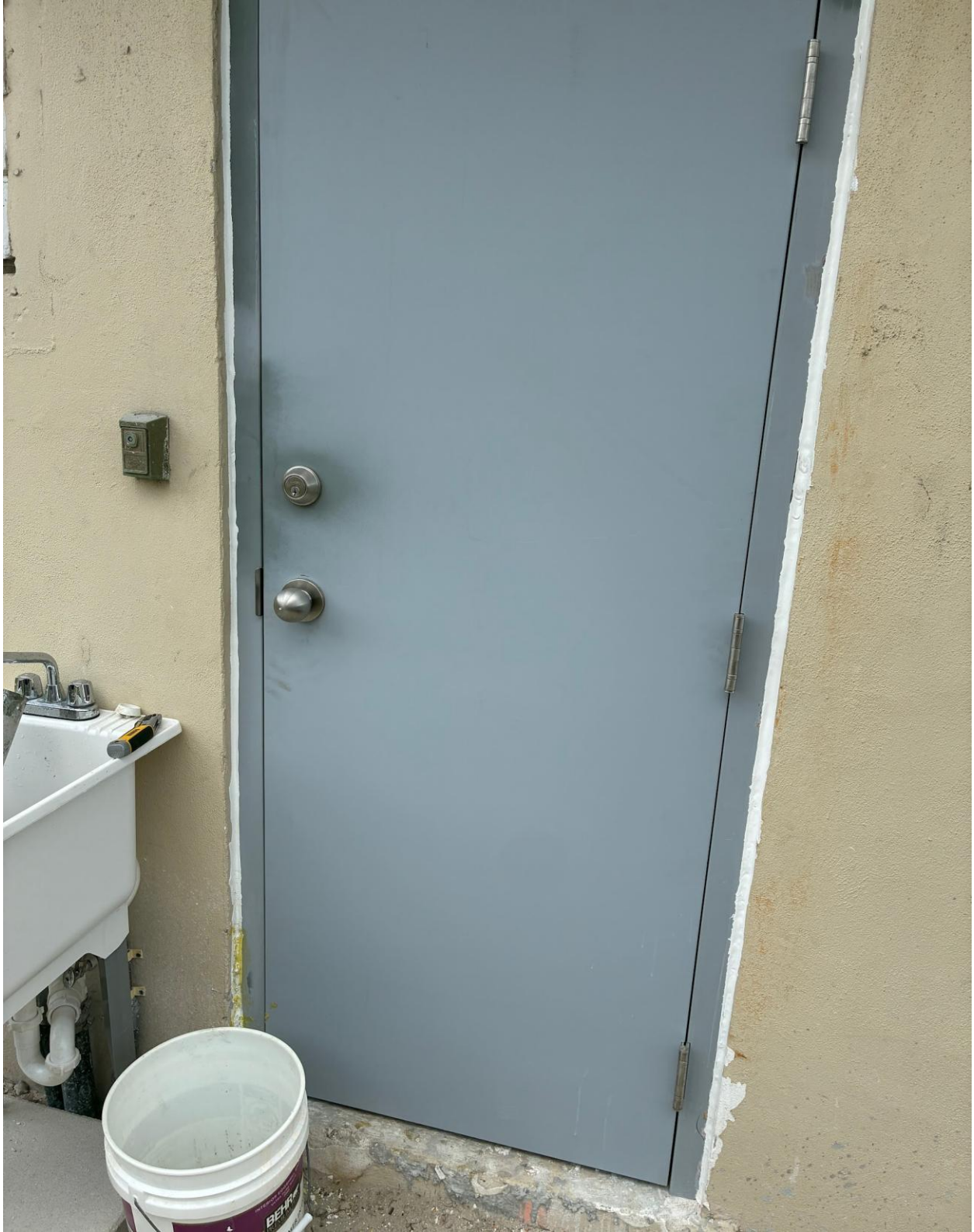
PLYMOUTH LAUNDRY- DRYER VENT ROOM DOOR INSTALLED.