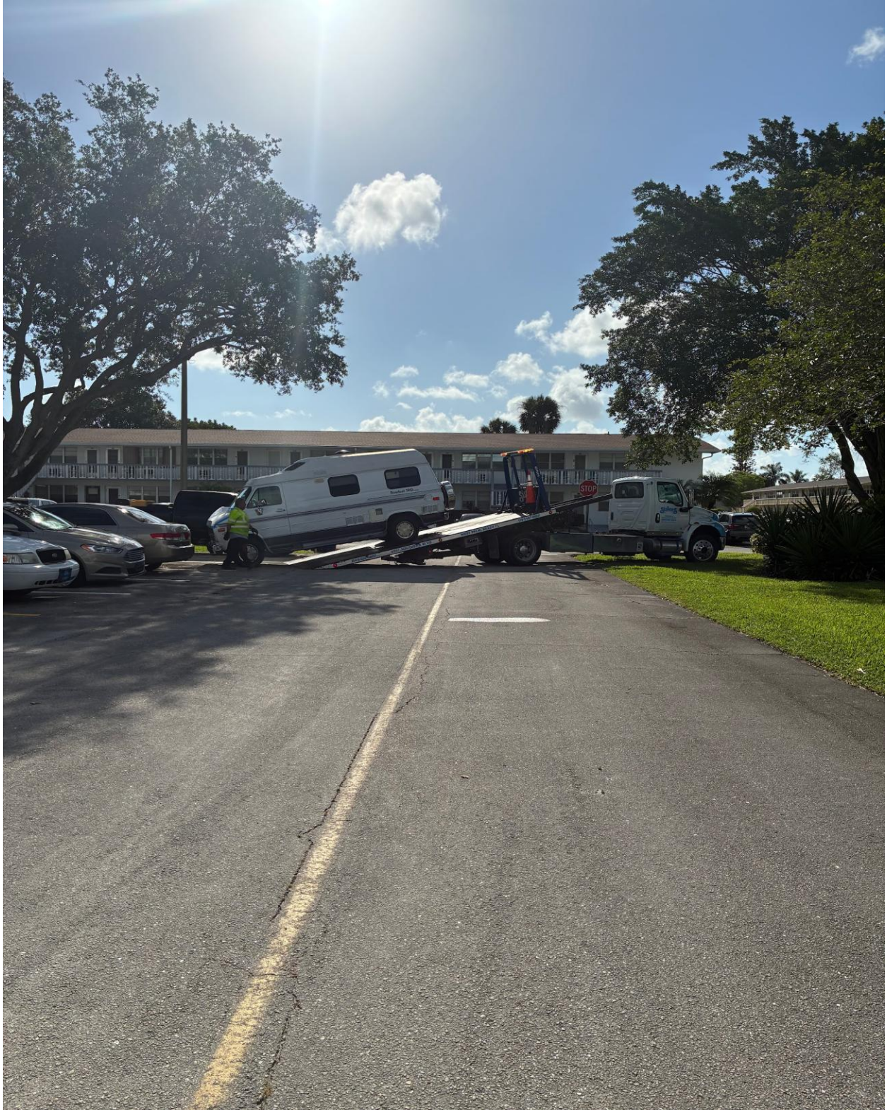
NORTHAMPTON G- THIS VAN WAS REMOVED FROM THE PROPERTY BY SISTERS TOWING ON 5/21.