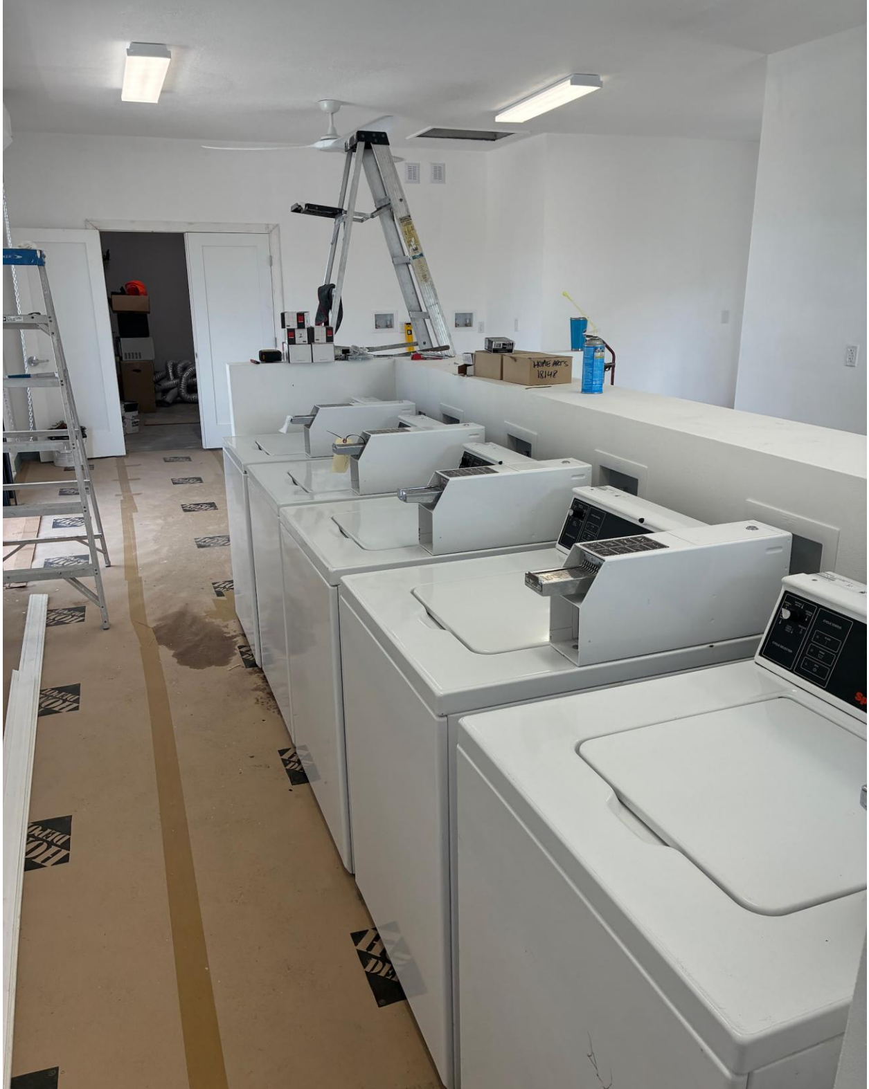
PLYMOUTH LAUNDRY- WASHERS REINSTALLED. A QUARTZ COUNTERTOP WILL BE INSTALLED ON TOP OF THE DIVIDER WALL.