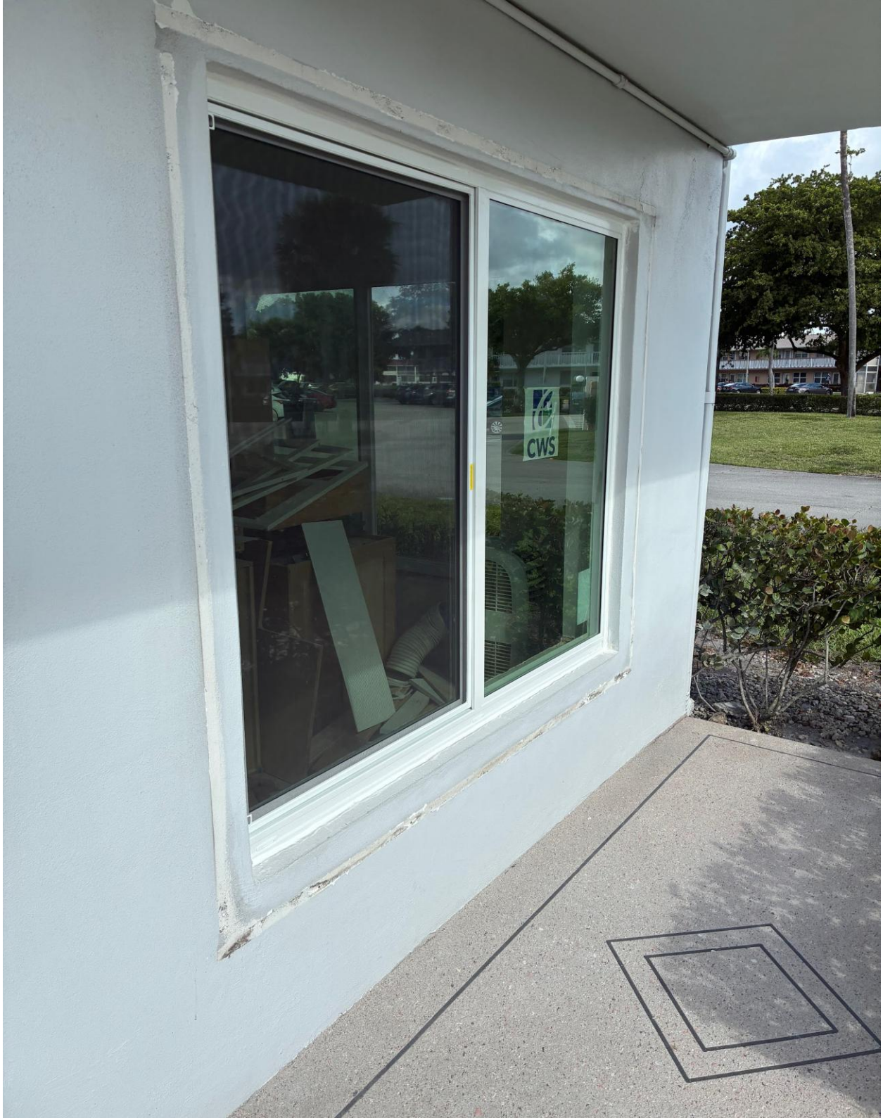
114 WELLINGTON F- WINDOWS INSTALLED, NO ACTIVE PERMIT ON FILE.