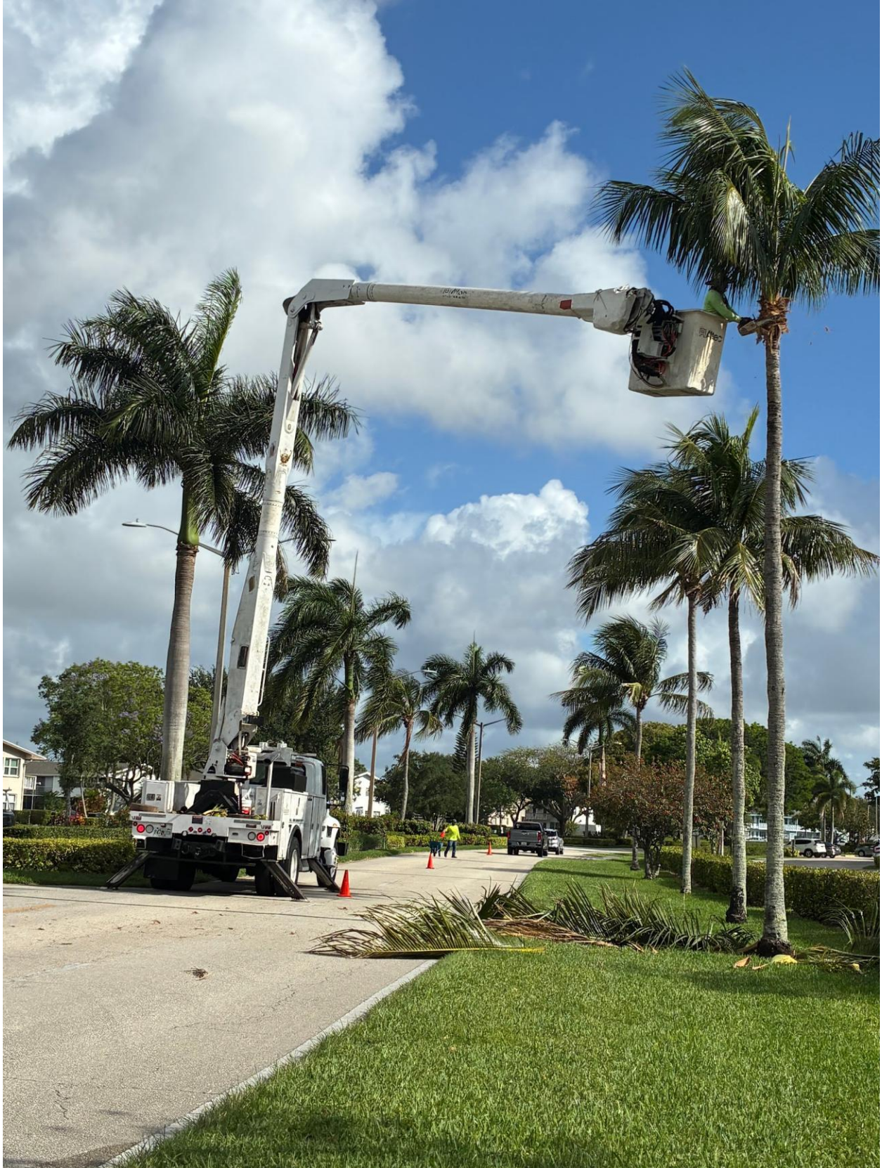
WEST DRIVE- ANNUAL TREE AND PALM TRIMMING BEGAN ON 5/19.