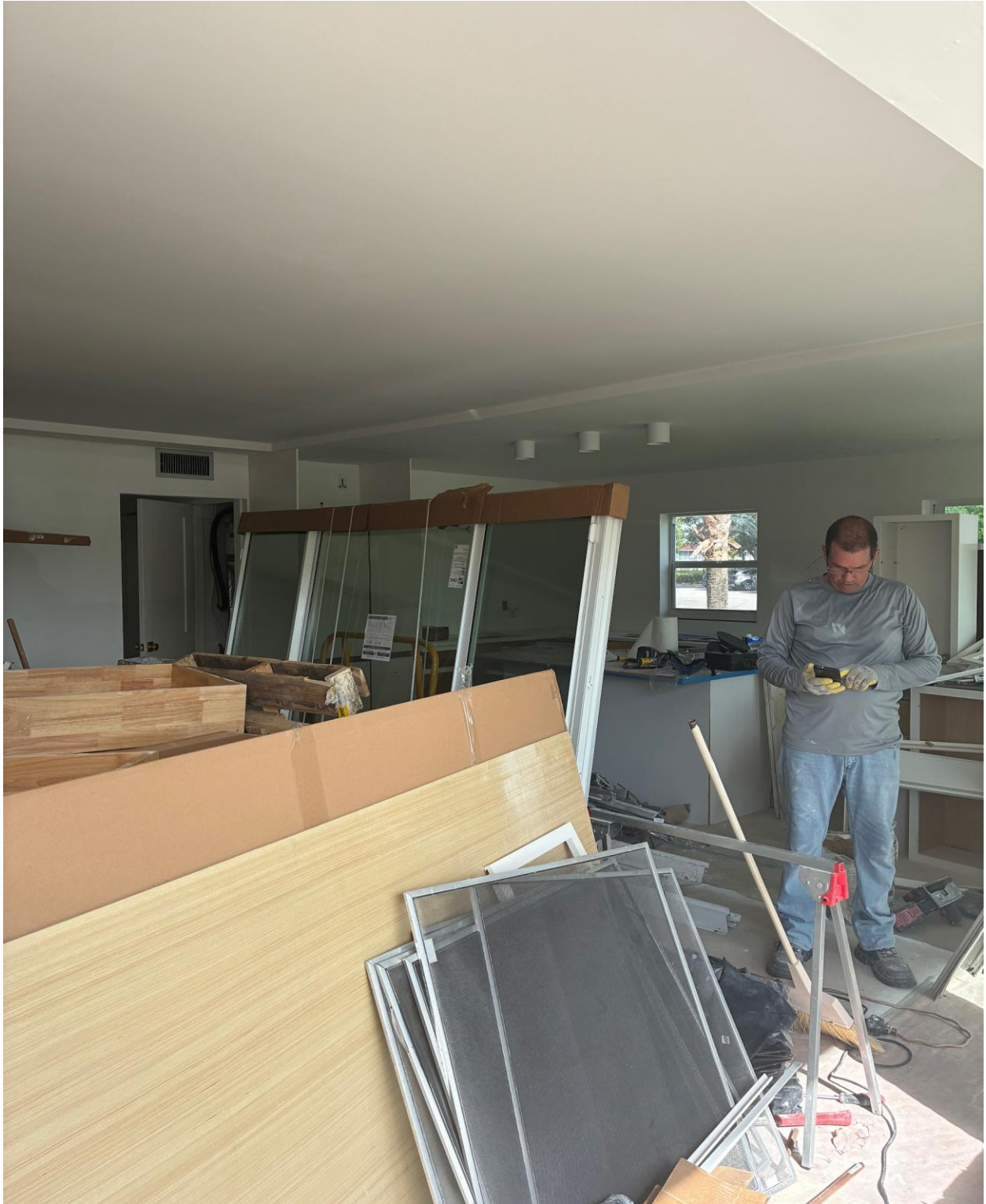
114 WELLINGTON F- KITCHEN WALL REMOVED, RECESSED LIGHTING INSTALLED, KITCHEN REDESIGN. NO ACTIVE PERMITS.