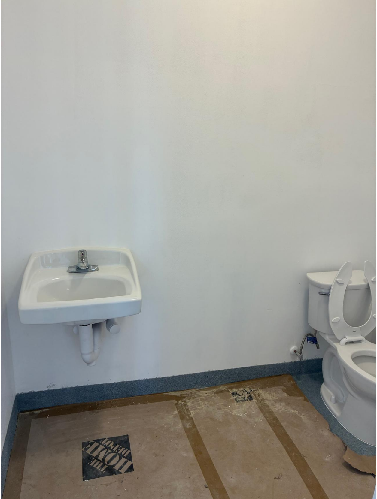
PLYMOUTH LAUNDRY- BASIN SINK AND TOILET INSTALLED.