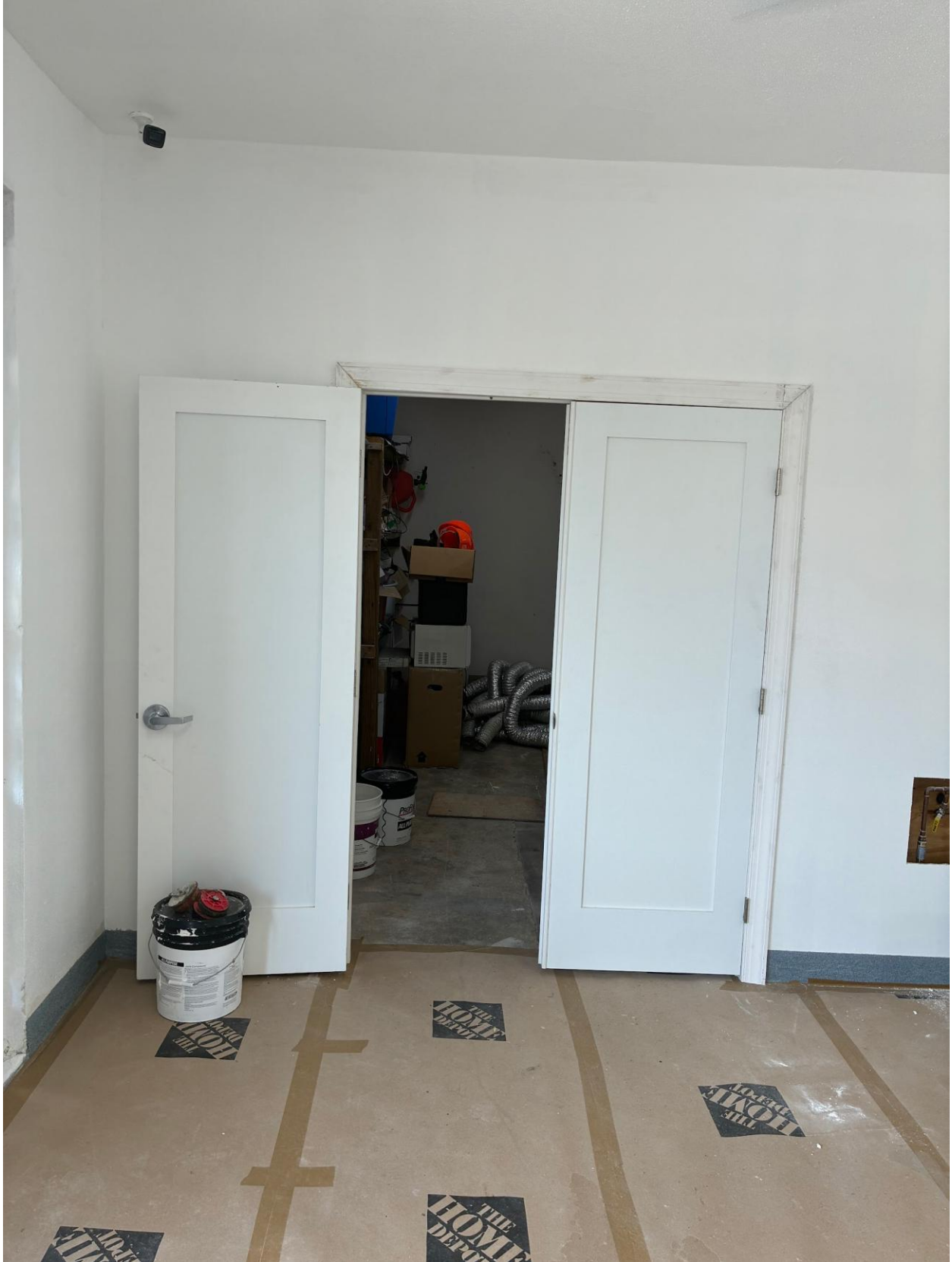
PLYMOUTH LAUNDRY- FINISH CARPENTRY CONTINUES.