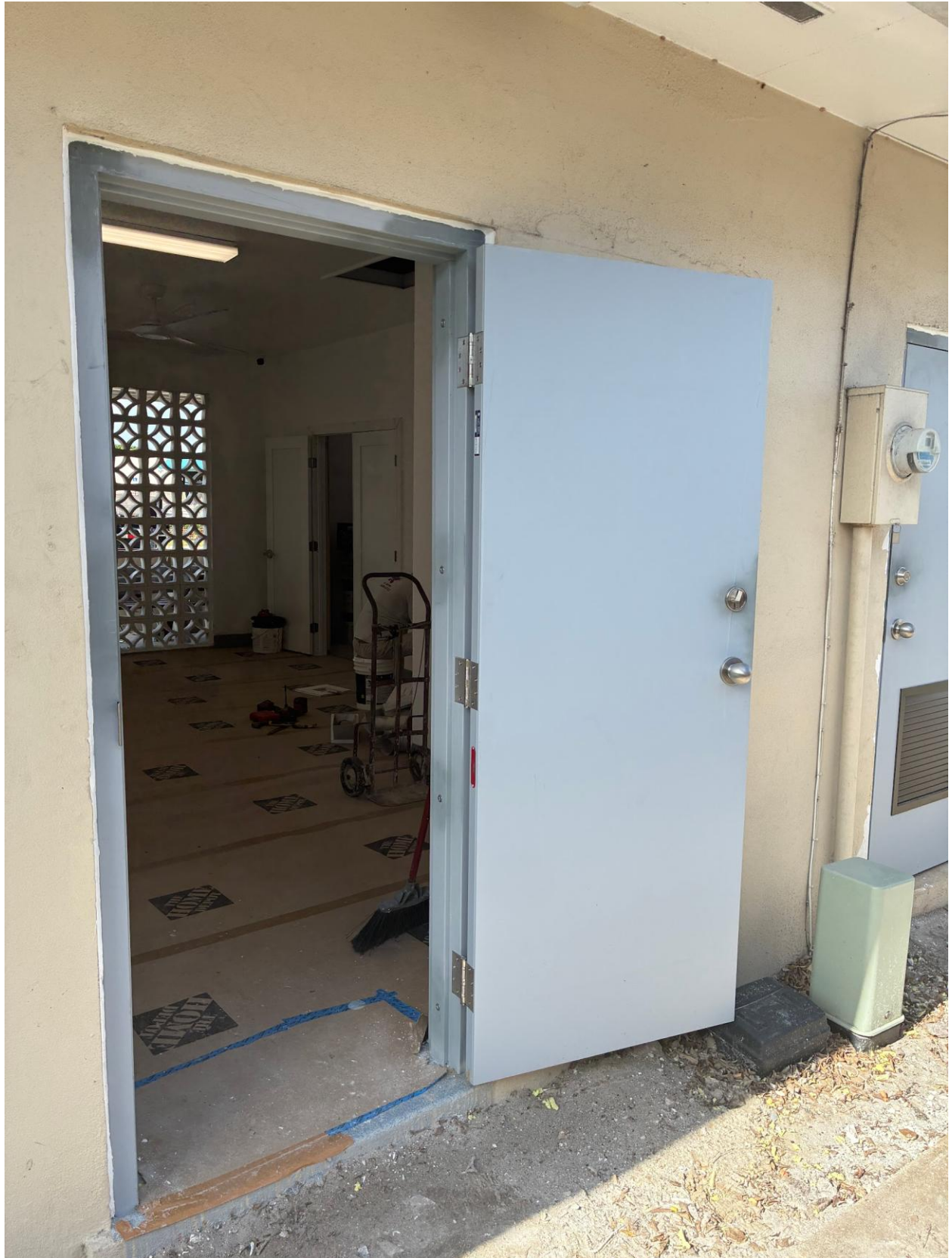
PLYMOUTH LAUNDRY- REAR ENTRY DOOR INSTALLED.