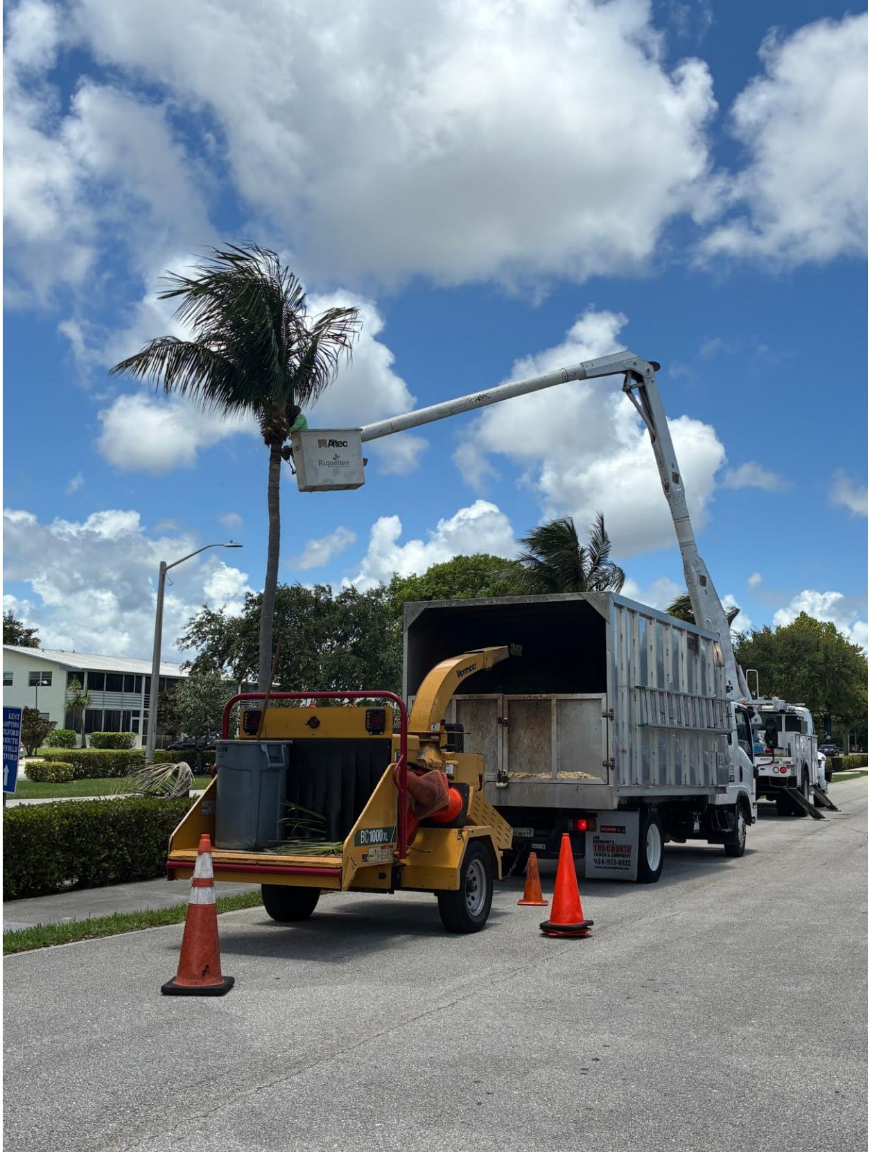
WEST DRIVE- ANNUAL TREE AND PALM TRIMMING BEGAN ON 5/19.