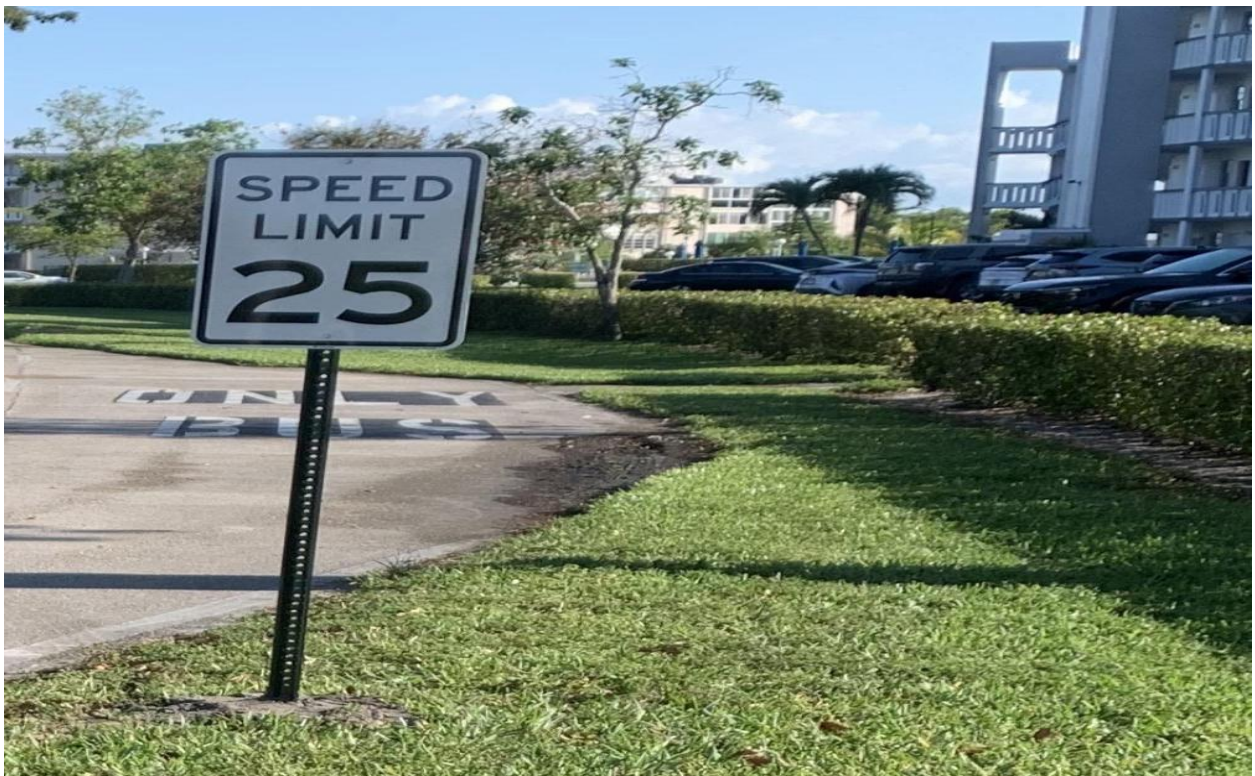
WEST, SOUTH DRIVES- LAST WEEK, HANDYMAN JOSE INSTALLED ADDITIONAL SPEED LIMIT 25 MPH SIGNS.