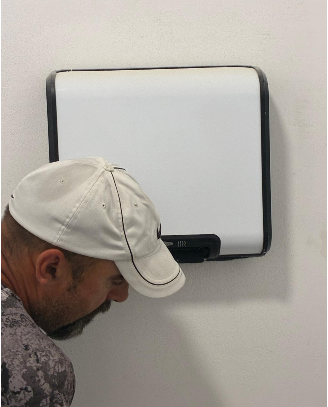
PLYMOUTH LAUNDRY- HAND DRYER INSTALLED.