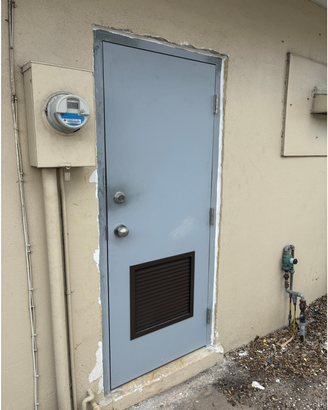
PLYMOUTH LAUNDRY- BOILER ROOM DOOR INSTALLED.