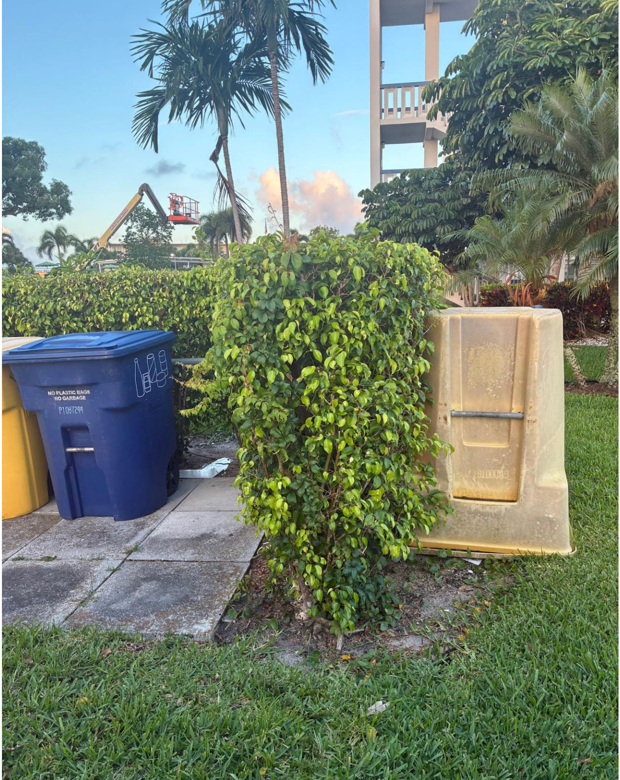
GREENBRIER A/C- BUSTED YELLOW TOTER. THIRD REQUEST SENT TO WASTE PRO.