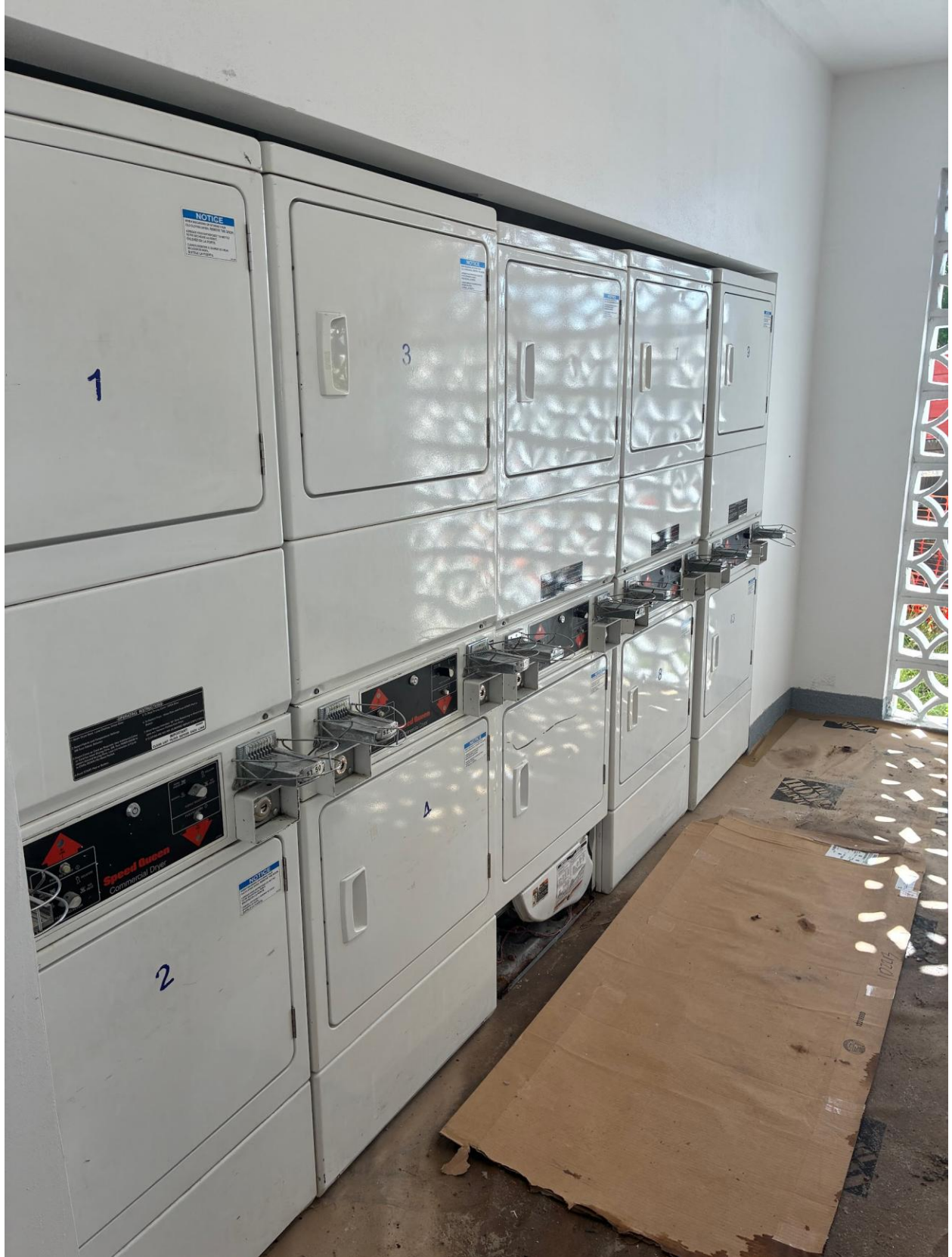
PLYMOUTH LAUNDRY- DRYERS REINSTALLED.