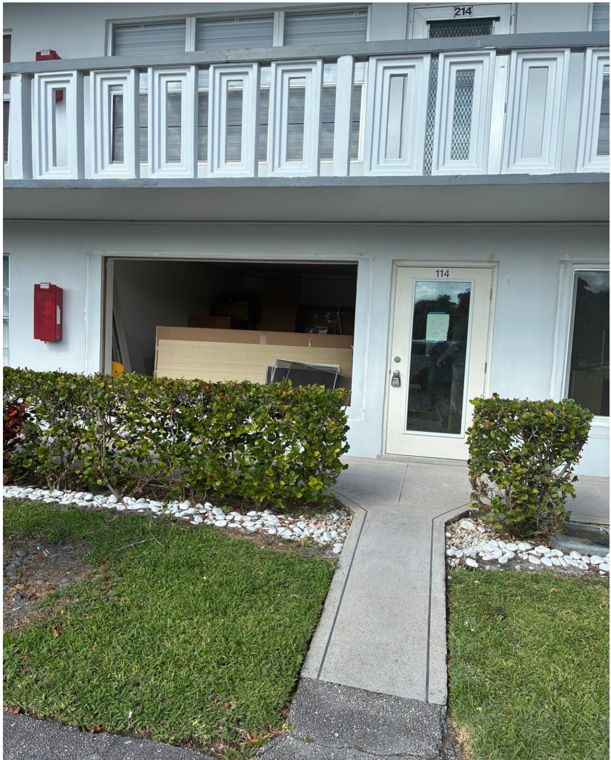
114 WELLINGTON F- WINDOWS REMOVED, NO ACTIVE PERMIT ON FILE. THIS PICTURE WAS TAKEN AT 9:35 AM.