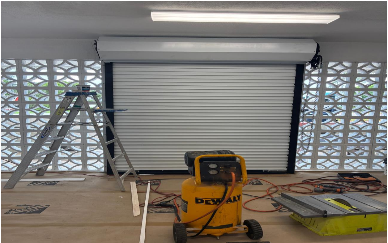
PLYMOUTH LAUNDRY- A NEW FRONT ROLL UP DOOR WAS INSTALLED.