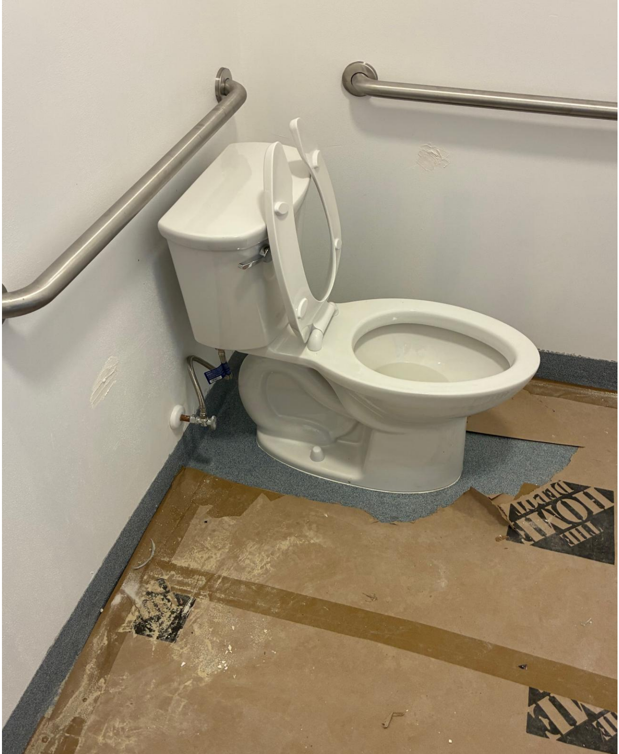
PLYMOUTH LAUNDRY- HANDRAILS INSTALLED. THIS IS AN ADA COMPLIANT RESTROOM.