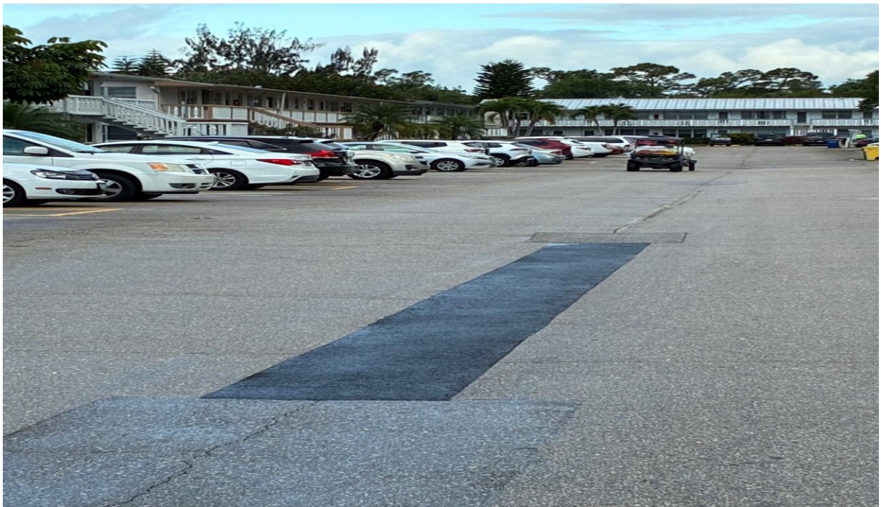
SHEFFIELD O, NORTHAMPTON A- PAVING REPAIRS COMPLETE.