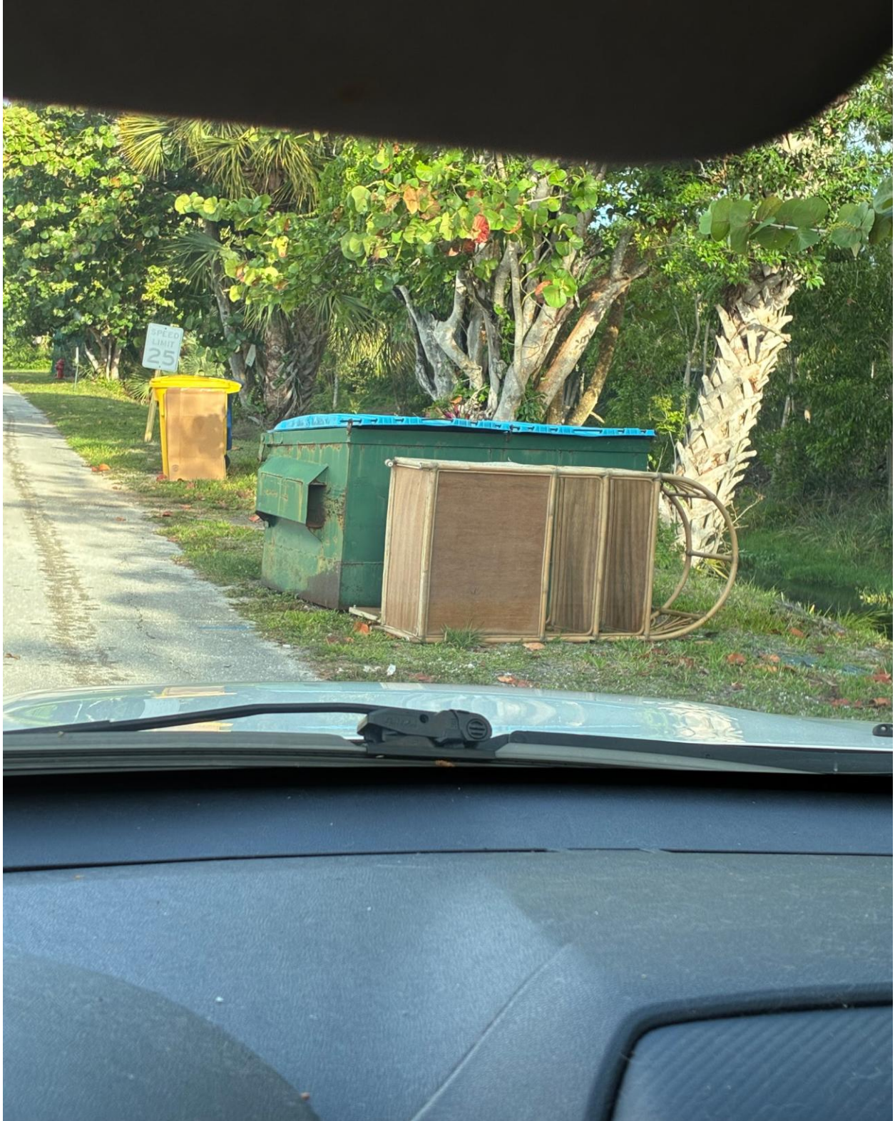
NORWICH F- THIS SHELF UNIT WAS PUT OUT AFTER THE FRIDAY BULK TRASH TRUCK PASSED BY.