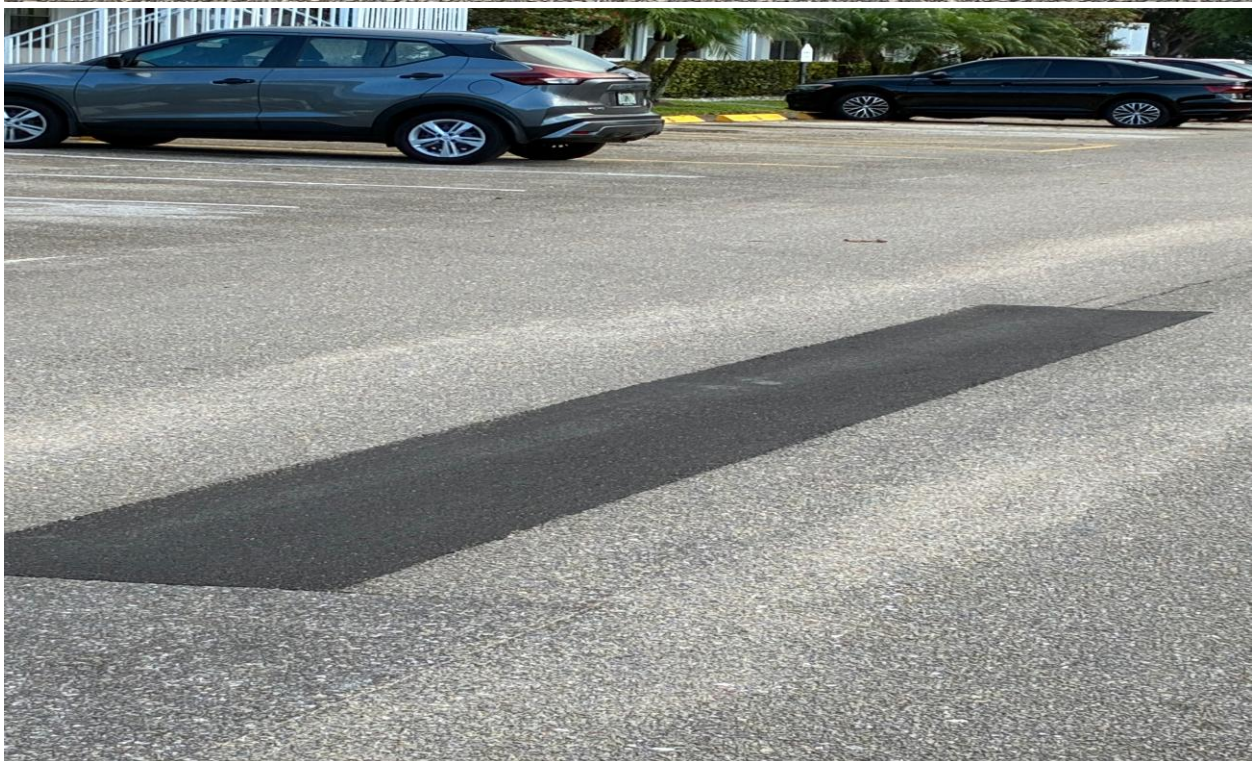
BERKSHIRE K, WINDSOR A- PAVING REPAIRS COMPLETE.