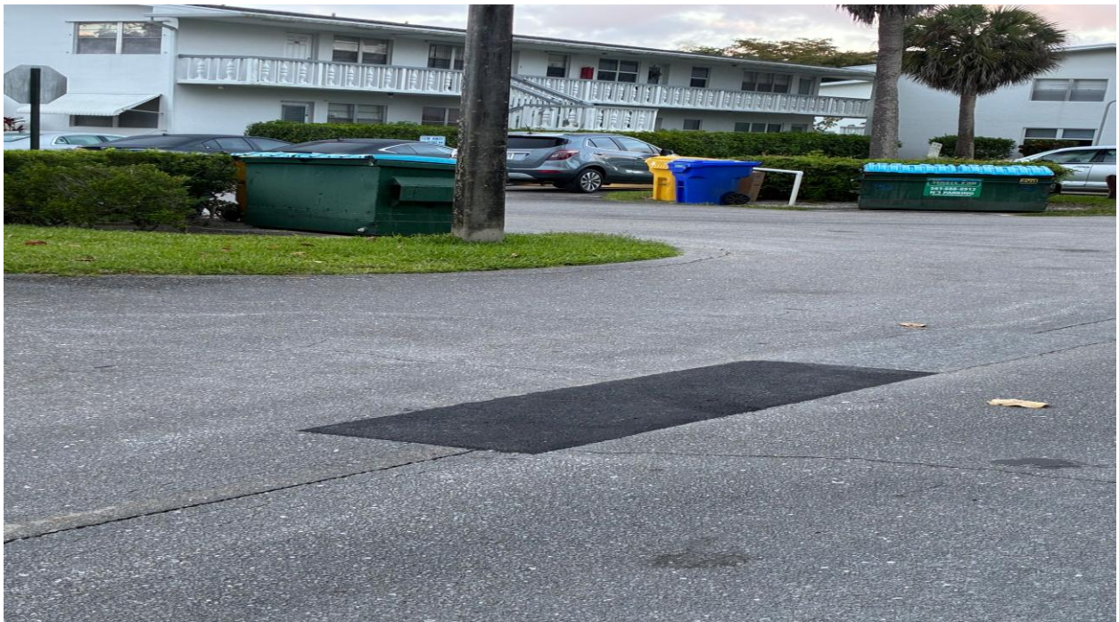
EASTHAMPTON F, COVENTRY L- PAVING REPAIRS COMPLETE.