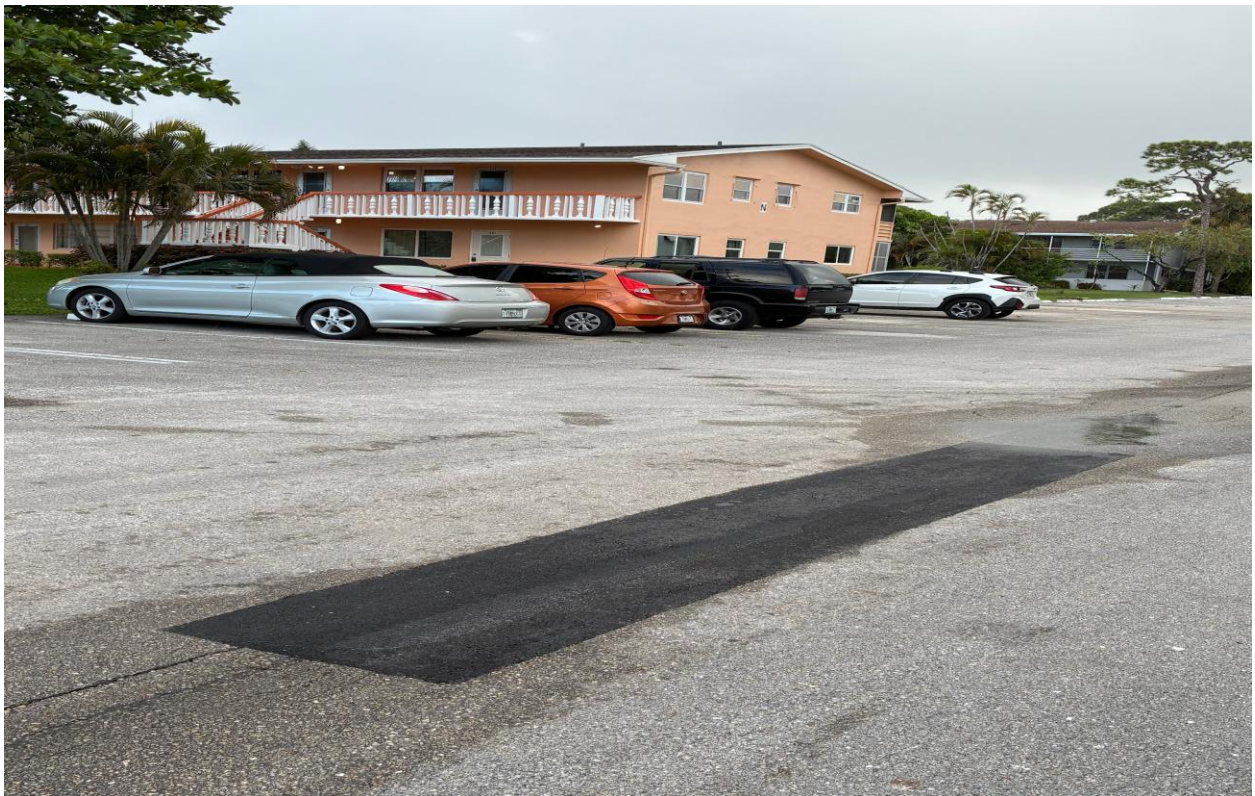
SHEFFIELD M, N, PAVING REPAIRS COMPLETE.