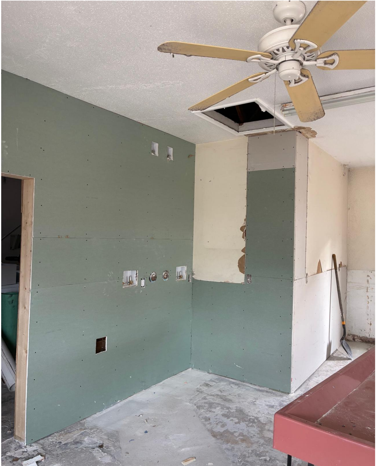
PLYMOUTH LAUNDRY- DRYWALL INSTALLATION. THIS IS WHERE THE TWO NEW HIGH CAPACITY WASHERS WILL BE. THOSE NASTY FANS AND LIGHTING FIXTURES WILL BE REPLACED.