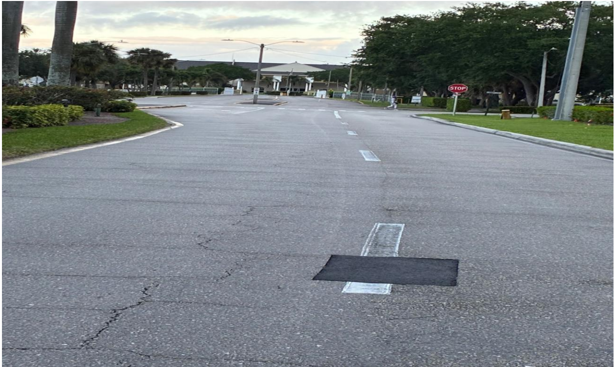
CENTURY BOULEVARD- PAVING REPAIRS COMPLETE.