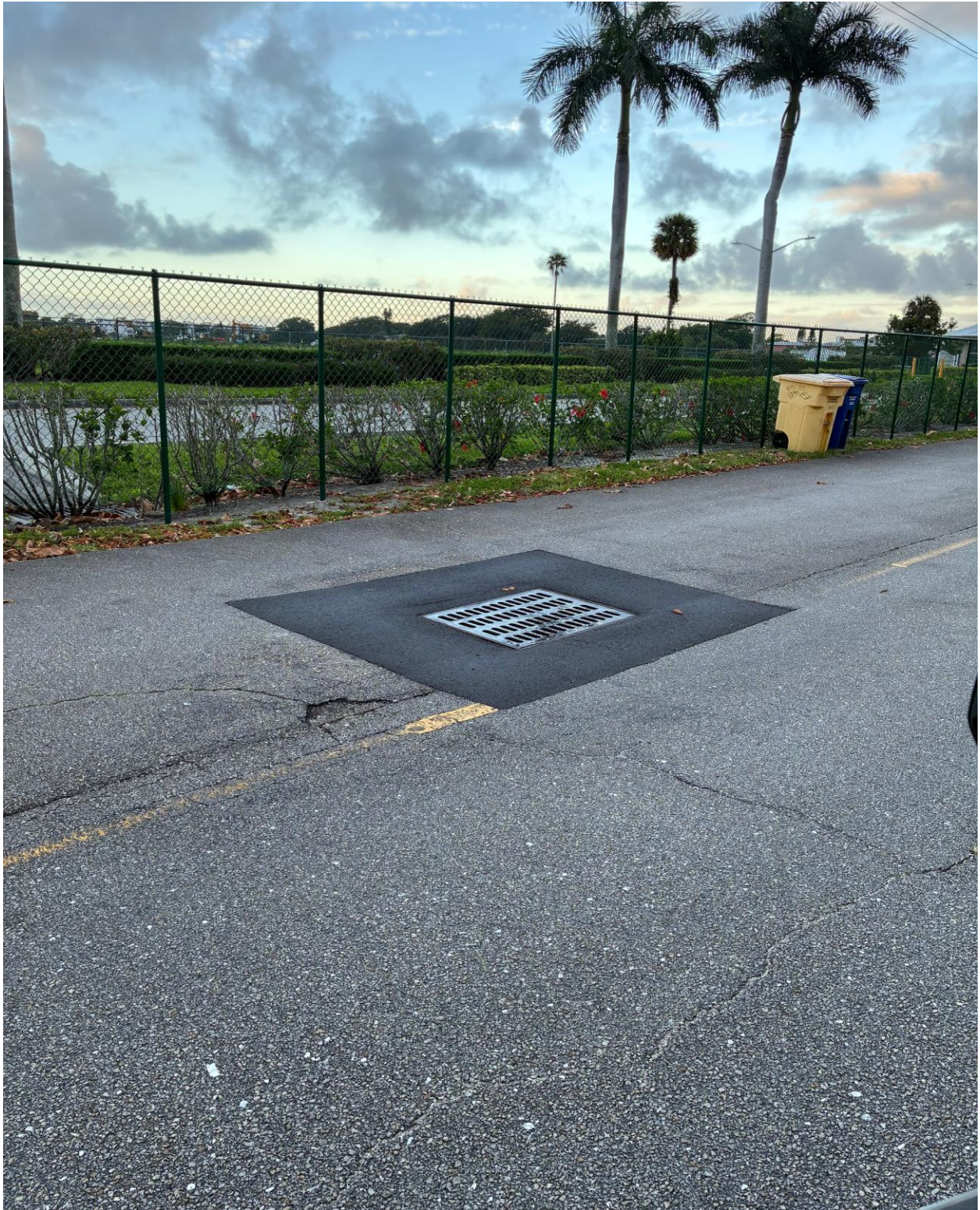
EASTHAMPTON A- CATCH BASIN REPAIR COMPLETE. THE DETERIORATED PAVEMENT TO THE LEFT OF THE CATCH BASIN WILL BE REPAIRED NEXT MONTH.