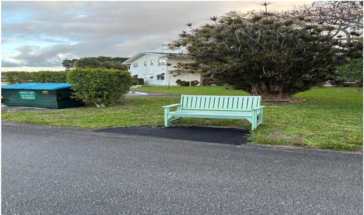
BEDFORD D, F- PAVING REPAIRS COMPLETE.