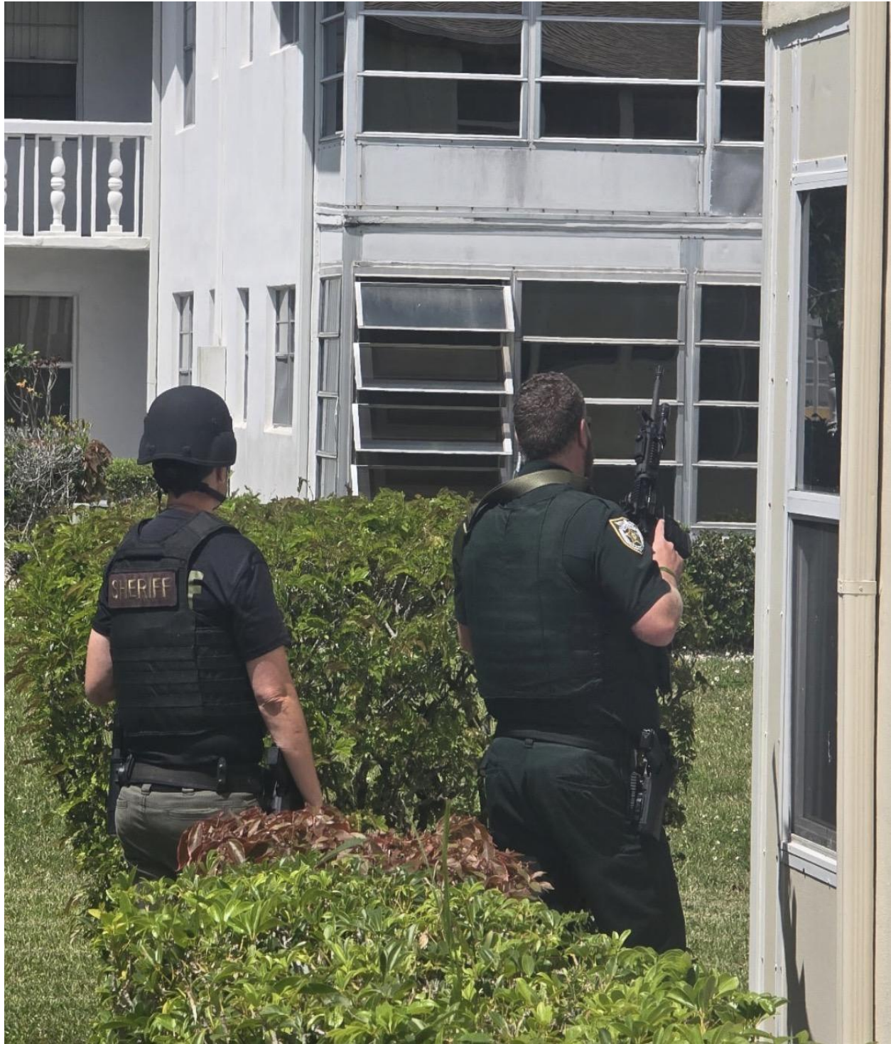
NORTHAMPTON SECTION- ON 4/16, PBSO RESPONDED TO A REPORT OF GUN SHOTS.