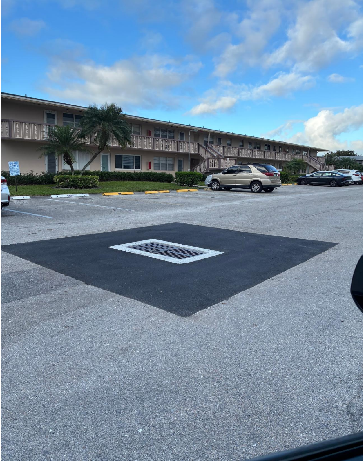
CHATHAM I- CATCH BASIN REPAIR COMPLETE.