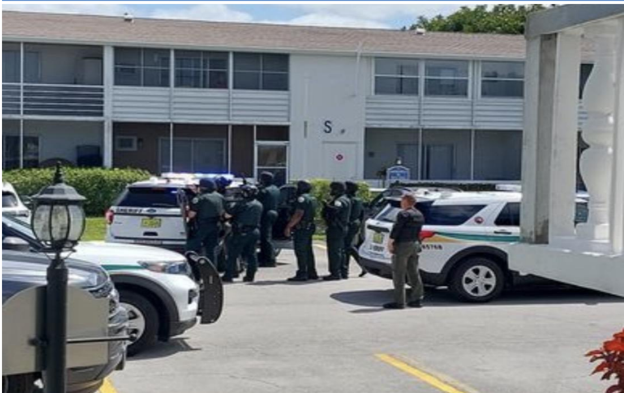
NORTHAMPTON S- MANY PBSO DEPUTIES RESPONDED TO THE GUNSHOTS FALSE ALARM ON 4/16.