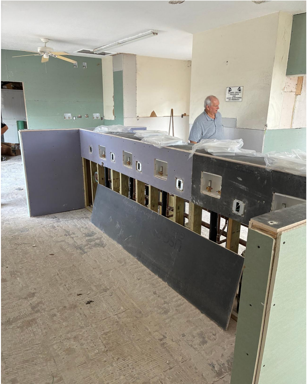
PLYMOUTH LAUNDRY- DRYWALL INSTALLATION. THIS IS WHERE THE REGULAR WASHERS WILL BE.