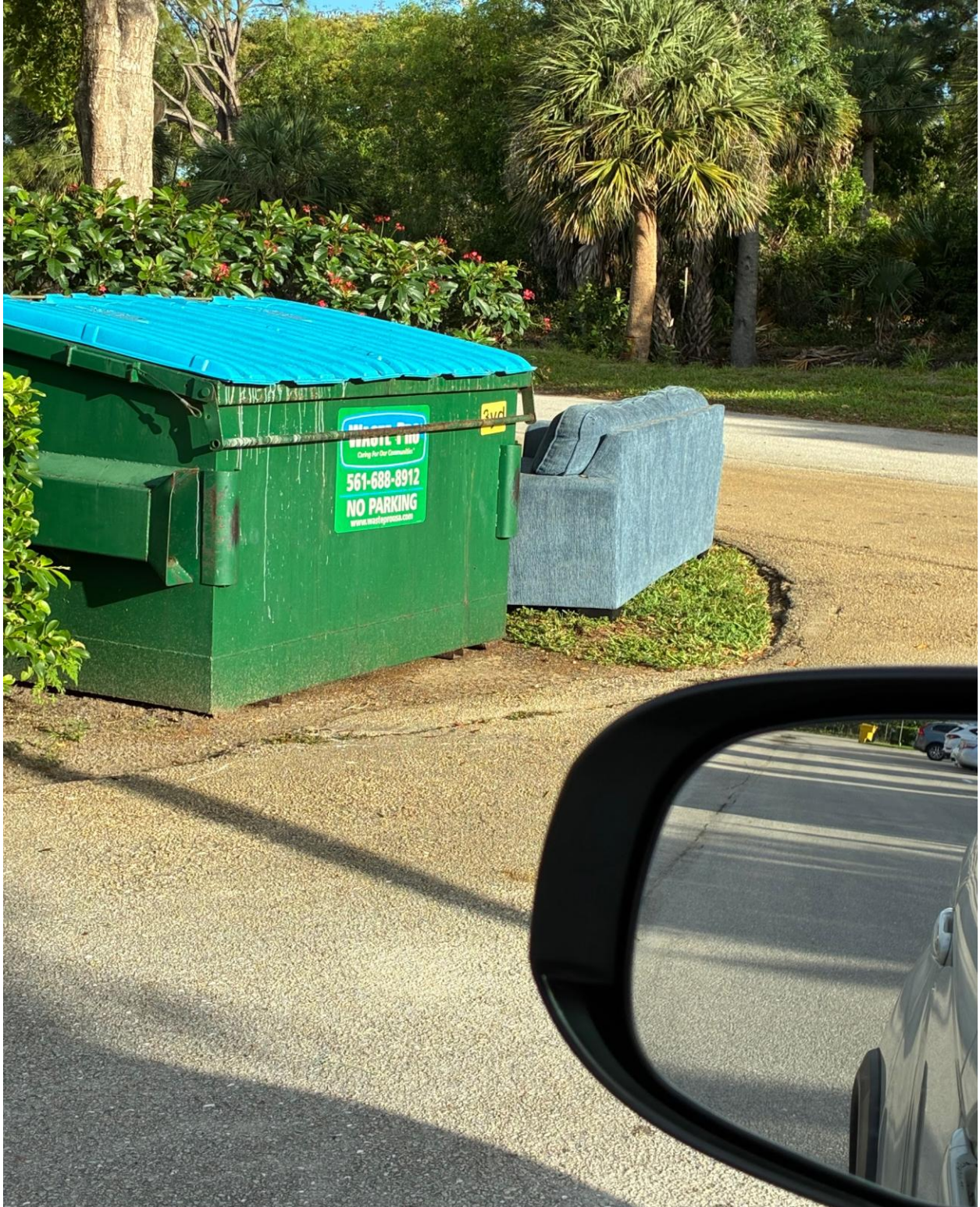
SHEFFIELD P- THIS COUCH WAS PUT OUT AFTER THE FRIDAY BULK TRASH TRUCK PASSED BY.