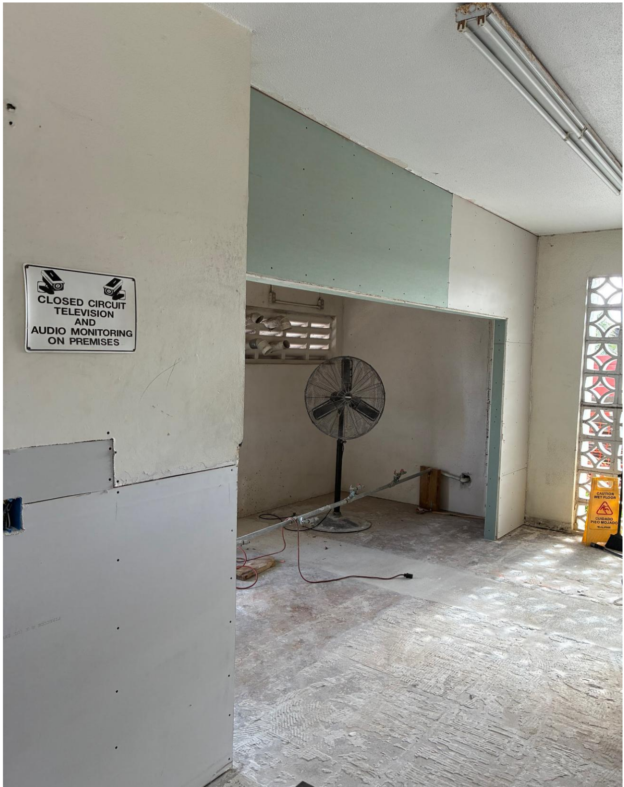
PLYMOUTH LAUNDRY- DRYWALL INSTALLATION. THIS IS WHERE THE DRYERS WILL BE.