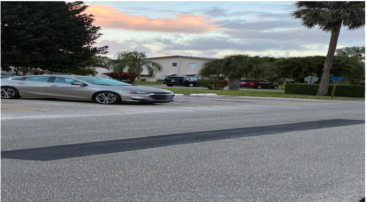
COVENTRY I, WALTHAM F- PAVING REPAIRS COMPLETE.