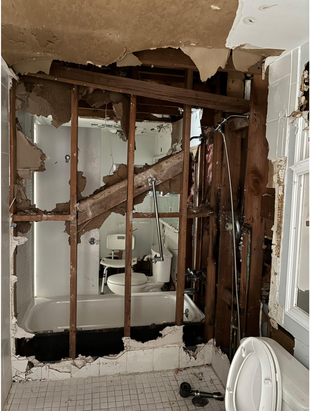
WALTHAM A- DEMO WORK AT THE DAMAGED UNITS CONTINUES.