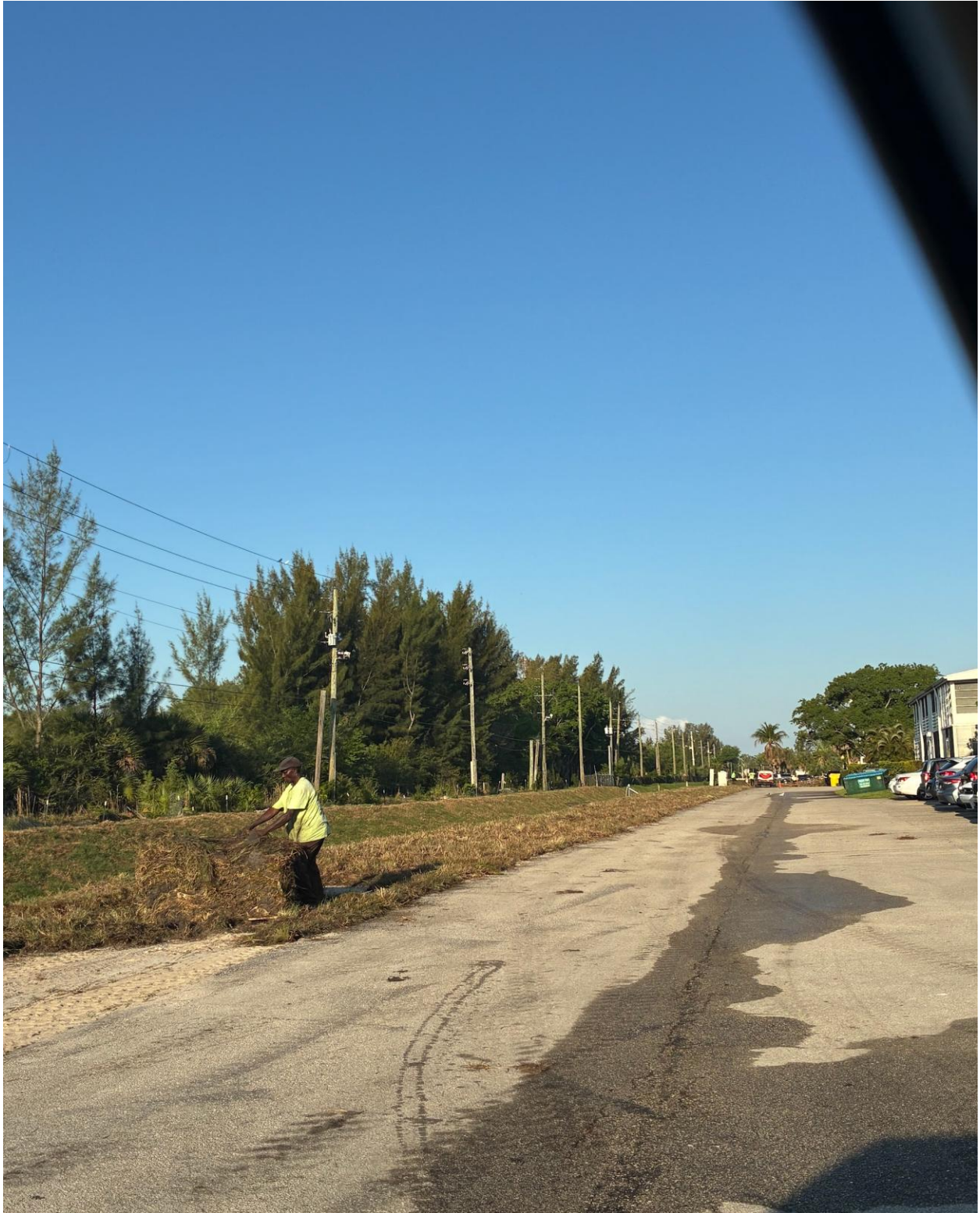
ANDOVER SECTION- SOD WAS INSTALLED ON 3/28.