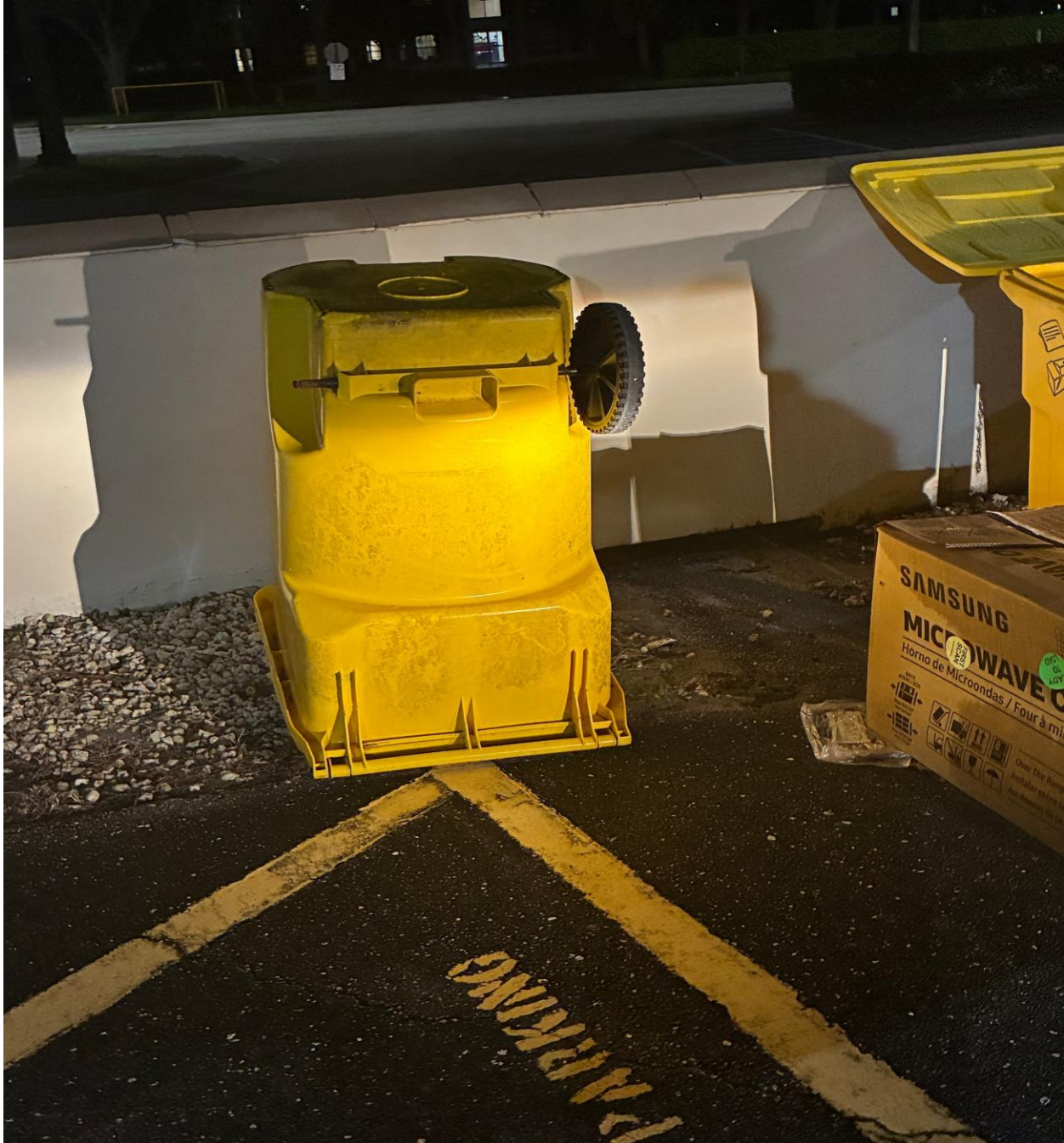
DOVER A- YELLOW TOTER WITH BUSTED WHEELS. CALLED IN BY A CV UNIT OWNER. A REQUEST FOR REPAIR WAS SENT TO WASTE PRO. PLEASE SEND BUSTED DUMPSTER REPORTS TO UCOGARBAGE@GMAIL.COM .