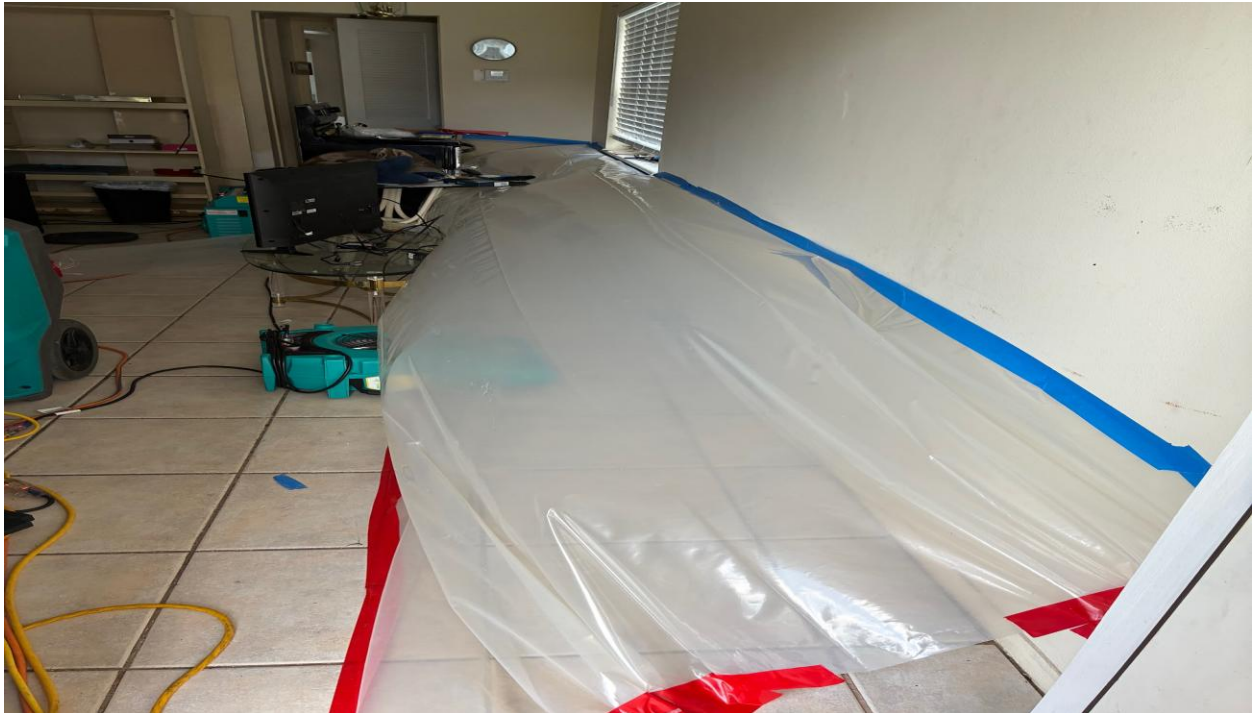
WALTHAM A- SERVICE MASTERS CONTINUES DRYING OUT WALLS AT THE DAMAGED UNITS.