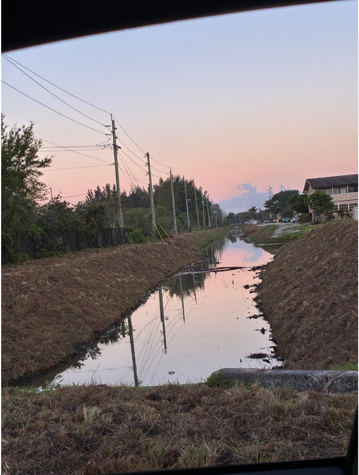
BEDFORD SECTION- SOD INSTALLATION COMPLETE.