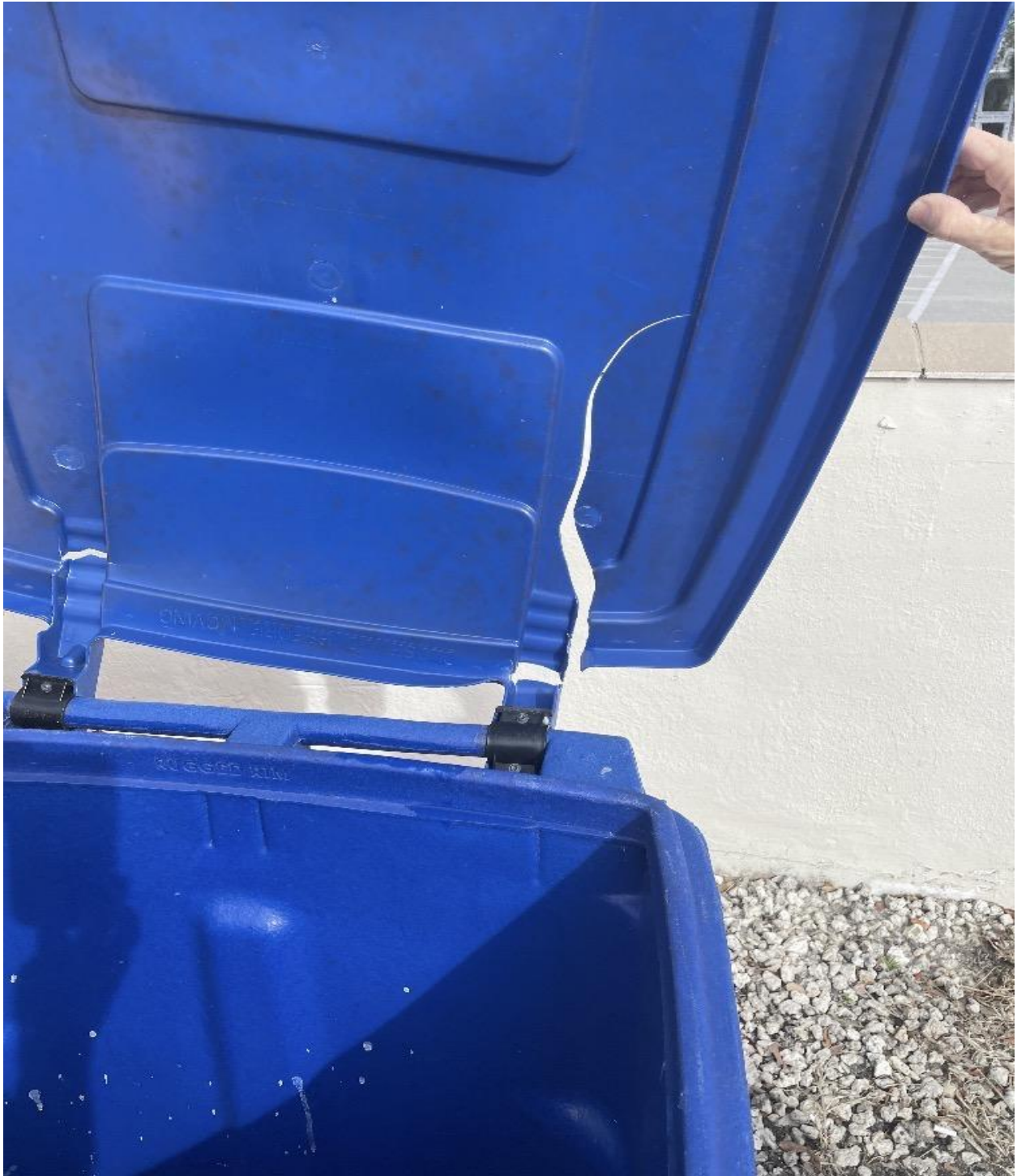
DOVER A- BLUE TOTER WITH CRACKED LID. CALLED IN BY A CV UNIT OWNER. A REQUEST FOR REPLACEMENT WAS SENT TO WASTE PRO.