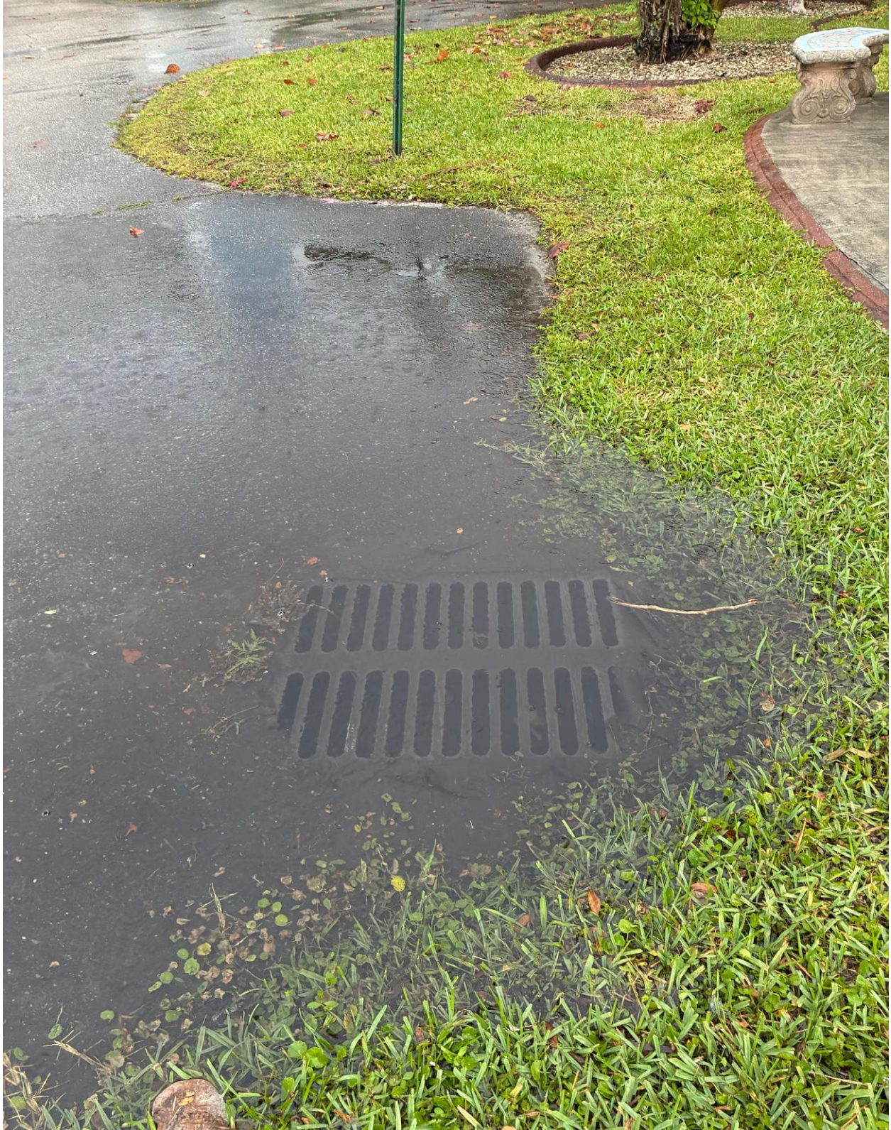
WELLINGTON M- THIS IS THE CAUSE OF THE WASHOUT, A STORM DRAIN CLOGGED WITH EXCAVATION DEBRIS.