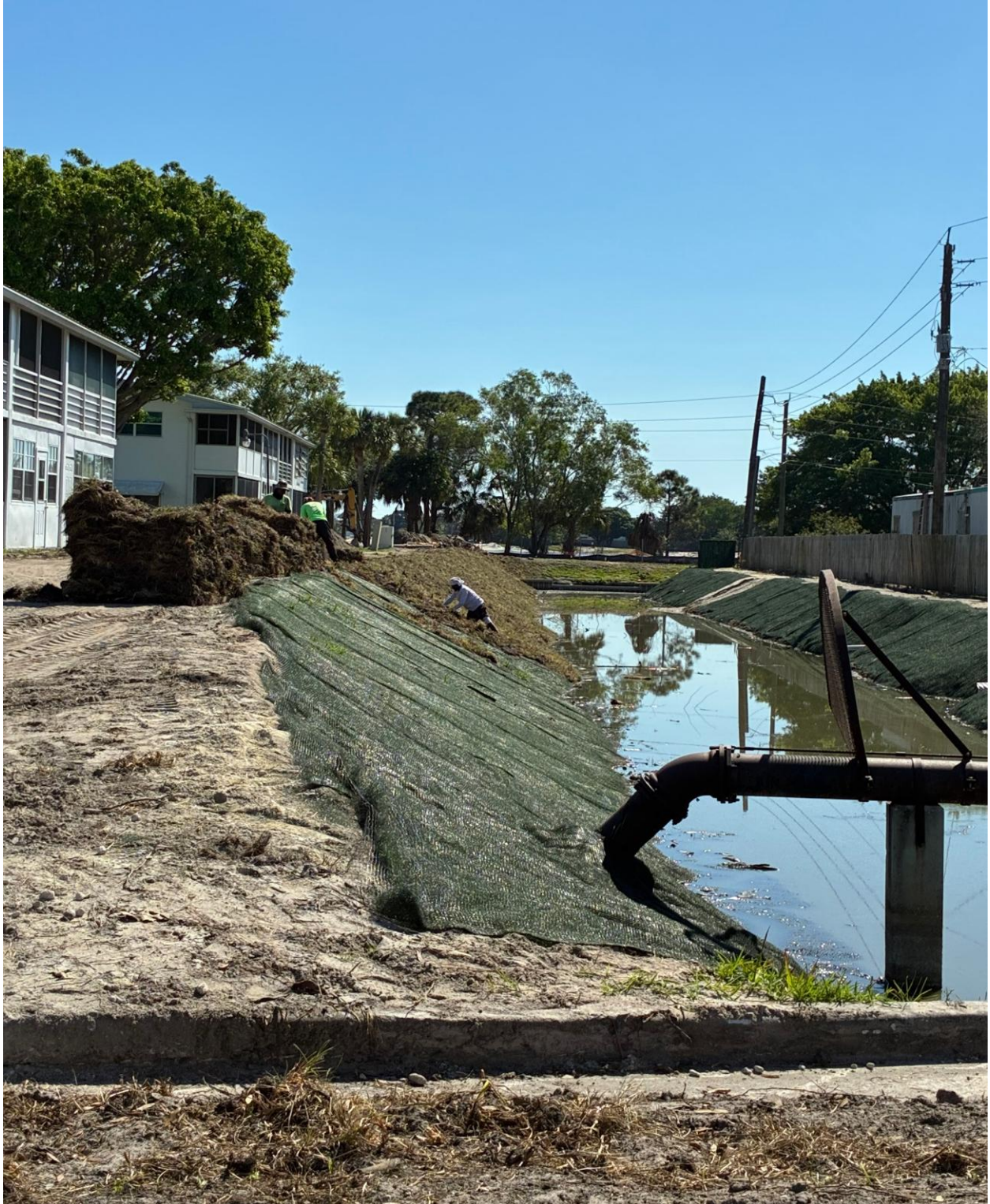
BEDFORD SECTION- SOD INSTALLATION STARTED LAST WEEK.