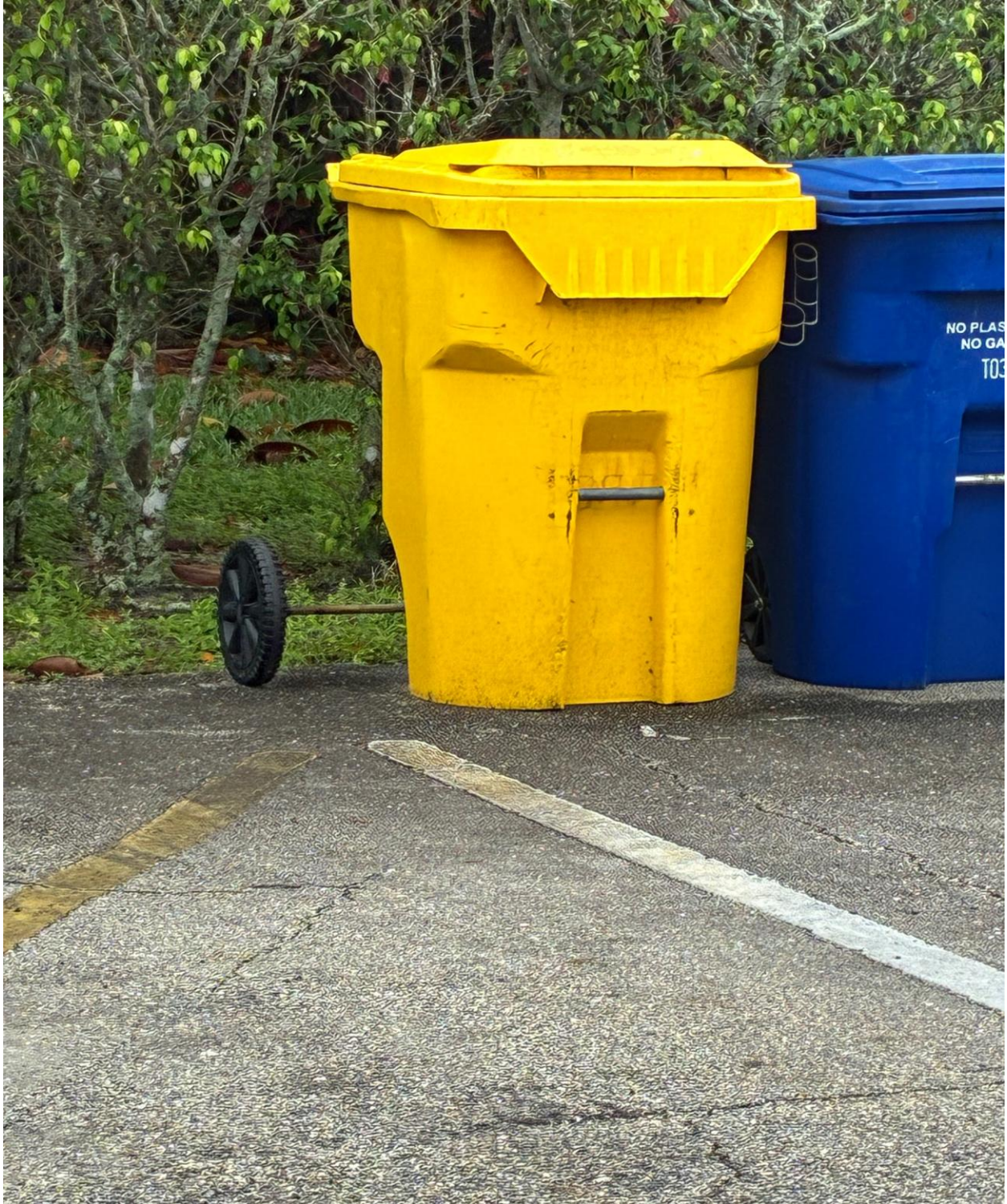
CAMBRIDGE B/C- YELLOW TOTER WITH BUSTED WHEEL. A REQUEST FOR REPLACEMENT WAS SENT TO WASTE PRO.