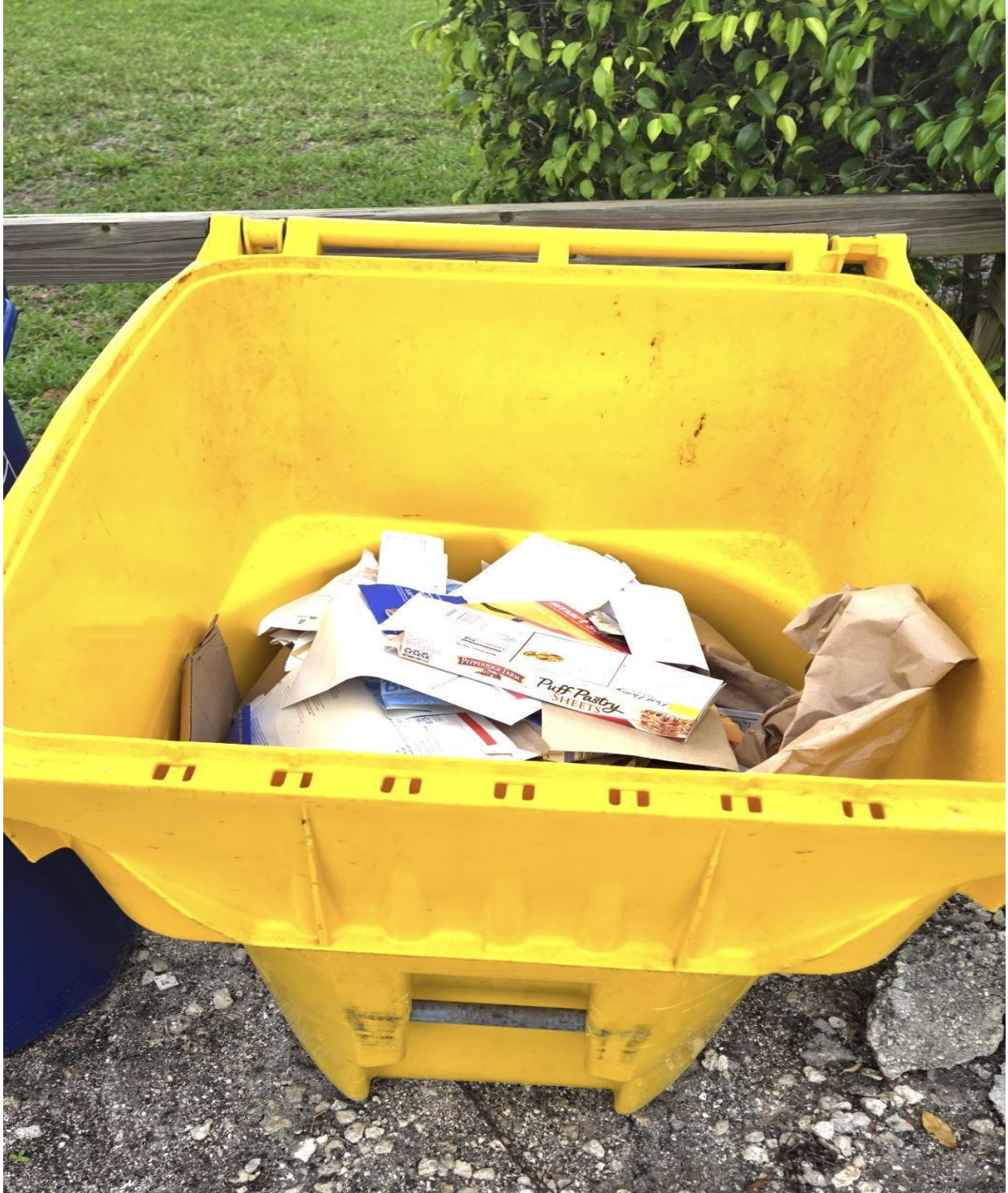
SOMERSET K- YELLOW TOTER WITH MISSING LID. REPORTED IN BY A CV UNIT OWNER. A REQUEST FOR REPAIR WAS SENT TO WASTE PRO.