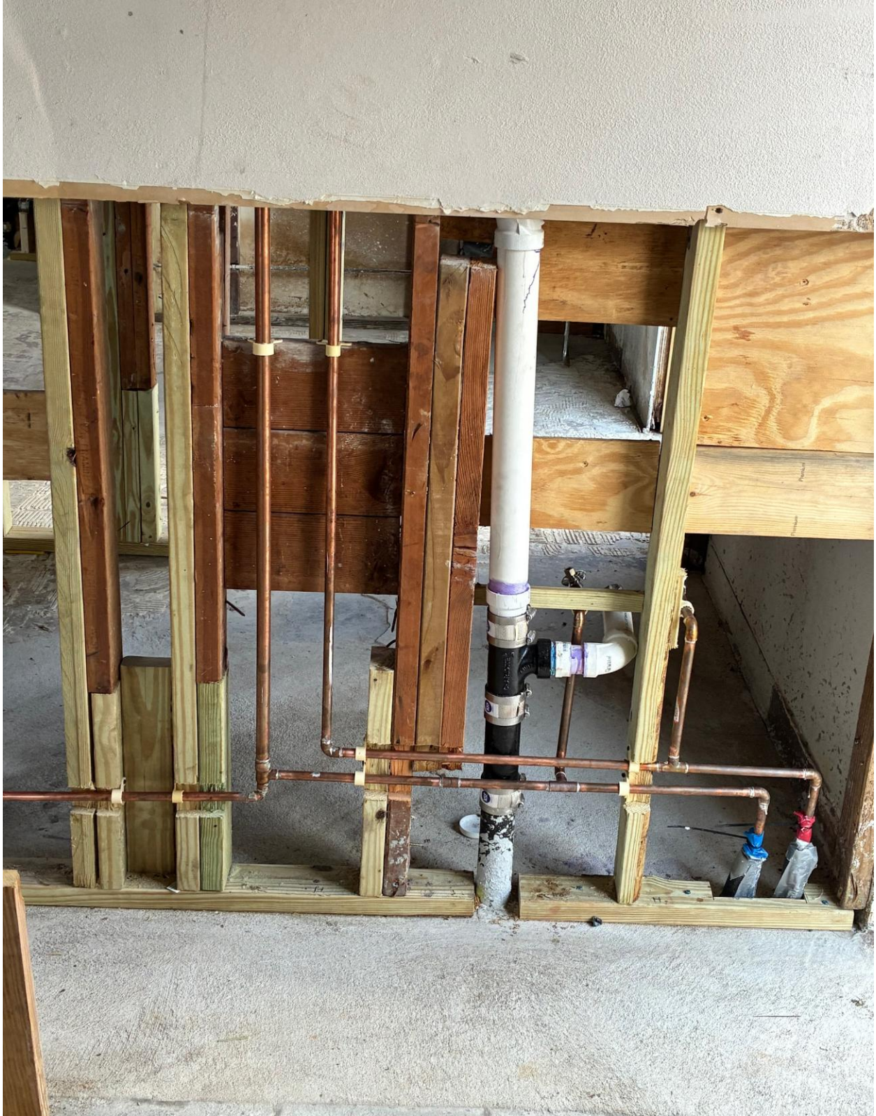
PLYMOUTH LAUNDRY- PLUMBING ROUGH-INS FOR THE NEW ADA COMPLIANT REST ROOM ARE COMPLETE.