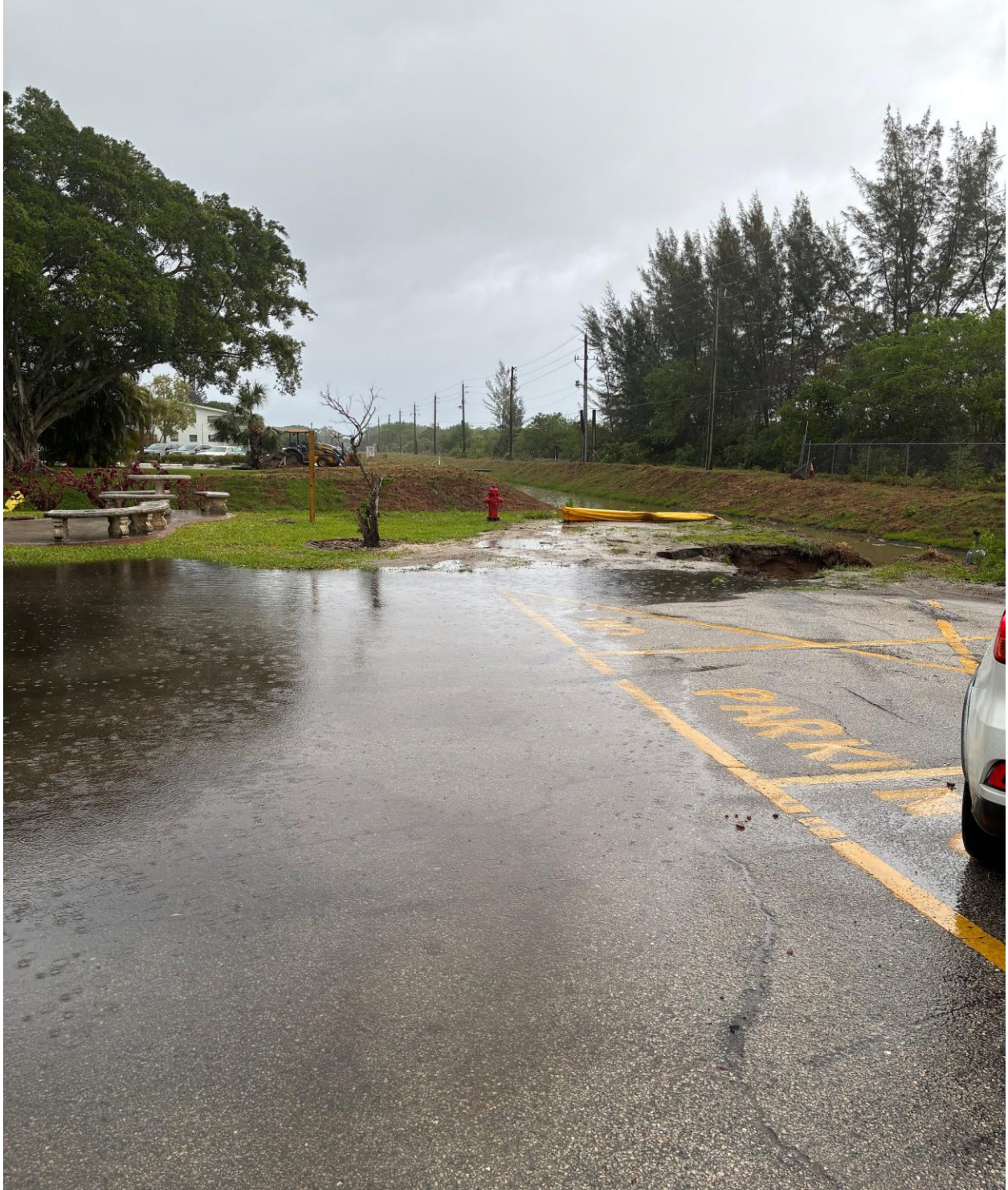
WELLINGTON M- DURING THE OVERNIGHT RAIN STORM, THE CLOGGED CATCH BASIN OVERFLOWED, WATER STACKED UP IN THE PARKING LOT UNTIL IT SPILLED OVER INTO THE CANAL, CAUSING THE WASHOUT.