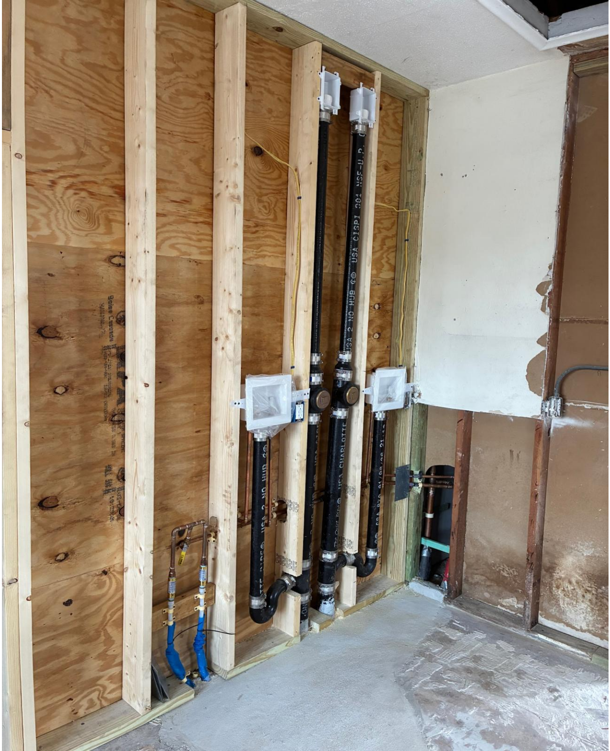
PLYMOUTH LAUNDRY- PLUMBING ROUGH-INS FOR OUR NEW HIGH CAPACITY WASHER AND DRYER ARE COMPLETE.