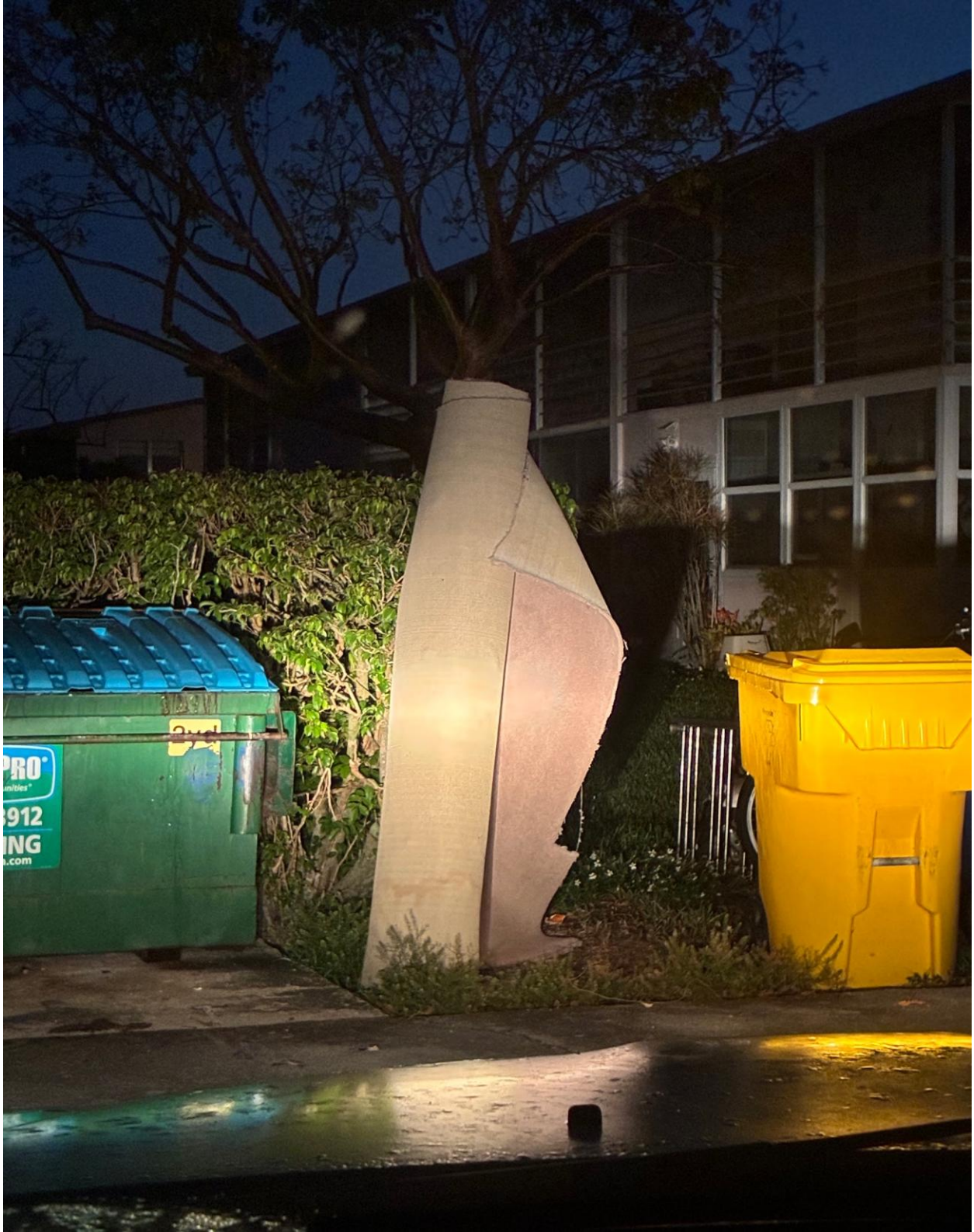
CANTERBURY E/B- LARGE PIECES OF CARPET MUST BE CUT TO FOUR FOOT SQUARES, ROLLED AND TIED.