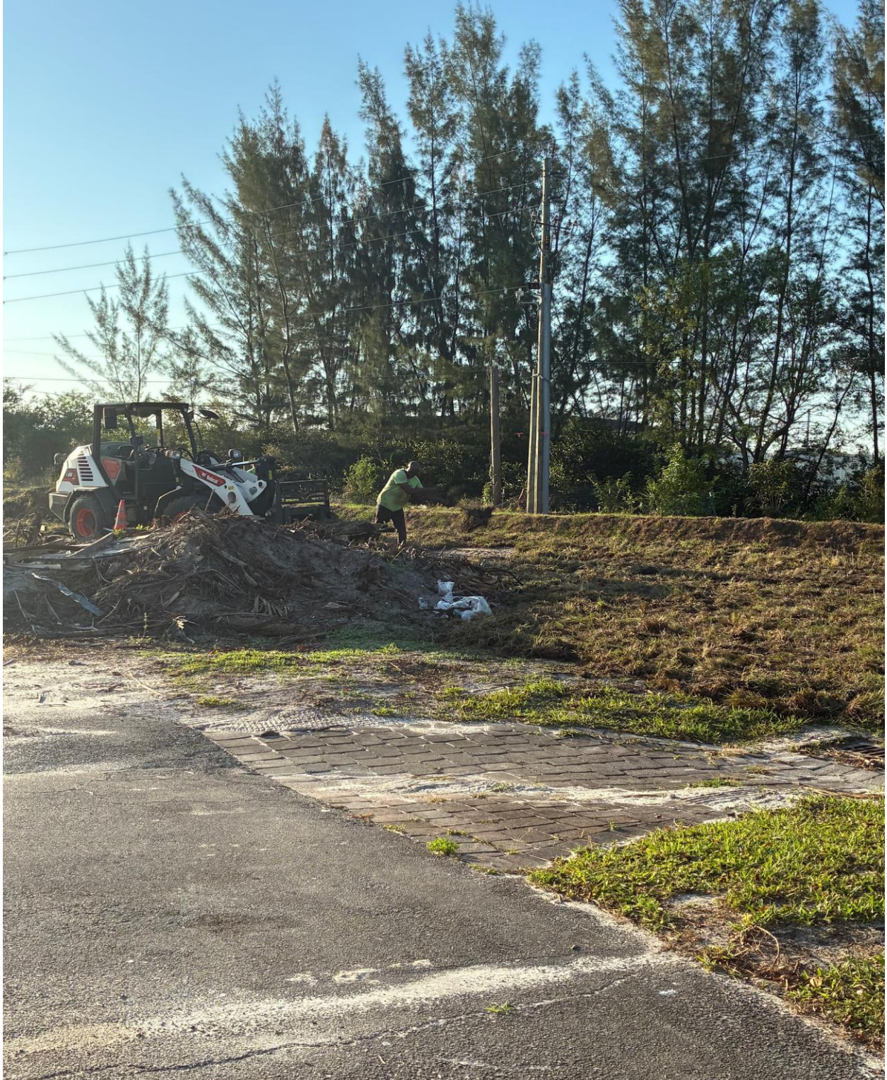
WELLINGTON E- SOD WAS INSTALLED ON 3/28. THE DEBRIS PILE STILL NEEDS TO BE REMOVED.