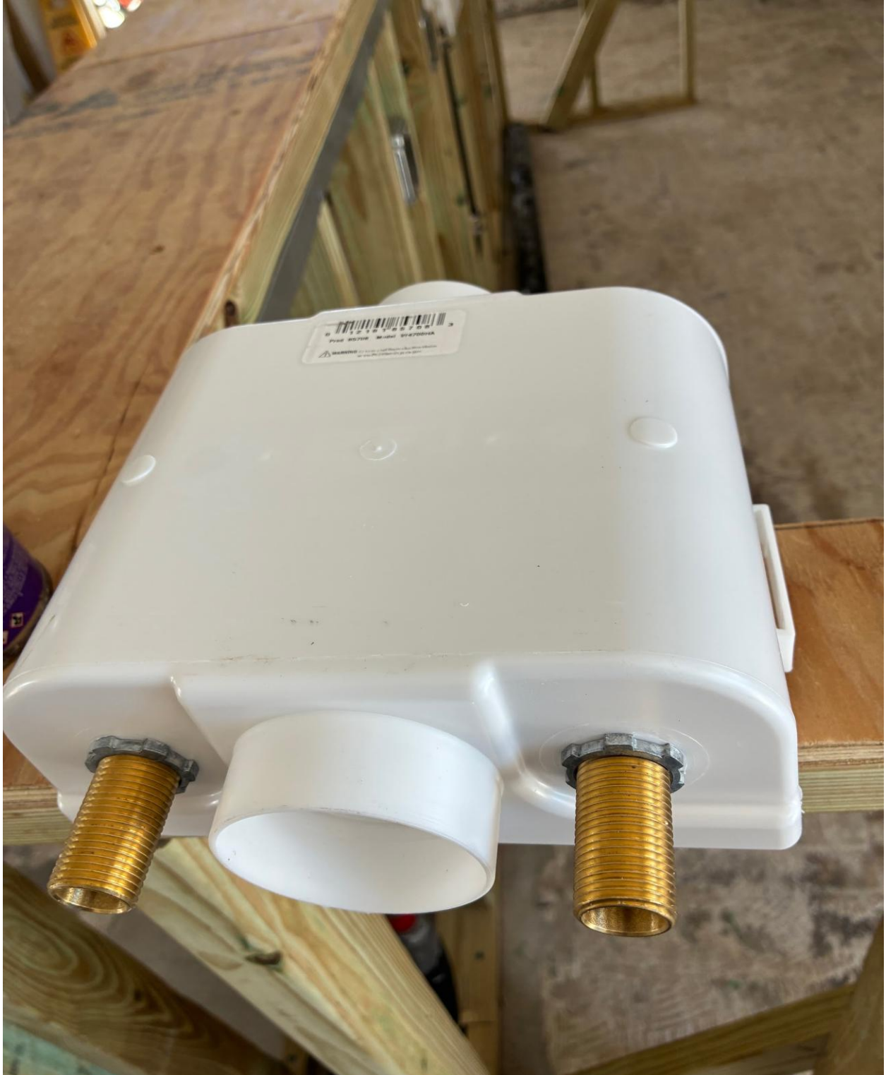
PLYMOUTH LAUNDRY- NOW WE WILL BE ABLE TO WASH OUR HANDS WITH HOT WATER WHEN WE USE THE PLYMOUTH LAUNDRY REST ROOM.