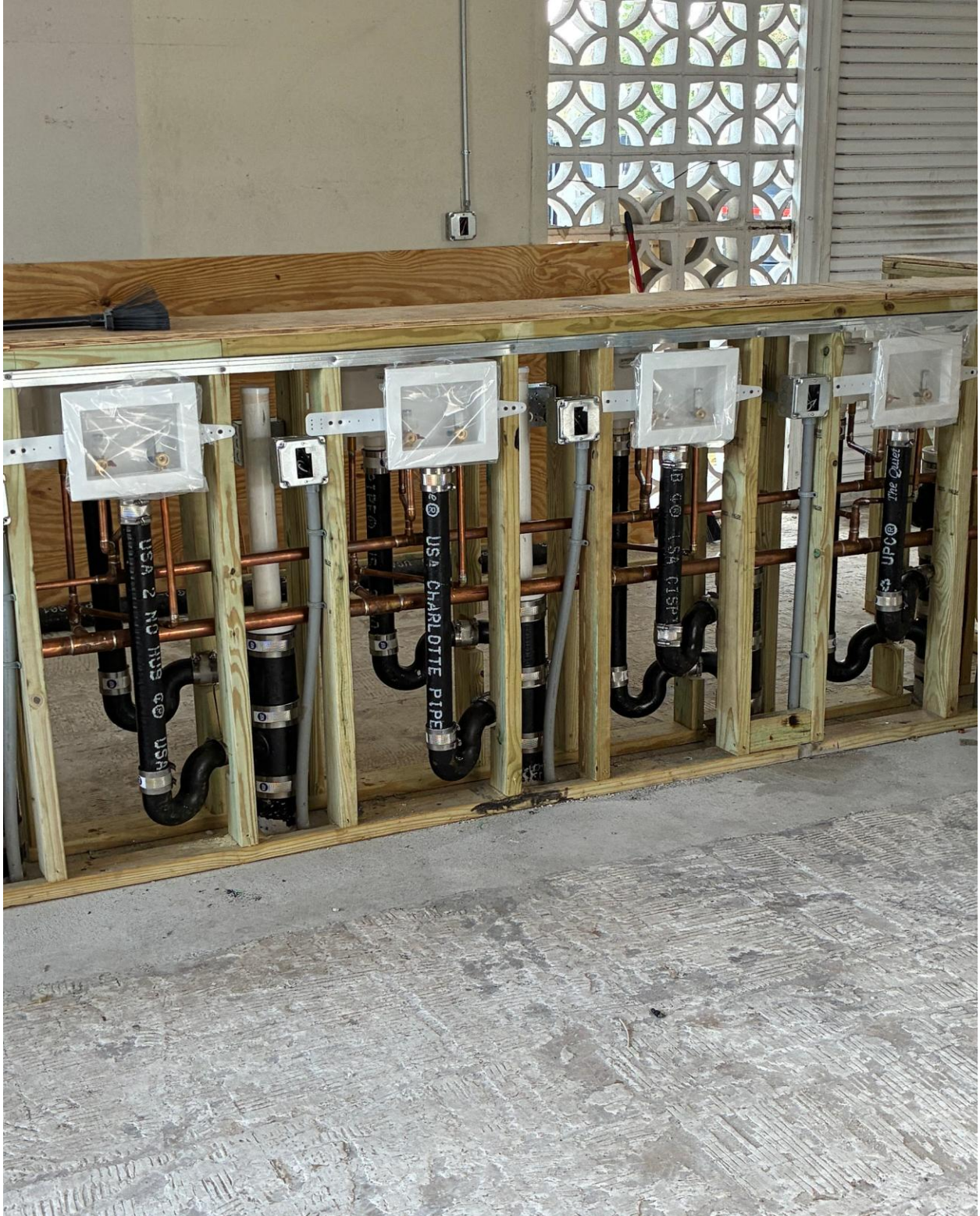
PLYMOUTH LAUNDRY- PLUMBING ROUGH-INS FOR THE REGULAR WASHERS ARE COMPLETE.