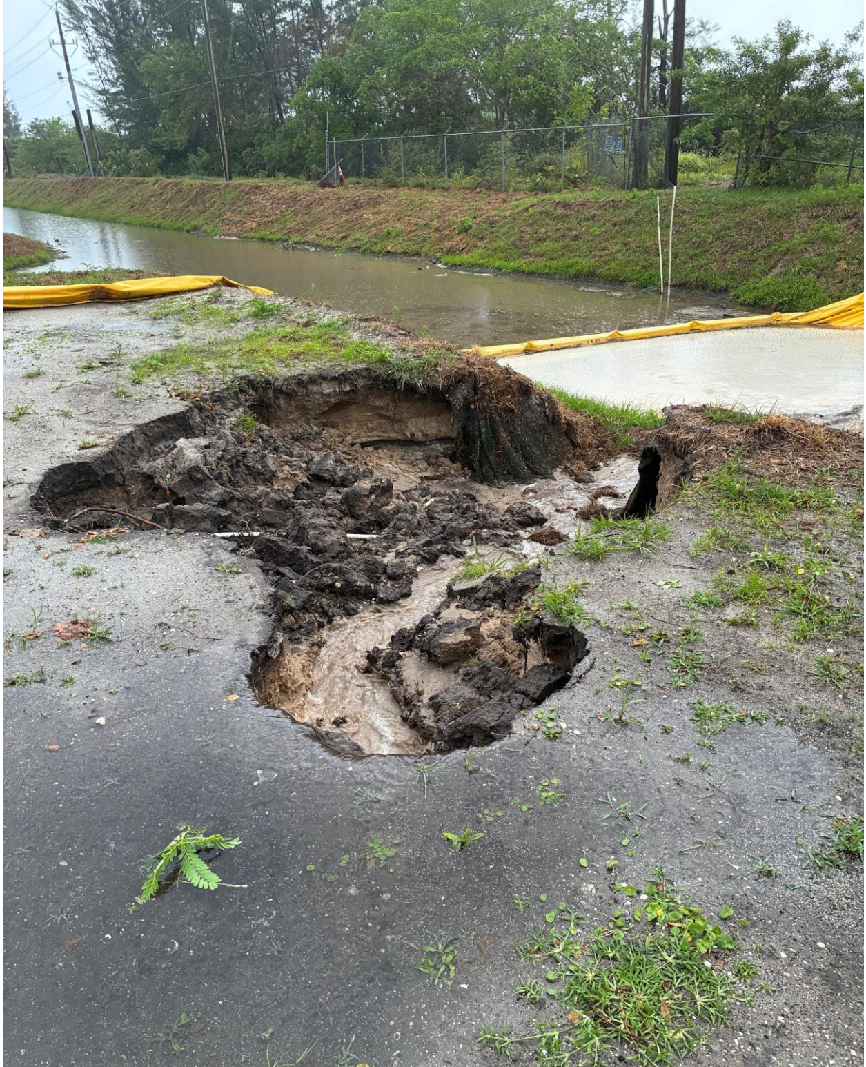
WELLINGTON M- A SECTION OF CANAL BANK WASHED OUT. DISCOVERED ON 3/29.