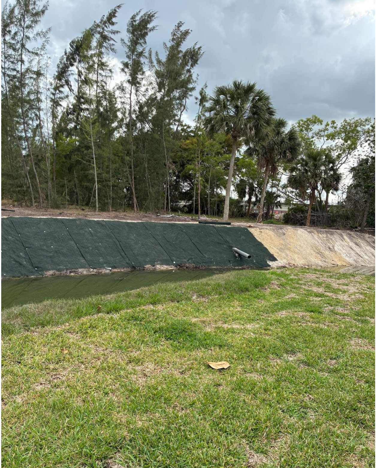
SOUTH CANAL- SHENANDOAH CONSTRUCTION IS WORKING ON THIS SECTION NEAR WINDSOR A.