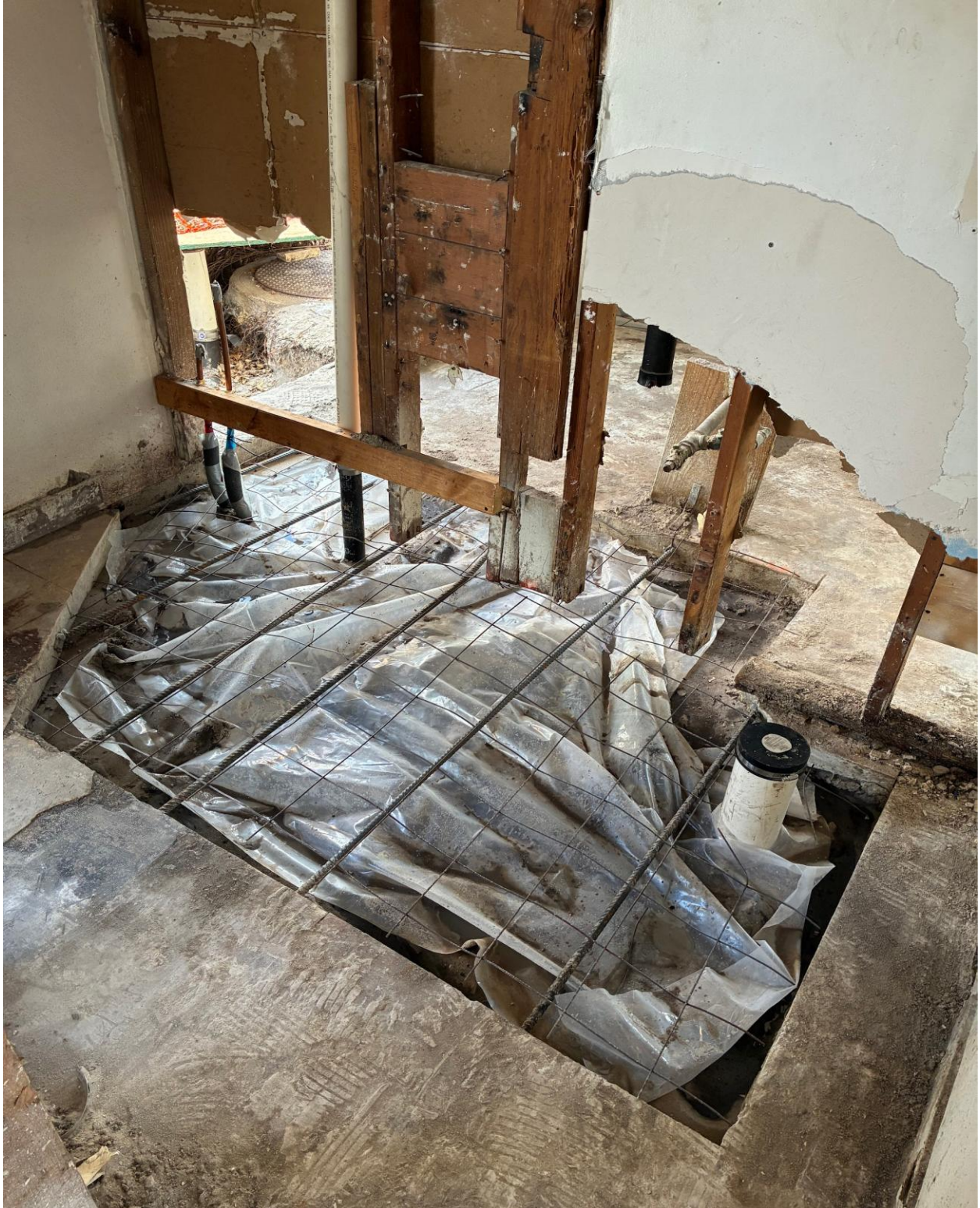
PLYMOUTH LAUNDRY- NEW ADA COMPLIANT REST ROOM, READY FOR CONCRETE. ALL OF THAT ROTTEN FRAMING WILL BE REPLACED WITH METAL MATERIAL.