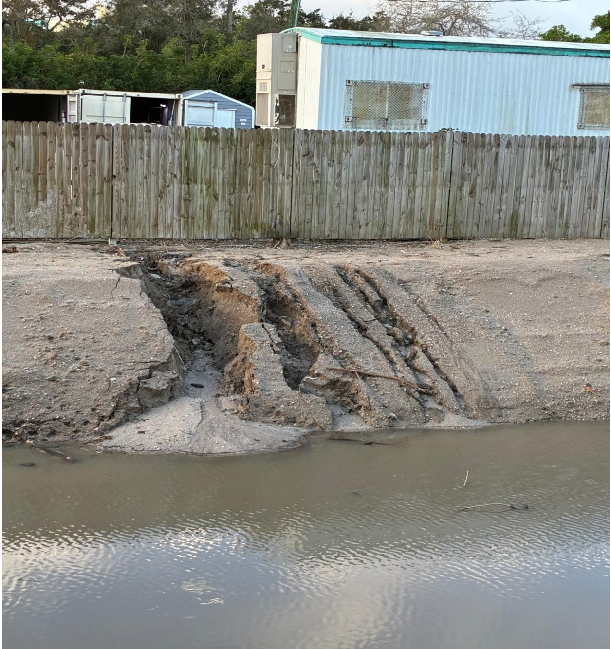
SOUTH CANAL- THIS IS THE SPOT WHERE A NEW STORM WATER CATCH BASIN AND DRAIN PIPE WILL BE INSTALLED BY SHENANDOAH CONSTRUCTION.