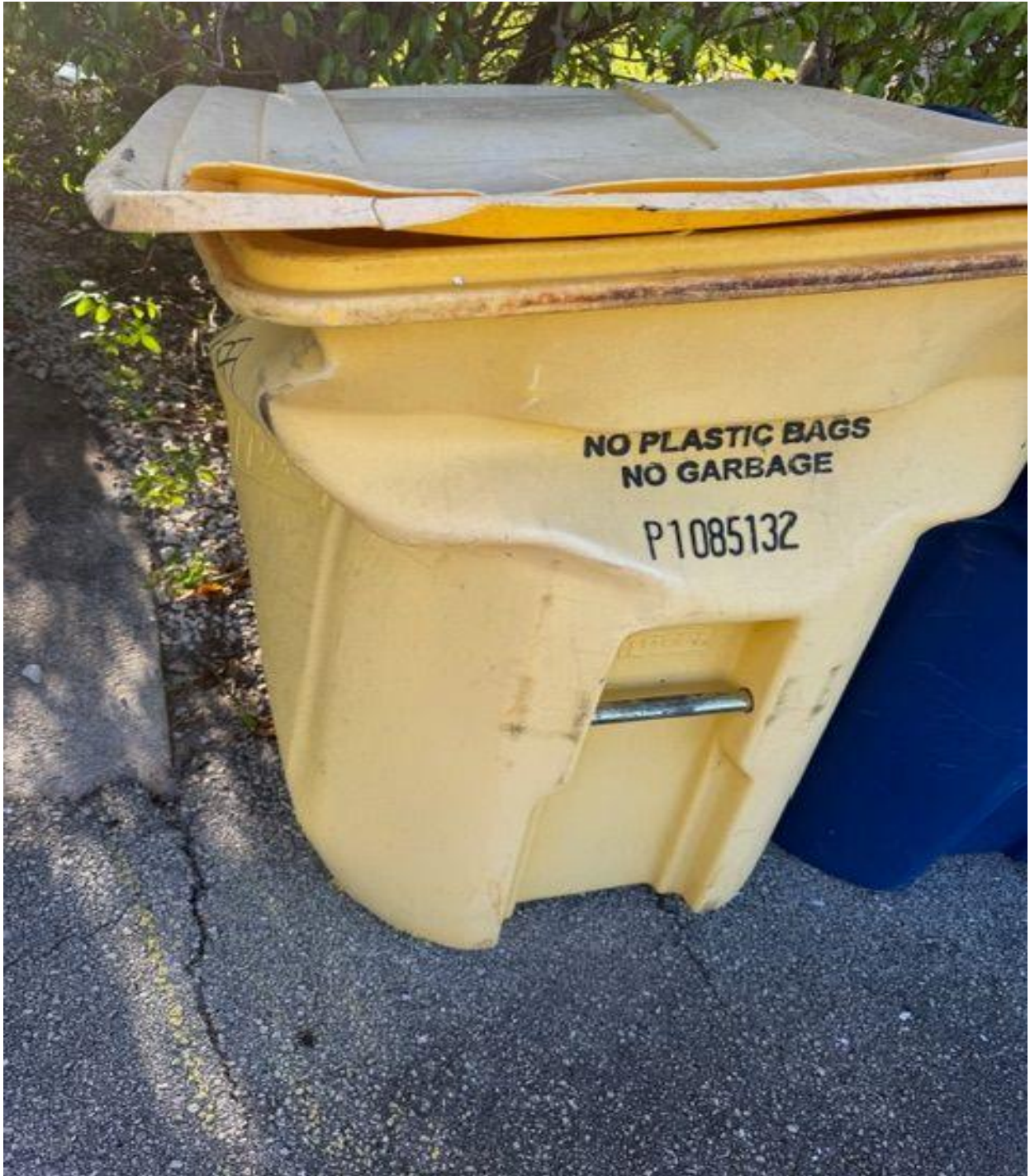
BEDFORD D/F- CRUSHED YELLOW TOTER. REPORTED IN BY A CV UNIT OWNER. A REQUEST FOR REPLACEMENT WAS SENT TO WASTE PRO.