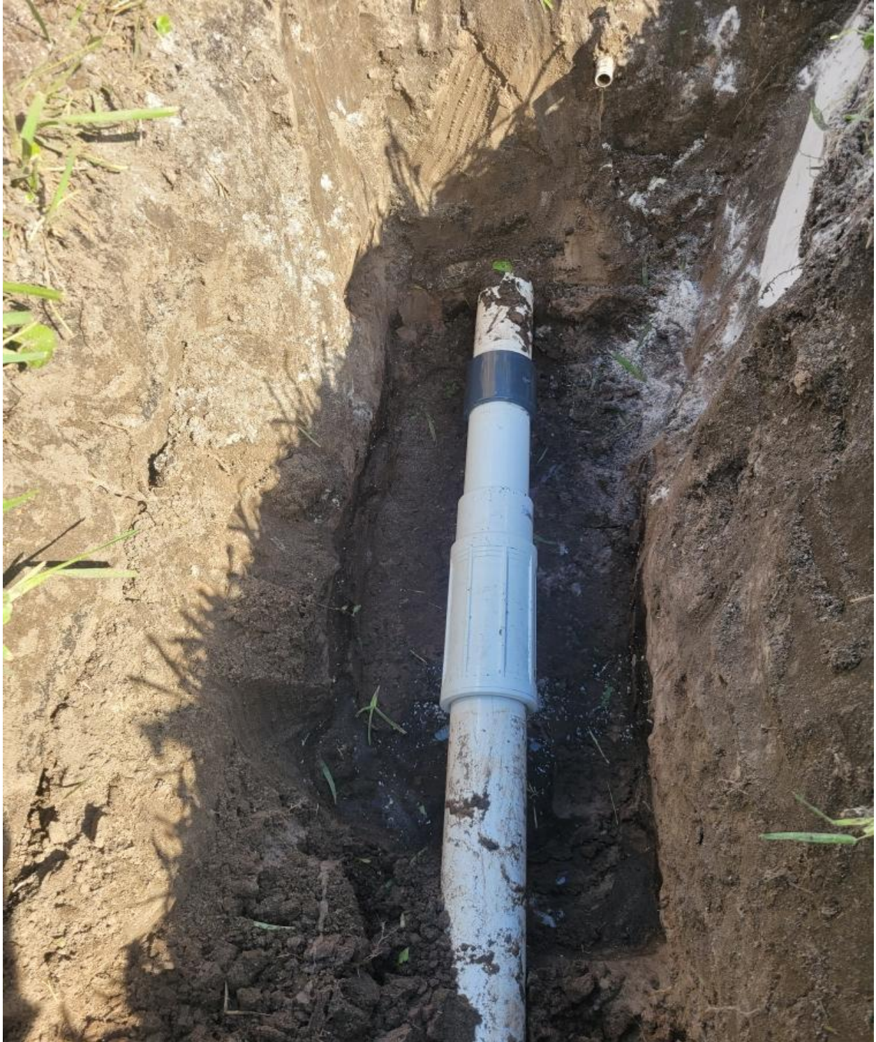
SHEFFIELD O- FOUR INCH IRRIGATION LINE REPAIRED BY SEACREST SERVICES ON 3/11.