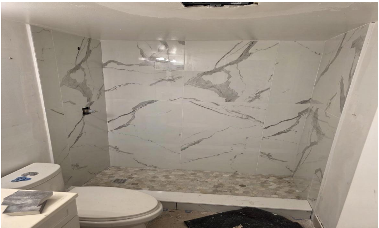
CAMDEN F- UNPERMITTED CONSTRUCTION WORK AT 123 CAMDEN F. REPORTED TO PZB CODE COMPLIANCE, #C-2026-03130021.