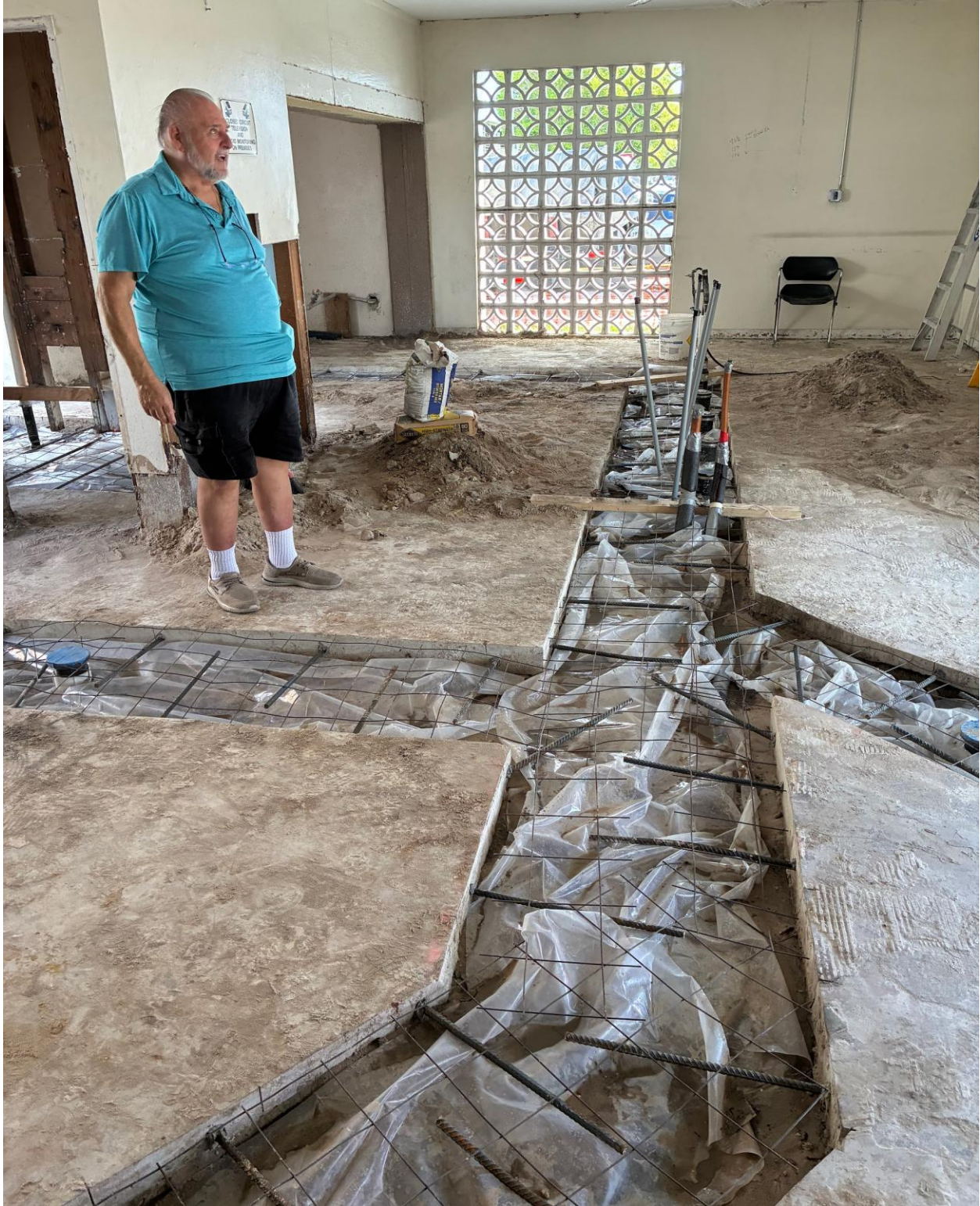
PLYMOUTH LAUNDRY- WASHER AND DRYER AREAS, READY FOR CONCRETE.