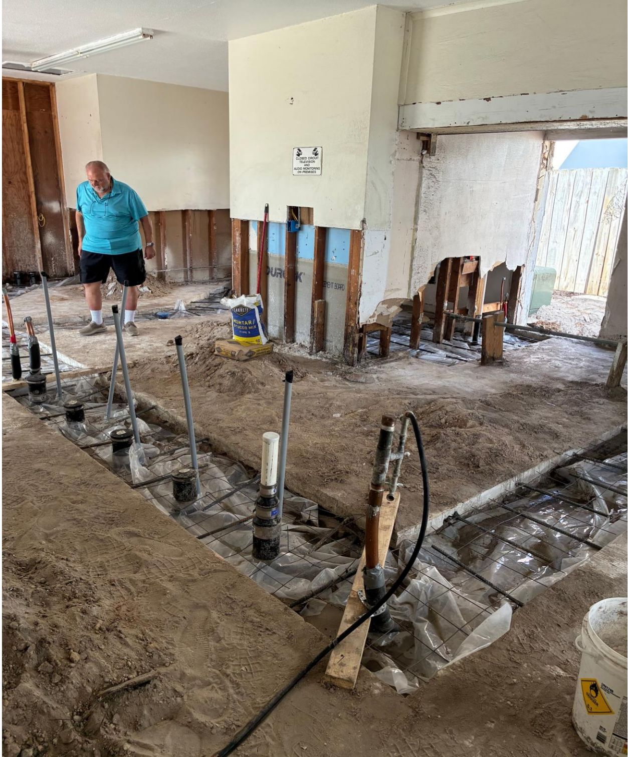
PLYMOUTH LAUNDRY- WASHER AND DRYER AREAS, READY FOR CONCRETE.