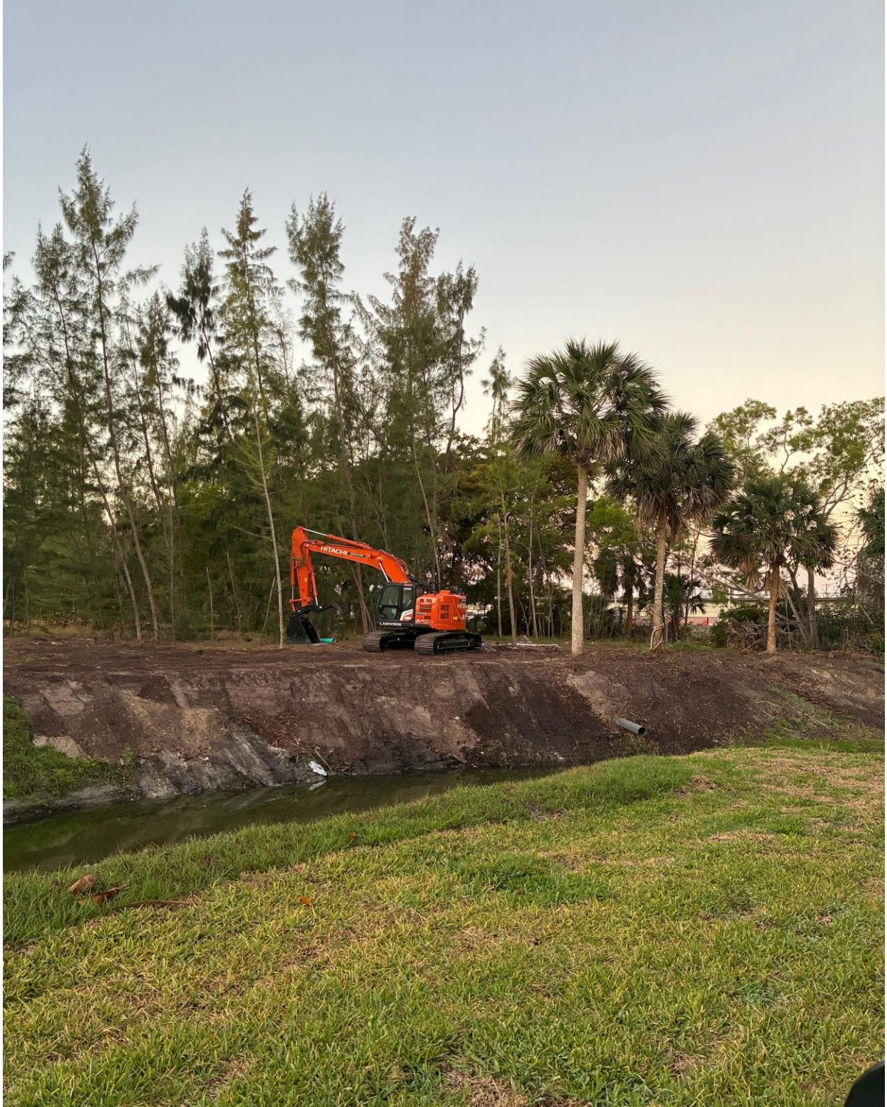
SOUTH CANAL- SHENANDOAH CONSTRUCTION IS WORKING ON THIS SECTION NEAR WINDSOR A.