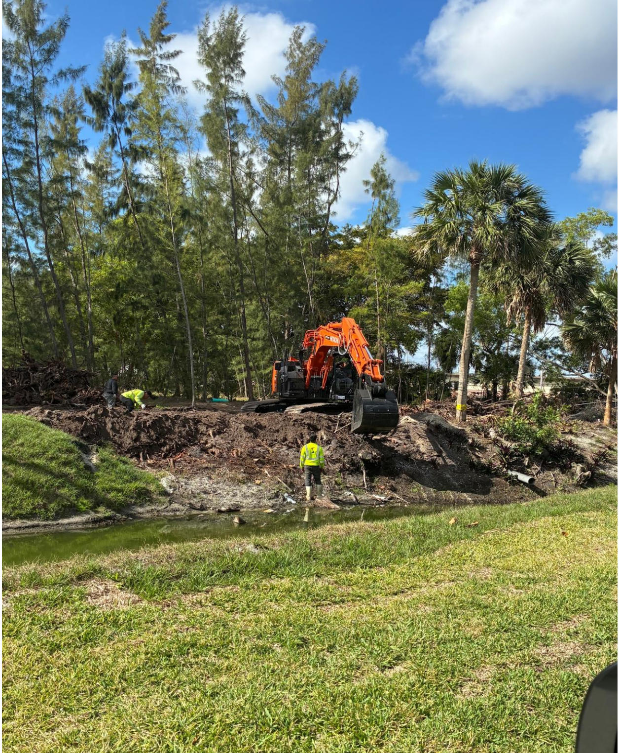
SOUTH CANAL- SHENANDOAH CONSTRUCTION IS WORKING ON THIS SECTION NEAR WINDSOR A.