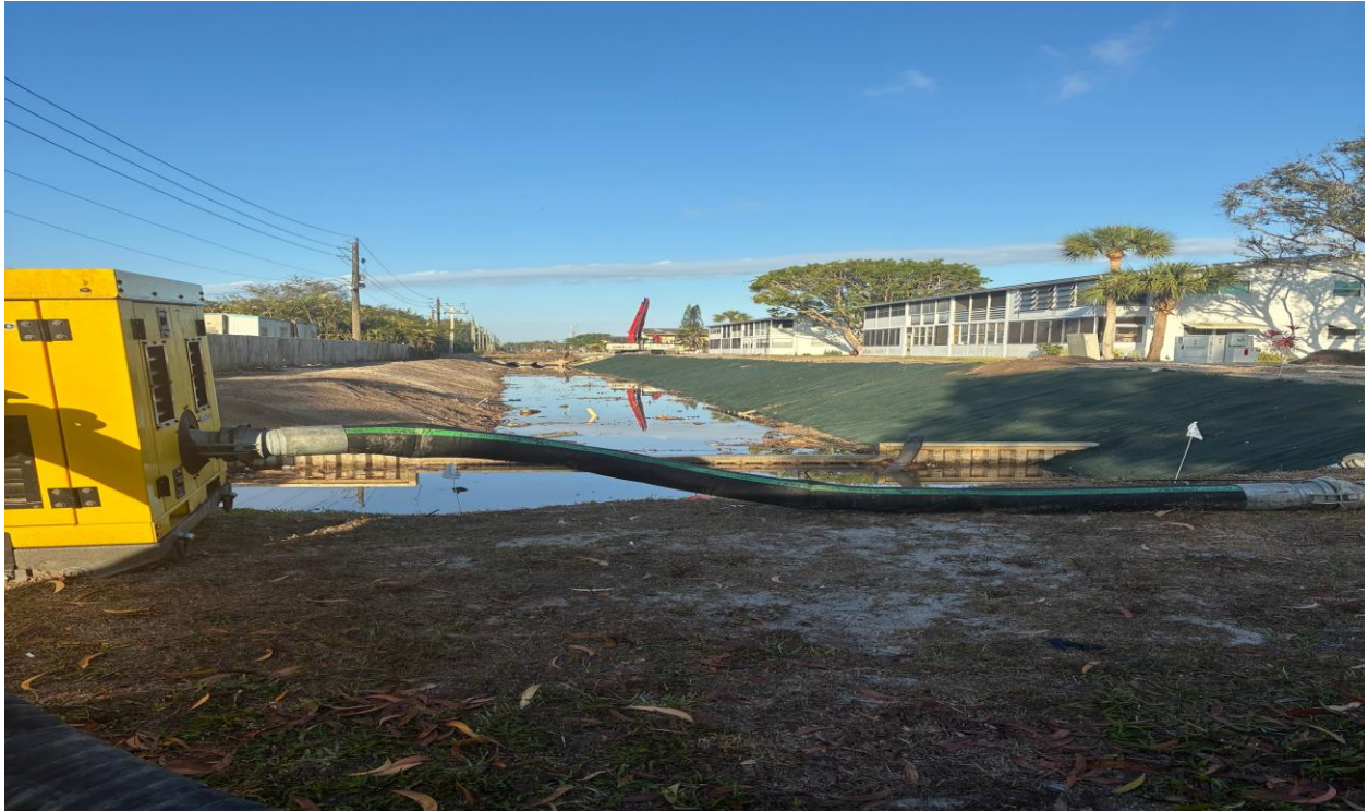
NORTH CANAL- RE-GRADING WORK AT THE EASTERNMOST SECTION OF THIS CANAL CONTINUES.