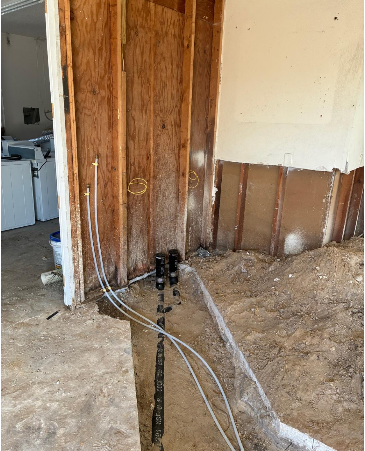
PLYMOUTH LAUNDRY- THESE ARE HOOKUPS FOR THE NEW HIGH CAPACITY WASHER.