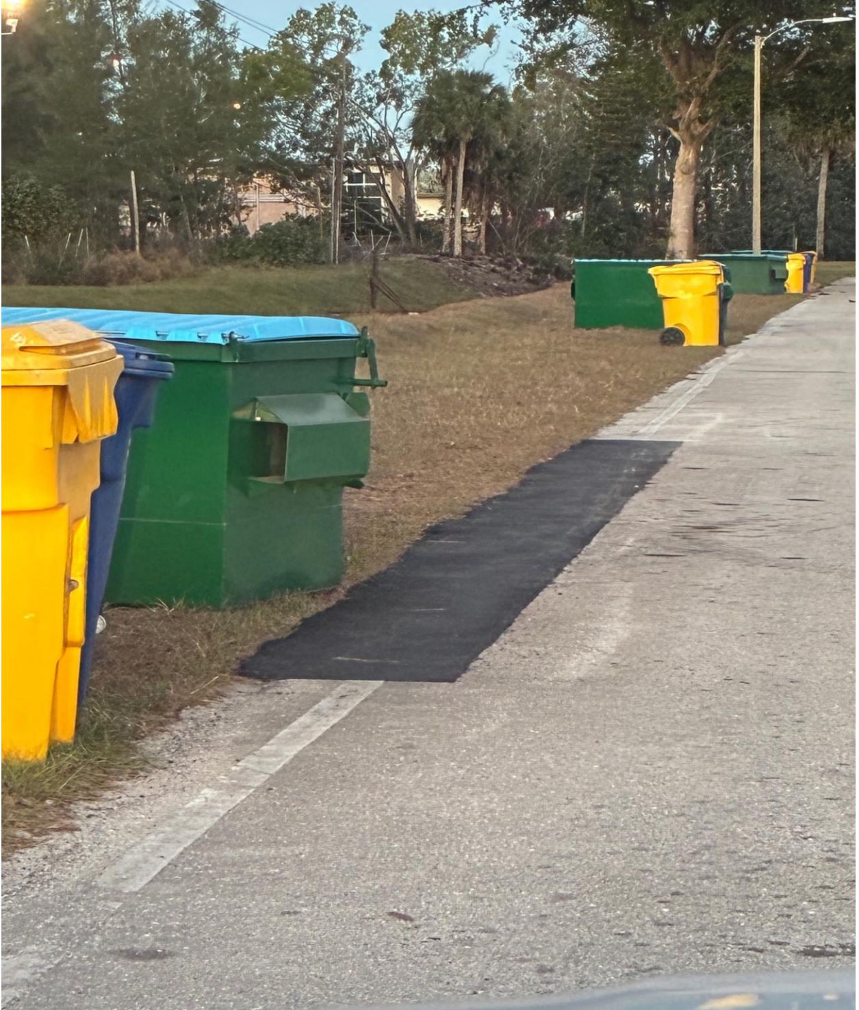
WINDSOR SECTION- PAVING REPAIR COMPLETE.