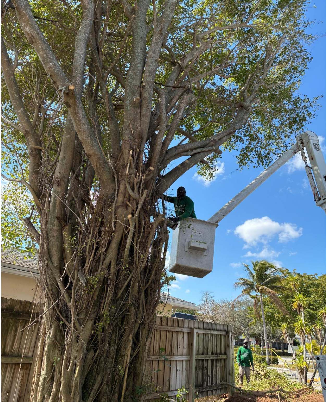
PLYMOUTH LAUNDRY- THIS OLD FIGUS TREE WAS CUT DOWN BY CURTIS LANDSCAPING ON 2/26.