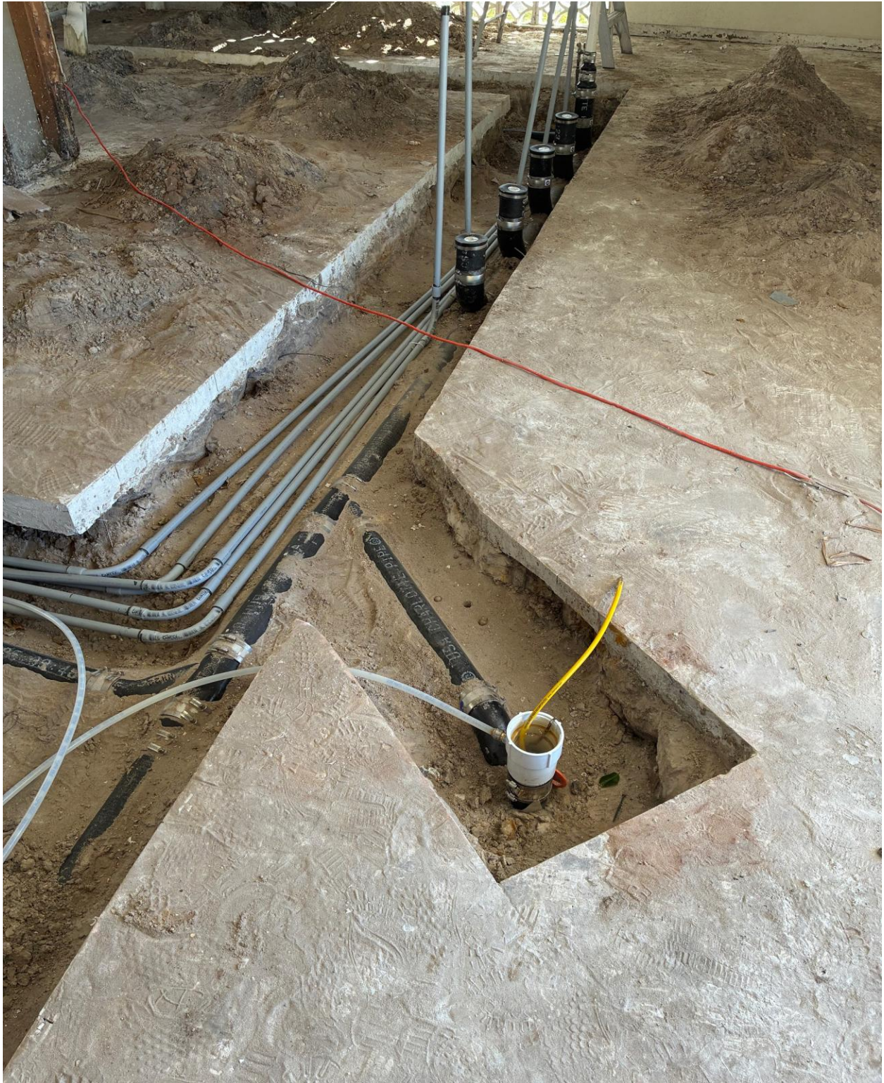
PLYMOUTH LAUNDRY- TWO FLOOR DRAINS WERE INSTALLED TO HANDLE WASHER OVERFLOWS. WITH THE NEW SEWER PIPES INSTALLED, THERE SHOULD BE FEWER OVERFLOWS.