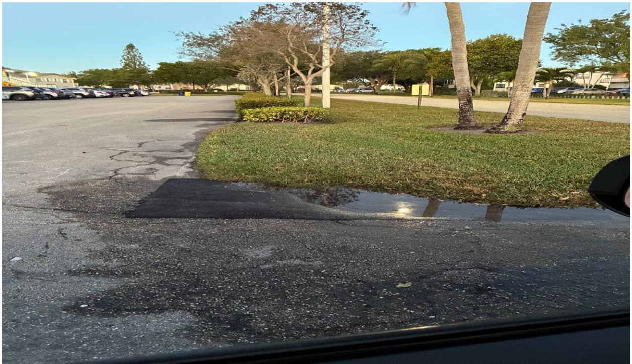
KENT, CANTERBURY SECTIONS- PAVING REPAIRS COMPLETE.