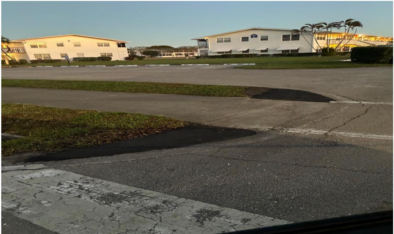
BERKSHIRE SECTION- PAVING REPAIRS COMPLETE.