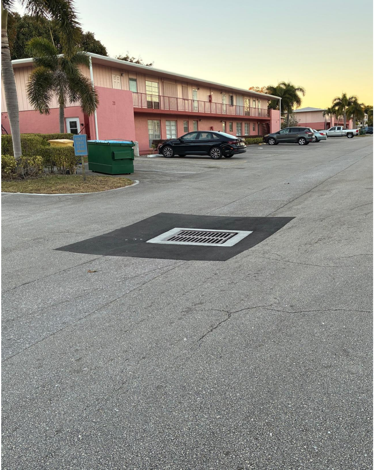
GOLFS EDGE/KINGSWOOD SECTION- REPAIR TO STORM DRAIN CATCH BASIN COMPLETE.