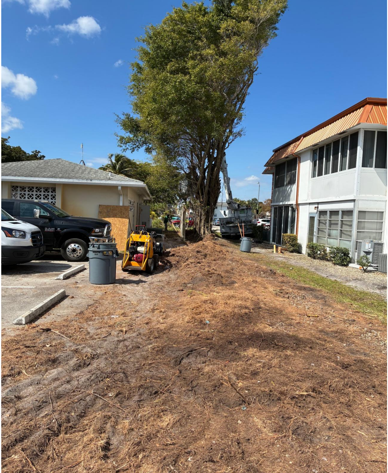
PLYMOUTH LAUNDRY- ARECA PALM AND STUMPS WERE REMOVED BY CURTIS LANDSCAPING.