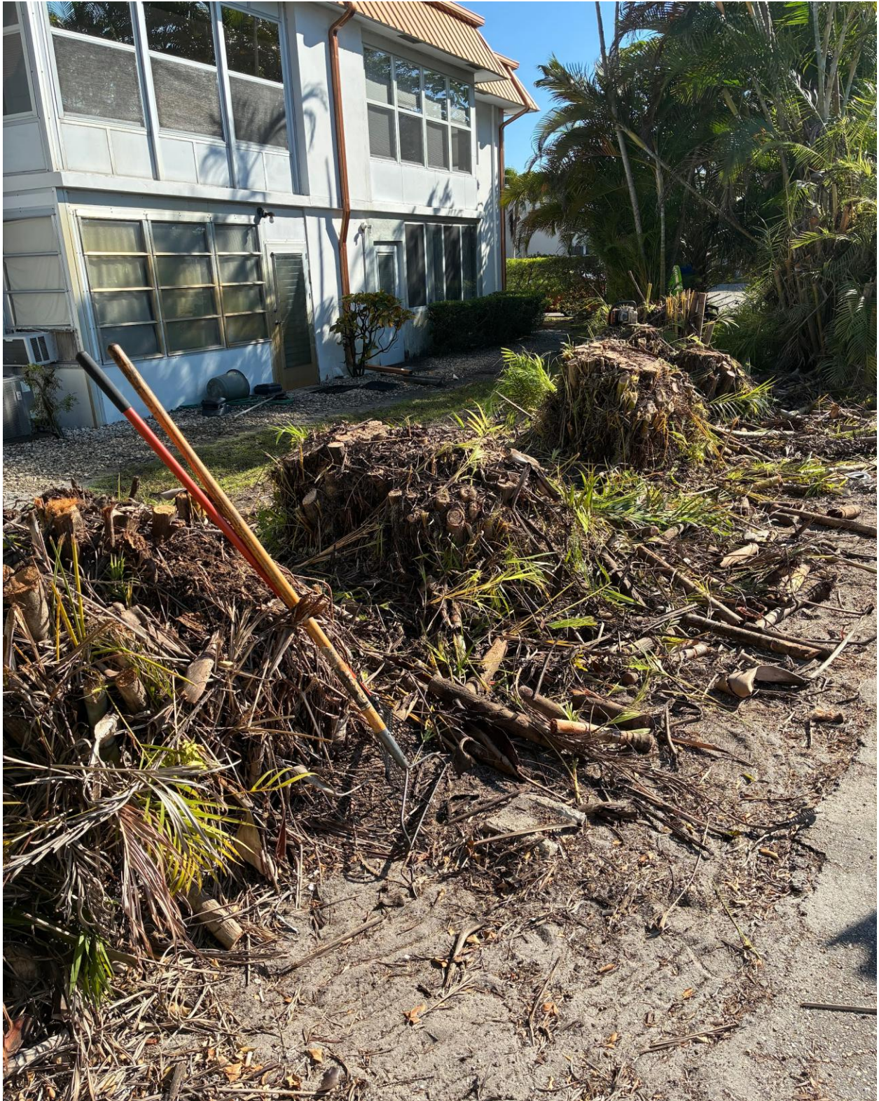
PLYMOUTH LAUNDRY- THE ARECA PALM STUMPS WERE ALSO REMOVED, TO KEEP THEM FROM GROWING BACK.