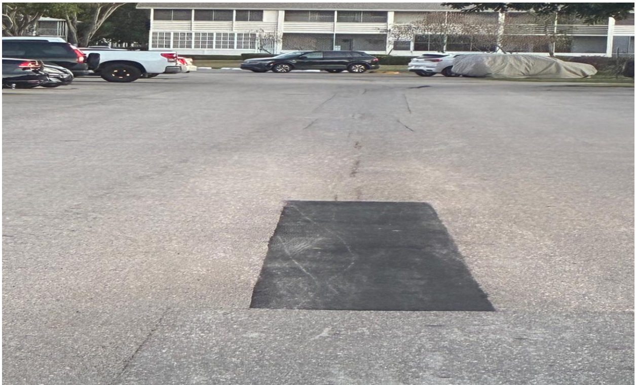
BEDFORD SECTION- PAVING REPAIRS COMPLETE.