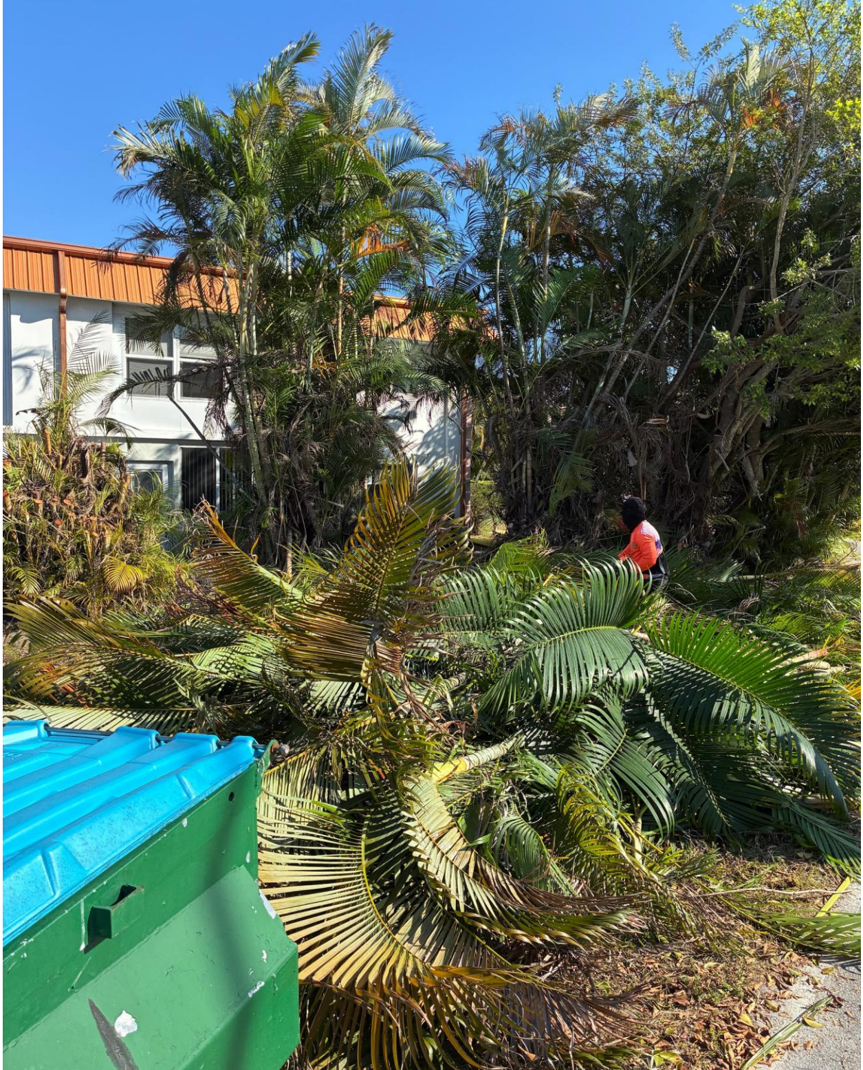
PLYMOUTH LAUNDRY- CURTIS LANDSCAPING REMOVED ARECA PALMS AT THE BACK OF THE LAUNDRY. THESE PALMS WERE SENDING ROOTS INTO THE LAUNDRY'S SEWER PIPES.