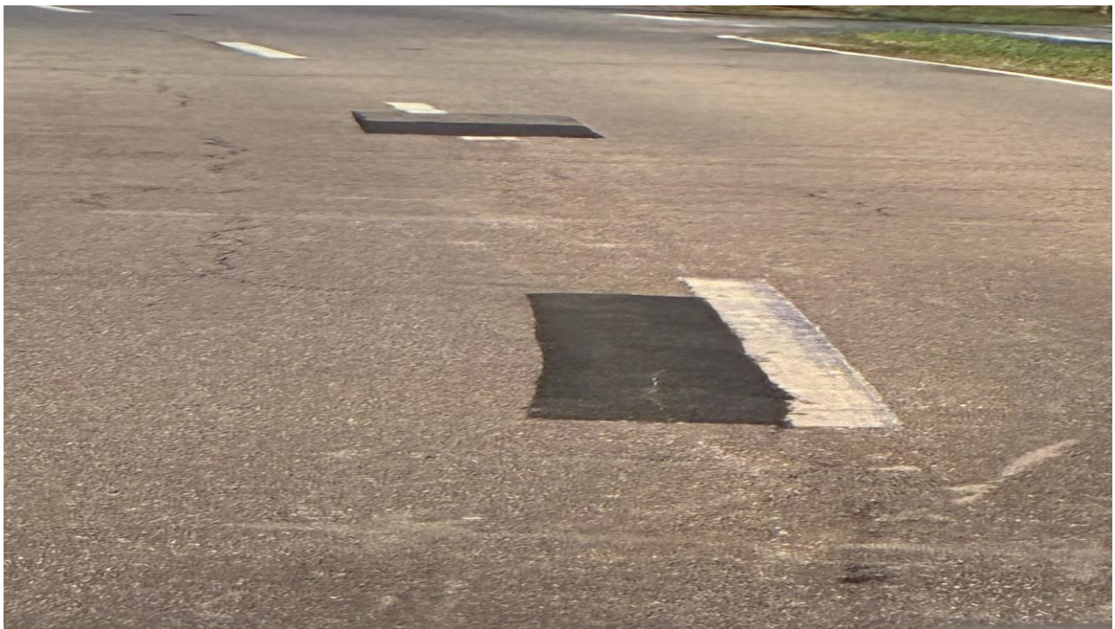
WEST DRIVE- PAVING REPAIRS COMPLETE.