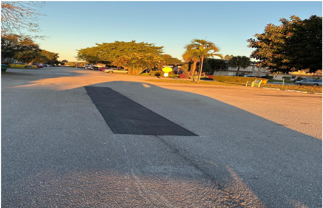
SALISBURY SECTION- PAVING REPAIRS COMPLETE.