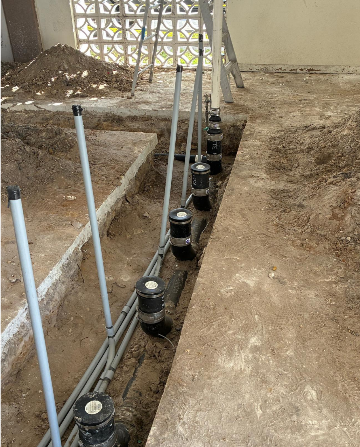
PLYMOUTH LAUNDRY- ELECTRICAL AND SEWER HOOKUPS FOR WASHERS ARE INSTALLED. WATER SUPPLY PIPES WILL BE INSTALLED NEXT.