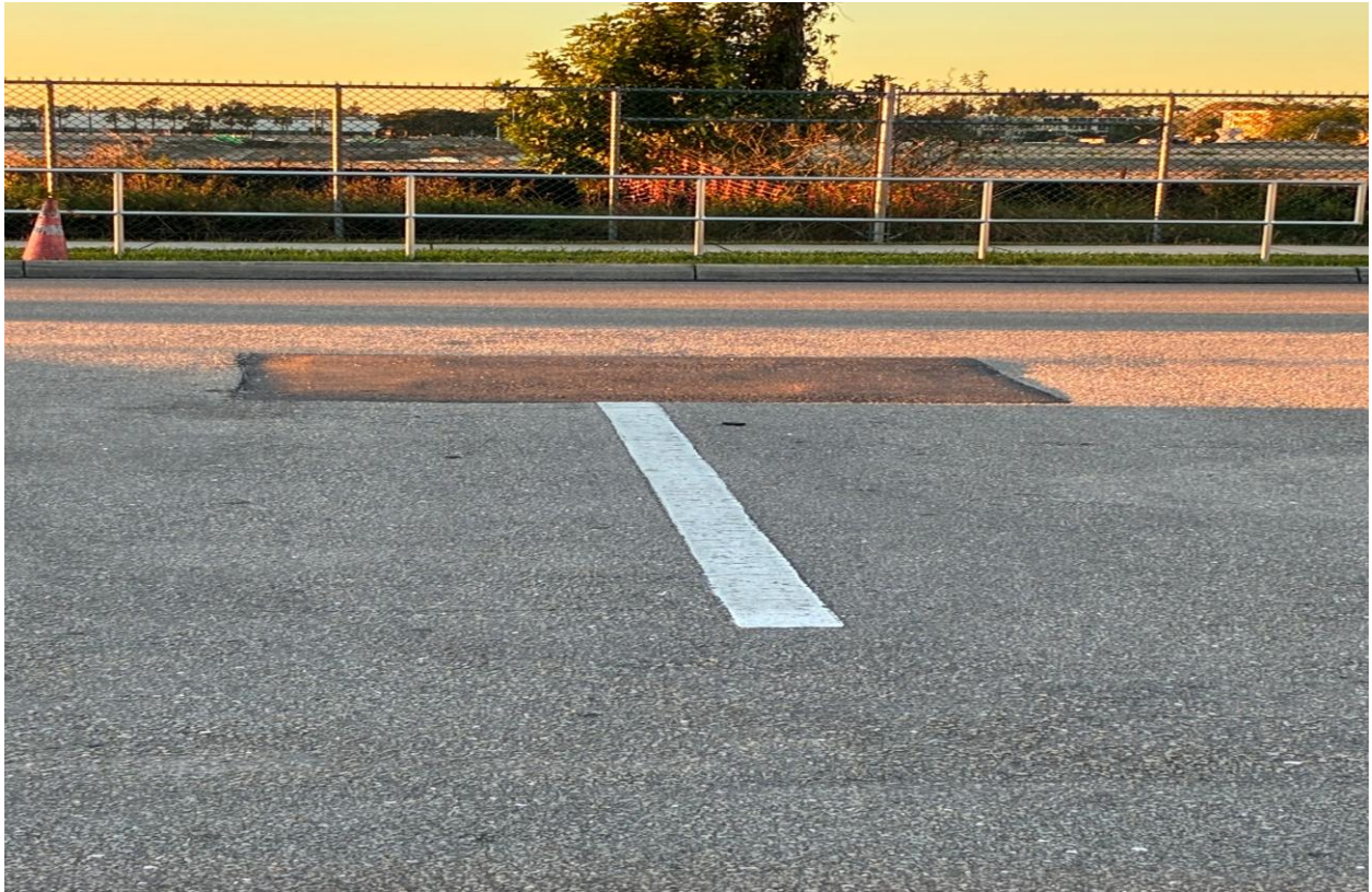
CENTURY BOULEVARD- PAVING REPAIRS COMPLETE.