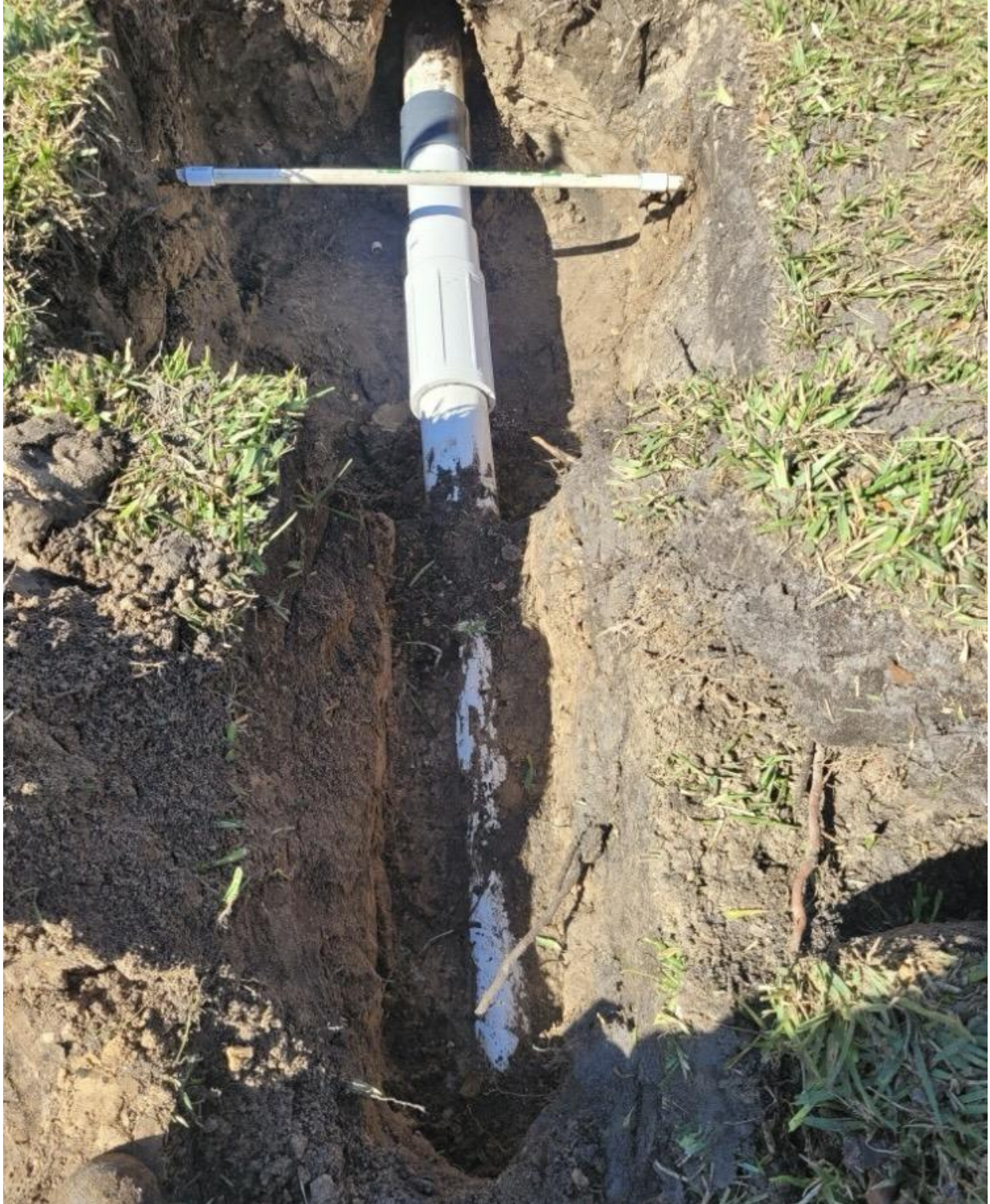
CHATHAM S- FOUR INCH IRRIGATION PIPE REPAIRED BY SEACREST SERVICES ON 2/12.