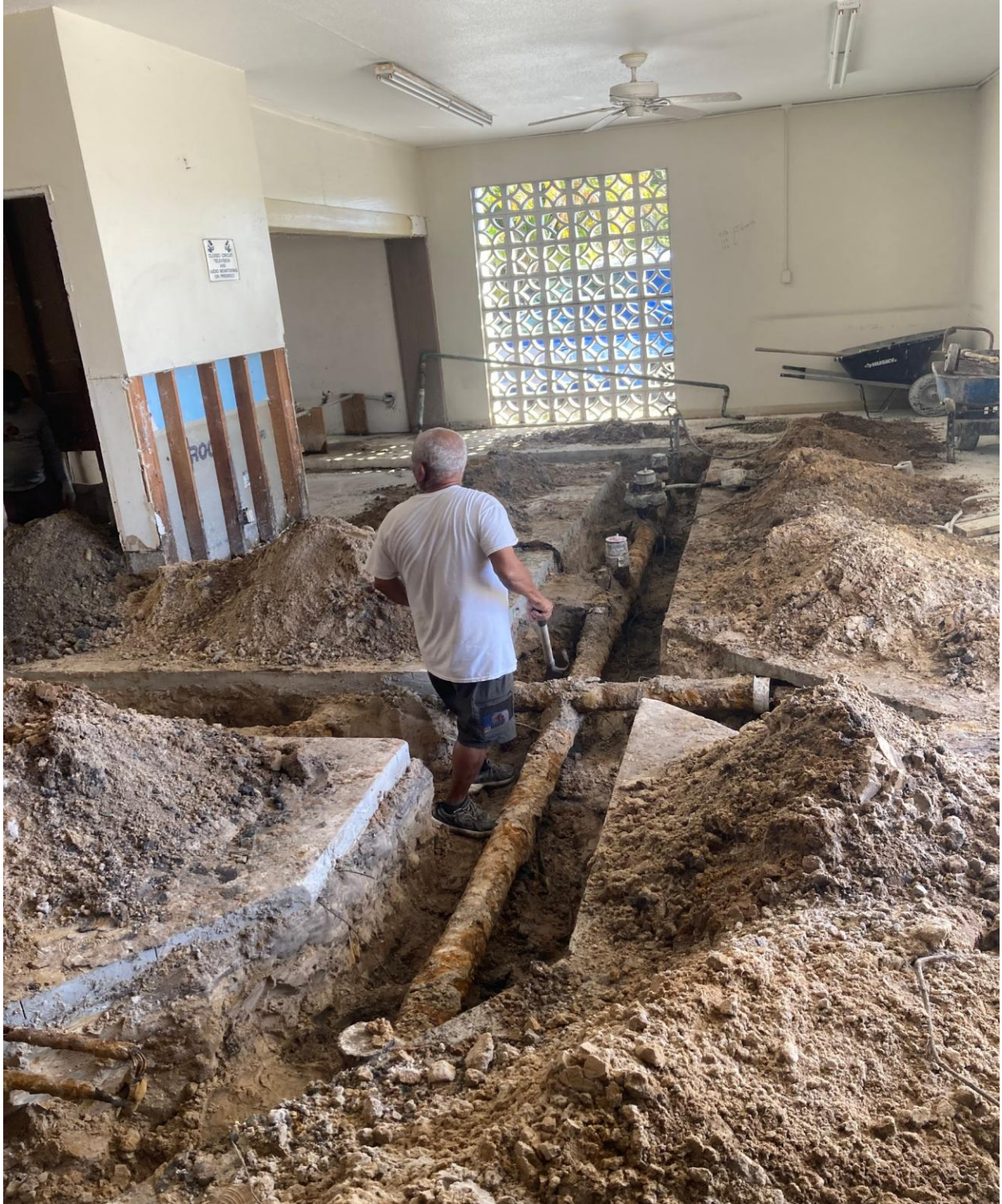
PLYMOUTH LAUNDRY- ON 2/12, THE OLD SEWER PIPES WERE DUG UP AND REMOVED.