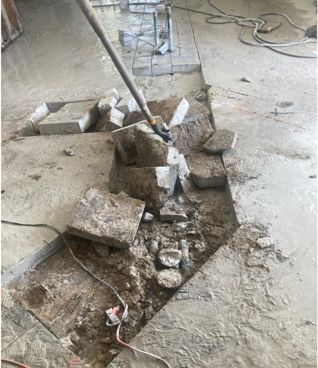
PLYMOUTH LAUNDRY- SECTIONS OF THE CONCRETE FLOOR SLAB WERE REMOVED ON 2/11.