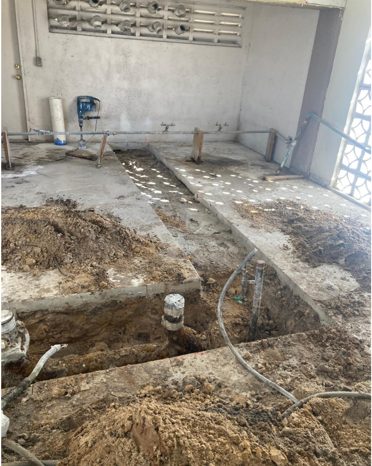
PLYMOUTH LAUNDRY- ON 2/12, THE OLD SEWER PIPES WERE DUG UP AND REMOVED.