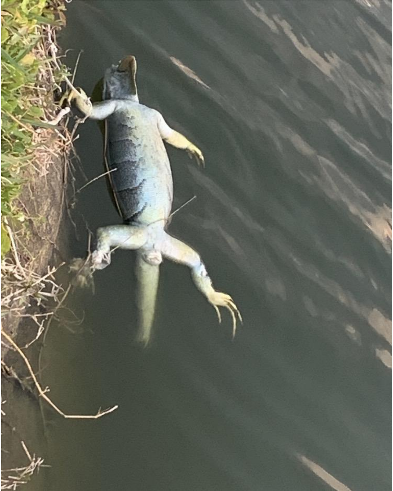
CHATHAM SECTION- THE RECENT FREEZE CAUSED MANY IGUANAS TO DIE.