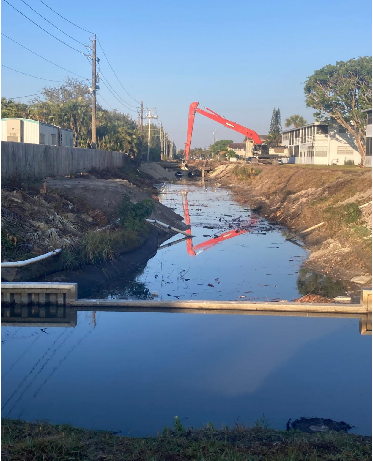
BEDFORD SECTION- SHENANDOAH CONSTRUCTION IS WORKING ON THE FINAL SECTION OF NORTH CANAL.