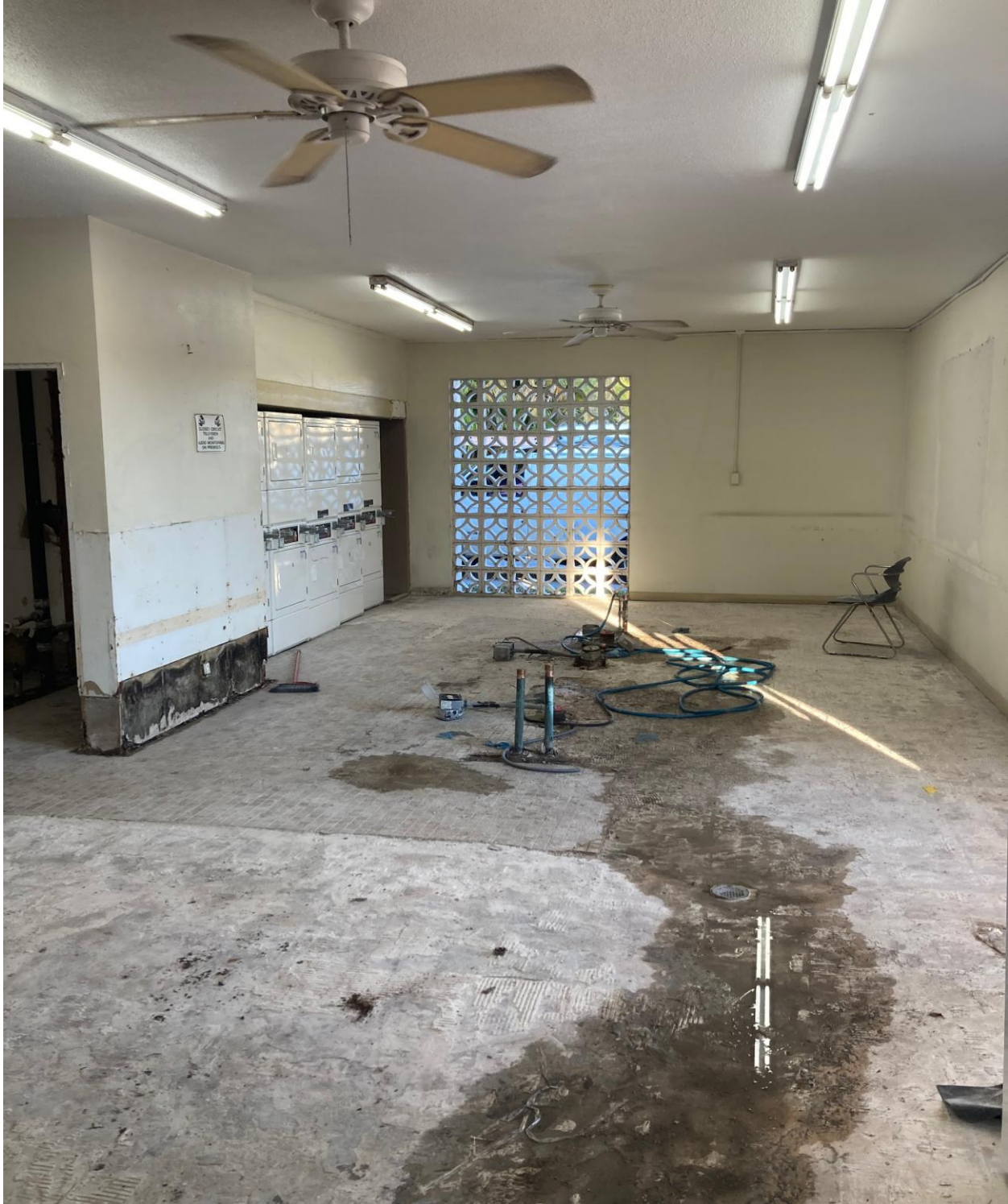
PLYMOUTH LAUNDRY- ON 2/9, DOS SANTOS CONSTRUCTION REMOVED LAUNDRY MACHINES, CAPPED PLUMBING, REMOVED CERAMIC FLOOR TILES, AND STRIPPED DOWN WALLS.