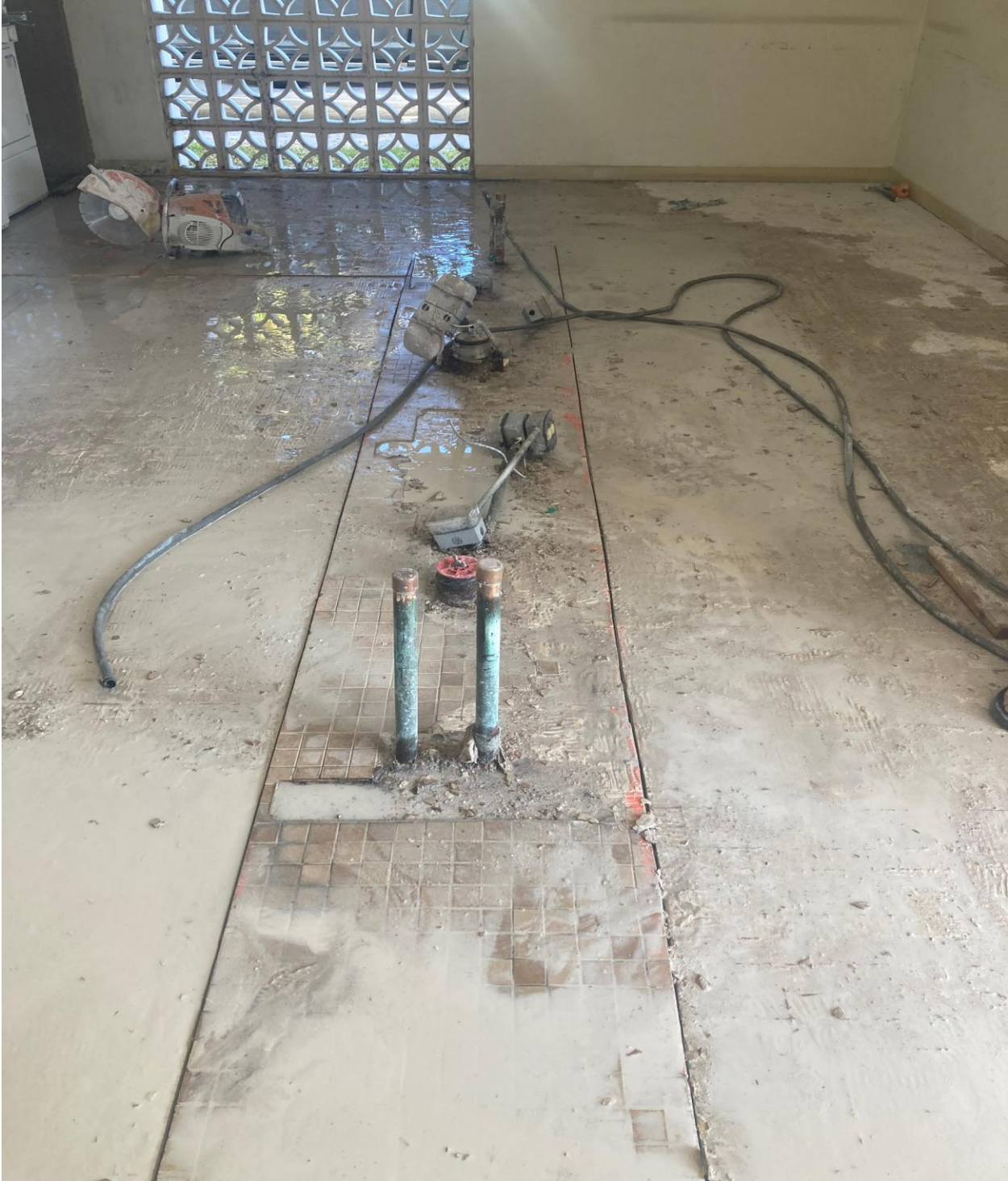
PLYMOUTH LAUNDRY- ON 2/10, DOS SANTOS CONSTRUCTION CAPPED EXISTING PLUMBING AND SAW CUT THE CONCRETE FLOOR SLAB. THIS SECTION OF SLAB WILL BE BUSTED UP AND THE CAST IRON DRAIN PIPES UNDERNEATH WILL BE REPLACED.