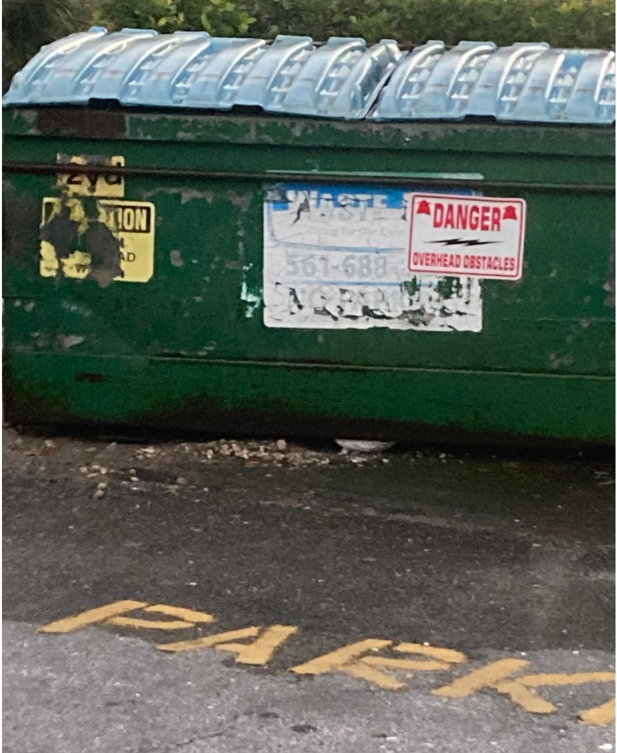
DORCHESTER K- RUSTED OUT DUMPSTER. A REQUEST FOR REPLACEMENT WAS SENT TO WASTE PRO.