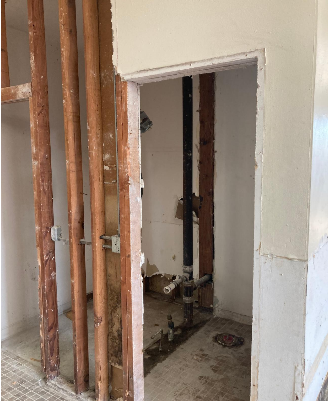
PLYMOUTH LAUNDRY- THIS WAS THE REST ROOM ON RIGHT AND SLOP SINK ROOM ON THE LEFT. THIS SPACE WILL BE MADE INTO A SINGLE ADA COMPLIANT REST ROOM.