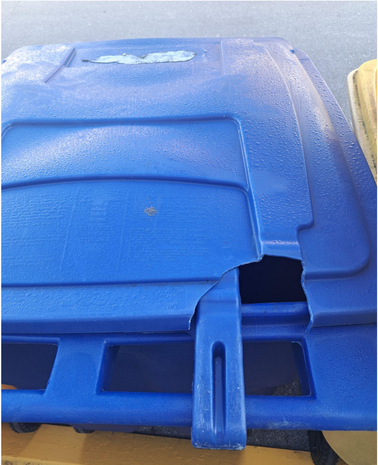
WELLINGTON D- BUSTED LID ON BLUE Toter. REPORTED IN BY A CV UNIT OWNER. A REQUEST FOR REPAIR WAS SENT TO WASTE PRO.