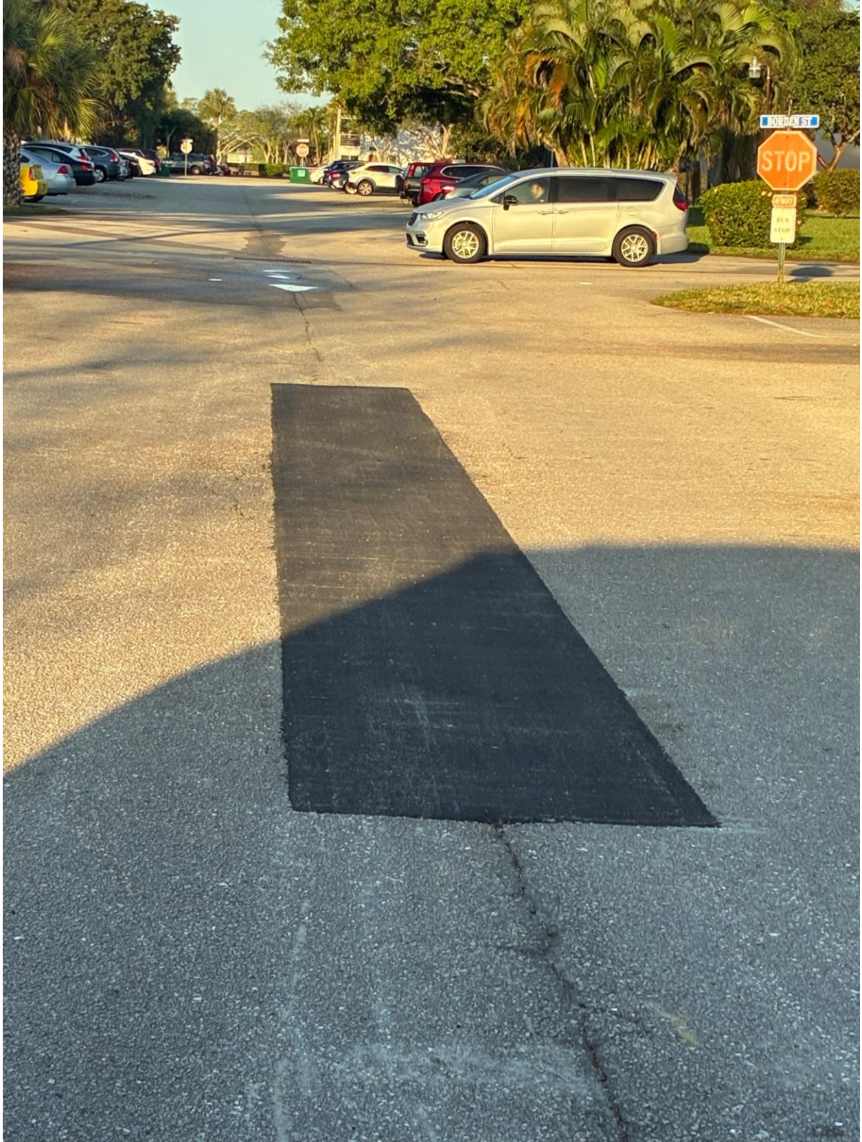
SALISBURY SECTION- ROADWAY REPAIR COMPLETE.