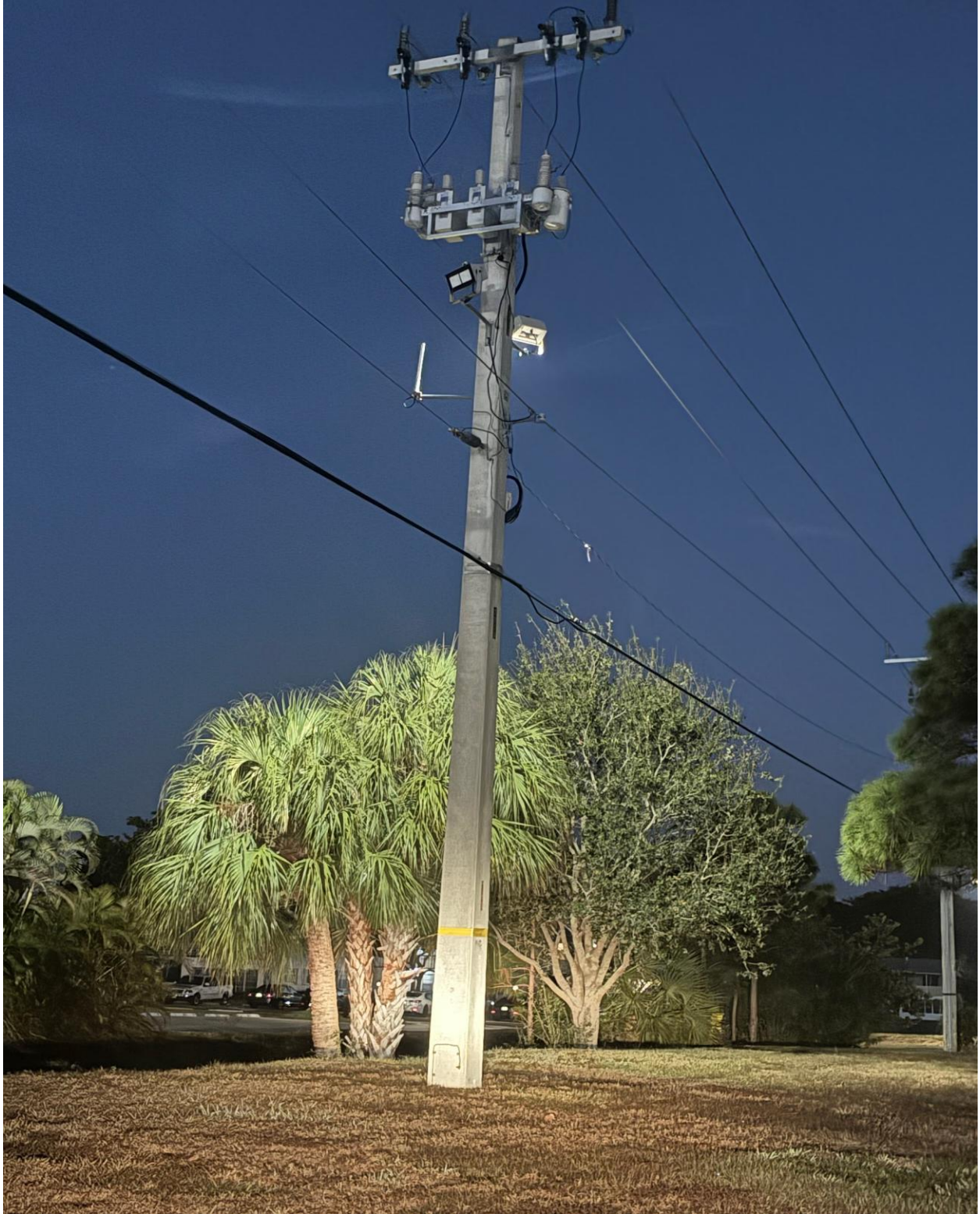
HASTINGS SECTION- DARK FLOODLIGHT, REPORTED IN BY A CV UNIT OWNER. A SECOND REQUEST FOR REPAIR WAS SENT TO FPL, TICKET #48304.