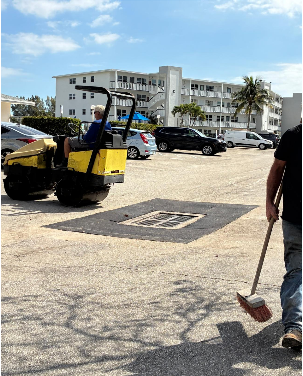
WELLINGTON SECTION- STORM DRAIN CATCH BASIN COMPLETE. THE BASIN WAS RAISED TO JUST BELOW GRADE.