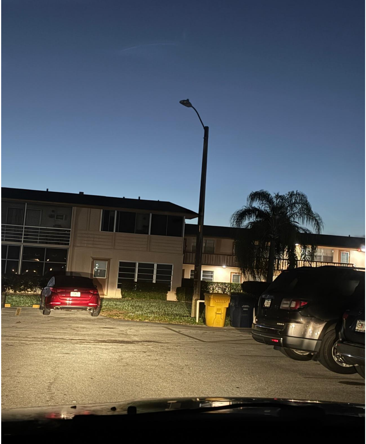
DORCHESTER D- DARK STREETLIGHT. REPORTED IN BY A CV UNIT OWNER. A REQUEST FOR REPAIR WAS SENT TO FPL, TICKET #41370 .