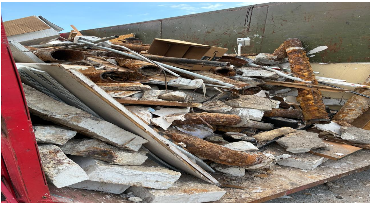
PLYMOUTH LAUNDRY- THESE OLD SEWER PIPES WERE CLOGGED WITH ROOTS, RUST, ETC. SOME PIPES WERE ALSO CRACKED.