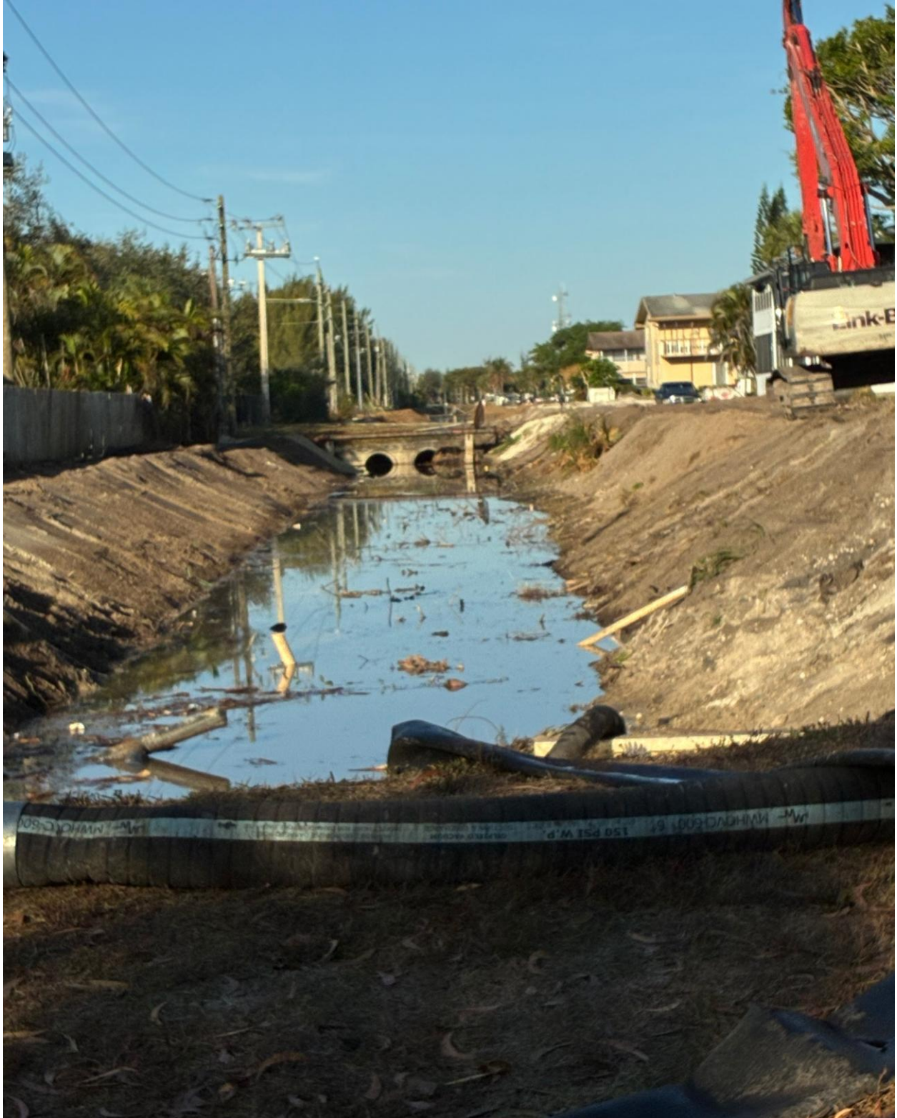
BEDFORD SECTION- RE-GRADING WORK AT THE EASTERNMOST SECTION OF SOUTH CANAL CONTINUES.