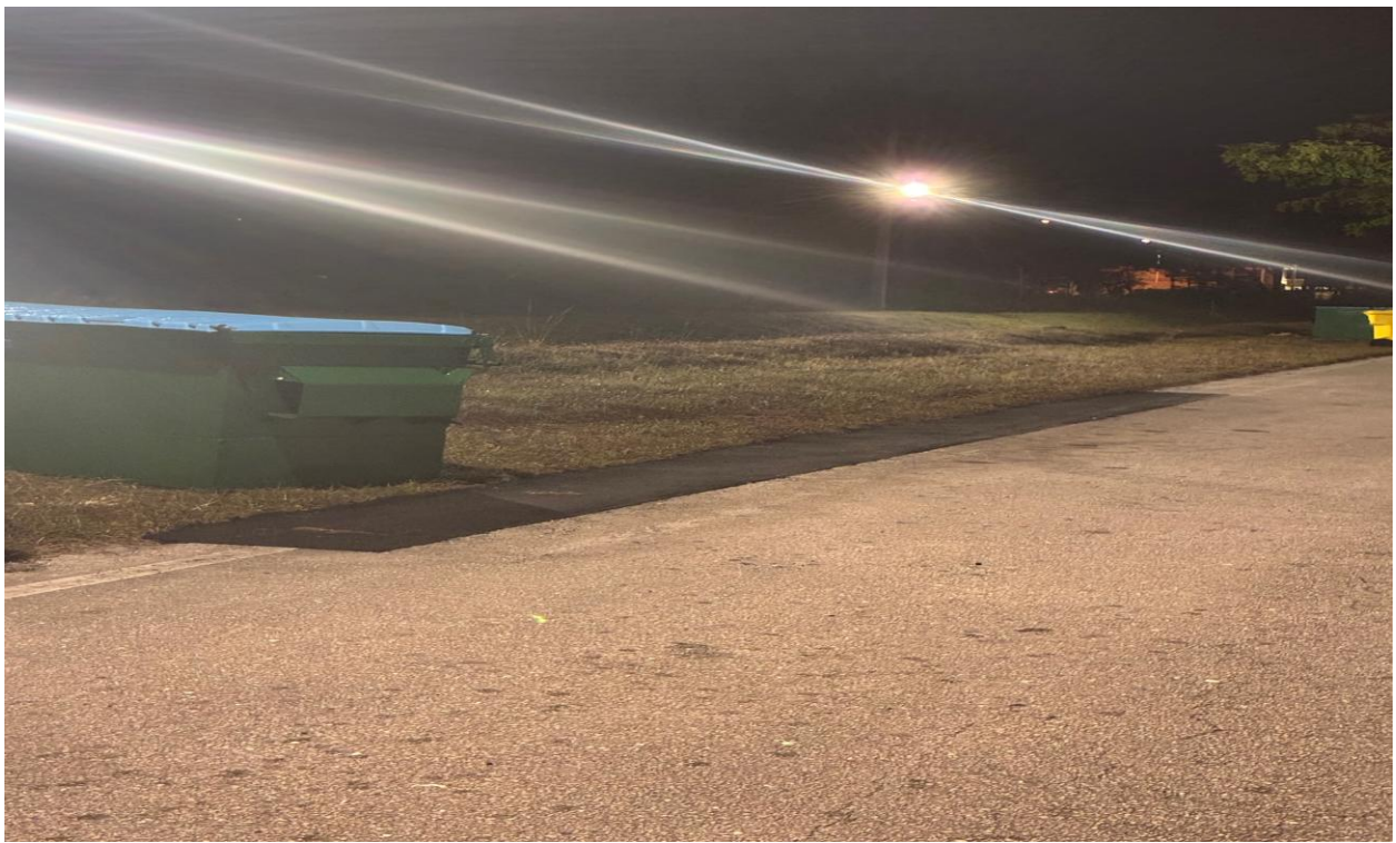
WINDSOR SECTION- ROADWAY REPAIRS COMPLETE.