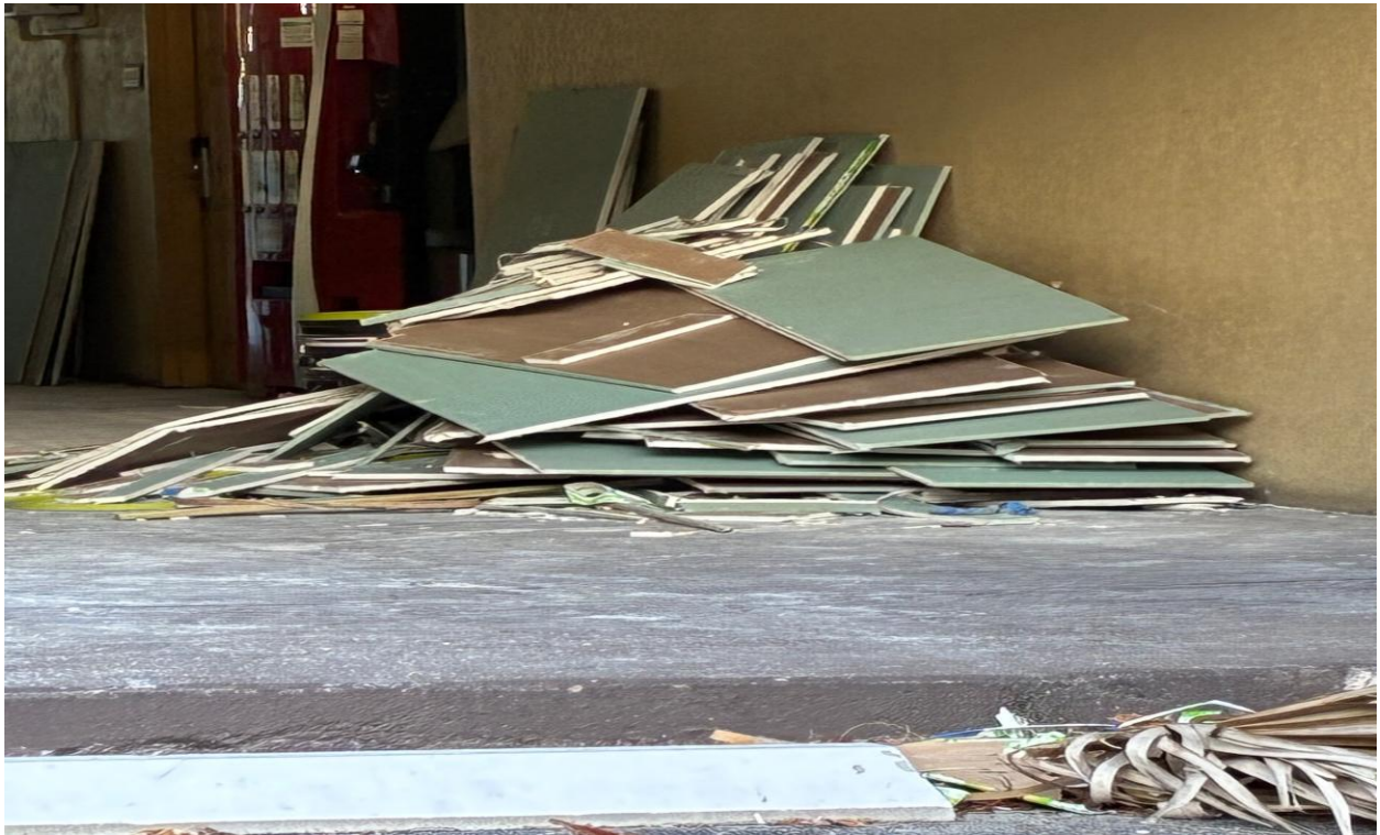
LA QUINTA INN- THESE RUBBISH PILES WERE REPORTED TO PBC CODE ENFORCEMENT.