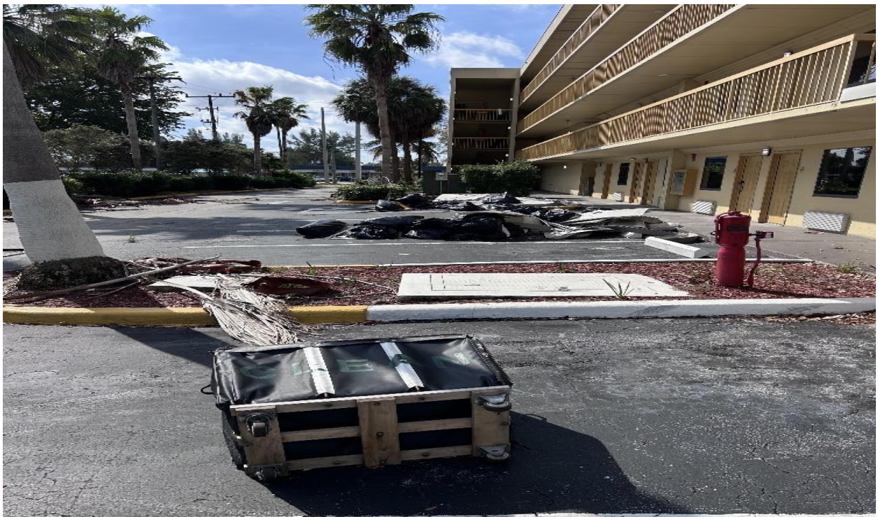
LA QUINTA INN- THESE RUBBISH PILES WERE REPORTED TO PBC CODE ENFORCEMENT.