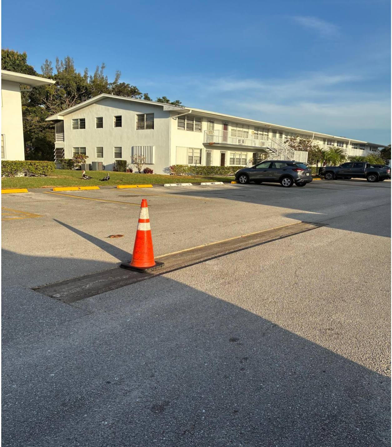
WINDSOR SECTION- DETERIORATED SECTION OF ROADWAY WAS SAWCUT AND REMOVED BY FEDERAL MAINTENANCE ON 2/19. AN ASPHALT PATCH IS NEXT.