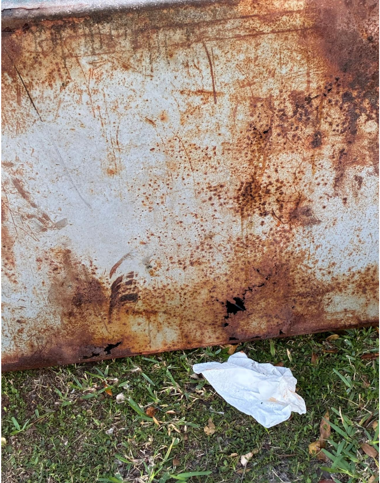
CHATHAM P- RUSTED OUT DUMPSTER. A REQUEST FOR REPLACEMENT WAS SENT TO WASTE PRO.