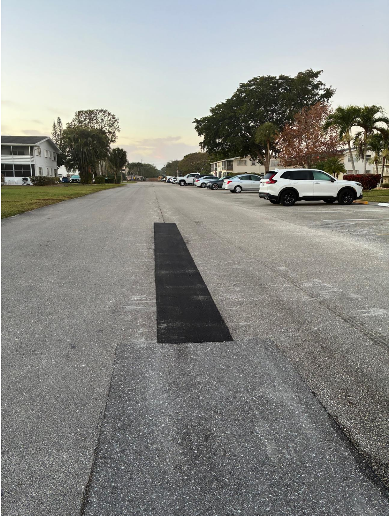
BEDFORD SECTION- ROADWAY REPAIR COMPLETE.