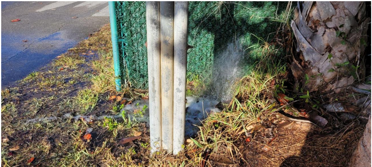
COVENTRY SECTION- A CV UNIT OWNER CALLED IN THIS LEAK ON 2/17. REPORTS LIKE THESE, WITH PICTURES, ARE VERY HELPFUL.