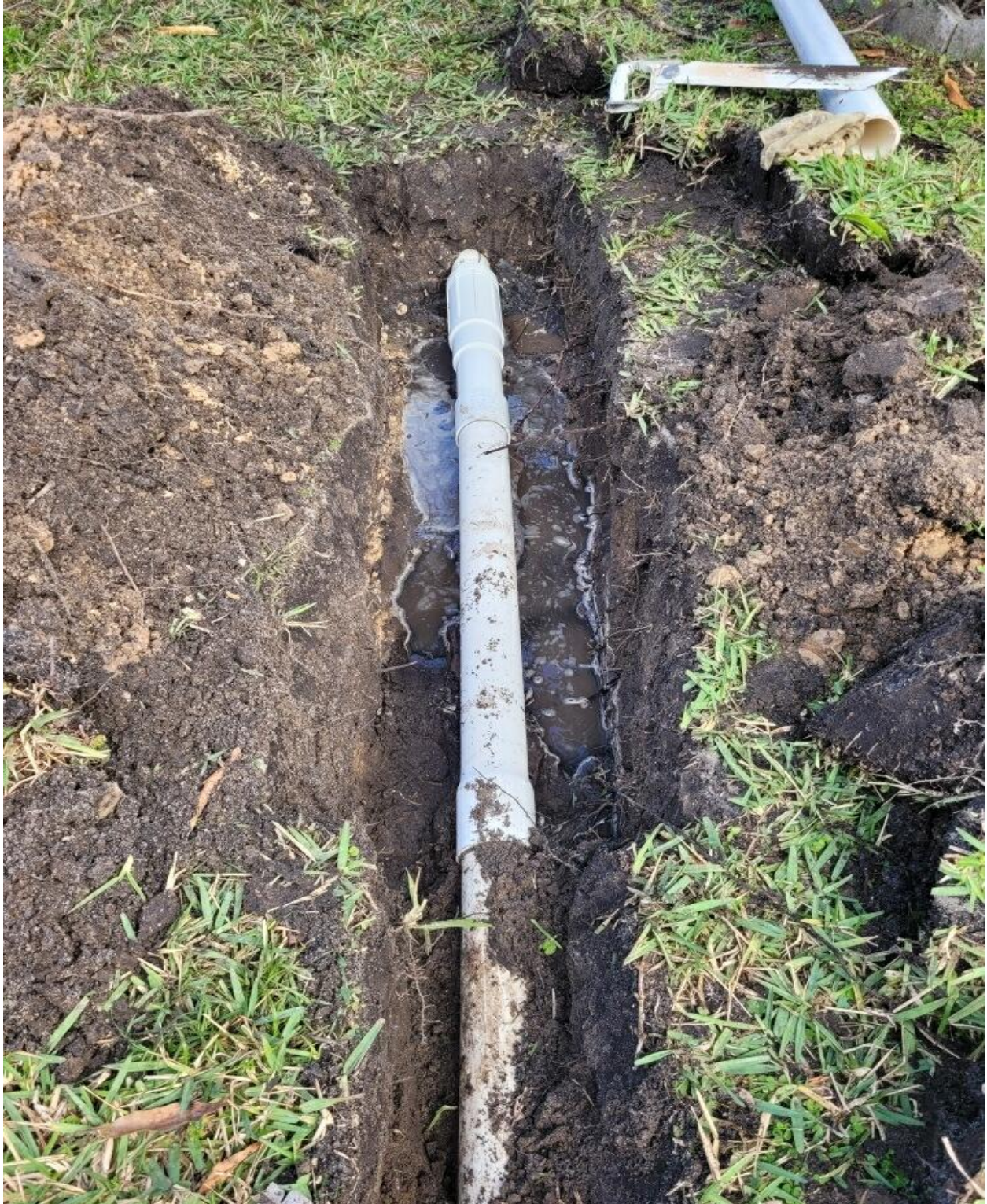
NORWICH N- FOUR INCH UNDERGROUND IRRIGATION PIPE REPAIRED BY SEACREST SERVICES ON 2/17.