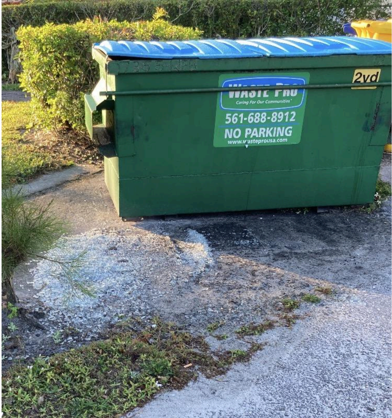
DORCHESTER F- THIS IS WHY LARGE PIECES OF GLASS SHOULD NOT BE LEFT UP AGAINST THE DUMPSTERS.