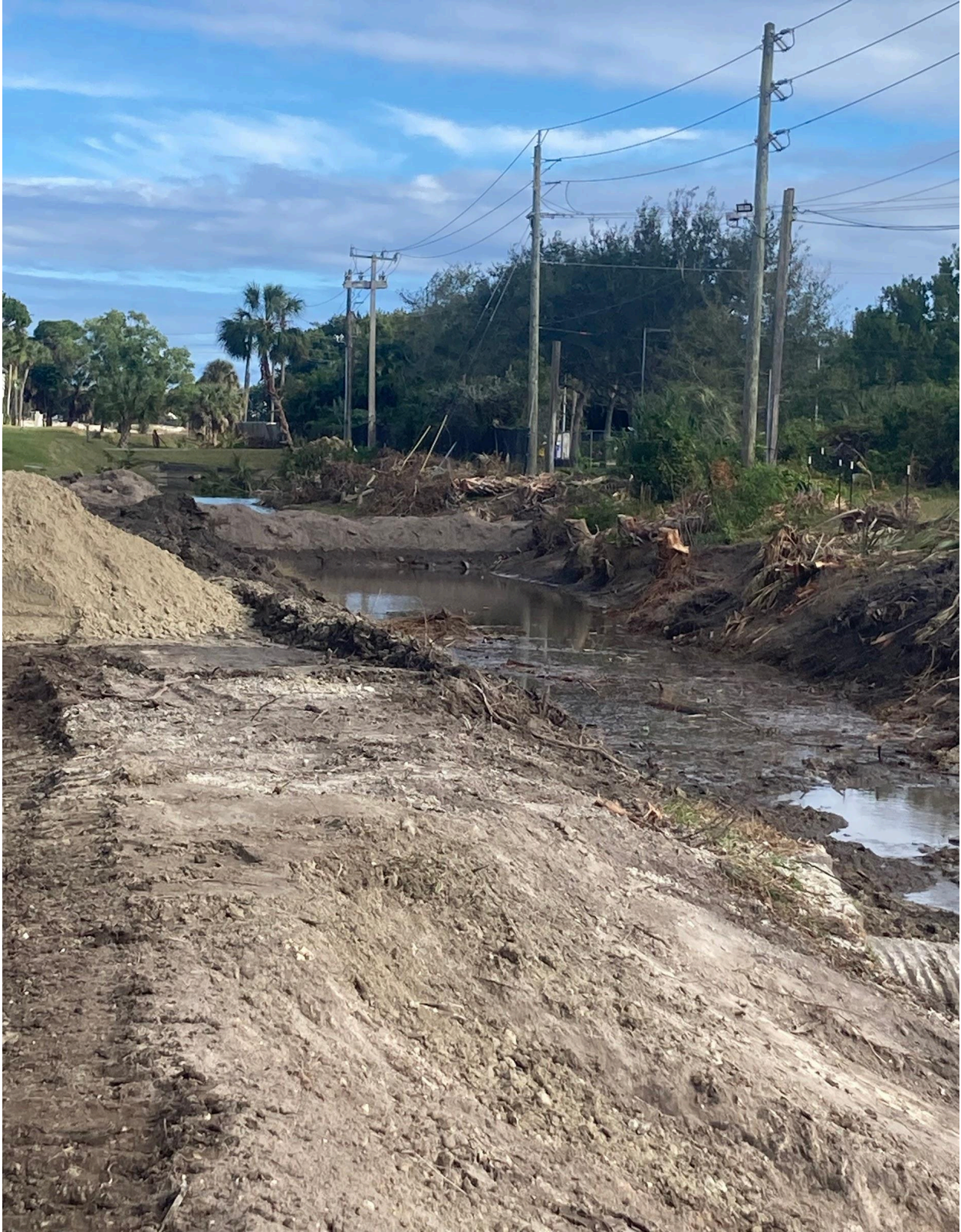
ANDOVER SECTION- CONSTRUCTION WORK AT SOUTH CANAL CONTINUES.