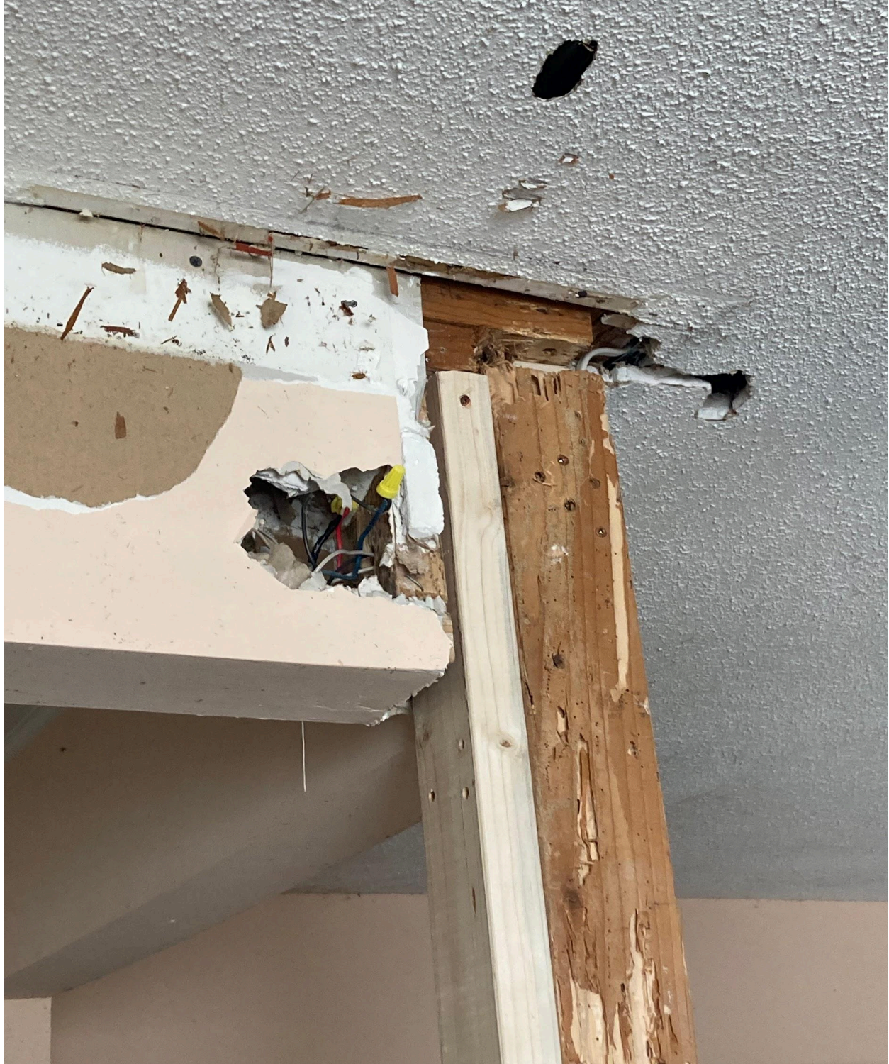
8 NORWICH A- UNPERMITTED ELECTRICAL WORK, ALTERED LOAD BEARING POST, EVIDENCE OF TERMITE DAMAGE.