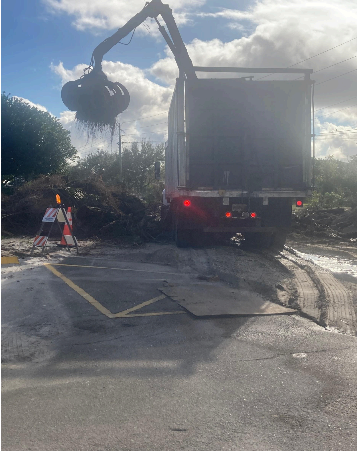
ANDOVER SECTION- TREES AND STUMPS WERE REMOVED FROM THE PROPERTY ON 1/23.