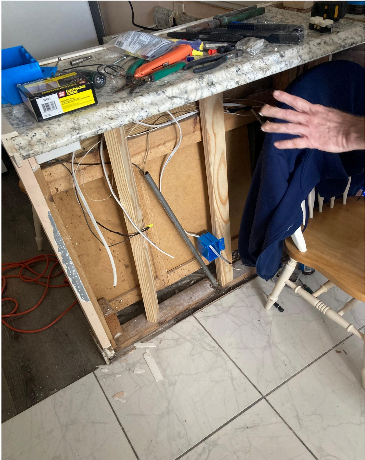
8 NORWICH A- UNAUTHORIZED DRYWALL REMOVAL, UNPERMITTED ELECTRICAL WORK.