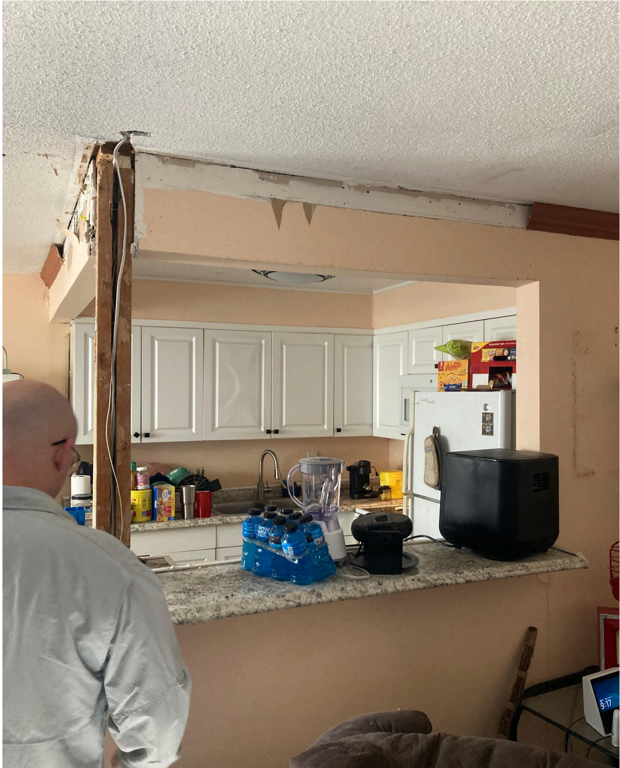
8 NORWICH A- AN OCCUPANT AT THIS UNIT REMOVED DRYWALL, PERFORMED UNPERMITTED ELECTRICAL WORK, AND ALTERED A LOAD BEARING POST.