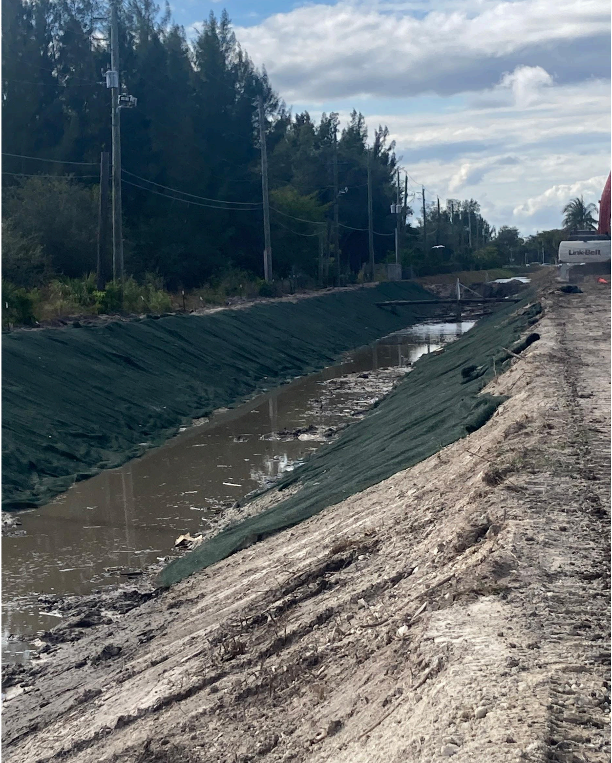
ANDOVER SECTION- CONSTRUCTION WORK AT SOUTH CANAL CONTINUES.