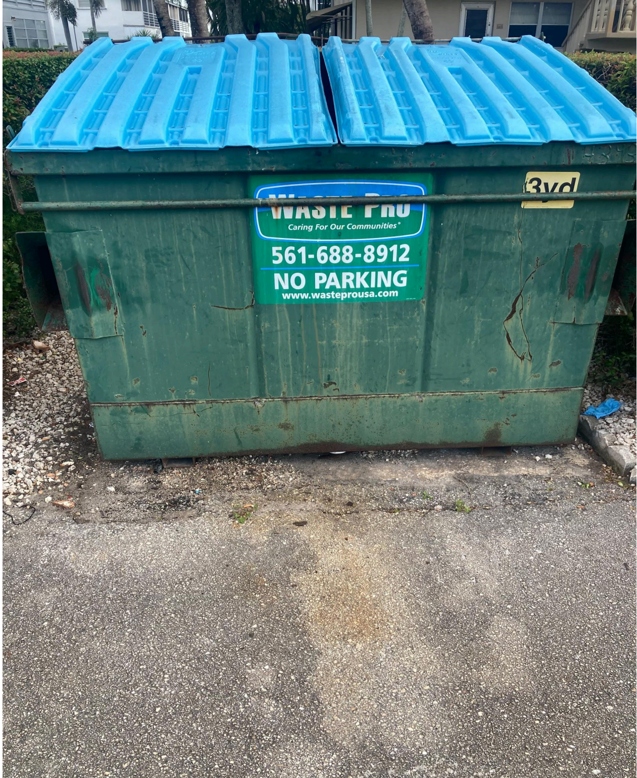
SHEFFIELD K- RUSTED OUT DUMPSTER. A REQUEST FOR REPLACEMENT WAS SENT TO WASTE PRO.