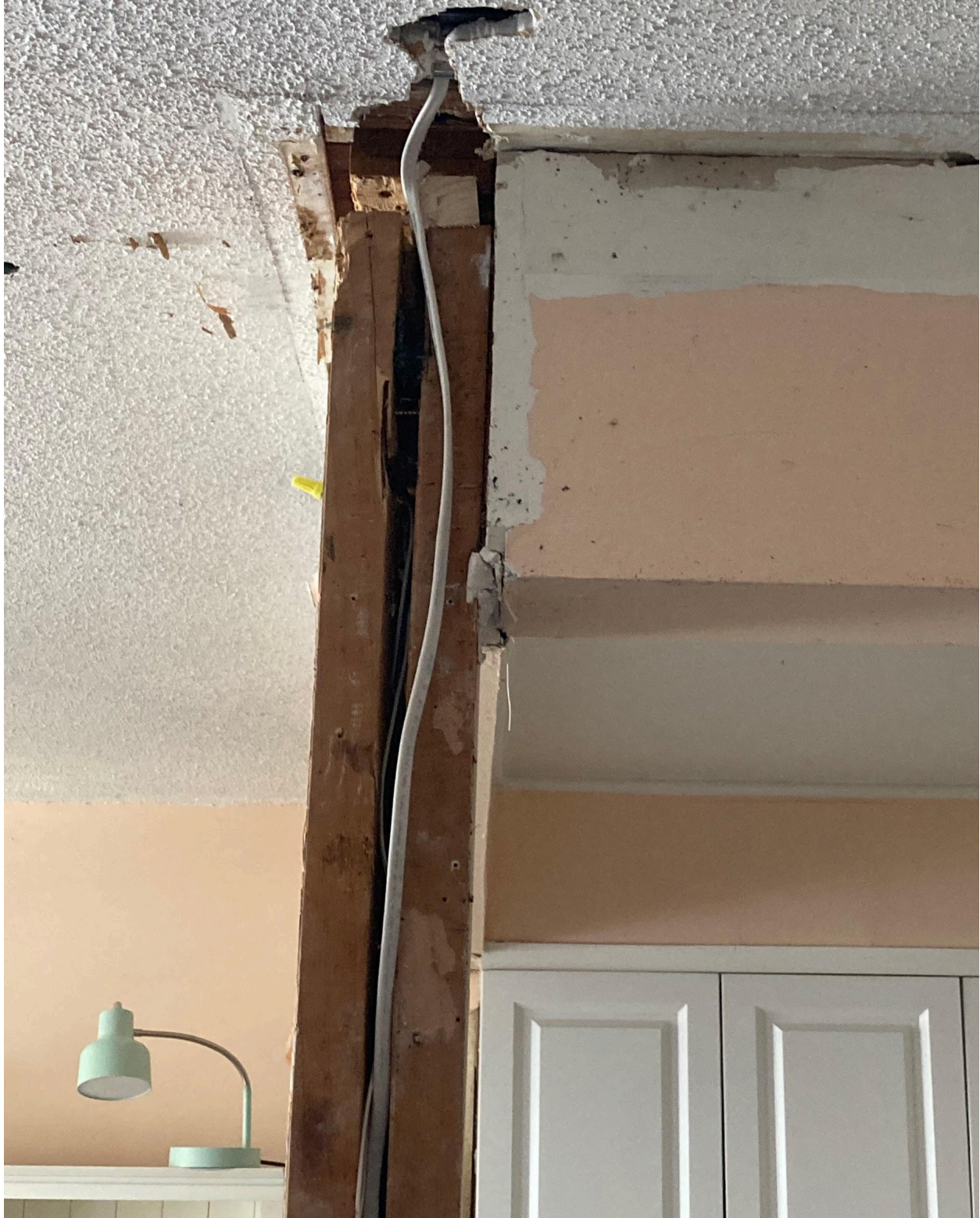
8 NORWICH A- ALTERED AND WEAKENED LOAD BEARING POST, UNPERMITTED AND NON-CODE COMPLIANT WIRING. A REPORT WAS SENT TO PBC CODE ENFORCEMENT.