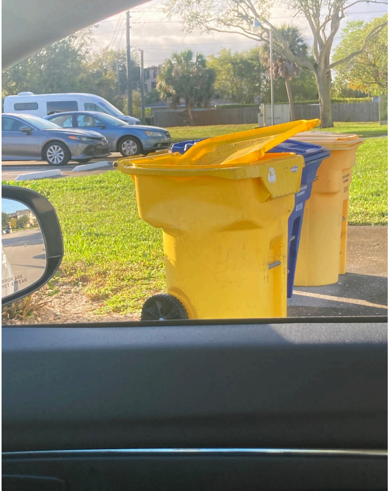
BEDFORD G- YELLOW TOTER WITH BUSTED LID. A REQUEST FOR REPLACEMENT WAS SENT TO WASTE PRO.