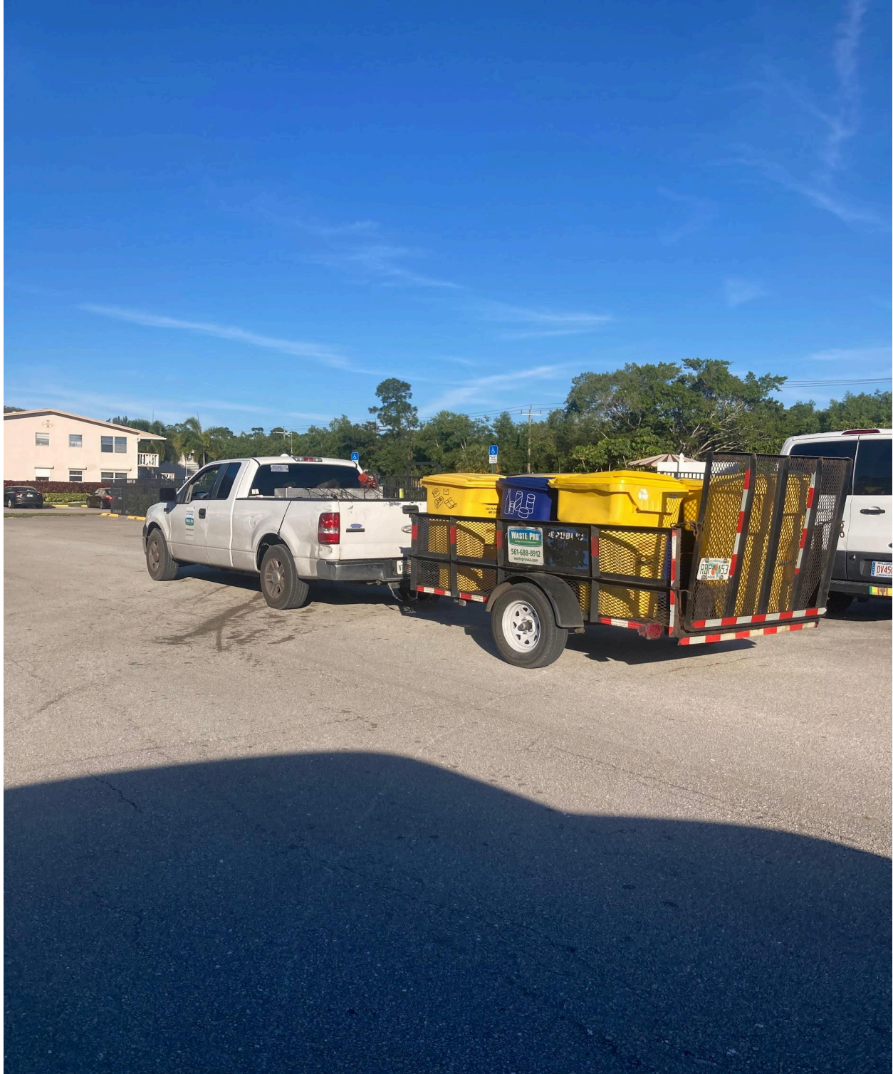
DORCHESTER SECTION- WASTE PRO DELIVERED NEW TOTERS TO CV ON 1/24.