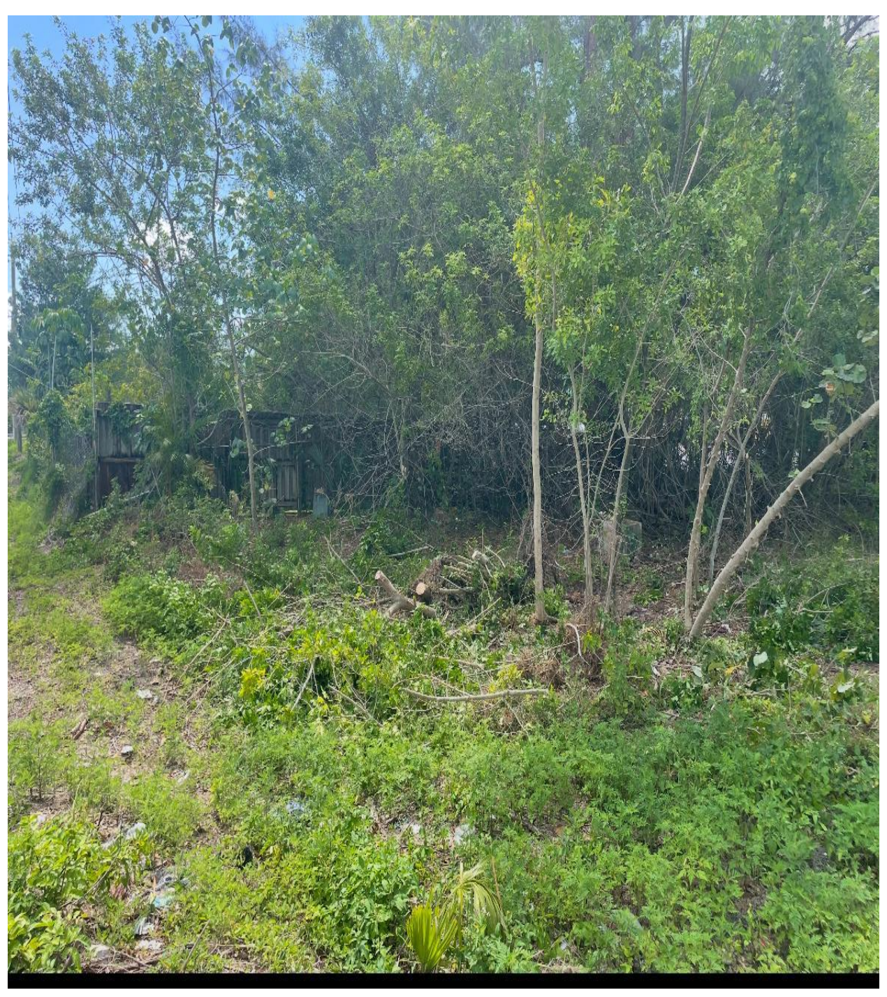
SOUTH CANAL- A HOMELESS ENCAMPMENT IN THIS AREA WAS CLEARED BY SEACREST SERVICES ON 5/6. THERE WAS QUITE A MESS OVER THERE.