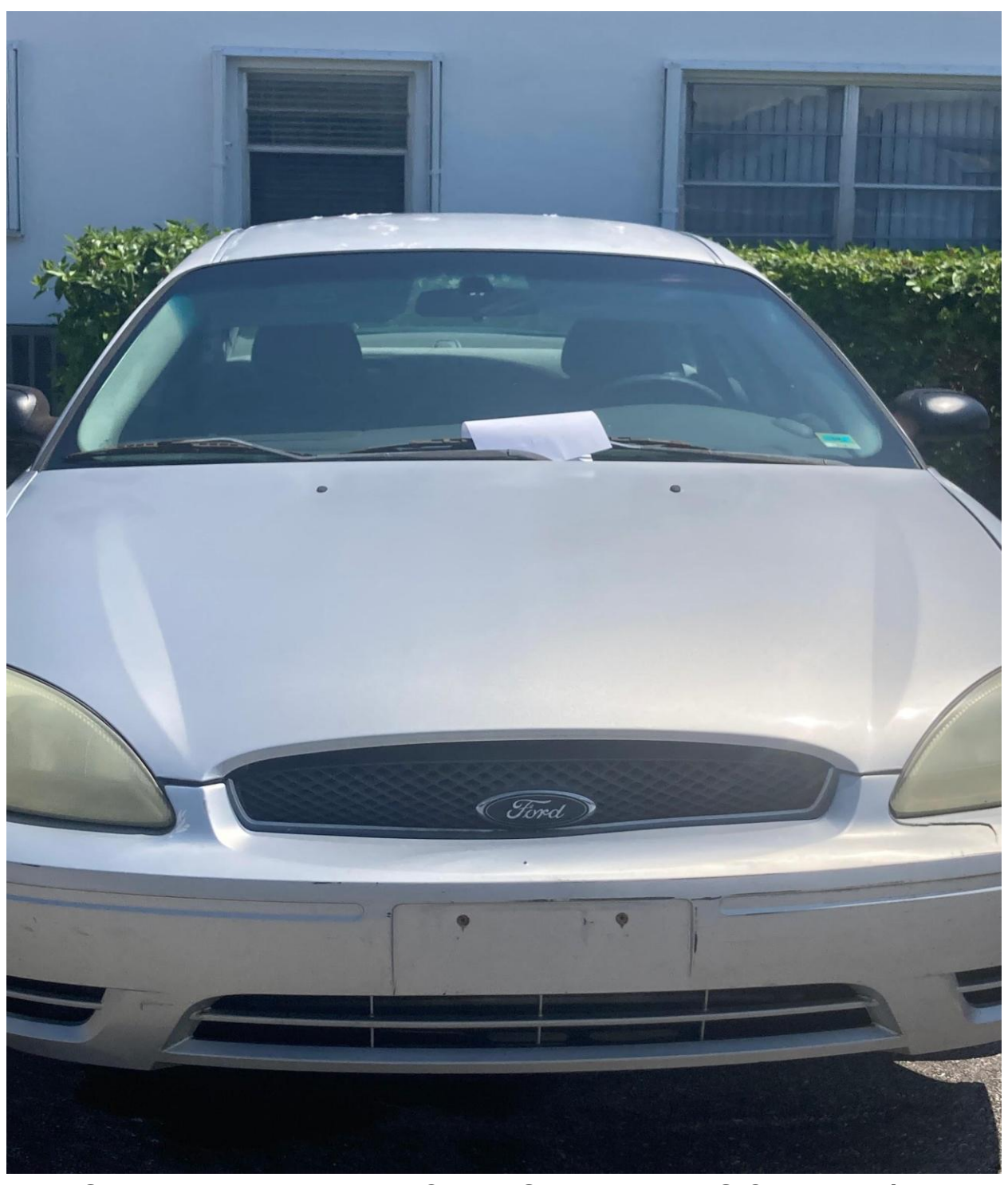
KINGSWOOD F- A TOW NOTICE WAS PUT ON THIS CAR ON 5/8. THE CAR WAS REMOVED FROM CV ON 5/9. PBC CODE ENFORCEMENT WAS NOTIFIED SO THAT THE NOTICE OF VIOLATION CAN BE CANCELLED.