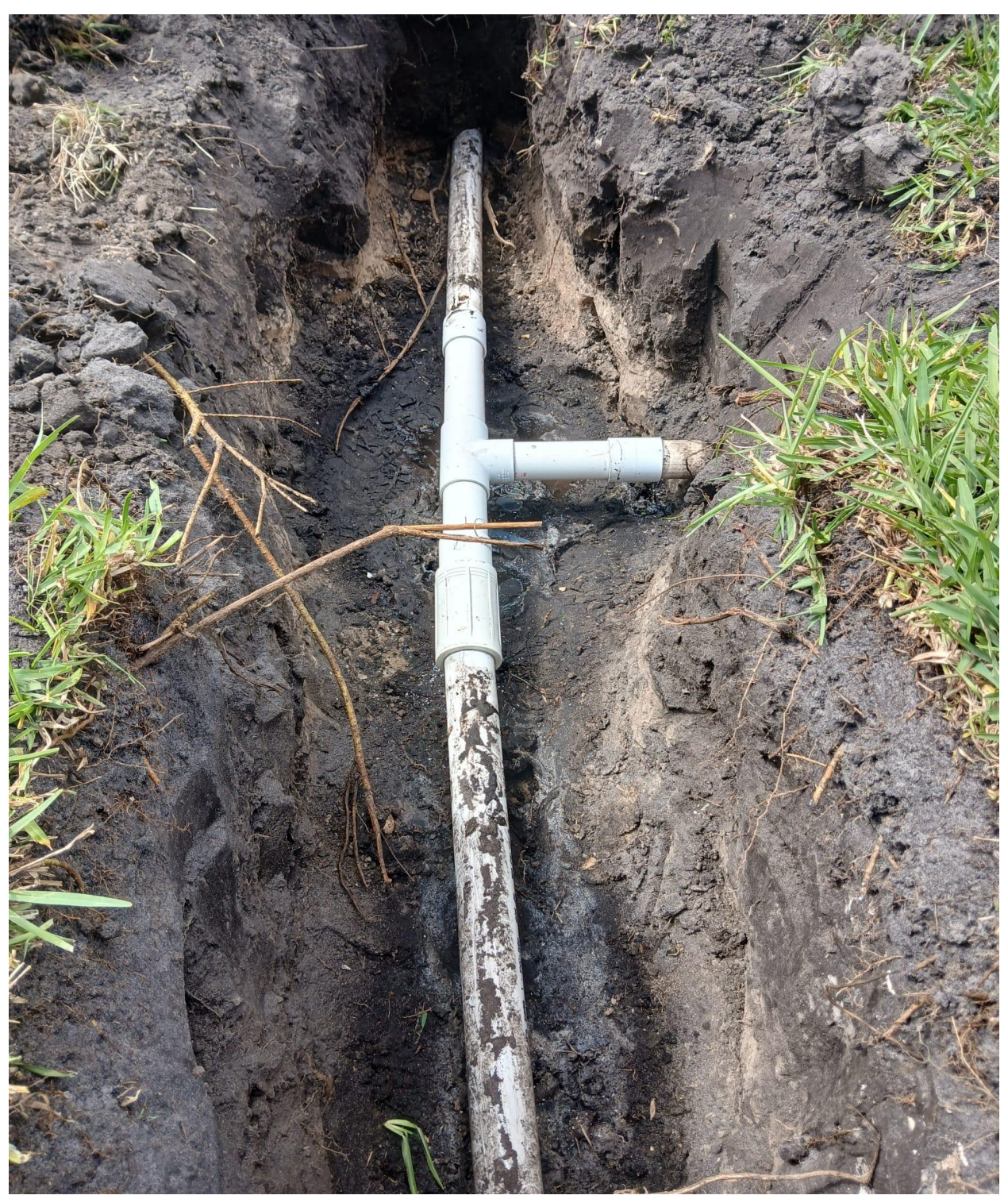
ANDOVER E- SEACREST SERVICES REPAIRED THIS UNDERGROUND IRRIGATION SUPPLY PIPE ON 5/6.