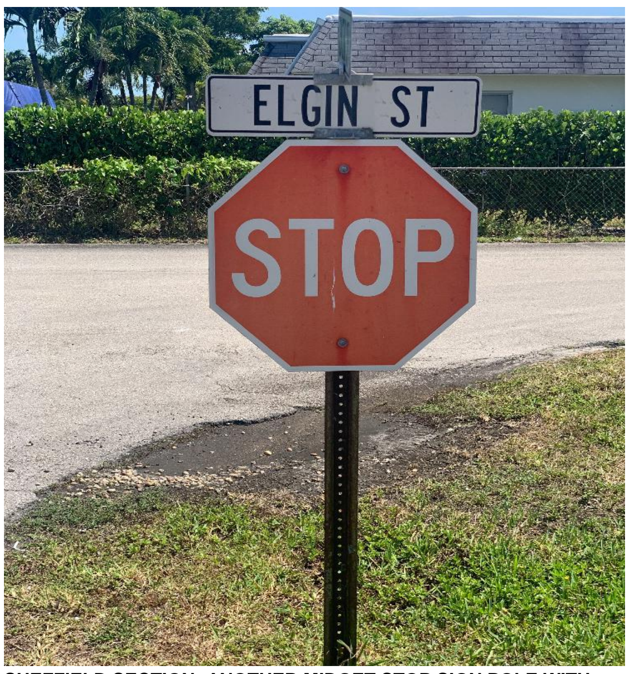
SHEFFIELD SECTION- ANOTHER MIDGET STOP SIGN POLE WITH FADED SIGN.