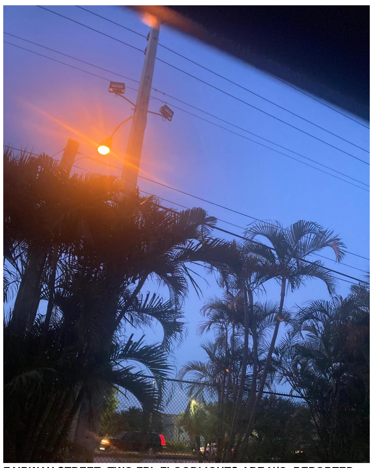
FAIRWAY STREET- TWO FPL FLOODLIGHTS ARE N/G. REPORTED TO FPL, WORK TICKET #47725.