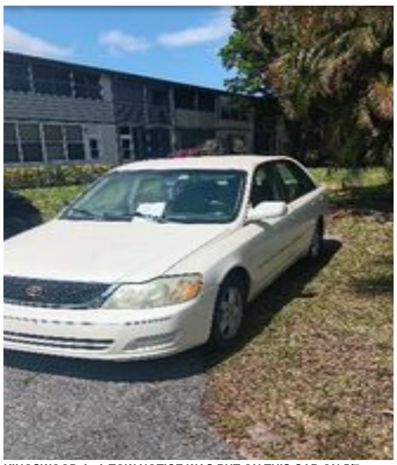
KINGSWOOD A- A TOW NOTICE WAS PUT ON THIS CAR ON 5/7.