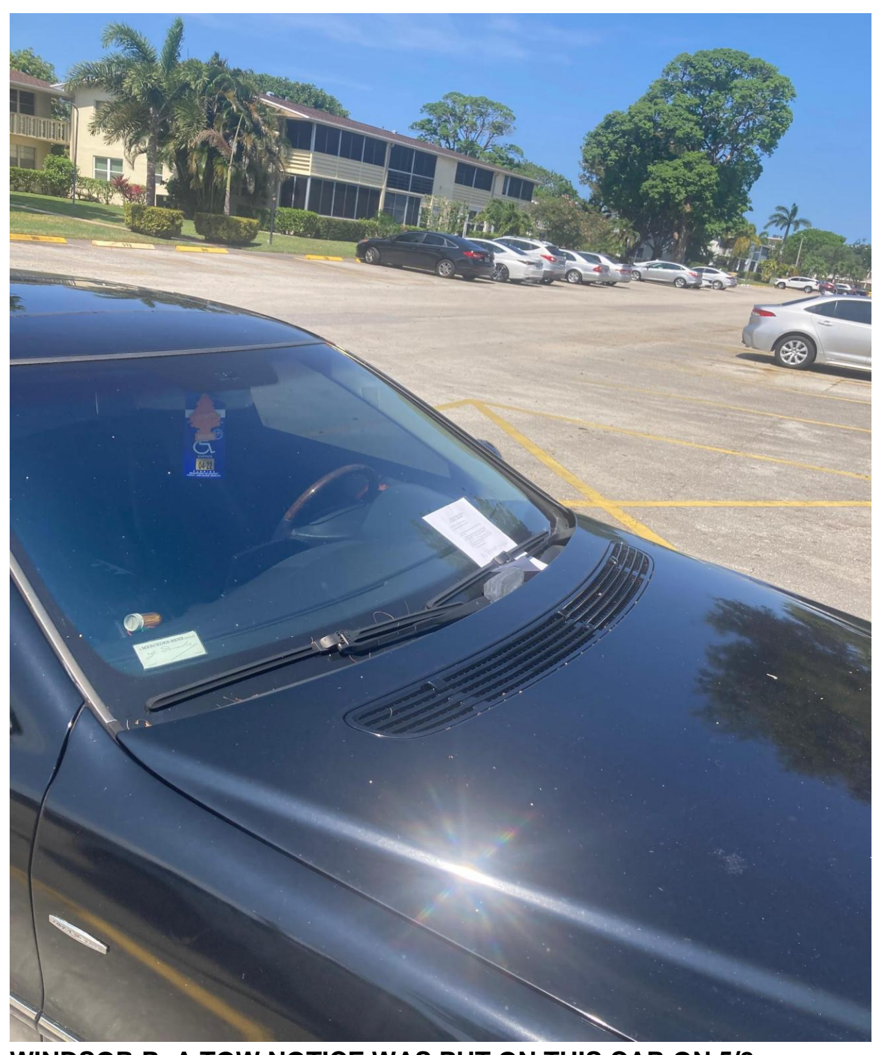
WINDSOR P- A TOW NOTICE WAS PUT ON THIS CAR ON 5/8.