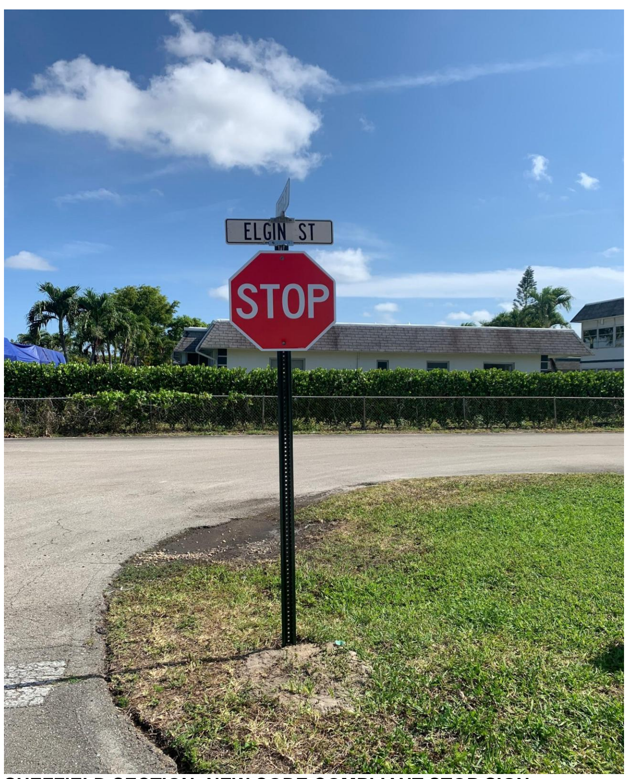
SHEFFIELD SECTION- NEW CODE COMPLIANT STOP SIGN, INSTALLED BY HANDYMAN JOSE.