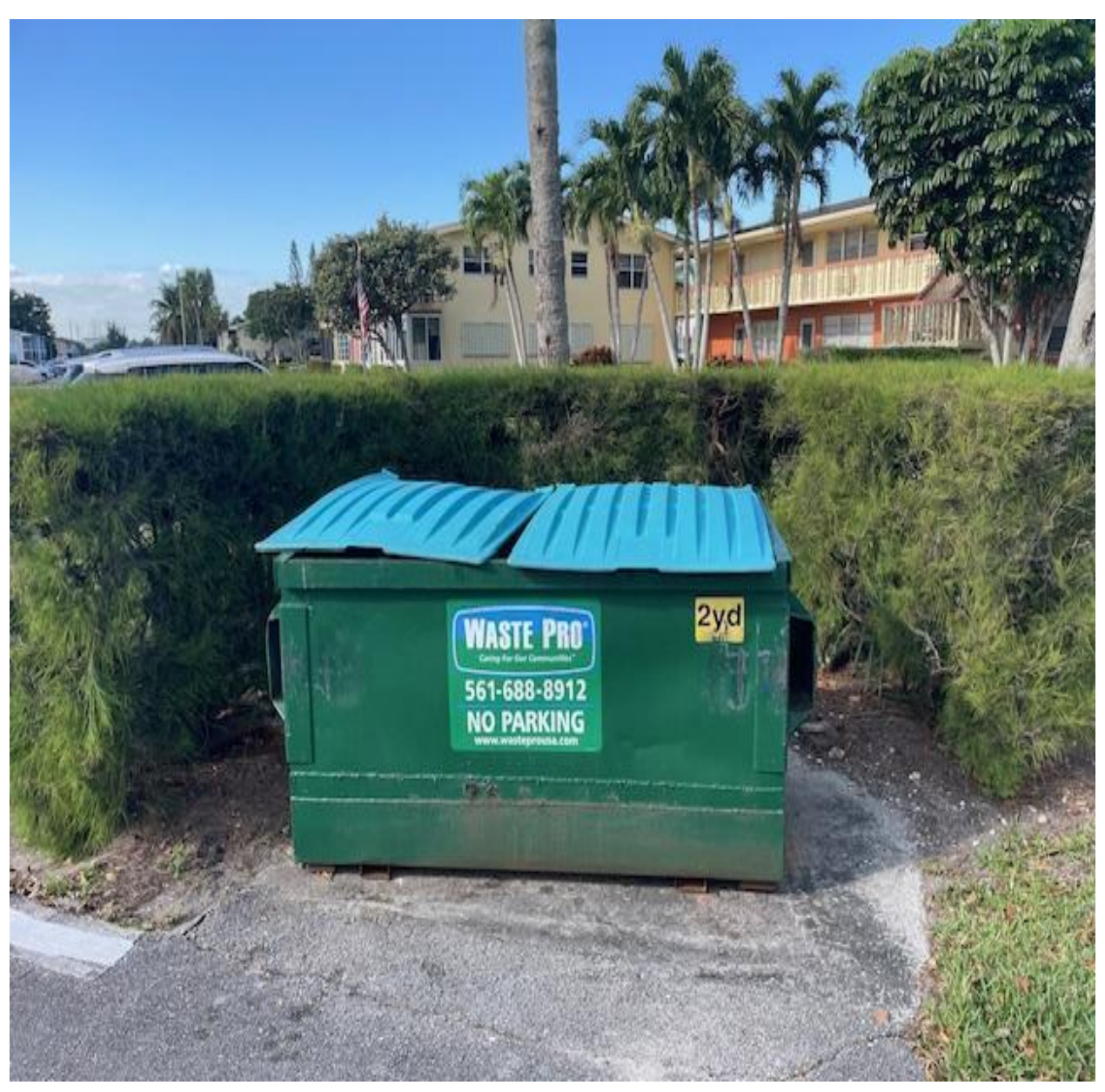
ANDOVER C- DUMPSTER WITH WHACKED OUT LID. REPORTED IN BY A CV UNIT OWNER. A REQUEST FOR REPAIR WAS SENT TO WASTE PRO.