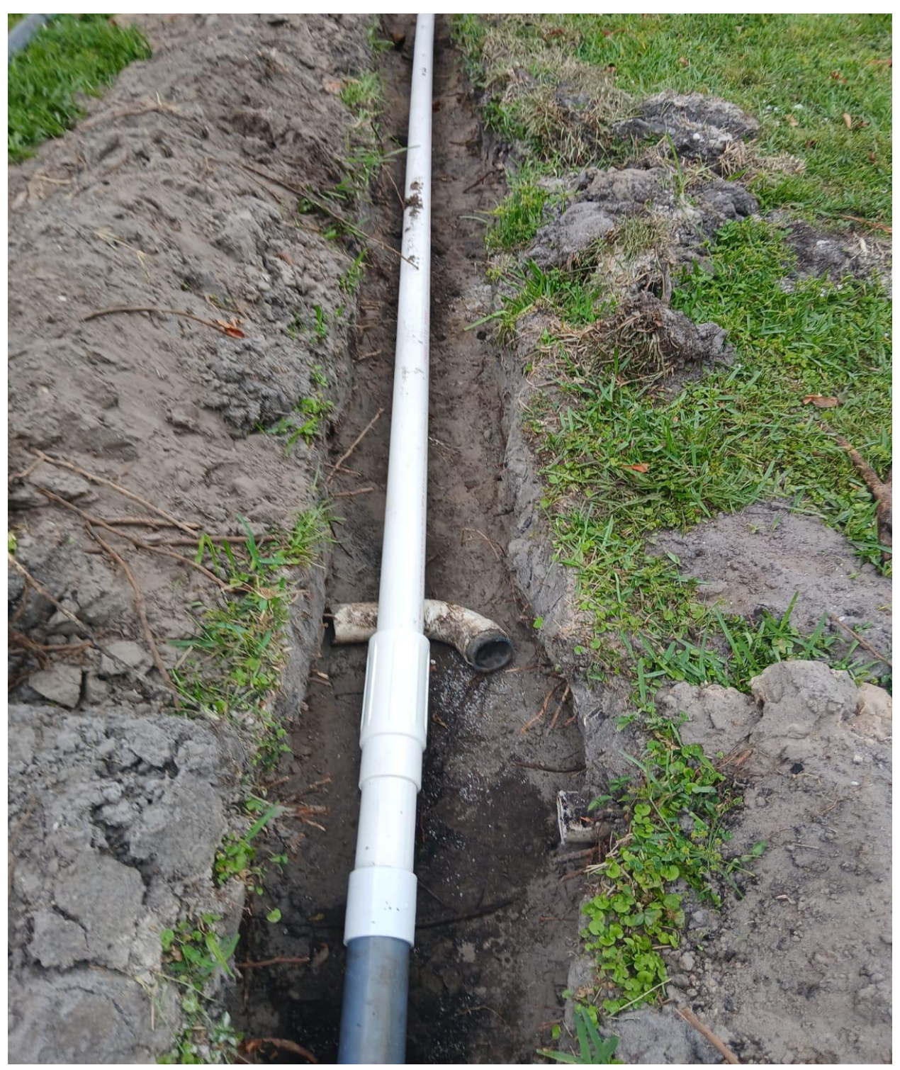
NORWICH D- SEACREST SERVICES REPAIRED THIS UNDERGROUND IRRIGATION SUPPLY PIPE ON 5/6.