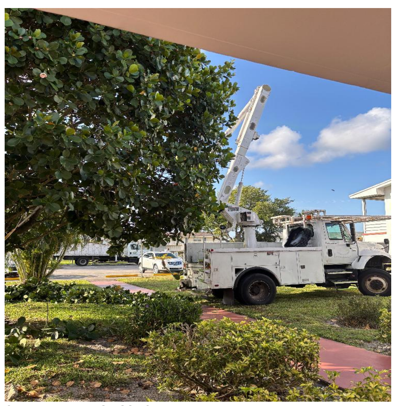
CHATHAM E- THIS ASSOCIATION ORDERED ADDITIONAL TRIMMING OF THIS FALSE BANYAN TREE, BEYOND WHAT IS COVERED IN THE SEACREST ANNUAL MAINTENANCE TRIM.