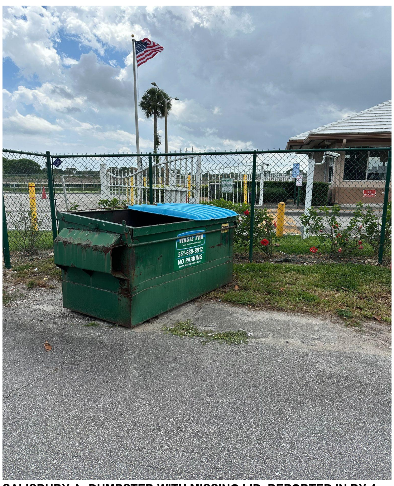
SALISBURY A- DUMPSTER WITH MISSING LID. REPORTED IN BY A CV UNIT OWNER. A REQUEST FOR REPLACEMENT HAS BEEN SENT TO WASTE PRO.