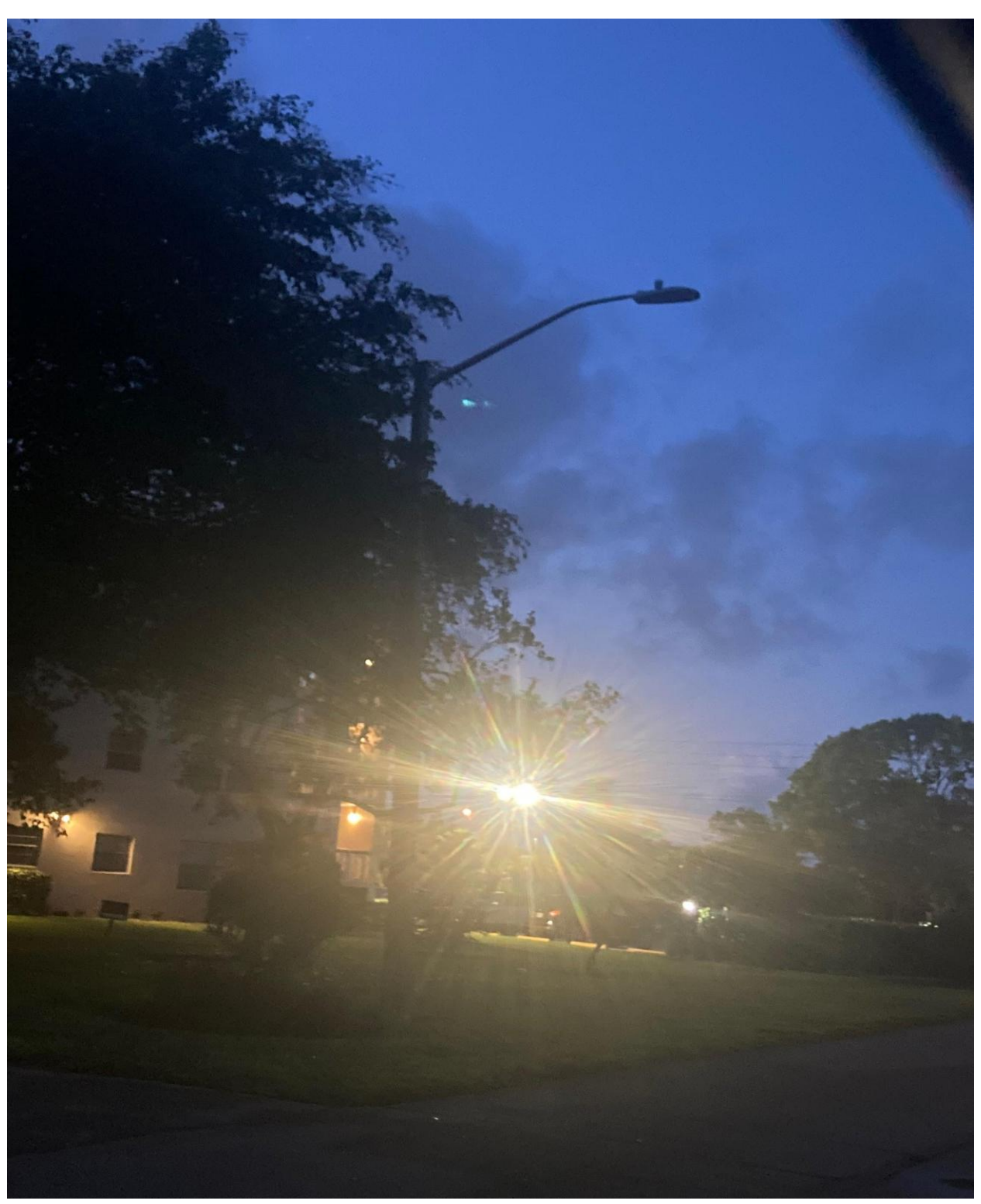
FAIRWAY STREET- THE STREETLIGHT, NEAR SOUTHAMPTON A, HAS BEEN REPORTED IN SEVERAL TIMES. A NEW COMPLAINT WAS SENT TO FPL, #47724.