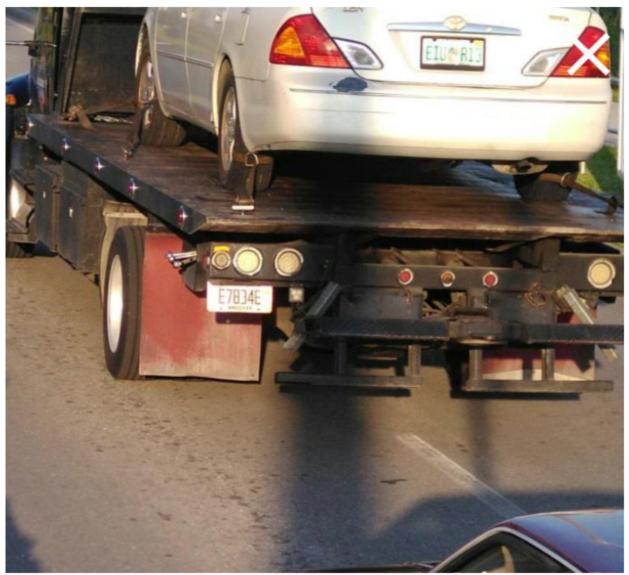
KINGSWOOD A- EXPIRED REGISTRATION CAR WAS REMOVED FROM CV ON 5/9.