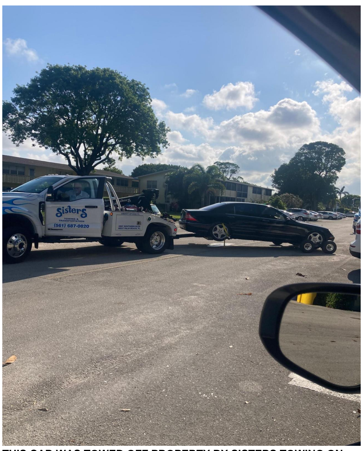
THIS CAR WAS TOWED OFF PROPERTY BY SISTERS TOWING ON 5/9. PBC CODE ENFORCEMENT WAS NOTIFIED SO THE VIOLATION NOTICE CAN BE CANCELLED.