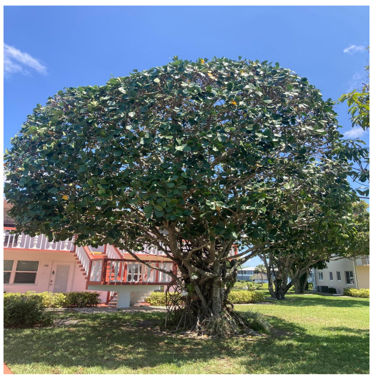
CHATHAM E- THIS IS CROWN REDUCTION AND THINNING, WHICH MAKES THE TREE LESS TOP-HEAVY AND ALLOWS WIND TO PASS THROUGH THE CANOPY. WHICH MEANS THE TREE IS LESS LIKELY TO BE BLOWN OVER IN A HURRICANE.