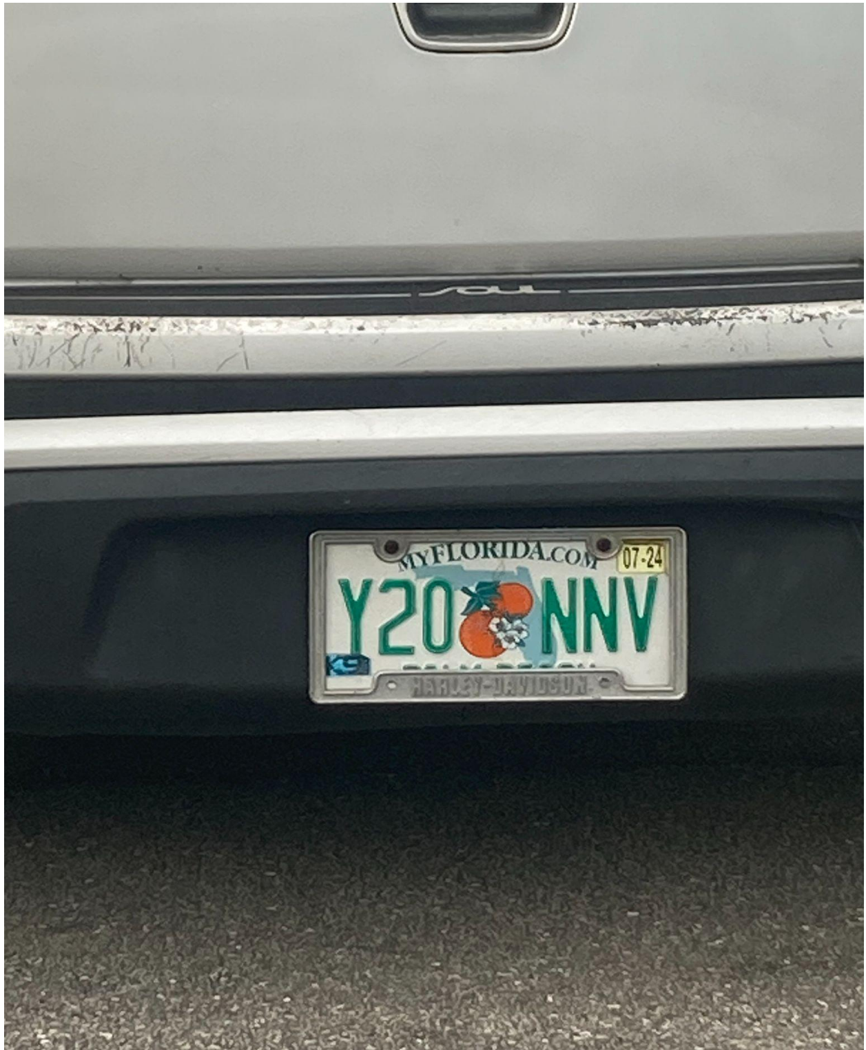
SALISBURY E- CAR WITH EXPIRED REGISTRATION TAG. REPORTED TO PBC CODE ENFORCEMENT, #C-2025-04210006.