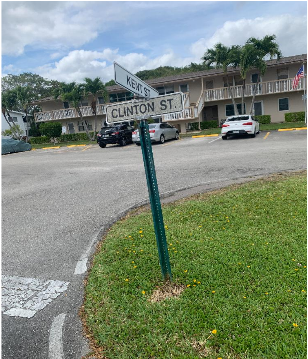
CHATHAM SECTION- MISSING STOP SIGN. WHEREVER THERE'S A WHITE STOP BAR, THERE SHOULD BE A STOP SIGN.