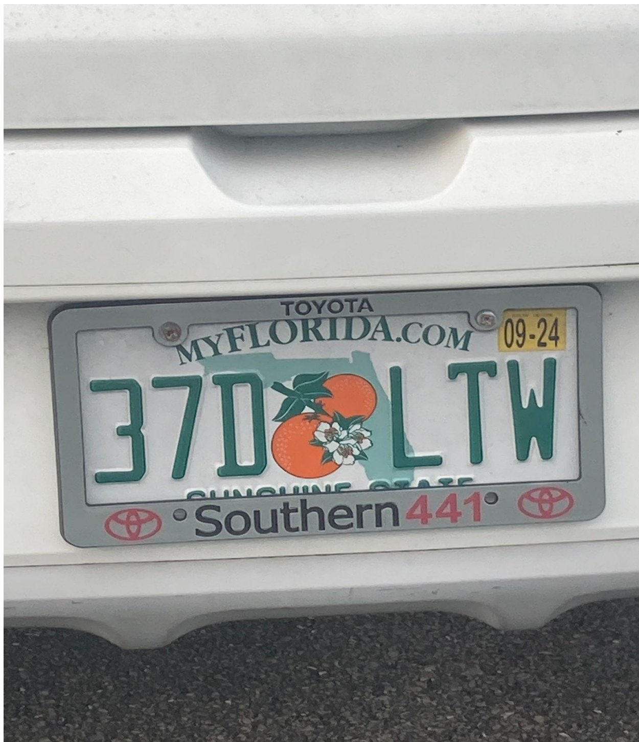
WALTHAM H- CAR WITH EXPIRED REGISTRATION TAG. REPORTED TO PBC CODE ENFORCEMENT, #C-2025-04210004.