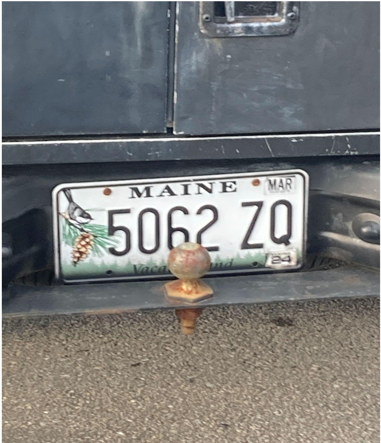
SALISBURY F- PICKUP TRUCK WITH EXPIRED REGISTRATION TAG. REPORTED TO PBC CODE ENFORCEMENT, #C-2025-04210005.