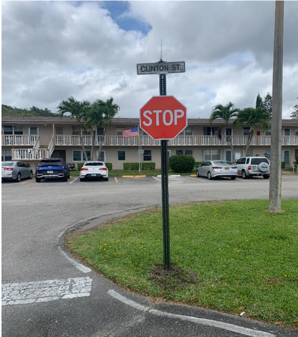
CHATHAM SECTION- CODE COMPLIANT STOP SIGN INSTALLED BY HANDYMAN JOSE ON 4/22.