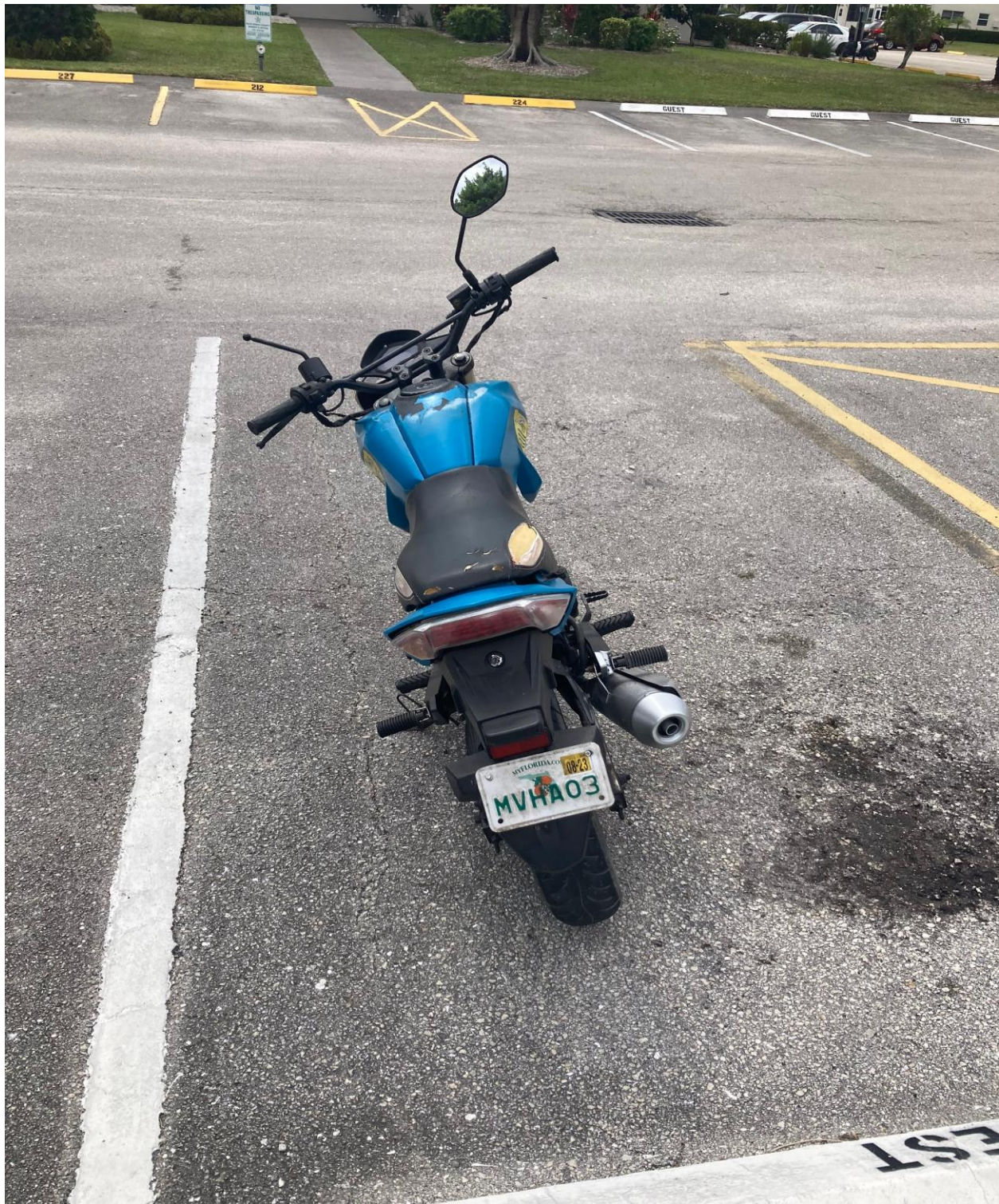
ANDOVER M- MOTORCYCLE WITH EXPIRED REGISTRATION TAG (2023). REPORTED TO PBC CODE ENFORCEMENT, #C-2025-04230022.