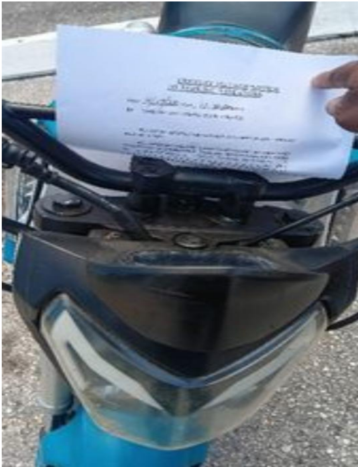
ANDOVER M- A TOW NOTICE WAS PUT ON THIS MOTORCYCLE ON 4/27.