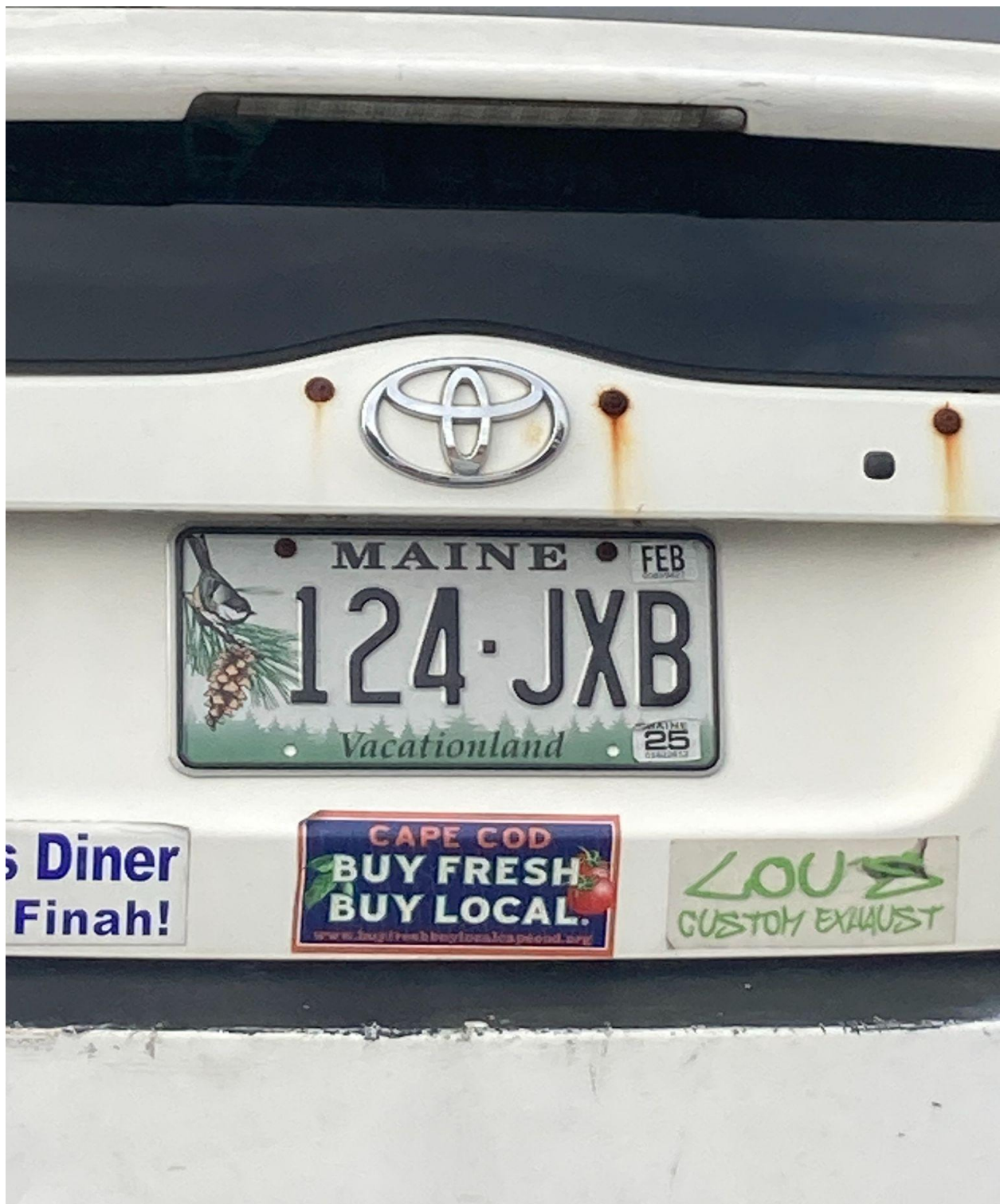
SALISBURY F- CAR WITH EXPIRED REGISTRATION TAG. REPORTED TO PBC CODE ENFORCEMENT, #C-2025-04210006.