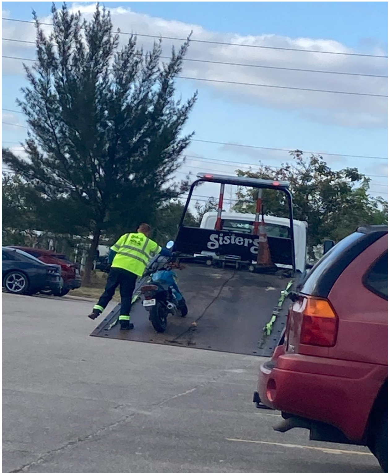
ANDOVER M- UNREGISTERED MOTORCYCLE REMOVED FROM CV BY SISTERS TOWING ON 4/28.