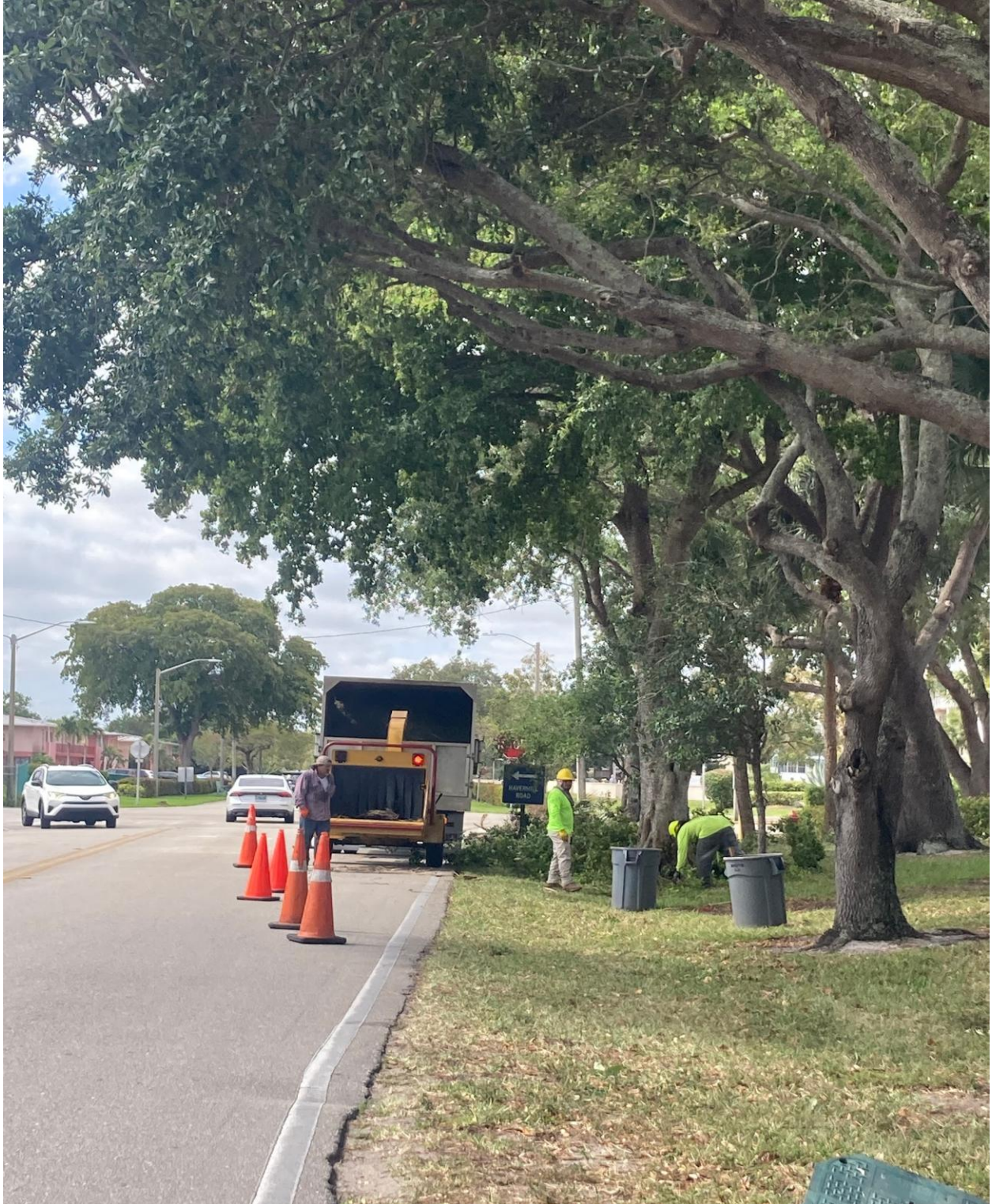
EAST DRIVE- REQUELME TREE SERVICE CONTINUES TREE TRIMMING ON UCO OWNED PROPERTY.