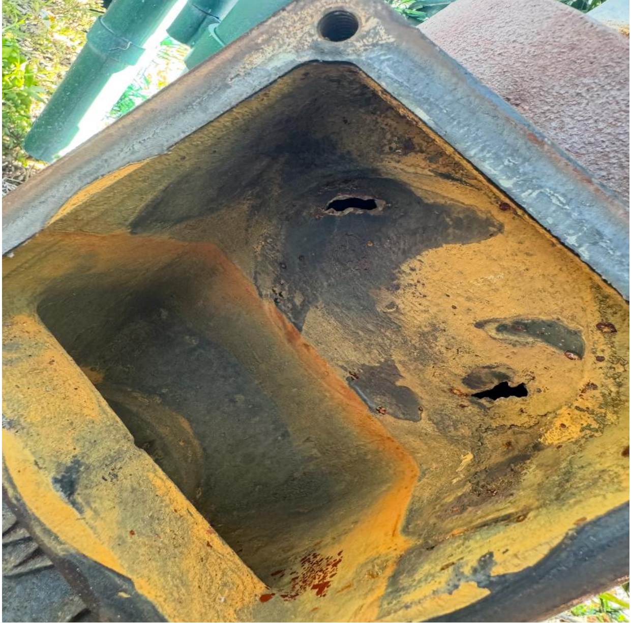
NORWICH SECTION- THE TWO HOLES AT THE BOTTOM OF THIS IRRIGATION PUMP ARE THE REASON FOR THE PUMP'S FAILURE TO PRIME.