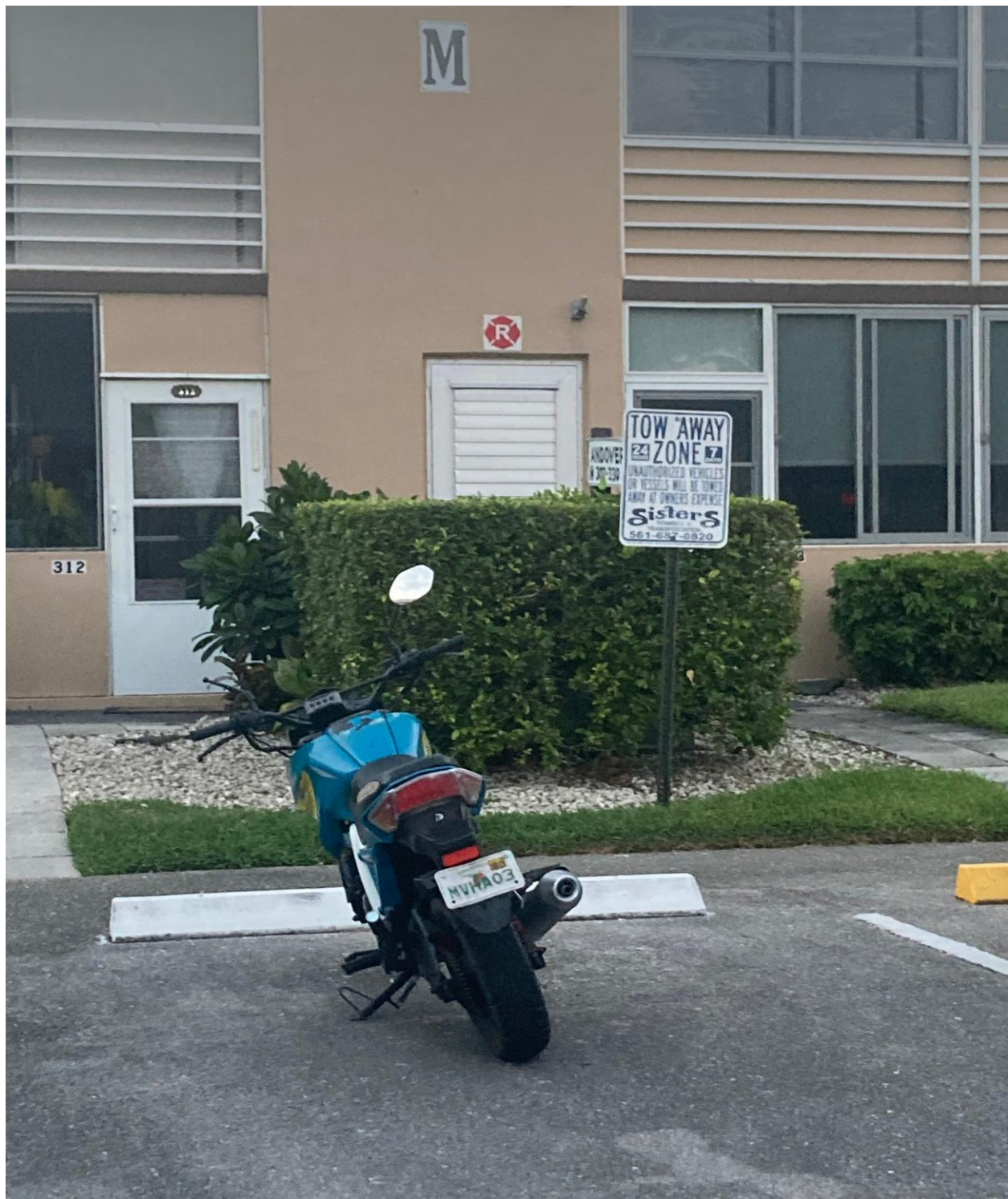
ANDOVER M- MOTORCYCLE WAS MOVED TO A DIFFERENT SPOT OVERNIGHT. NOTE SISTERS TOWING SIGN.