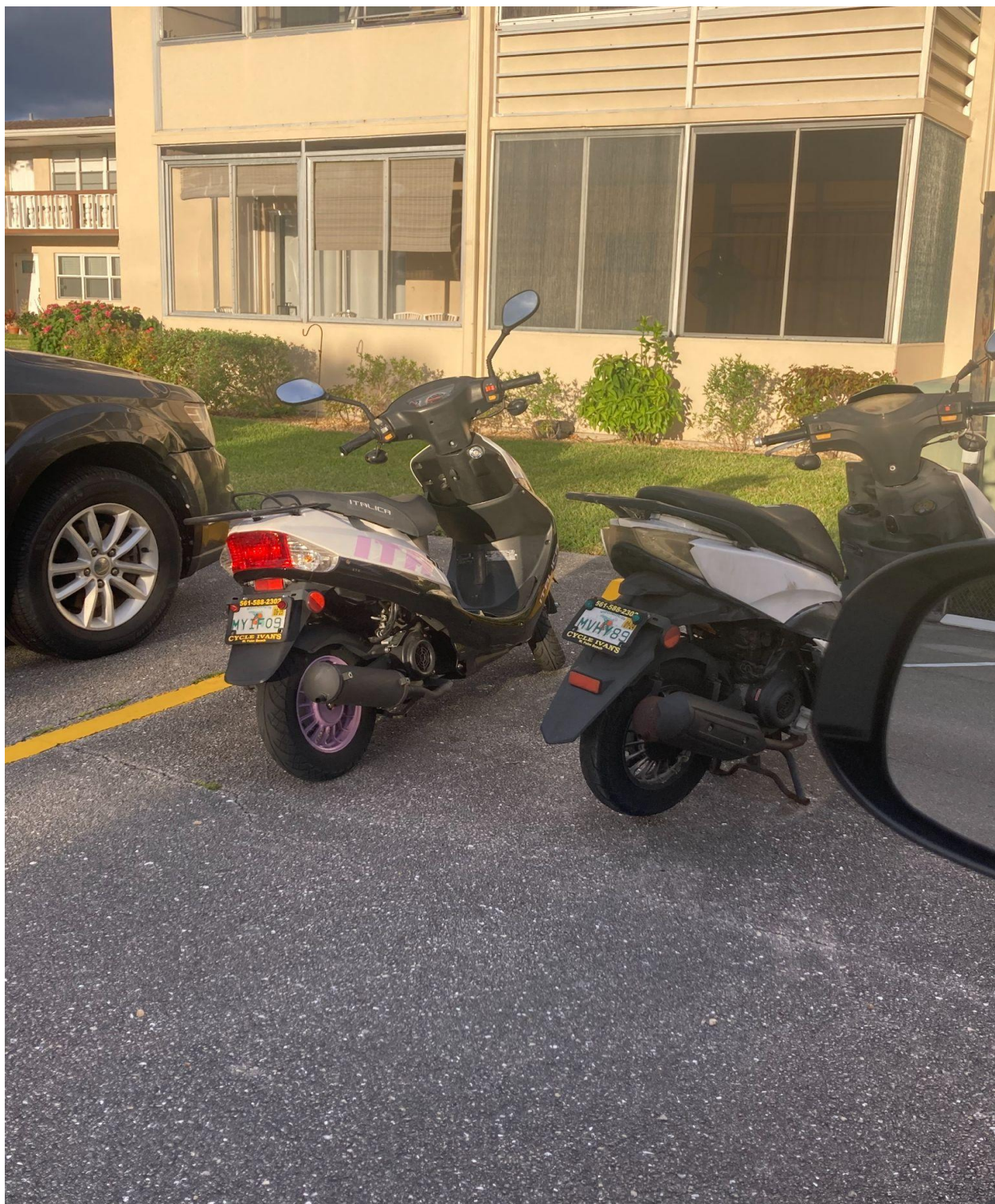
EASTHAMPTON I- TWO SCOOTERS WITH EXPIRED REGISTRATION TAGS (2023, 2024). REPORTED TO PBC CODE ENFORCEMENT, #C-2025-04210002.