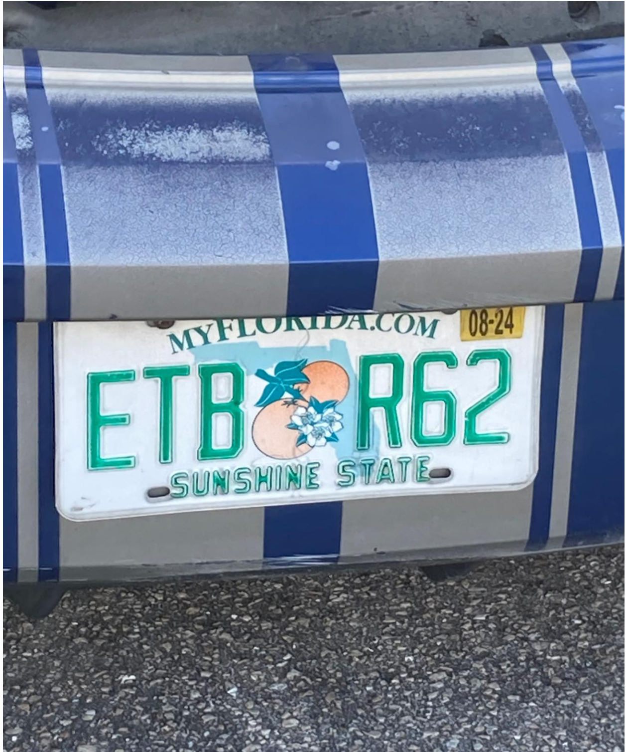
ANDOVER I- CAR WITH EXPIRED REGISTRATION TAG. A REPORT WAS SENT TO PBC CODE ENFORCEMENT, # C-2025-04210009.