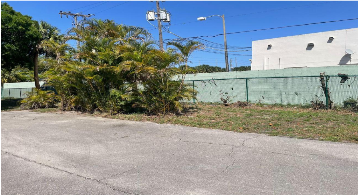
SOUTHAMPTON SECTION- LAST WEEK, SEACREST SERVICES CLEARED WEEDS AND BRUSH FROM THE STRIP BETWEEN THE MASONRY WALL AND THE PERIMETER FENCE.