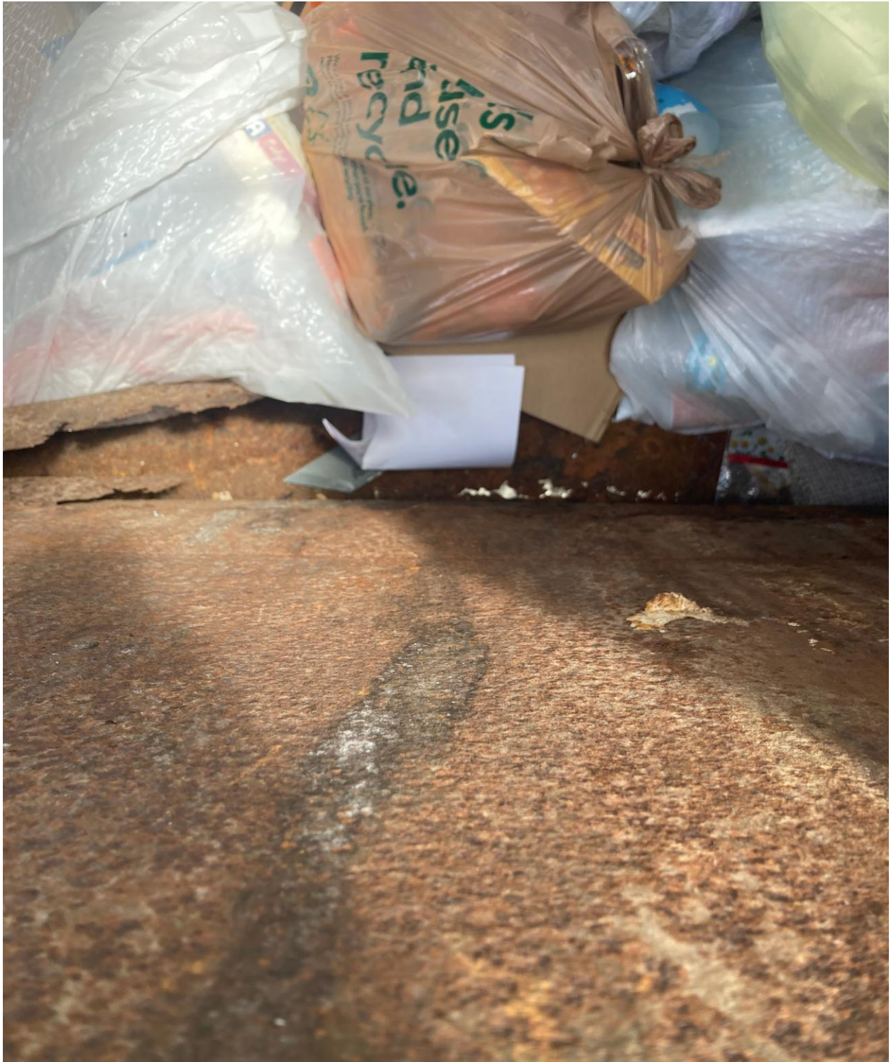
NORTHAMPTON E- DUMPSTER WITH A ROTTED-OUT BOTTOM. REPORTED IN BY A CV UNIT OWNER. A REQUEST FOR REPLACEMENT WAS SENT TO WASTE PRO.