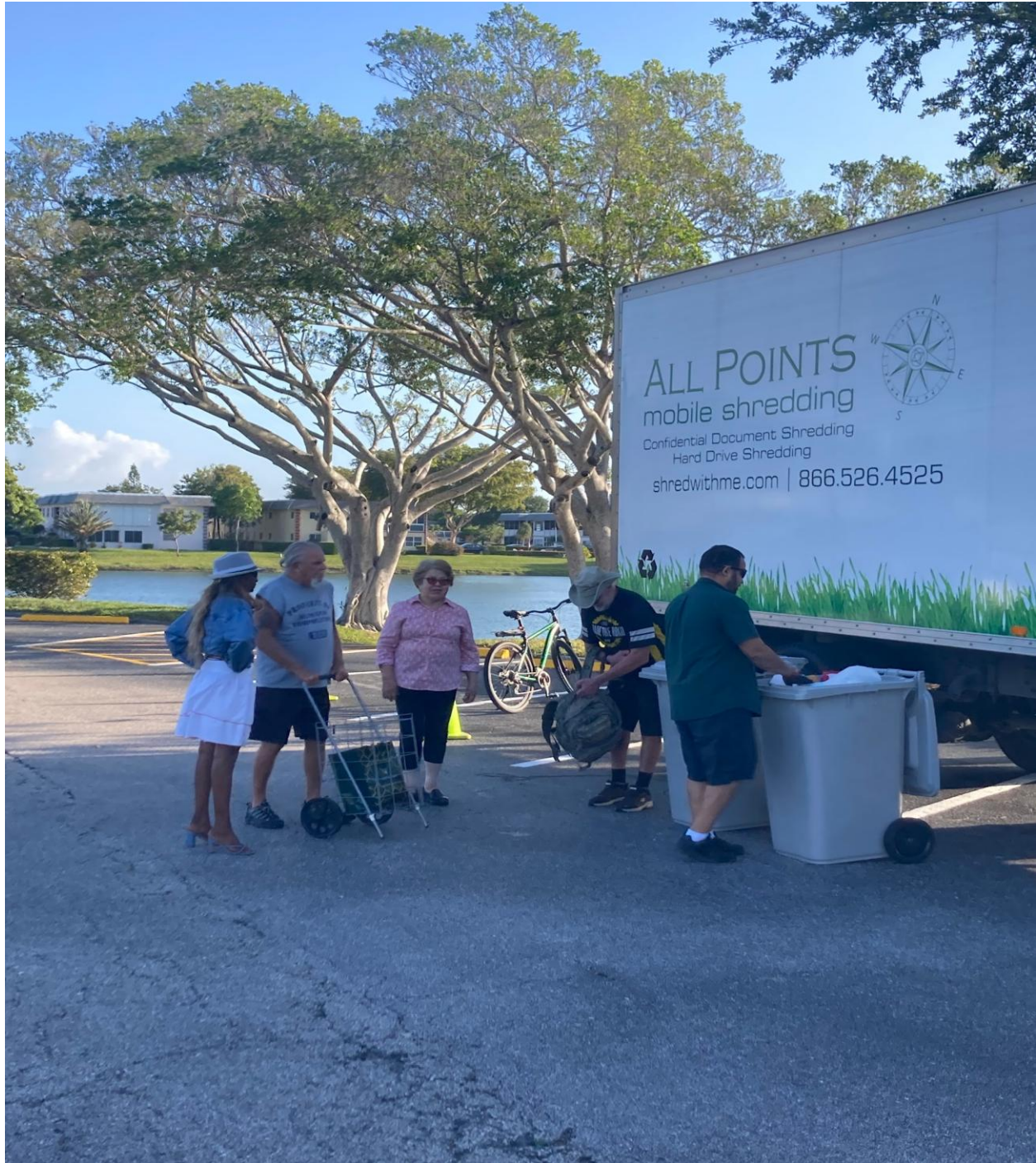
CV CLUBHOUSE- ON 4/4, CV RESIDENTS BROUGHT THEIR DOCUMENTS TO ALL POINTS MOBILE SHREDDING FOR SECURE DESTRUCTION. A CERTIFICATE OF DESTRUCTION WAS PROVIDED TO UCO BY THE VENDOR.