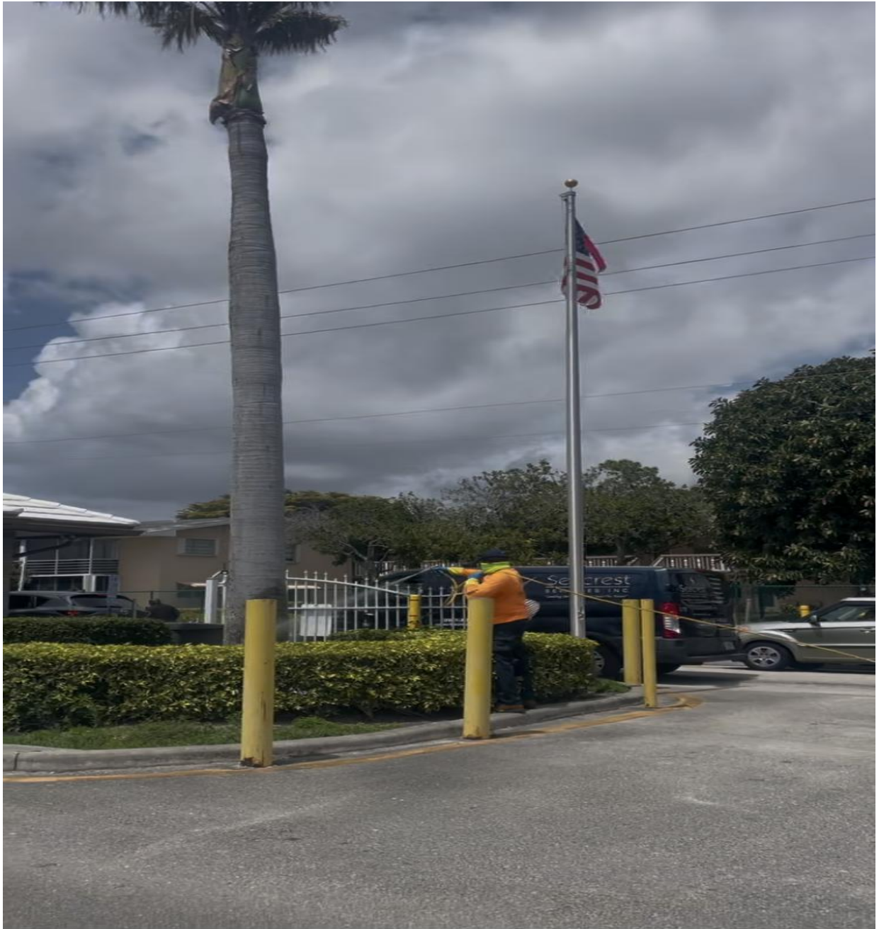
CENTURY BOULEVARD- LAST WEEK, SEACREST SERVICES TREATED ALL ROYAL PALMS ON UCO PROPERTY WITH PESTICIDE AND FERTILIZER. THIS PARTICULAR PALM IS DEAD AND IS SCHEDULED FOR REMOVAL.