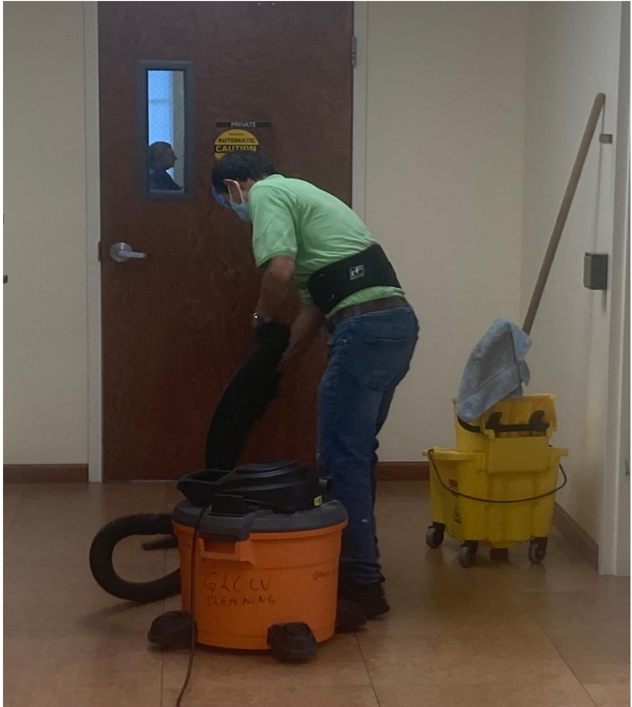
UCO OFFICE- GLOW CLEANING PLUS PERFORMED DEEP CLEANING AT THE UCO OFFICE ON 4/6.