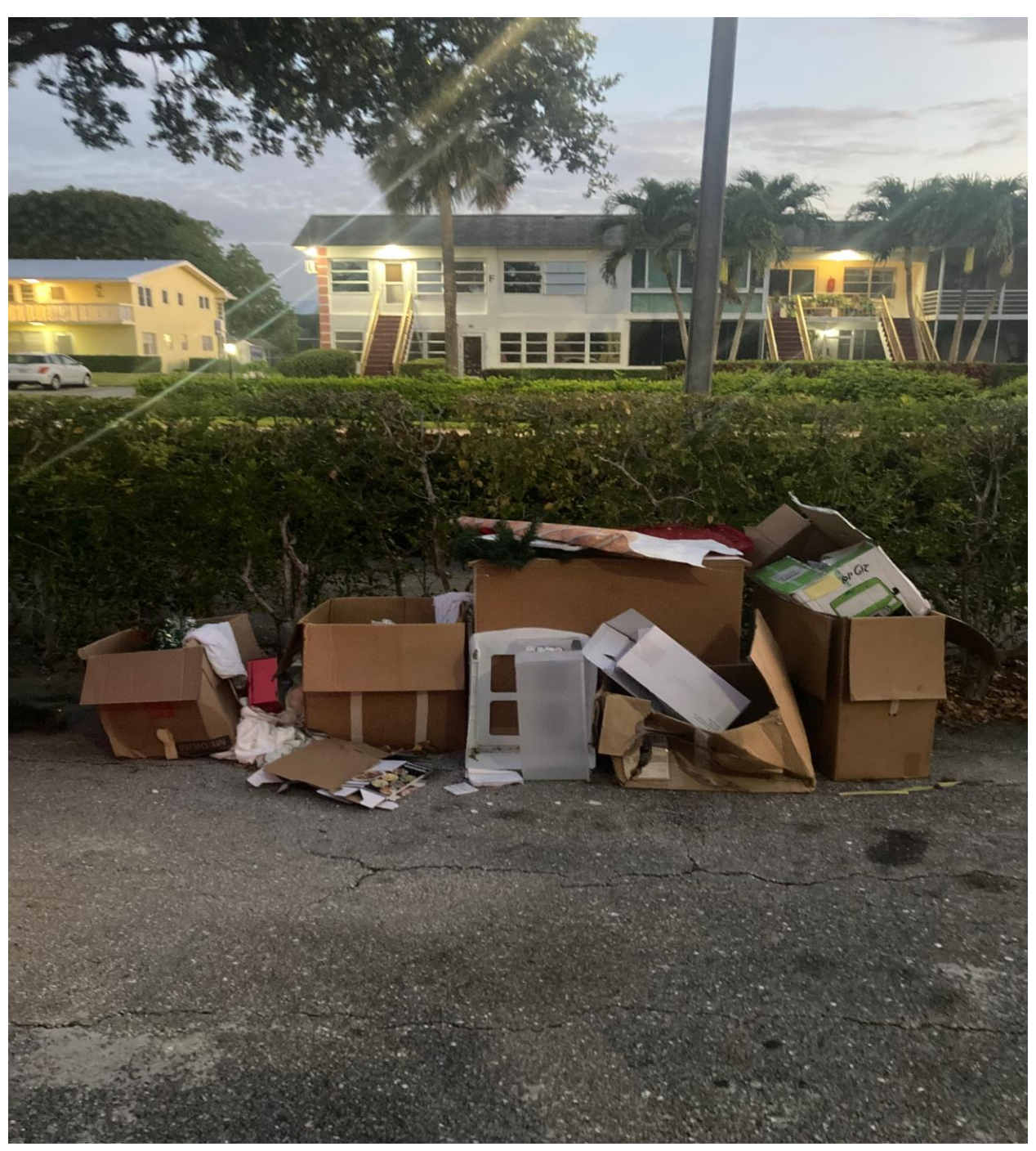
STRATFORD I- PILES OF LOOSE JUNK WILL NOT BE PICKED UP BY WASTE PRO AS PART OF THEIR WEEKLY BULK TRASH SERVICE. THIS PILE OF JUNK WILL NEED TO BE CONTAINERIZED, BY PUTTING IT INTO THE DUMPSTER OR INTO PLASTIC BAGS.