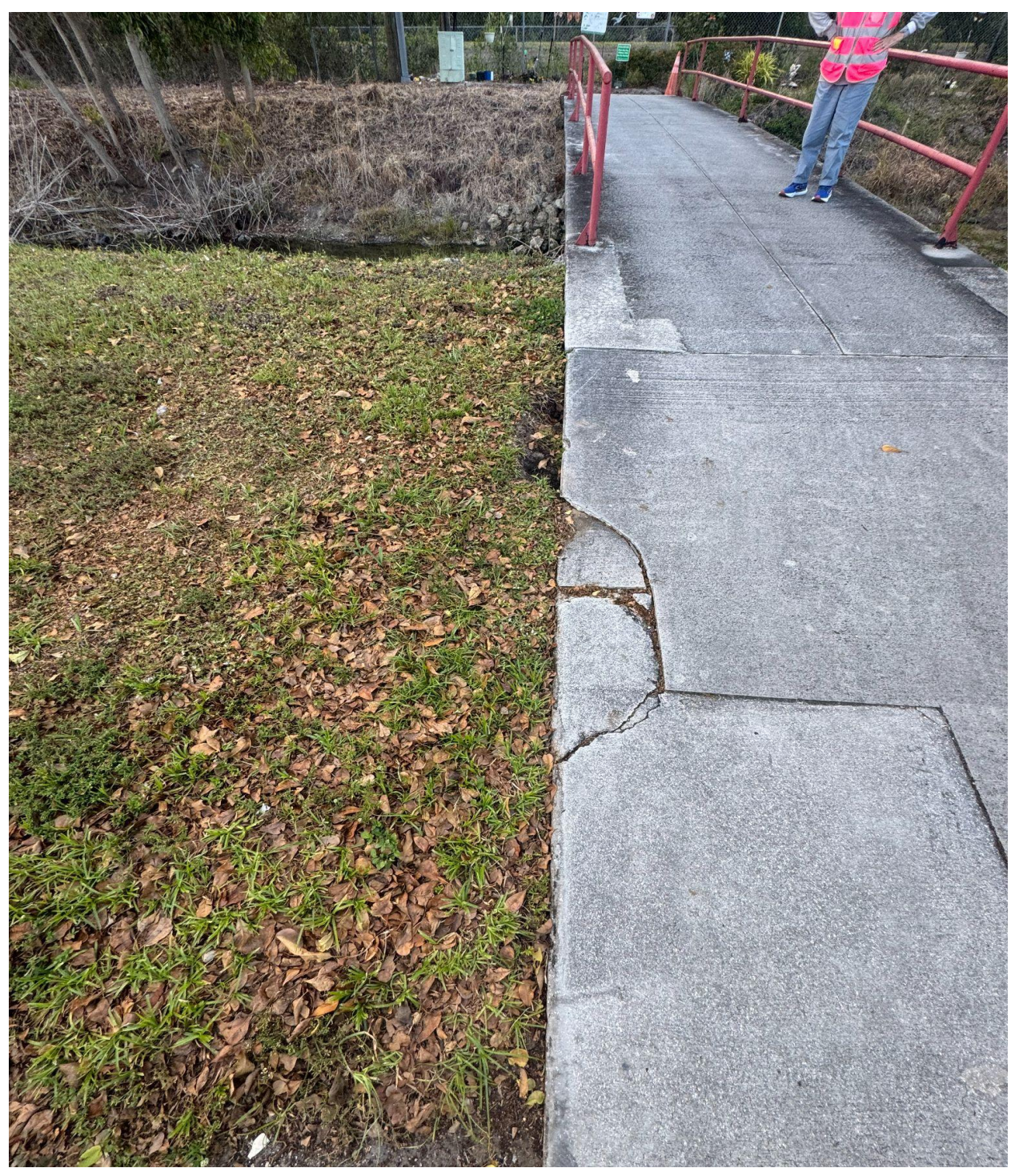
DORCHESTER/HASTINGS FOOTBRIDGE- A CV UNIT OWNER REPORTED SEEING RATS GOING IN AND OUT OF THE HOLE TO THE RIGHT OF THIS WALKWAY. HULETT WILL INSTALL ADDITIONAL RODENT BAIT BOXES AREA THIS AREA THIS WEEK.