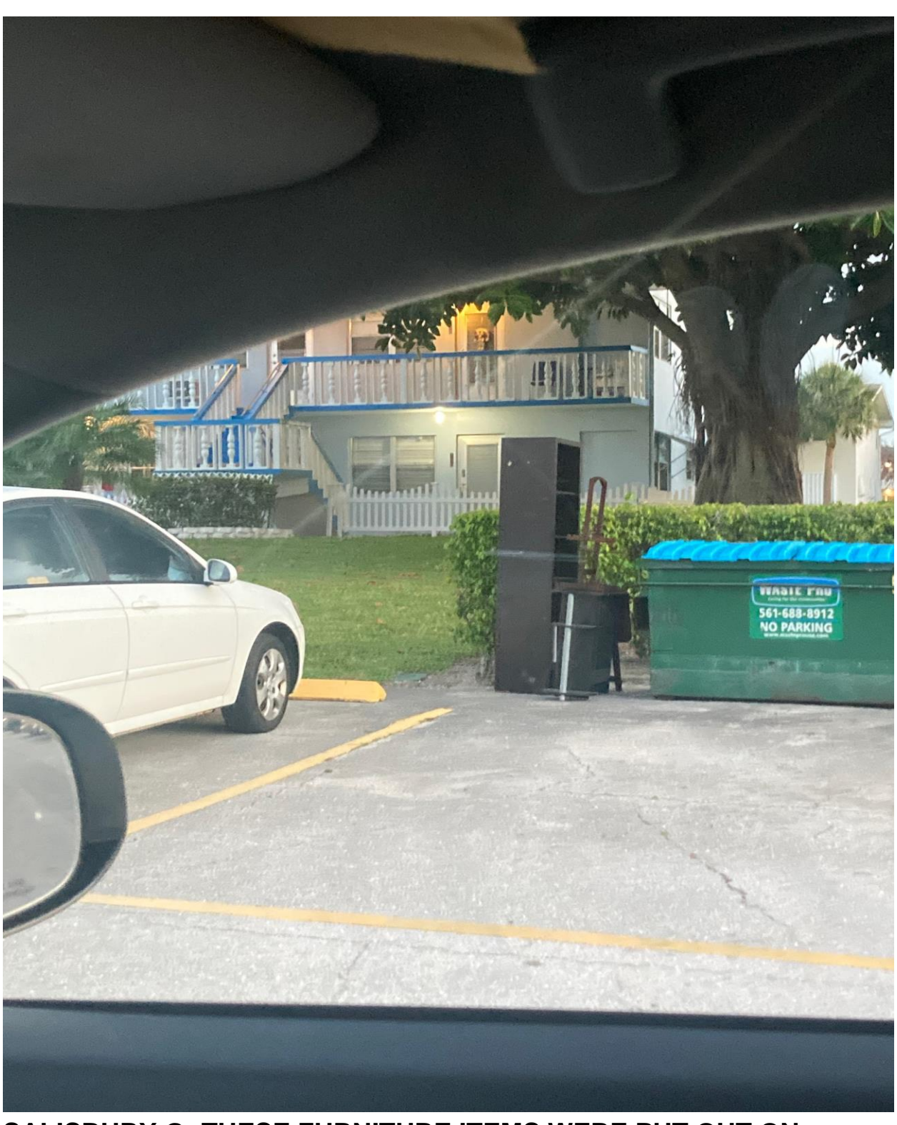
SALISBURY G- THESE FURNITURE ITEMS WERE PUT OUT ON FRIDAY, AFTER THE BULK TRASH TRUCK HAD PASSED BY. WASTE PRO MADE A COURTESY PICKUP OF THIS ITEM ON SATURDAY.