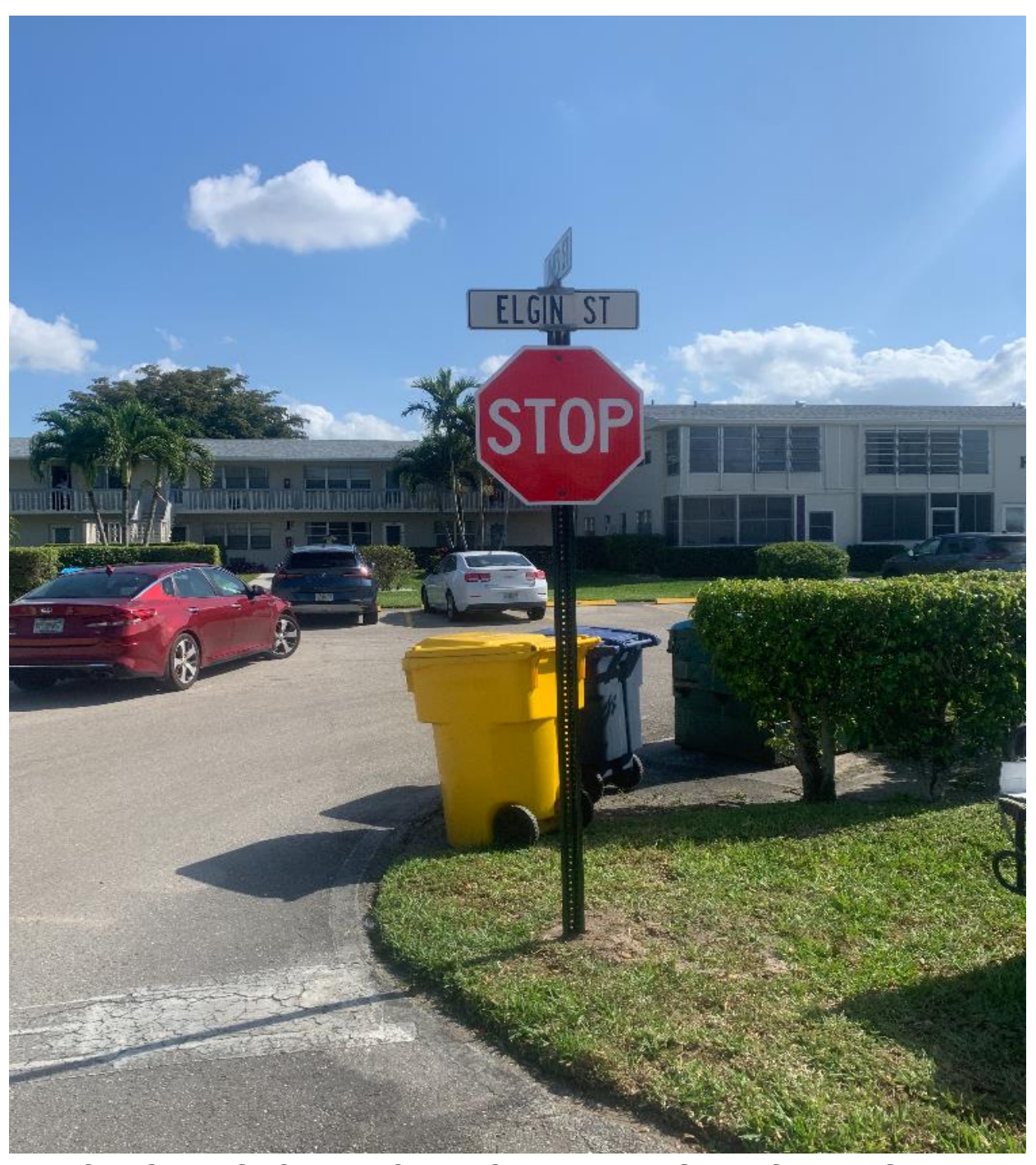
DORCHESTER SECTION- CODE COMPLIANT STOP SIGN INSTALLED BY HANDYMAN JOSE. THE STOP BAR WILL NEED TO BE REPAINTED AS WELL.