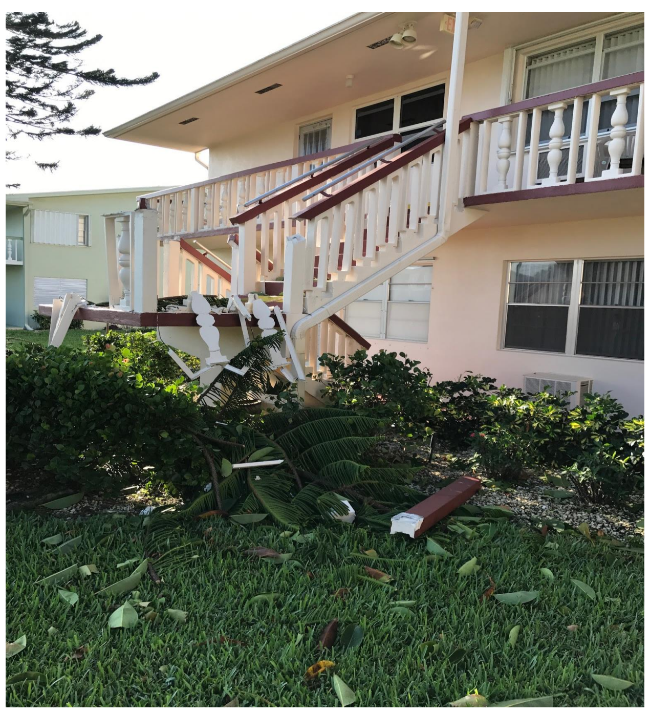
NORWICH SECTION- THE 2017 HURRICANE KNOCKED OVER A BIG NORFOLK PINE WHICH DAMAGED A STAIRCASE. IN THAT STORM, THERE WERE QUITE A FEW MAJOR DAMAGES CAUSED BY MASSIVE TREES THAT WERE TOO CLOSE TO BUILDINGS.