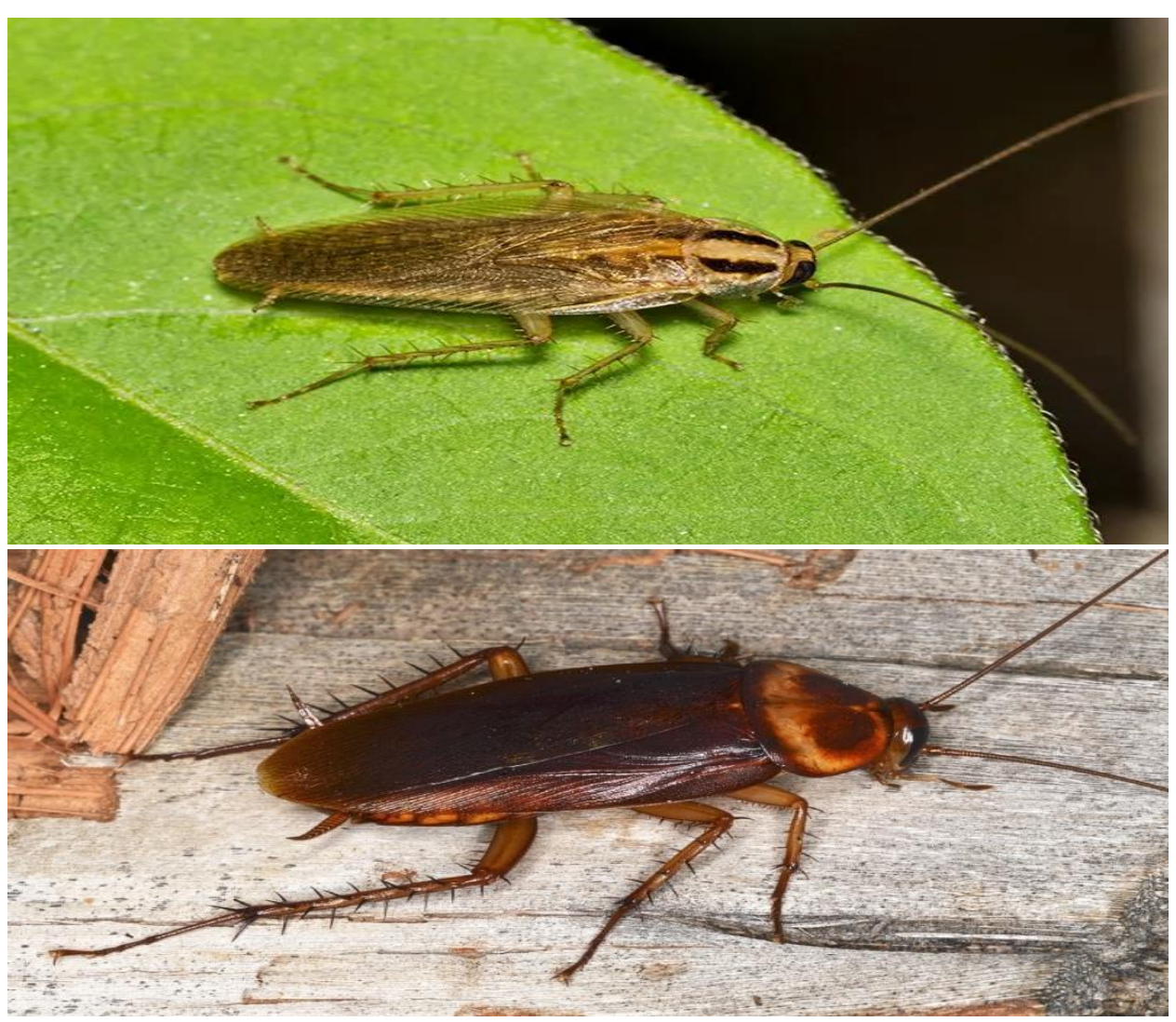
ROACHES- GERMAN COCKROACH AT TOP, PALMETTO BUG AT BOTTOM. PALMETTO BUGS ARE LARGER AND MOSTLY LIVE OUTDOORS BUT WILL ENTER A BUILDING TO FIND WATER OR FOOD. BOTH ARE GROSS, BUT PEST CONTROL CAN HANDLE THEM.