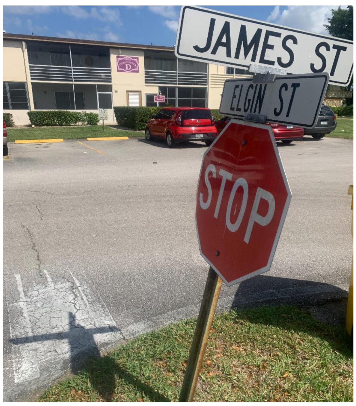
DORCHESTER SECTION- ANOTHER MIDGET STOP SIGN WITH A FADED STOP BAR.