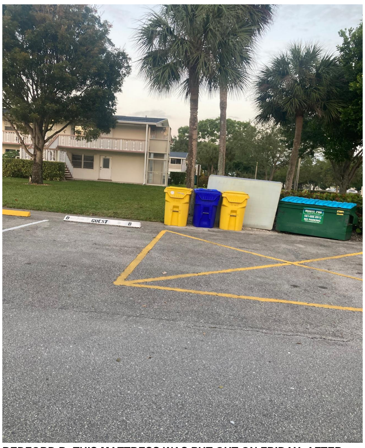
BEDFORD B- THIS MATTRESS WAS PUT OUT ON FRIDAY, AFTER THE BULK TRASH TRUCK HAD PASSED BY. WASTE PRO MADE A COURTESY PICKUP OF THIS ITEM ON SATURDAY.