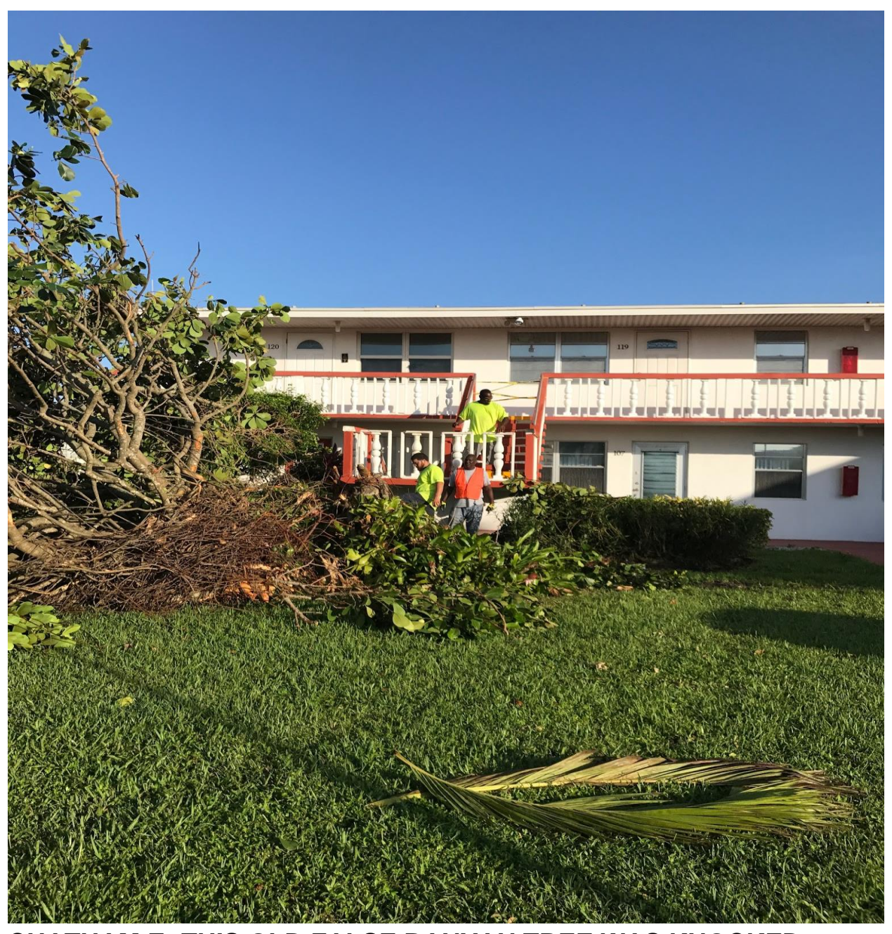
CHATHAM E- THIS OLD FALSE BANYAN TREE WAS KNOCKED DOWN DURING A 2017 HURRICANE AND DAMAGED ONE OF OUR STAIRCASES.