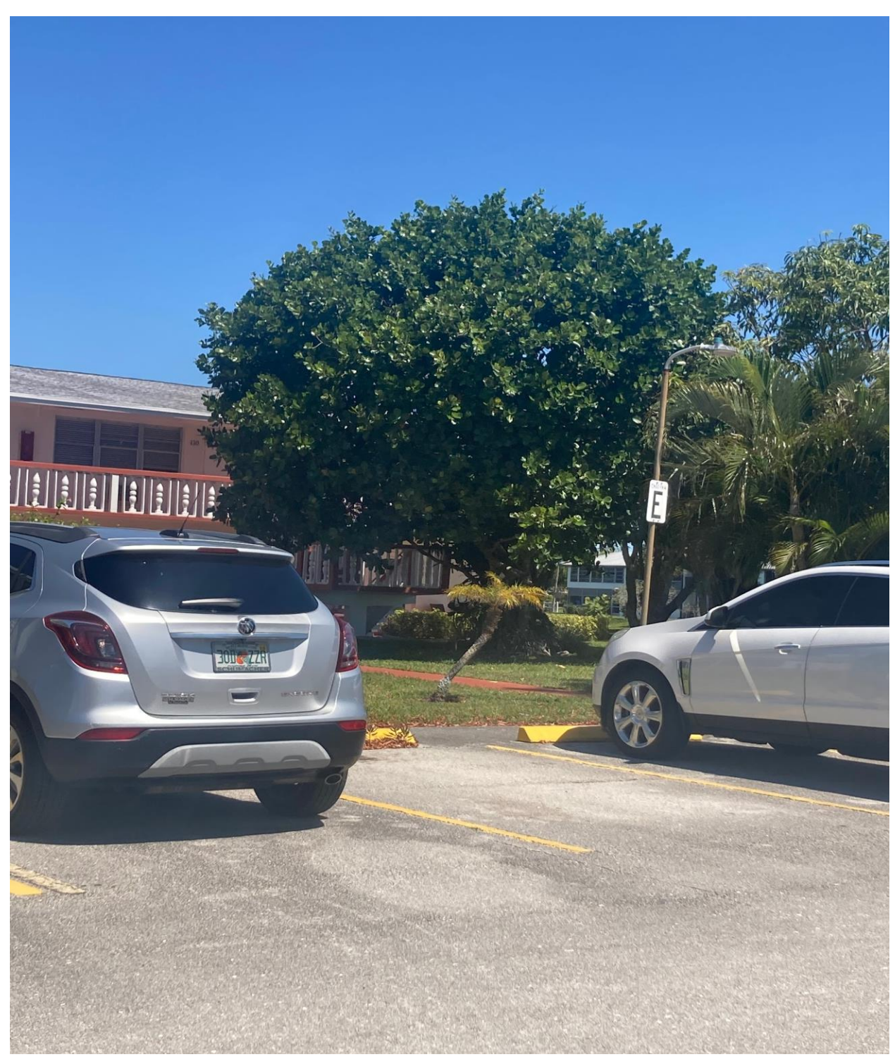
CHATHAM E- AS MUCH AS WE ALL LOVE THIS FALSE BANYAN TREE, IT IS A MONSTER THAT CAN FALL ON OUR BUILDING. A DECISION WILL BE MADE THIS WEEK TO EITHER SEVERELY PRUNE OR REMOVE THIS TREE.