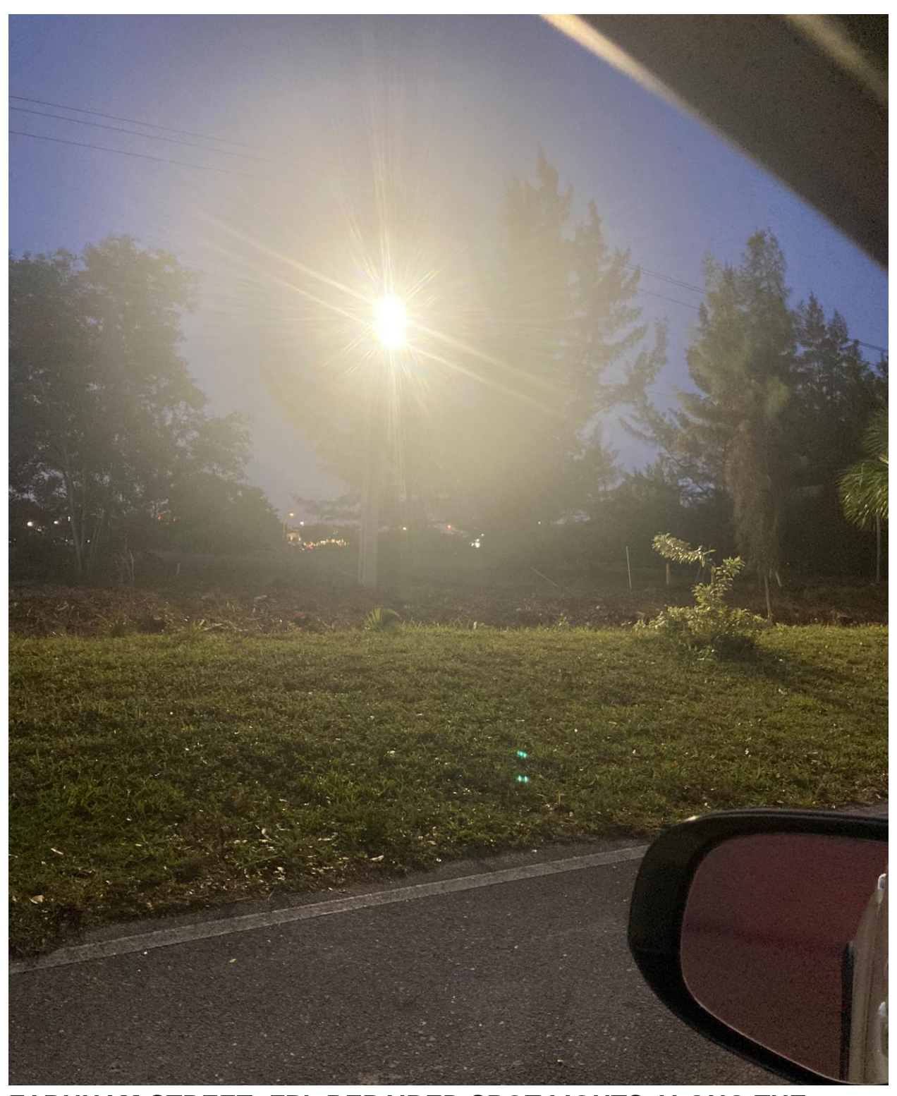
FARNHAM STREET- FPL REPAIRED SPOT LIGHTS ALONG THE SOUTH SIDE OF SOUTH CANAL. MORE STREET LIGHTS WILL BE REPAIRED SOON.