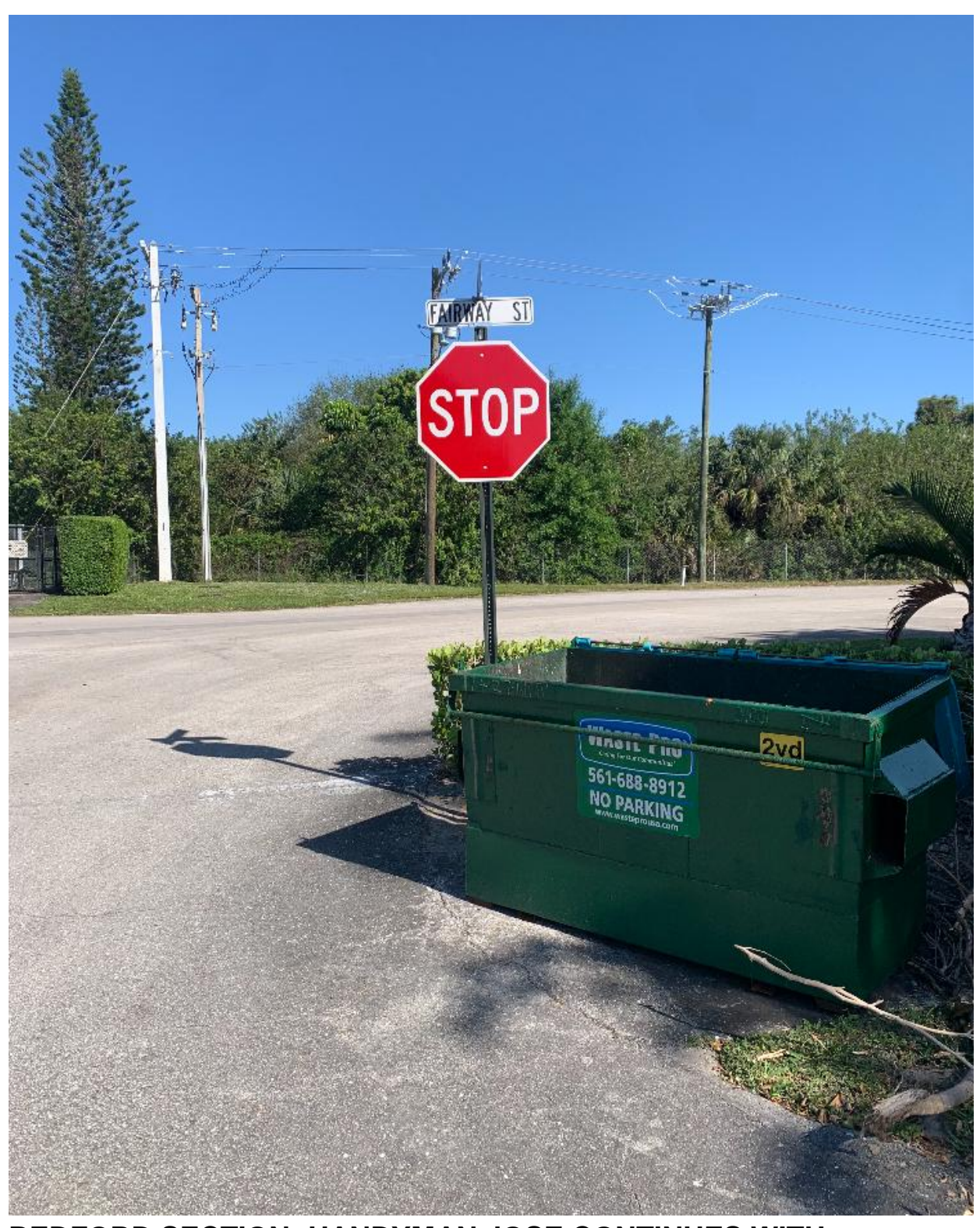
BEDFORD SECTION- HANDYMAN JOSE CONTINUES WITH REPLACEMENT OF WEATHERED AND NON-COMPLIANT STOP SIGNS.