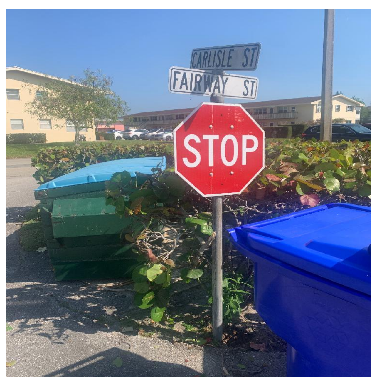
BEDFORD SECTION- ANOTHER MIDGET STOP SIGN.