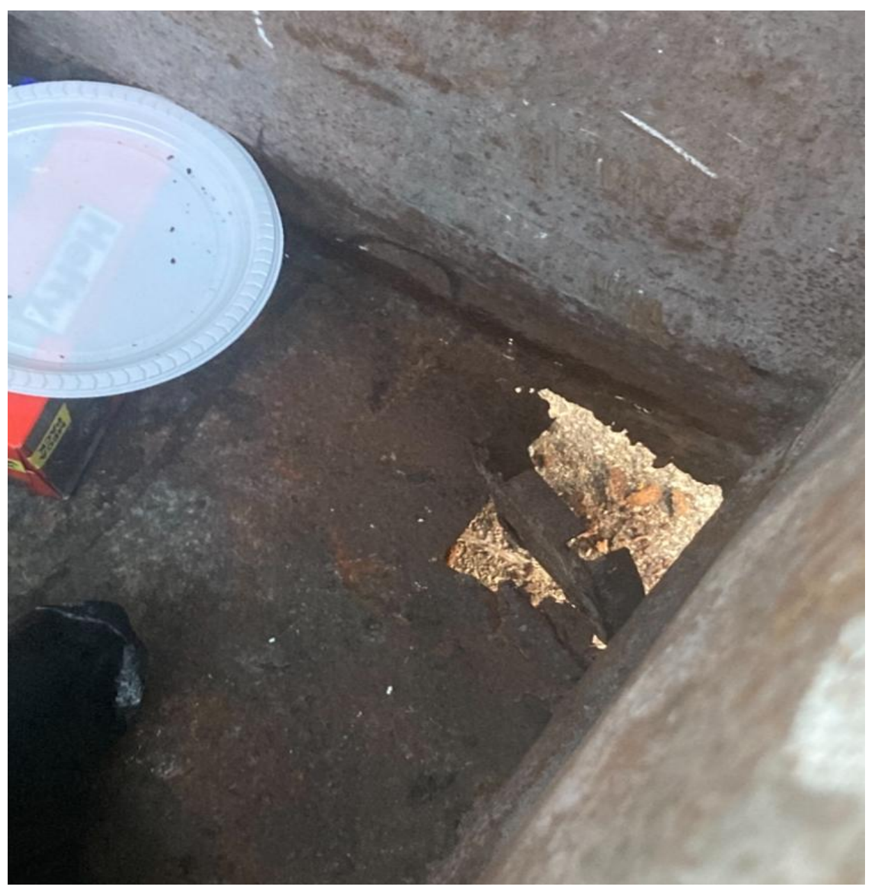
STRATFORD D- BIG HOLE AT THE BOTTOM OF THIS DUMPSTER. A REQUEST FOR REPLACEMENT WAS SENT TO WASTE PRO.