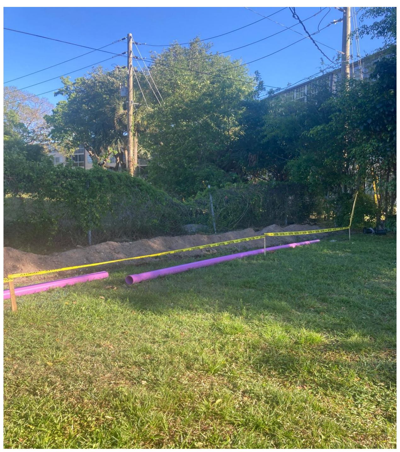
FAIRWAY STREET, SOUTHAMPTON SECTION- SEACREST SERVICES IS INSTALLING NEW UNDERGROUND IRRIGATION WATER SUPPLY PIPES, REPLACING PIPE THAT WERE PREVIOUSLY INSTALLED ON THE REFLECTION BAY PROPERTY.