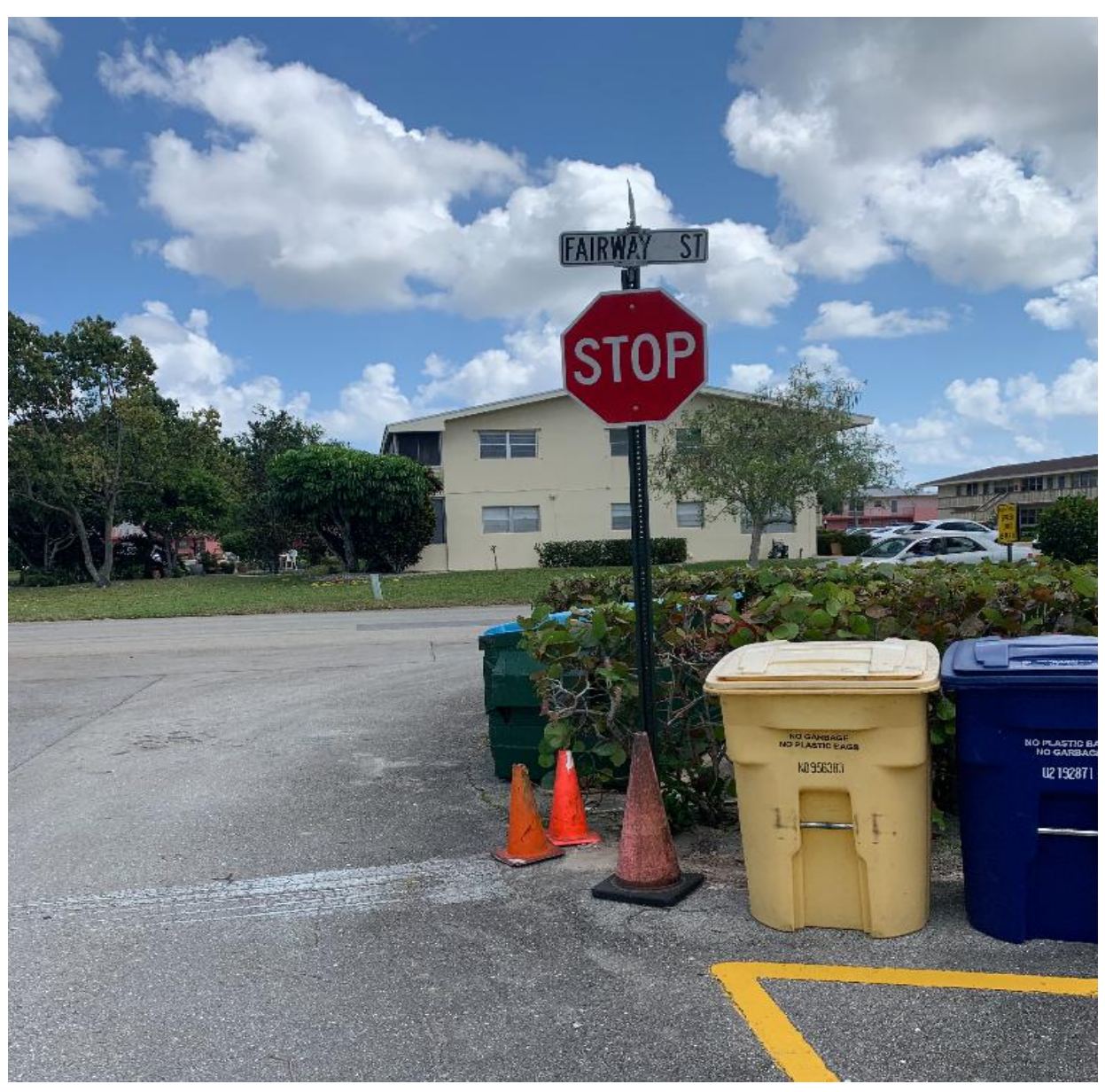
BEDFORD SECTION- CODE COMPLIANT STOP SIGN AND POLE INSTALLED BY HANDYMAN JOSE. NOTE TO DONALD, ORDER MORE POLES AND SIGNS.