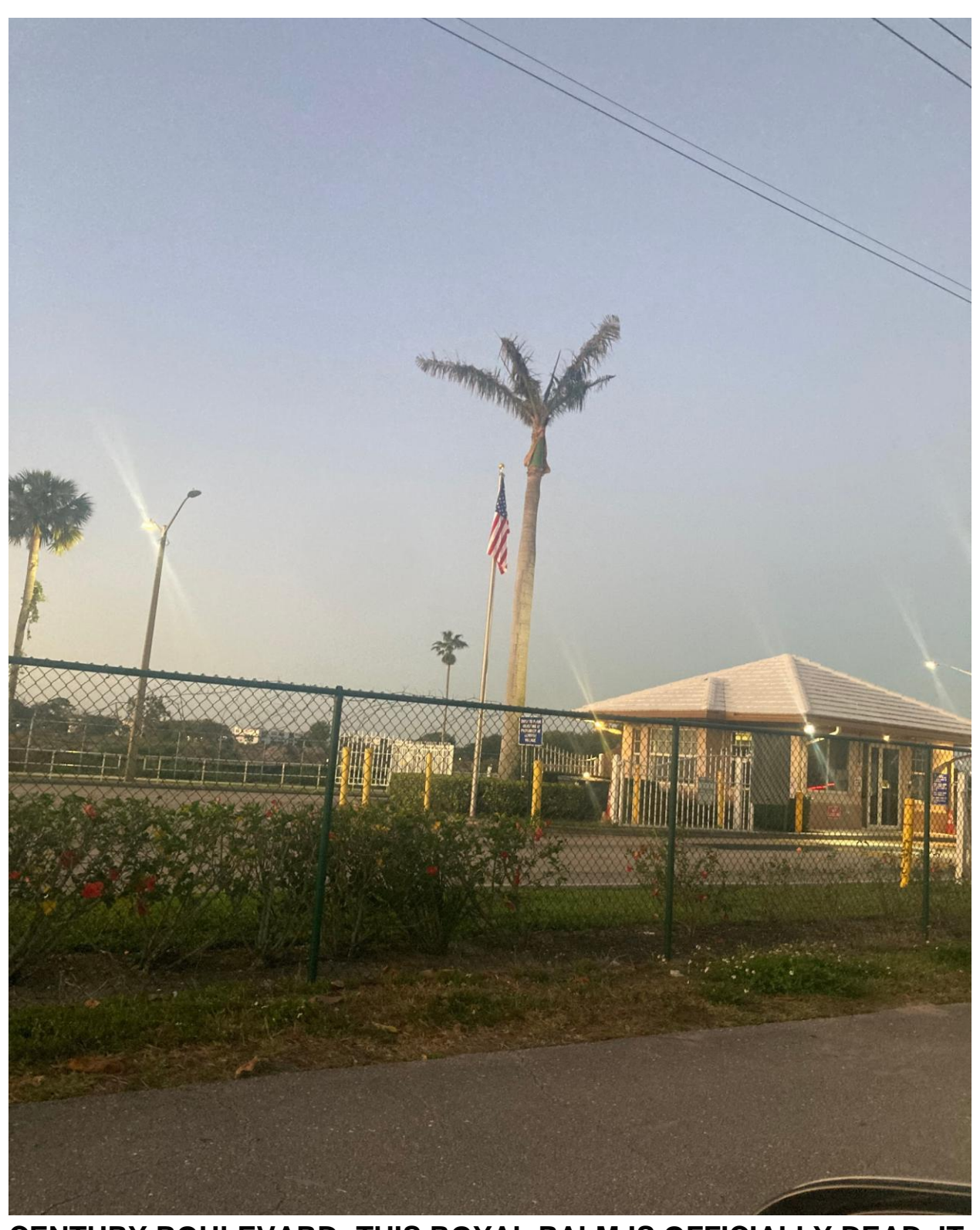
CENTURY BOULEVARD- THIS ROYAL PALM IS OFFICIALLY DEAD. IT WILL BE REMOVED SOON.