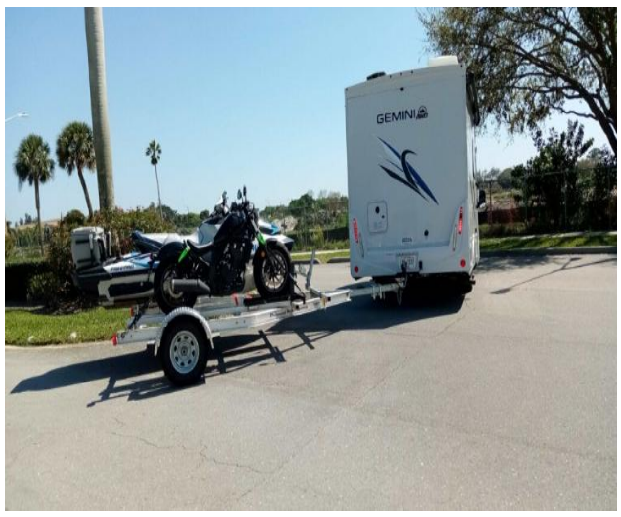
CENTURY BOULEVARD- THIS RV, JET SKI AND MOTORCYCLE WAS TURNED AROUND ON 3/13. THESE THINGS ARE NOT ALLOWED TO ENTER CV.