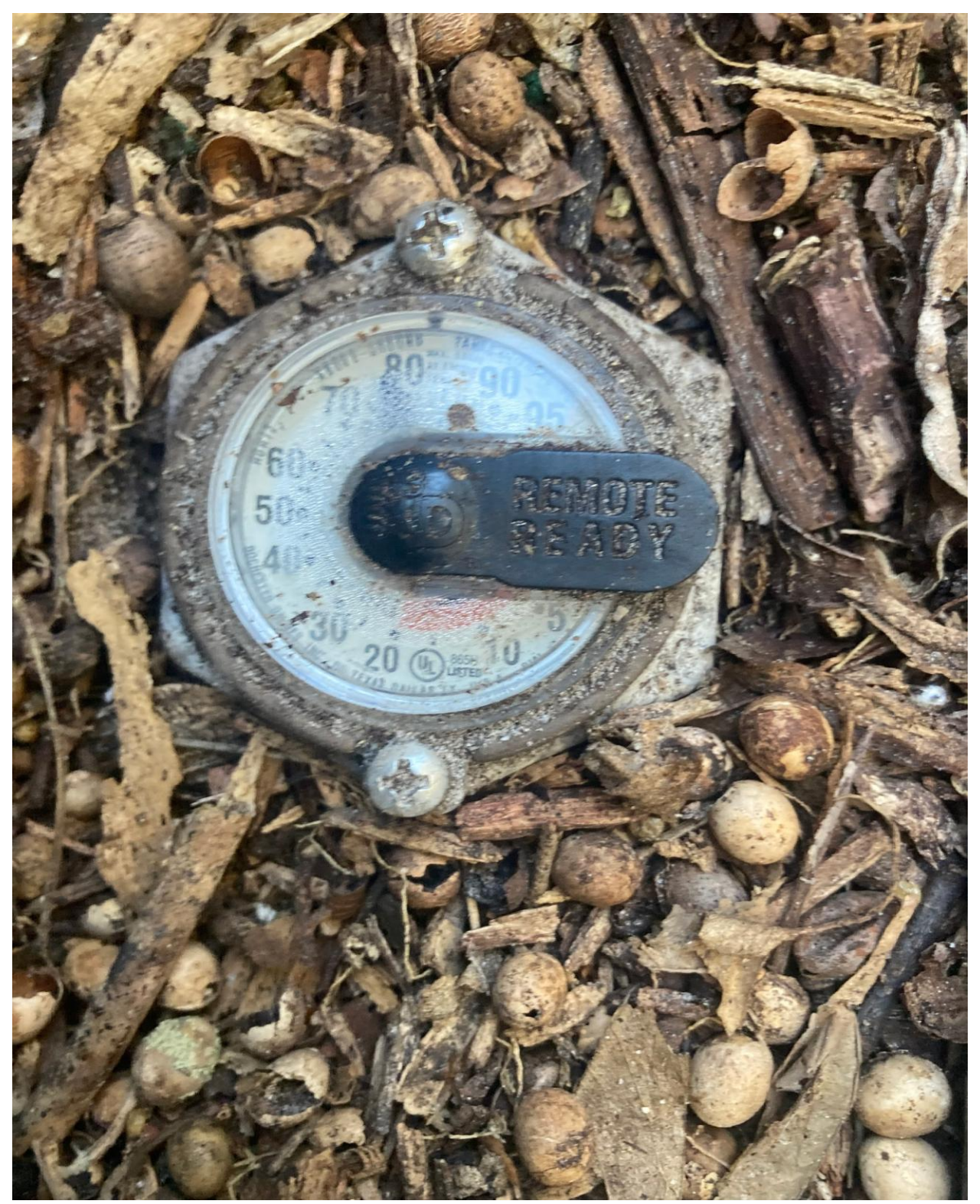
OKEECHOBEE BOULEVARD GUARDHOUSE- FUEL SUPPLY FOR THE EMERGENCY GENERATOR WAS CHECKED, 400 GALLONS.