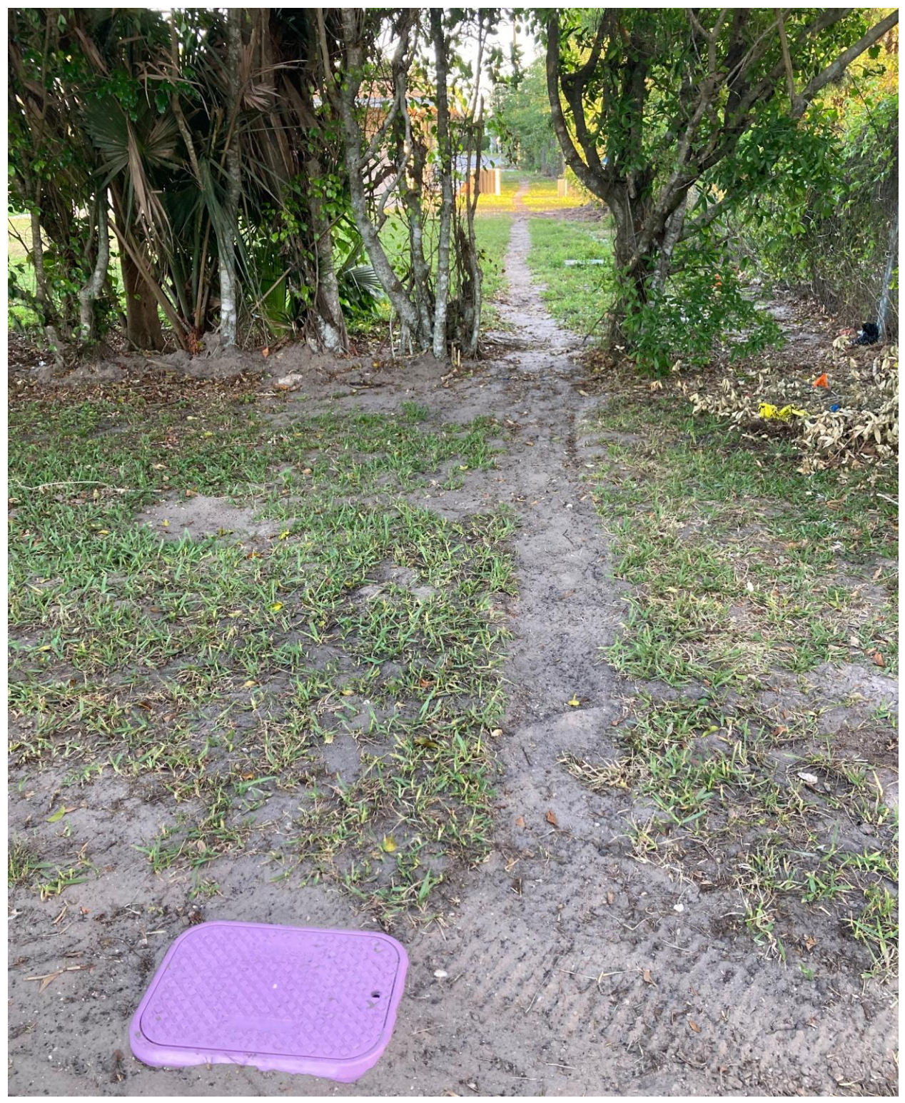
SOUTHAMPTON A- IRRIGATION LINE INSTALLATION COMPLETE.