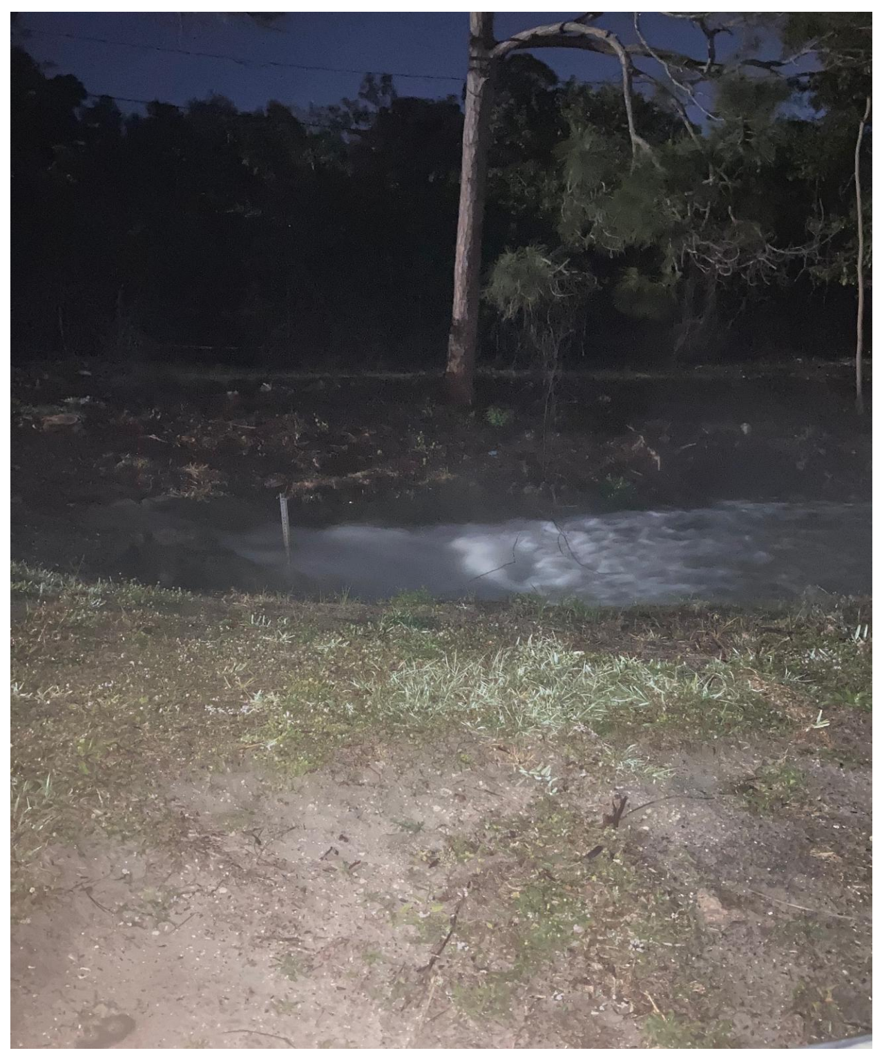
NORTH CANAL- PBC WATER CONTINUES TO SEND A SUPPLY OF RECLAIMED WATER INTO OUR WATERWAYS. THIS HELPS WITH KEEPING OUR LAKES FROM COMPLETELY DRYING OUT, BUT ONLY RAIN CAN REFILL THEM.