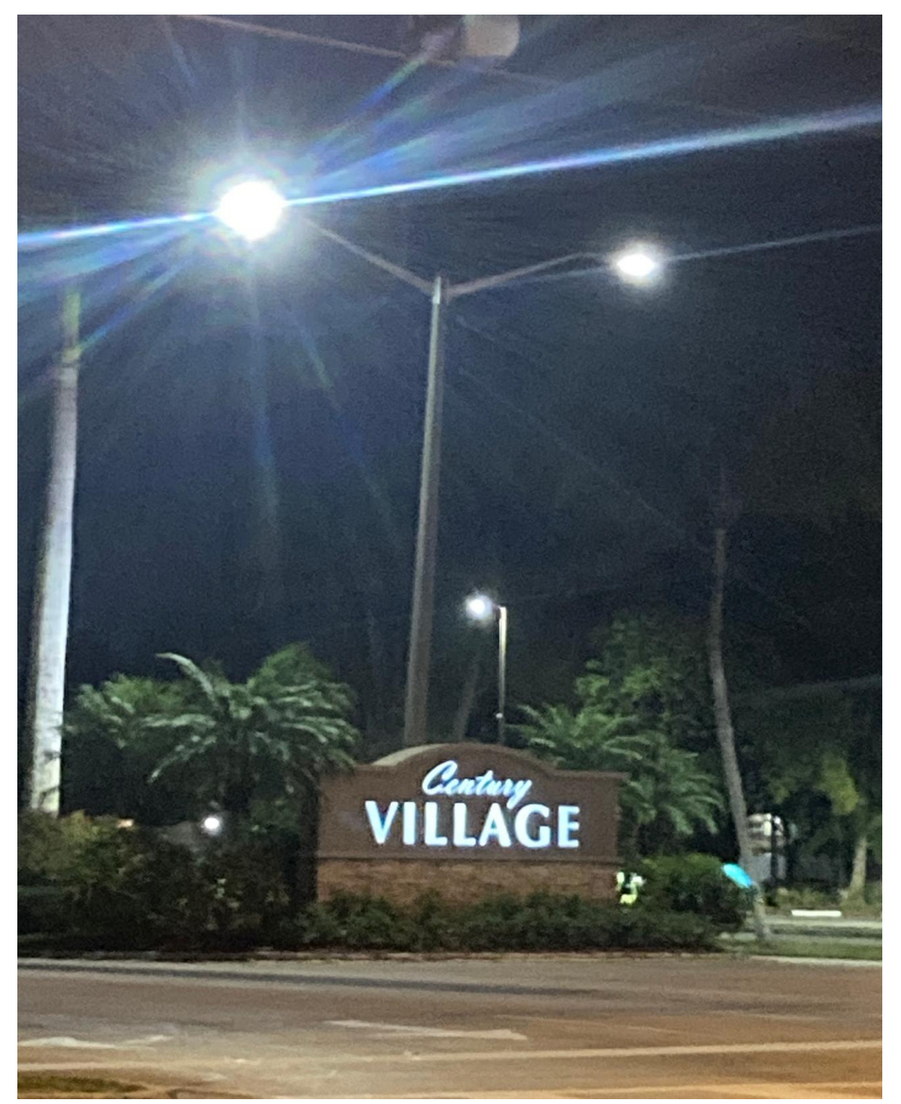
OKEECHOBEE BOULEVARD ENTRANCE- STREETLIGHTS WERE REPAIRED BY FPL LAST WEEK.