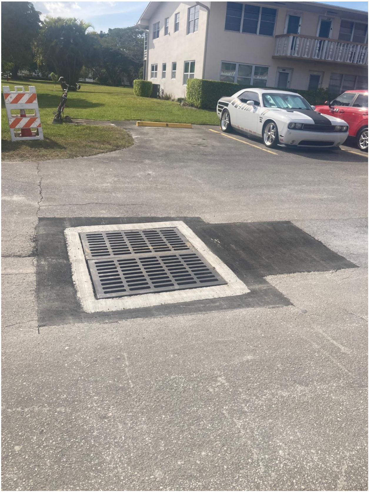
KENT SECTION- CATCH BASIN REPAIR COMPLETE.