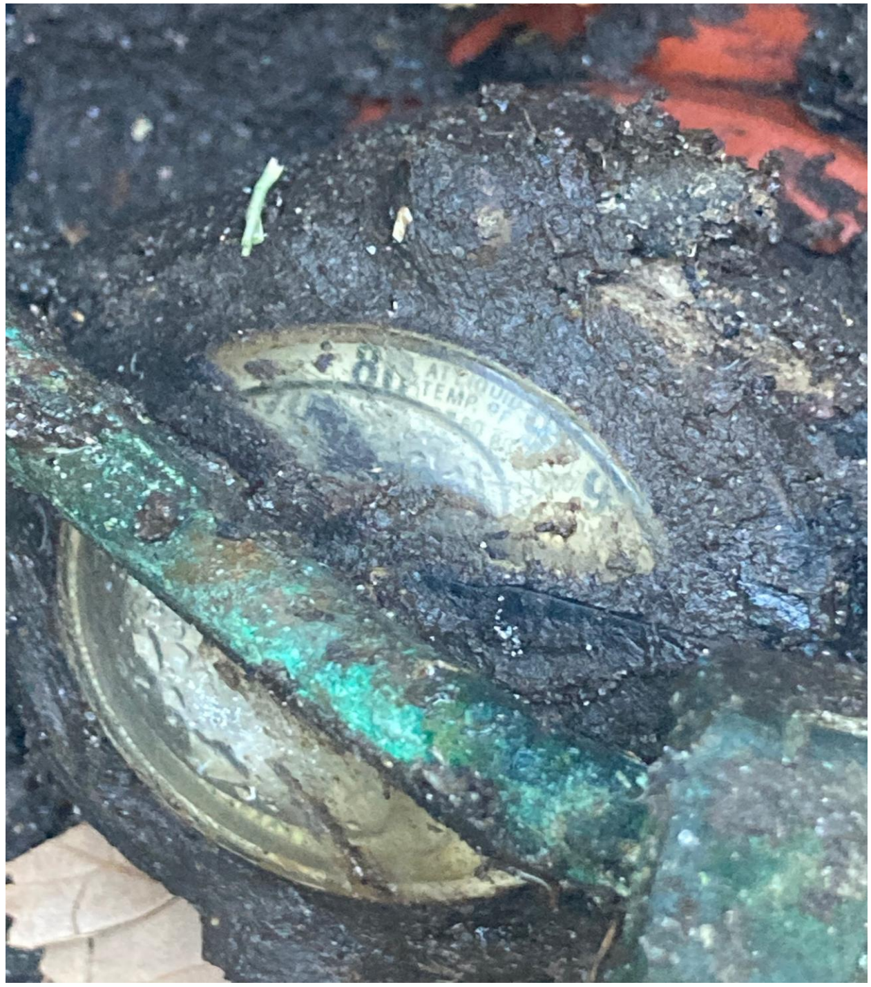
UCO OFFICE- FUEL SUPPLY FOR THE EMERGENCY GENERATOR WAS CHECKED, 700 GALLONS. A REQUEST FOR "TOP OFF" WAS SENT TO FERRELLGAS. THESE GENERATORS AUTOMATICALLY TURN THEMSELVES ON FOR TEN MINUTES EACH WEEK, WHICH ACCOUNTS FOR THE SMALL AMOUNT OF FUEL USAGE.