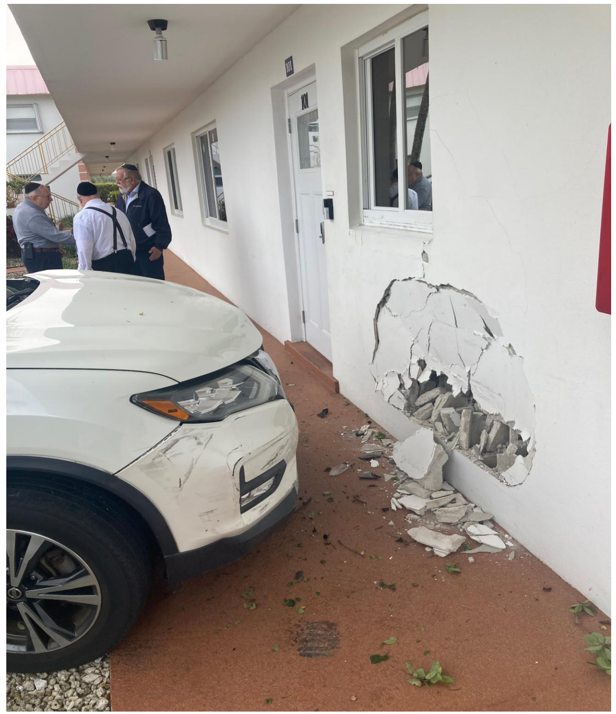
PLYMOUTH M- THIS CAR CRASHED INTO THE FRONT OF THE BUILDING ON 3/23.