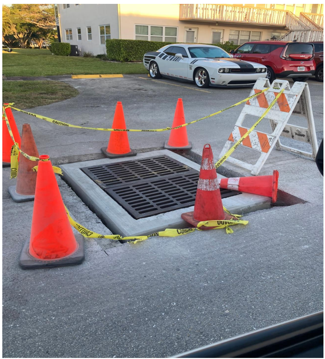
KENT SECTION- THIS DAMAGED STORM DRAIN CATCH BASIN WAS REPLACED BY FEDERAL MAINTENANCE ON 3/20.