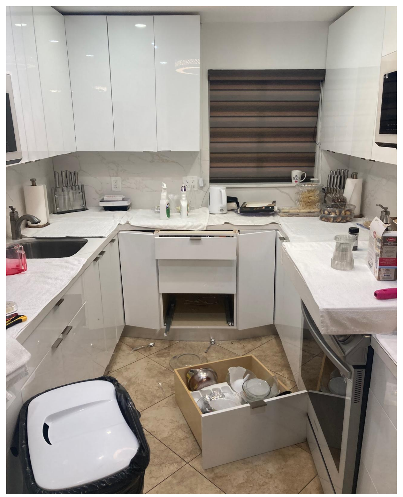
111 PLYMOUTH M- THE FRONT WALL WAS PUSHED IN, AND DAMAGED THE KITCHEN CABINETS.