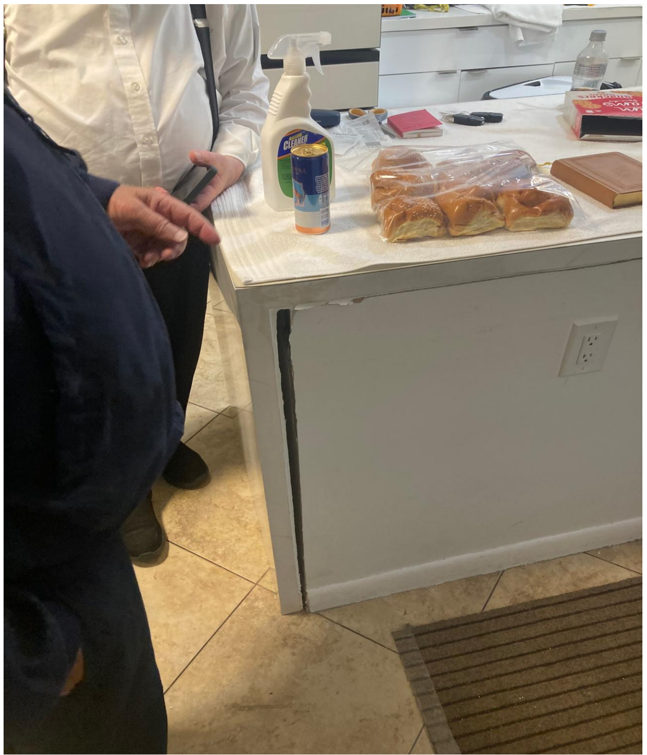
111 PLYMOUTH M- THIS KITCHEN DIVIDER WALL, WHICH IS PERPENDICULAR TO THE FRONT EXTERIOR WALL, APPEARS TO HAVE BEEN PUSHED FORWARD, THEN SHRANK BACK. AN ENGINEER WILL NEED TO CERTIFY WHETHER OR NOT THERE IS STRUCTURAL DAMAGE TO THE BUILDING.