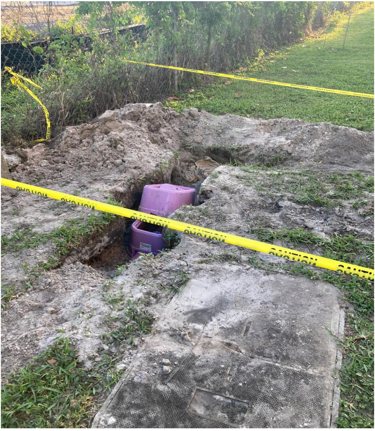
SOUTHAMPTON A- THIS IS WHERE THE NEW IRRIGATION MAIN LINE ENDS. BACKFILL AND SOD INSTALLATION WILL HAPPEN THIS WEEK. THE PLUMBING WORK PASSED PBC INSPECTION LAST WEEK.