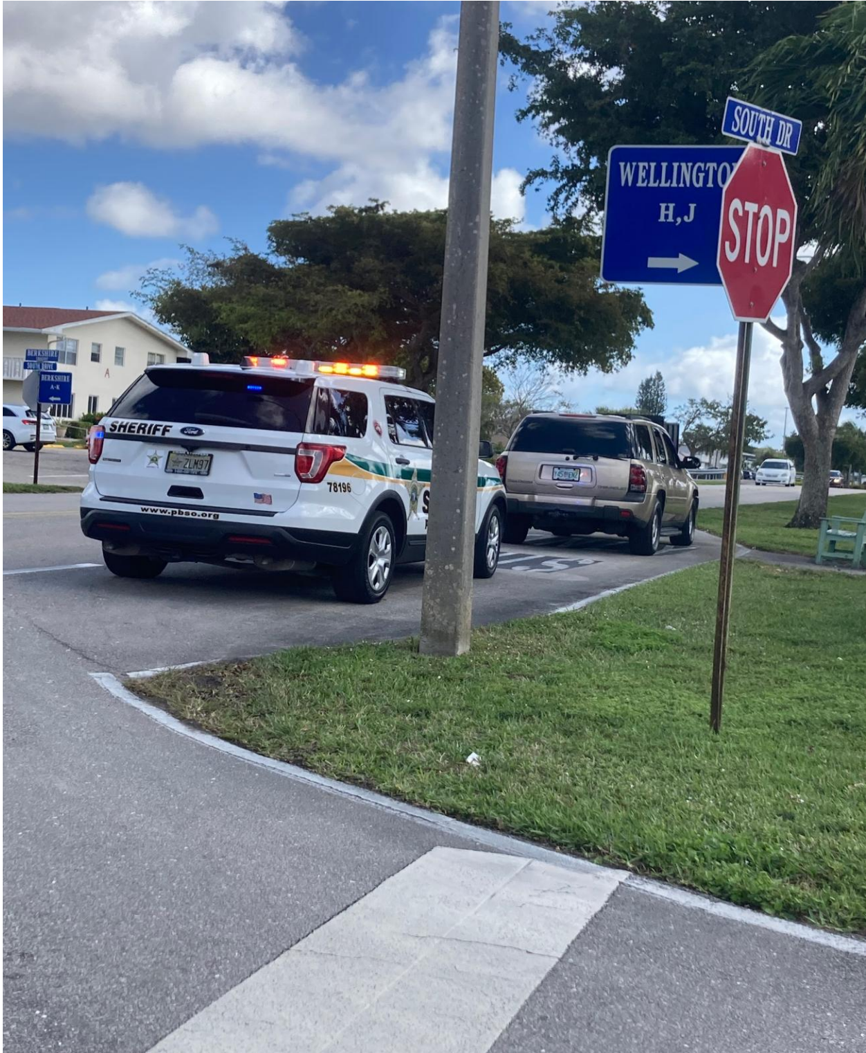
SOUTH DRIVE- PBSO ENFORCES TRAFFIC LAWS AT CV. DRIVE CAREFULLY, AND MAKE FULL STOPS AT STOP SIGNS.