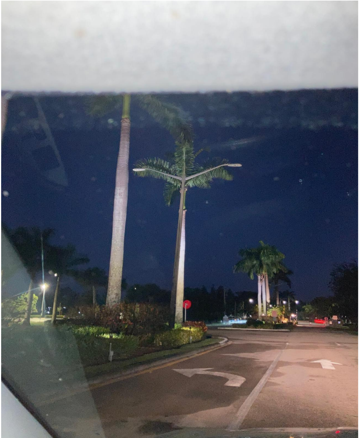
WEST DRIVE- THESE STREET LIGHTS HAVE BEEN DARK FOR SOME TIME. FPL WAS TRYING TO FIND THE SOURCE OF THE PROBLEM.