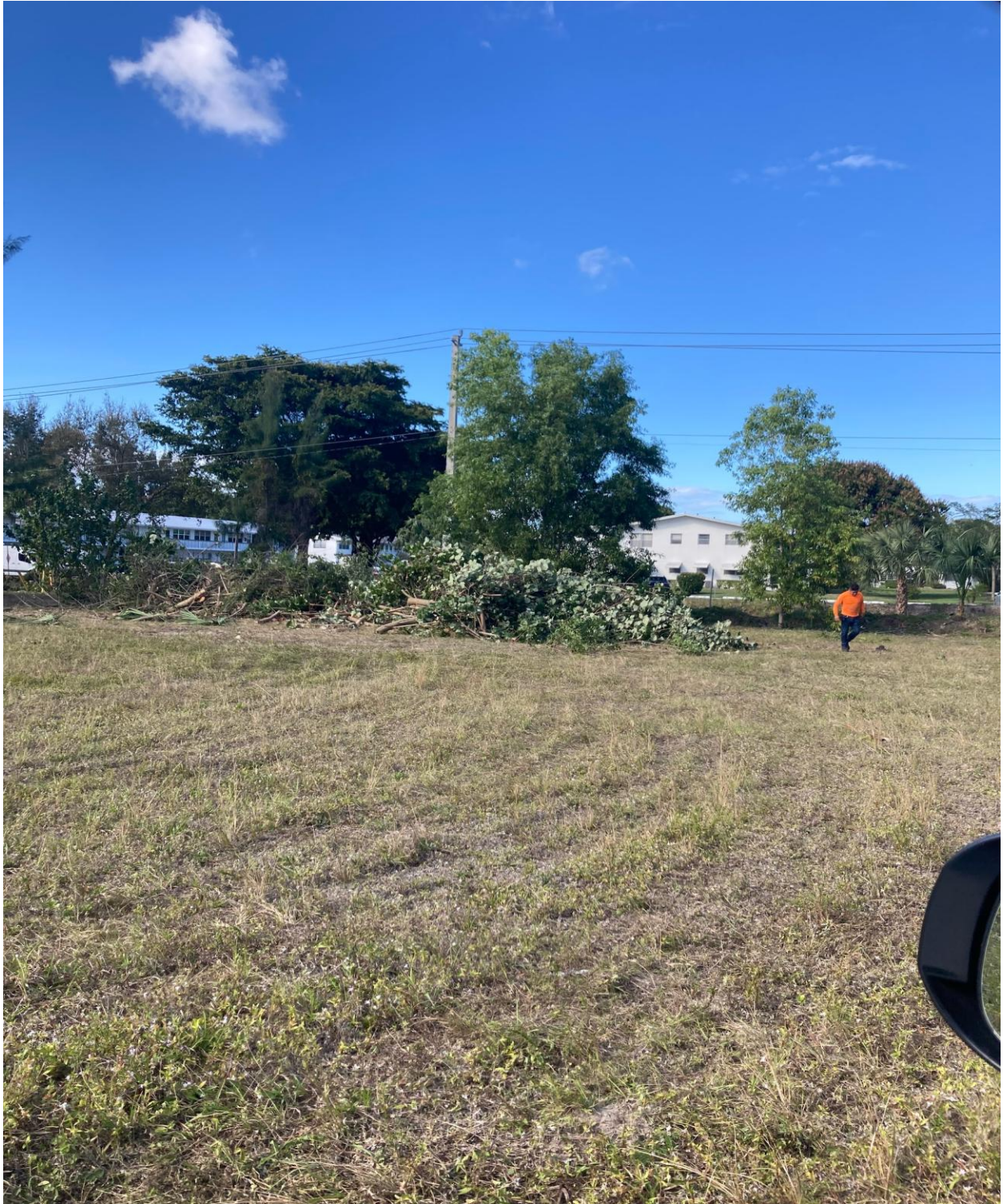
SOUTH CANAL- SEACREST CONTINUES LAND CLEARING WORK, REMOVING HUGE PILES OF OVERGROWTH.