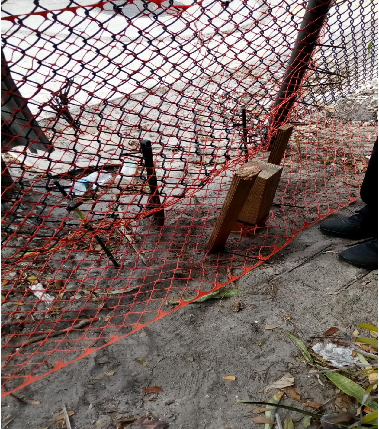
SOUTHAMPTON SECTION- TEMPORARY REPAIRS WERE MADE TO THIS FENCE, ALONG OKEECHOBEE BOULEVARD. THE FENCE WILL BE PERMANENTLY REPAIRED AND REINFORCED SOON.