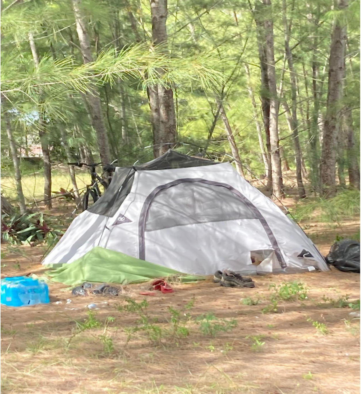
6255 OKEECHOBEE BOULEVARD- HOMELESS ENCAMPMENT ON THIS VACANT PARCEL. PBSO AND THE PROPERTY OWNER WERE NOTIFIED. THIS ENCAMPMENT HAS BEEN ABANDONED FOR SOME TIME.