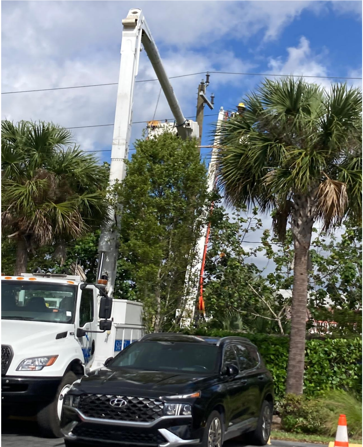
WINDSOR SECTION- A NEW POLE WAS INSTALLED BY PIKE ELECTRIC ON 2/12. THE WEST DRIVE STREET LIGHTS WILL BE RE-LIT BY FPL SOON.