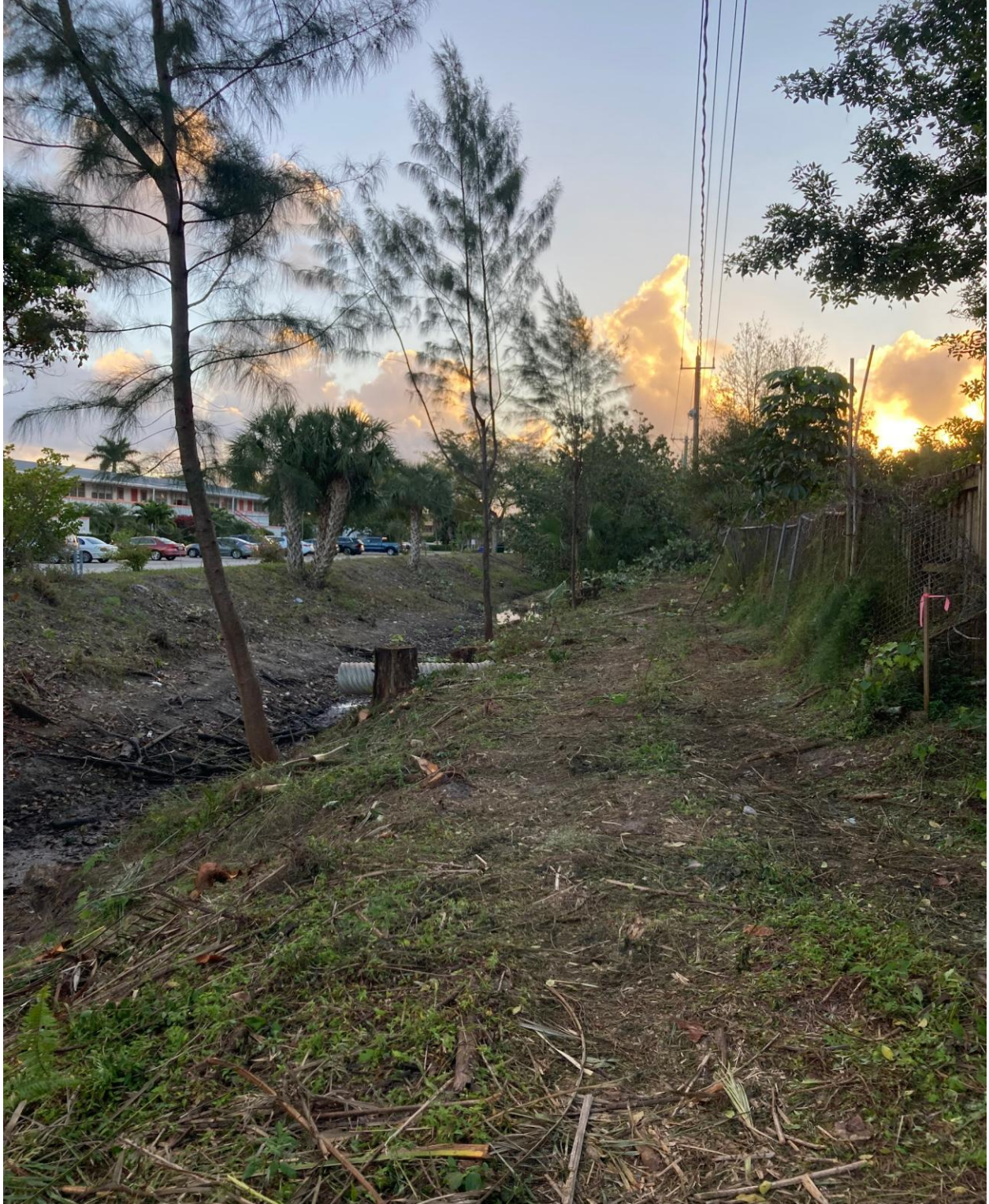
SOUTH CANAL, WINDSOR SECTION- LAND CLEARING WORK ALONG BOTH SIDE OF SOUTH CANAL CONTINUES.