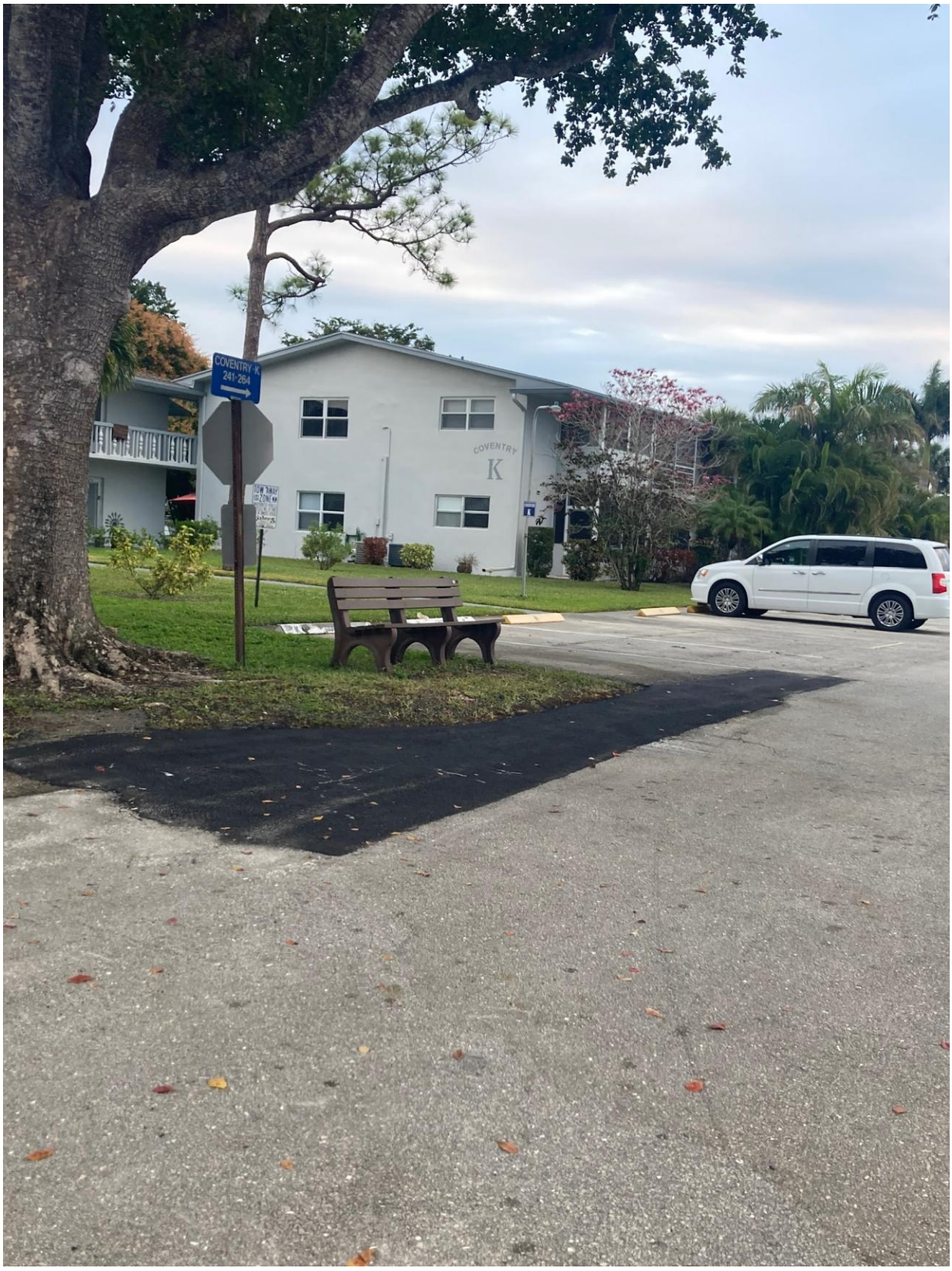
COVENTRY SECTION- PAVING REPAIR COMPLETE.