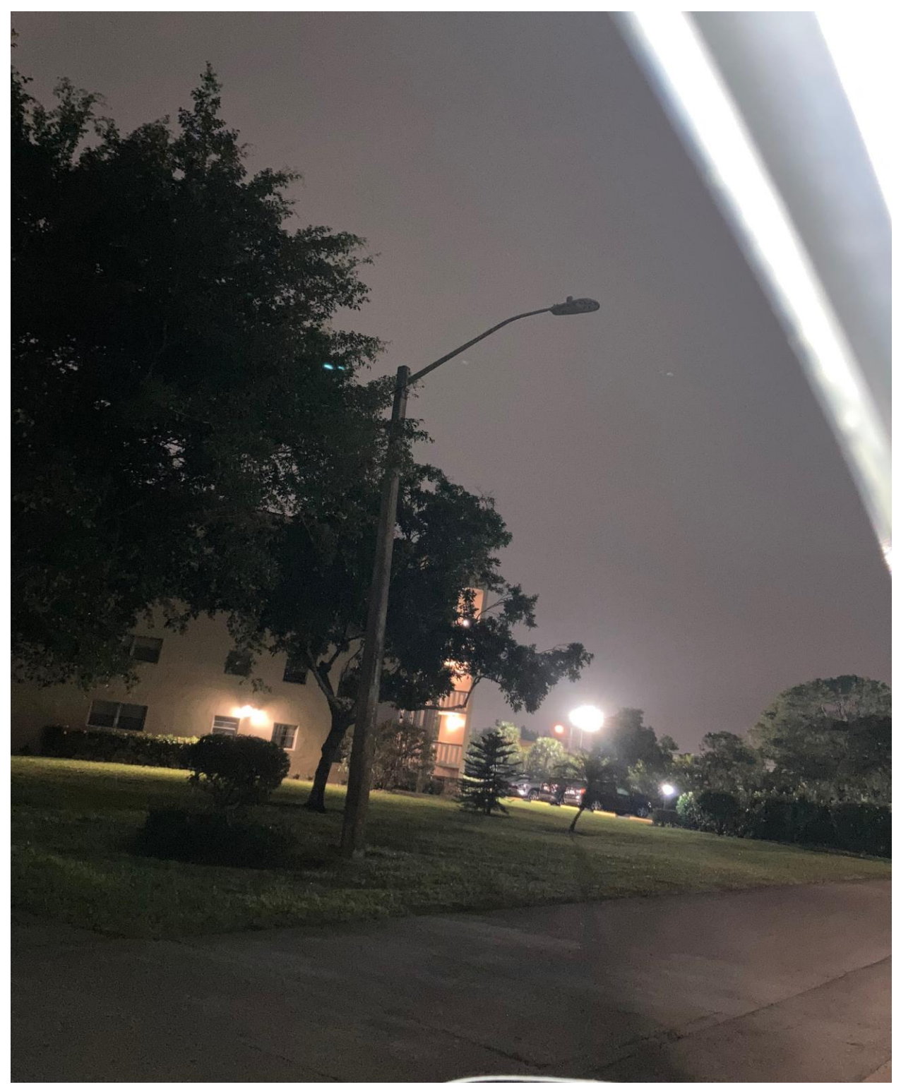
FAIRWAY STREET- DARK STREETLIGHT. REPORTED TO FPL, W.O. #41952.