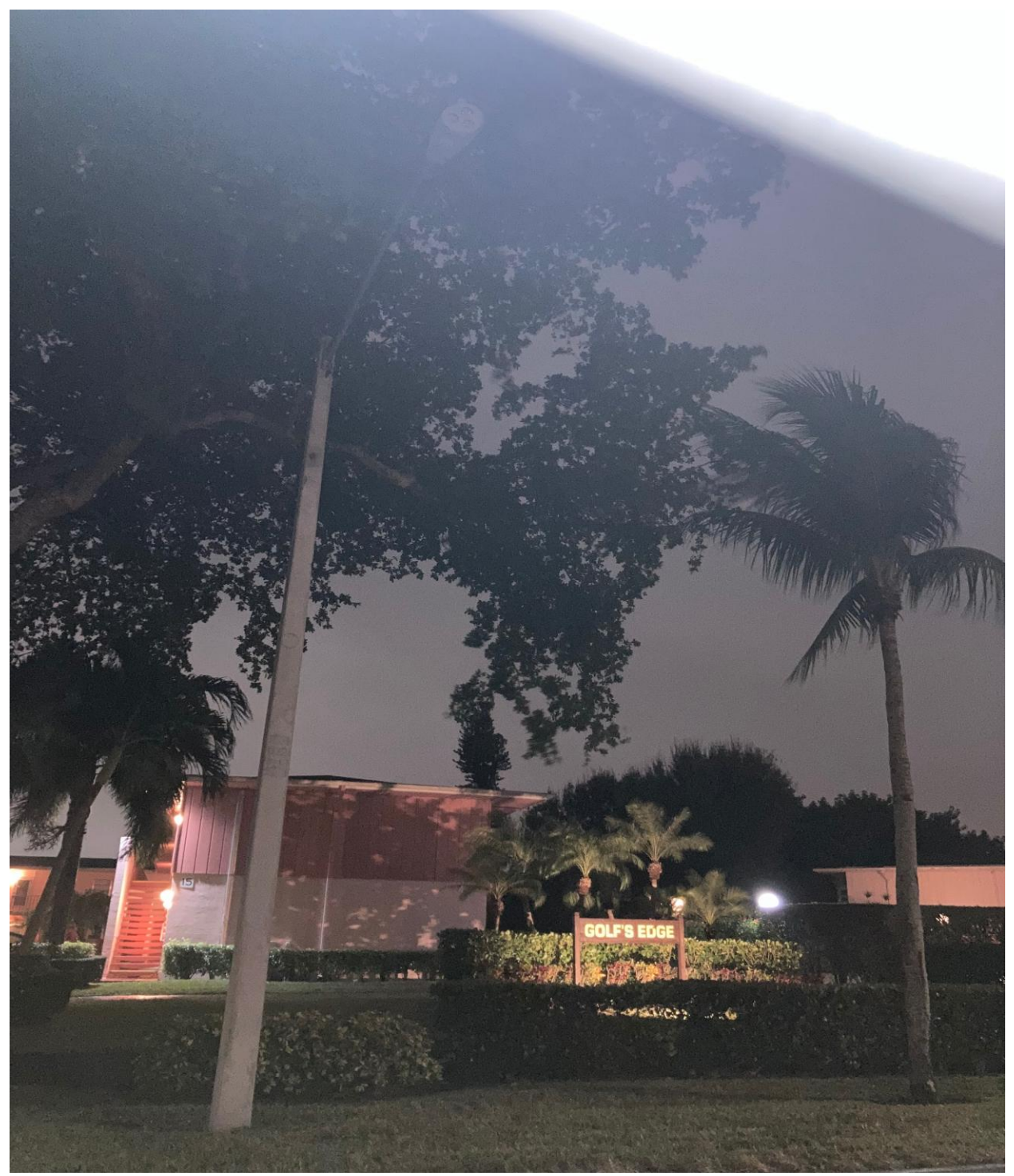
EAST DRIVE- DARK STREET LIGHT. REPORTED TO FPL, W.O. #41953.