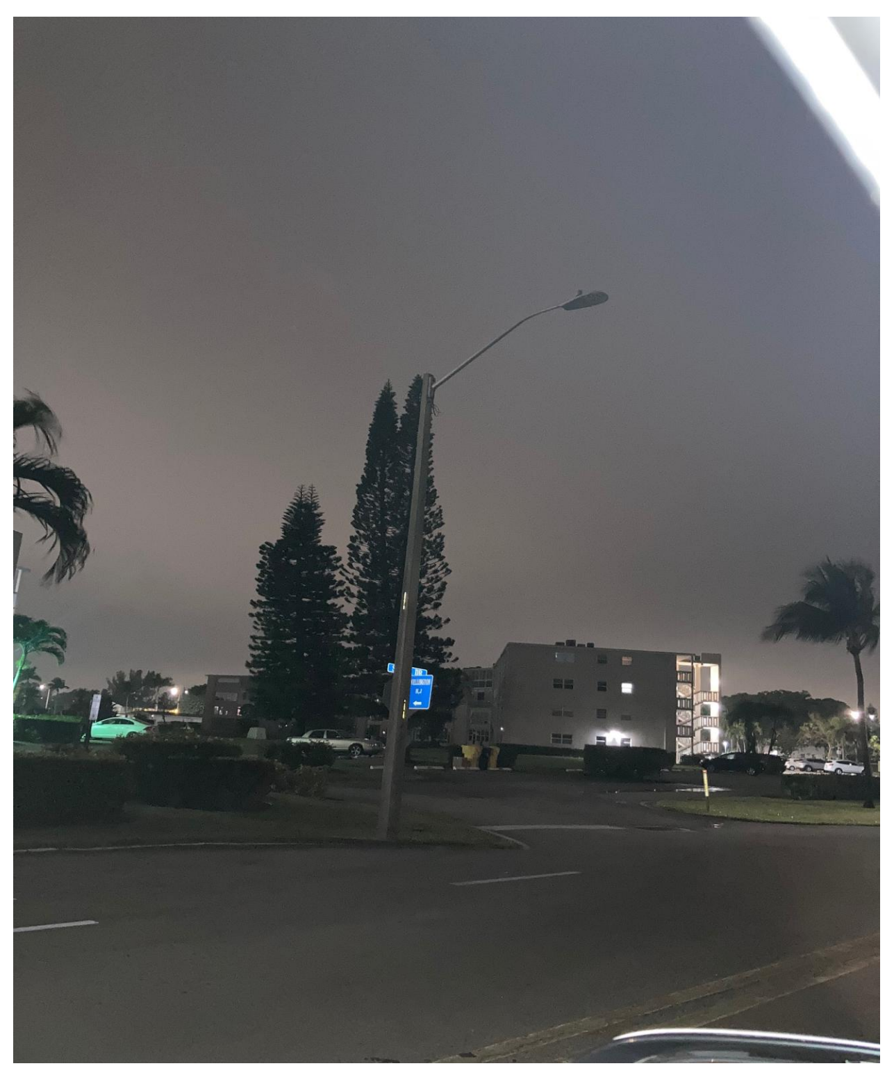
SOUTH DRIVE- DARK STREET LIGHT. REPORTED TO FPL, W.O. #41948.