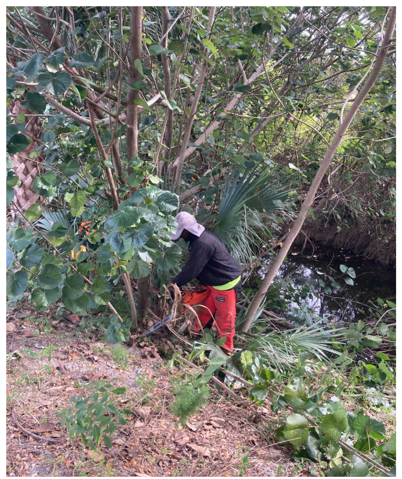
WINDSOR SECTION- SEACREST SERVICES CONTINUES LAND CLEARING AT SOUTH CANAL.