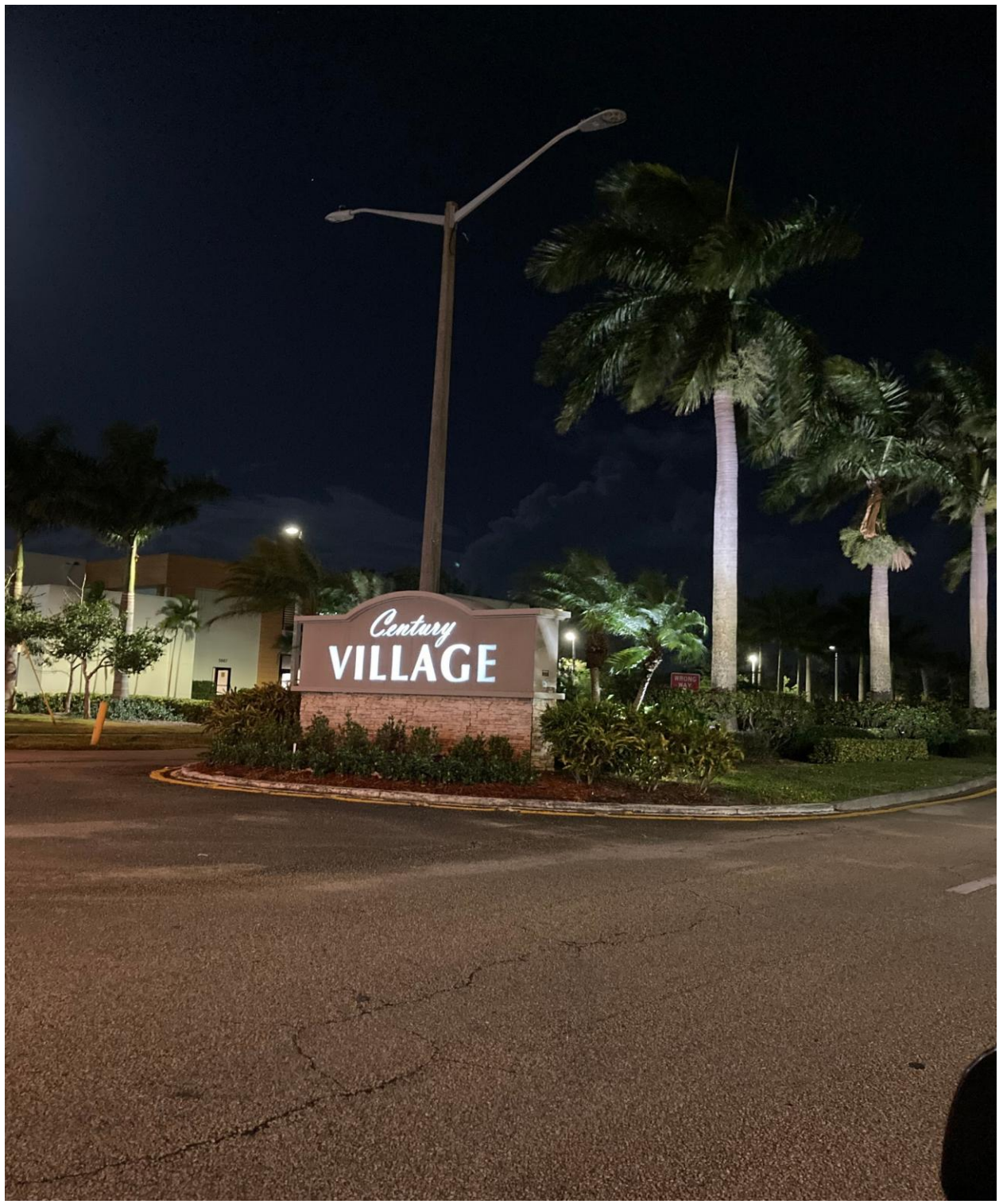
WEST DRIVE- FOUR DOUBLE STREET LIGHTS OOO. FPL REPORTS AN UNDERGROUND WIRING FAULT AND HAS SCHEDULED REPAIRS, W.O. #40116.