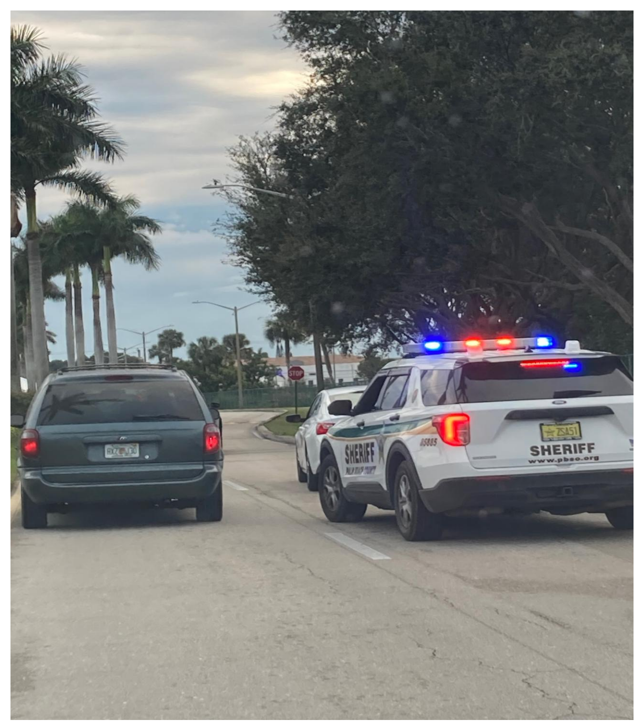
CENTURY BOULEVARD- REMINDER TO DRIVERS: PBSO ENFORCES TRAFFIC LAWS INSIDE CV. PLEASE DRIVE CAREFULLY, DON'T PASS CARS ON DOUBLE YELLOWS AND MAKE FULL STOPS AT STOP SIGNS.