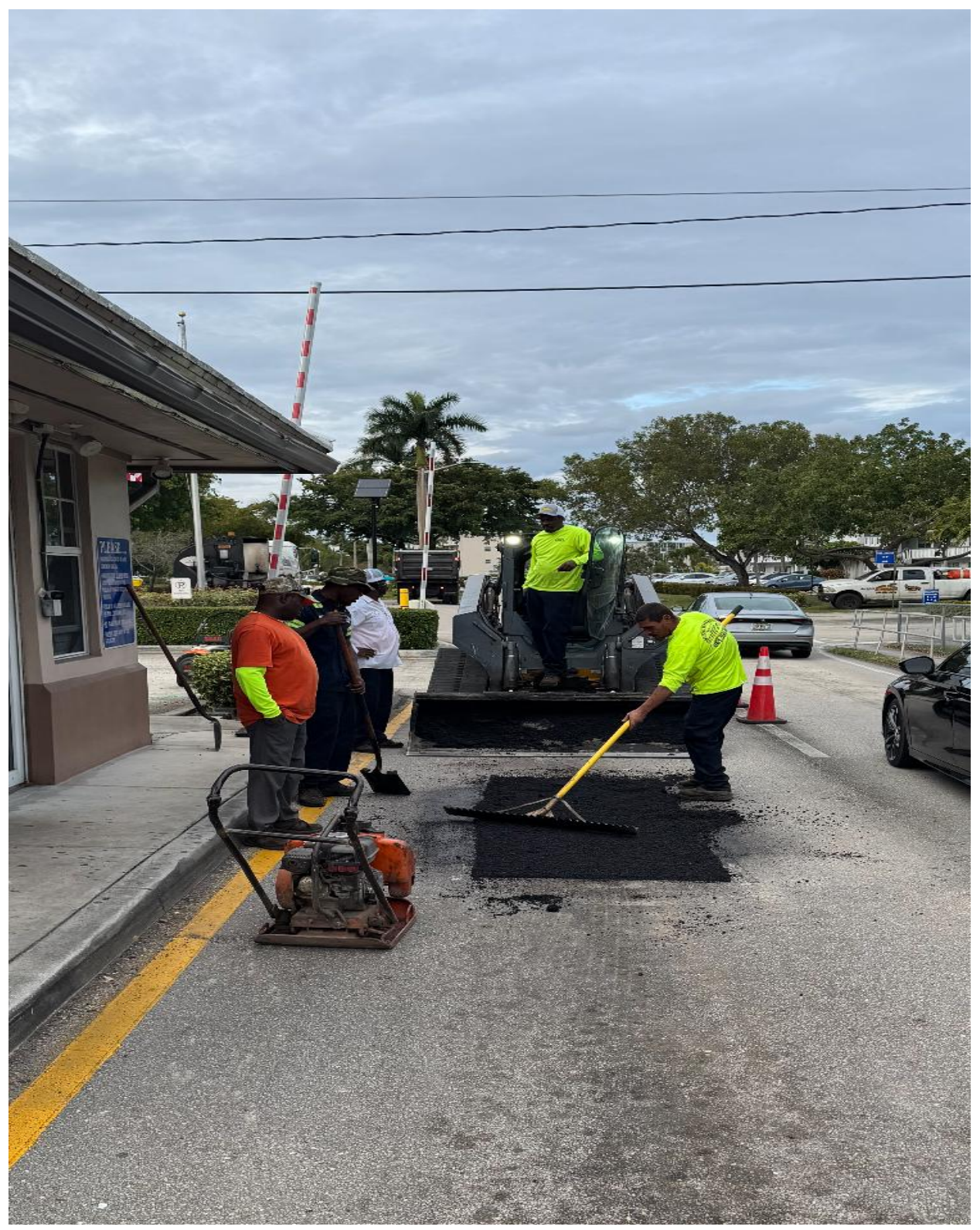
OKEECHOBEE BOULEVARD ENTRANCE- PAVING REPAIR BY SUNSHINE SERVICES UNLIMITED ON 1/16.