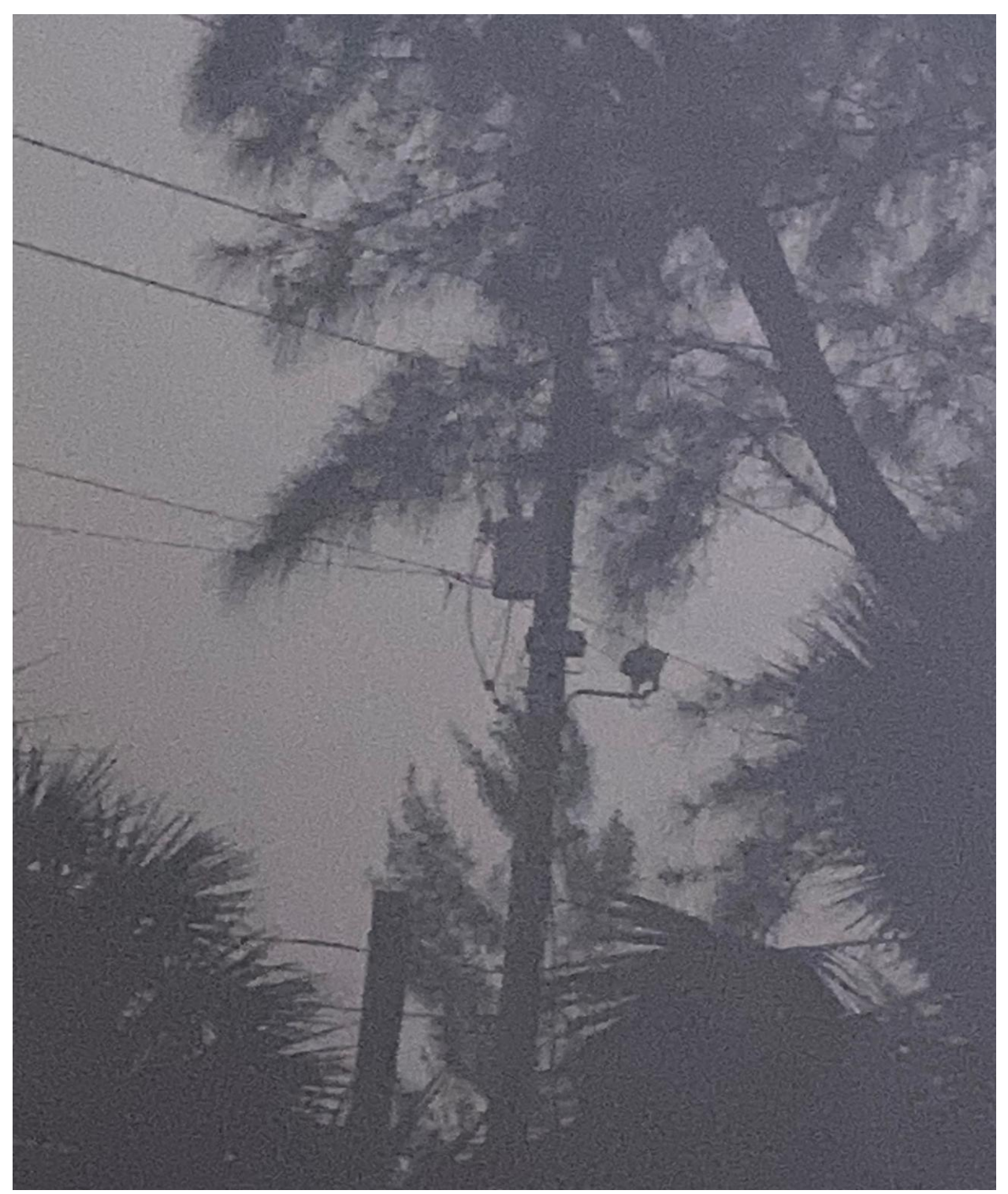
ANDOVER H- DARK FLOOD LIGHTS. REPORTED TO FPL, W.O. #41949.