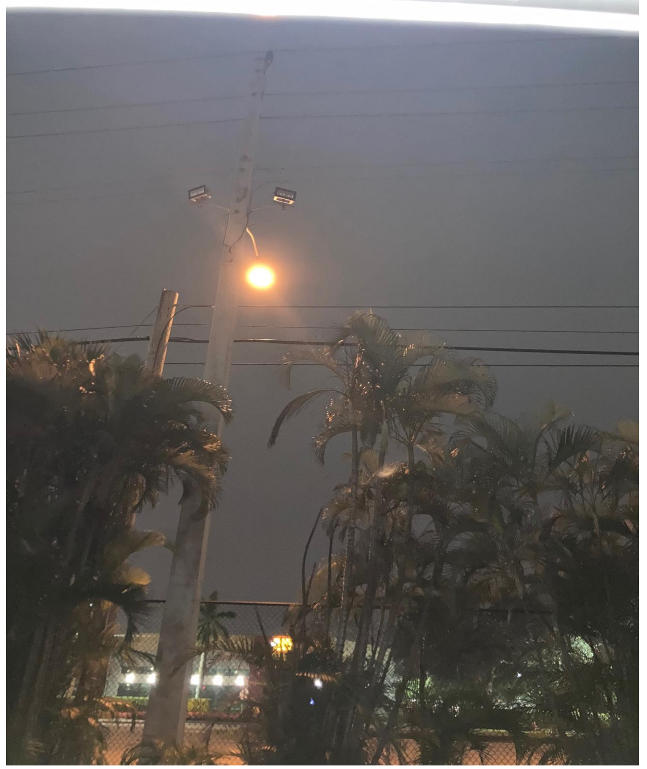
FAIRWAY STREET- DARK SPOT LIGHTS ALONG OKEECHOBEE BOULEVARD. REPORTED TO FPL, W.O. #41955.