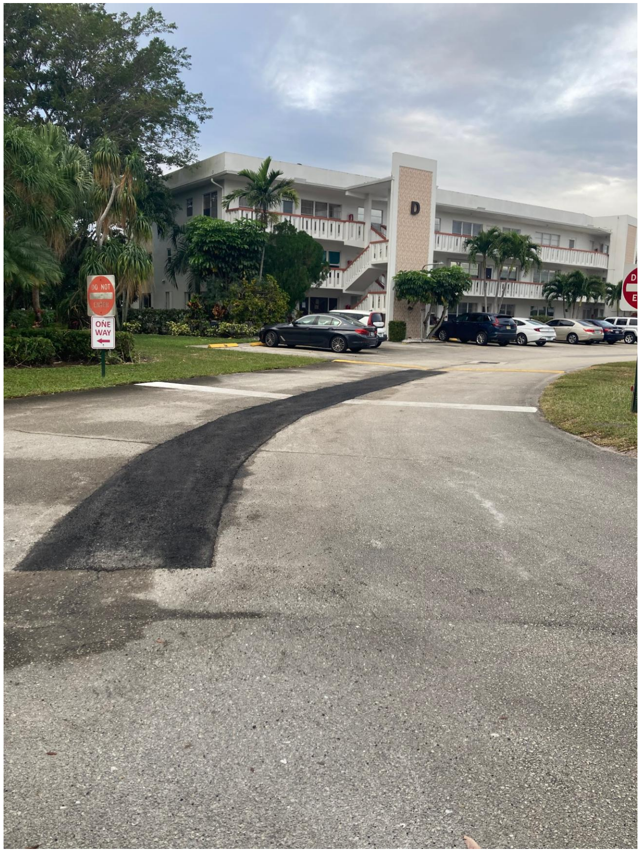
WELLINGTON SECTION- PAVING REPAIR COMPLETE.