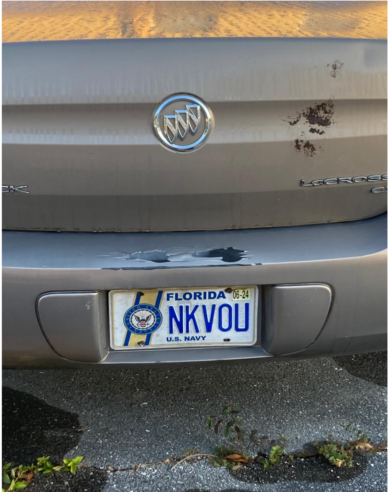
CANTERBURY C- CAR WITH EXPIRED REGISTRATION TAG, REPORTED TO PBC CODE ENFORCEMENT, # C-2024-11260004.