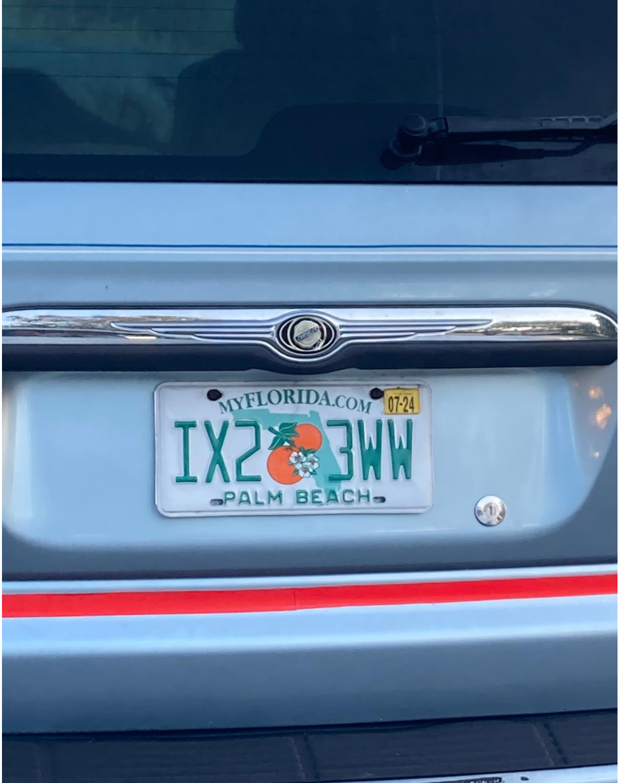
SHEFFIELD E- MINIVAN WITH EXPIRED LICENSE TAG, #C-2024-11260003.