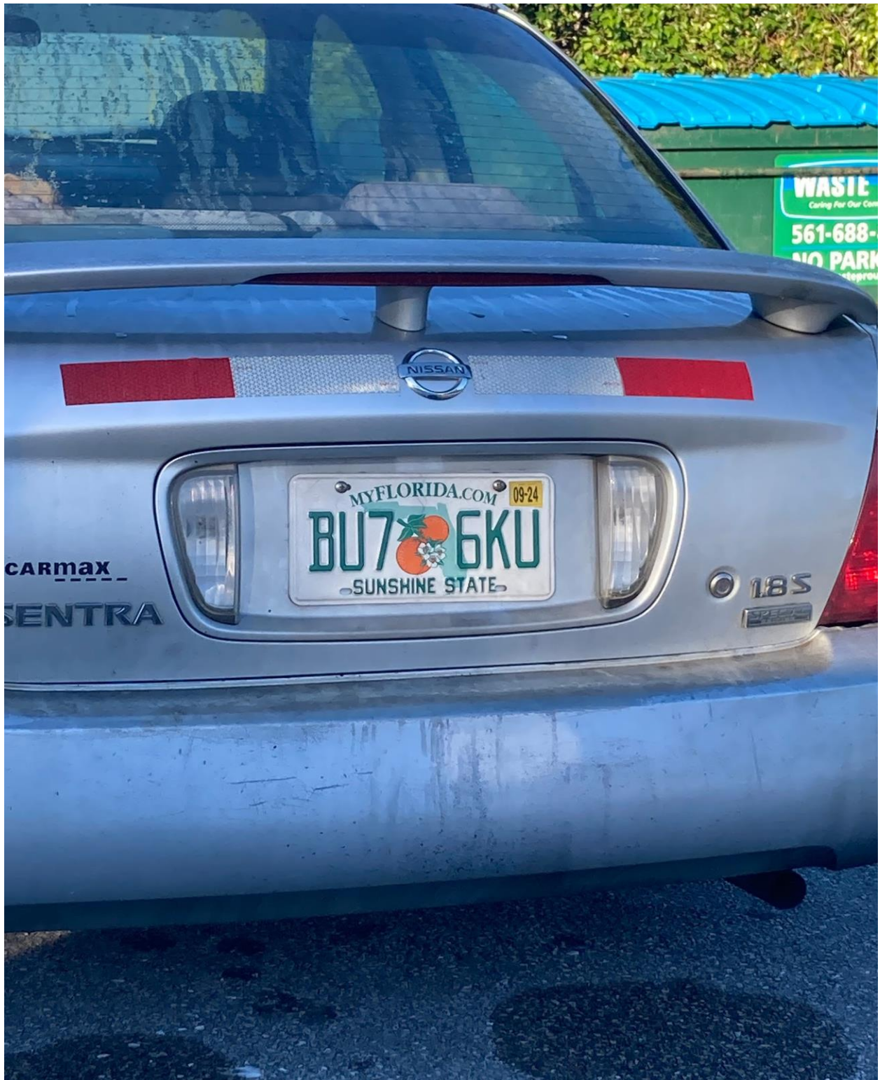
BEDFORD J- CAR WITH EXPIRED REGISTRATION TAG. REPORTED TO PBC CODE ENFORCEMENT, # C-2024-11270003.