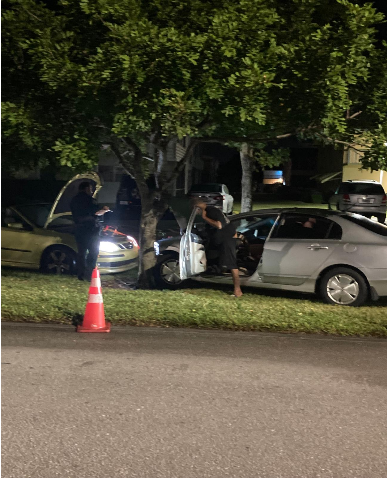
NORTH DRIVE- ON 11/26, A TENANT FROM 270 CHATHAM N CRASHED HIS CAR INTO A TREE. HE WAS UNHURT.