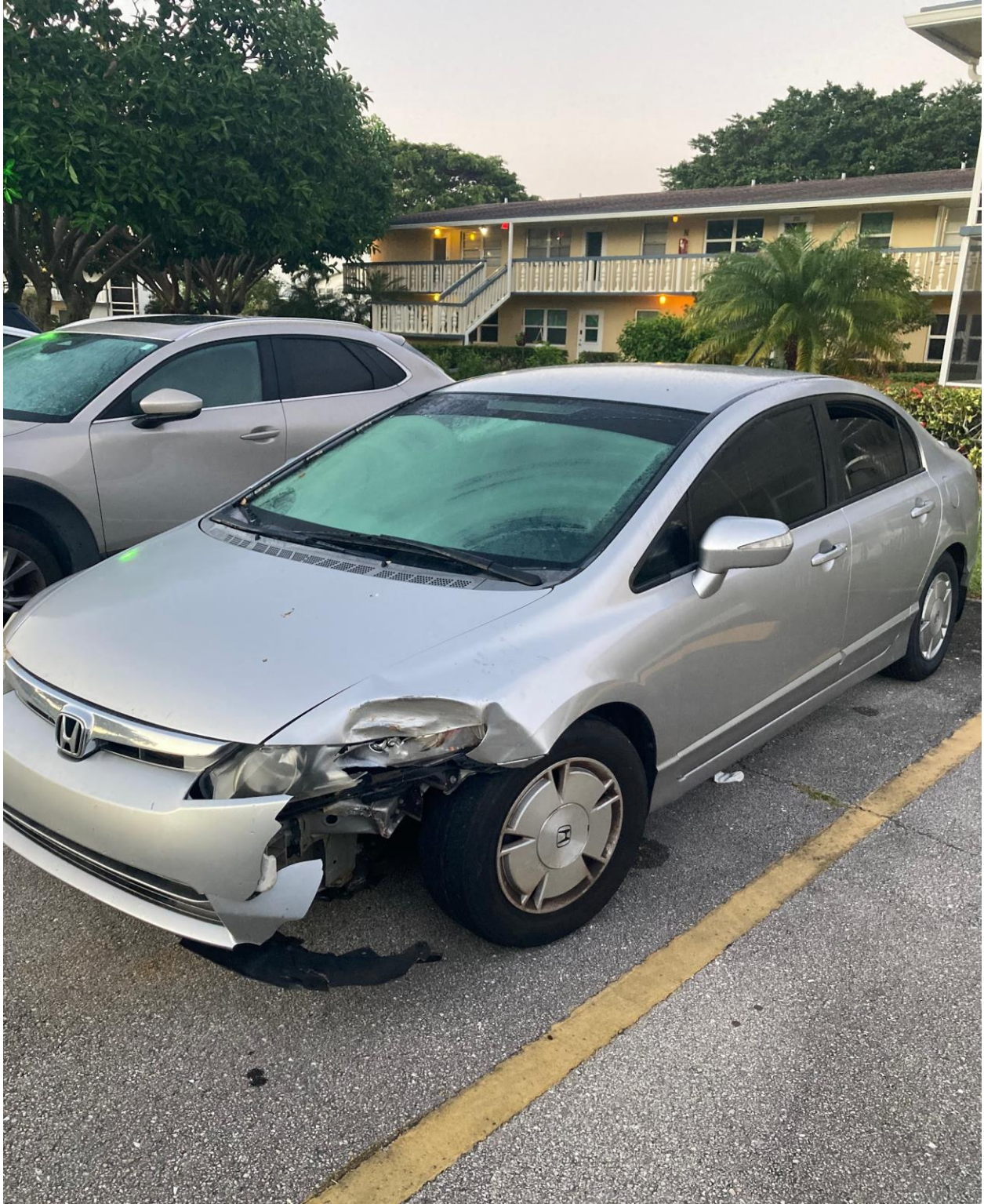
CHATHAM N- THE CAR THAT CRASHED INTO A TREE ON NORTH DRIVE IS NOW INOPERABLE.