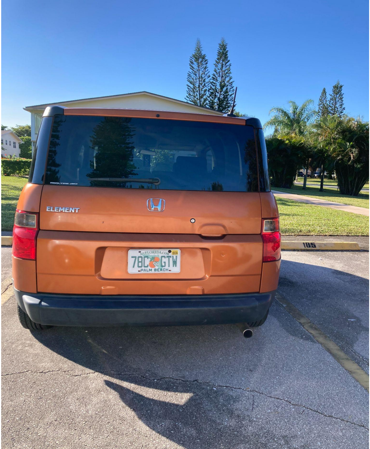
CANTERBURY H- CAR WITH EXPIRED REGISTERED TAG. REPORTED TO PBC CODE ENFORCEMENT, #C-2024-11250004.