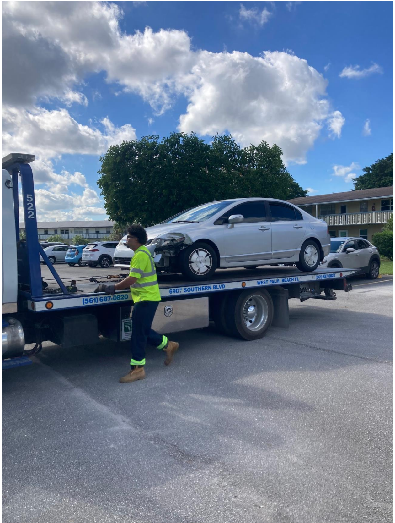
CHATHAM N- THIS CAR WAS TOWED OFF PROPERTY ON 11/26.