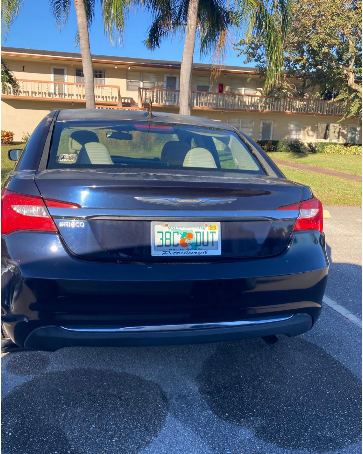
BEDFORD I- CAR WITH EXPIRED REGISTRATION TAG. REPORTED TO PBC CODE ENFORCEMENT. #C-2024-11270004.