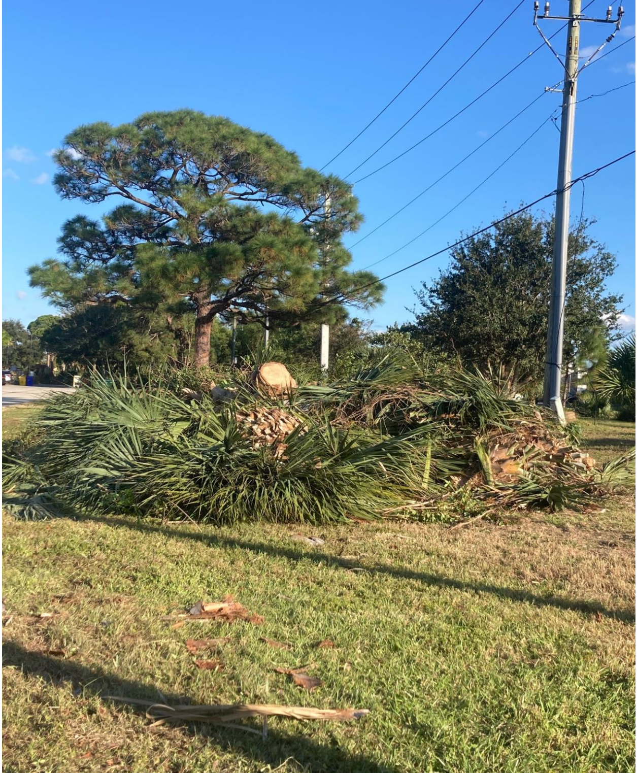
NORTH CANAL, HASTINGS SECTION- LAND CLEARING WORK BY SEACREST SERVICES CONTINUES.