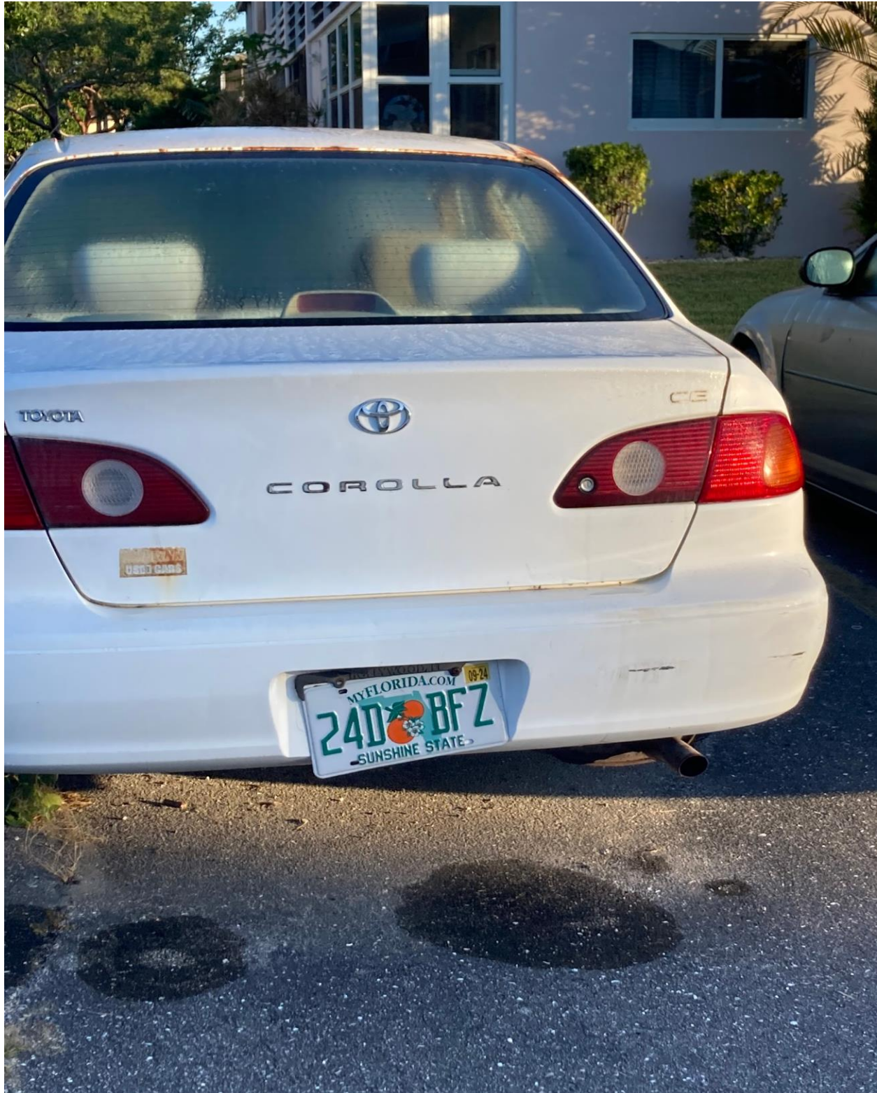
CANTERBURY B- CAR WITH EXPIRED REGISTRATION TAG. REPORTED TO PBC CODE ENFORCEMENT, #C-2024-11260005.