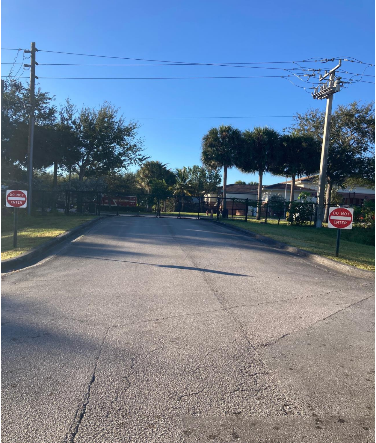
BEDFORD SECTION- THE EMERGENCY ACCESS GATE BEHIND PBC FIRE RESCUE STATION 23 HAS BEEN REPAIRED. IT HAD PREVIOUSLY BEEN SMASHED INTO BY A CAR.