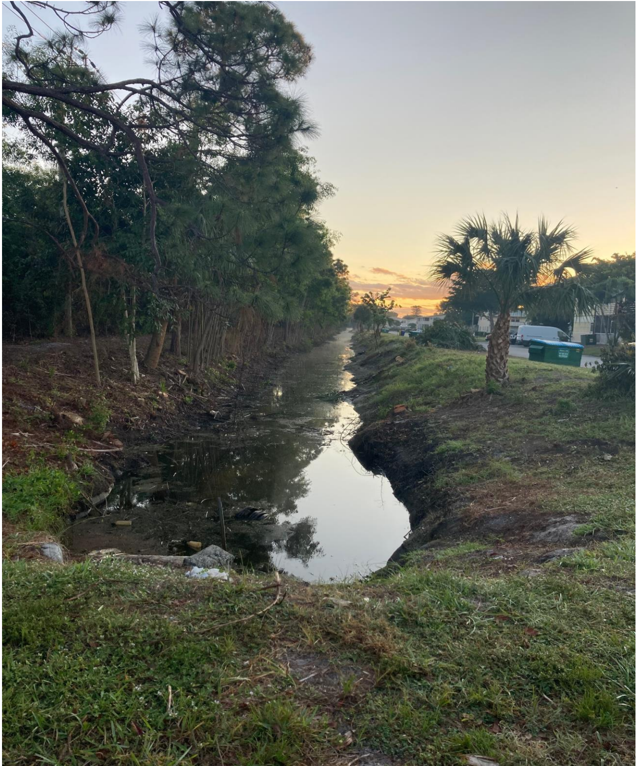
NORTH CANAL- THIS IS AT GROVE STREET, FACING EAST TO HAVERHILL ROAD. THIS STORMWATER RETENTION DITCH IS NOW A MORE EFFECTIVE FLOOD CONTROL INFRASTRUCTURE, AND WILL BE MORE SO WHEN THE CANAL IS DREDGED.