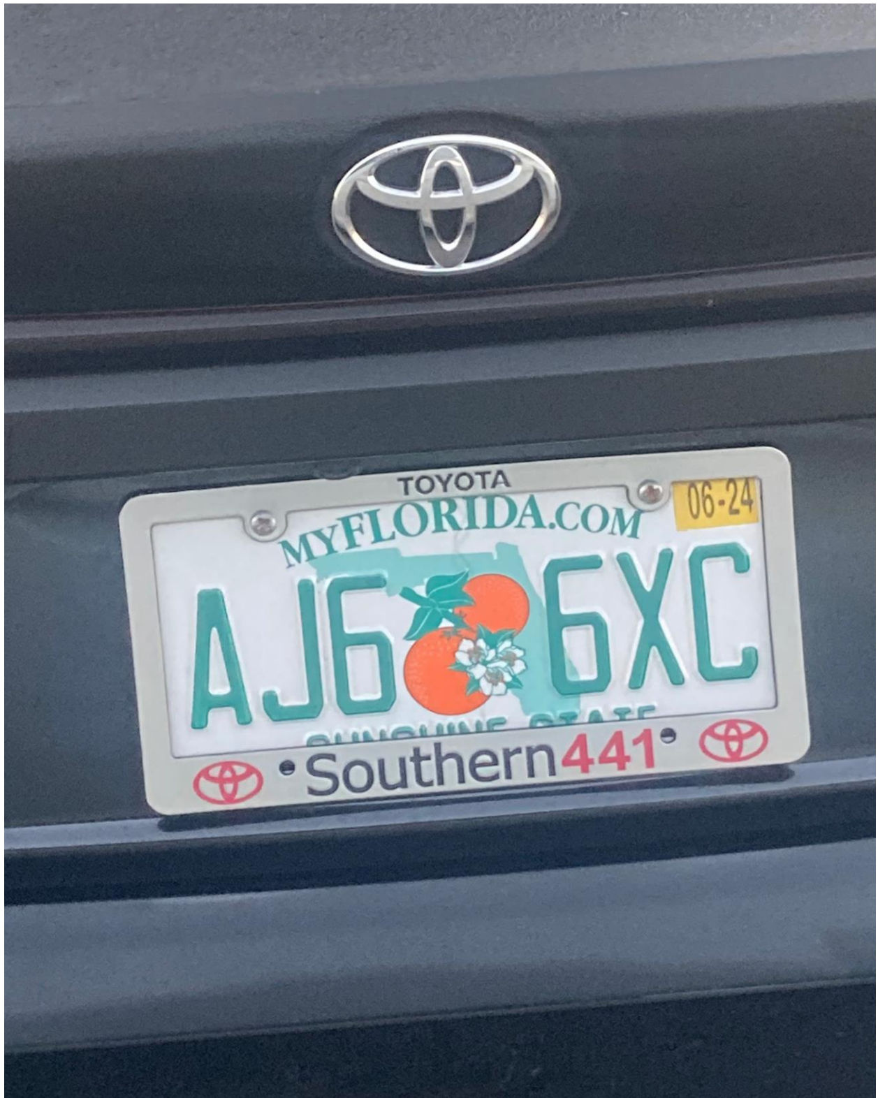
CHATHAM O- CAR WITH EXPIRED REGISTRATION TAG, REPORTED TO PBC CODE ENFORCEMENT, #C-2024-1126002.