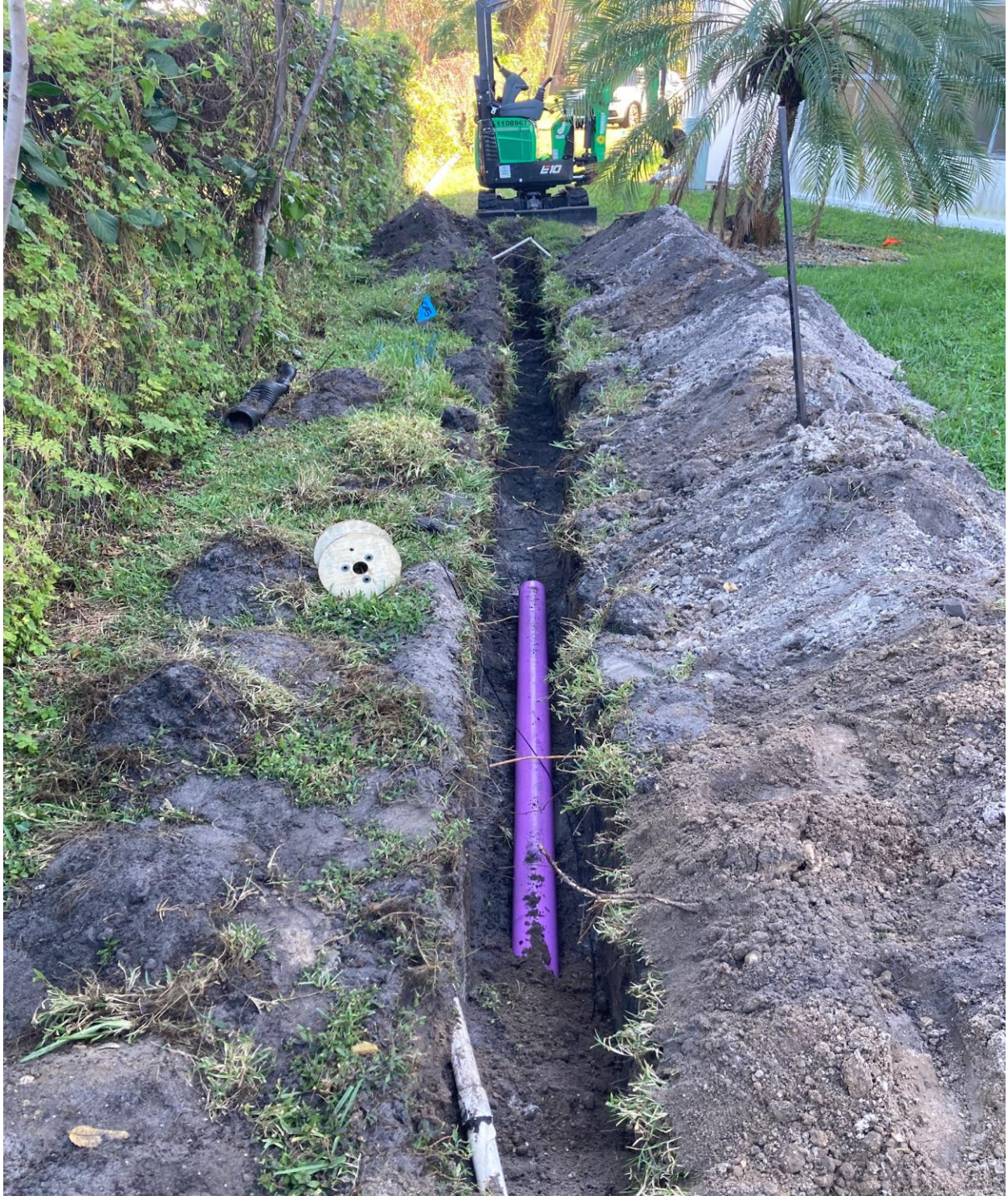
GREENBRIER A- SEACREST SERVICES CONTINUES INSTALLATION OF NEW UNDERGROUND IRRIGATION PIPES.