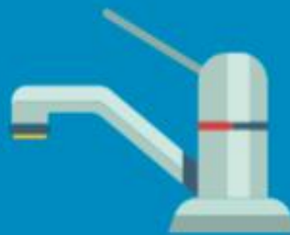
Faucet aerator and low-flow showerhead installation