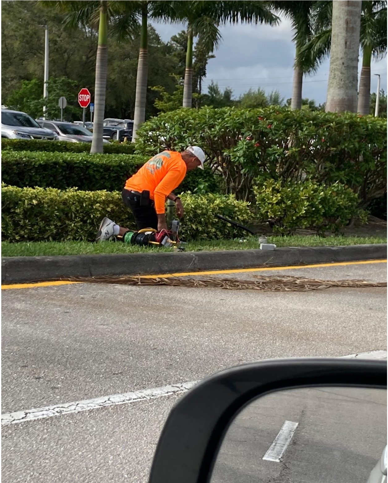
WEST DRIVE- T.S.I. ELECTRIC IS MAKING REPAIRS TO LIGHTING AND UNDERGROUND CONDUITS AT THE TRAFFIC MEDIANS.