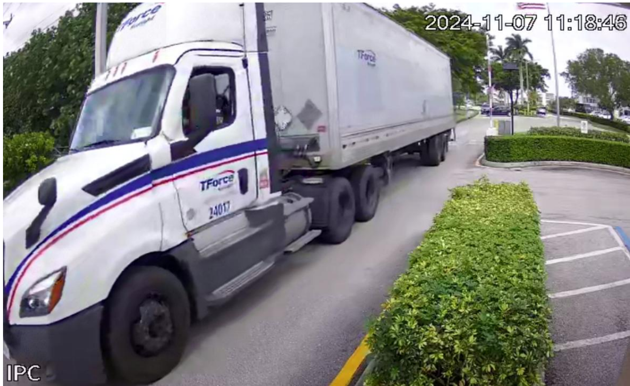
OKEECHOBEE BOULEVARD ENTRANCE- OVER FORTY FOOT TRUCK DENIED ENTRY ON 11/7.