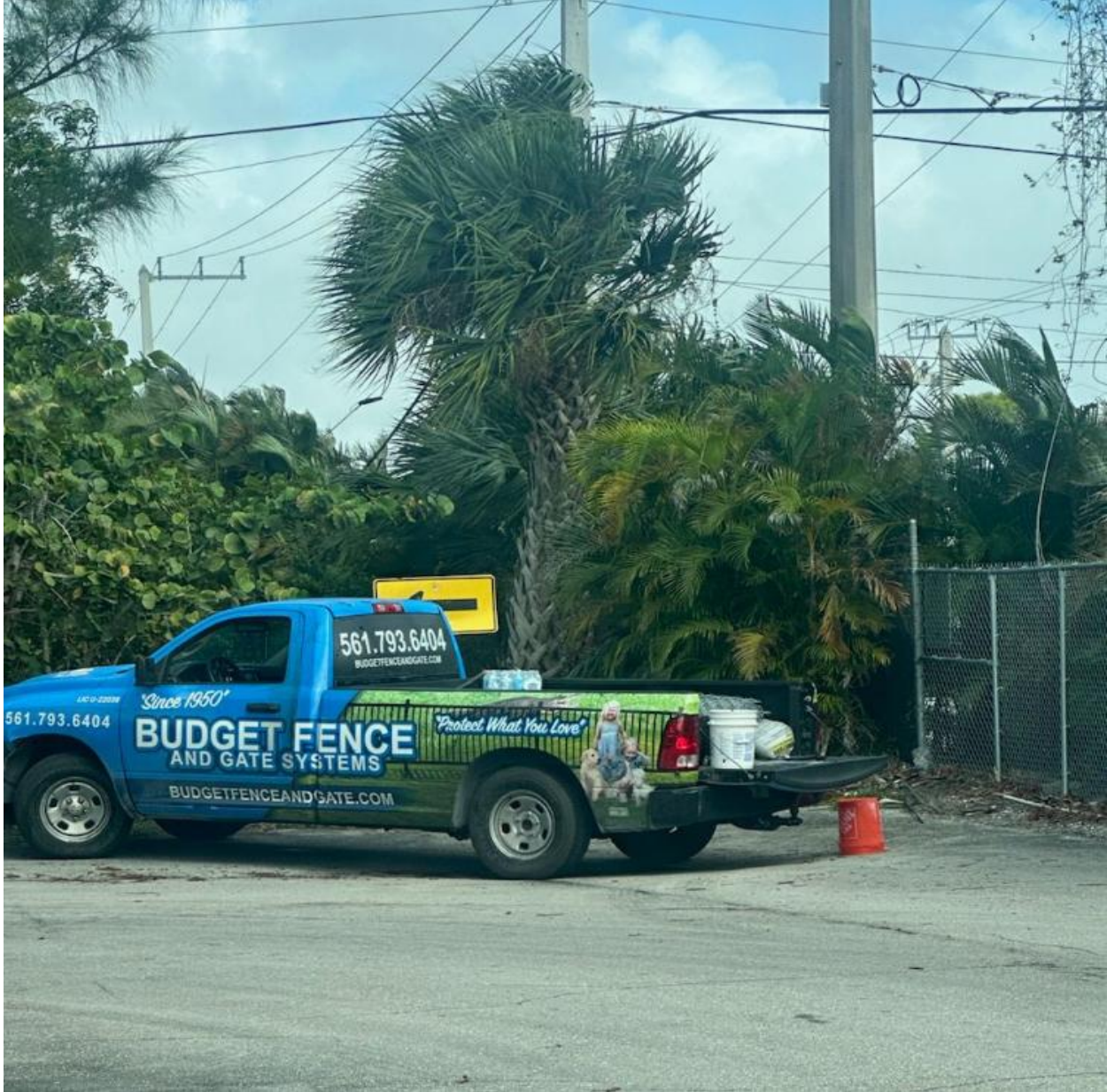
FALKIRK/AVON STREETS, NORWICH SECTION- ON 11/6, BUDGET FENCE AND GATE SYSTEMS REPAIRED A SECTION OF FENCE THAT HAD BEEN CUT.