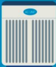
A/C unit inspection

Providing free FPL energy services , if applicable, including: