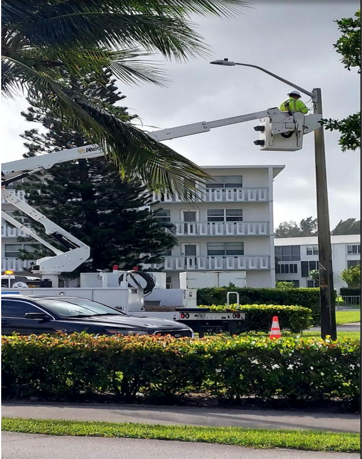
FPL MADE REPAIRS TO STREETLIGHTS ON 11/5. THESE REPAIRS WILL CONTINUE THIS WEEK.