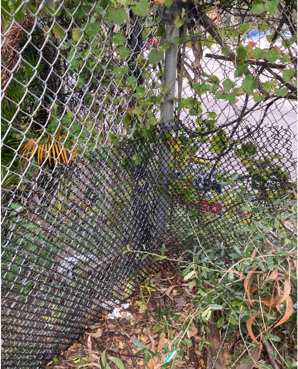
NORWICH SECTION- BUDGET FENCE AND GATE ADDED SOME CUT RESISTANT MESH TO THE EXISTING CHAIN LINK FENCE, TO MAKE IT MORE DIFFICULT FOR THE FENCE TO BE CUT.