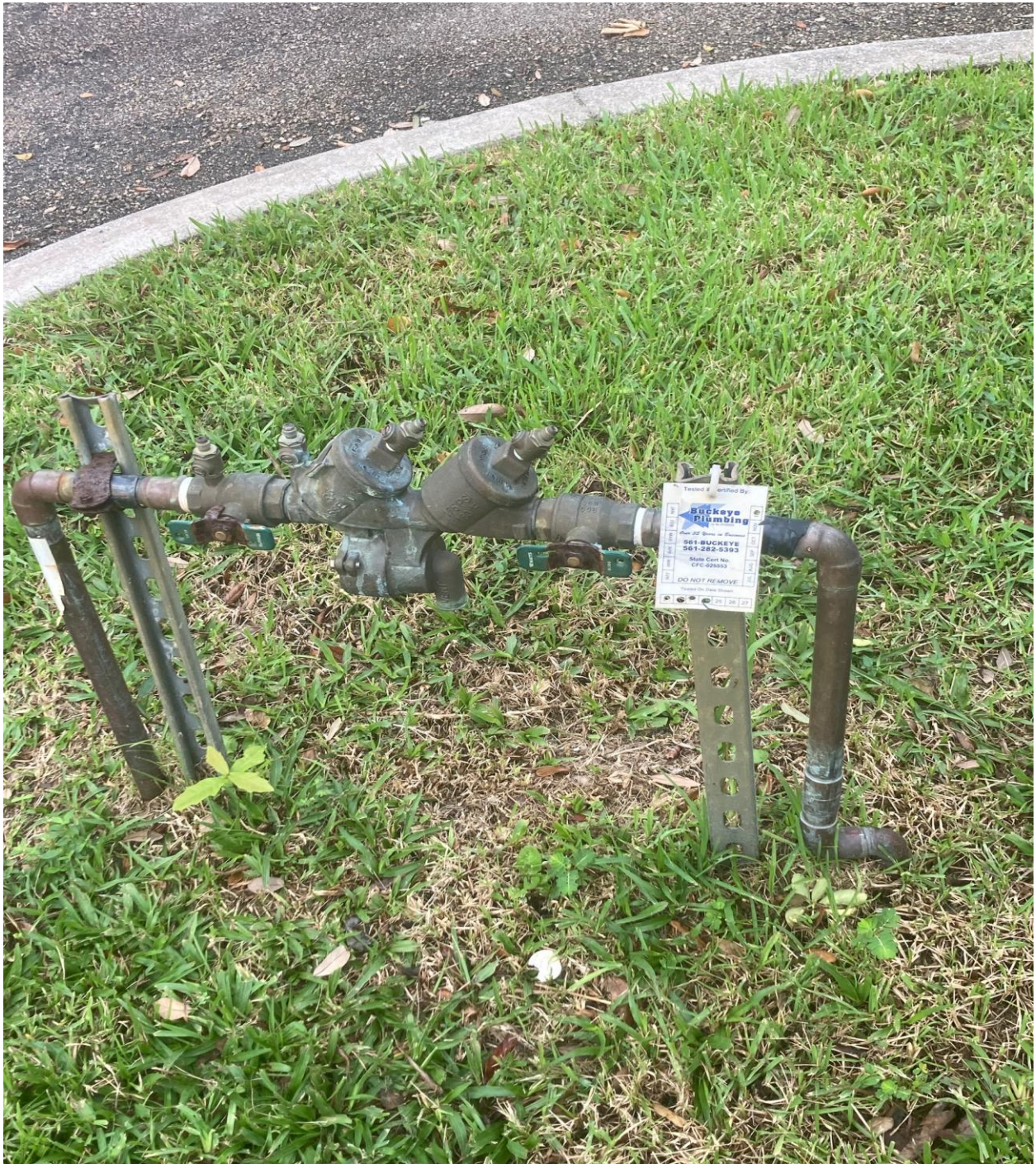
UCO OFFICE- POTABLE WATER BACKFLOW VALVES AT THE FIVE BUILDINGS OWNED BY UCO WERE INSPECTED BY BUCKEYE PLUMBING ON 11/5.