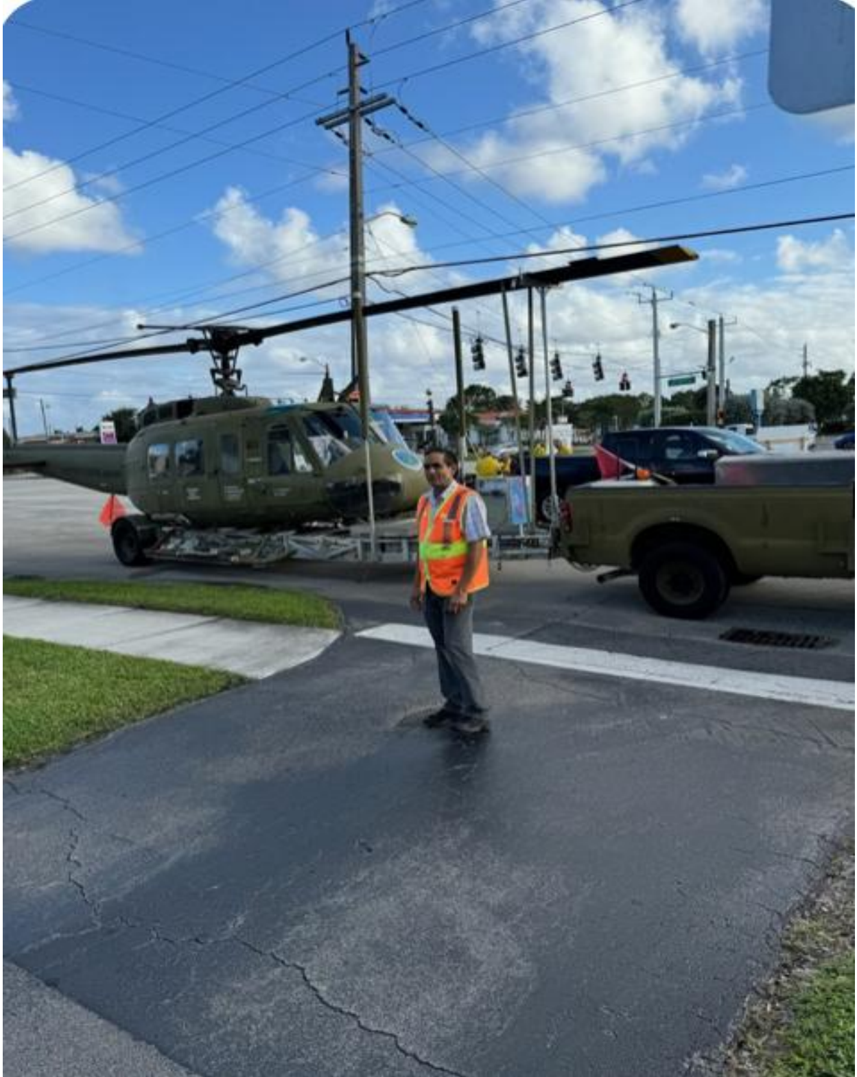
OKEECHOBEE BOULEVARD ENTRANCE- TRAILERED HELICOPTERS ARE ALSO NOT PERMITTED TO ENTER CV.