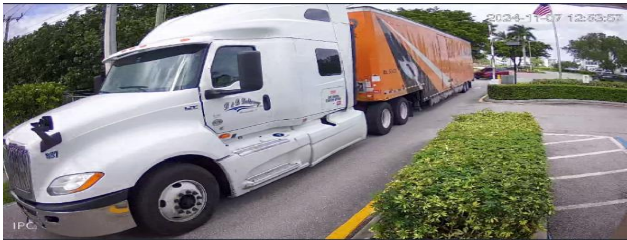
OKEECHOBEE BOULEVARD ENTRANCE- OVER FORTY FOOT MOVING VAN DENIED ENTRY ON 11/7. PLEASE TELL NEW RESIDENTS ABOUT OUR NO OVER FORTY FOOT RULE. THESE THINGS ARE HARD TO TURN AROUND AND THEY TEAR UP OUR ROADS.