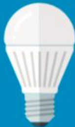
Energy efficient LED lightbulbs