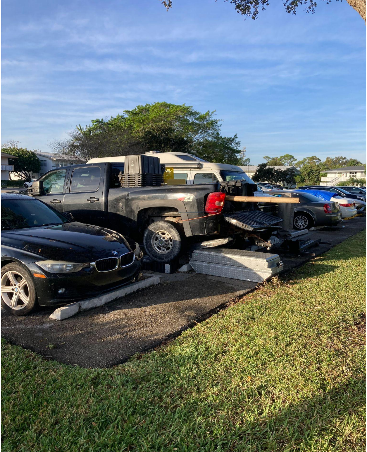
NORTHAMPTON G- JUNK TRUCK WITH NO LICENSE PLATE. REPORTED TO PBC CODE ENFORCEMENT, # C-2024-11210009. THIS TRUCK HAS SINCE BEEN REMOVED FROM CV.