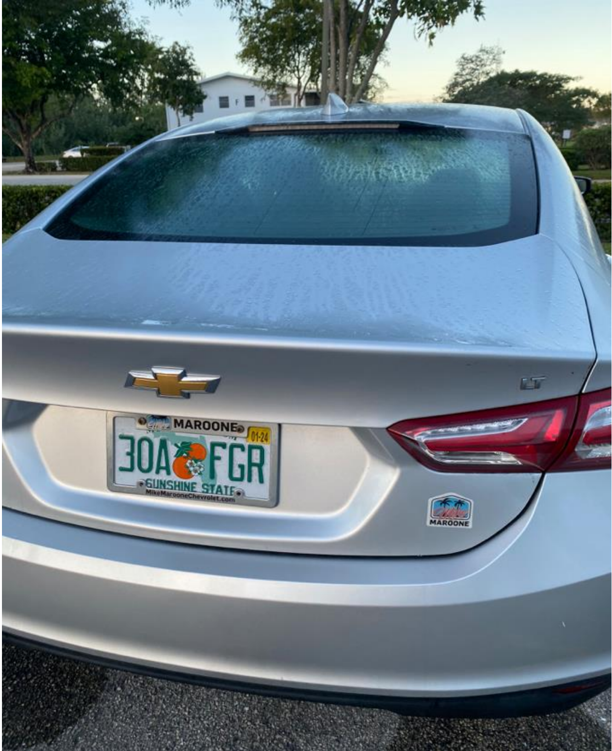
WELLINGTON K- CAR WITH EXPIRED REGISTRATION TAG. REPORTED IN BY A CV UNIT OWNER. REPORT WAS SENT TO PBC CODE ENFORCEMENT, # C-2024-11180011.