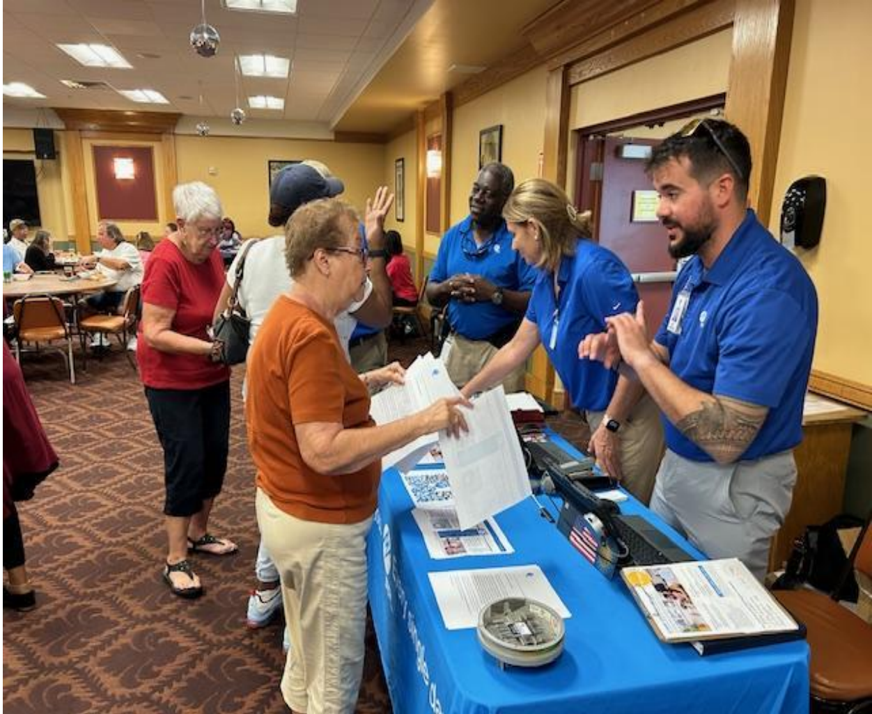
CV CLUBHOUSE- CV UNIT OWNERS SIGNED UP FOR THE FPL POWER TO SAVE PROGRAM, WHICH CAN HELP WITH REDUCING UTILITY BILLS.