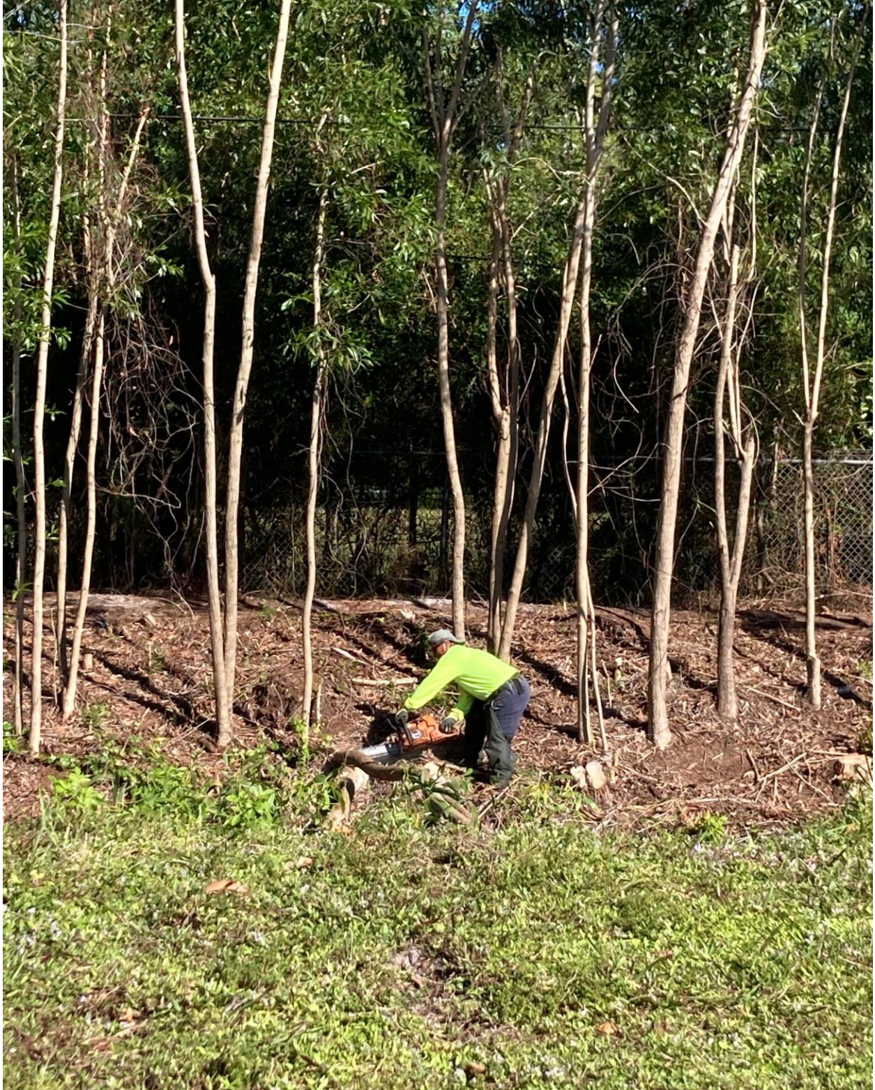
NORTH CANAL- LAND CLEARING WORK BY SEACREST SERVICES CONTINUES.