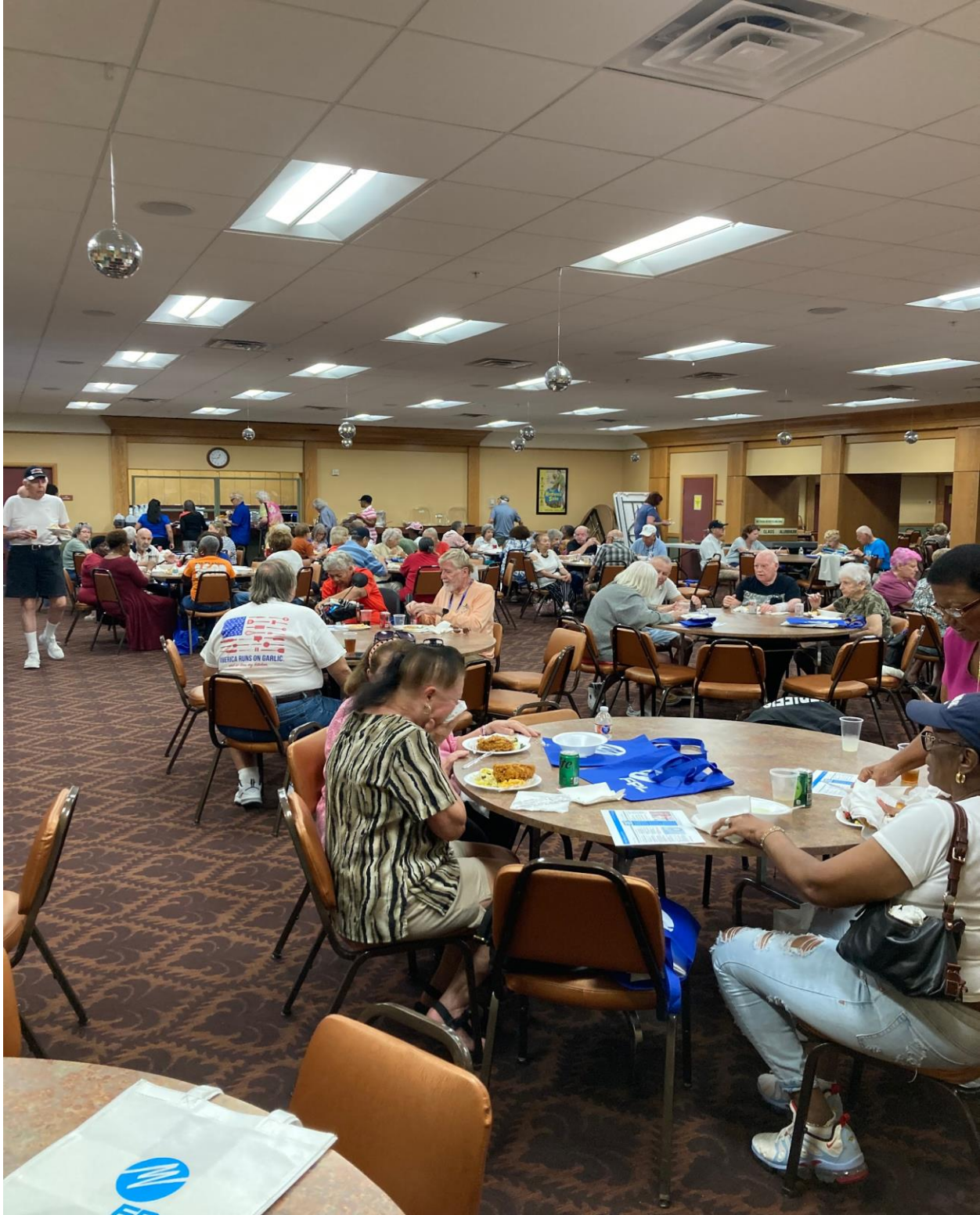
CV CLUBHOUSE- A GOOD SIZED CROWD ATTENDED THE 11/19 FPL INFORMATIONAL LUNCHEON.