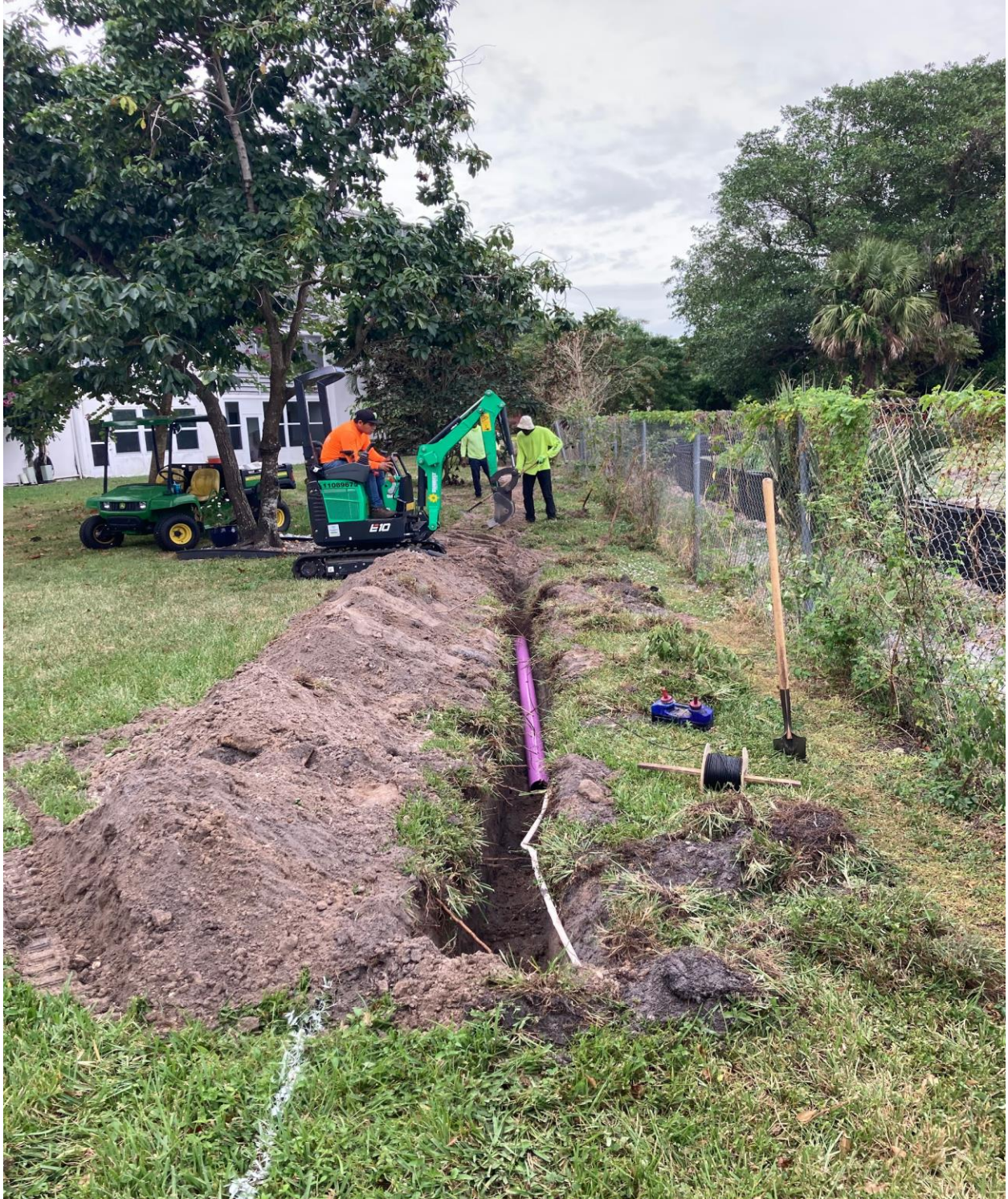
GREENBRIER SECTION- SEACREST SERVICES CONTINUE WORK ON THE IRRIGATION REROUTE PROJECT.