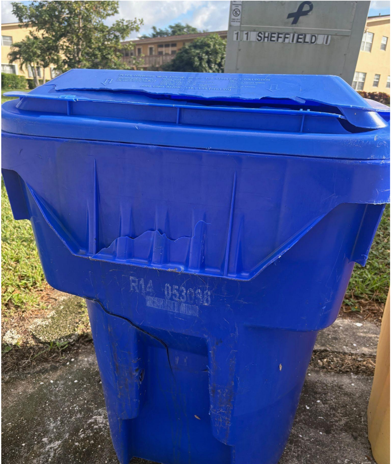
SHEFFIELD I- CRACKED BLUE RECYCLE BIN. REPORTED IN BY A CV UNIT NUMBER. A REQUEST FOR REPLACEMENT WAS SENT TO WASTE PRO.