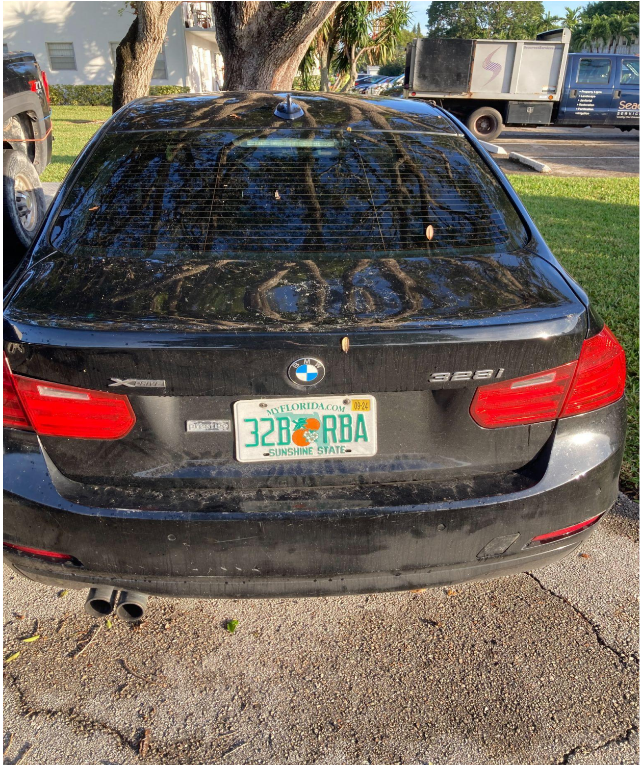
NORTHAMPTON G- CAR WITH EXPIRED REGISTRATION TAG. REPORTED TO PBC CODE ENFORCEMENT, #C-2024-11210010. THIS CAR HAS SINCE BEEN REMOVED FROM CV.