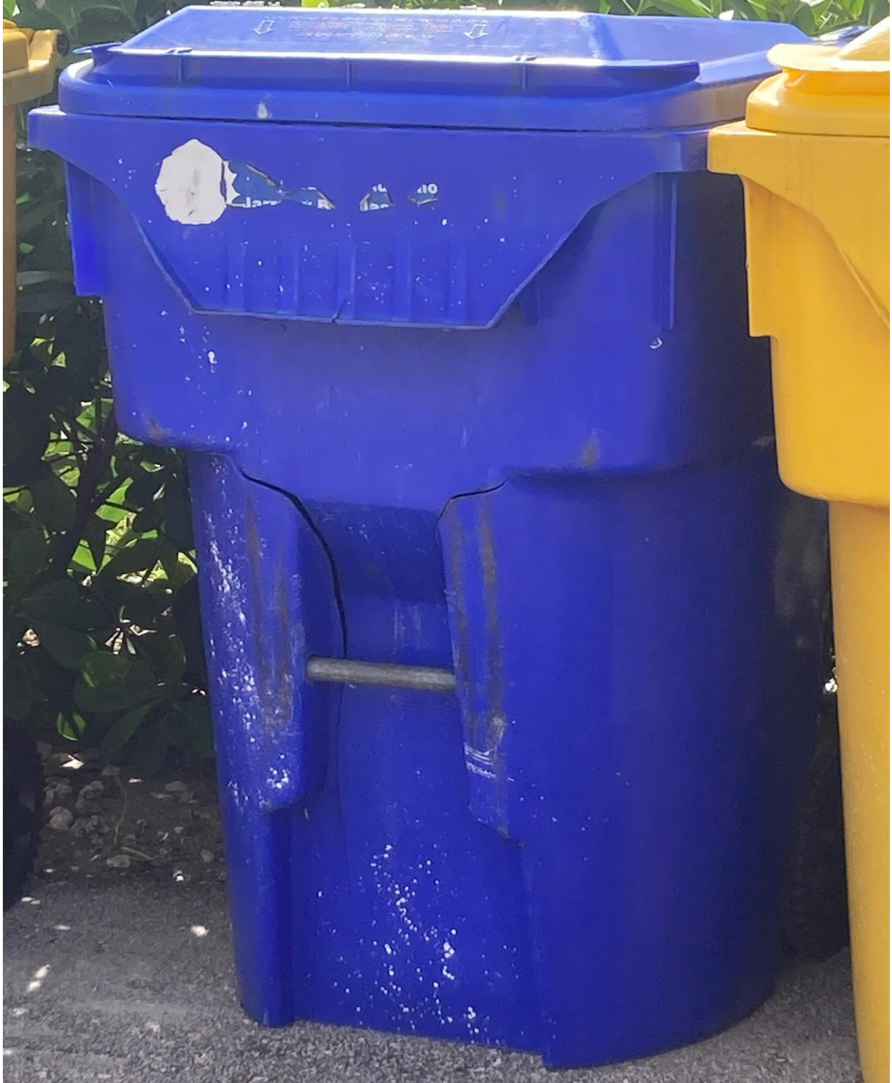
SOUTHAMPTON A- CRACKED BLUE Toter. A REQUEST FOR REPLACEMENT WAS SENT TO WASTE PRO.