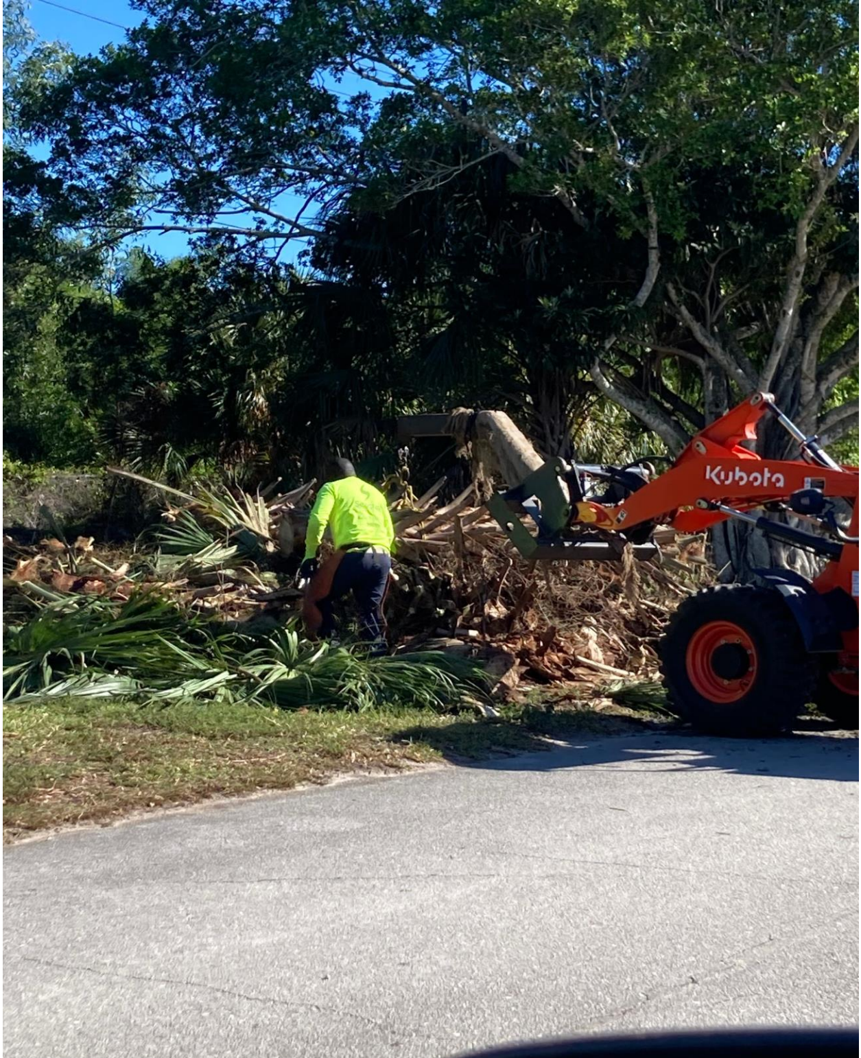
NORTH CANAL- LAND CLEARING WORK BY SEACREST SERVICES CONTINUES.