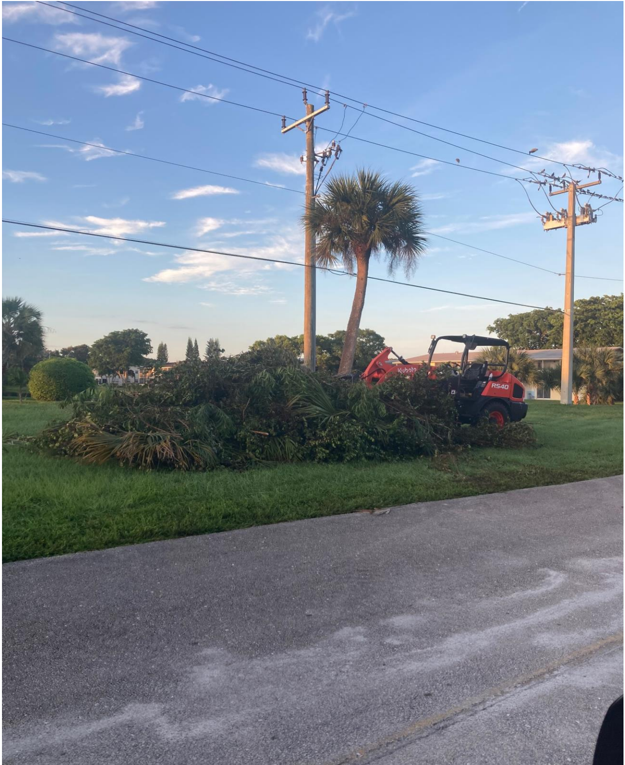
HASTINGS SECTION- JUNGLE CLEARANCE ALONG NORTH CANAL CONTINUES.