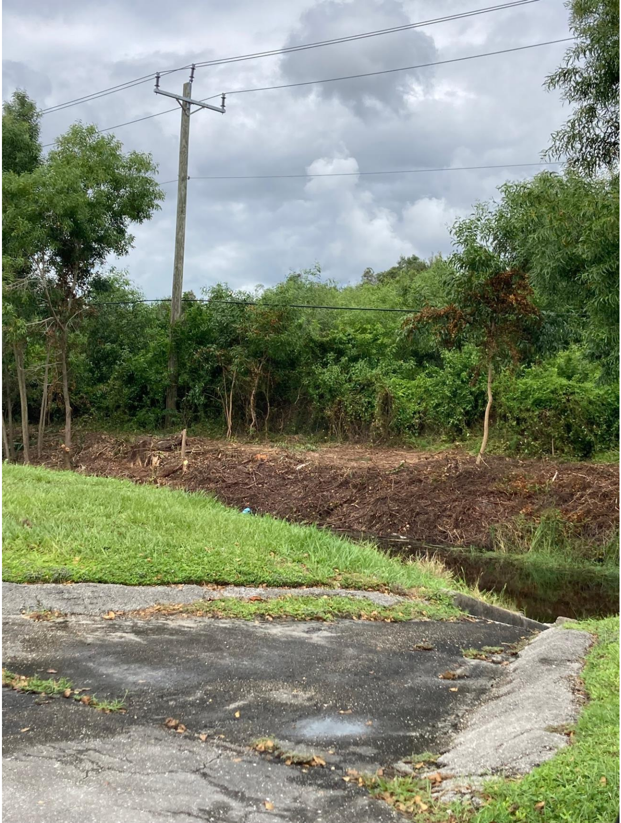
DORCHESTER SECTION- CANAL BANKS HAVE BEEN CLEARED.