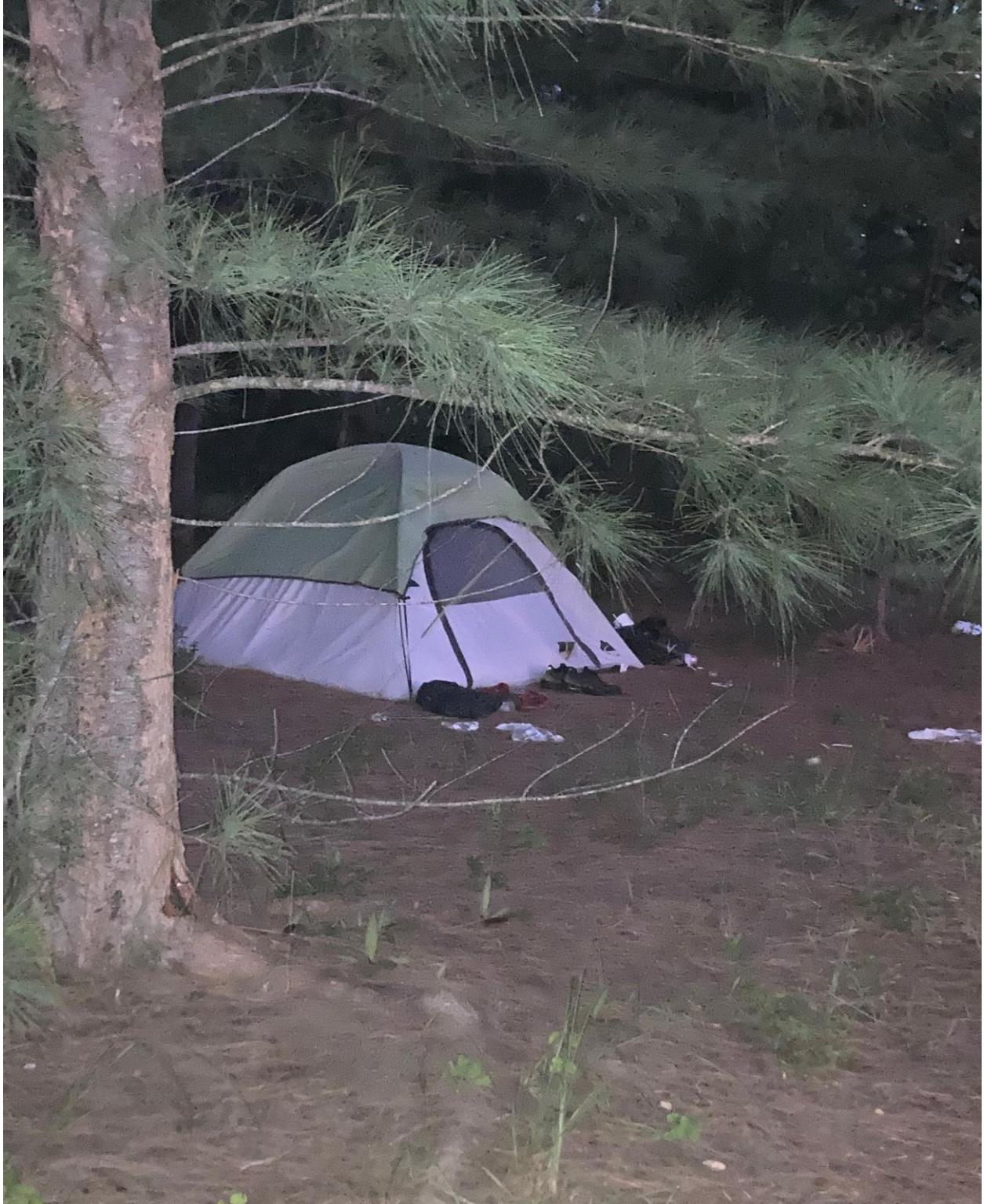
HOMELESS ENCAMPMENT, 6255 OKEECHOBEE BOULEVARD. THIS IS THE VACANT PARCEL THAT IS NEXT TO THE LA QUINTA MOTEL. THIS ENCAMPMENT HAS BEEN REPORTED TO PBSO.