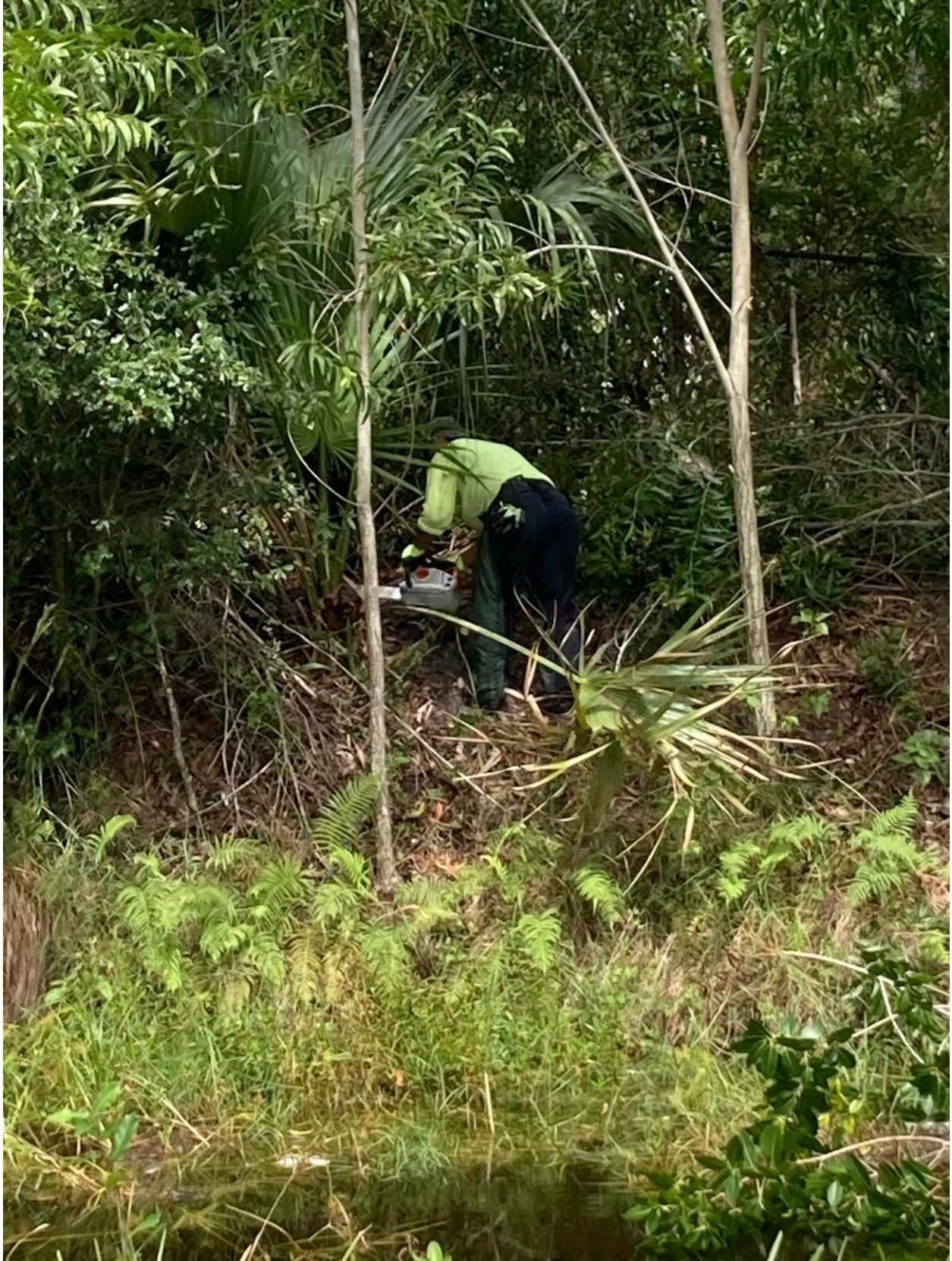
NORTH CANAL- JUNGLE CLEARANCE CONTINUES.