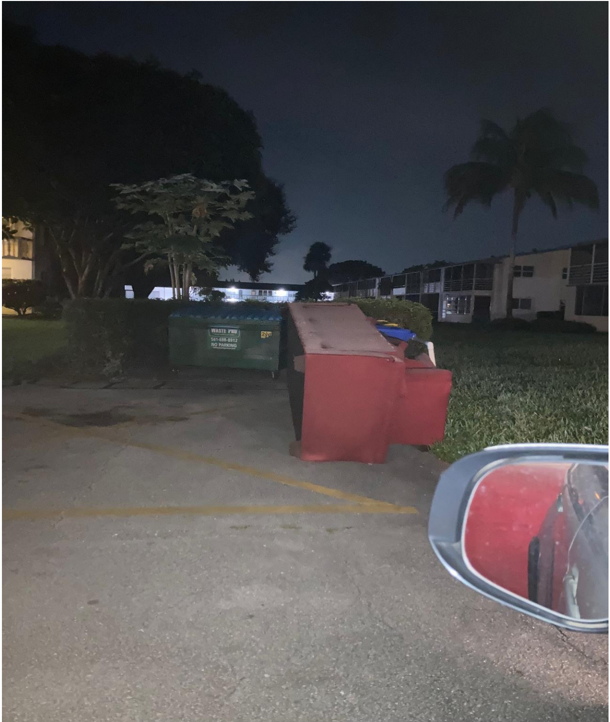
NORTHAMPTON S- MISSED BULK PICKUP, REPORTED IN BY A CV UNIT OWNER. REPORT WAS SENT TO WASTE PRO, AND THE COUCH WAS PICKED UP.