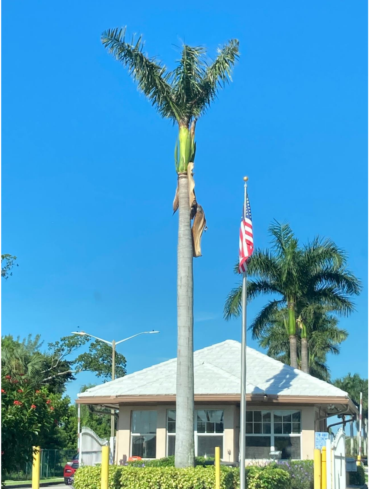
CENTURY BOULEVARD- ANOTHER SICK PALM.