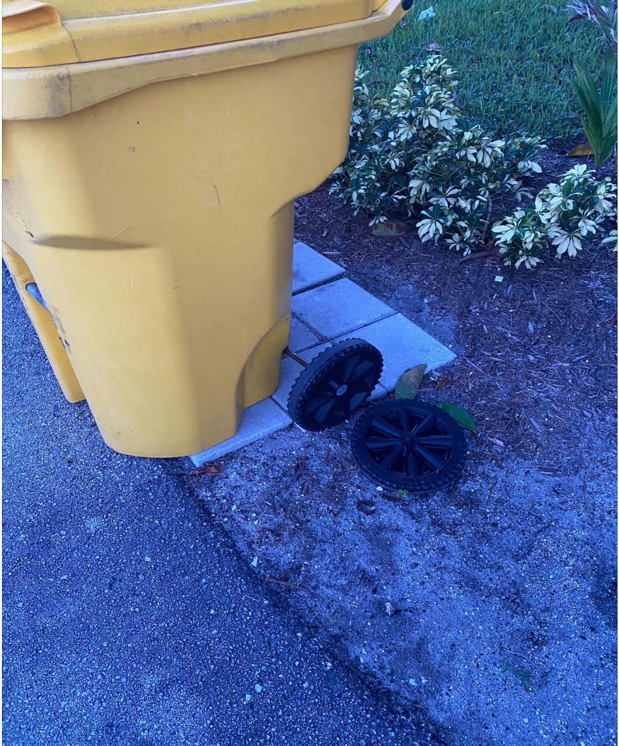
ANDOVER J- YELLOW Toter WITH BUSTED WHEEL. REPORTED IN BY A CV UNIT OWNER. REQUEST FOR REPLACEMENT WAS SENT TO WASTE PRO.