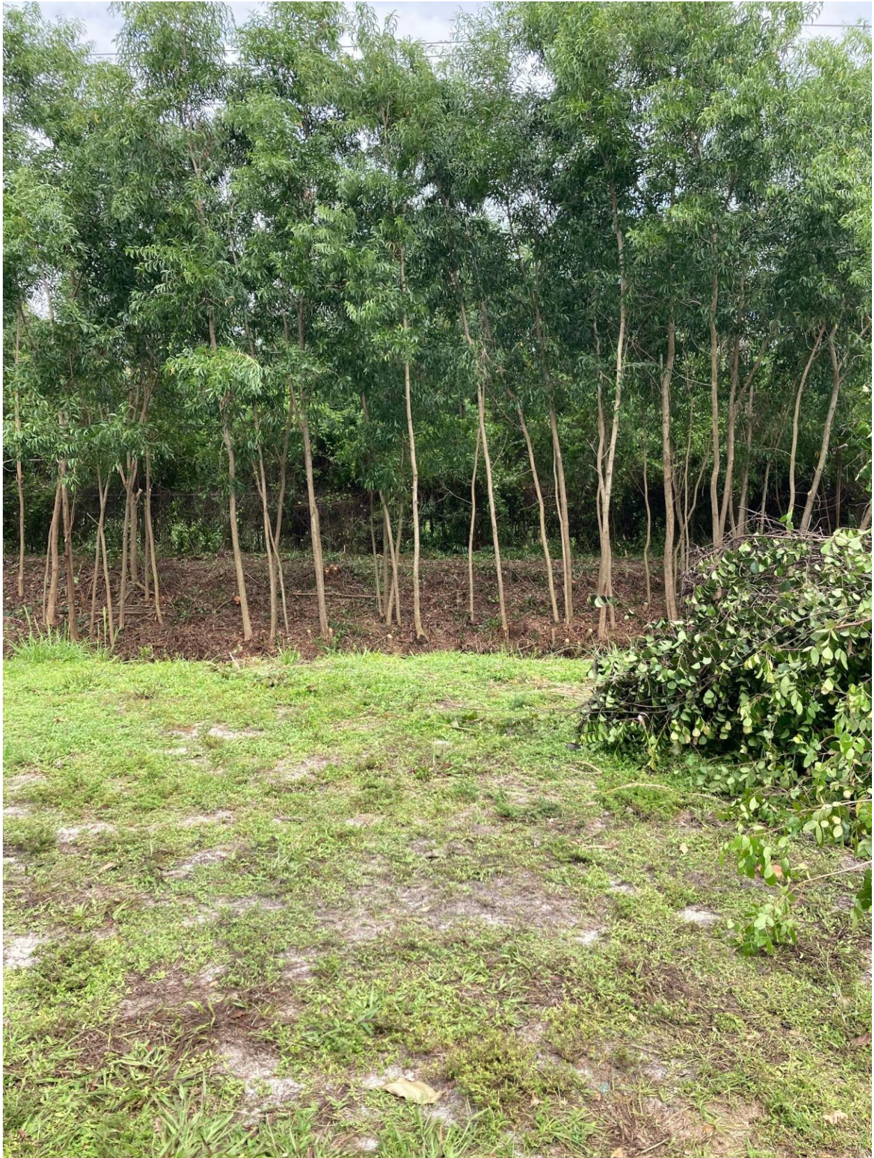
CANTERBURY SECTION- CANAL BANKS HAVE BEEN CLEARED.