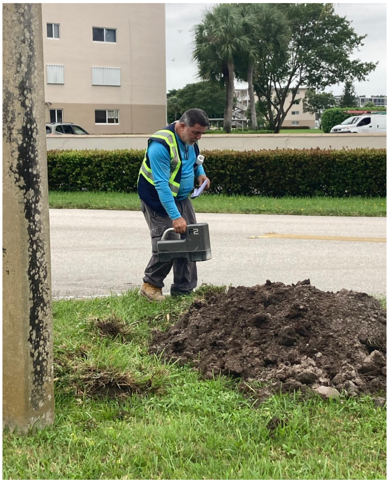
WEST DRIVE, GOLFS EDGE- THIS WORKER IS USING A DOPPLER RADAR DEVICE TO CONFIRM THE LOCATION AND DEPTH OF THE NEW UNDERGROUND IRRIGATION LINE.