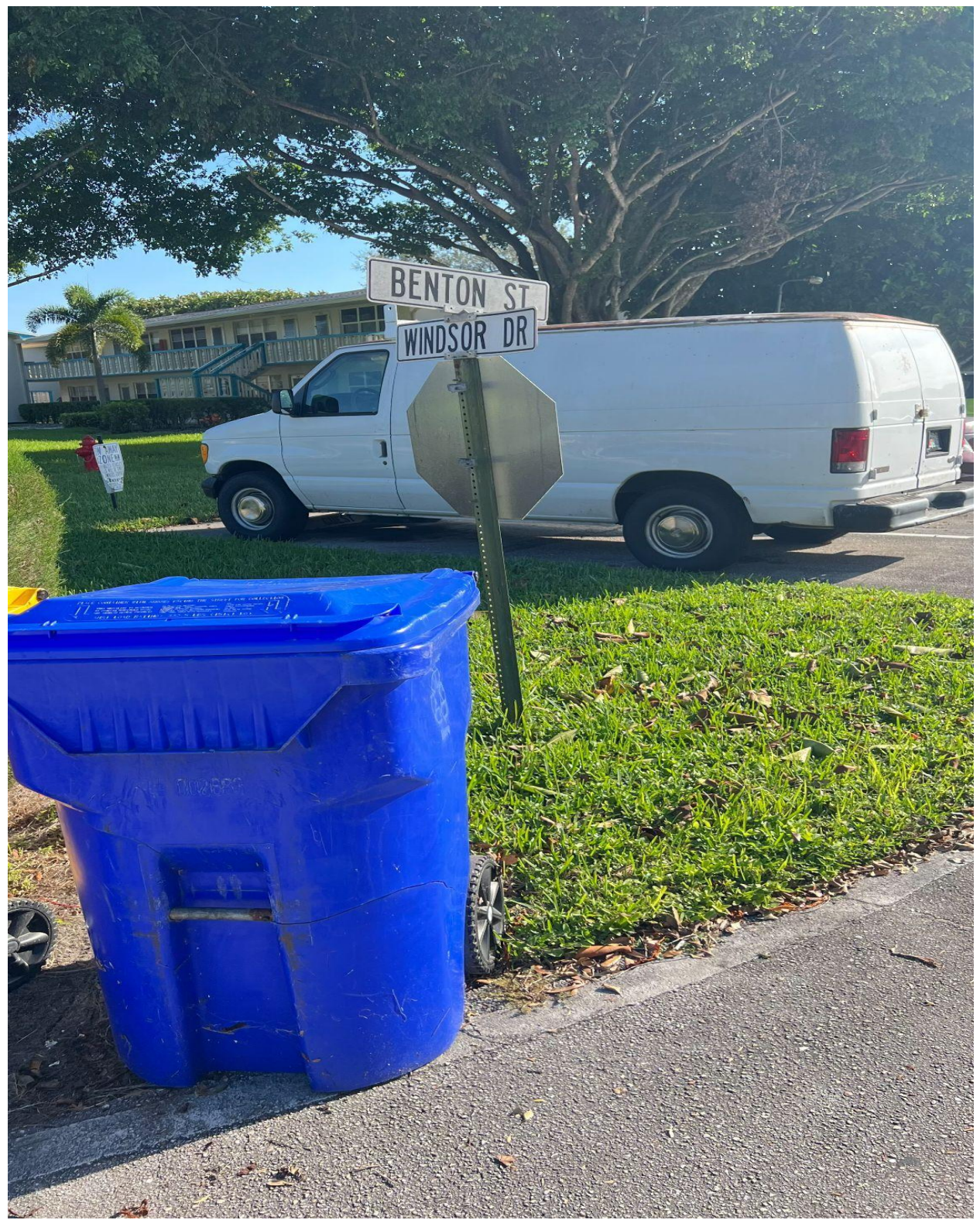
CAMDEN I- BUSTED BLUE TOTER, REPORTED IN BY A CV UNIT OWNER. A REQUEST FOR REPLACEMENT WAS SENT TO WASTE PRO.