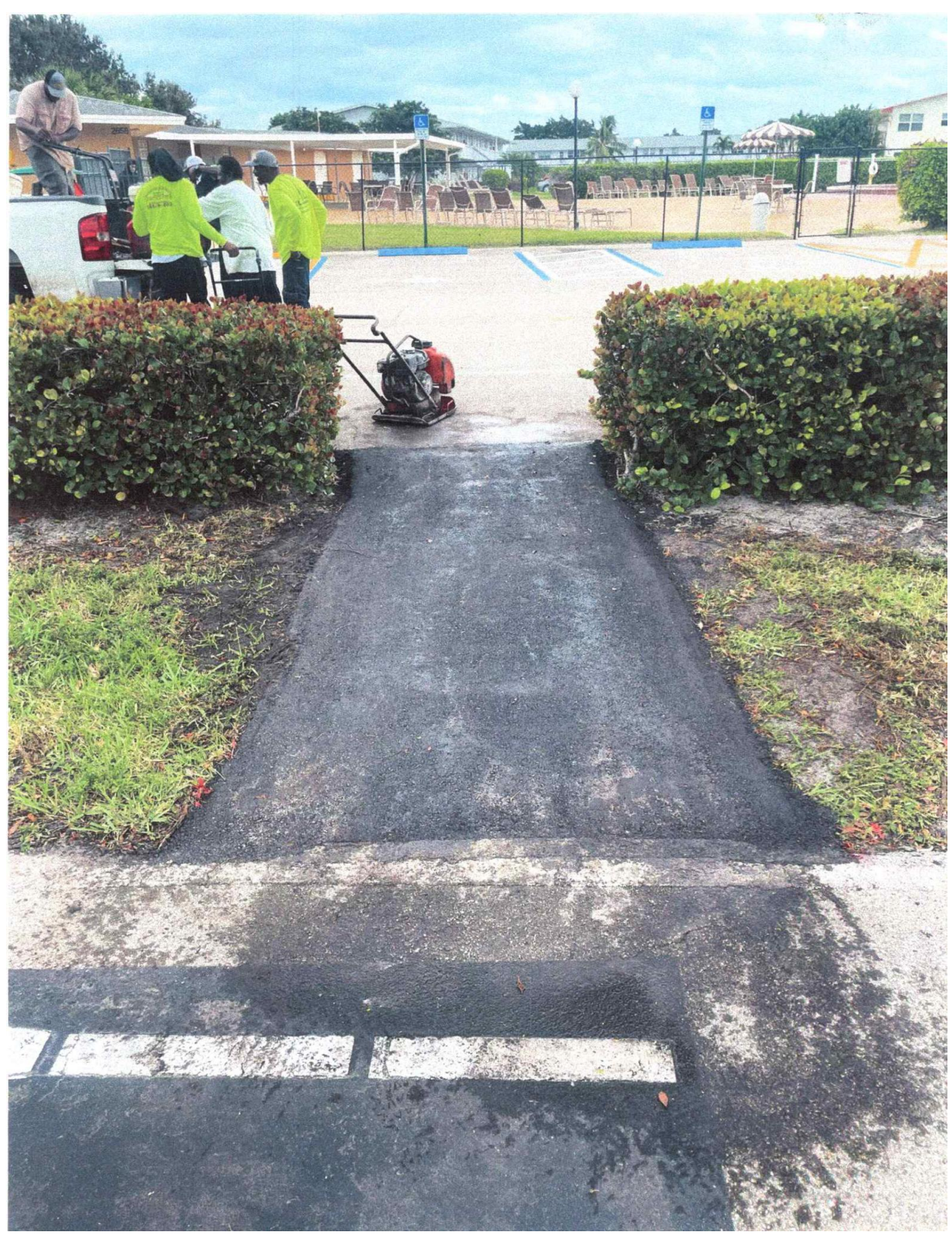
WEST DRIVE- WALKWAY REPAIR COMPLETE.