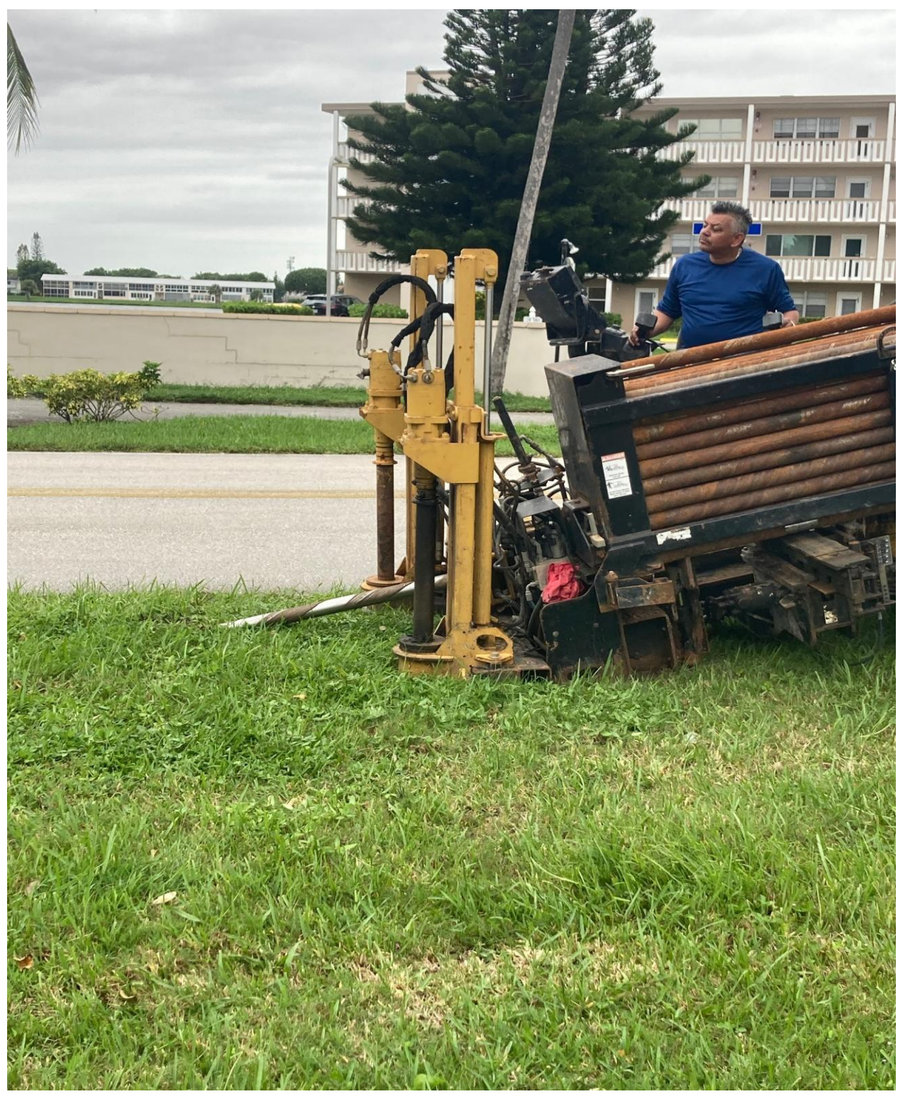
WEST DRIVE, GOLFS EDGE- PELLICO ENGINEERING USED UNDERGROUND BORING EQUIPMENT TO INSTALL NEW IRRIGATION LINES. THIS METHOD REDUCES DAMAGE TO LAWNS, PAVEMENTS, AND OTHER UNDERGROUND UTILITIES.