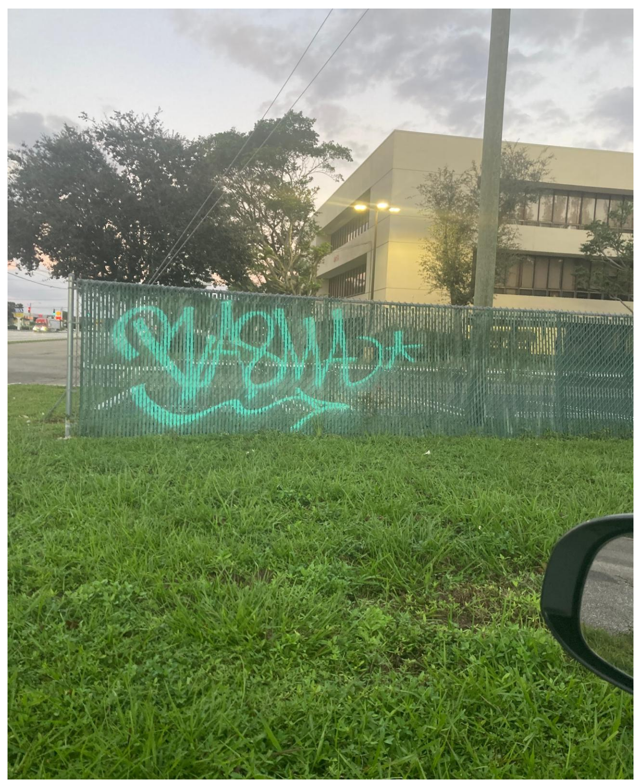
5843 OKEECHOBEE BOULEVARD- GANG GRAFFITI. THE PROPERTY OWNER HAS BEEN NOTIFIED, AND WILL PAINT OVER THIS FENCE.