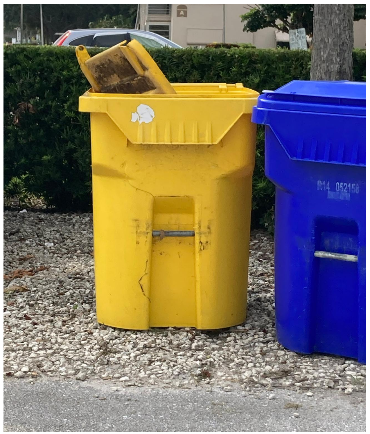
WALTHAM C- YELLOW TOTER WITH BUSTED LID. A REQUEST FOR REPAIR WAS SENT TO WASTE PRO.