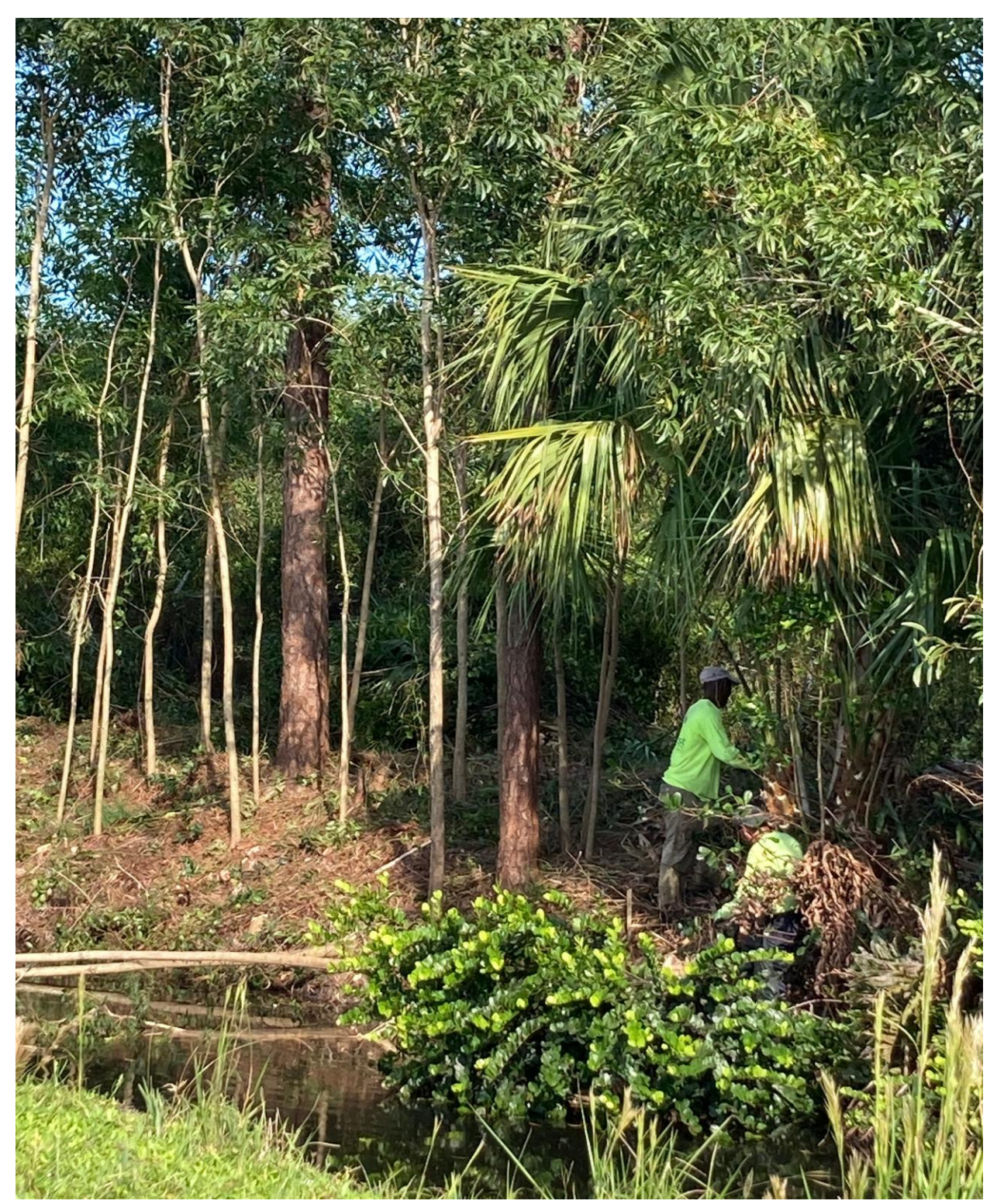
SOUTH CANAL, CANTERBURY SECTION- JUNGLE CLEARANCE CONTINUES.