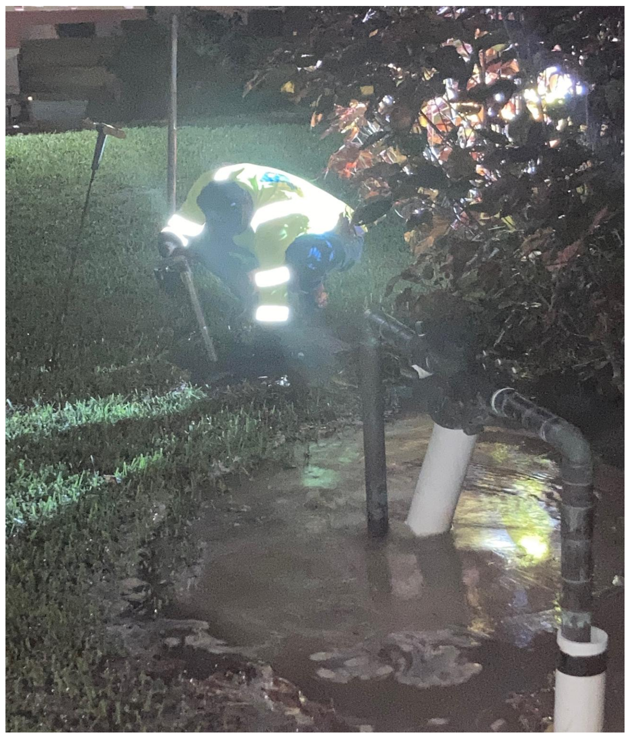
CAMDEN POOL- THE SHUT OFF VALVE FOR THE POOL HOUSE WAS TURNED OFF BY PBC WATER TO STOP THE LEAK. CAMDEN POOL IS CLOSED UNTIL THE LEAK CAN BE REPAIRED.