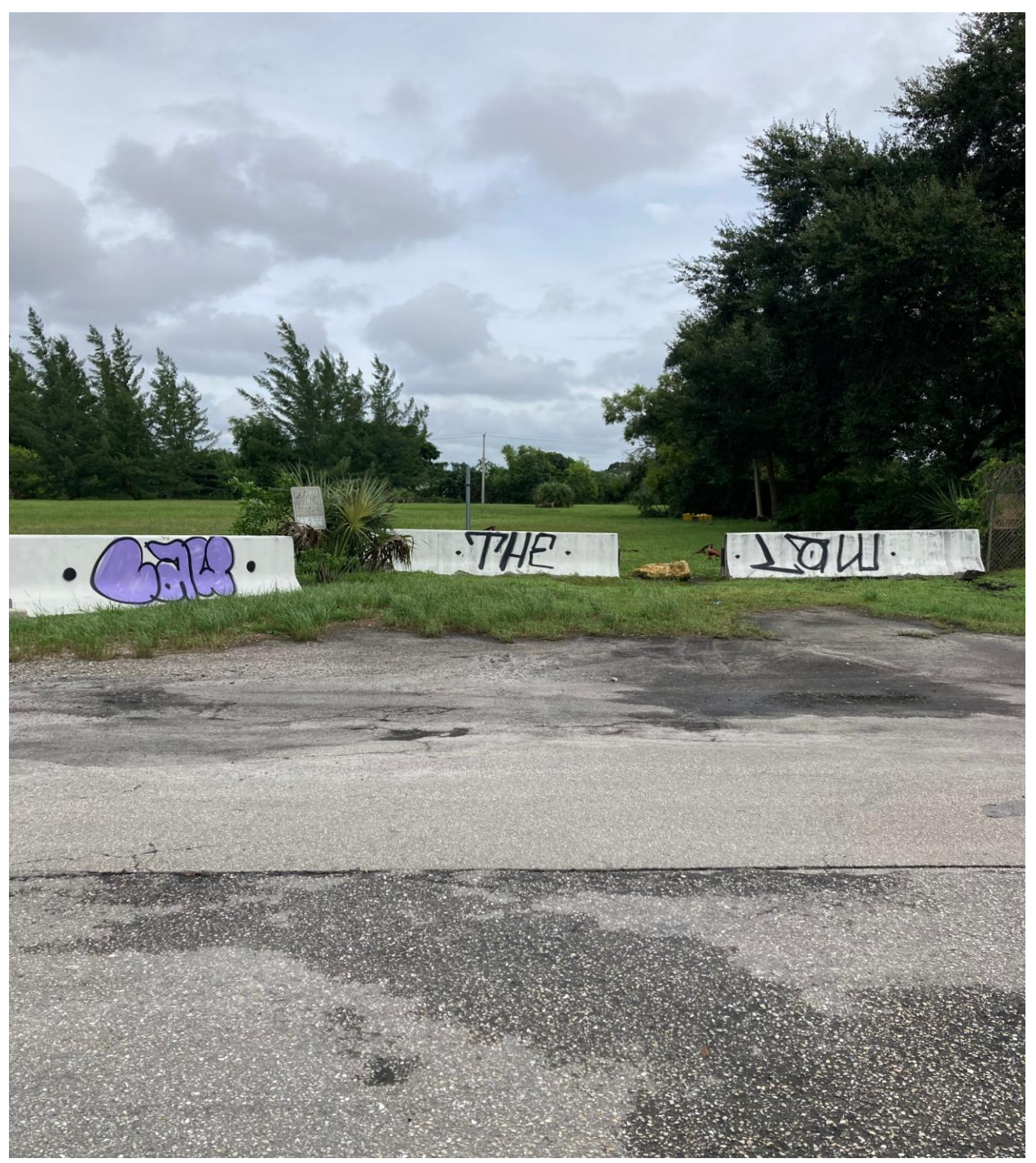
6255 OKEECHOBEE BOULEVARD- GANG GRAFFITI. THIS IS THE VACANT LOT NEXT TO THE LA QUINTA MOTEL. THIS GRAFFITI WAS REPORTED TO THE PROPERTY OWNER, AND HAS SINCE BEEN PAINTED OVER.