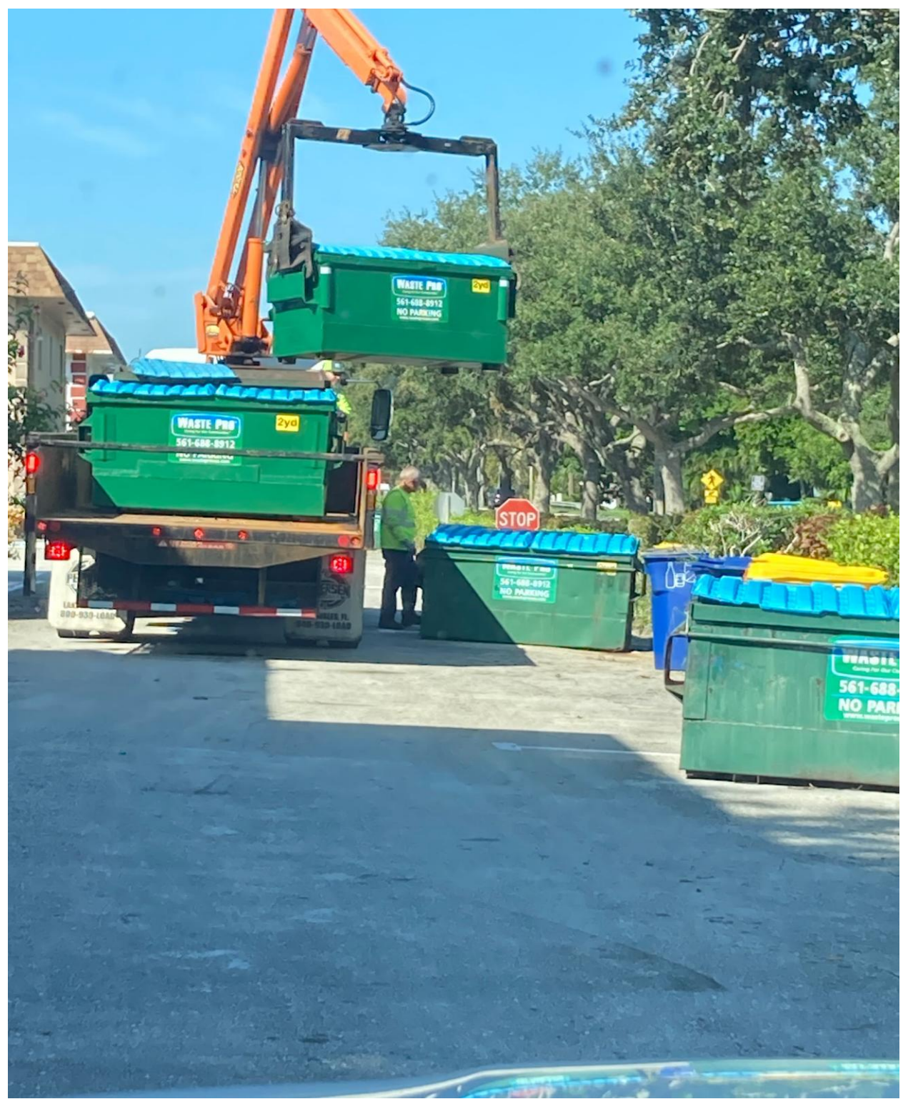
STRATFORD J- RUSTED OUT DUMPSTER REPLACED BY WASTE PRO ON 10/16. THANK YOU!