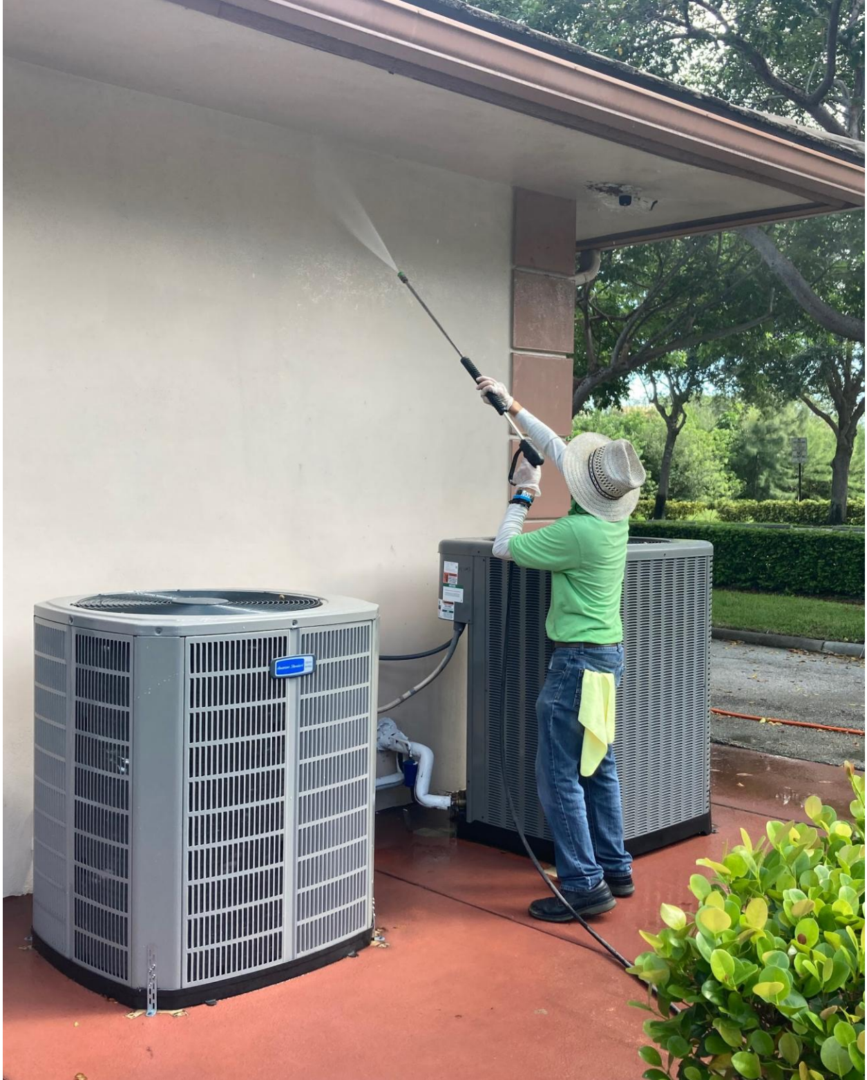
UCO OFFICE- GLOW CLEANING PLUS COMPETED PRESSURE CLEANING OF EXTERIOR AREAS ON 9/21.