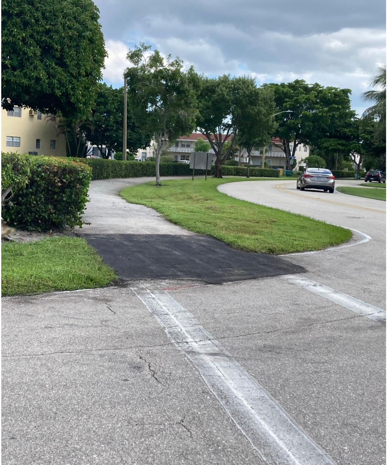
NORTH DRIVE- WALKWAY REPAIR COMPLETE.