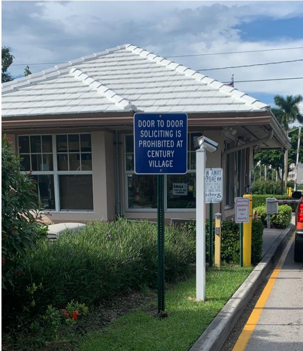
OKEECHOBEE BOULEVARD ENTRANCE- NO SOLICITATION SIGNS WERE INSTALLED AT BOTH ENTRANCES TO CV ON 9/20.