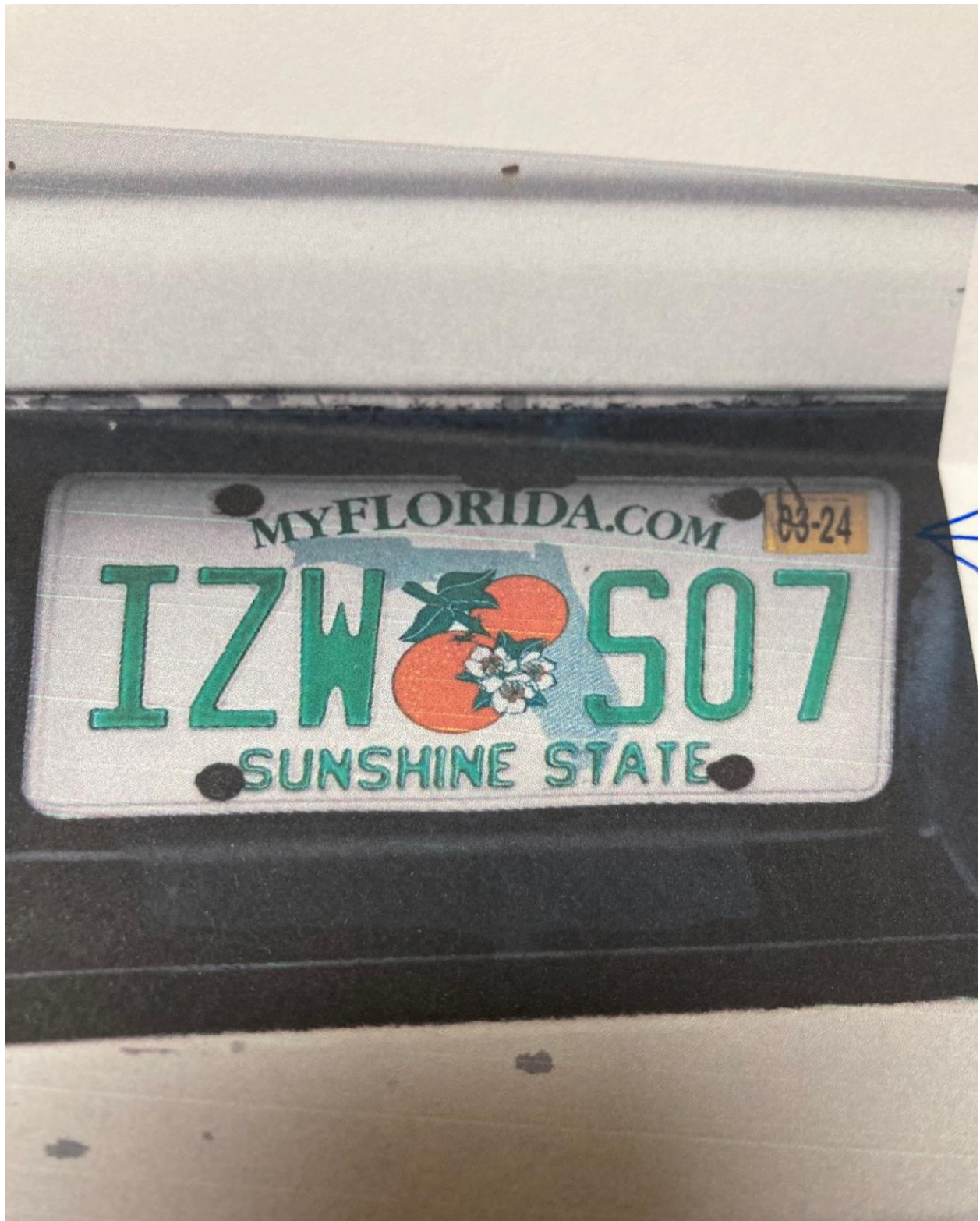
NORWICH H- VAN WITH EXPIRED REGISTRATION TAG. CALLED IN BY A CV UNIT OWNER. REPORTED TO PBC CODE ENFORCEMENT, # C-2024-09170003.