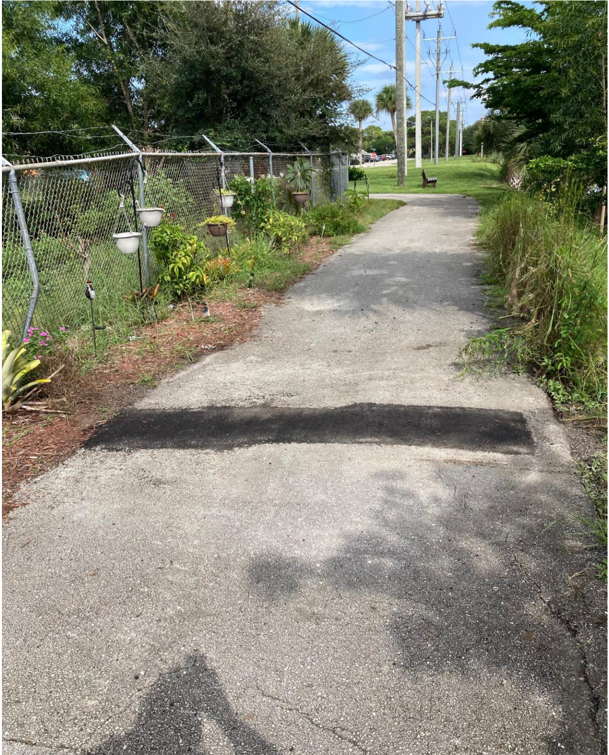
DORCHESTER/HASTINGS WALKWAY- REPAIR COMPLETE.