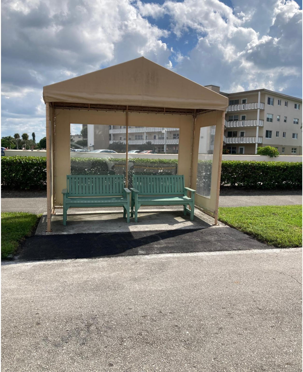
CENTURY BOULEVARD- OLD, UNEVEN PAVERS WERE REPLACED WITH SMOOTH ASPHALT.