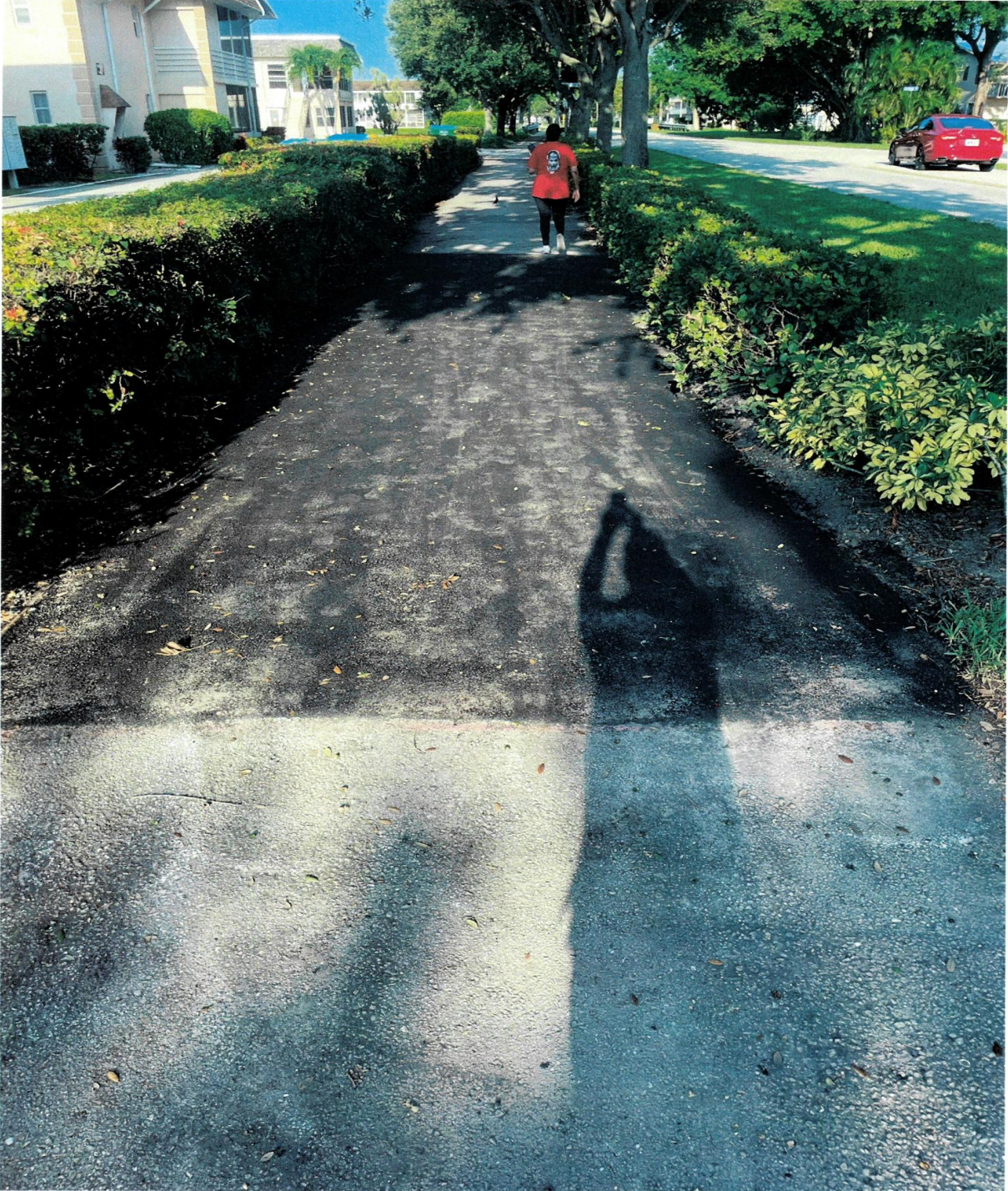
STRATFORD SECTION- THIS SECTION OF WALKWAY WAS PUSHED UP BY TREE ROOTS. SUNSHINE PAVING CUT THE ROOTS AND REPAVED THE WALKWAY.