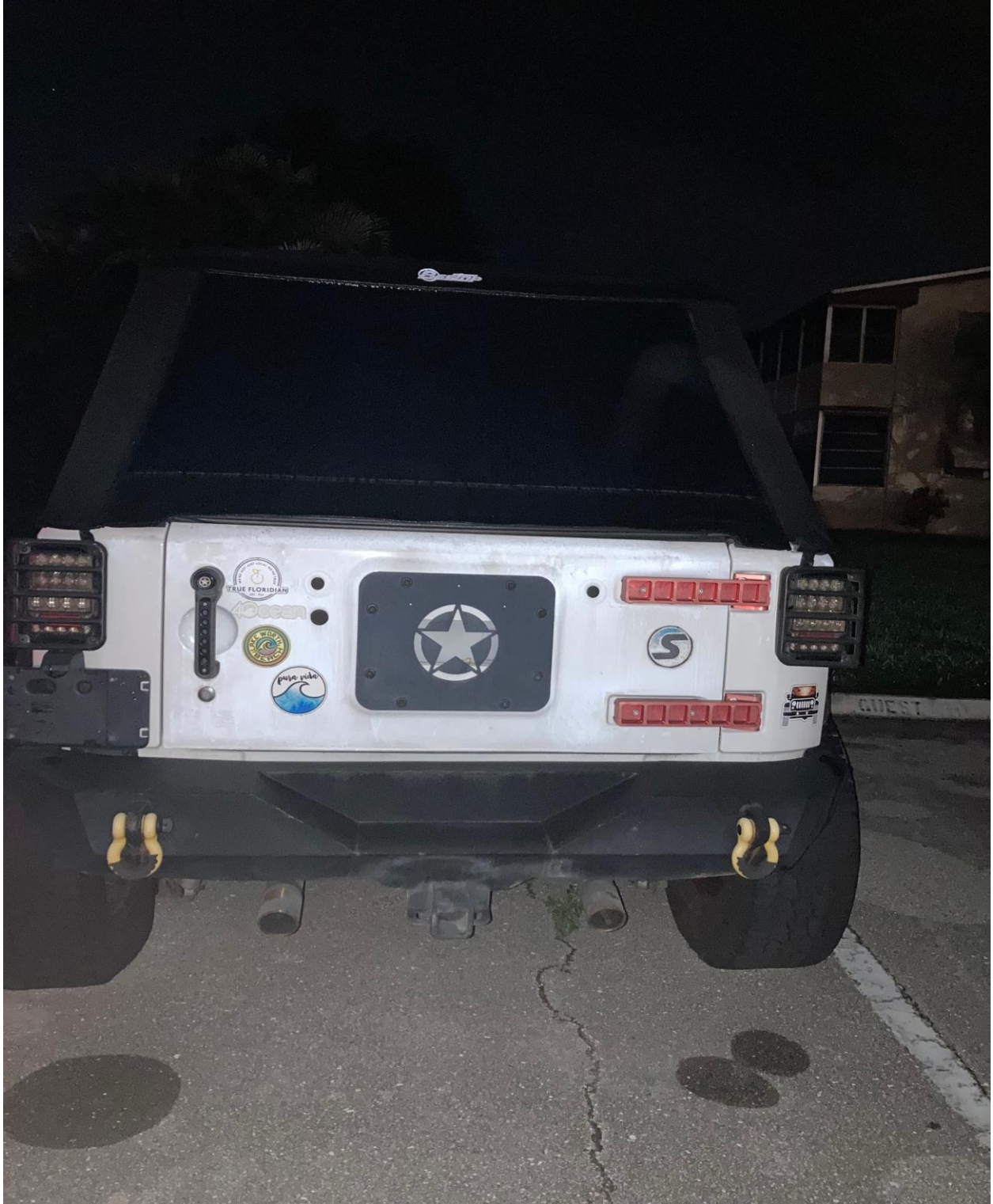
CANTERBURY K- JEEP WITH NO LICENSE PLATE. REPORTED TO PBC CODE ENFORCEMENT, #C-2024-09160002.