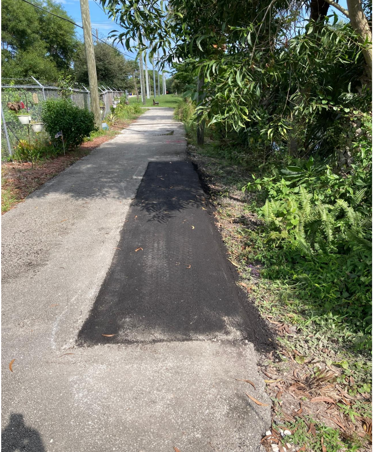
DORCHESTER/HASTINGS WALKWAY- REPAIR COMPLETE.