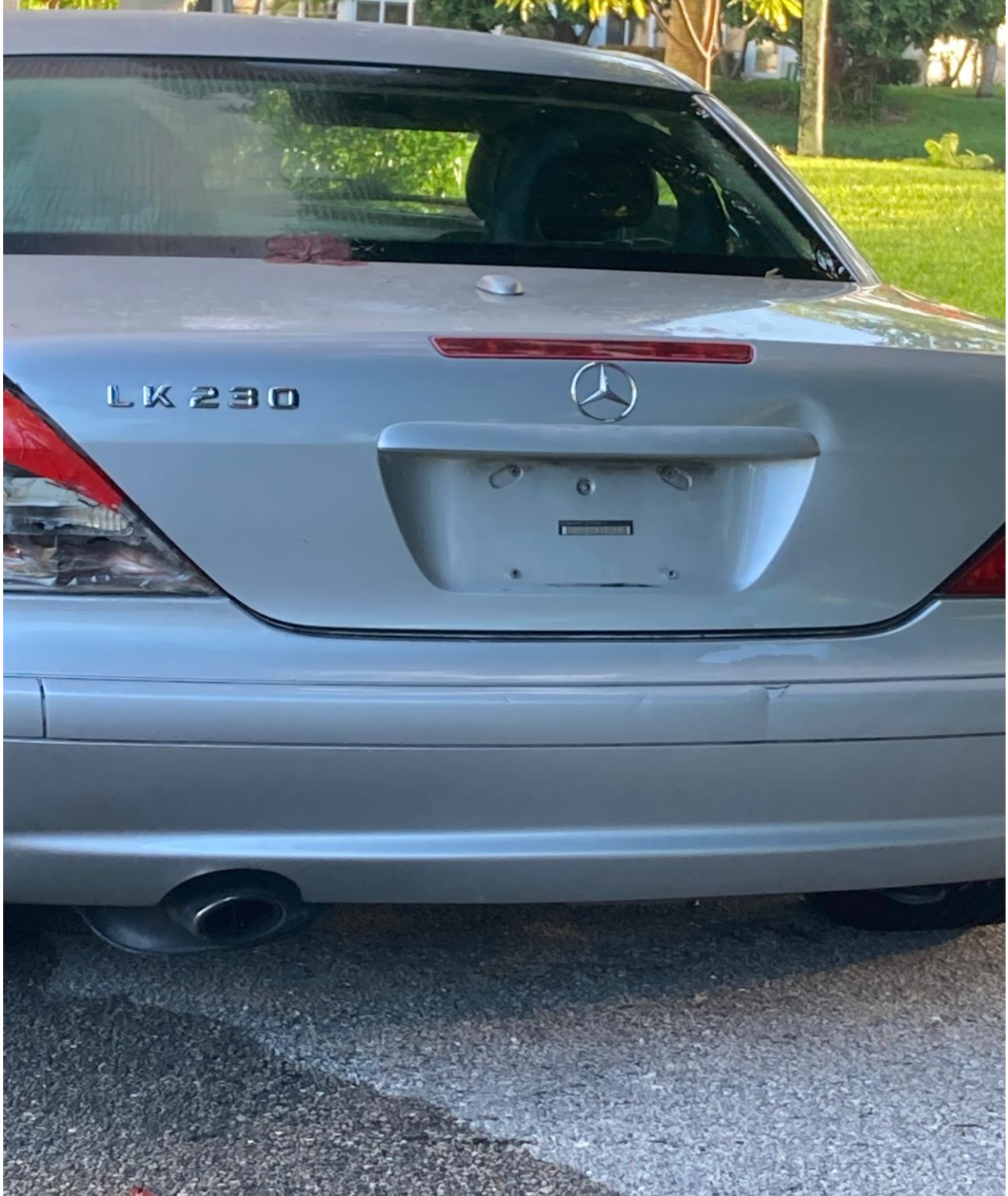
WELLINGTON M- CAR WITH NO LICENSE PLATE. REPORTED TO PBC CODE ENFORCEMENT, COMPLAINT # C-2024-06250010.