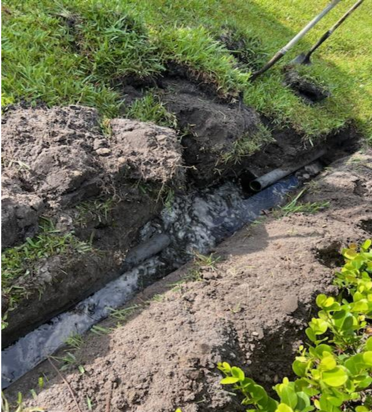
WALTHAM A- THREE INCH UNDERGROUND IRRIGATION PIPE REPAIRED BY SEACREST SERVICES ON 6/26.