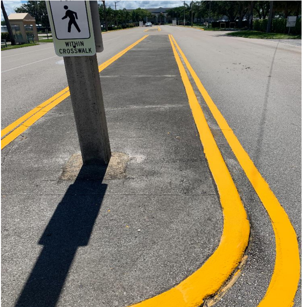
HANDYMAN JOSE CONTINUES WITH LINE, CURB, STOP BAR, AND SPEED BUMP PAINTING. NICE JOB, JOSE!