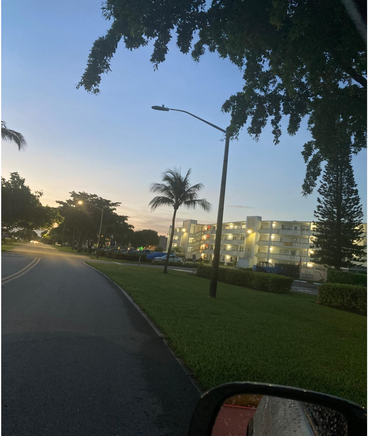
SOUTH DRIVE- DARK STREETLIGHT. REPORTED TO FPL, WORK ORDER #40895.