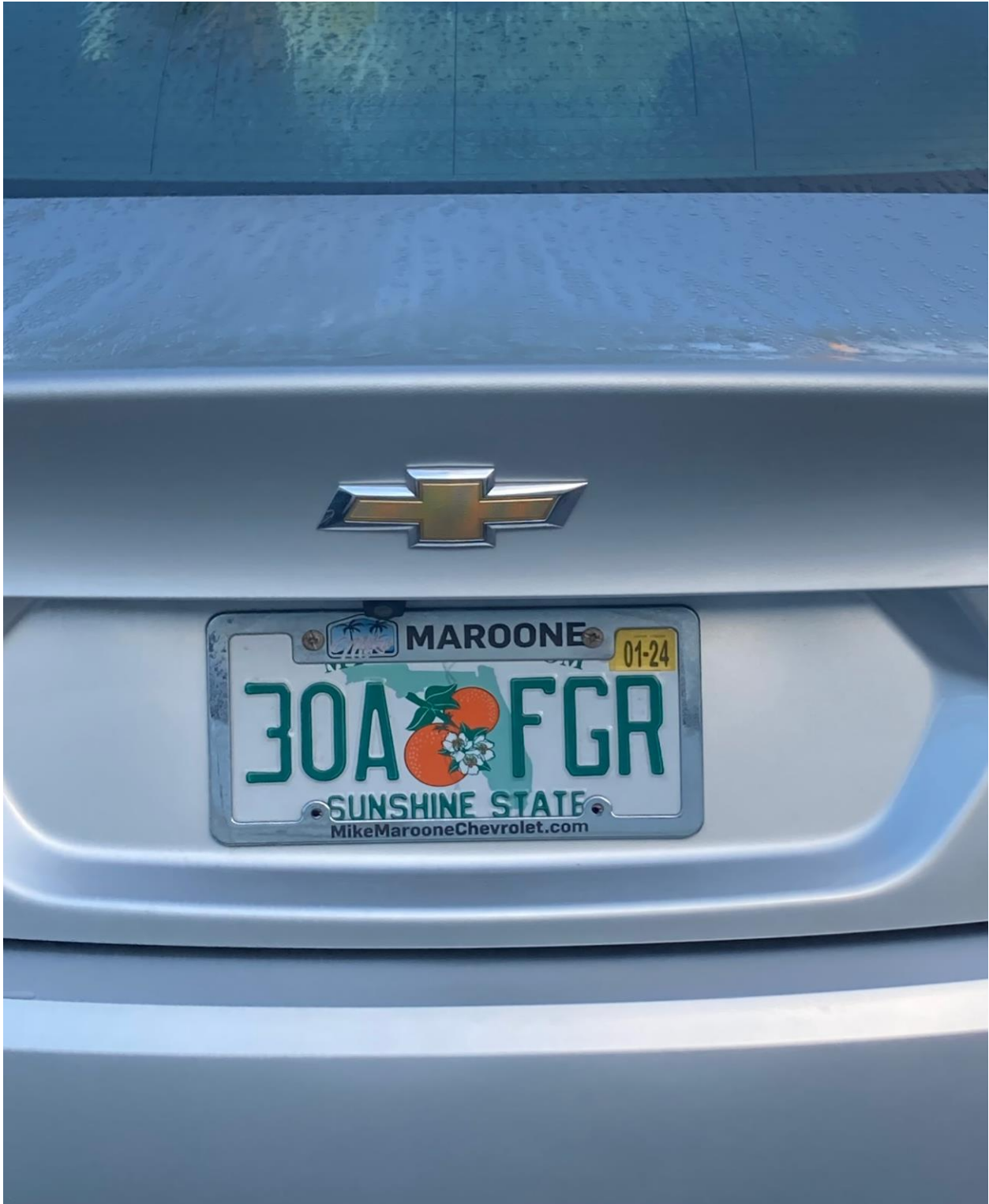
WELLINGTON K- CAR WITH EXPIRED REGISTRATION TAG. REPORTED TO PBC CODE ENFORCEMENT, #C-2024-06250009.