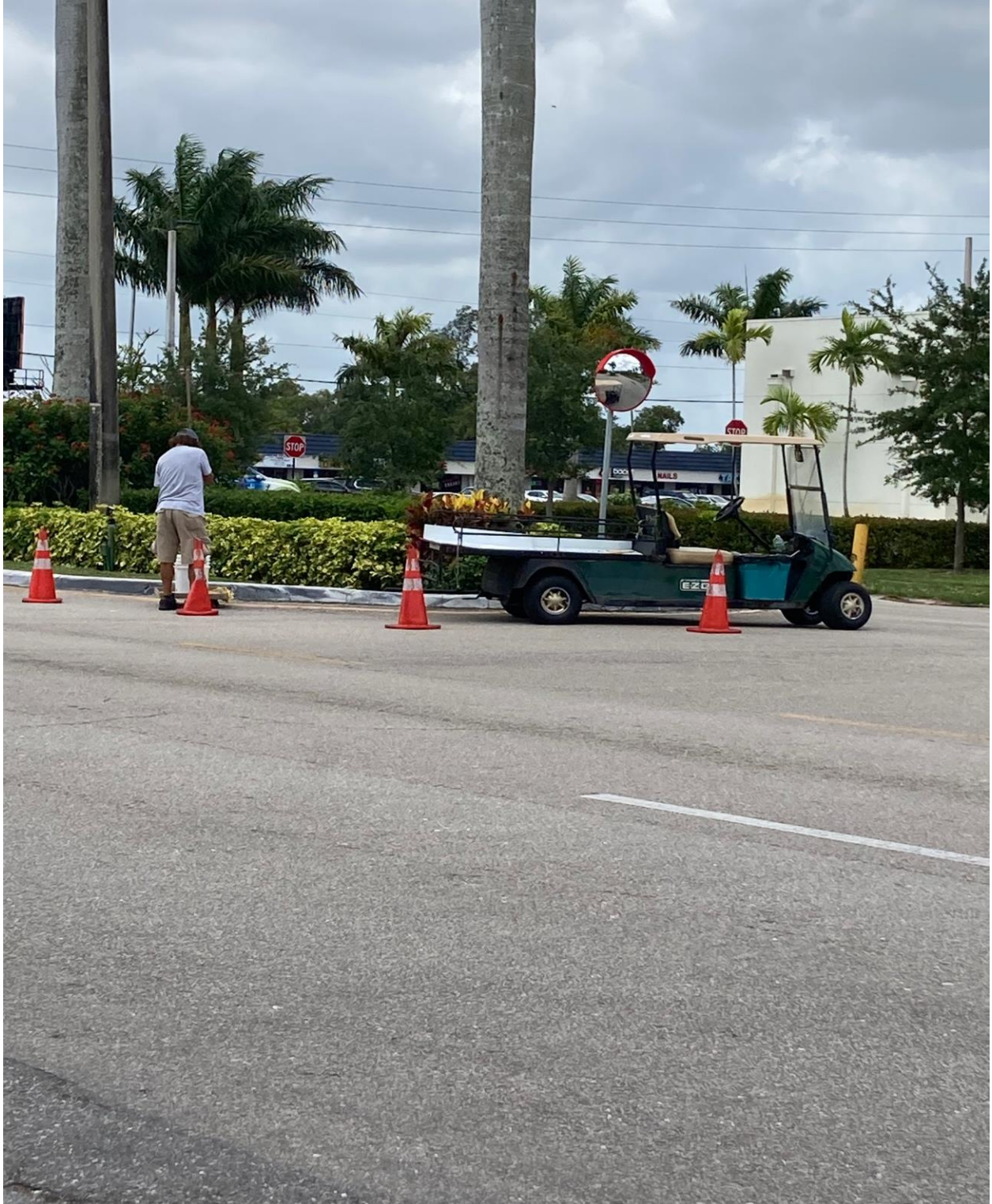
WEST DRIVE- HANDYMAN JOSE CONTINUES WITH ROADWAY PAINTING: CURBS, SPEED BUMPS, STOP BARS.