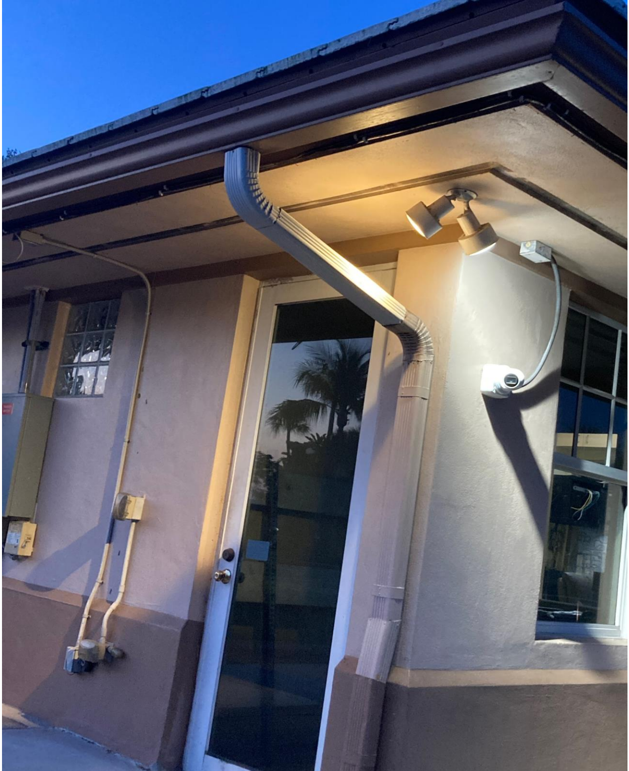
OKEECHOBEE BOULEVARD GUARDHOUSE- RAIN DOWNSPOUT WAS REPAIRED BY GUTTER MONKEYS ON 5/29.