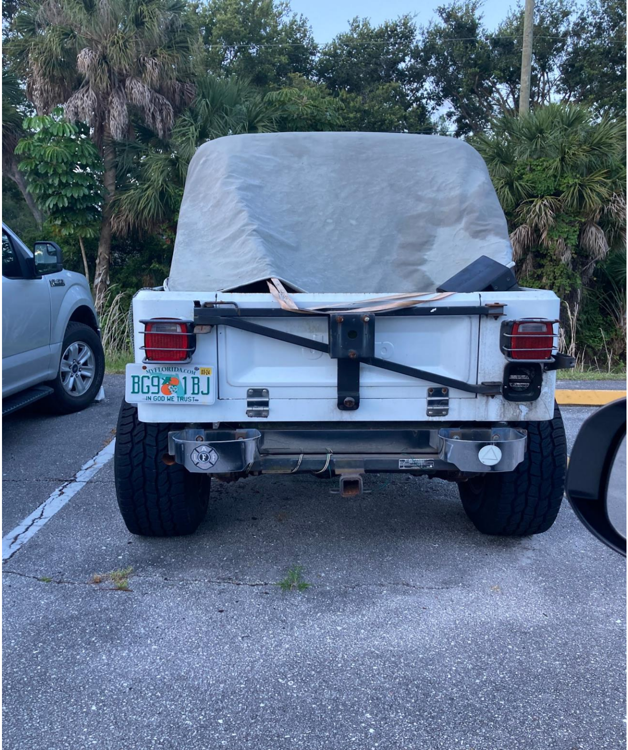
WELLINGTON M- CAR WITH EXPIRED REGISTRATION TAG. REPORTED TO PBC CODE ENFORCEMENT.