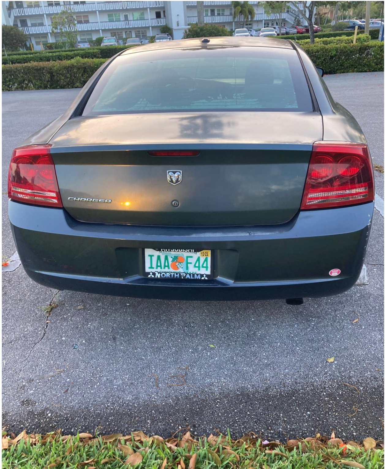
WINDSOR L- CAR WITH EXPIRED REGISTRATION TAG. REPORTED TO PBC CODE ENFORCEMENT.