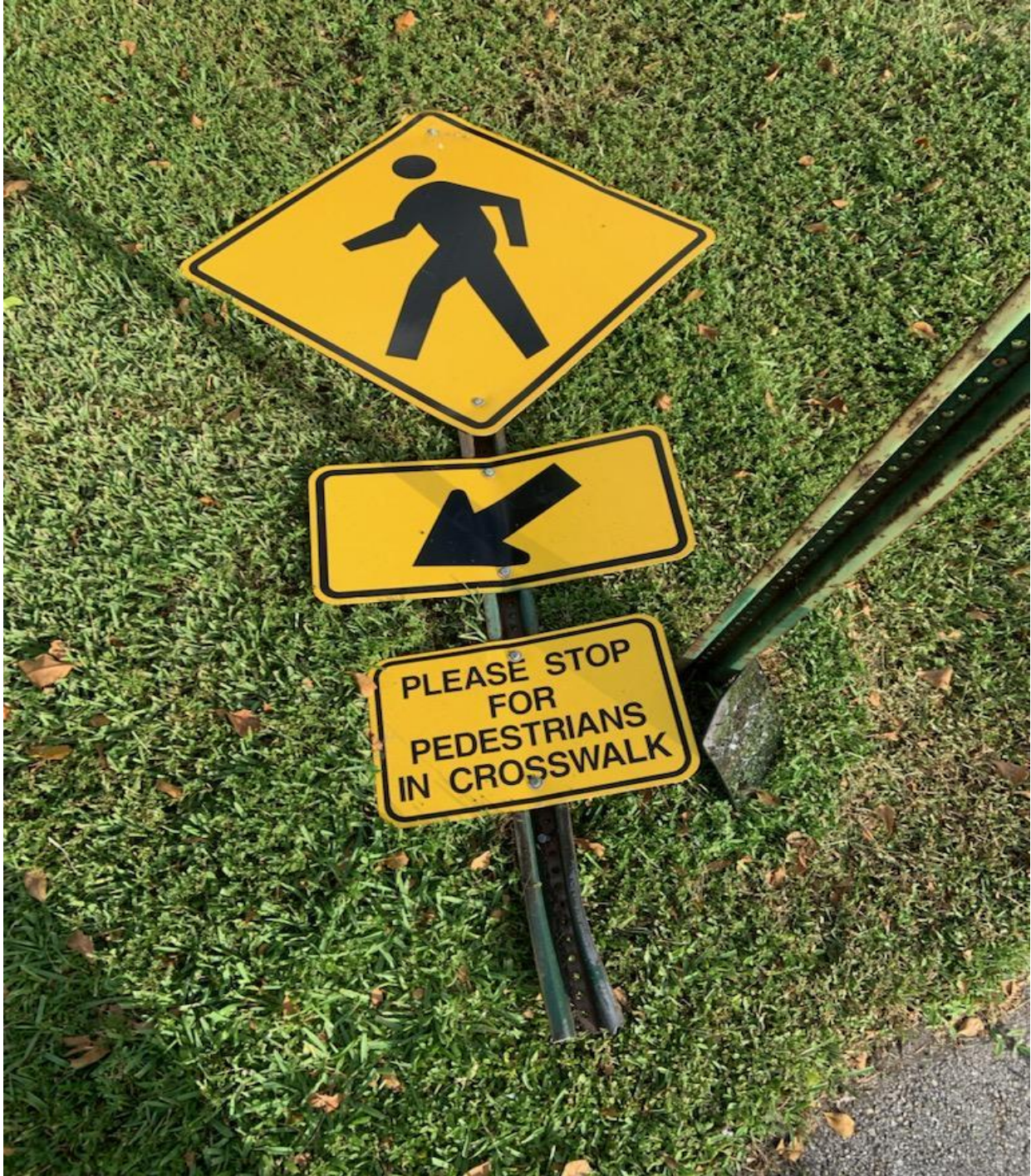
SOUTH DRIVE, DOVER SECTION- THIS SIGN WAS CRASHED INTO BY A CAR ON 6/1.