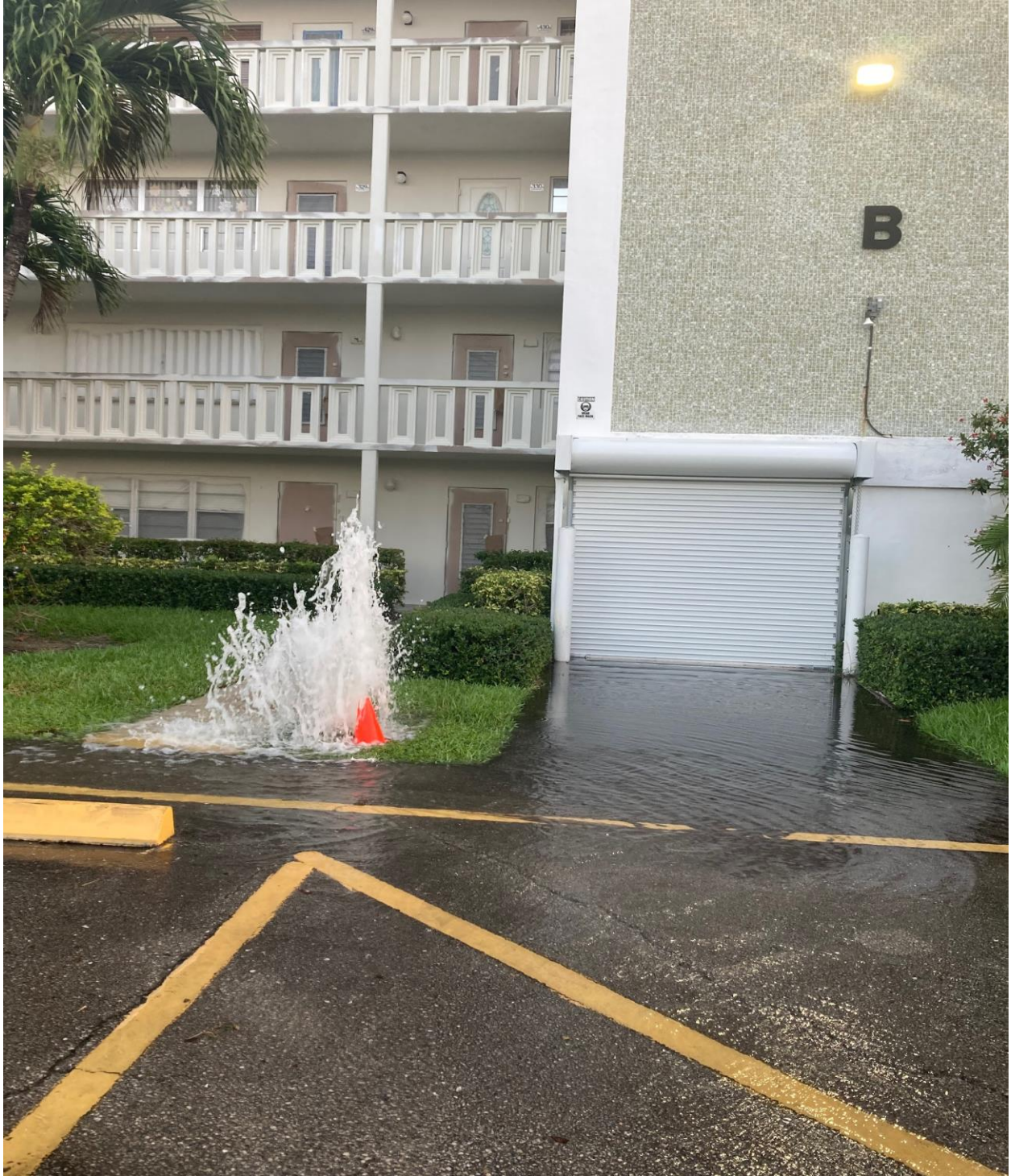
SOUTHAMPTON B- IRRIGATION LEAK. DISCOVERED 5/27, EARLY AM. IRRIGATION PUMP WAS TURNED OFF. SEACREST WILL MAKE REPAIRS THIS WEEK.