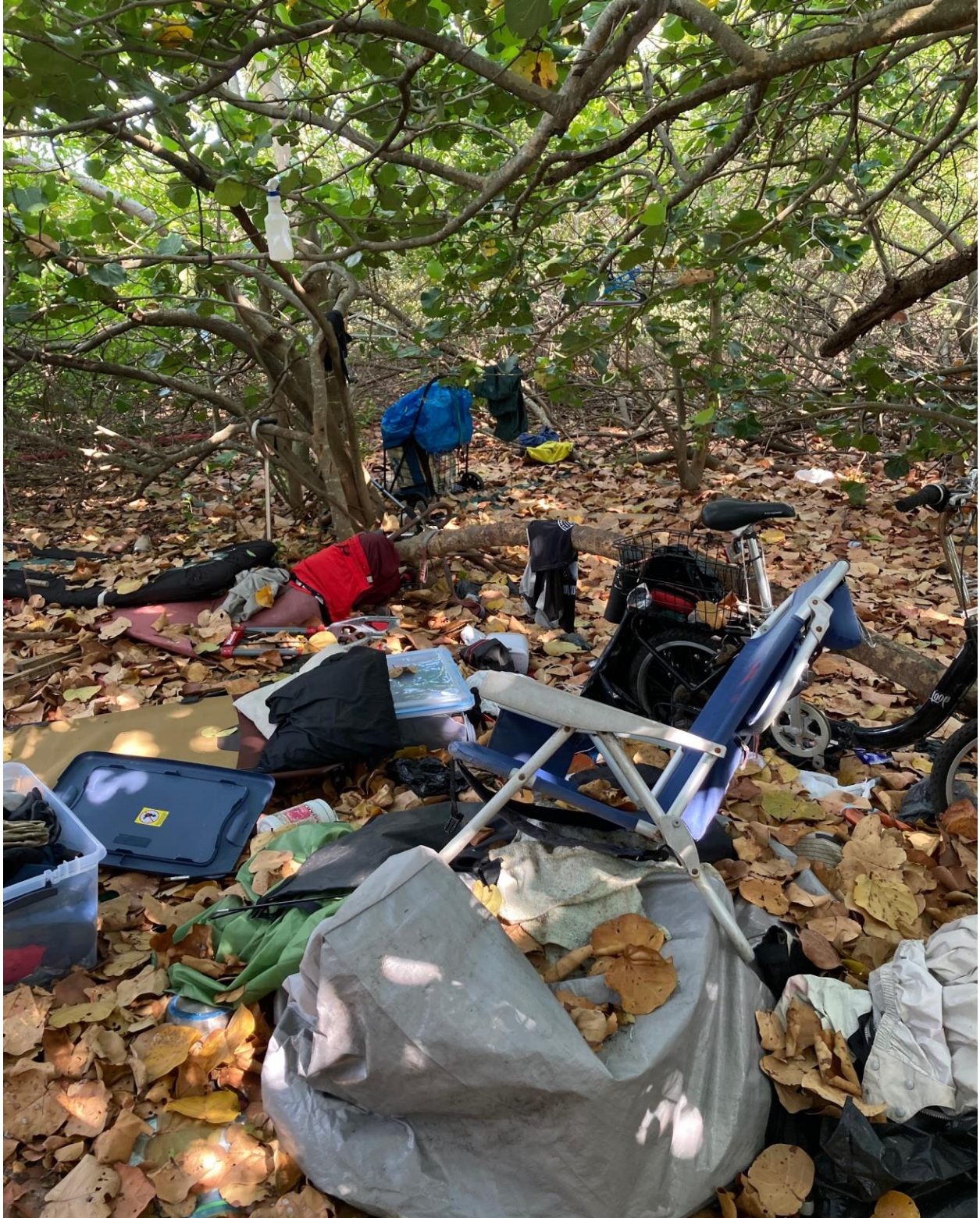
6255 OKEECHOBEE BOULEVARD- THIS CAMPSITE WAS ABANDONED LAST WEEK.