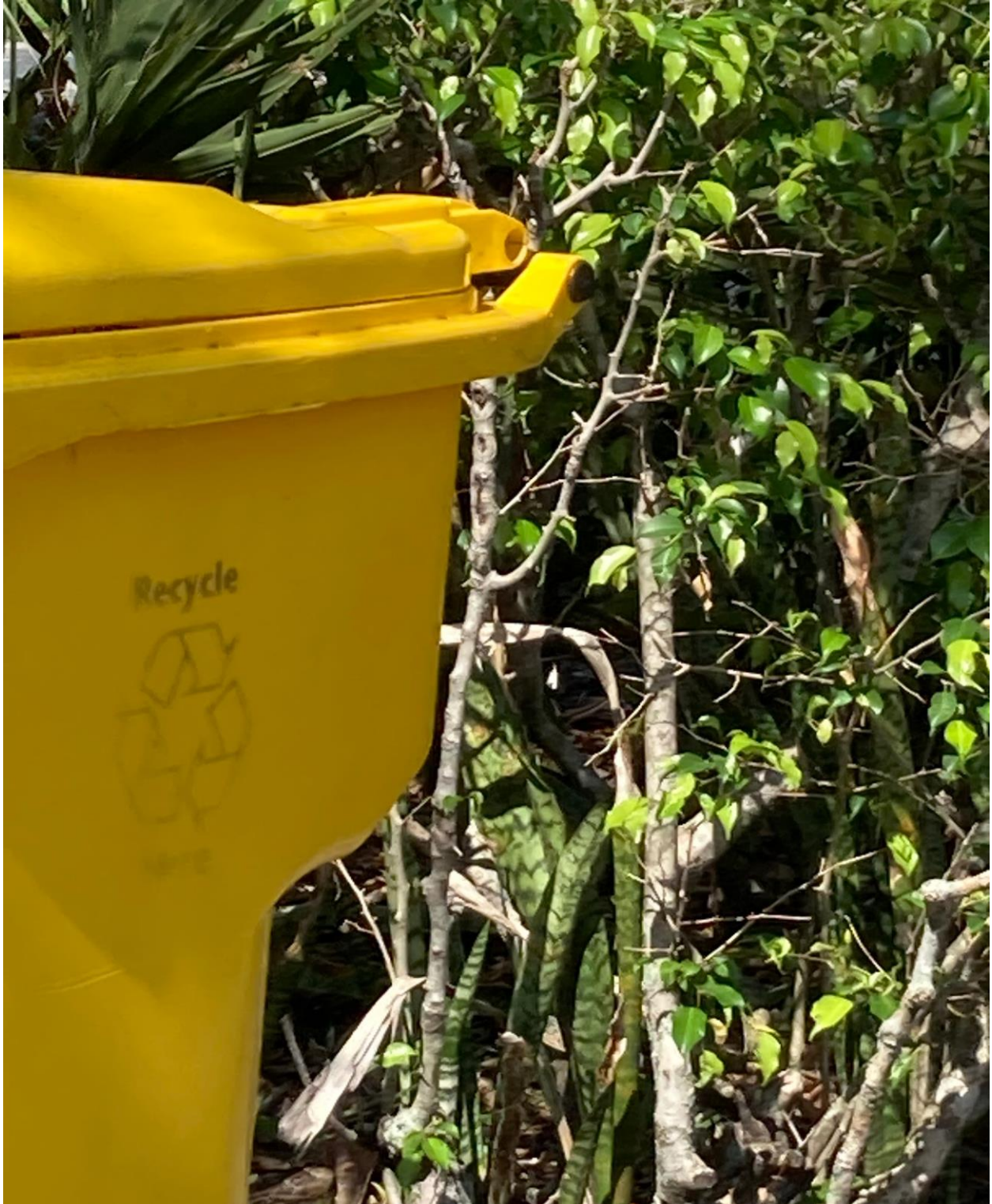
STRATFORD A- YELLOW TOWER WITH BUSTED LID. REQUEST FOR REPAIR WAS SENT TO WASTE PRO.