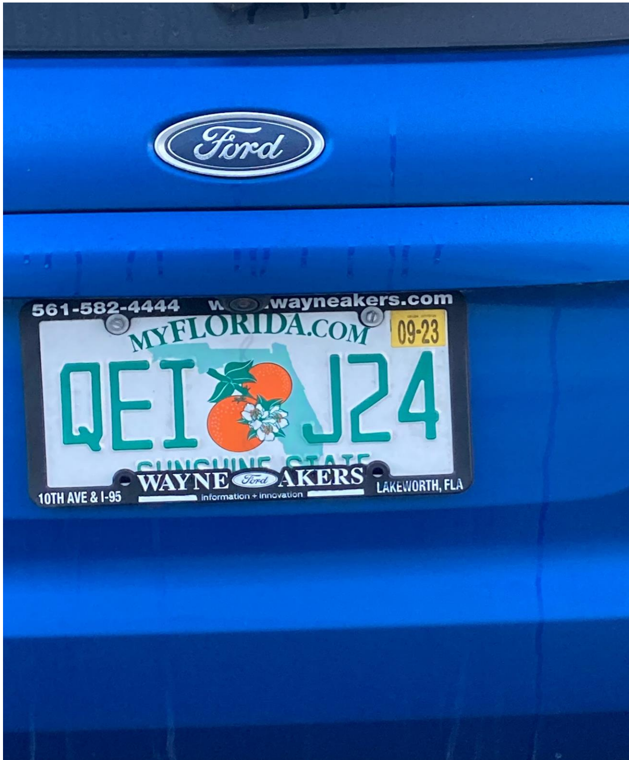
NORTHAMPTON K- CAR WITH EXPIRED REGISTRATION TAG. REPORTED TO PBC CODE ENFORCEMENT, #C-2024-05210002.