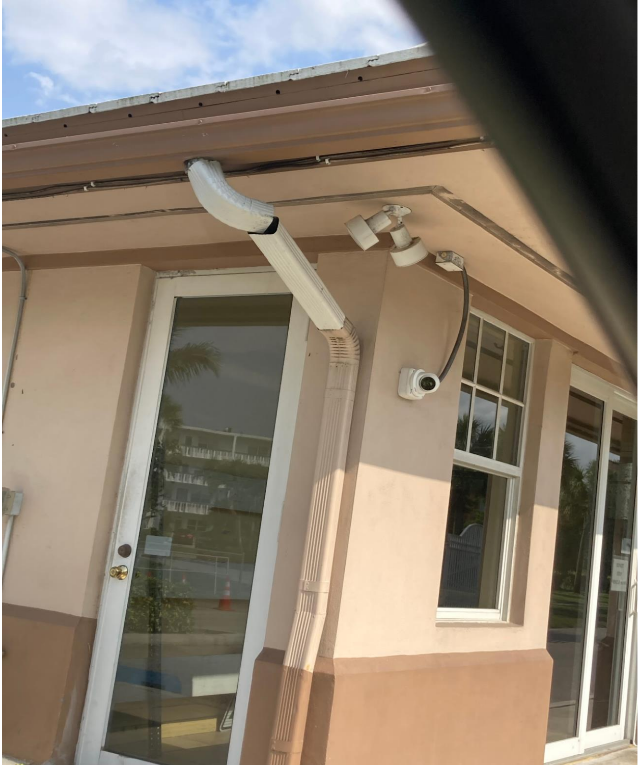
OKEECHOBEE GUARDHOUSE- BUSTED DOWNSPOUT. GUTTER MONKEYS WAS CALLED TO MAKE REPAIR.