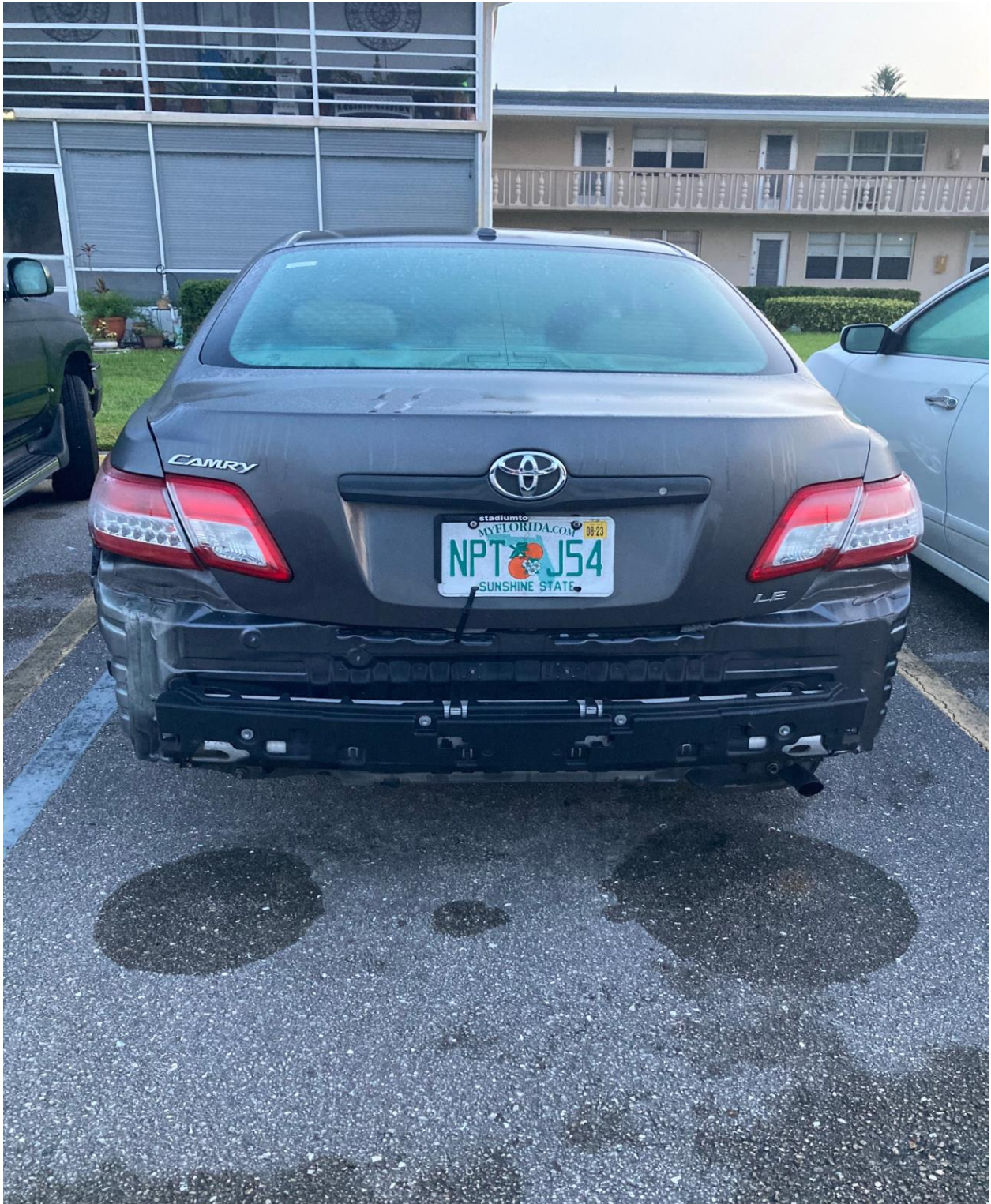
SHEFFIELD K- CAR WITH EXPIRED REGISTRATION TAG. REPORTED TO PBC CODE ENFORCEMENT, #C-2024-05210003 .