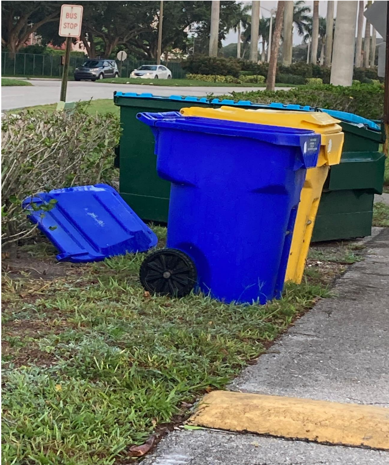
SALISBURY A- BLUE TOTER WITH CRACKED LID. REQUEST FOR REPAIR WAS SENT TO WASTE PRO.