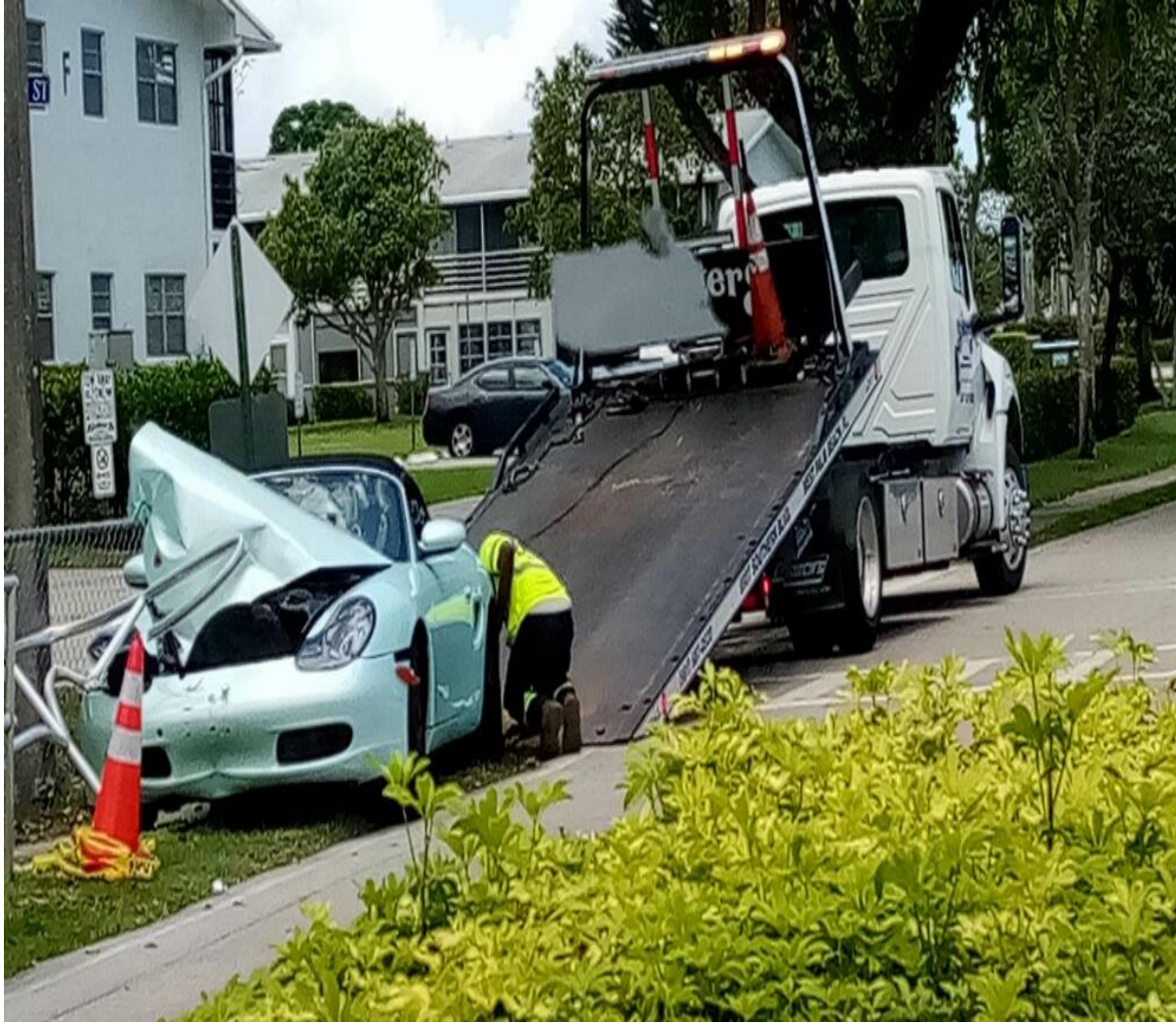
WEST DRIVE- THIS CAR WAS REMOVED FROM CV BY SISTERS TOWING ON 5/21. THE RAILING WILL BE REPLACED SOON.