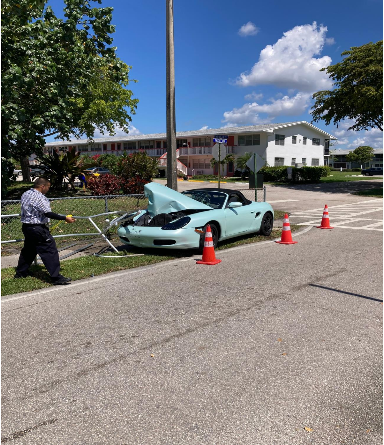
WEST DRIVE- ON 5/21, THIS CAR, BELONGING TO A CV UNIT OWNER, CRASHED INTO A RAILING. THE DRIVER WAS UNHURT.