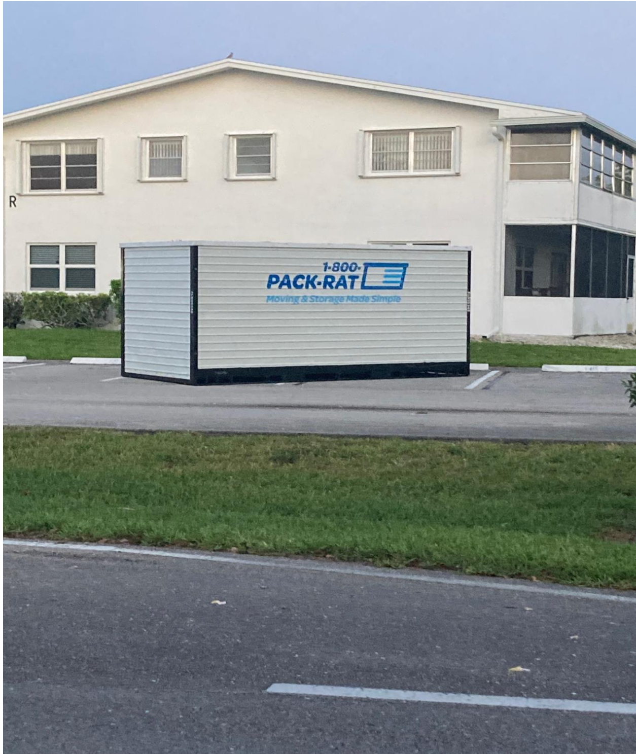
NORTHAMPTON R- THIS STORAGE POD, BELONGING TO THE OWNER OF UNIT #353, HAS BEEN PARKED HERE FOR SEVERAL WEEKS. A COMPLAINT WAS SENT TO PBC CODE ENFORCEMENT.