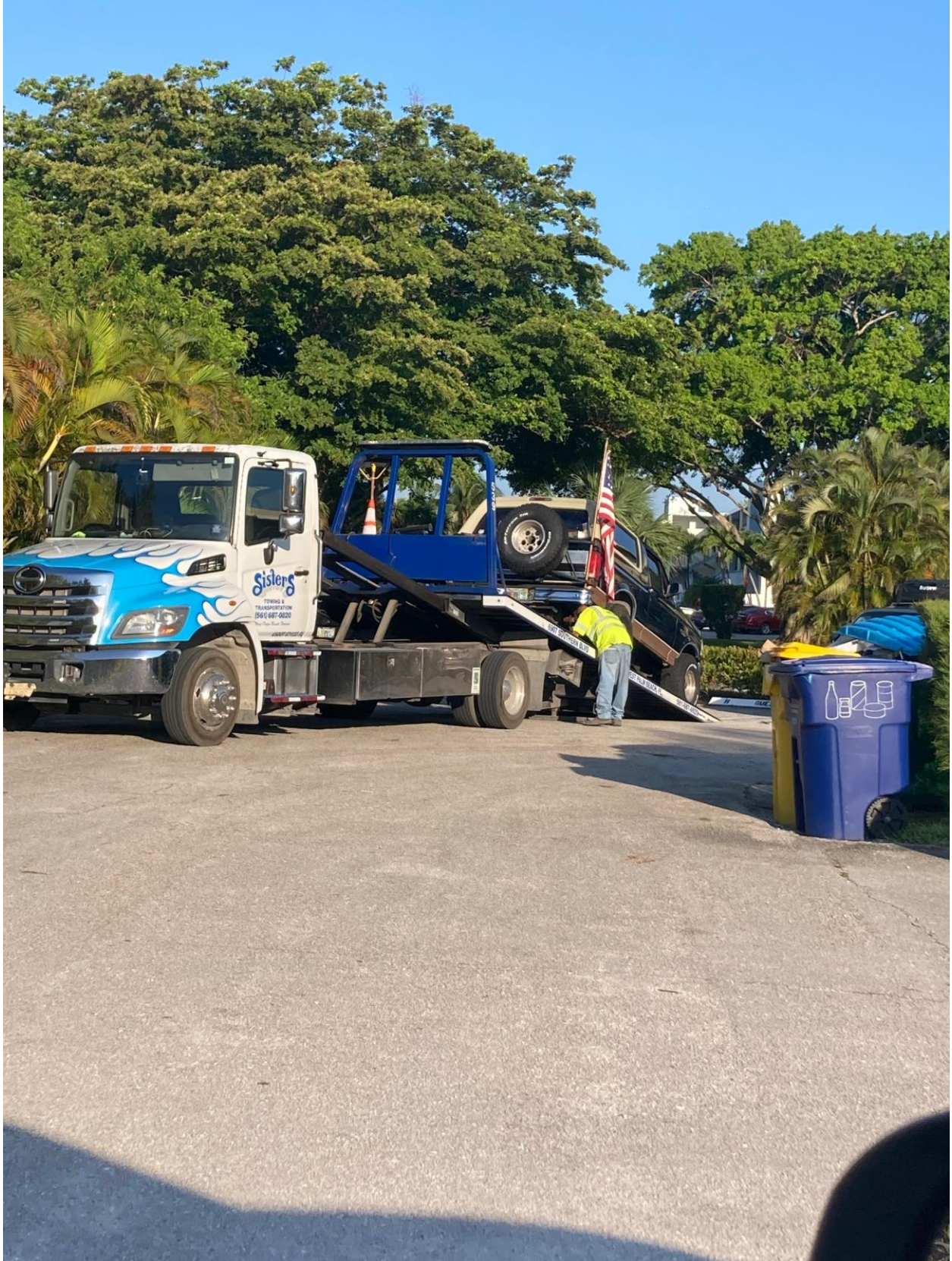
ANDOVER H- THIS TRUCK WAS TOWED OFF PROPERTY ON 5/27.