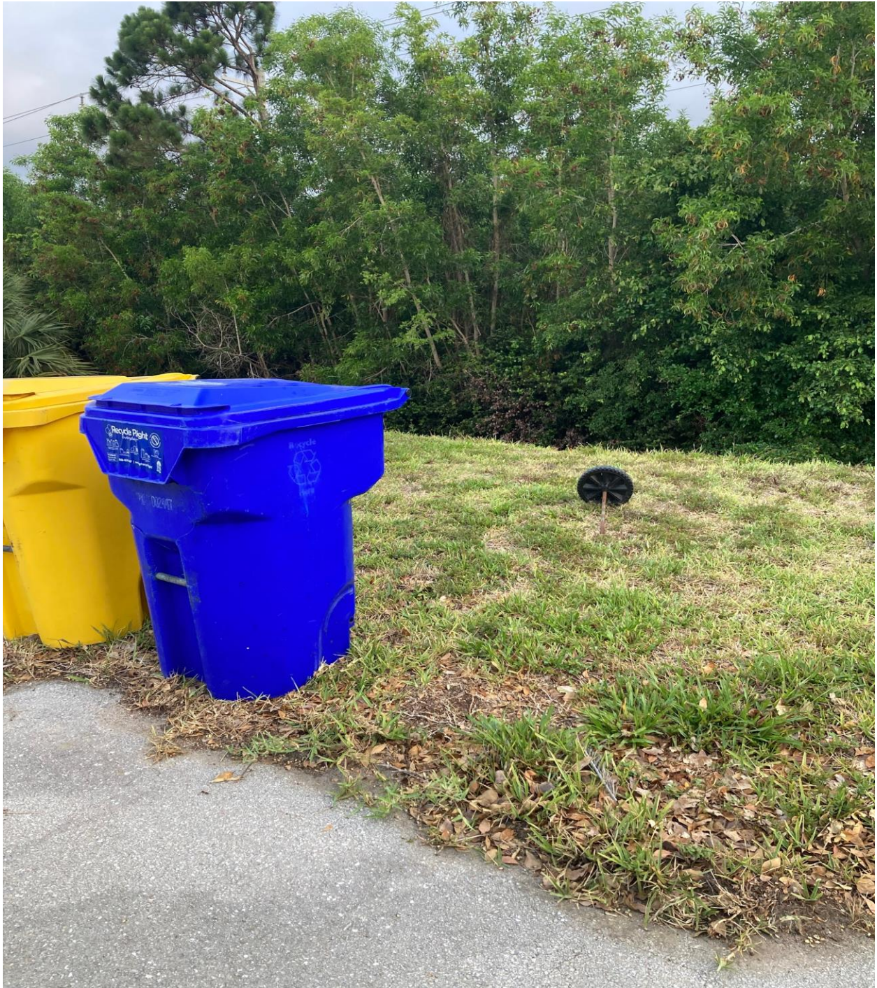
CANTERBURY K- BLUE TOLER WITH BUSTED WHEELS. REQUEST FOR REPAIR WAS SENT TO WASTE PRO.