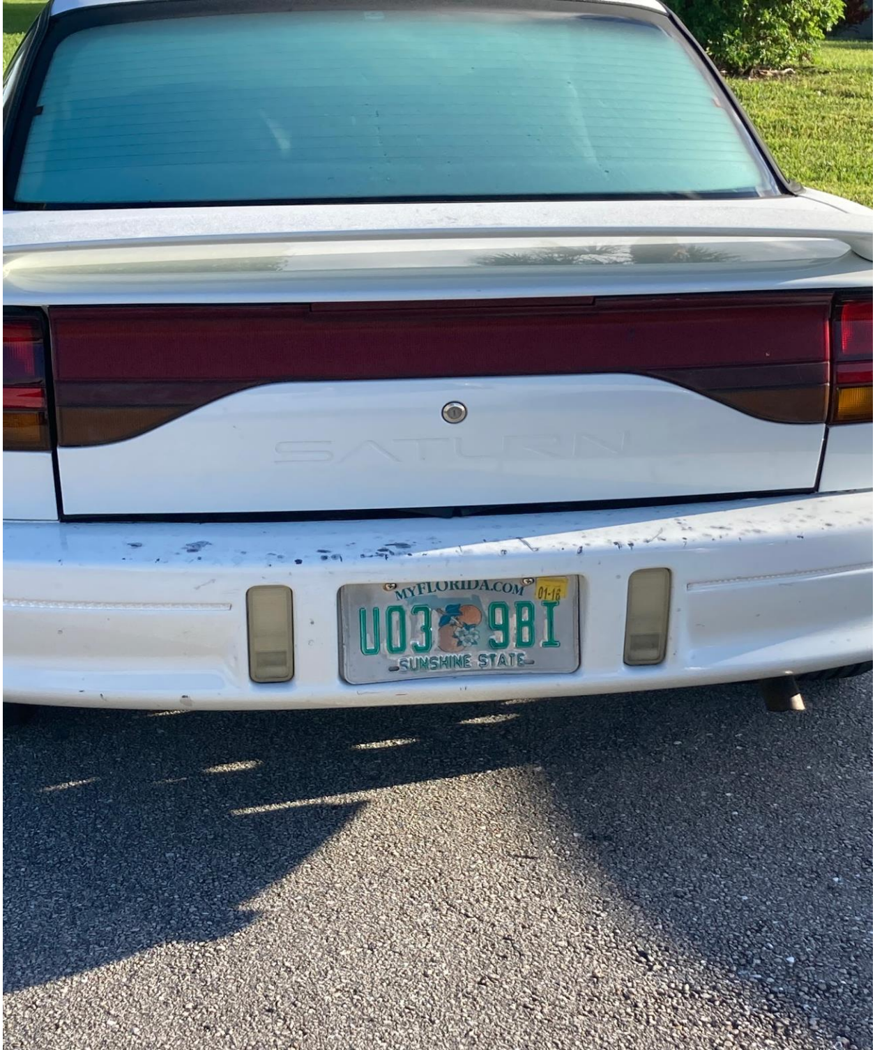
EASTHAMPTON G- CAR WITH EXPIRED (2016) REGISTRATION TAG. A COMPLAINT WAS SENT TO PBC CODE ENFORCEMENT, #C-2024-05230019.