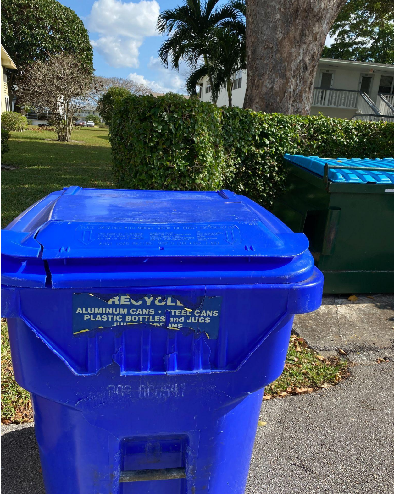
WINDSOR O- CRACKED BLUE TOTER. REPORTED IN BY A CV UNIT OWNER. REQUEST FOR REPLACEMENT WAS SENT TO UCO.