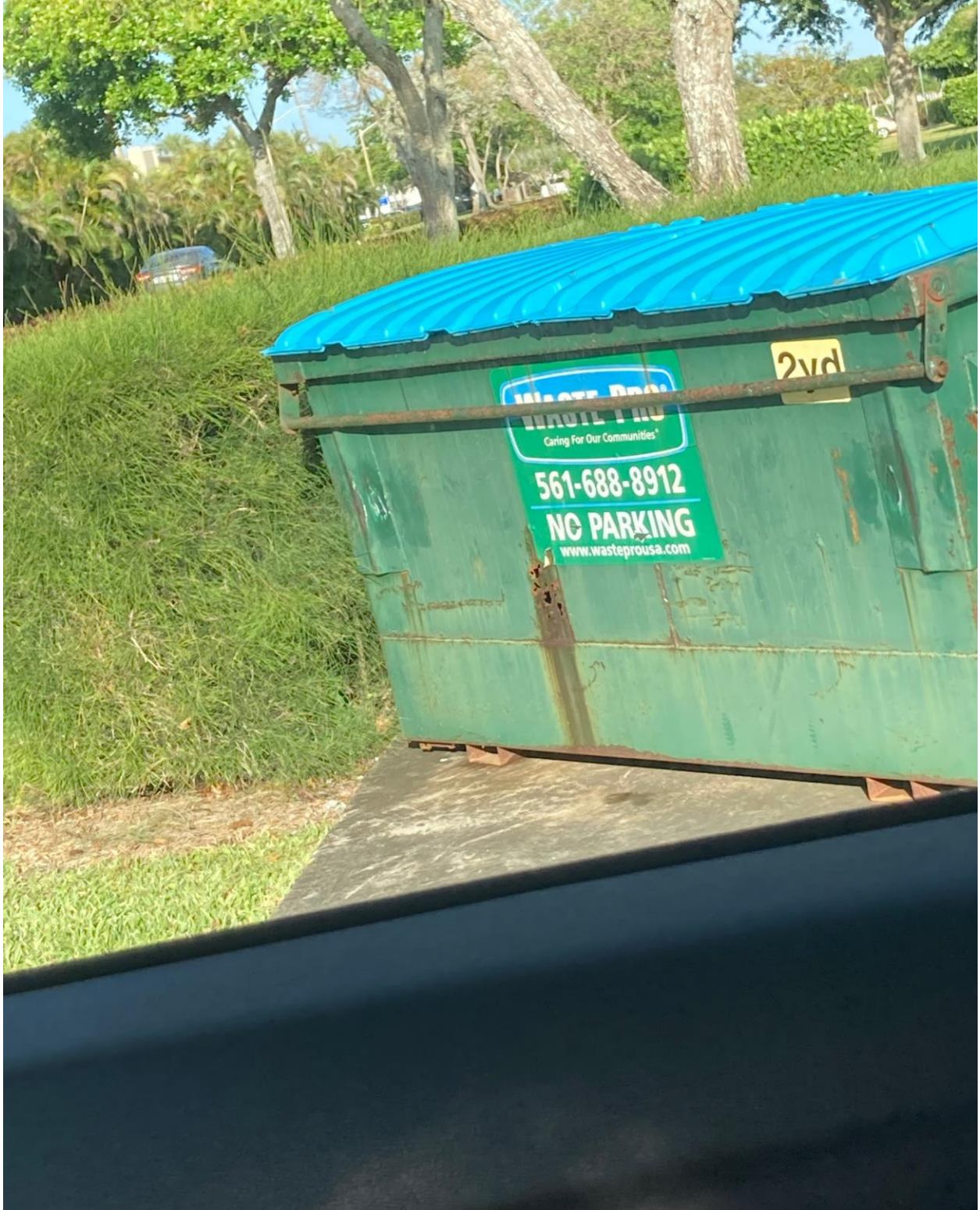
SOMERSET A- HOLEY DUMPSTER, SECOND REQUEST FOR REPLACEMENT WAS SENT TO WASTE PRO.