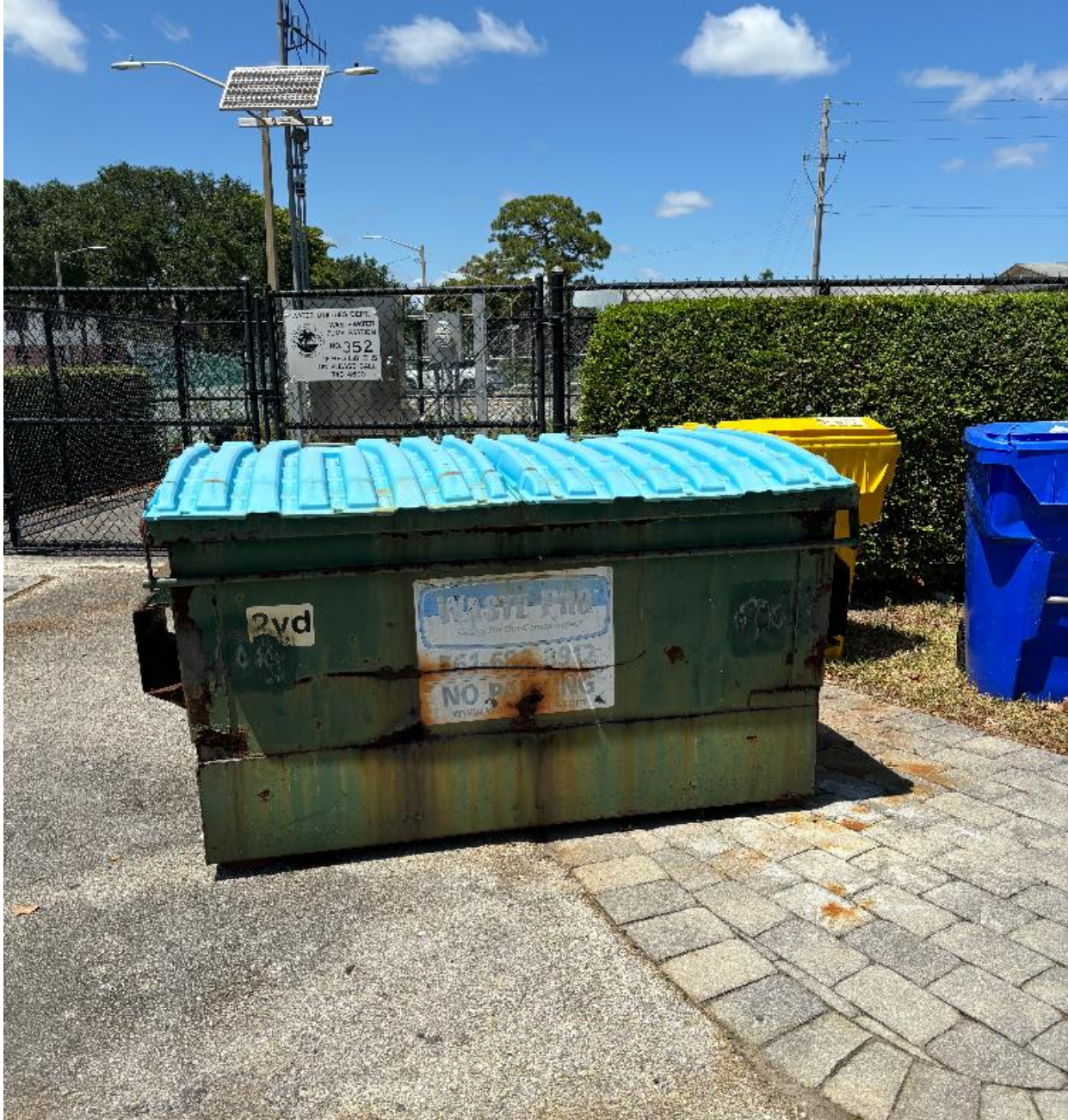
GOLFS EDGE- HOLEY DUMPSTER. REPORTED IN BY A CV UNIT OWNER. REQUEST FOR REPLACEMENT WAS SENT TO WASTE PRO.