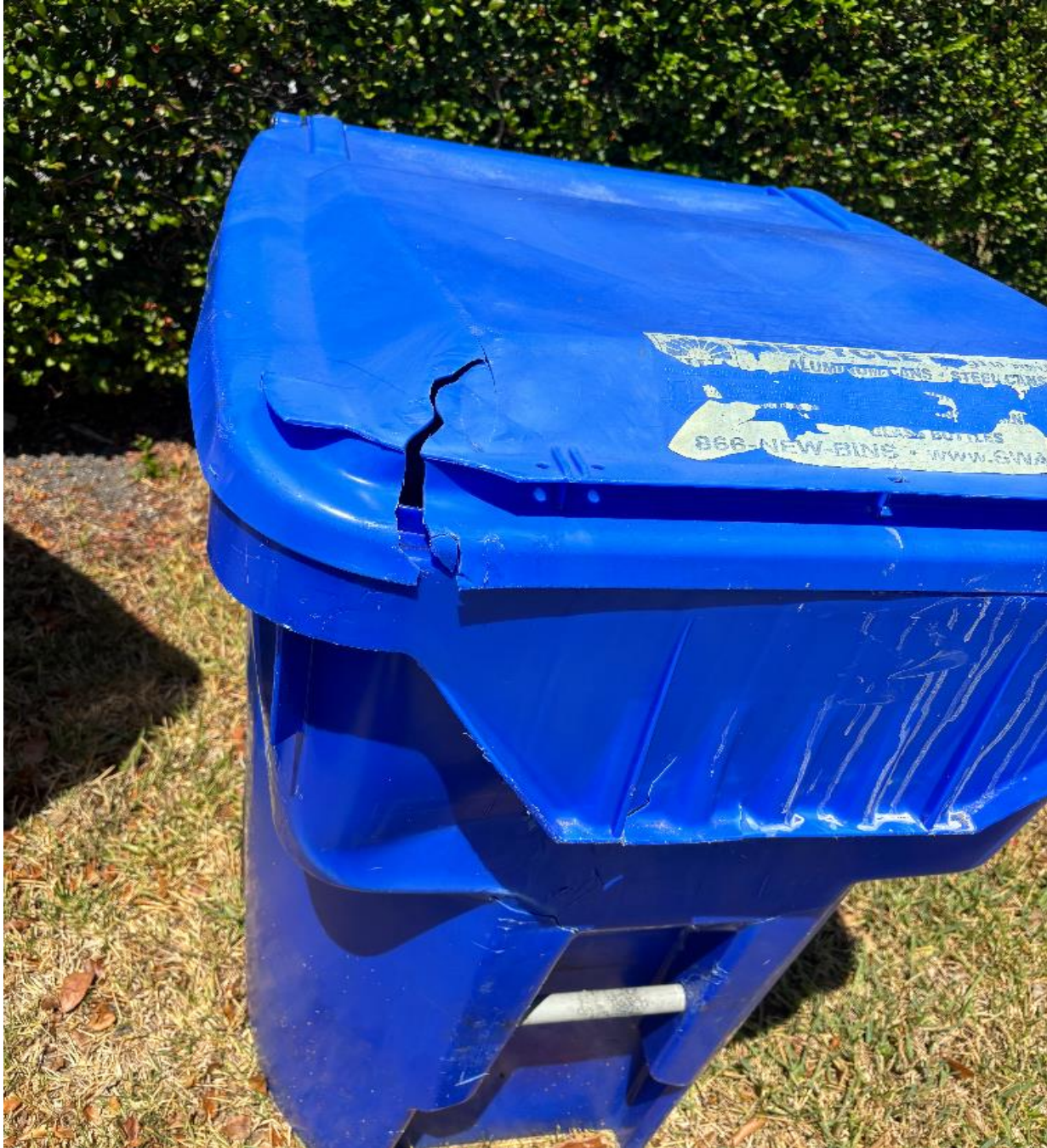
GOLFS EDGE- CRACKED BLUE Toter. REPORTED IN BY A CV UNIT OWNER. REQUEST FOR REPLACEMENT WAS SENT TO WASTE PRO.