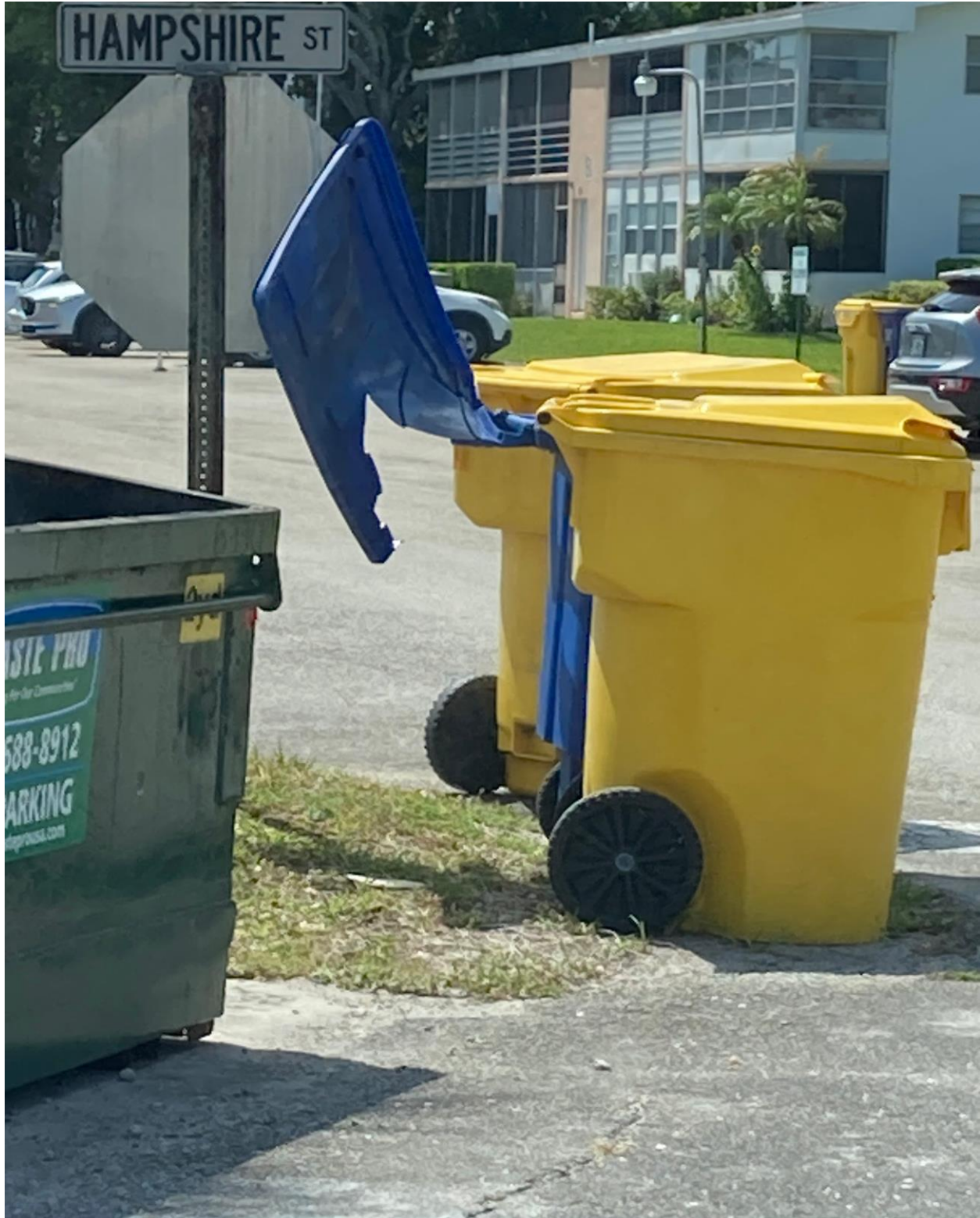
ANDOVER F- CRACKED LID, BLUE TOTER. REQUEST FOR REPAIR WAS SENT TO WASTE PRO.