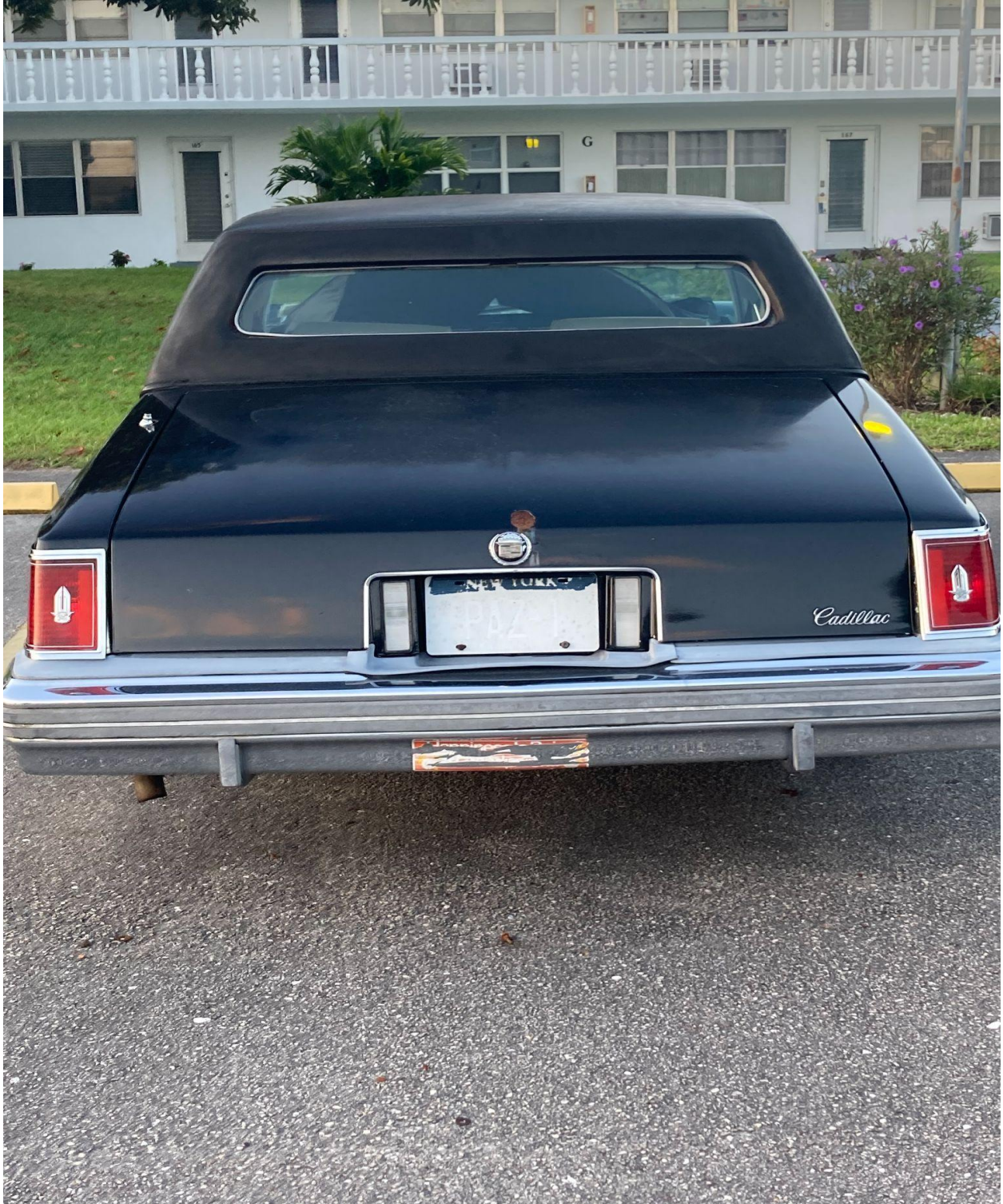
BEDFORD G- CAR WITH NO LICENSE PLATE. REPORTED TO PBC CODE ENFORCEMENT, COMPLAINT #C-2024-04230003.