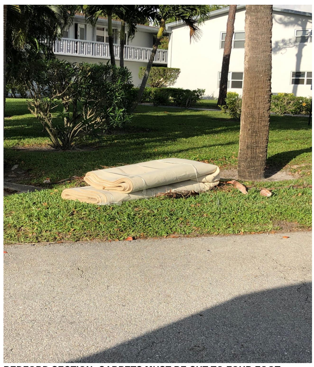
BEDFORD SECTION- CARPETS MUST BE CUT TO FOUR FOOT SQUARES, ROLLED AND TIED.