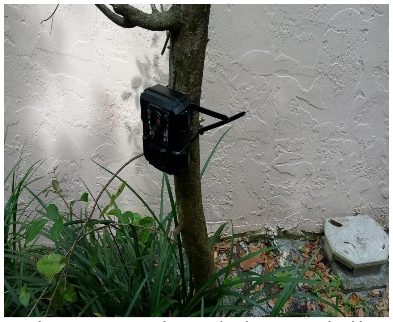
GOLFS EDGE- ADDITIONAL STEALTH CAMS AND NO TRESPASSING SIGNS WERE INSTALLED AT THIS SPOT.