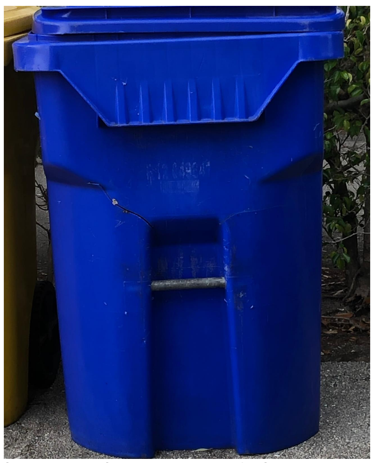
STRATFORD L- BUSTED BLUE TOTER. A REQUEST FOR REPLACEMENT WAS SENT TO WASTE PRO.