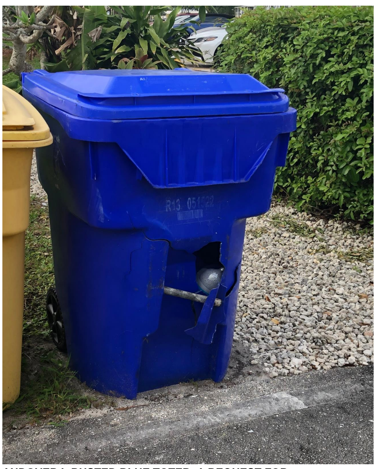
ANDOVER I- BUSTED BLUE TOTER. A REQUEST FOR REPLACEMENT WAS SENT TO WASTE PRO.