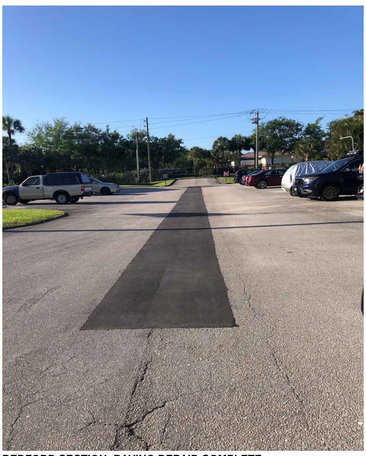
BEDFORD SECTION- PAVING REPAIR COMPLETE.