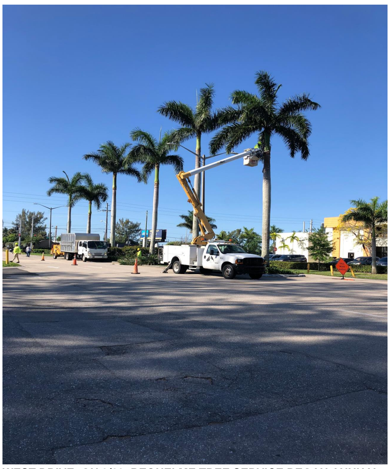
WEST DRIVE- ON 3/29, REQUELME TREE SERVICE BEGAN ANNUAL MAINTENANCE TRIM OF TREES AND PALMS ON UCO OWNED AND MAINTAINED PROPERTY. THIS WORK WILL CONTINUE NEXT WEEK.