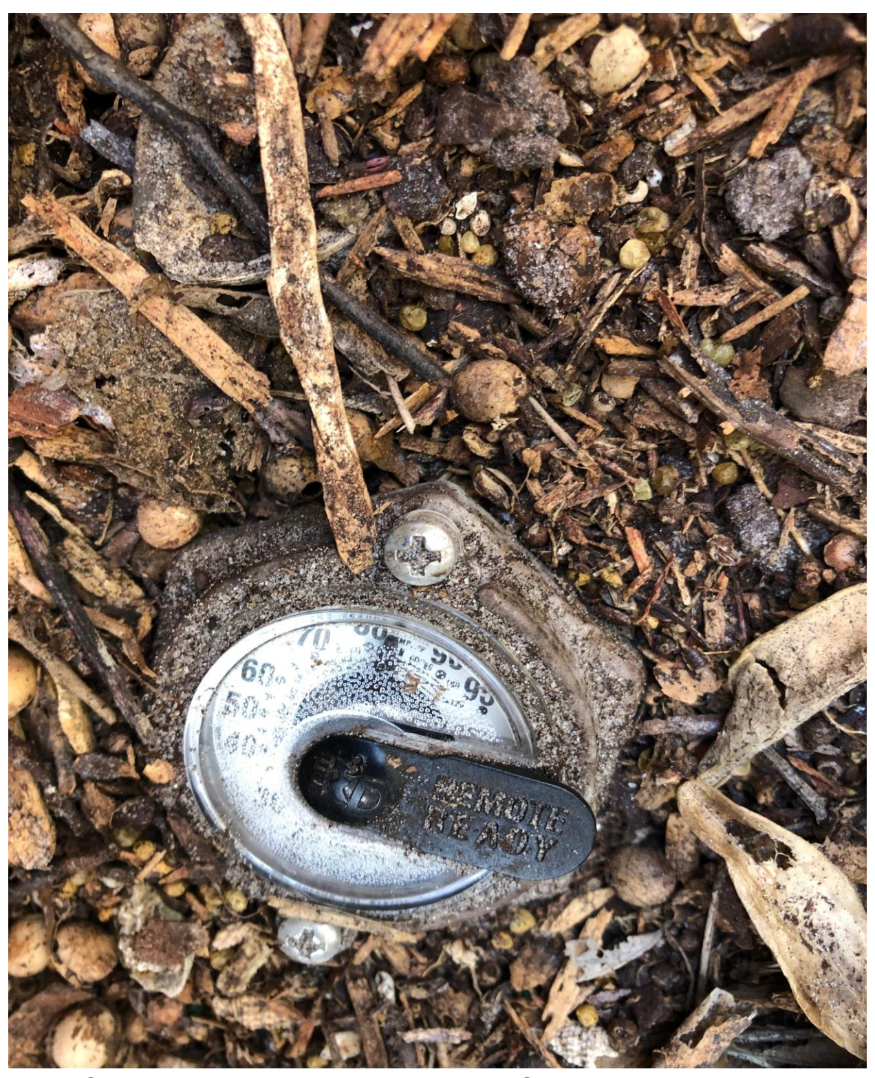
OKEECHOBEE BOULEVARD GUARDHOUSE- PROPANE FUEL TANK FOR EMERGENCY GENERATOR- APPROXIMATELY 400 GALLONS.