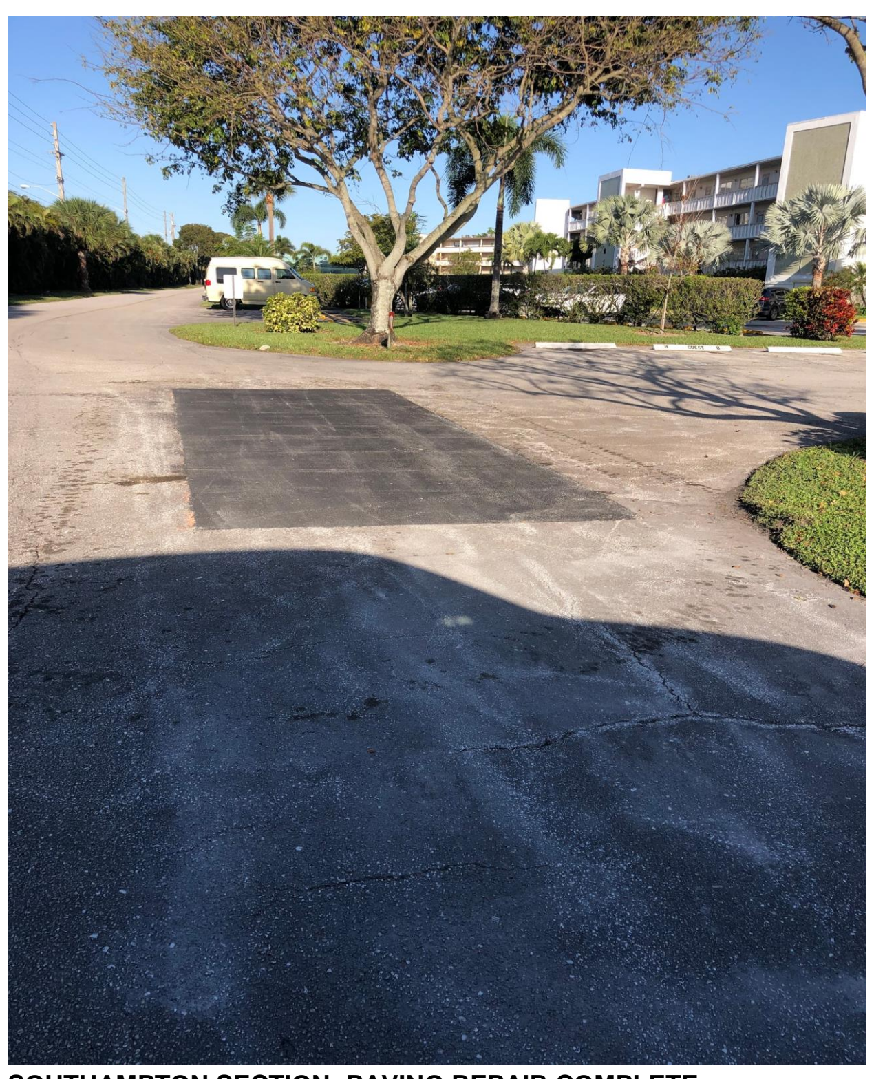
SOUTHAMPTON SECTION- PAVING REPAIR COMPLETE.