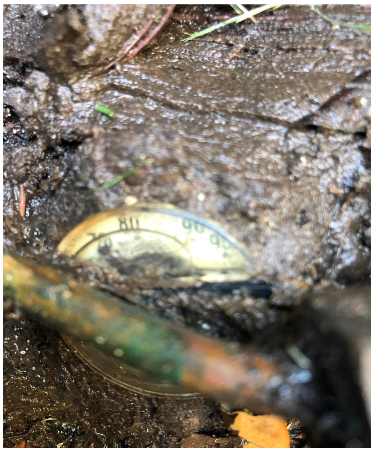
UCO OFFICE- PROPANE FUEL TANKS FOR EMERGENCY GENERATOR- APPROXIMATELY 700 GALLONS.