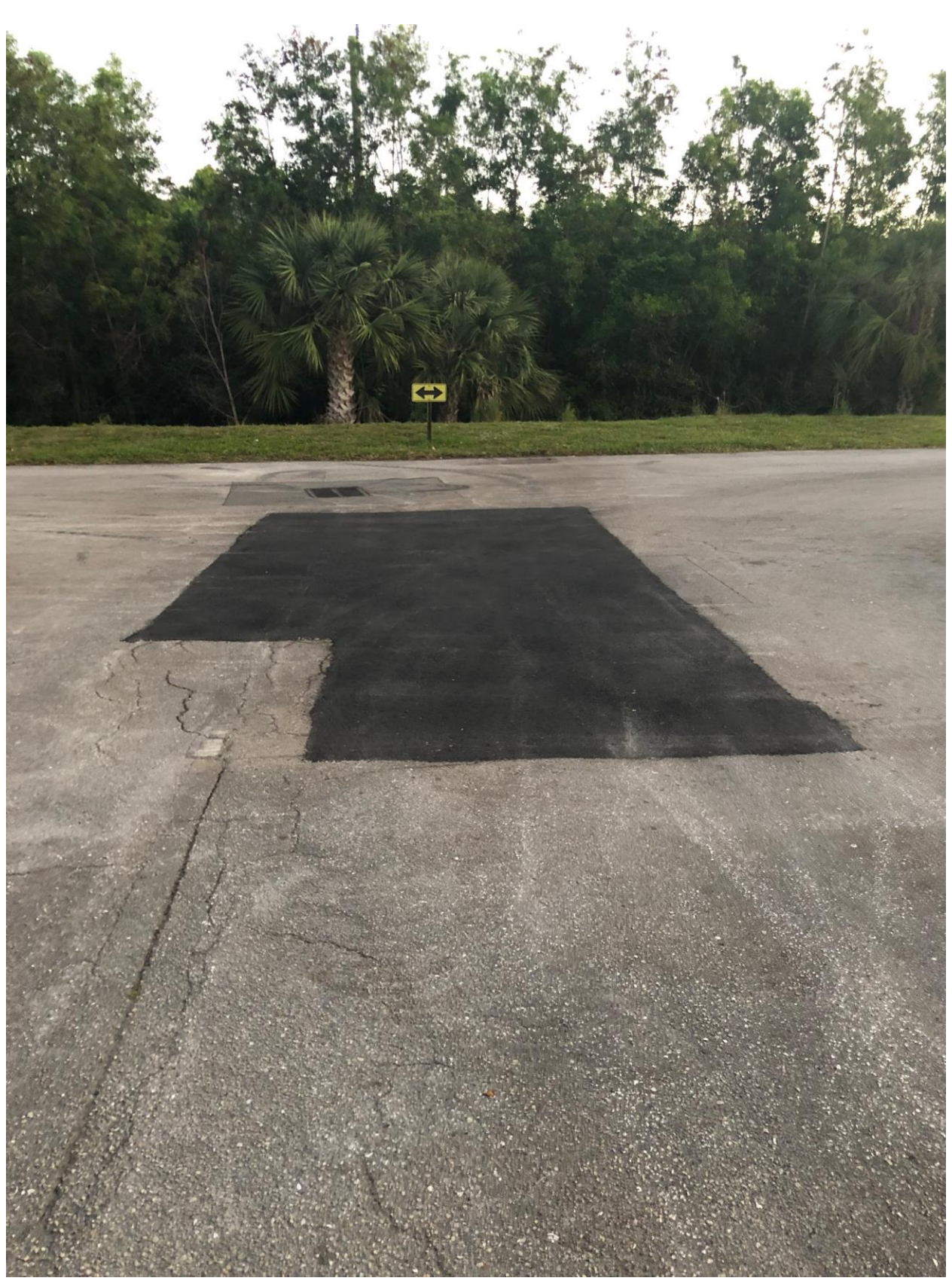
CANTERBURY SECTION- PAVING REPAIR COMPLETE.