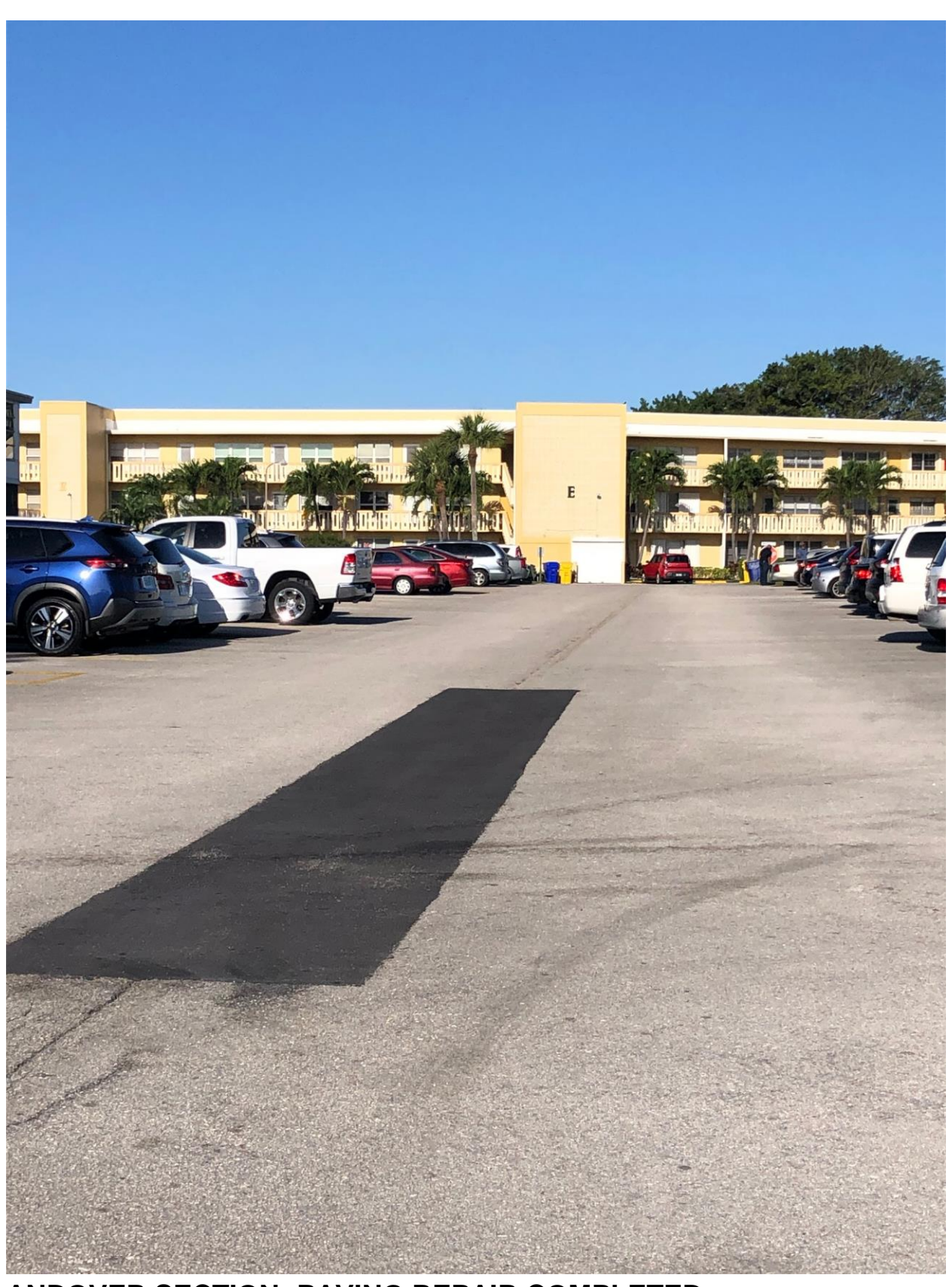
ANDOVER SECTION- PAVING REPAIR COMPLETED.