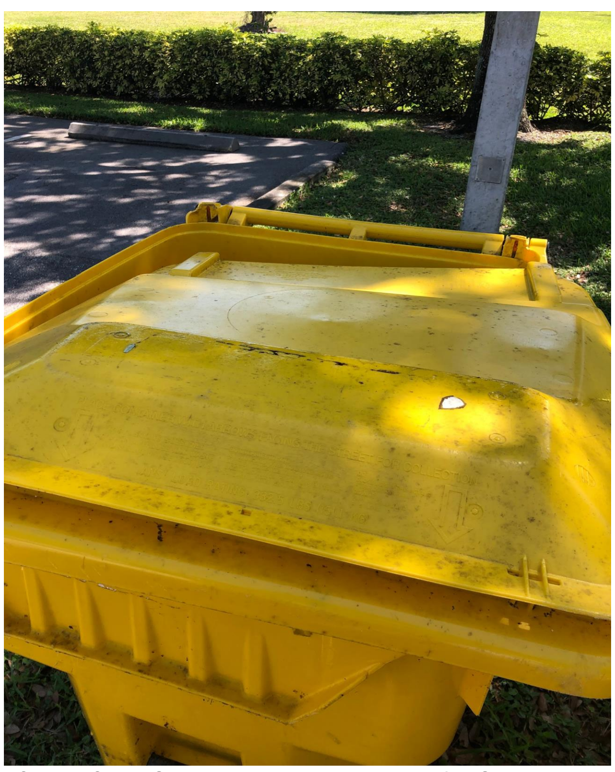
UCO OFFICE- BUSTED YELLOW TOTER LID- A REQUEST FOR REPLACEMENT WAS SENT TO WASTE PRO.