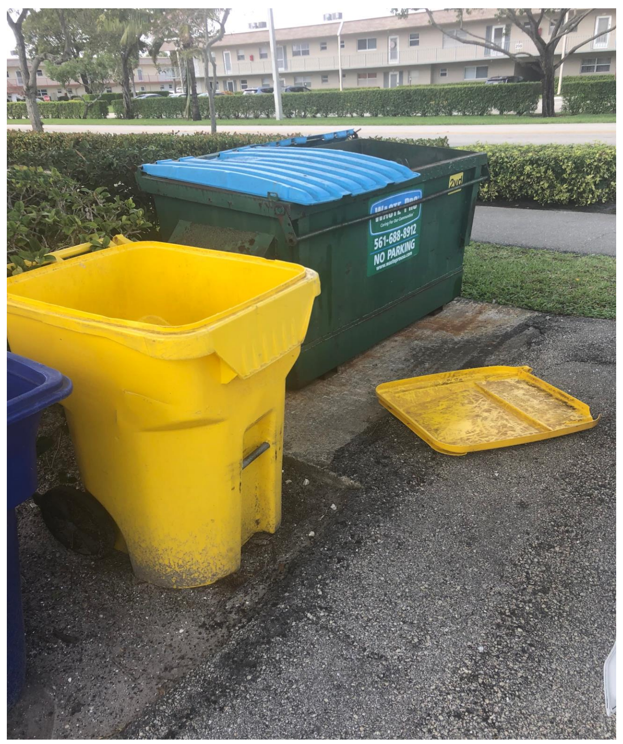
CHATHAM U- BUSTED LID. REPORTED IN BY A CV UNIT OWNER. REQUEST FOR REPLACEMENT WAS SENT TO WASTE PRO. PLEASE SEND BUSTED DUMPSTER REPORTS TO

UCOGARBAGE@GMAIL.COM. PICTURES ARE VERY HELPFUL.