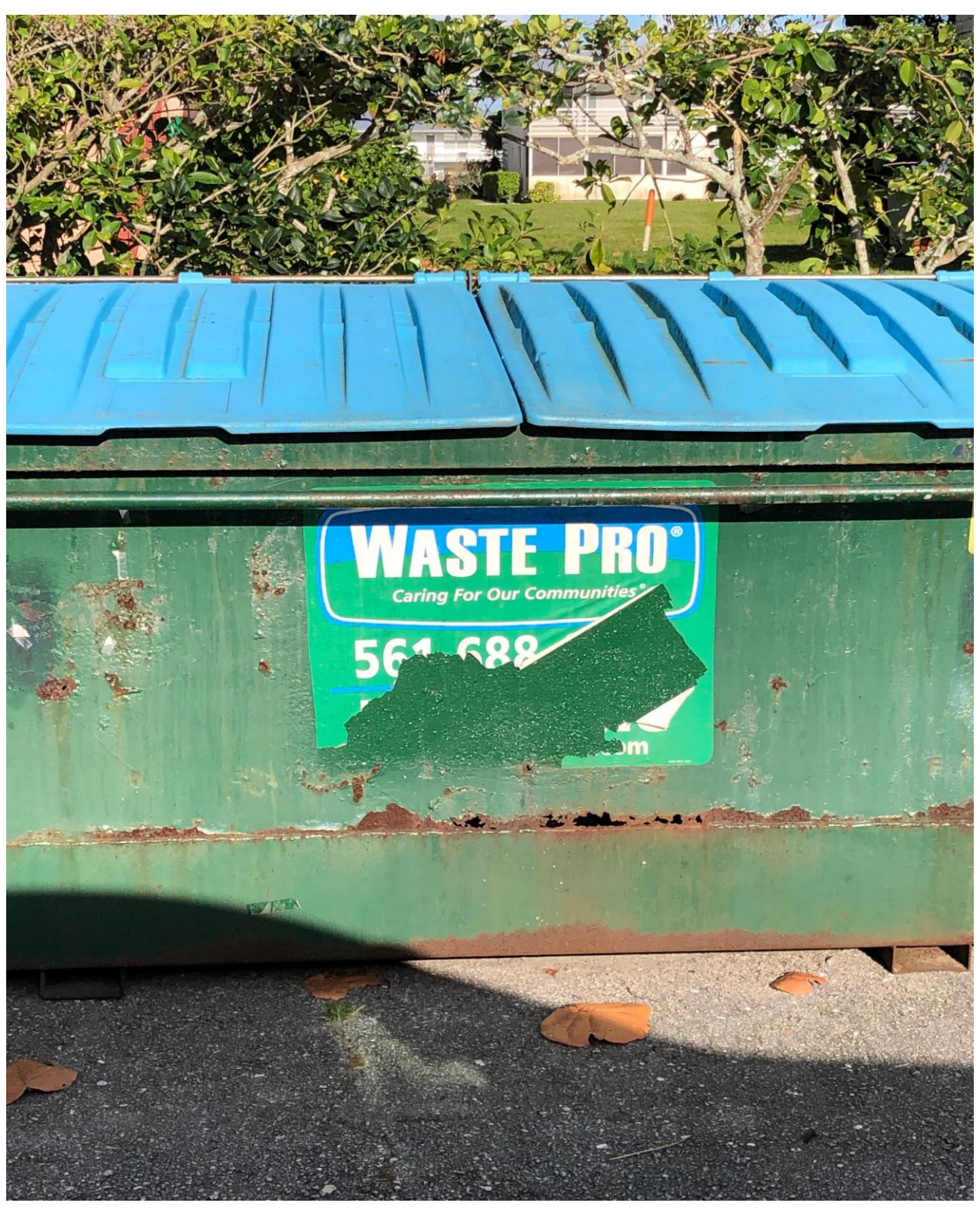
OXFORD 300- HOLEY DUMPSTER, REQUEST FOR REPLACEMENT WAS SENT TO WASTE PRO.