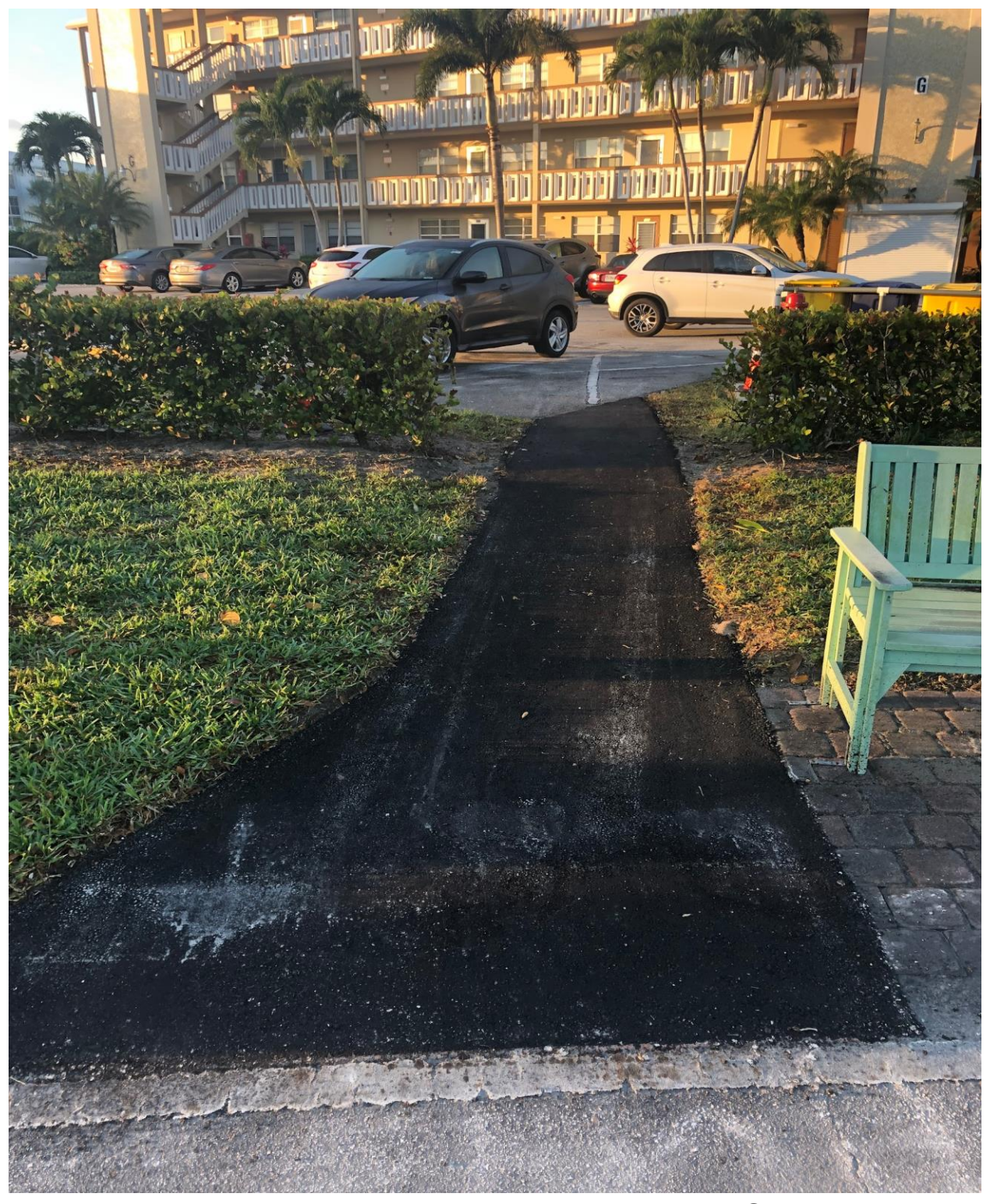
WELLINGTON G- A ROOT DAMAGED WALKWAY WAS REPAIRED BY ATLANTIC SOUTHERN PAVING.