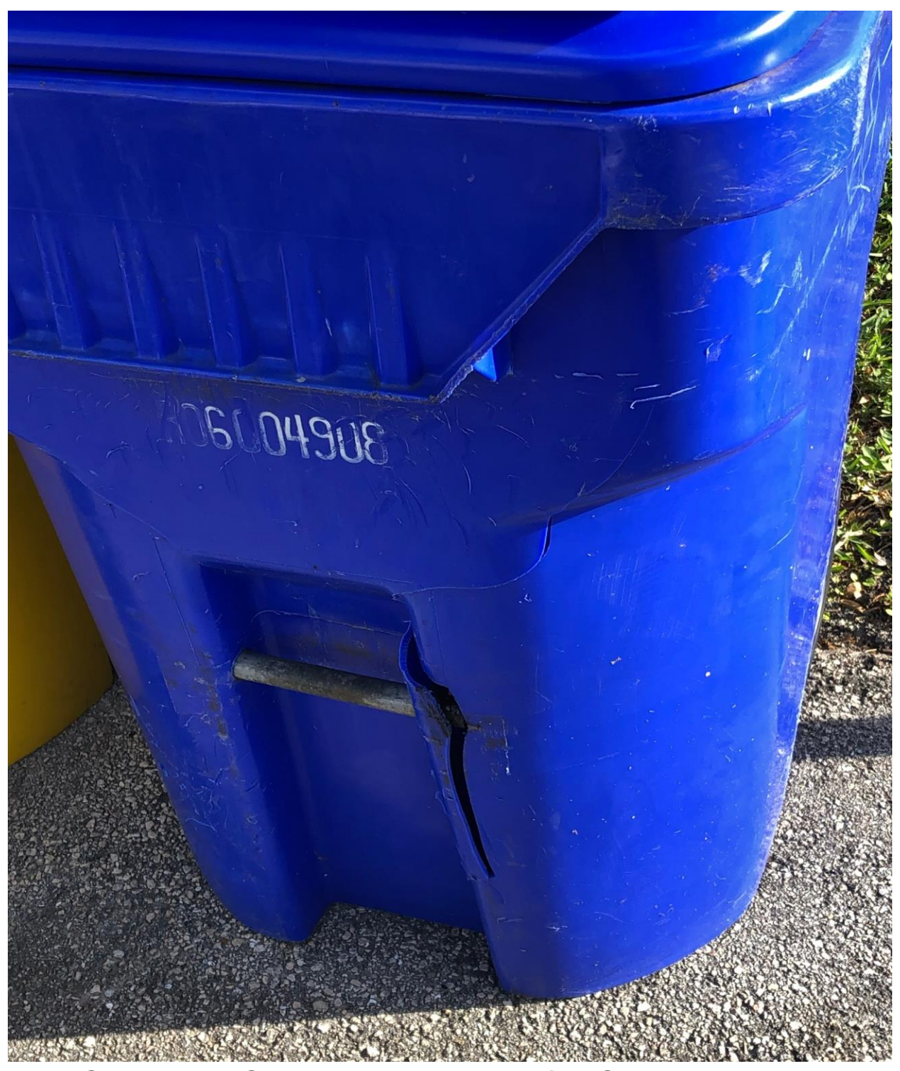
BERKSHIRE E- BUSTED BLUE TOTER. REQUEST FOR REPLACEMENT WAS SENT TO WASTE PRO.