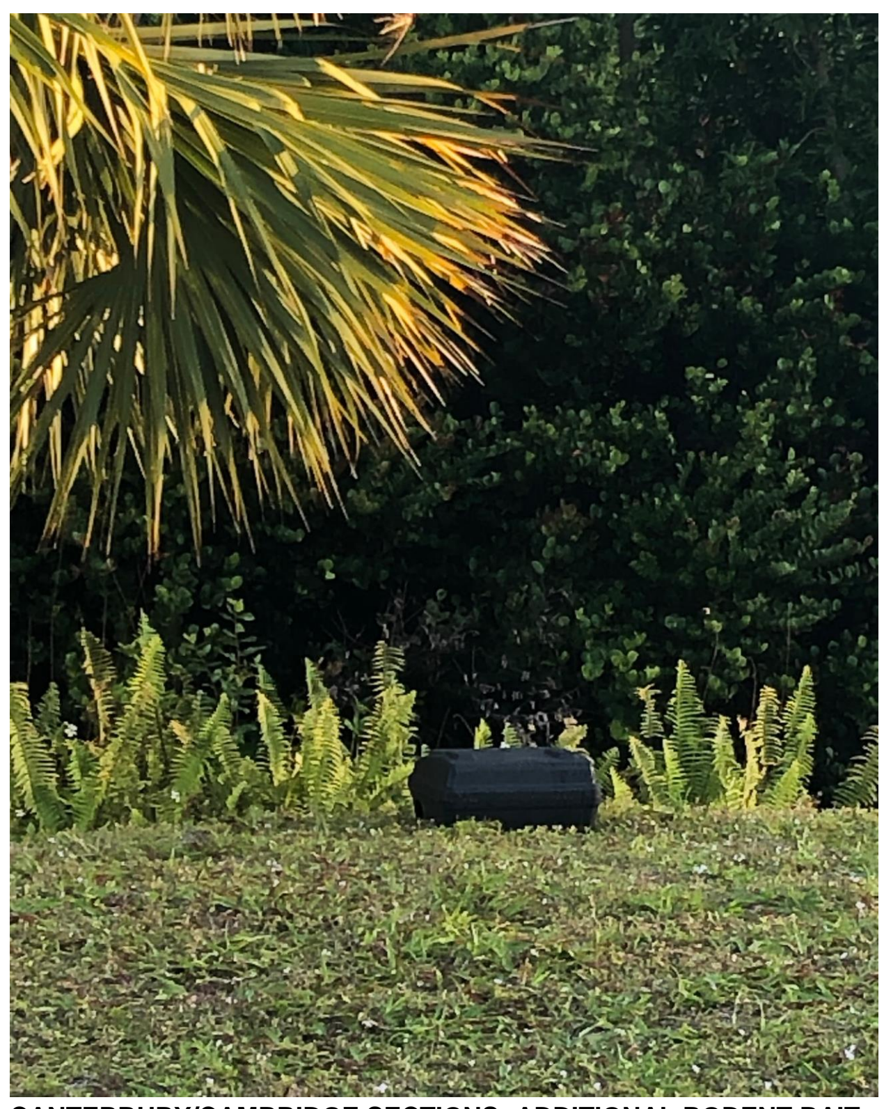
CANTERBURY/CAMBRIDGE SECTIONS- ADDITIONAL RODENT BAIT TRAPS WERE INSTALLED ALONG NORTH CANAL ON 3/29.