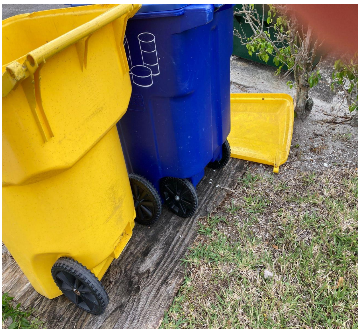
ANDOVER E- BUSTED YELLOW TOTER. REPORTED IN BY A CV UNIT OWNER. REQUEST FOR REPLACEMENT WAS SENT TO WASTE PRO.