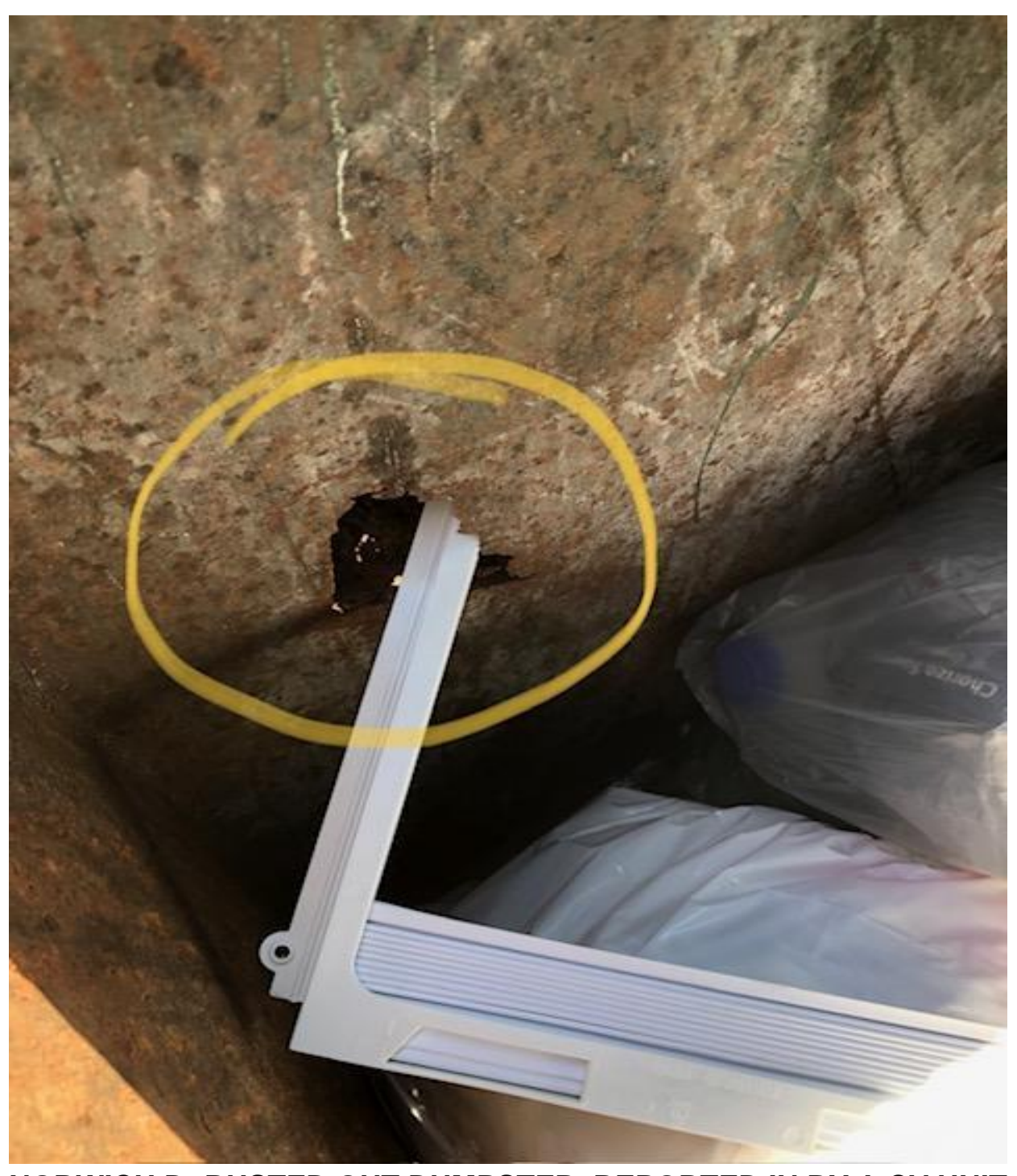
NORWICH D- RUSTED OUT DUMPSTER. REPORTED IN BY A CV UNIT OWNER. A REQUEST FOR REPLACEMENT WAS SENT TO WASTE PRO.