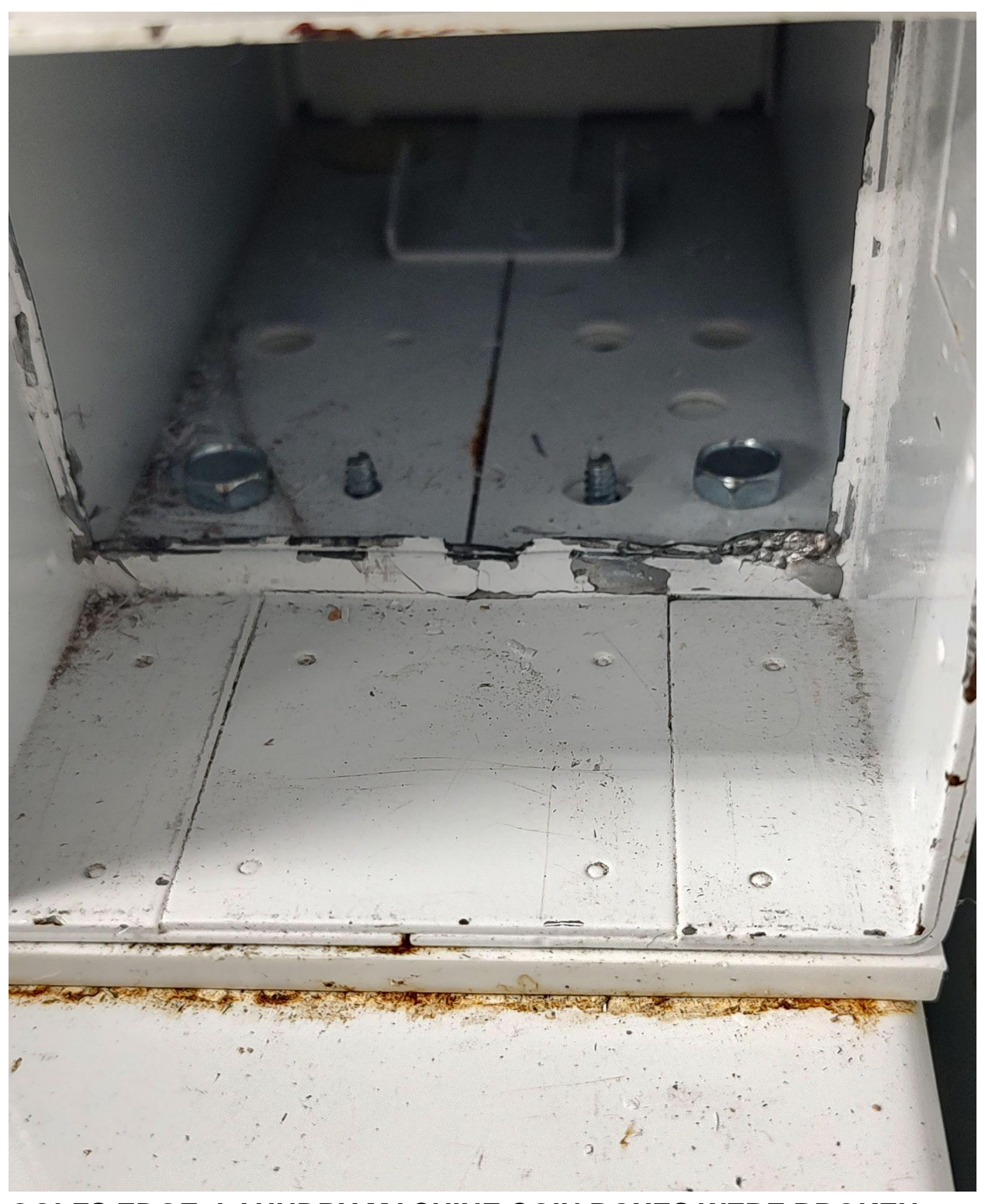
GOLFS EDGE- LAUNDRY MACHINE COIN BOXES WERE BROKEN INTO AND EMPTIED OF COINS.