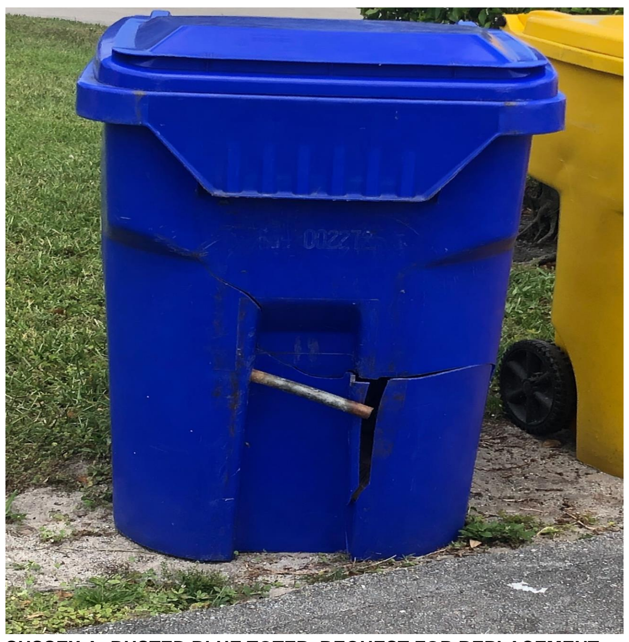
SUSSEX A- BUSTED BLUE TOTER. REQUEST FOR REPLACEMENT WAS SENT TO WASTE PRO.