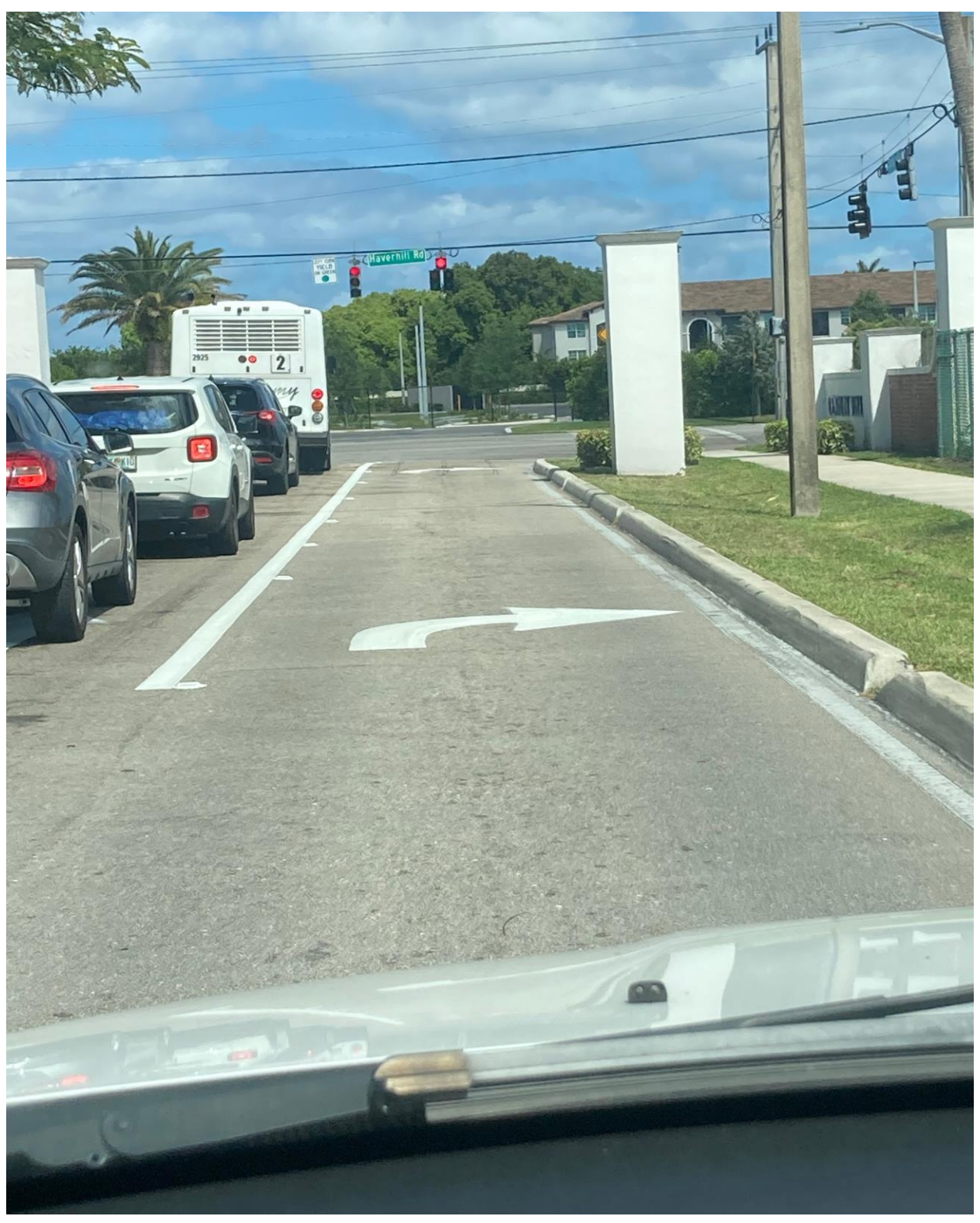
CENTURY BOULEVARD- NEW DIRECTIONAL ARROWS PAINTED BY PBC TRAFFIC DIVISION. RIGHT EXIT LANE IS FOR RIGHT TURNS ONLY.