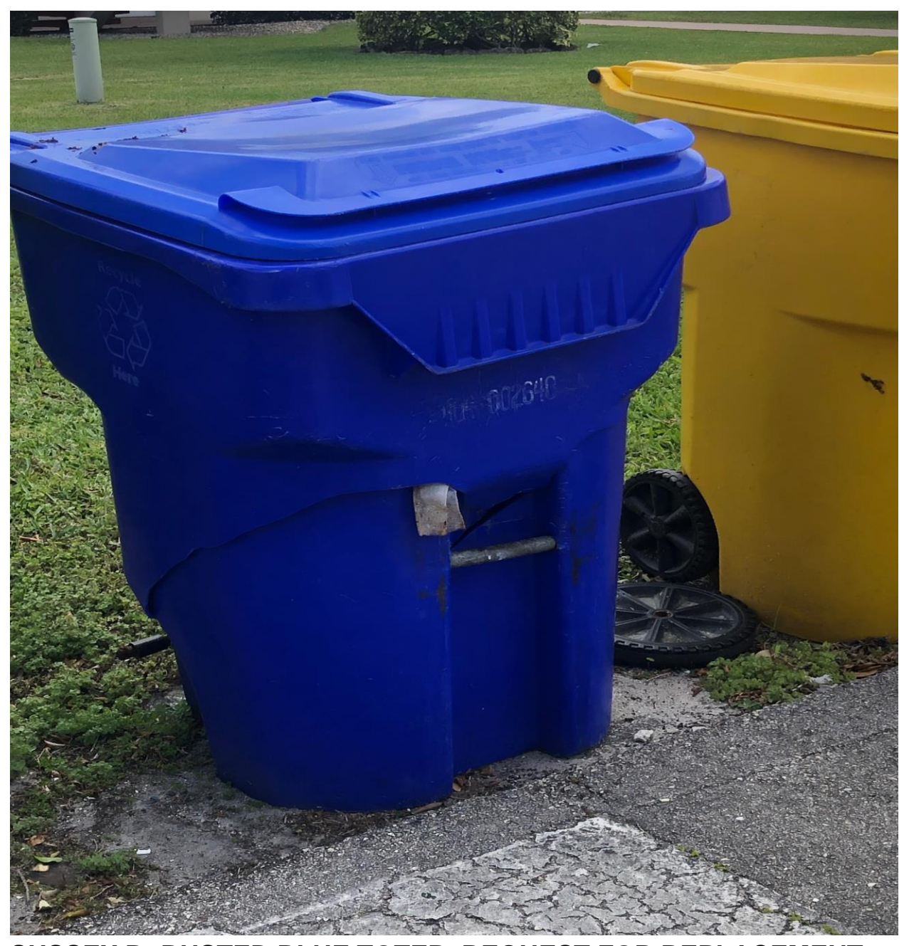
SUSSEX B- BUSTED BLUE TOTER. REQUEST FOR REPLACEMENT WAS SENT TO WASTE PRO.