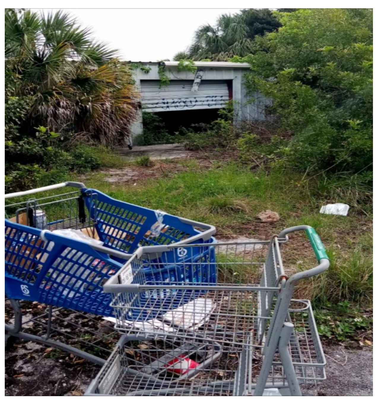
REFLECTION BAY- THIS DISUSED GARAGE BUILDING, NEAR THE CV/RB PROPERTY LINE, IS BEING USED BY HOMELESS PERSONS FOR SHELTER. NOTE THE SPRAY PAINTED MARKINGS ON THE GARAGE DOOR.