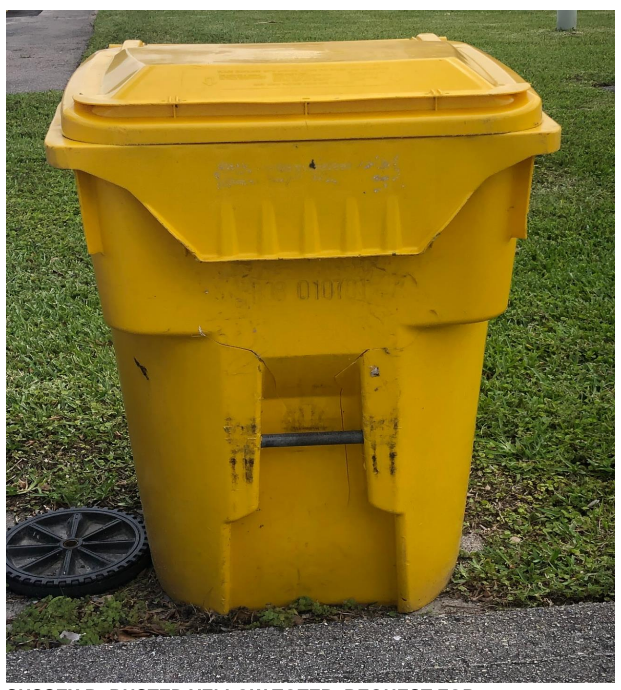
SUSSEX B- BUSTED YELLOW TOTER. REQUEST FOR REPLACEMENT WAS SENT TO WASTE PRO.