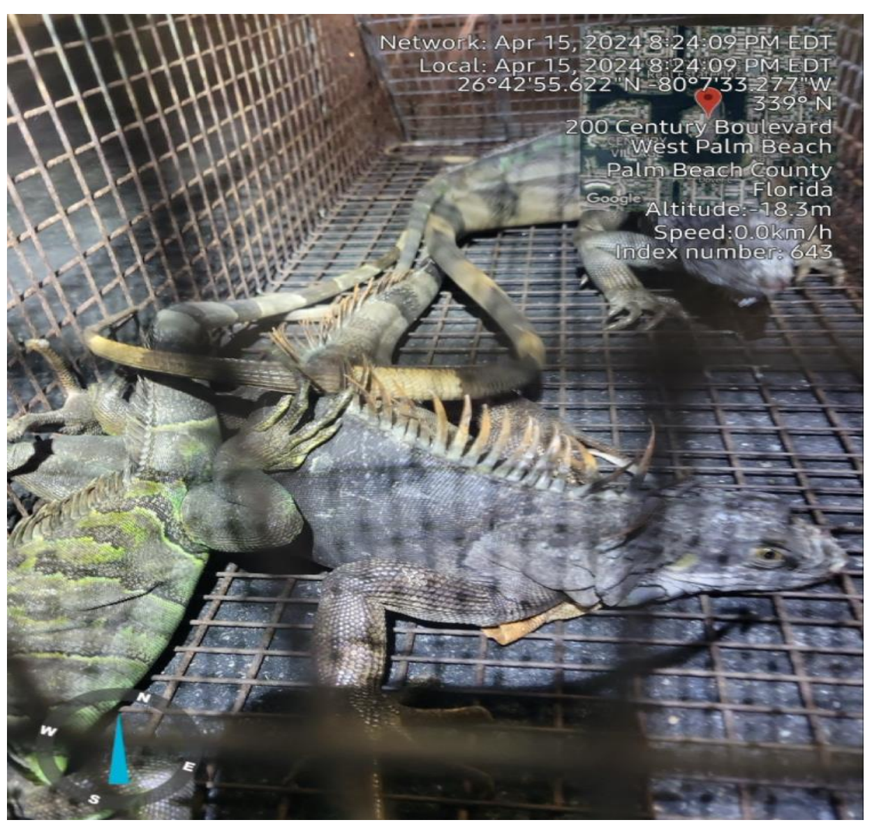
CLUBHOUSE ISLAND- TRAPPER JAY WAS VERY SUCCESSFUL WITH IGUANA REMOVALS.