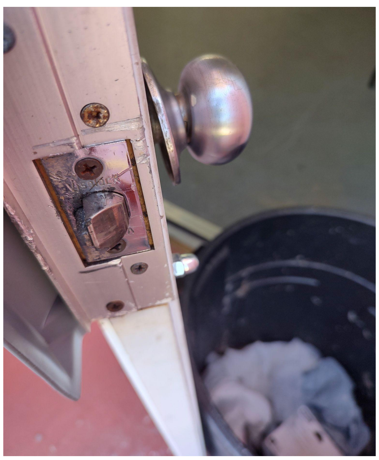
GOLFS EDGE- A LAUNDRY ROOM WAS BROKEN INTO, DISCOVERED ON MONDAY, 4/15/24.