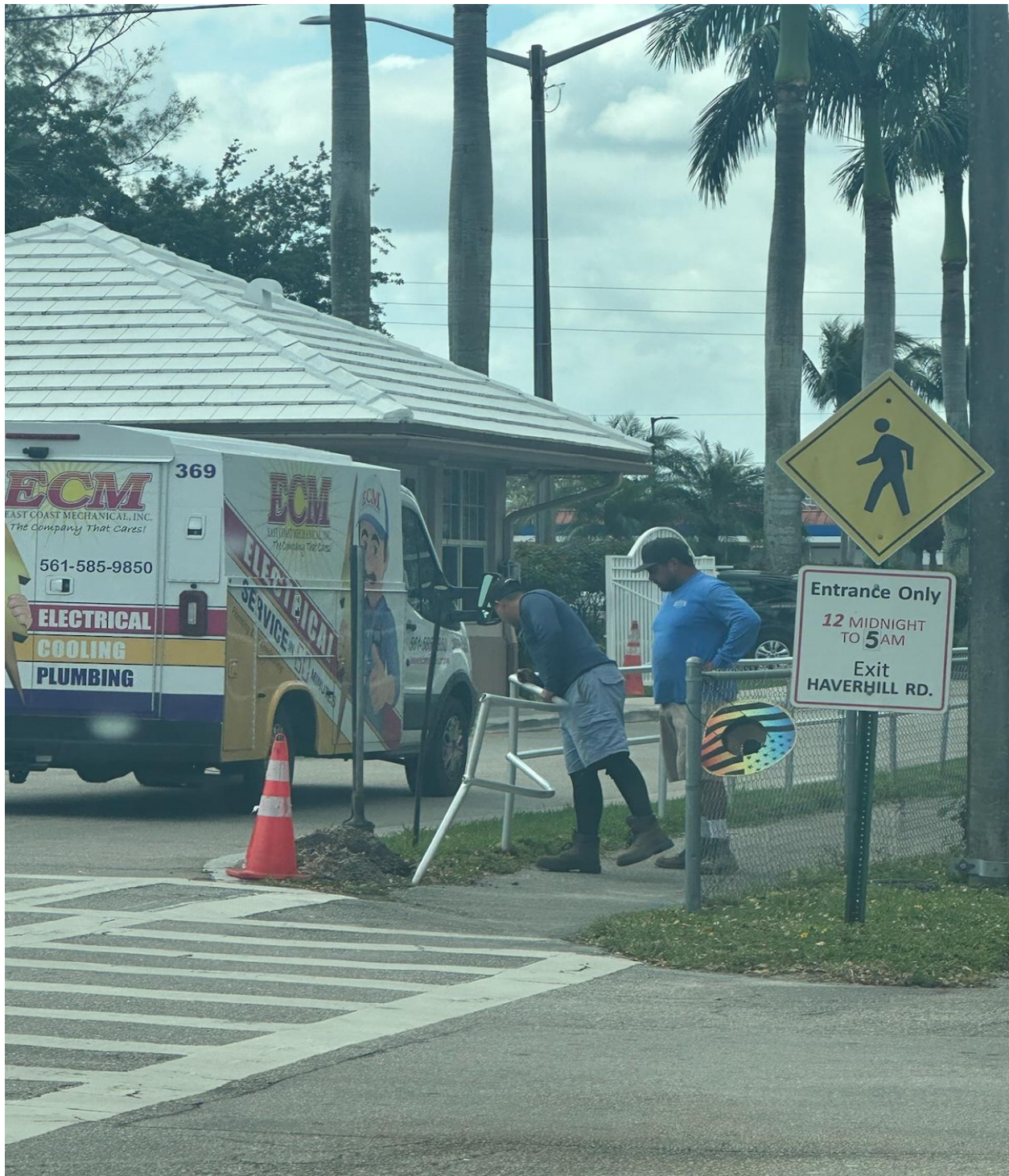
WEST DRIVE- BUDGET FENCE AND GATE REPAIRED THIS RAILING ON 4/9, WHICH WAS SMASHED INTO BY AN ACADEMY BUS. ACADEMY WILL BE INVOICED FOR THIS REPAIR.