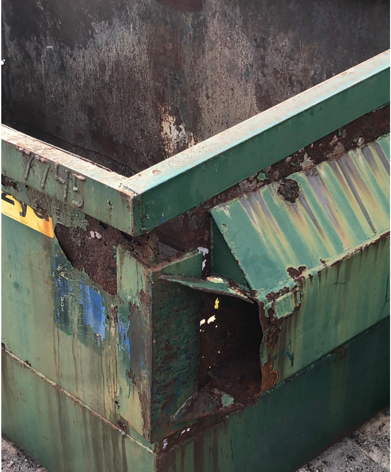
WALTHAM G- RUSTED OUT DUMPSTER. REQUEST FOR REPLACEMENT SENT TO WASTE PRO.