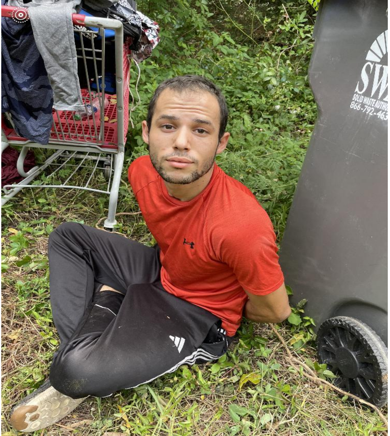
REFLECTION BAY- TRESPASSER ARRESTED BY PBSO ON 4/11.