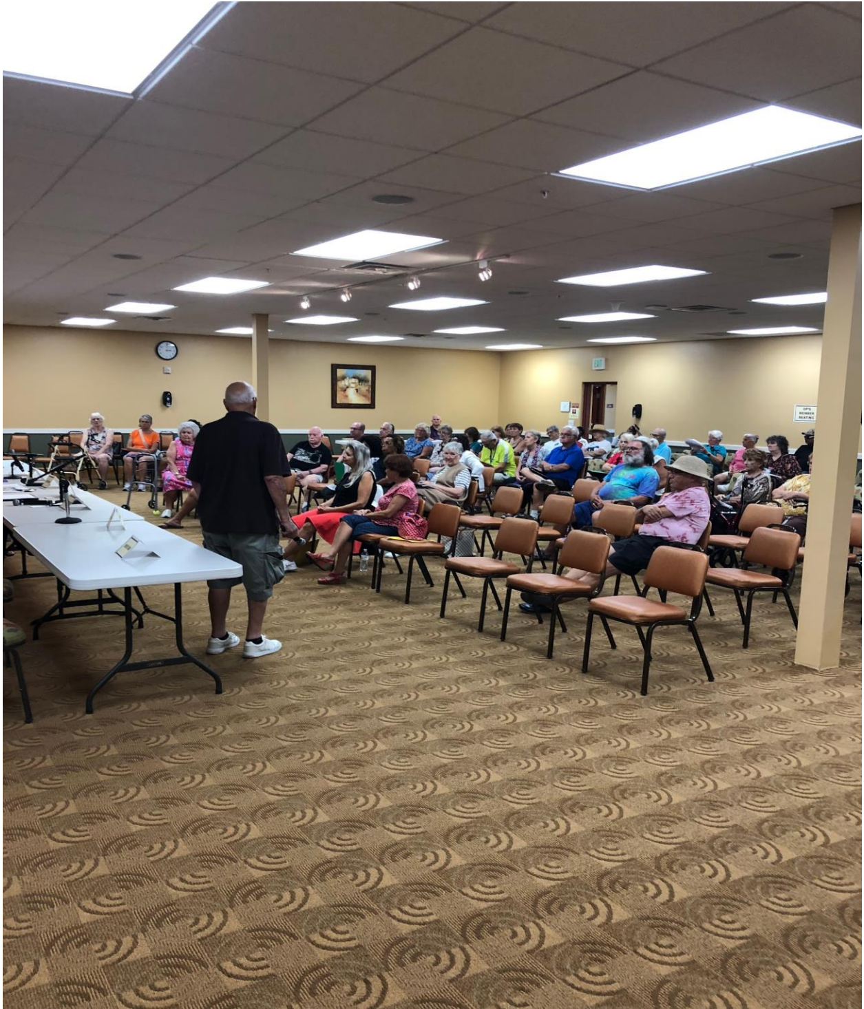
CV CLUBHOUSE- OVER SIXTY NEW CV RESIDENTS ATTENDED THE 4/9 UCO NEWCOMERS MEETING, WHICH COVERED A WIDE RANGE OF TOPICS CONCERNING LIFE IN CENTURY VILLAGE.