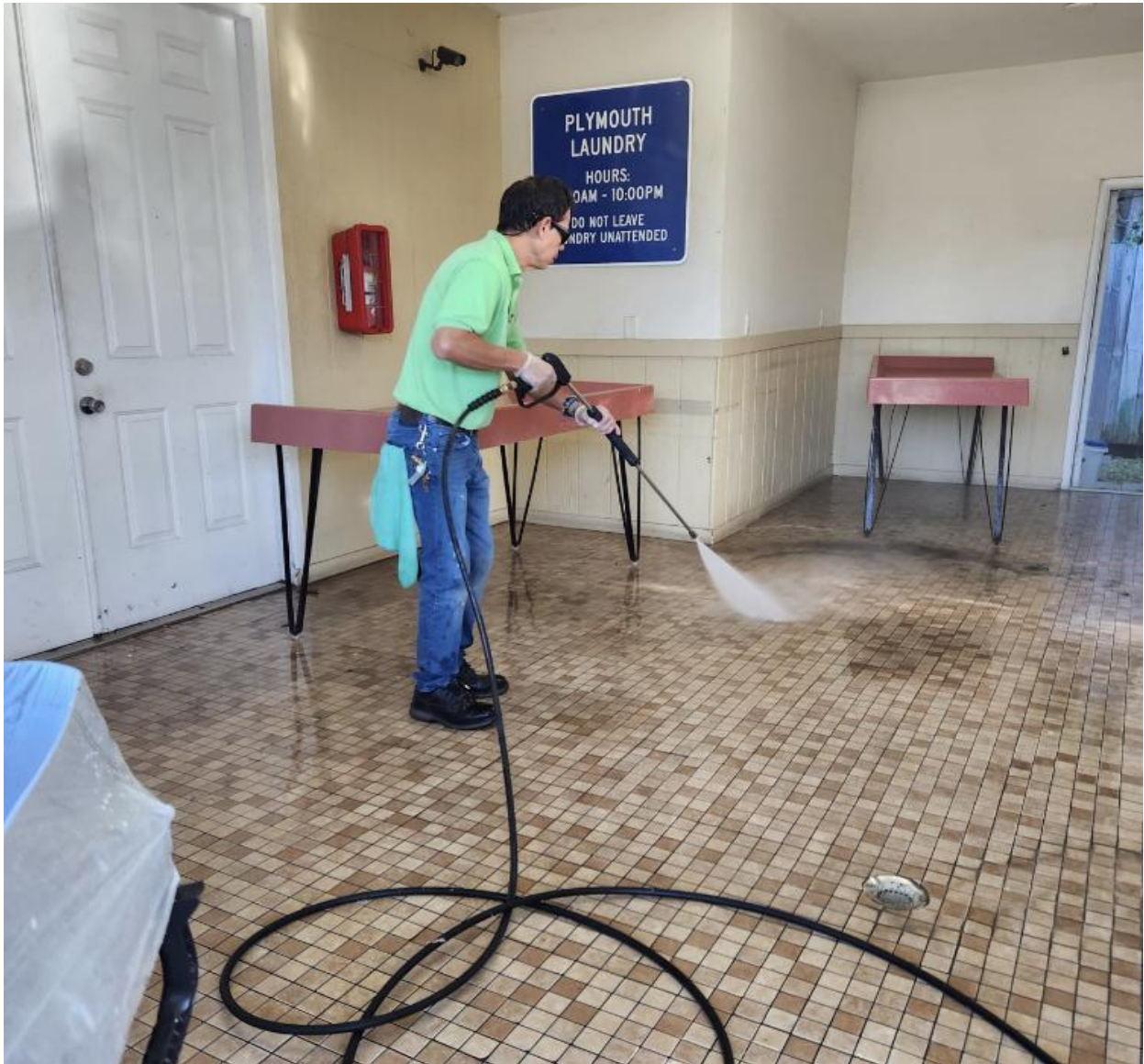
PLYMOUTH LAUNDRY- ON 4/13, GLOW CLEANING PLUS PERFORMED DEEP CLEANING AT THE PLYMOUTH LAUNDRY.