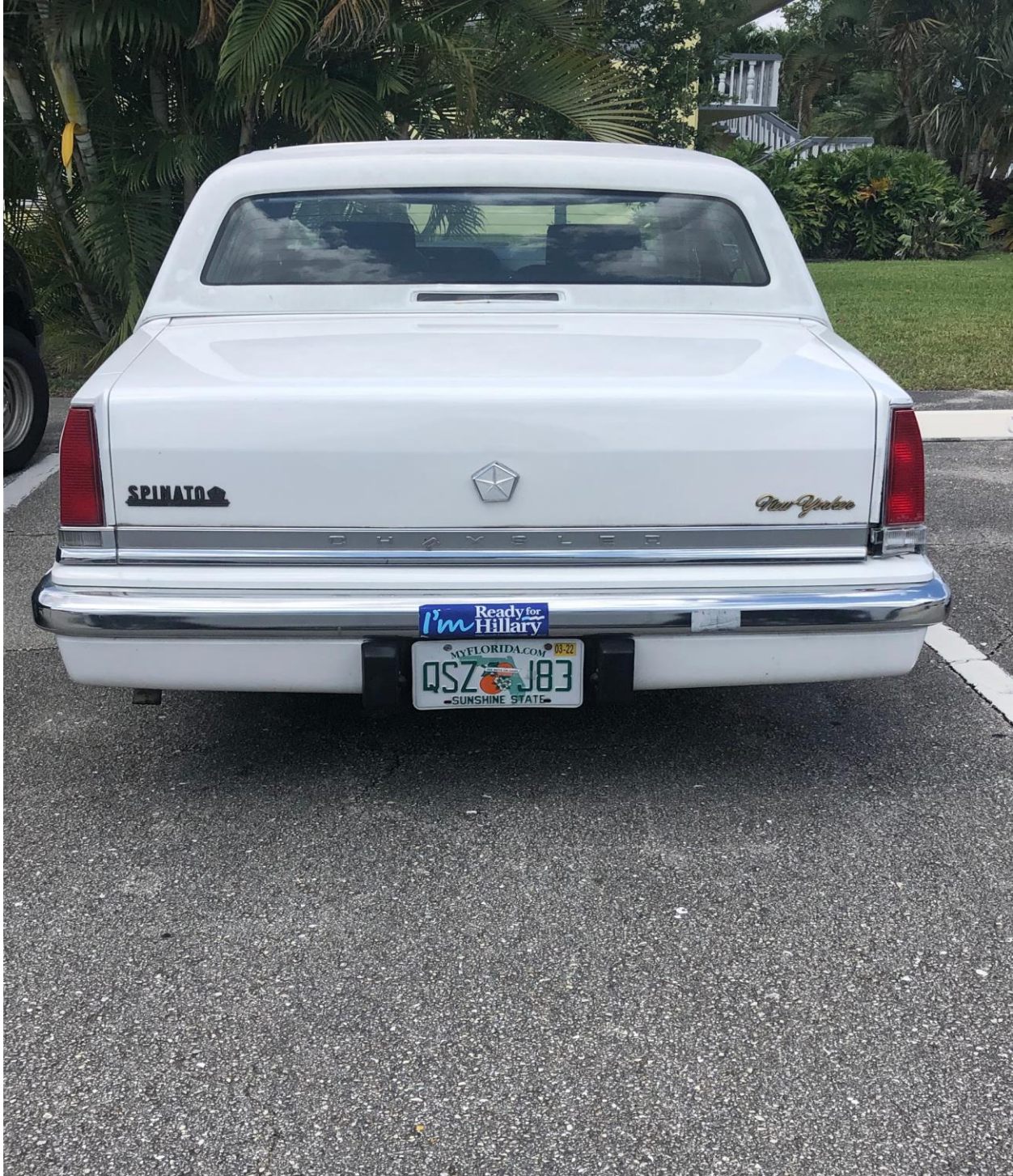
SUSSEX A- CAR WITH LONG EXPIRED REGISTRATION TAG. REPORTED TO PBC CODE ENFORCEMENT, COMPLAINT #C-2024- 04100011.