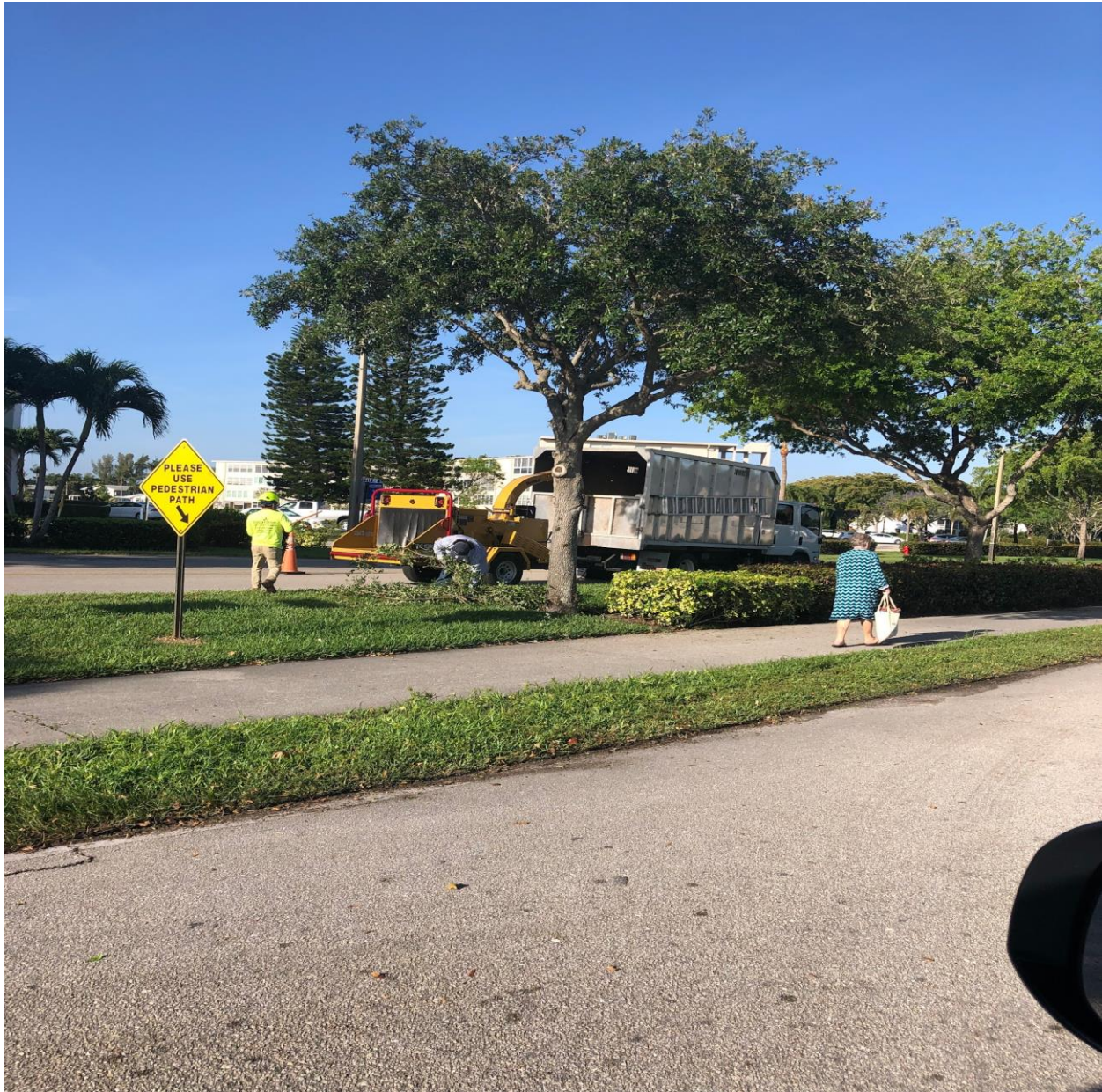
SOUTH DRIVE- TREE TRIMMING WORK CONTINUED LAST WEEK, MOSTLY ON LEAFY TREES ALONG THE MAIN ROADS. THIS WORK INVOLVES CANOPY REDUCTION, THINNING (WHICH IS FOR HURRICANES), AND REMOVAL OF “SUCKERS” WHICH ARE STRAY BRANCHES GROWING OFF THE TRUNKS.