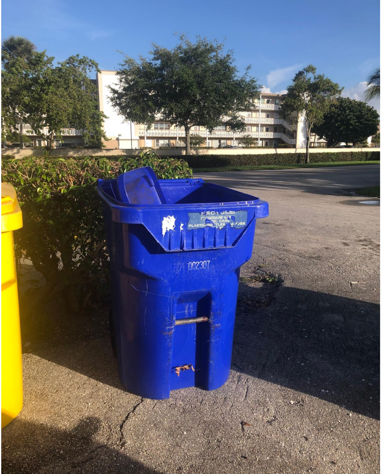
GOLFS EDGE- BUSTED LID ON A BLUE RECYCLE BIN. REQUEST FOR REPLACEMENT WAS SENT TO WASTE PRO. PLEASE SEND BUSTED DUMPSTER REPORTS TO UCOGARBAGE@GMAIL.COM .