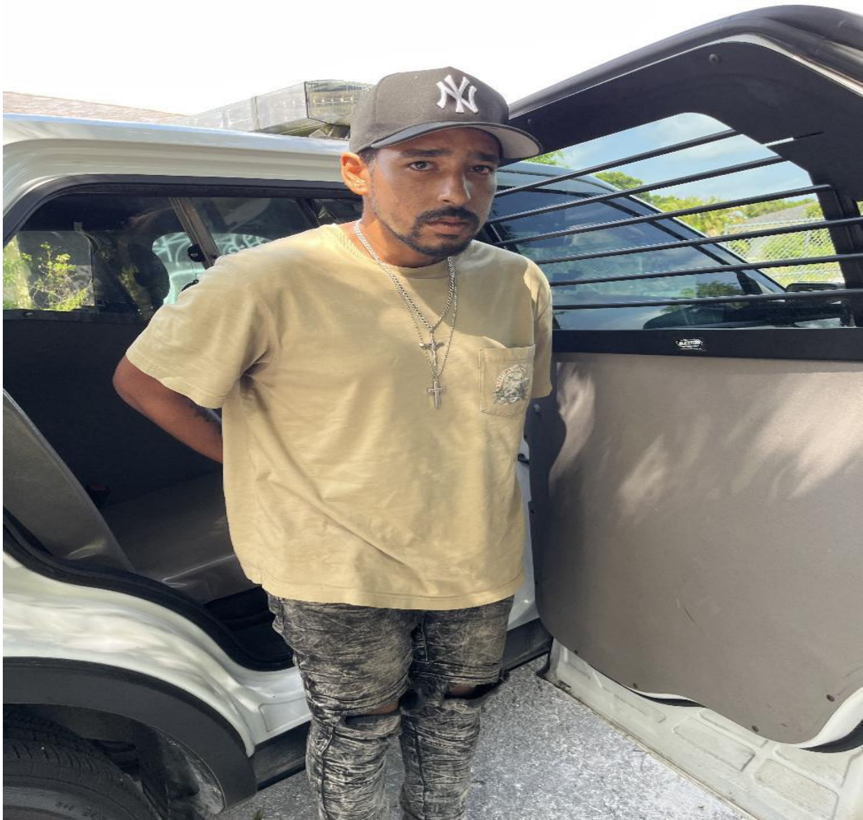
REFLECTION BAY- TRESPASSER ARRESTED. PBSO DOES NOT FOOL AROUND.