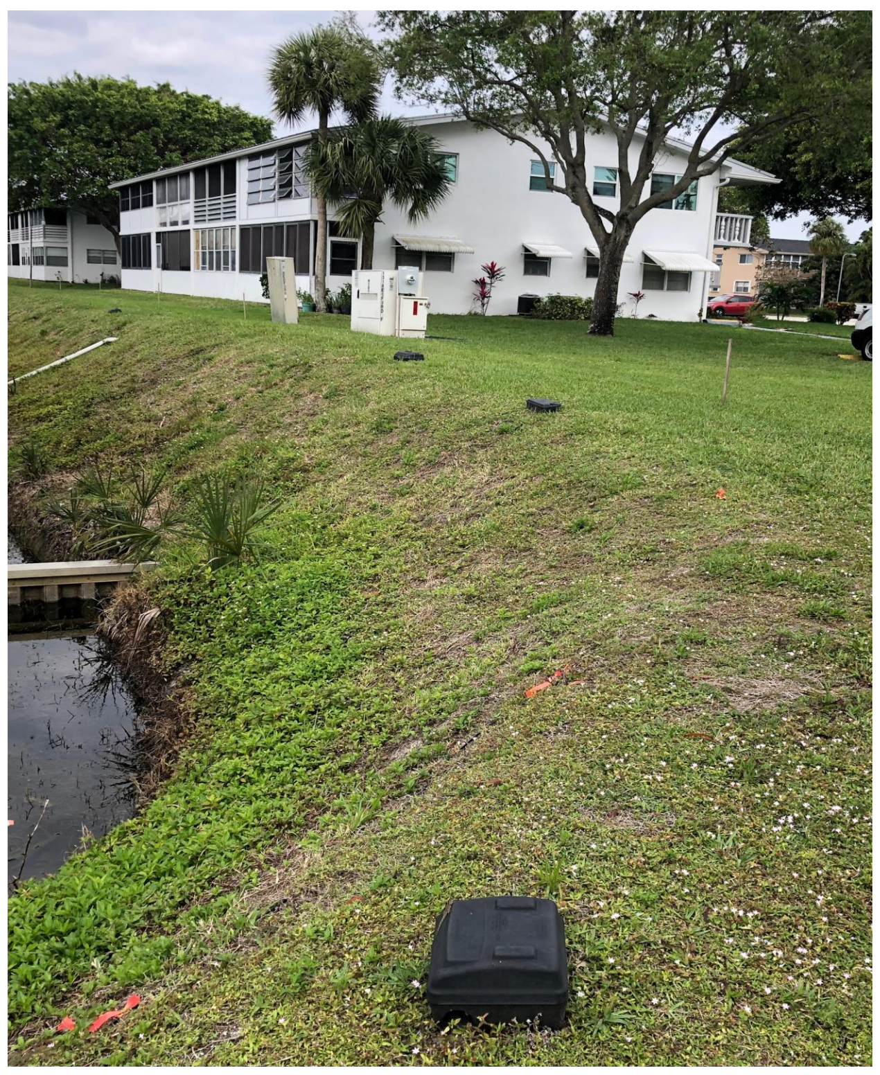
BEDFORD SECTION- THESE BAIT STATIONS, ALONG SOUTH CANAL, WERE NOT MOVED BY RESIDENTS AND PROVED VERY EFFECTIVE.