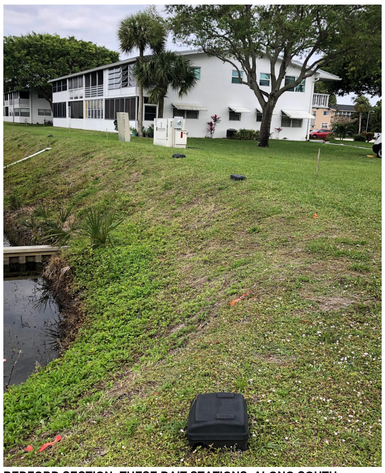
BEDFORD SECTION- THESE BAIT STATIONS, ALONG SOUTH CANAL, WERE NOT MOVED BY RESIDENTS AND PROVED VERY EFFECTIVE.