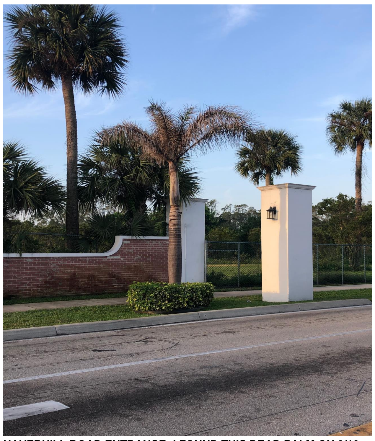
HAVERHILL ROAD ENTRANCE- I FOUND THIS DEAD PALM ON 3/10. IT WILL BE REMOVED BY SEACREST SERVICES SOON.