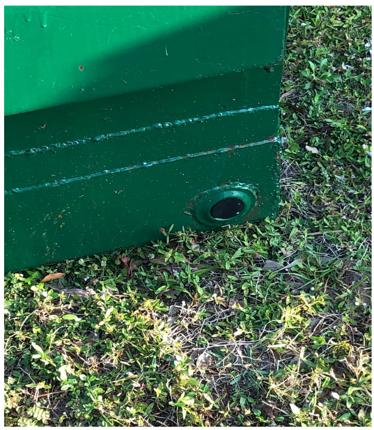
CAMBRIDGE I- THESE DRAIN HOLES, ON THE SIDES OF THE DUMPSTERS, ARE USUALLY HOW RATS GET IN. NOT IN THIS CASE, BECAUSE THE HOLE IS PLUGGED. CV PROPERTY MANAGERS CAN PLUG THESE DRAIN HOLES, IF NEEDED. CHECK YOUR DUMPSTER.