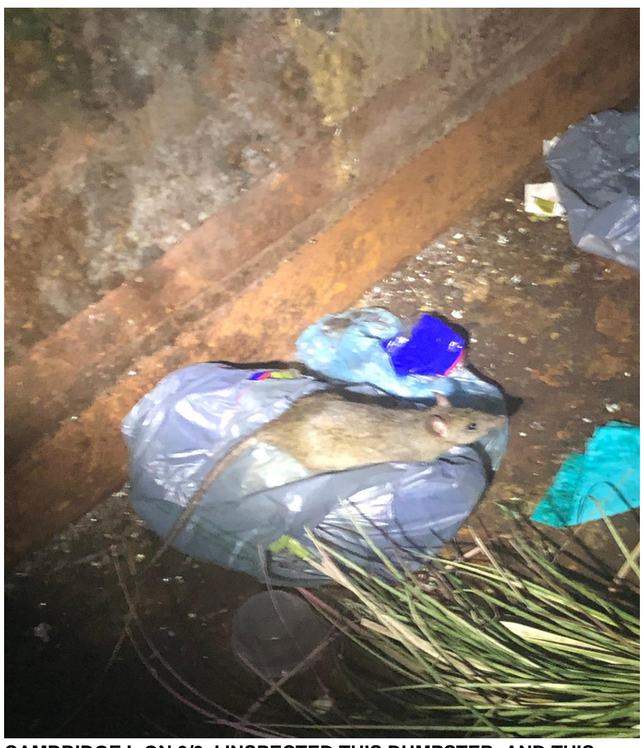
CAMBRIDGE I- ON 3/9, I INSPECTED THIS DUMPSTER, AND THIS FELLOW POSED FOR A PICTURE BEFORE I RAN AWAY. NO RAT BITES FOR DONALD.