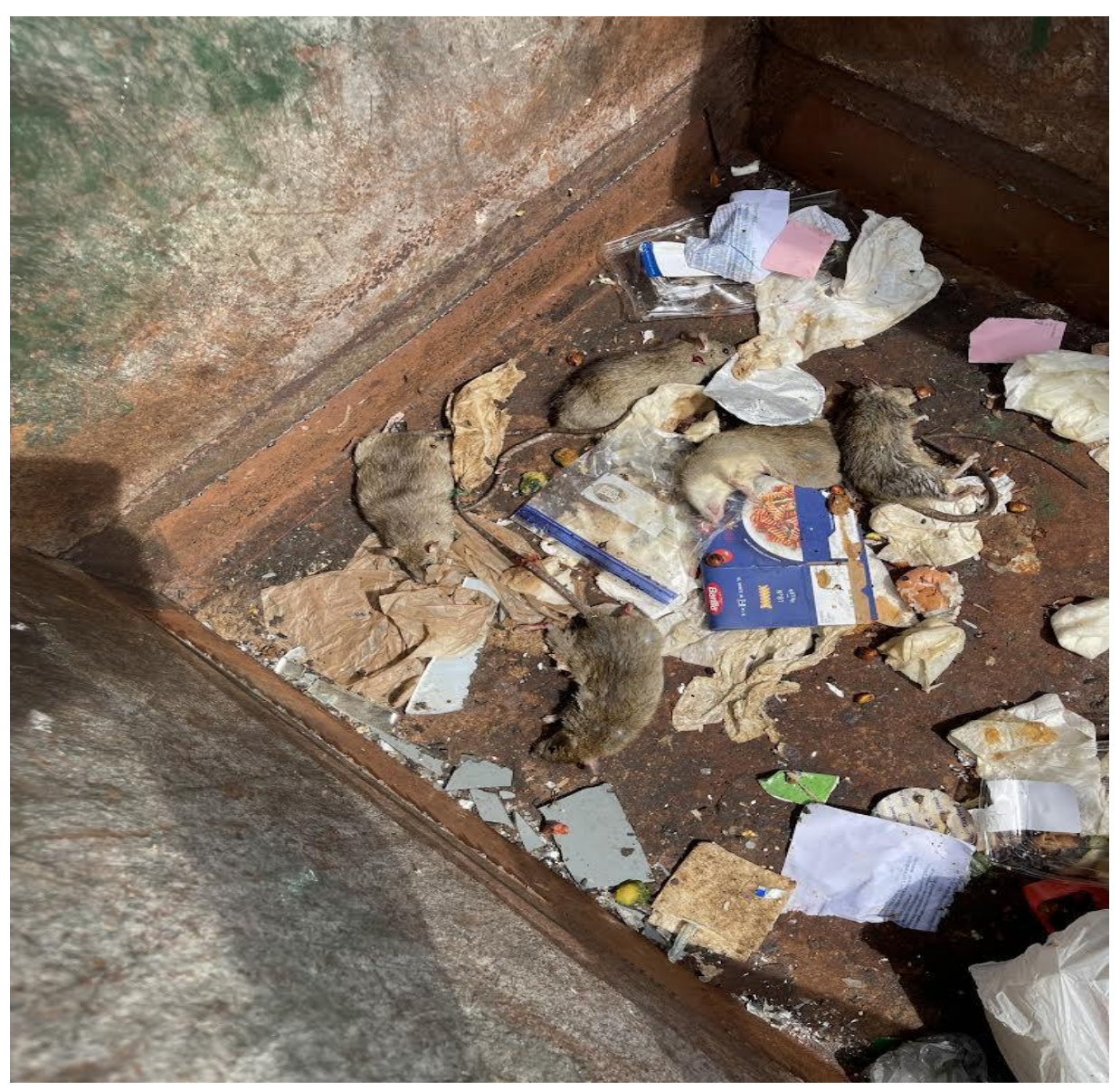
CAMBRIDGE I- THIS IS AN IMPRESSIVE BODY COUNT, BUT ILL-ADVISED NONETHELESS.