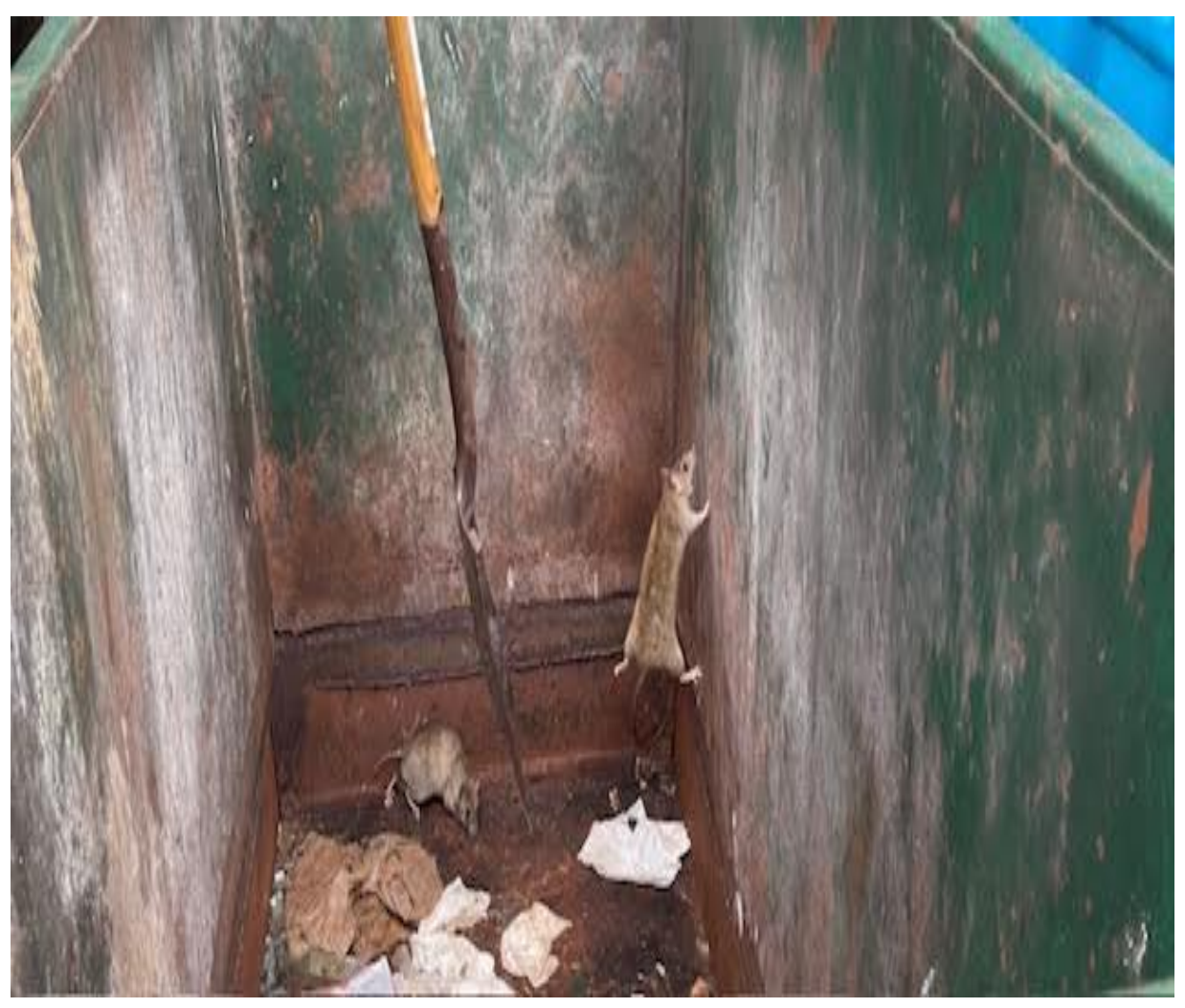
CAMBRIDGE I- ON 3/8, A CV UNIT OWNER WENT AFTER THE RATS IN HIS DUMPSTER WITH A SHOVEL. YIKES! THESE THINGS ARE LIGHTING QUICK, AND CAN JUMP FOUR FEET STRAIGHT UP. AND THEY BITE.