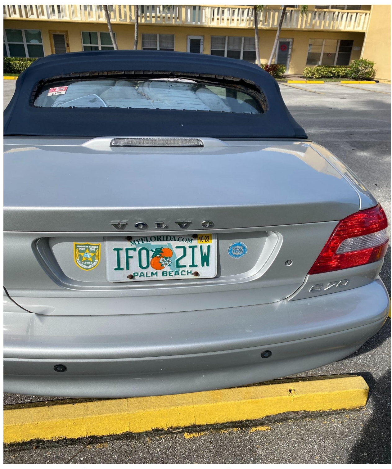
ANDOVER G- CAR WITH EXPIRED REGISTRATION TAG. REPORTED IN BY A CV UNIT OWNER. REPORTED TO PBC CODE ENFORCEMENT.