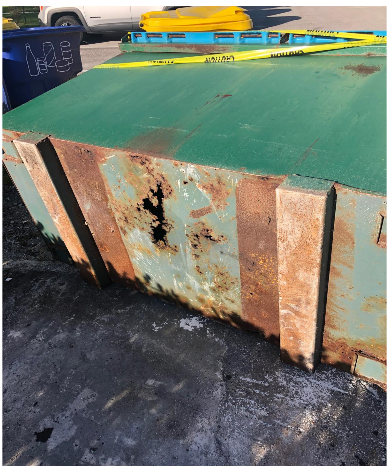
BEDFORD G- ROTTED OUT DUMPSTER. REQUEST FOR REPLACEMENT WAS SENT TO WASTE PRO.