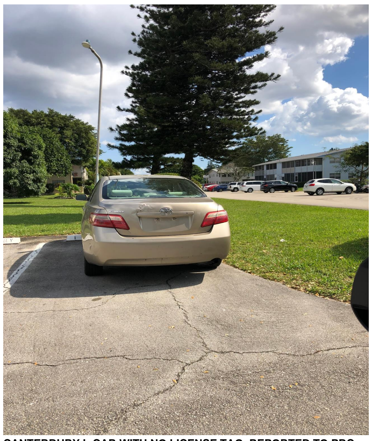
CANTERBURY I- CAR WITH NO LICENSE TAG. REPORTED TO PBC CODE ENFORCEMENT.