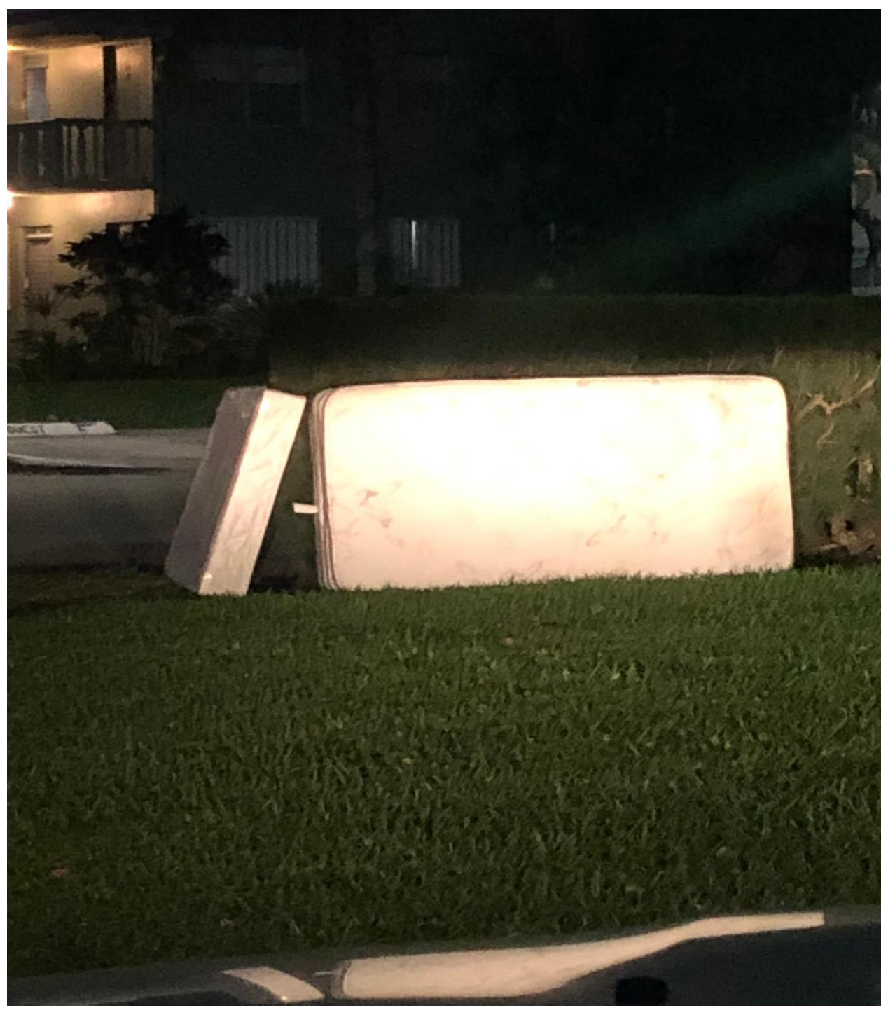
EASTHAMPTON F- THESE NASTY MATTRESSES WERE PUT OUT ON SATURDAY, 2/3. A COMPLAINT WAS SENT TO PBC CODE ENFORCEMENT. NO CV UNIT OWNER SHOULD HAVE TO STARE AT STAINED MATTRESSES ALL WEEK LONG.