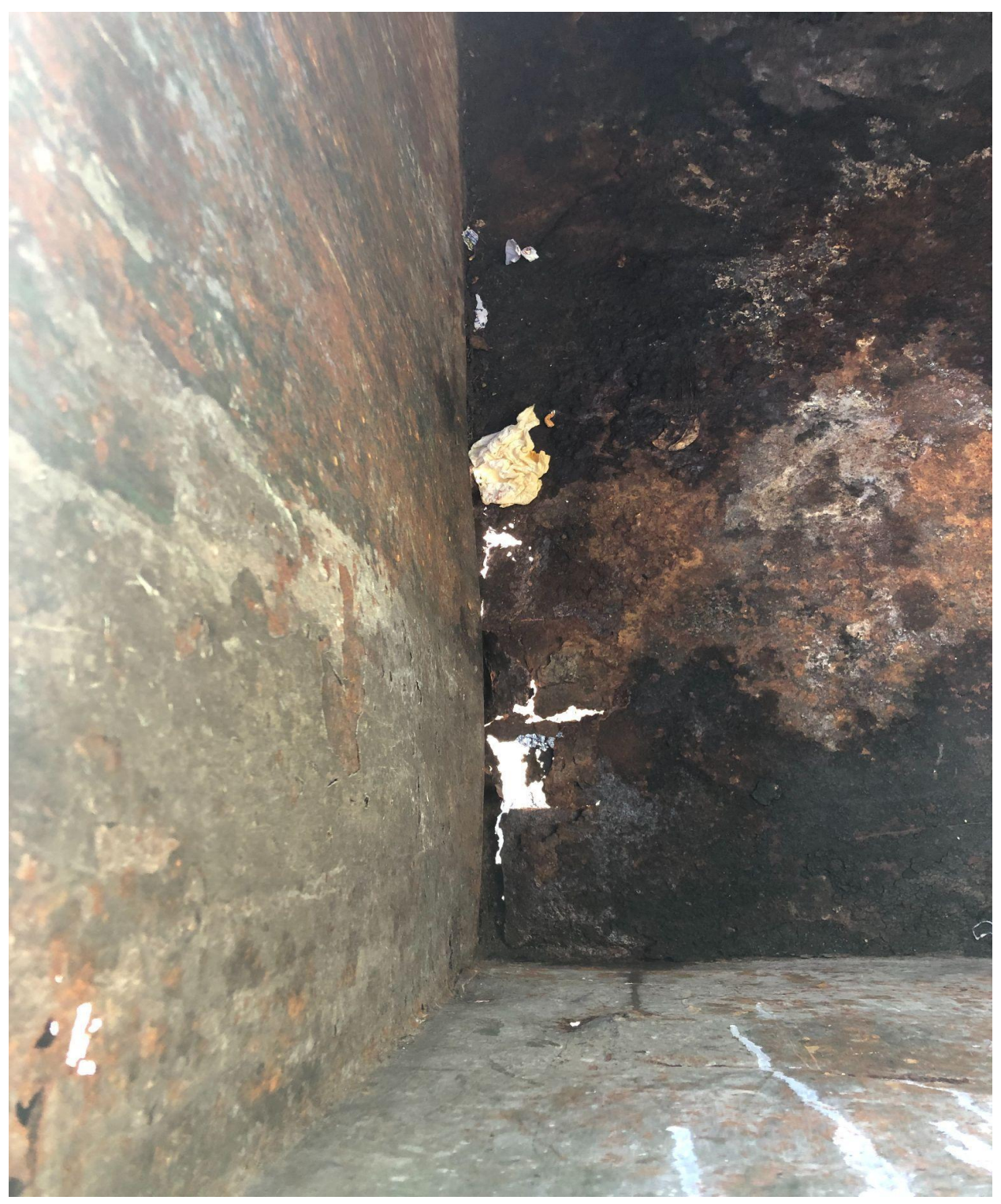
BEDFORD B- RUSTED OUT DUMPSTER. A REQUEST FOR REPLACEMENT WAS SENT TO WASTE PRO.