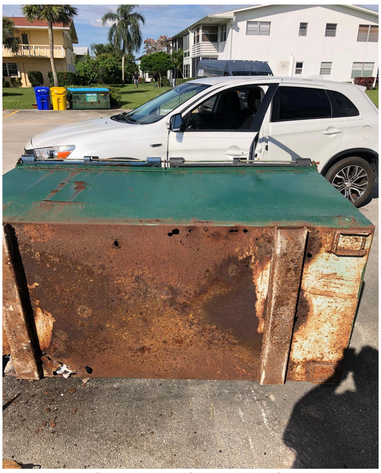
WALTHAM E- RUSTED OUT DUMPSTER. A REQUEST FOR REPLACEMENT WAS SENT TO WASTE PRO.