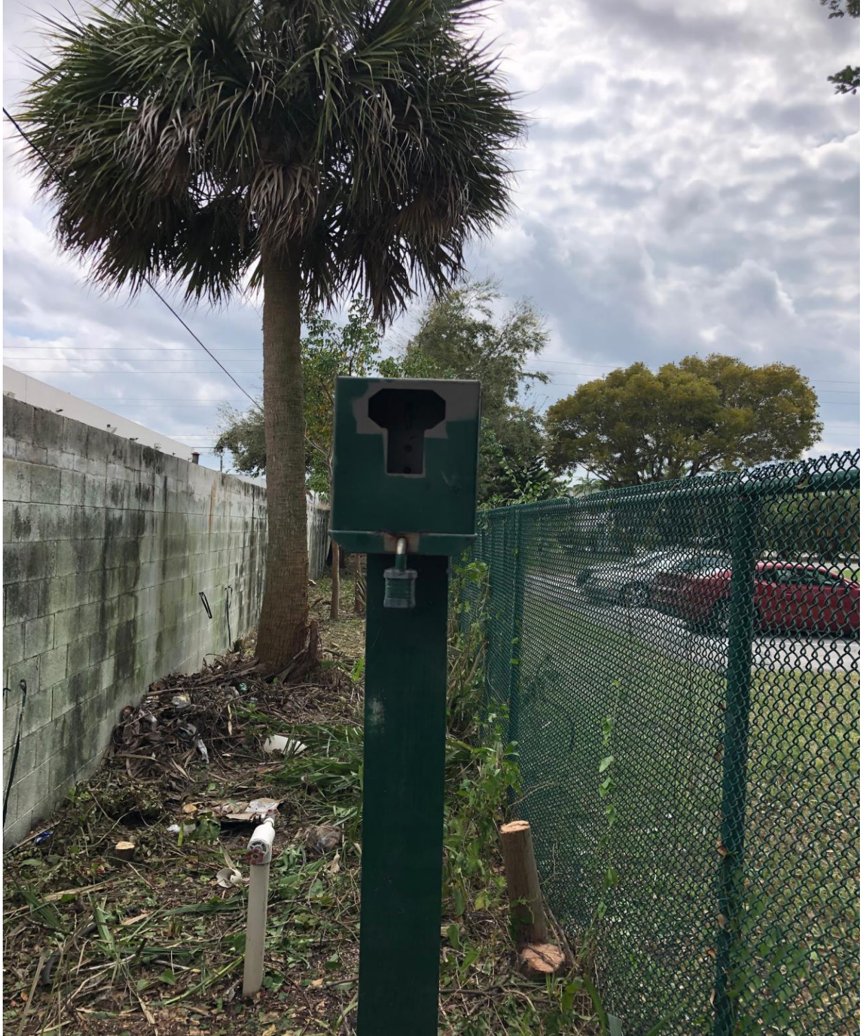
SOUTHAMPTON SECTION- STEALTH CAMS ALONG THIS FENCE LINE ALLOW SECURITY TO MONITOR FOR WALL/FENCE JUMPERS.