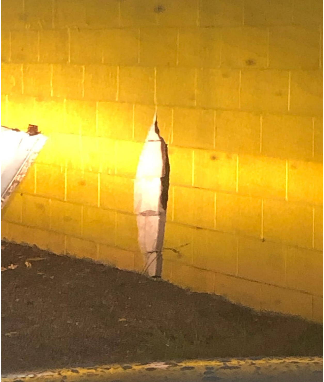
HERE IS THE HOLE FROM THE SHOPPING CENTER SIDE OF THE HOLE. LIKELY HIT BY A GARBAGE TRUCK.