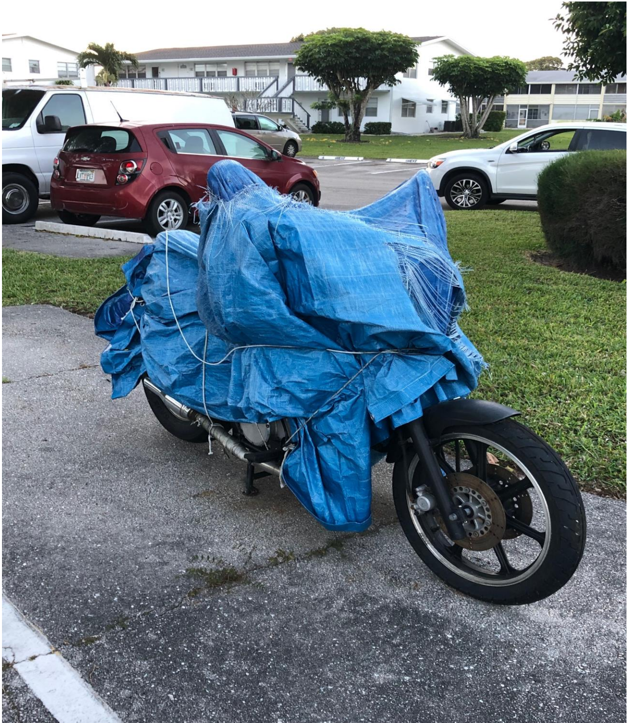
CAMDEN B- NASTY LOOKING COVERED MOTORCYCLE. HAS NOT MOVED IN YEARS. EYESORE.