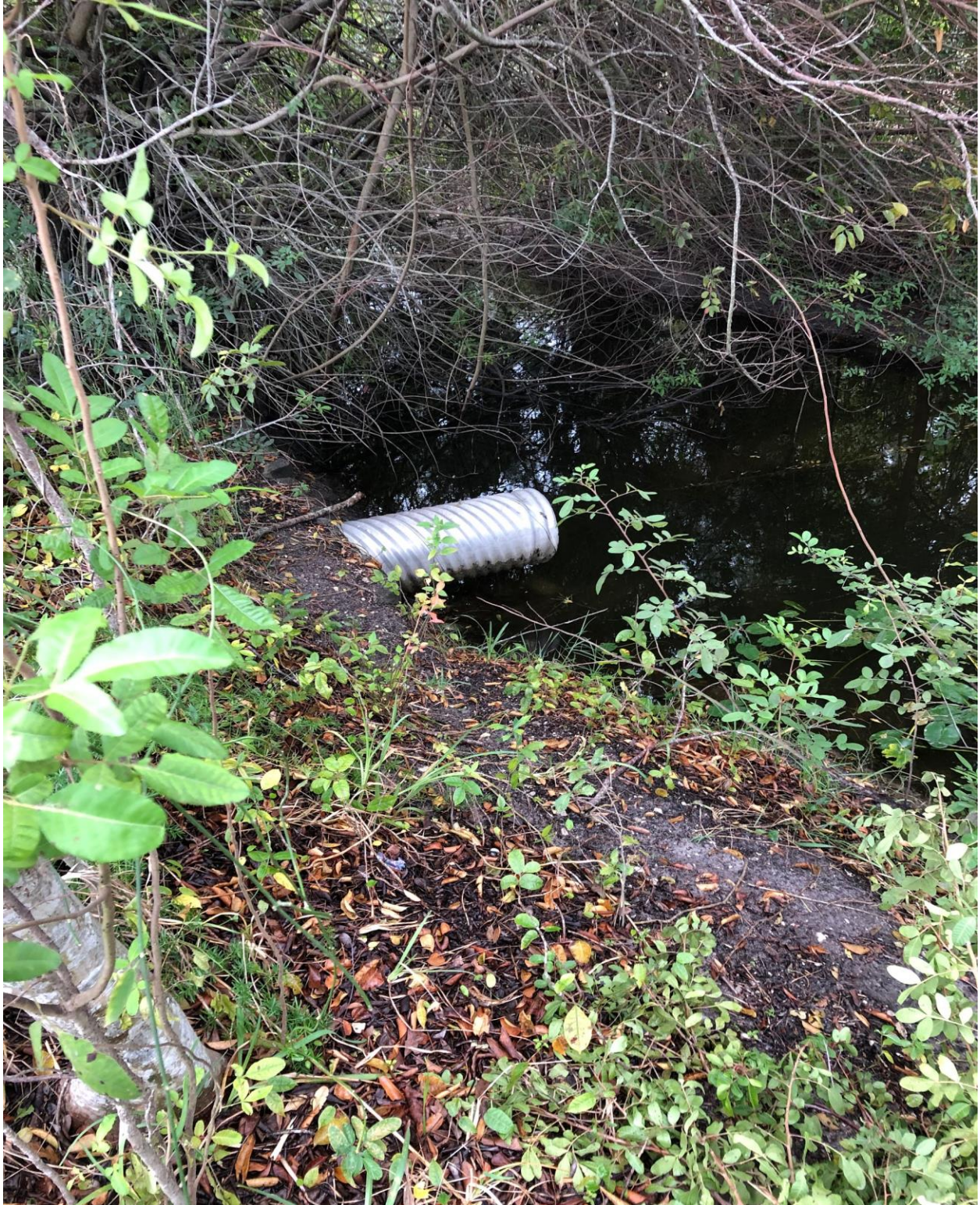
ANDOVER SECTION- RECENT LAND CLEARING SHOWS HOW IMPORTANT THIS CANAL IS: ALL OF ANDOVER DRAINS OFF THROUGH THIS PIPE INTO THE CANAL.