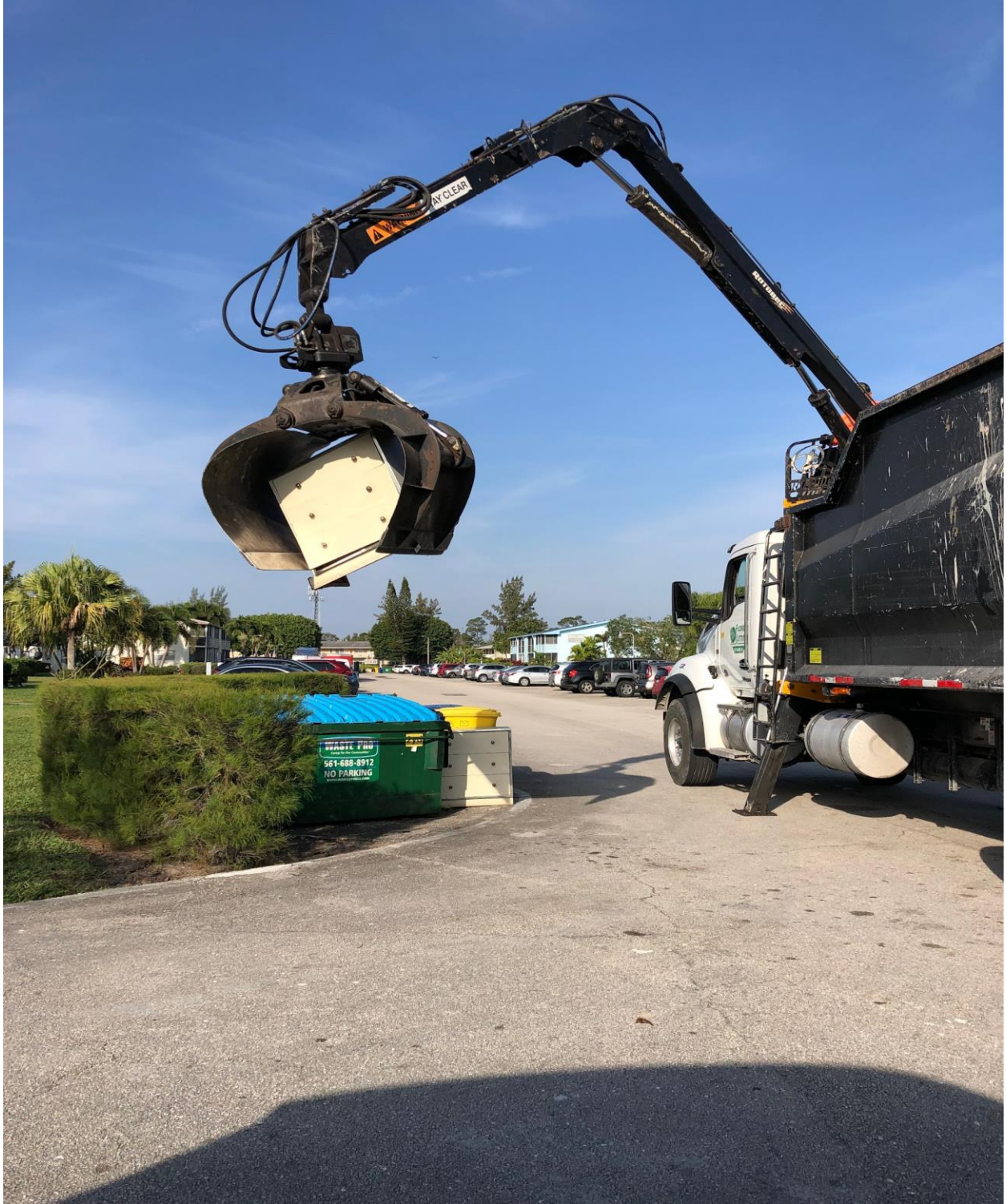
CANTERBURY SECTION- WASTE PRO SENT OUT A CLAM TRUCK ON 2/17 TO REMOVE THE MISSED BULK TRASH ITEMS. THANK YOU!