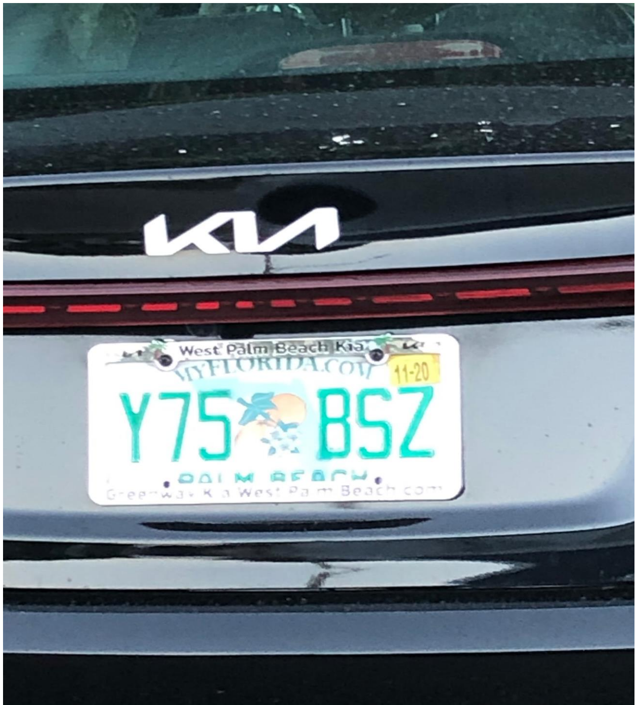
CHATHAM P- CAR WITH EXPIRED REGISTRATION TAG. REPORTED TO PBC CODE ENFORCEMENT, COMPLAINT #C-2024-02120008.