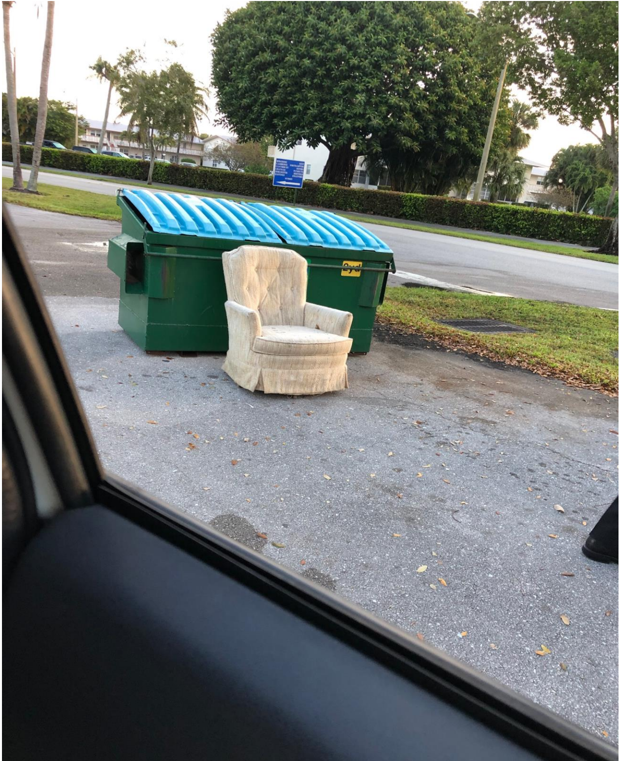
STRATFORD SECTION- A NUMBER OF BULK TRASH ITEMS AT SEVERAL CV SECTIONS WERE MISSED BY WASTE PRO ON 2/16.