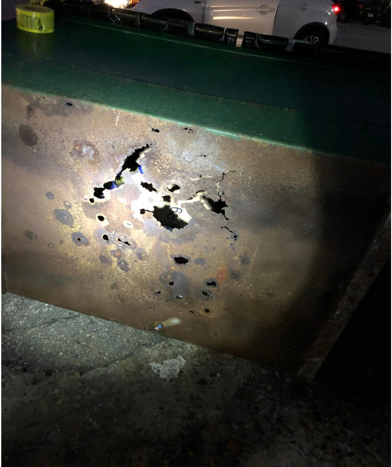
ANDOVER K- RUSTED OUT DUMPSTER. REPORTED IN BY A CV UNIT OWNER. A REQUEST FOR REPLACEMENT WAS SENT TO WASTE PRO.