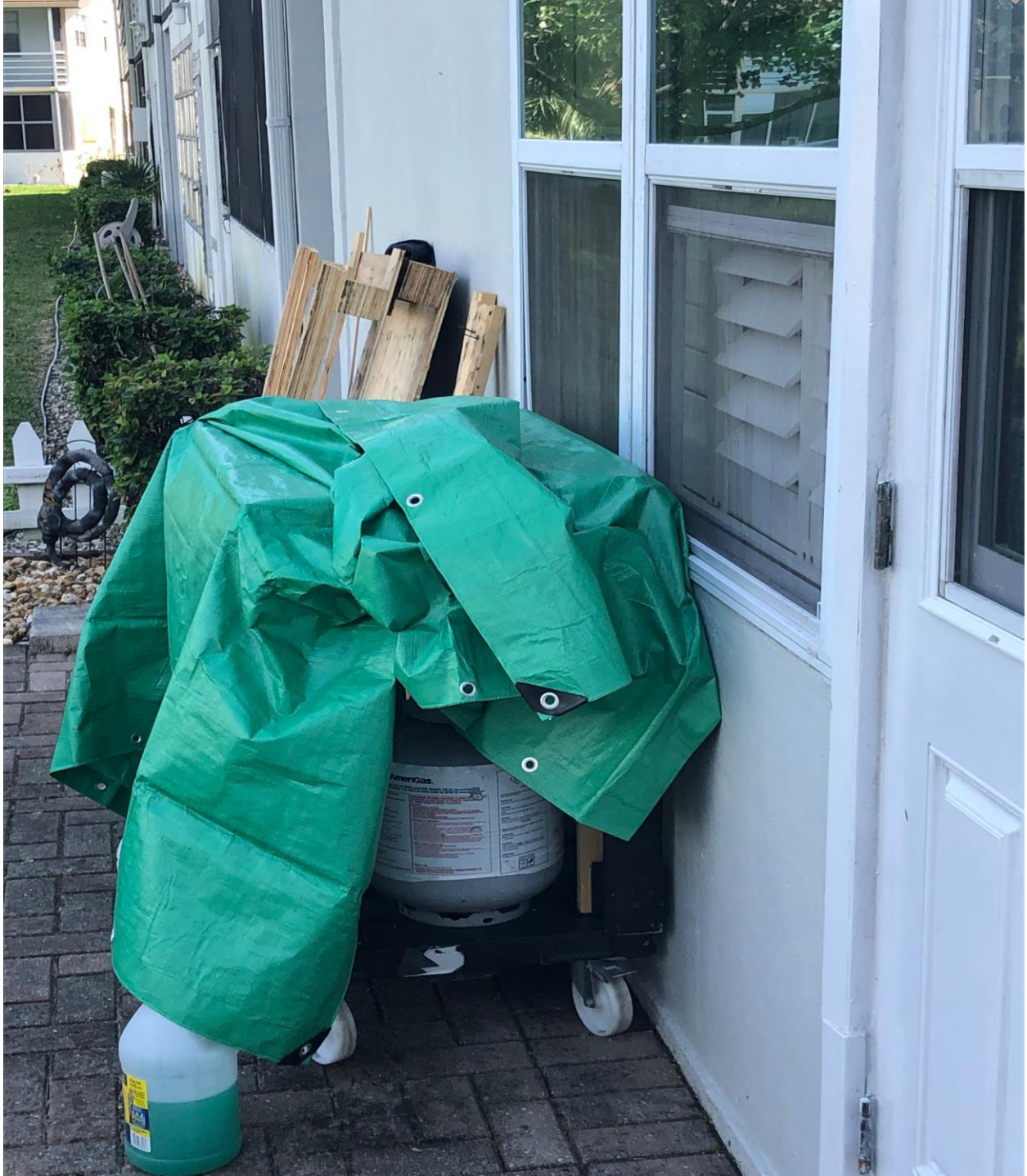
NORTHAMPTON K- PROPANE TANK UP AGAINST THE BUILDING. REPORTED TO UCO BY A NORTHAMPTON K UNIT OWNER. THIS IS DANGEROUS. A REPORT WAS SENT TO PBC CODE ENFORCEMENT, COMPLAINT # C-2024-02130019. THE ASSOCIATION'S PROPERTY MANAGER WAS NOTIFIED.