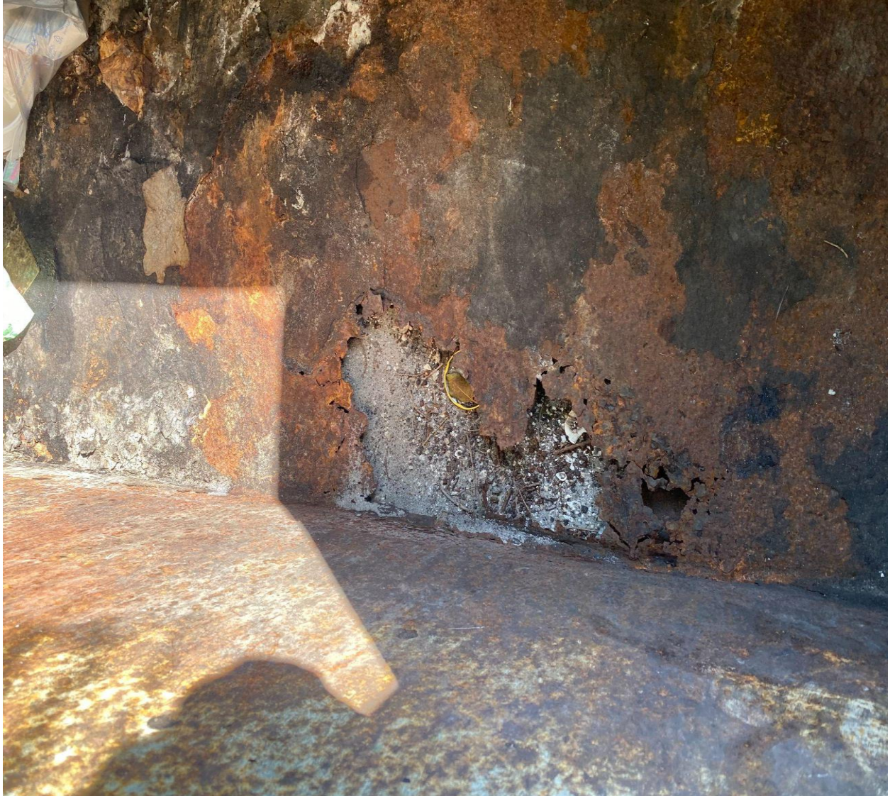
SHEFFIELD A- RUSTED OUT DUMPSTER. REPORTED IN BY A CV UNIT OWNER. REQUEST FOR REPLACEMENT WAS SENT TO WASTE PRO.