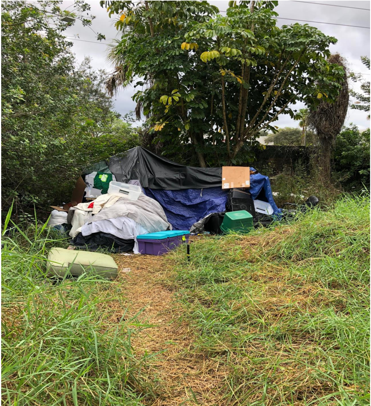
REFLECTION BAY- THIS IS ONE OF THE HOMELESS ENCAMPMENTS ON THE REFLECTION BAY PROPERTY, LOCATED NEAR THE FAMILY DOLLAR STORE.