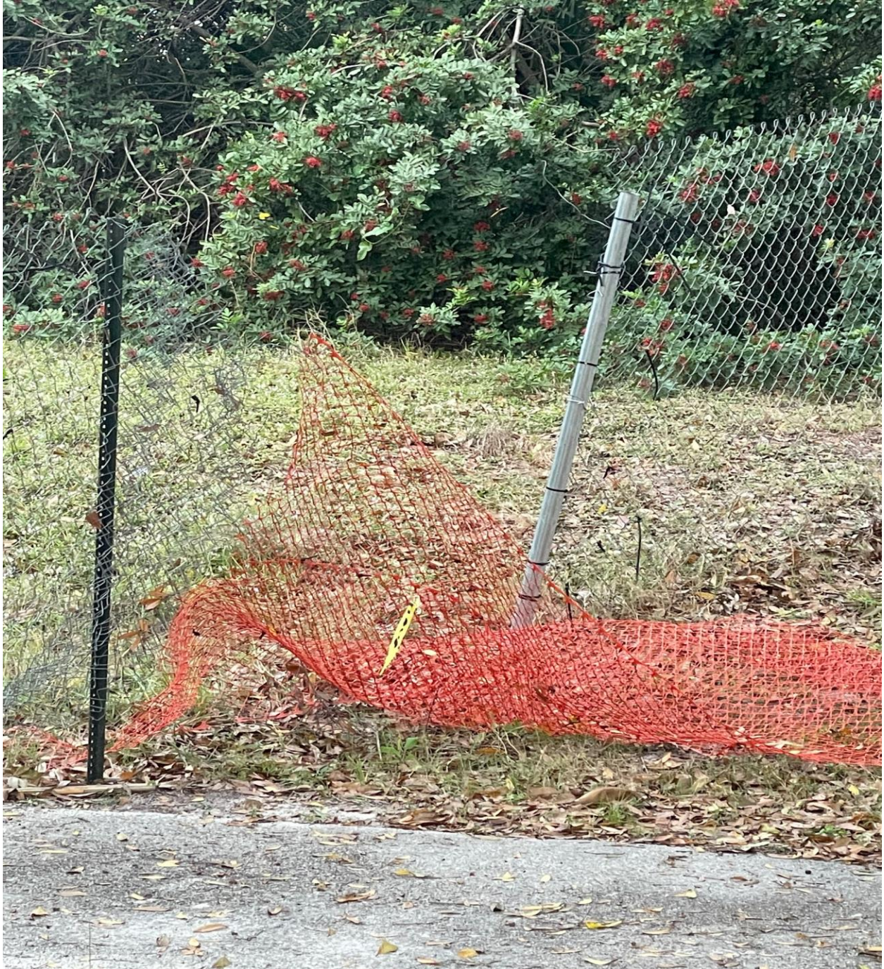
SOUTHAMPTON SECTION- THIS SECTION OF TEMPORARY CONSTRUCTION FENCE WAS FOUND TO BE PUSHED DOWN BY A CV UNIT OWNER, WHO REPORTED IT TO UCO.