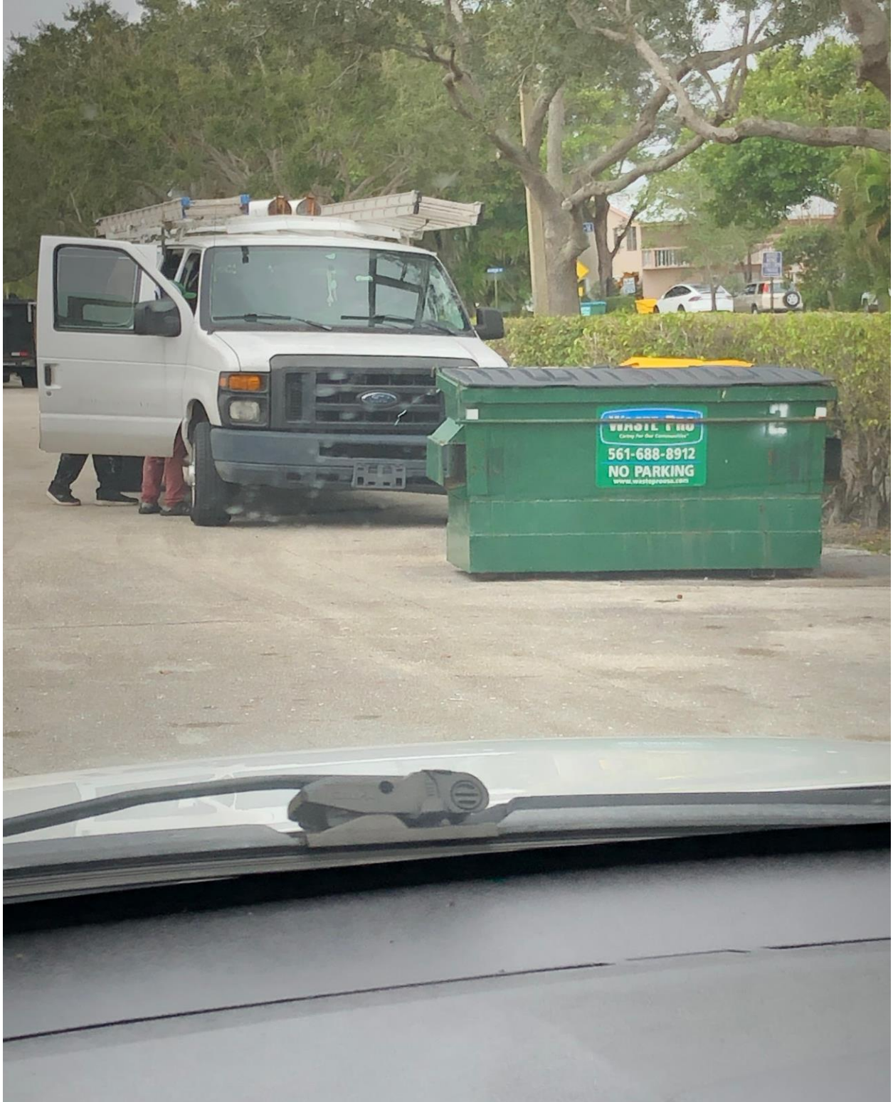
STRATFORD SECTION- I SPOTTED THIS VAN ON 1/15. SOMETHING GOING ON HERE.