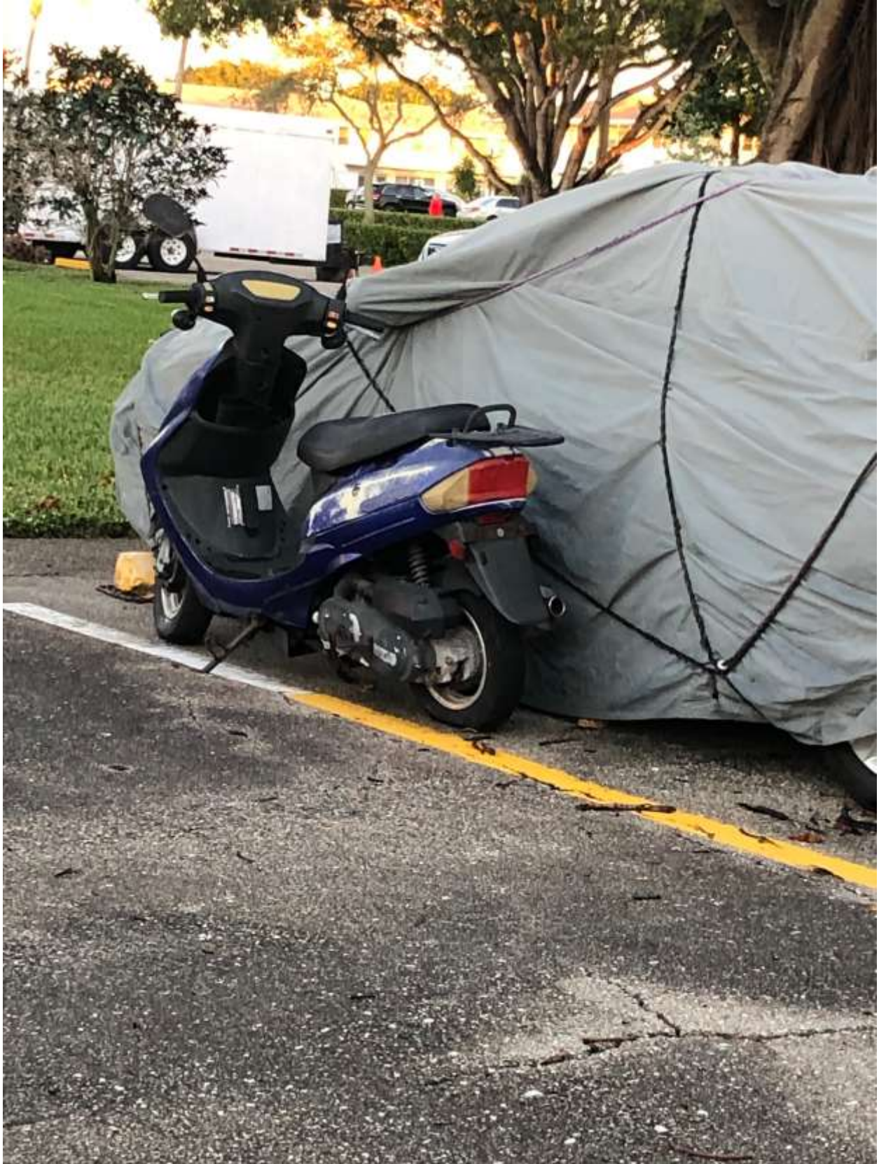
CAMDEN M- REPORTED TO PBC CODE ENFORCEMENT.