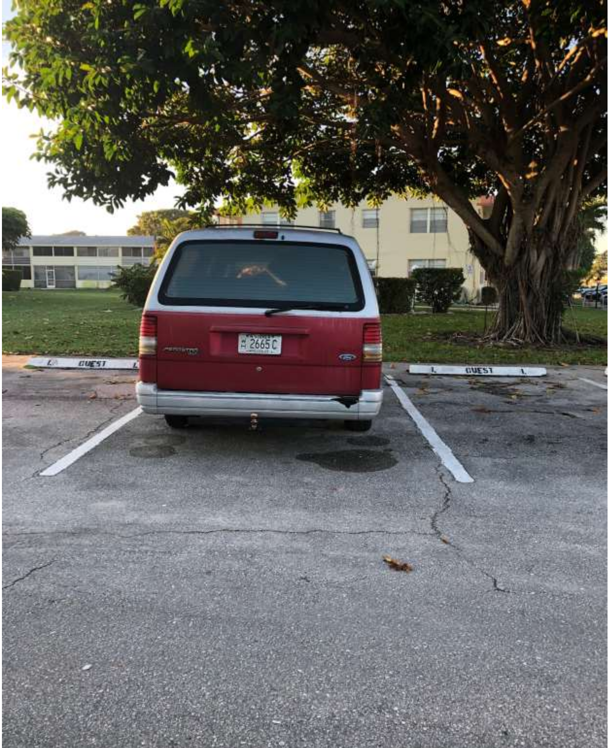
CAMDEN M- THIS VAN HAS DIFFERENT PLATES EVERY WEEK. REPORTED TO PBC CODE ENFORCEMENT AS A POSSIBLE UNREGISTERED VEHICLE.