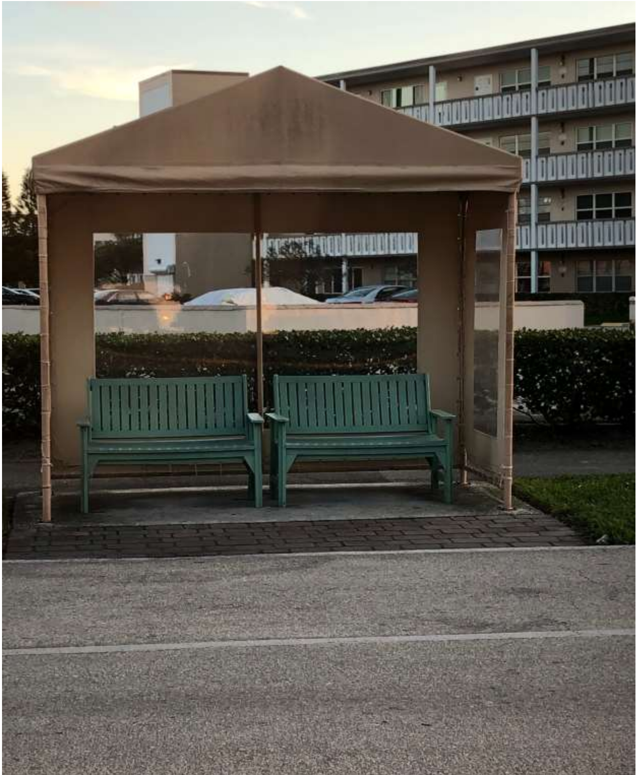
CENTURY BOULEVARD- NEW BUS STOP SHELTER INSTALLED BY SOUTHERN AWNING.