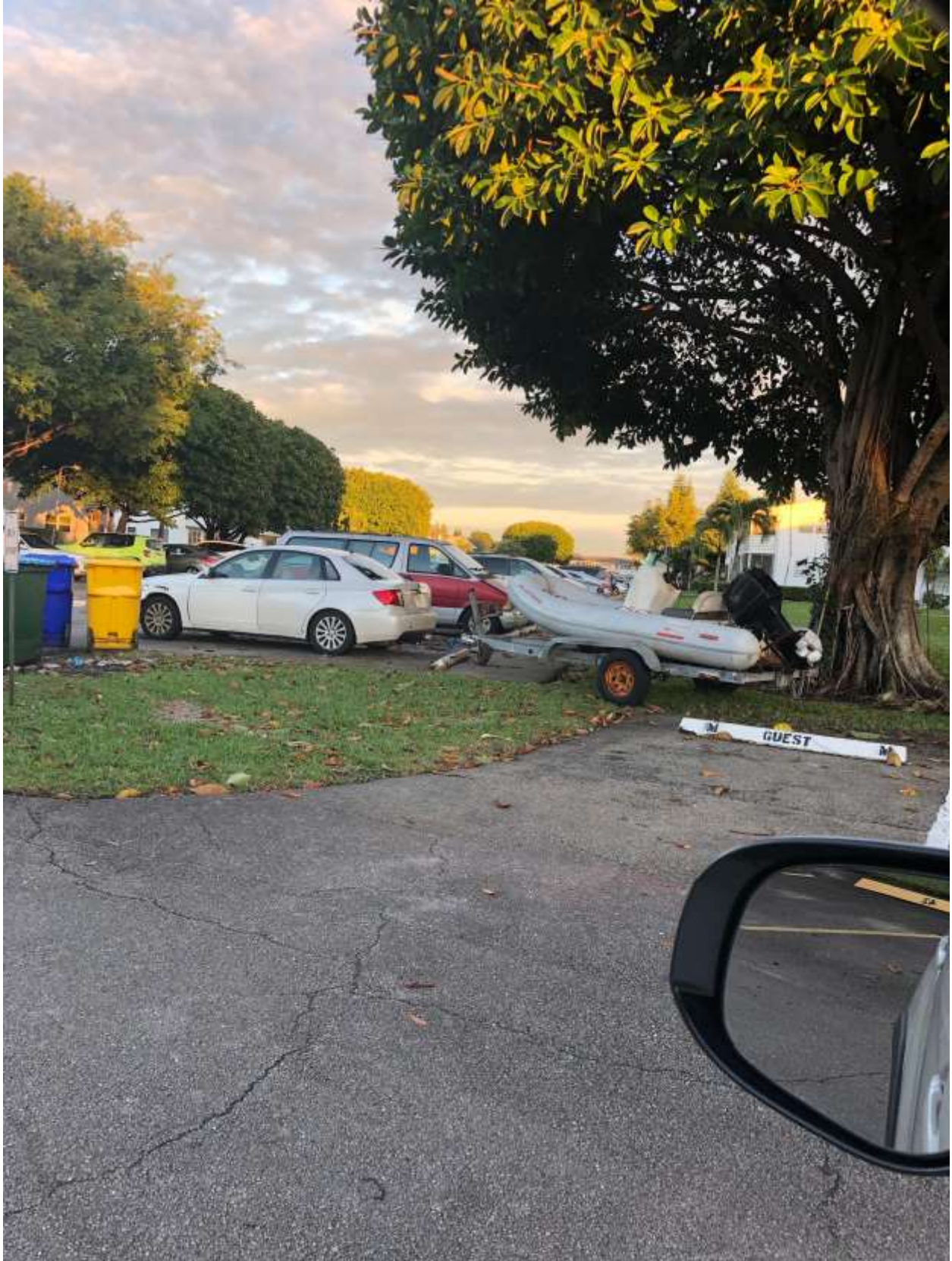
CAMDEN M- REPORTED TO PBC CODE ENFORCEMENT.