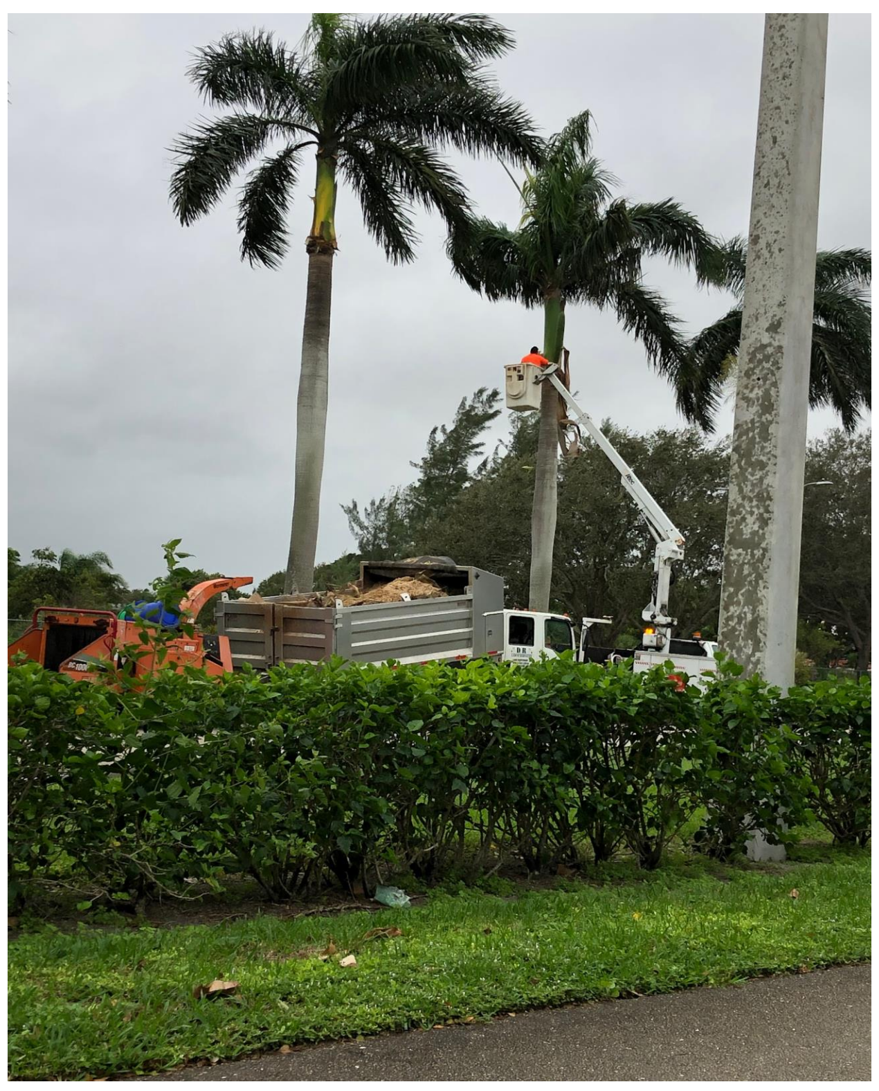
CENTURY BOULEVARD- ON 12/16, D.R. LAWN SERVICE COMPLETED TRIMMING OF PALMS ALONG THE MAIN ROADS OF CV. JUST IN TIME FOR THE STORM.