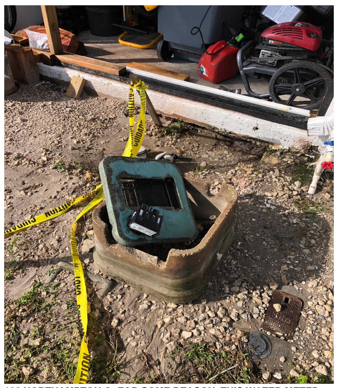
128 NORTHAMPTON G- FOR SOME REASON, THIS WATER METER BOX WAS REMOVED, AND THE USAGE METERS FOR TWO UNITS WERE DISCONNECTED. PBC WATER HAS BEEN NOTIFIED.