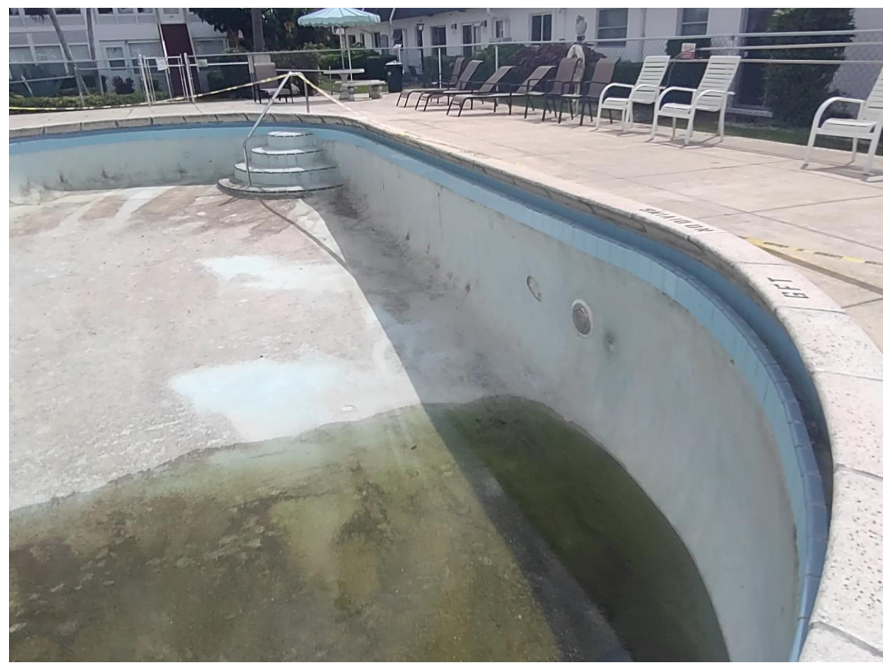
PLYMOUTH SECTION- THIS POOL WAS CLOSED BY THE PBC DEPARTMENT OF HEALTH ON 12/8. IT WILL BE REINSPECTED ON 12/18. POOL WILL REMAIN CLOSED UNTIL IT PASSES INSPECTION.