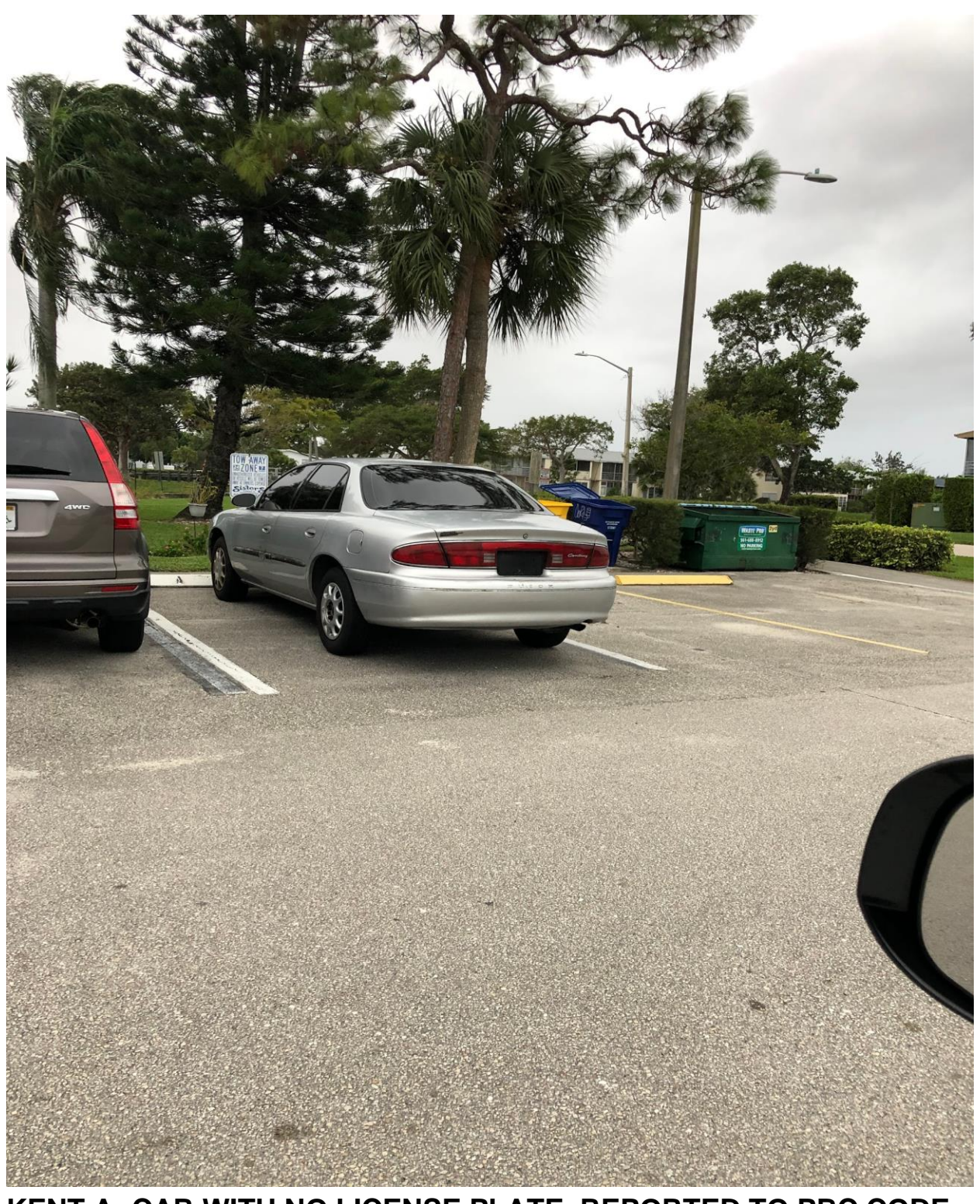
KENT A- CAR WITH NO LICENSE PLATE. REPORTED TO PBC CODE ENFORCEMENT.