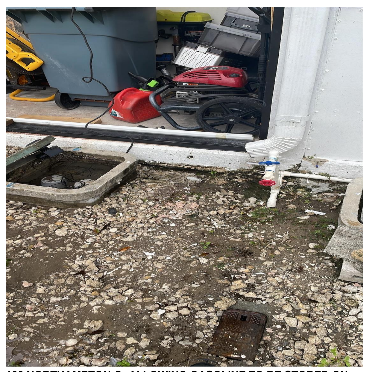
128 NORTHAMPTON G- ALLOWING GASOLINE TO BE STORED ON ASSOCIATION LIMITED COMMON ELEMENT IS NOT A GOOD IDEA. THIS WAS REPORTED TO PBC CODE ENFORCEMENT. ASSOCIATION BOARDS, AND THEIR PROPERTY MANAGERS, NEED TO REGULARLY INSPECT THEIR PROPERTIES TO NIP THIS NONSENSE IN THE BUD BEFORE IT GETS OUT OF HAND. THIS MESS DID NOT HAPPEN OVERNIGHT.