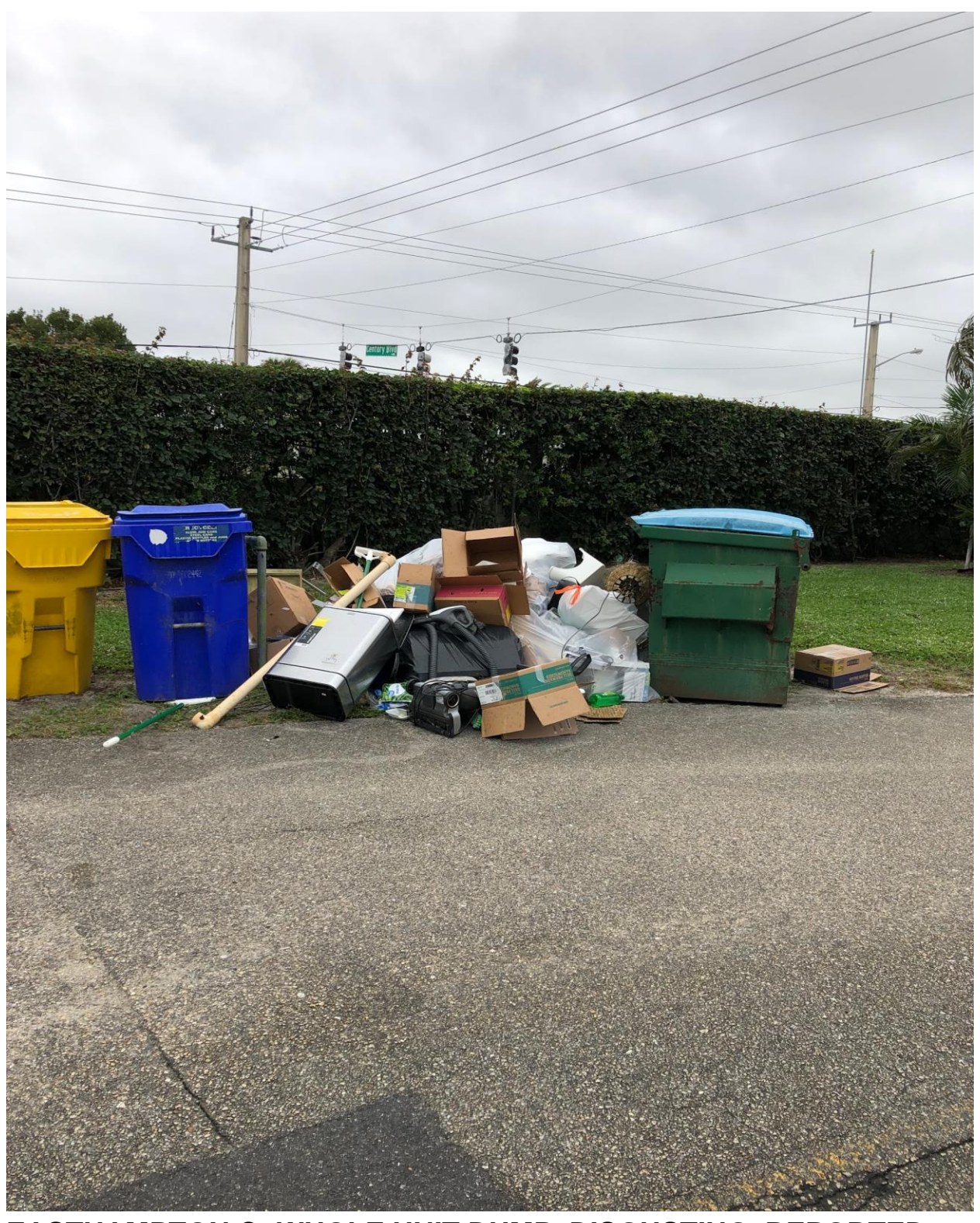
EASTHAMPTON C- WHOLE UNIT DUMP. DISGUSTING. REPORTED TO PBC CODE ENFORCEMENT.