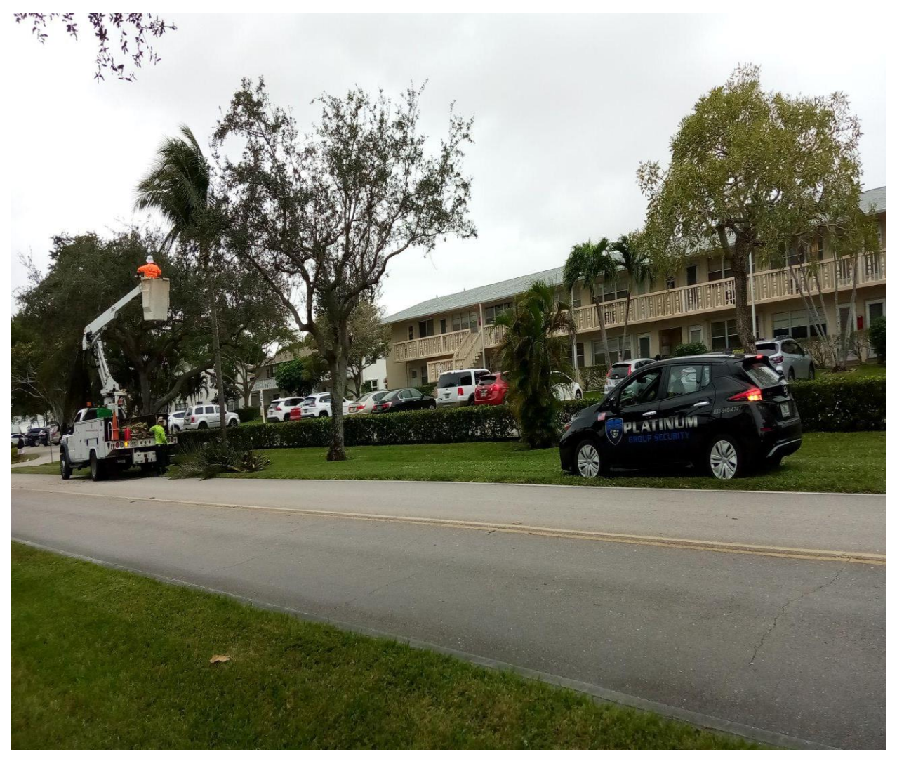
SOUTH DRIVE- LAST WEEK, D.R. LAWN SERVICE TRIMMED PALMS ALONG THE MAIN ROADS OF CV. AS USUAL, SOME CV RESIDENTS TRIED TO GATHER UP THE COCONUTS TO BRING HOME. SECURITY TURNED AWAY 18 CV RESIDENTS AND 6 CONTRACTORS.