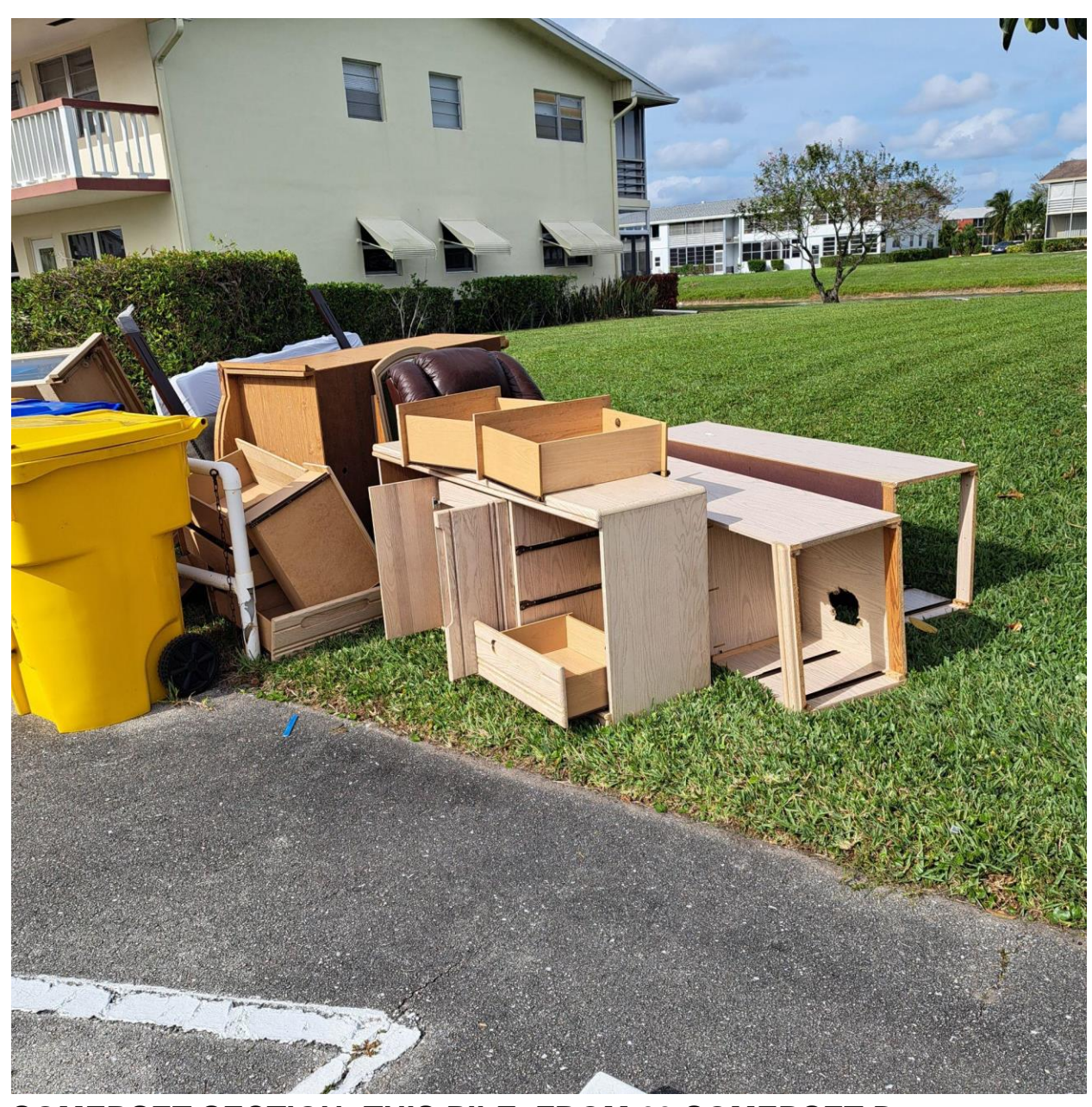
SOMERSET SECTION- THIS PILE, FROM 69 SOMERSET D, EXCEEDED SWA LIMITS FOR REGULAR BULK PICKUP SERVICE. THE ASSOCIATION'S PROPERTY MANAGER AUTHORIZED THE ADDITIONAL CHARGE FOR SPECIAL PICKUP.