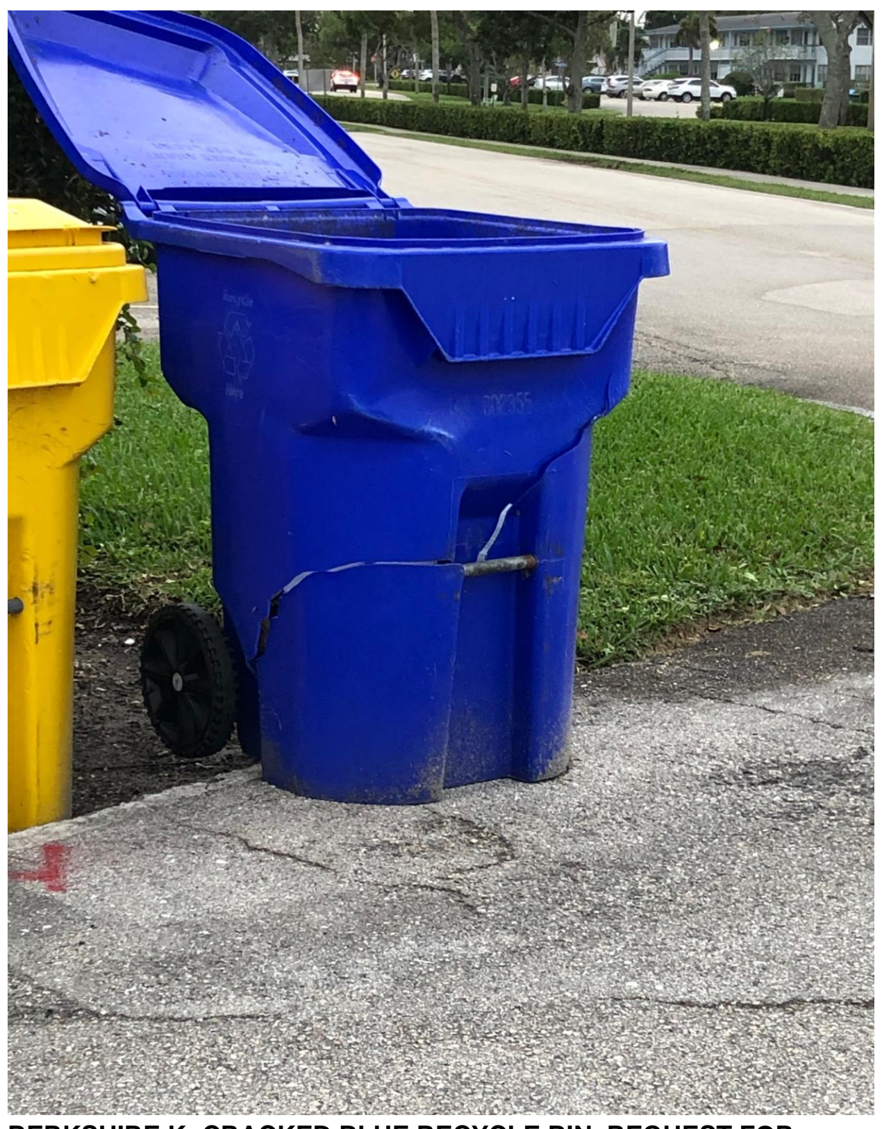
BERKSHIRE K- CRACKED BLUE RECYCLE BIN. REQUEST FOR REPLACEMENT WAS SENT TO WASTE PRO.