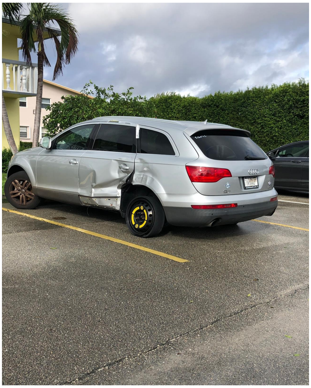
SUSSEX D- JUNKBOX CAR WITH A TEMPORARY TAG THAT EXPIRED IN AUGUST. REPORTED TO PBC CODE ENFORCEMENT.