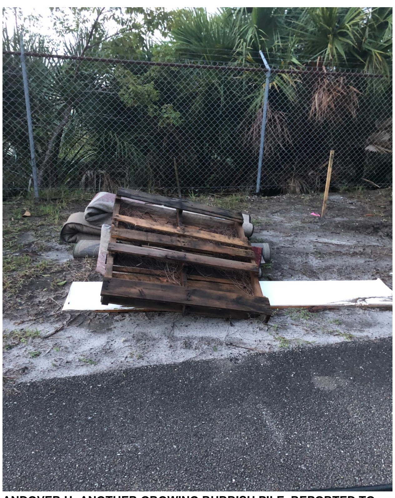
ANDOVER H- ANOTHER GROWING RUBBISH PILE. REPORTED TO PBC CODE ENFORCEMENT.