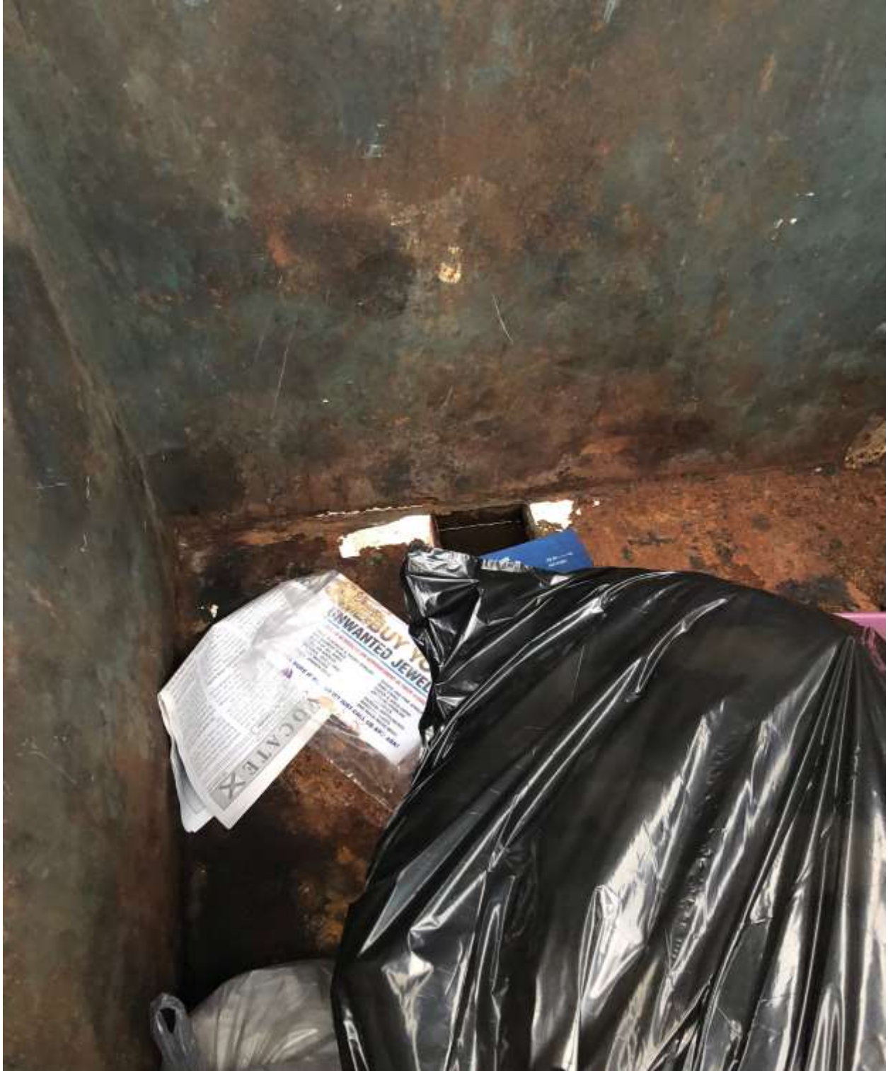
NORWICH F- DUMPSTER WITH ROTTED OUT BOTTOM. REQUEST FOR REPLACEMENT WAS SENT TO WASTE PRO.