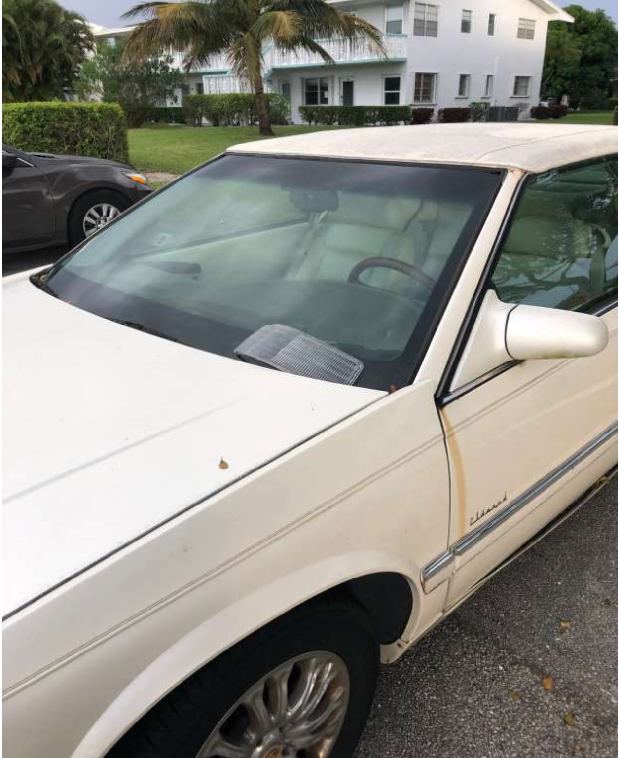
EASTHAMPTON B- THIS CAR HAS A PIECE OF JUNK COVERING THE CARS VEHICLE REGISTRATION NUMBER (VIN). FISHY.