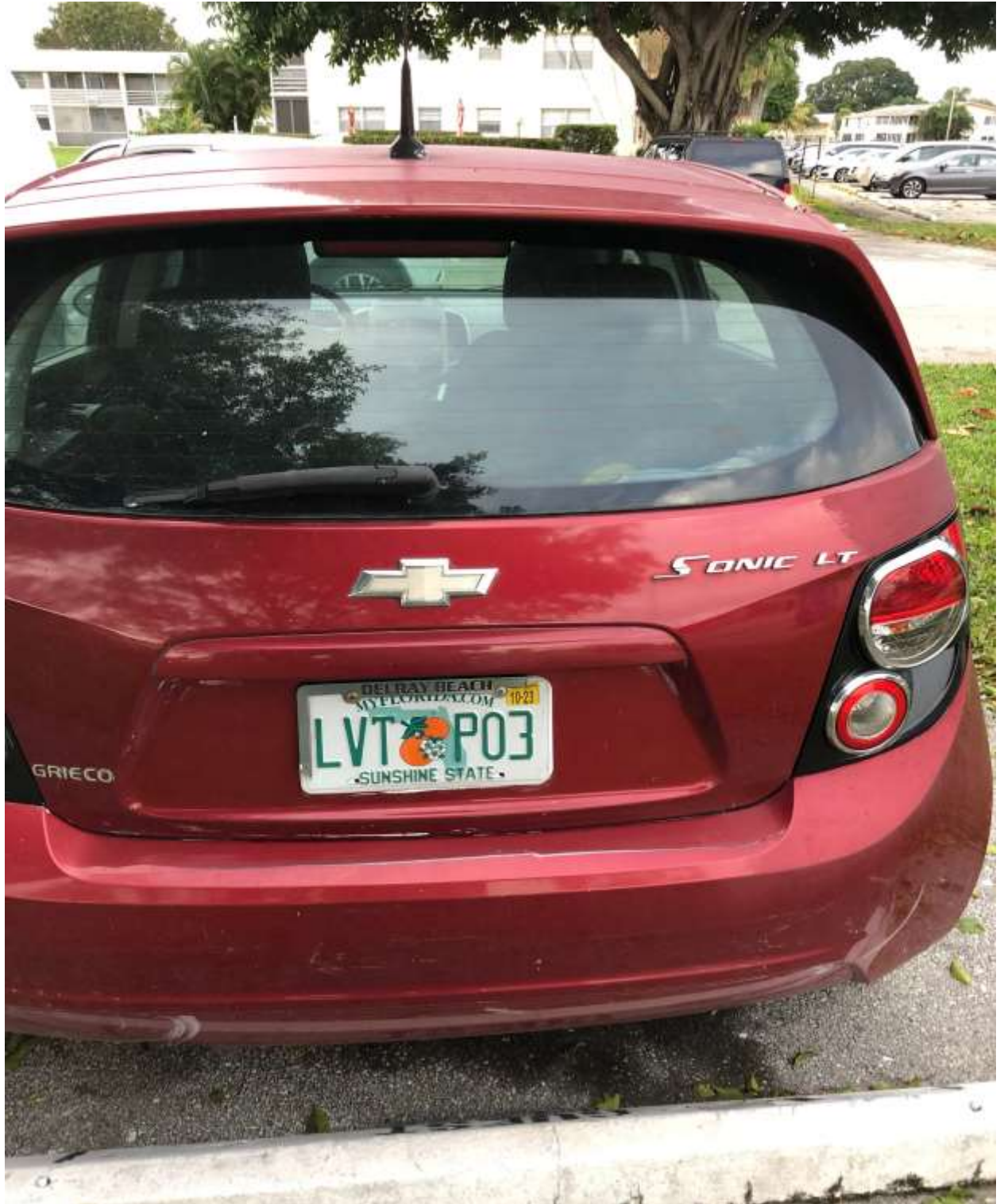
CAMDEN I- CAR WITH EXPIRED REGISTRATION TAG. REPORTED TO PBC CODE ENFORCEMENT.