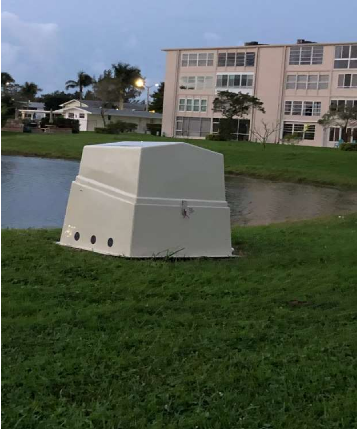
WELLINGTON H/J- NEW IRRIGATION PUMP COVER INSTALLED BY CHABOT IRRIGATION ON 12/21.