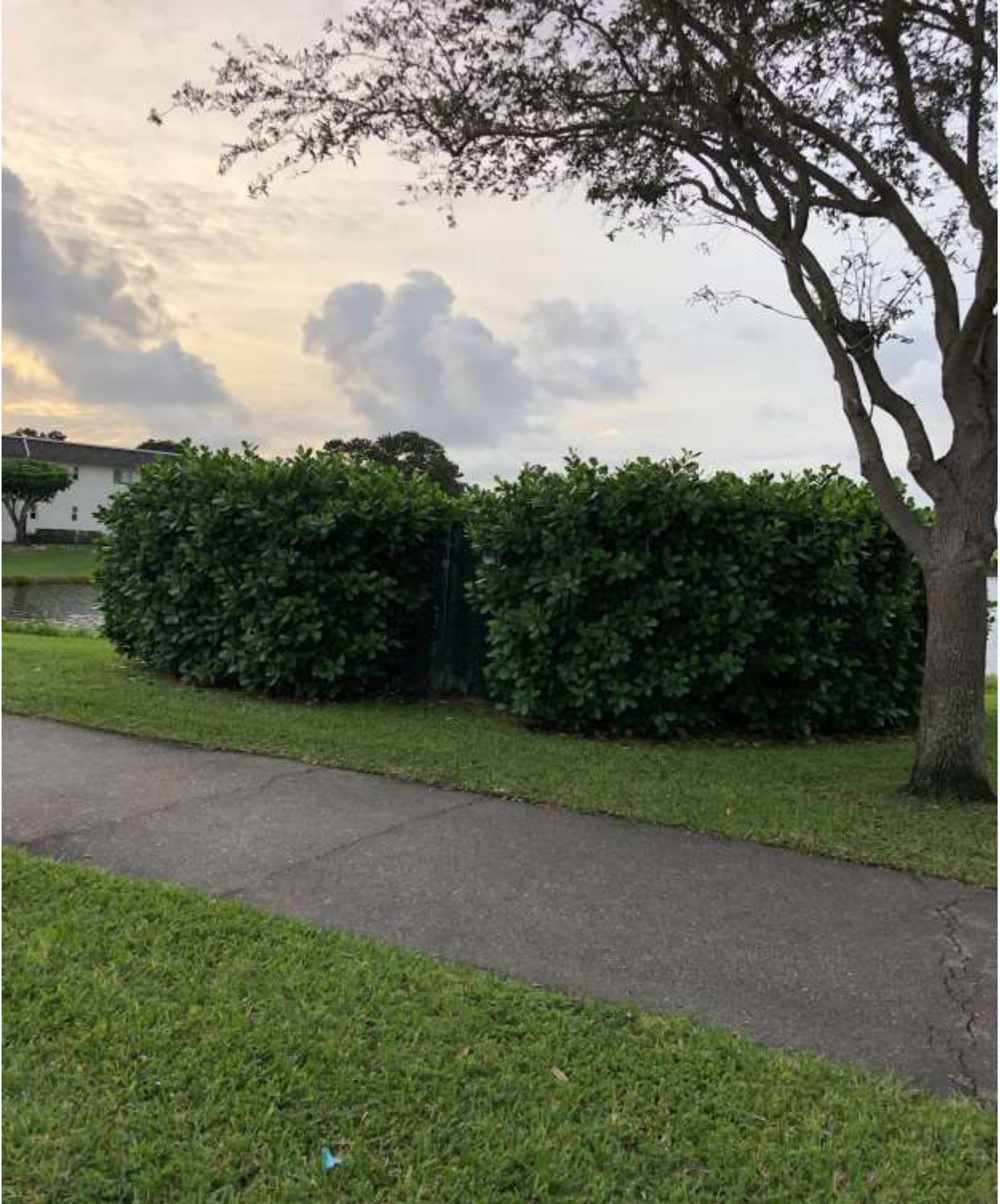
NORTH DRIVE- IT TAKES A COUPLE YEARS, BUT ONCE THE CLUSIA GROW UP, THEY CONCEAL THE PUMP STATIONS NICELY.