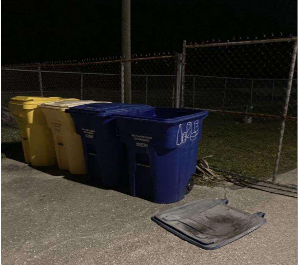
HASTINGS C- BLUE RECYCLE BIN WITH BUSTED LID. CALLED IN BY A CV UNIT OWNER. REQUEST FOR REPAIR WAS SENT TO WASTE PRO.