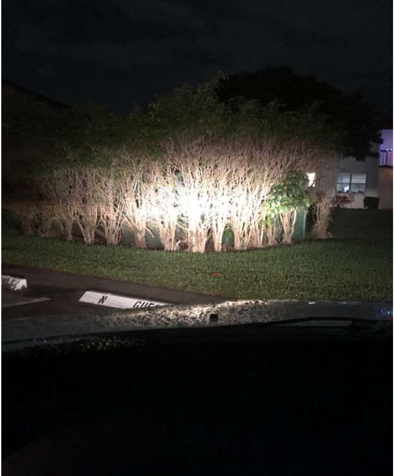
NORTHAMPTON SECTION- THESE DEAD FICUS SHRUBS, SURROUNDING THE IRRIGATION PUMP STATION, NEEDED TO GO.