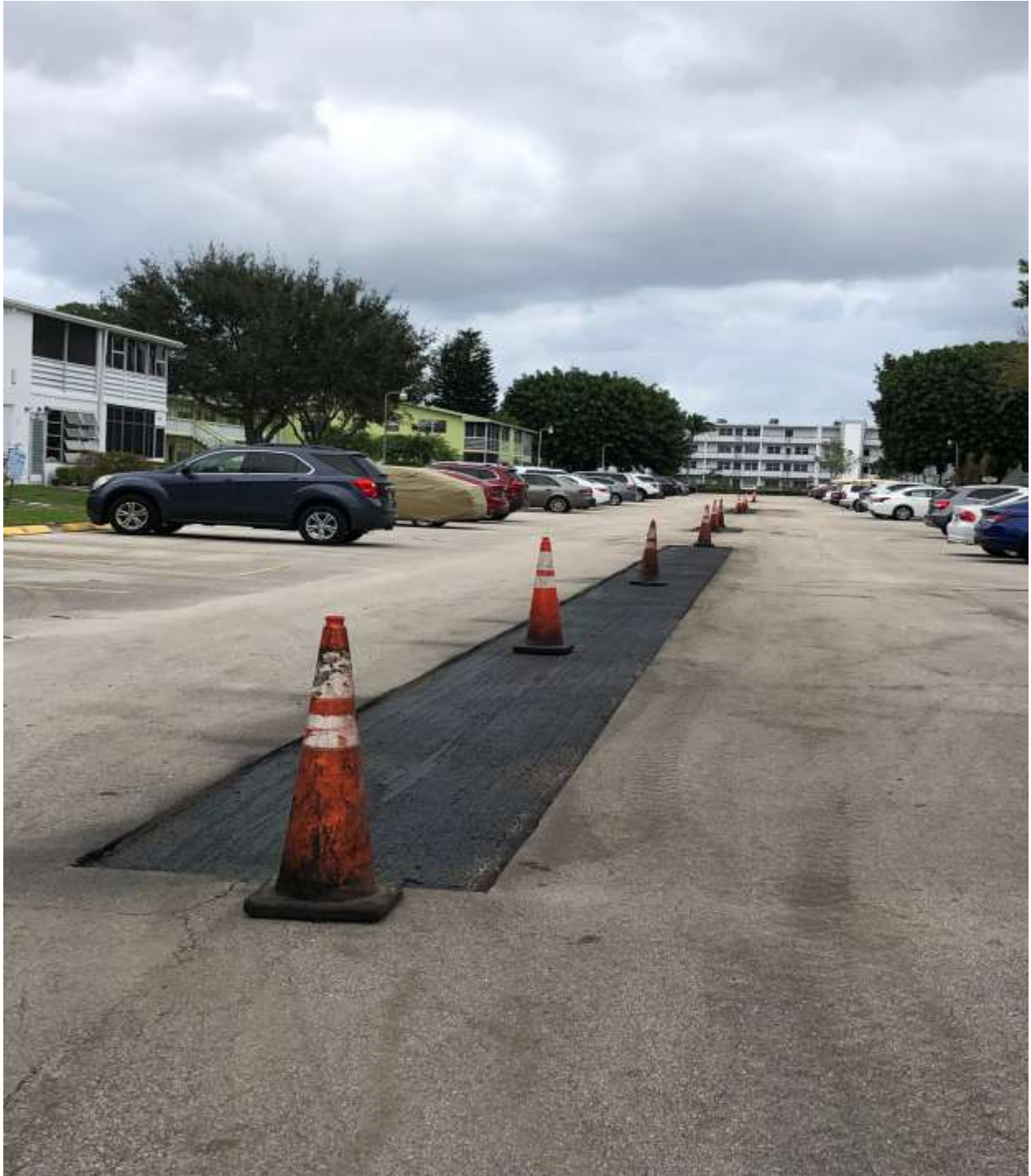
WINDSOR SECTION- DETERIORATED SECTIONS OF ROADWAY ARE REMOVED, READY FOR NEW ASPHALT.