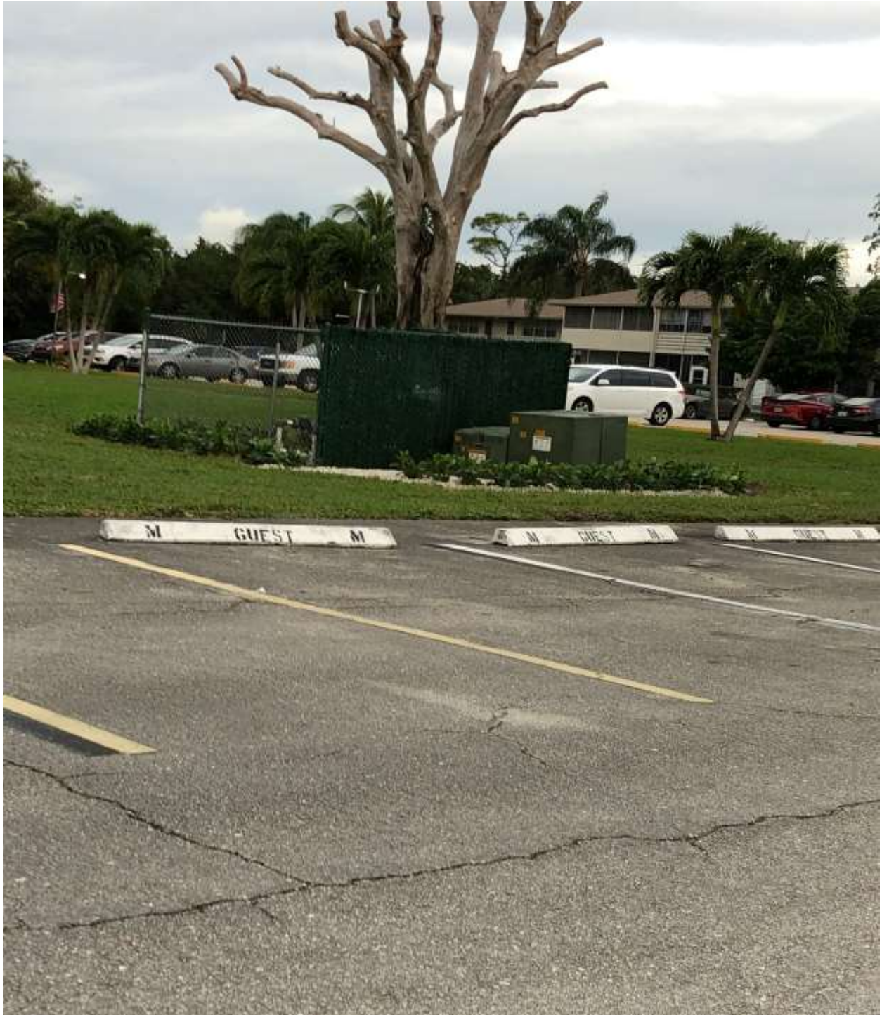
NORTHAMPTON SECTION- NEW CLUSIA SHRUBS AND WHITE ROCKS INSTALLED BY SEACREST SERVICES. THE GREEN CHRISTMAS TREE STRIPS WILL HIDE THE STATION UNTIL THE BABY SHRUBS GROW.