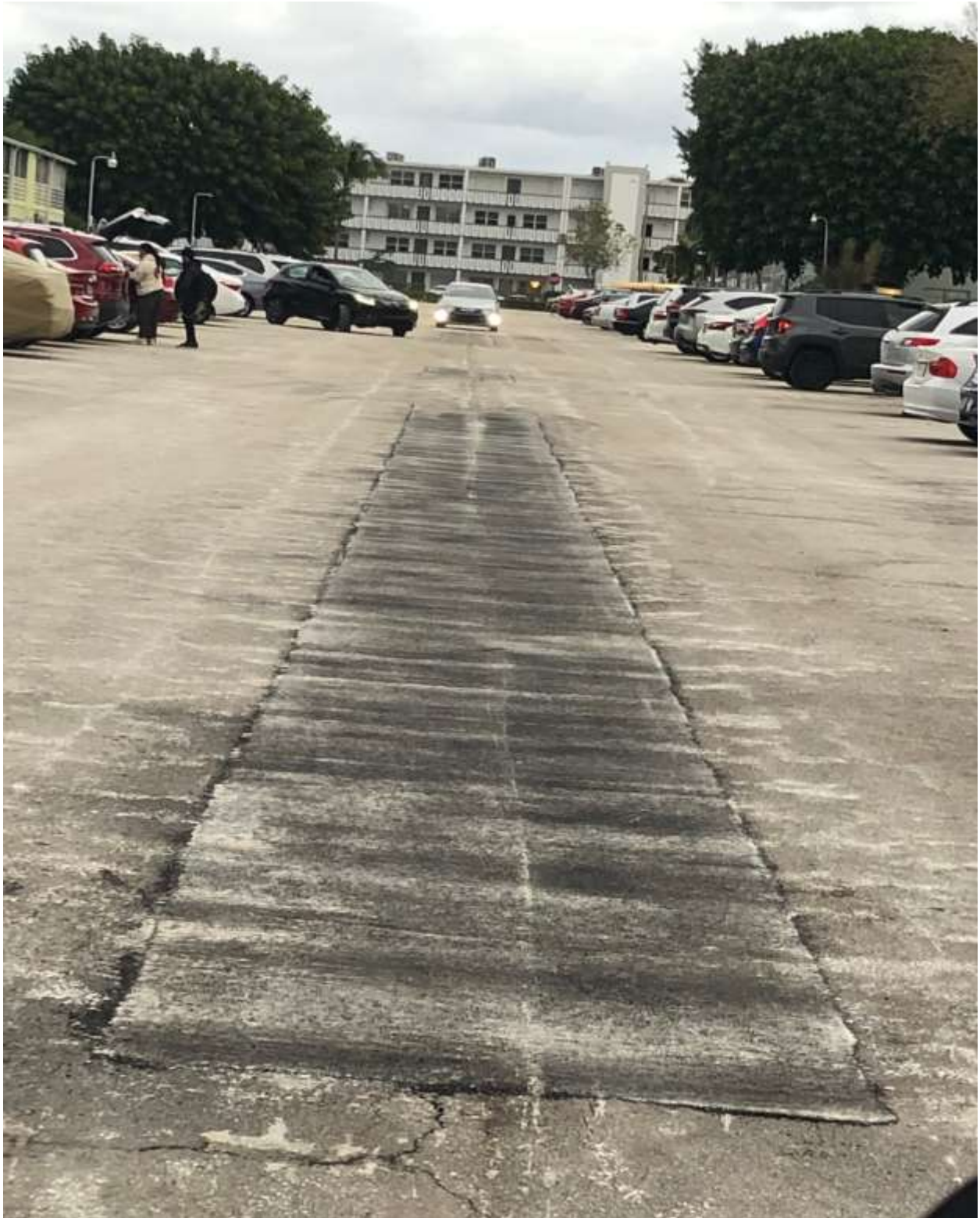
WINDSOR SECTION- REPAIRS COMPLETE. THIS REPAIR WORK WILL RESUME IN JANUARY.