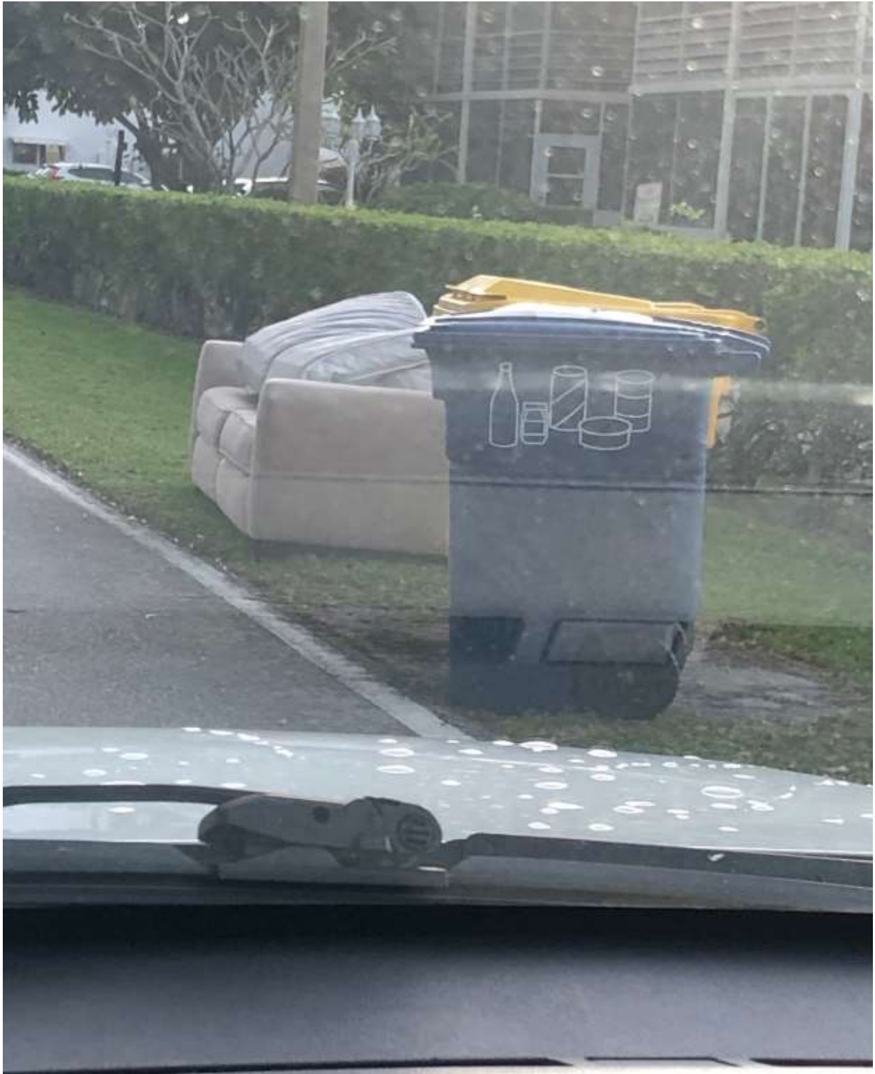
SALISBURY H- MISSED BULK ITEM.