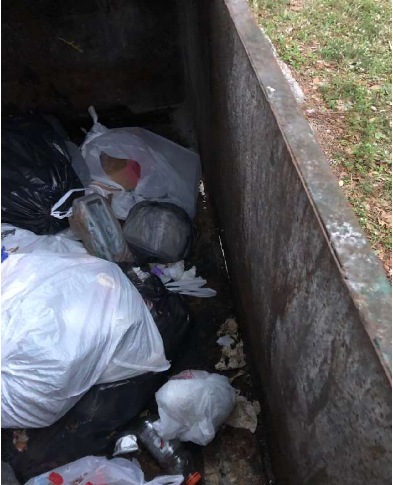
HASTINGS G- DUMPSTER WITH ROTTED OUT BOTTOM. REQUEST FOR REPLACEMENT WAS SENT TO WASTE PRO.