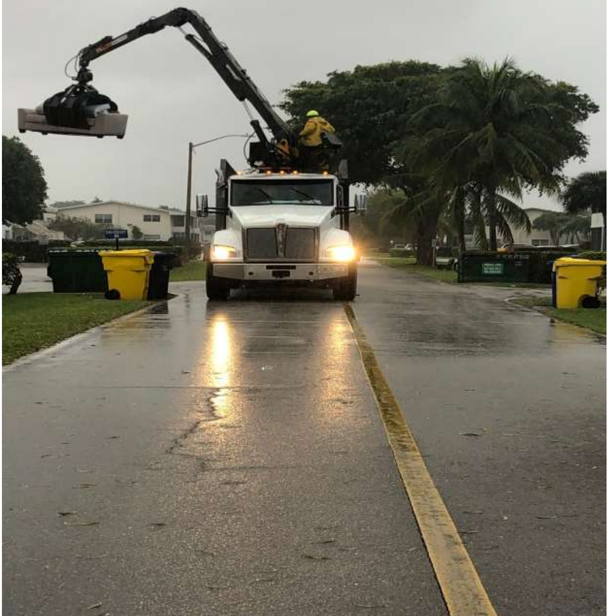
SALISBURY H- MISSED BULK ITEMS WERE PICKED UP BY WASTE PRO ON SATURDAY.